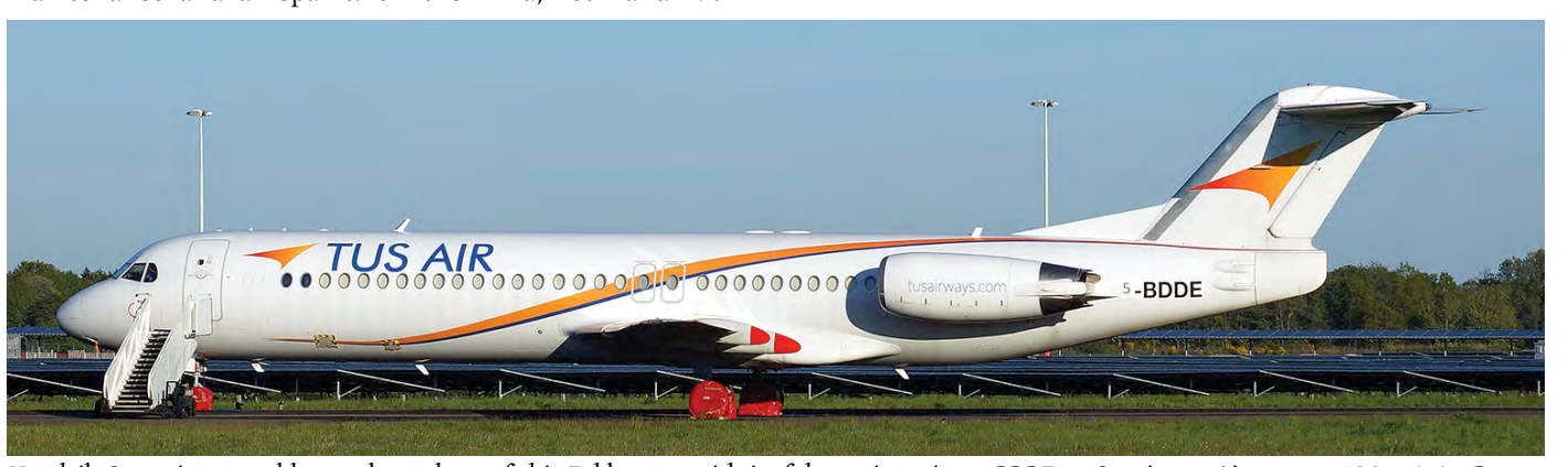
Hendrik Cazemier was able to take a photo of this Fokker 100 with its fake registration 5-BDDE at Groningen Airport on 6 May 2020. Due to paperwork issues its assigned new registration 2-BDDE needed to be covered up. See Scramble 493 - Page 27.