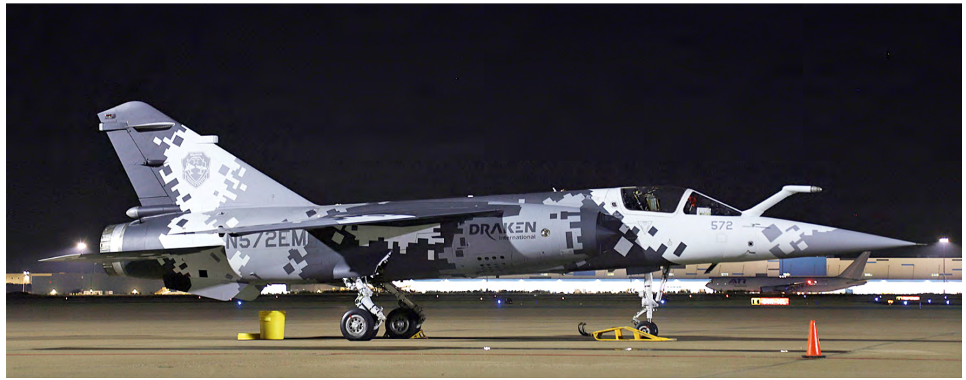
Former Spanish Air Force Mirage F1M C.14-67/14-39 was sold to Draken International and as N572EM. It made a night-stop at Fort Worth Alliance (TX) on 22 June 2020 and left the following morning to join its compadres at Nellis AFB after a fuel stop in Albuquerque (NM).