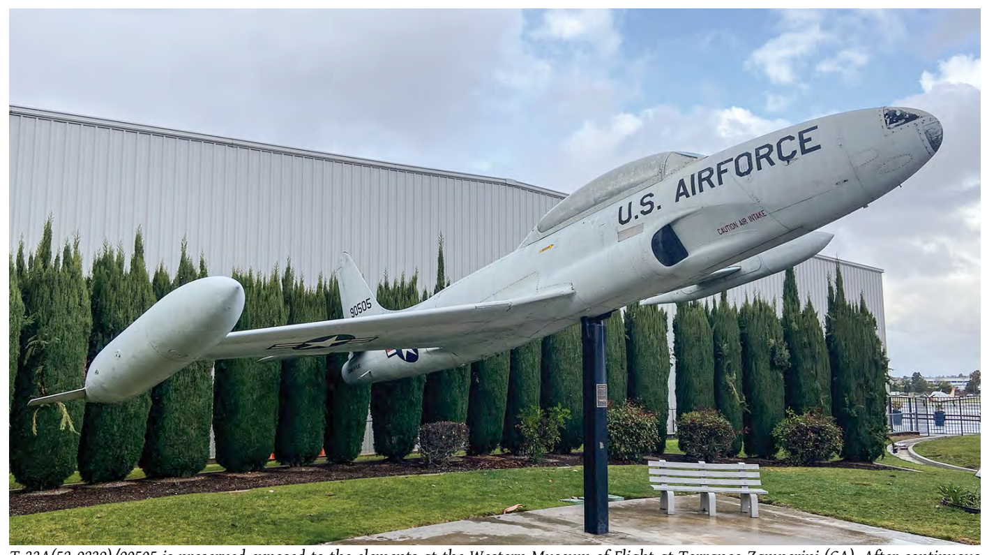
T-33A(52-9239)/90505 is preserved exposed to the elements at the Western Museum of Flight at Torrance-Zamperini (CA). After continuous British themed weather in the US, the weather took a turn for the better: it was dry! (13 March 2020)