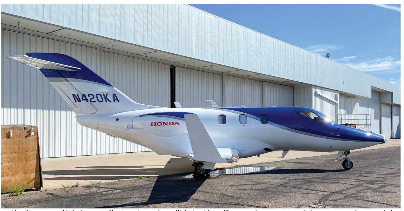
Besides the more established names of business jets and very llight jets like Gulfstream, Pilatus, Cessna and Piper amongst others, Honda has developed a very light jet as a business jet. Meet HA-420 N420KA operated by Leavitt Group Wings (Phoenix-Sky Harbour (AZ), 15 March 2020,)