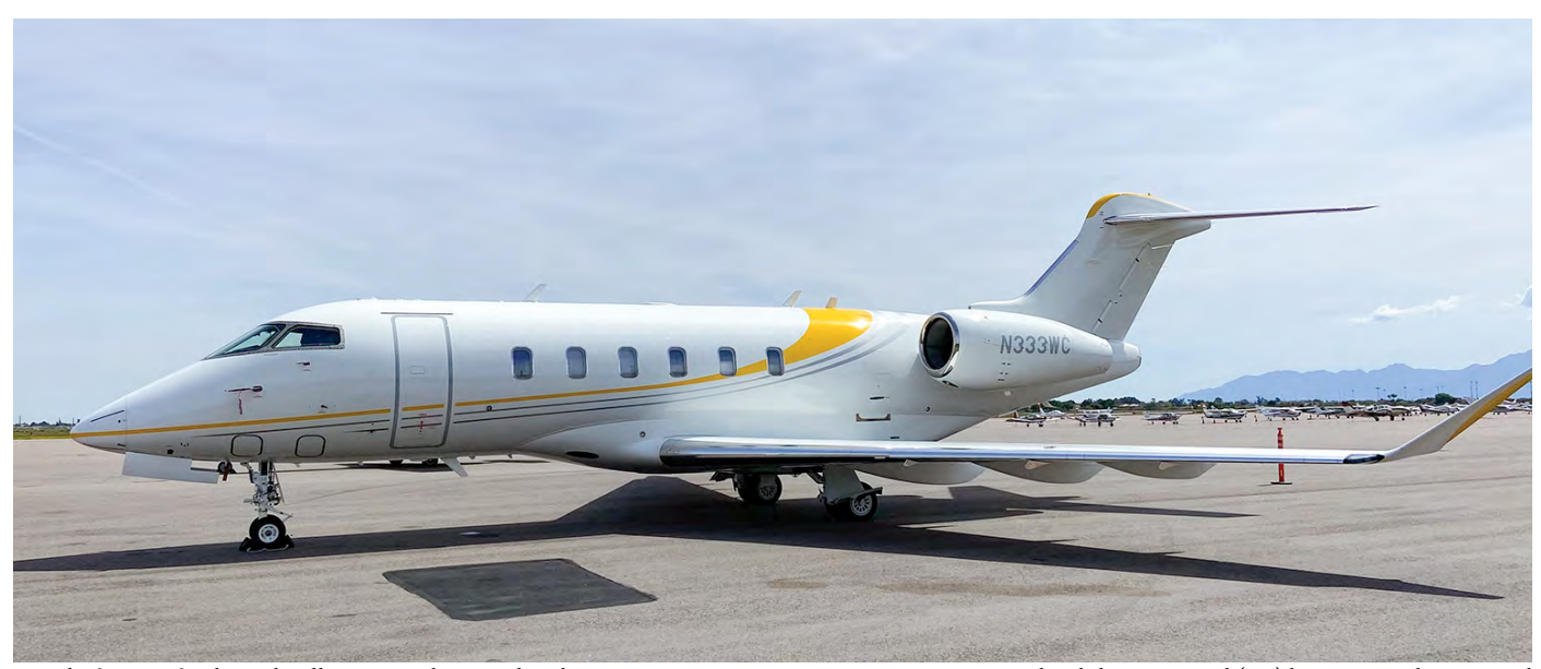
Nearly factory fresh, and still registered to Bombardier Aerospace, CL-350 N333WC, was seen at Glendale Municipal (AZ) by Grant Robinson and the tour members of Oxford Aviation Group during their visit to the site on 16 March 2020.