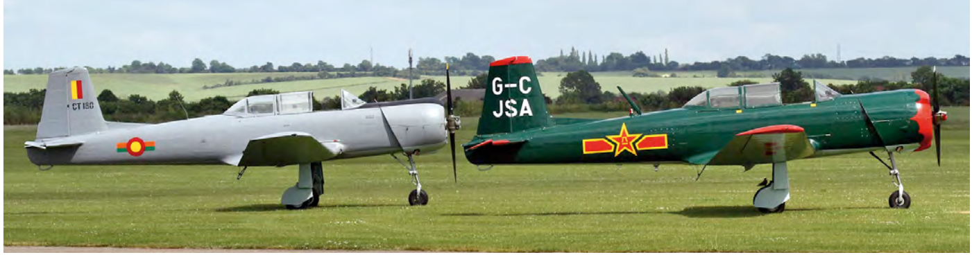
The European CJ-6 fleet is quite modest, only five that we know of. Seen here are G-BXZB (2632019) painted as Sri Lanka 'CT180' and G-CJSA (3151215). The latter has also been painted in mock Sri Lankan colours since then, as 'CT130'. (Duxford, 11 June 2014, David Whitworth)

<u>Note:</u> the quantity of most batches was assumed based on the highest known construction number in that batch, and/ or preceding/succeeding batches. Of course we do not know this for all batches nor if their love for multiples of 8 extends to every batch... Also, in 2018 a brand new facility was opened at the newly constructed airfield Nanchang/Yaohu.