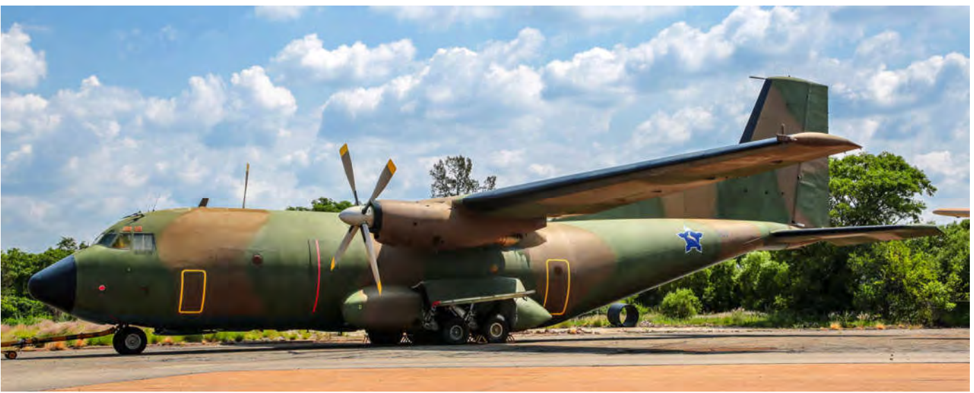
Air Force Base Swartkop holds one of three locations of the South African Air Force Museum. One of the larger aircraft preserved here is C-160Z 337. This is the only remaining SAAF C-160Z, all others have been scrapped. (Swartkop, 10 February 2020, Robert Eikelenboom)