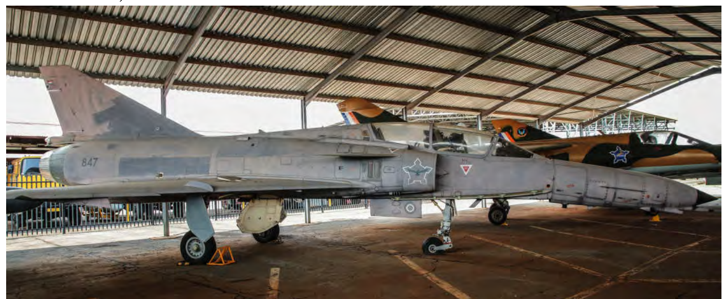
Of couse, the museum could not be complete without one of South Africa's indigenous fighters, the Cheetah. In this case, the honour goes to Cheetah D2 847. This aircraft was used by Denel to test the integration of a Klimov RD-33 derivative engine. As can be seen in the back, the museum houses multiple Mirage variants. (Swartkop, 10 February 2020, Robert Eikelenboom)