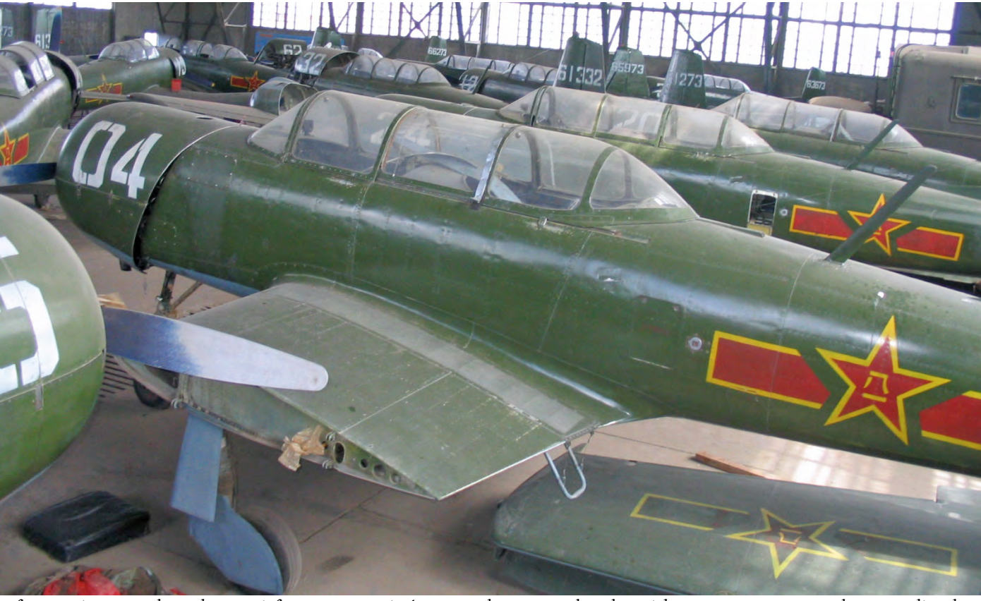
Infamous picture maybe, at least an infamous transaction! In November 1995, no less than eighteen CJ-6s were exported to Australia. These came from storage after being withdrawn not long before. Thirteen can be seen in this view and (partly) visible identities are 61273/12, 61332/32, 61373/13, 63673, 65973, 66273/62 as well as partially identified __273, 613__, /04, /20, /24, /_6.