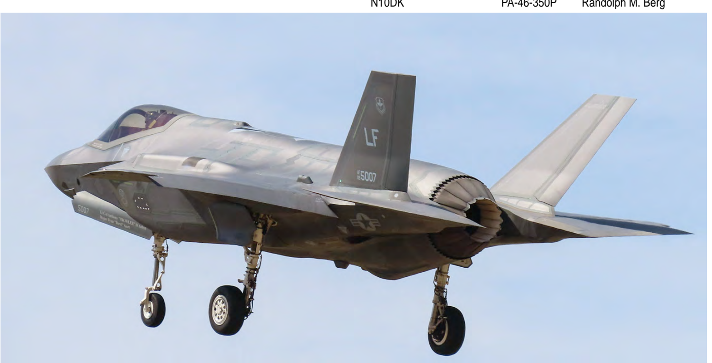
Operational at Luke (AZ) is F-35A 09-5007/LF with the 56th FW/61st FS. From this angle you might get an impression of the dimensions of the Lightning II. (16 March 2020,)