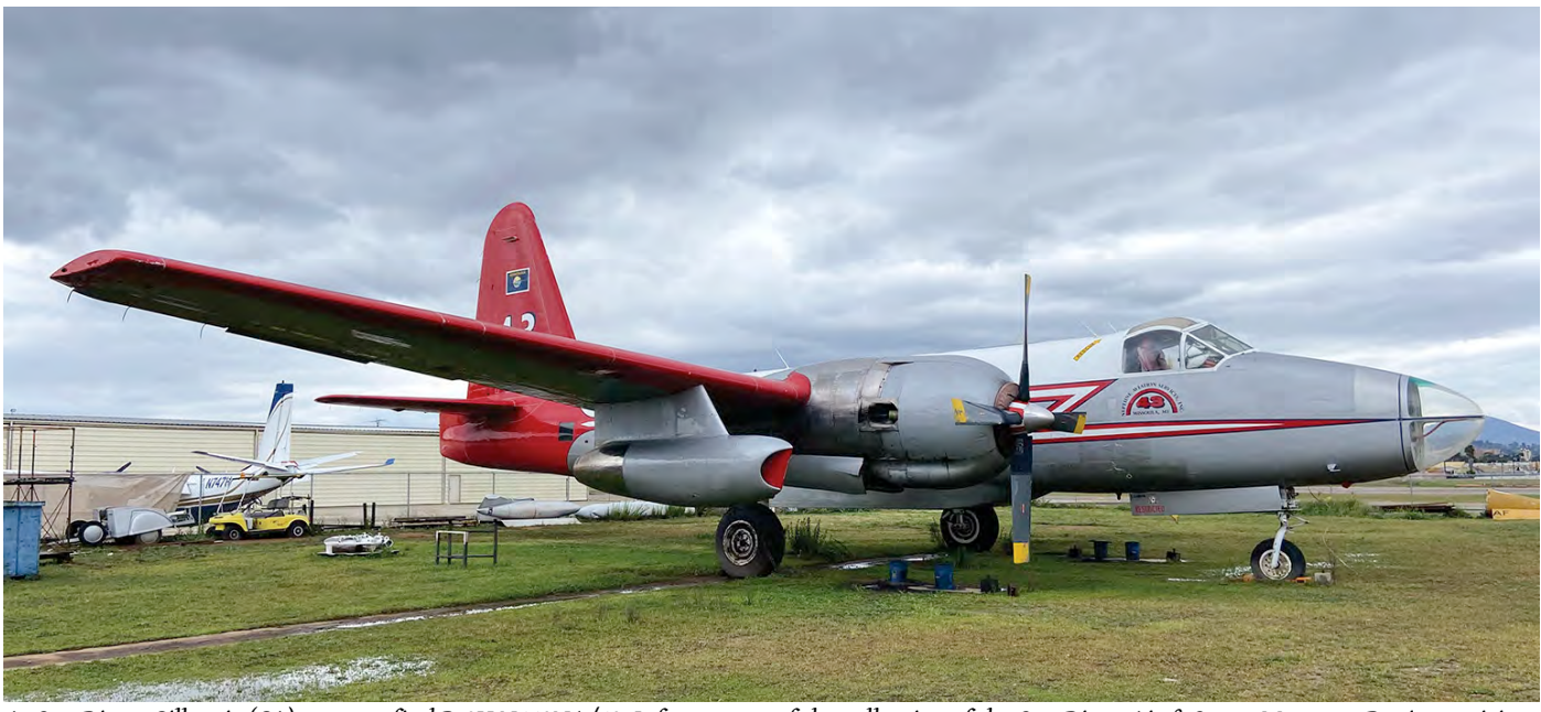
At San Diego-Gillespie (CA) you can find P-2H N443NA/43. It forms part of the collection of the San Diego Air & Space Museum. During a visit to the museum it was photographed as part of the outside collection on 14 March 2020.