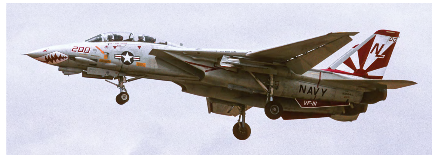
VFC-111 has a proud heritage. Upon its activation in 2006 the squadron assumed the name and traditions of VF-111, which flew the mighty F-14 Tomcat. Seen here is F-14A 162594/NL-100. (NAS Miramar (CA), August 1991)

The Navy's remaining twin-seat F-5F Tiger IIs were too costly to maintain, had very little service life left and needed to be retired. So the US Navy replaced these by using the airframes of the Swiss F-5Es that they had recently purchased. The three new F-5Fs, nicknamed 'Franken-Tigers', were built using parts from the Navy's two-seat F-5Fs and from the single-seat, former Swiss Air Force, F-5Es. What they actually did was take the two-seat cockpit section and the tail section of the old Navy F-5Fs 75-0756 (of VFC-111), 75-0753 (of VFC-13) and 84-0456 (of VMFT-401) and bolt these onto the newer centre section of the former Swiss F-5Es (81-0834 / J-3075, 76-1586 / J-3061 and 76-1580 / J-3055).