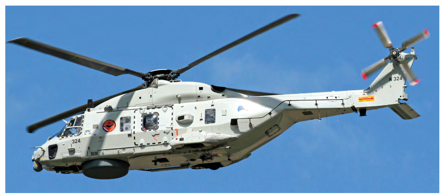
The COVID-19 crisis is seriously affecting traffic numbers at civil airports such as Schiphol-Amsterdam Airport. With these low numbers, ATC is more willing to allow military traffic to enter the control-zone and show off their hardware. NH90-NFH N-324 was captured making a low pass over taxiway Victor. (14 May 2020)