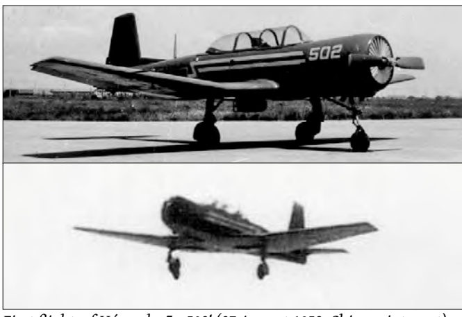
First flight, of Hóng zhuān 502! (27 August 1958, Chinese internet)

that was slightly redesigned, underwent wind tunnel tests and on 18 July 1960 the machine performed its first flight. It was put to a strenuous test program. During 82 flights, 55 hours and 22 minutes flight time some major corrections were suggested. One of these you may have seen, is to slant back the bulkhead giving it its peculiar angle to be seen when the engine covers come off.