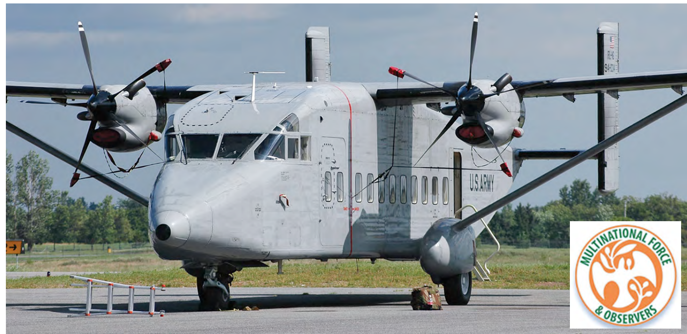
A pair of C-23C Sherpa aircraft were used by the 1st USASB AVN CO at Al-Arish Airport (Egypt) between 2010 and 2013. The aircraft were assigned to the Multinational Force and Observers (MFO) which is an independent organization which was established after the Camp David accords between Egypt and Israel in 1979. On 30 November 2013, two C-23s (93-01330 and 94-00310) passed through Europe while on their way back to the United States. This was the end of the final C-23 deployment with the MFO and they made a stop at Glasgow-Prestwick Airport. The badge visible on the wheelbay is the MFO crest. (Bob Smith).