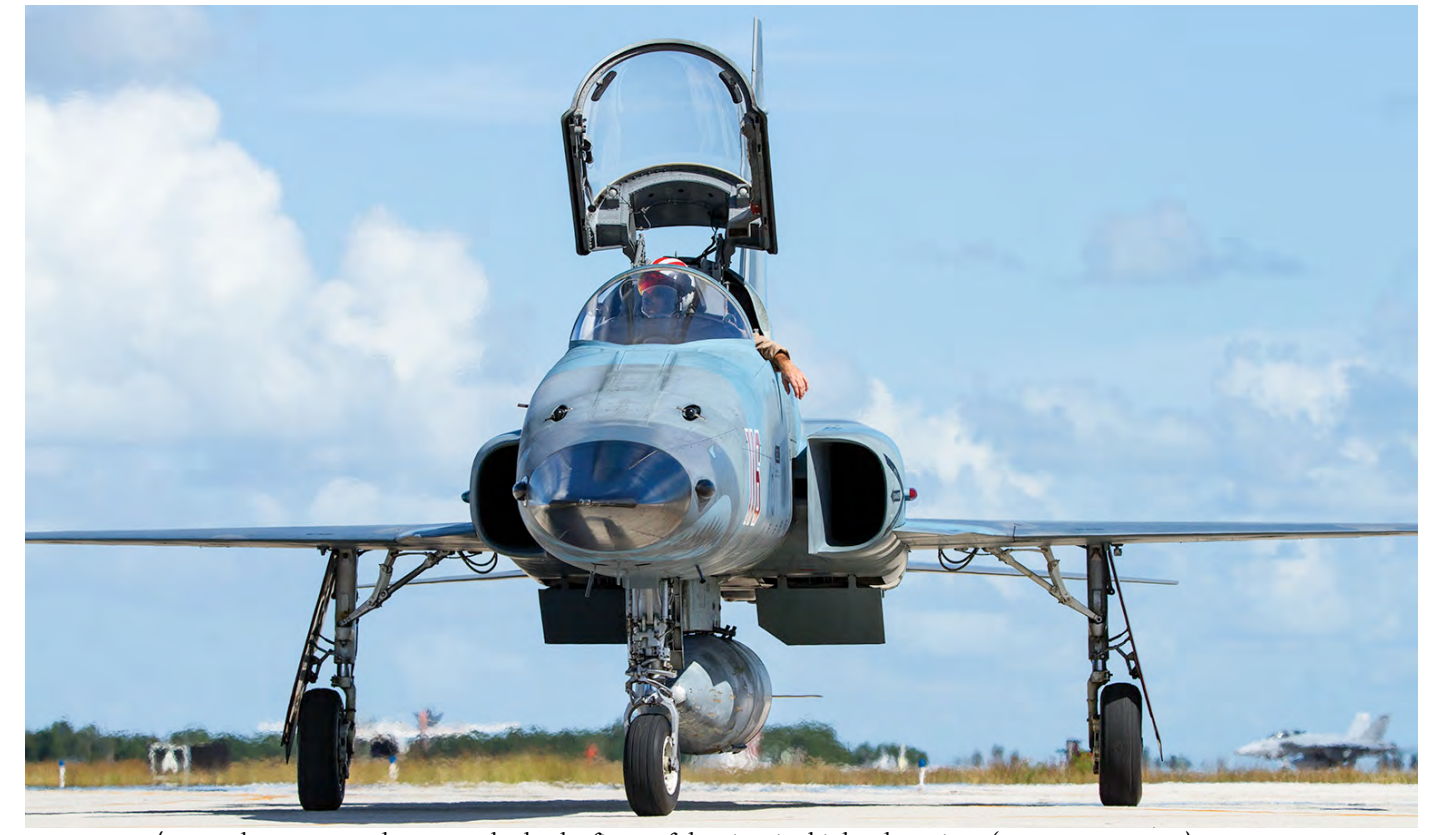
F-5N 76-1532/AF-116 demonstrates the extremely slender figure of the Tiger in this head-on view. (George Karavantos)