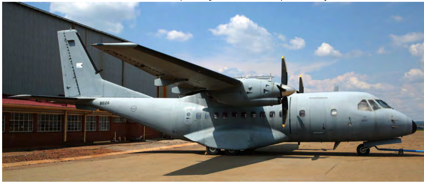
Another transport aircraft preserved at Swartkop is the only CN235 ever operated by the South African Air Force, 8026. It was absorbed into the SAAF when Bophuthatswana became part of South Africa in 1994. This is c/n C001, which makes it the oldest CN235 in the world. (Swartkop, 10 February 2020, Robert Eikelenboom)