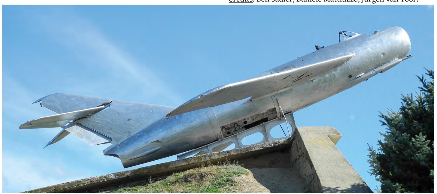
In the far southwest of Moldova, this old Soviet MiG-17 is mounted in spectacular fashion at the entrance road of the city of Cahul. In mid-March, the blistering cold steppe wind made climbing the mount to check its construction number not only a cold experience, but also an uneasy undertaking as the wind made the MiG roll slightly to both sides in its braces. The construction number was read as 0907 and bort number looked like 54.