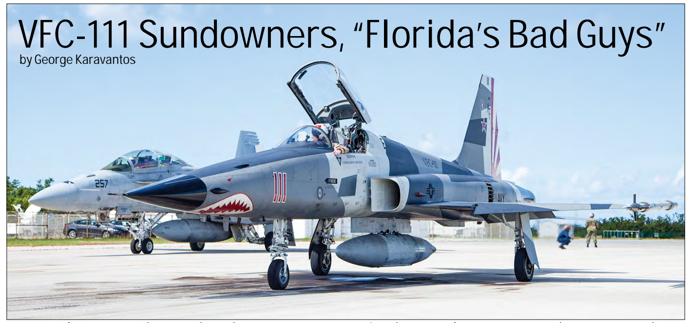
F-5N 761560/AF-111, carries the commnder's colours. It is taxiing past one of its 'clients', an F/A-18F Super Hornet.

At the southern part of the US continent where the famous 0 mile and the closest distance from Cuba lies, stands the Naval Air Station Key West base, Florida. The airfield is located on Boca Chica Key, one island before Key West, approximately 200 km south of Miami. The original name for NAS Key West is Boca Chica Field and its history goes back to 1823 when it was first established as a Naval Base.