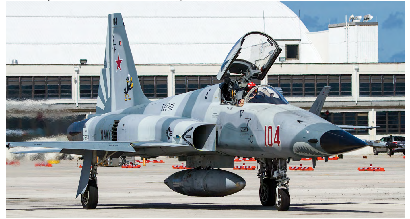
VFC-111 F-5N 761531 "AF-104" 2017 (3 tone gray scheme with lo-viz shark mouth and rudder markings). In order to be able to fly for a longer period of time, all the F-5s carry an external centreline fuel tank. The downside is that this tank degrades the performance of the aircraft in terms of G- forces. (George Karavantos)

The modification programme comprised nearly 600 modifications, the most important of which were the installation of a new oxygen generating system, new inertial navigation system, new display with multifunction touch screen, embedded GPS, new fibre optic gyro, ALR-87 radar warning receivers, ALE-40 chaff and flare system, automatic flaps and finally anti-skid braking system. The 44 aircraft were renamed F-5N and they are recognizable by their different wing leading edge roots extensions (LERX) and their flat nose (hence the nickname of "Platypus"), and by the small horizonal fin on top of the vertical stabilzer.