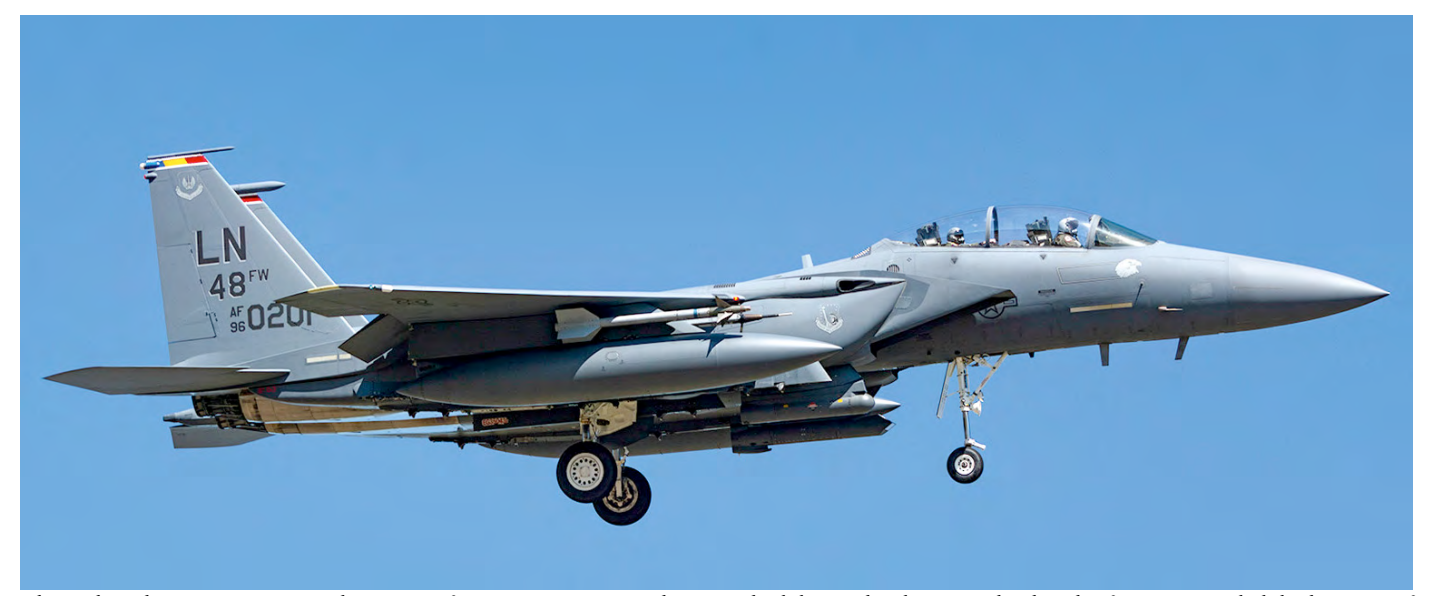
The 48th Fighter Wing commander's aircraft F-15E 96-0201 was photographed during landing at Lakenheath after an extended deployment of eight months to the Middle East. (29 May 2020, Rick Sleight)