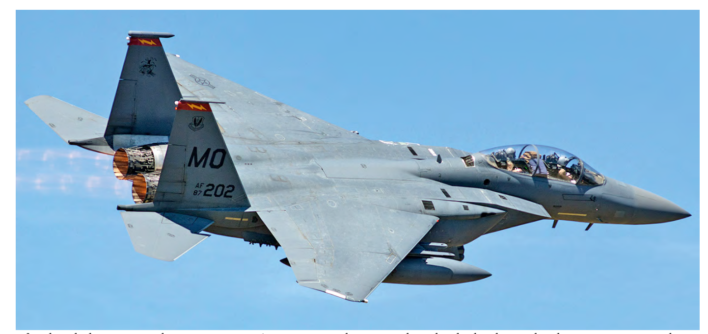
After their deployment in Jordan, Mountain Home's F-15Es returned to CONUS through Lakenheath. Two days later, F-15E 87-0202 and some others departed Lakenheath on 29 May 2020.