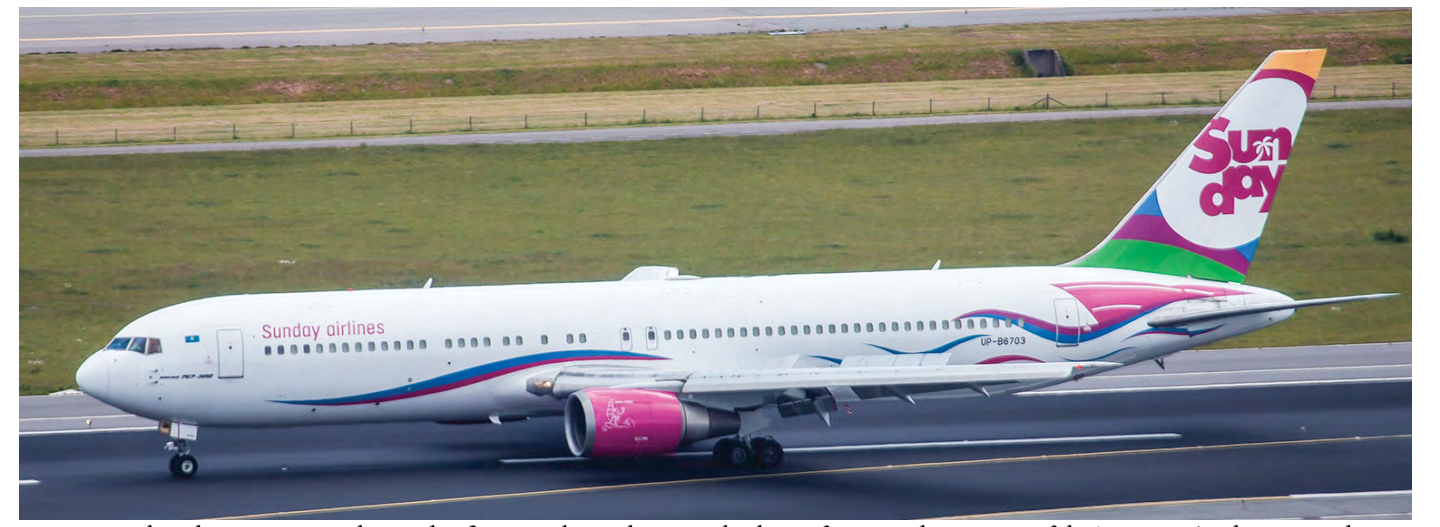
UP-B6703 is the sole Boeing 767 in the Sunday fleet. Sunday Airlines, a subsidiary of SCAT Airlines, is one of the 'COVID-19' airlines recently seen at airports around Europe. The Sunday Airlines fleet is being operated by SCAT. (Amsterdam - Schiphol, 14 May 2020)