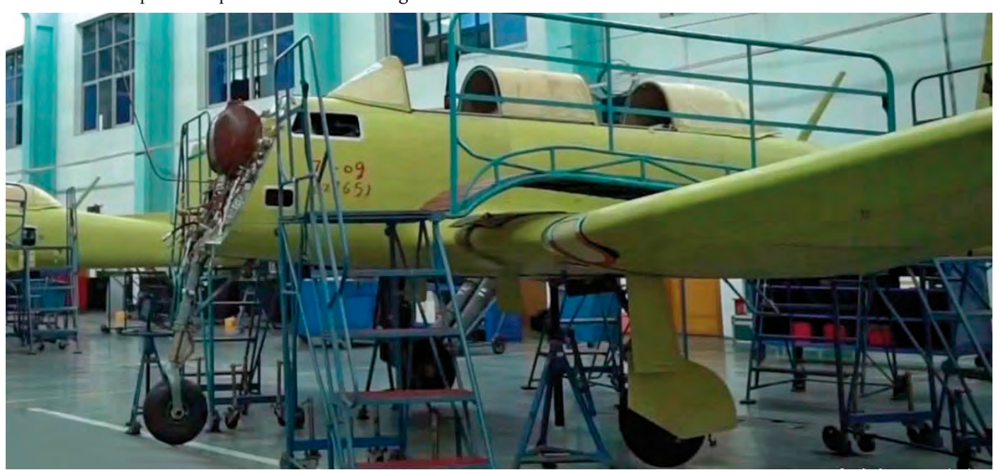
Some unique footage taken after the re-opening of the Hongdu production line disclosed these numerals crudely scribbled on the nose in red on this primer CJ-6A. It reads '71-09' and '2765', the 2765th CJ-6 built, batch 71, sequence number 09. (aired 1 April 2018, CCTV7)

The first three production aircraft were handed over to the armed forces on 28 December 1961. At that time the aircraft was referred to as Type-61. Meanwhile various major parts were being reverse engineered and by September 1963 all components could be manufactured in China. From that moment, it was a fully Chinese product and in 1964 it was renamed Chūjí jiào 6, literally 'Beginner 6'. During 1970, production was transferred to Factory 512. This explains some batches appearing with that numeral. This lasted only a