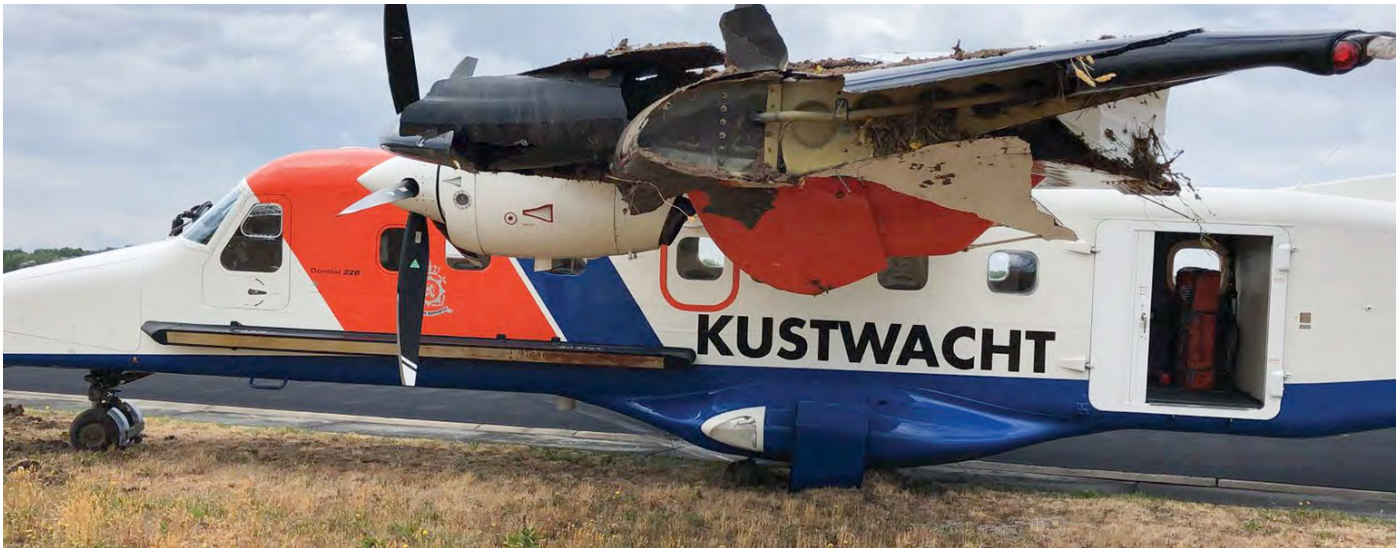
The Dutch Coast Guard Dornier 228 received what looks like minor damage after it suffered a burst left main gear tire at Eindhoven Air Base on 8 June. The runway at Eindhoven was closed for the rest of the day.

visible. The helicopter was captured by the Government of National Accord (GNA).