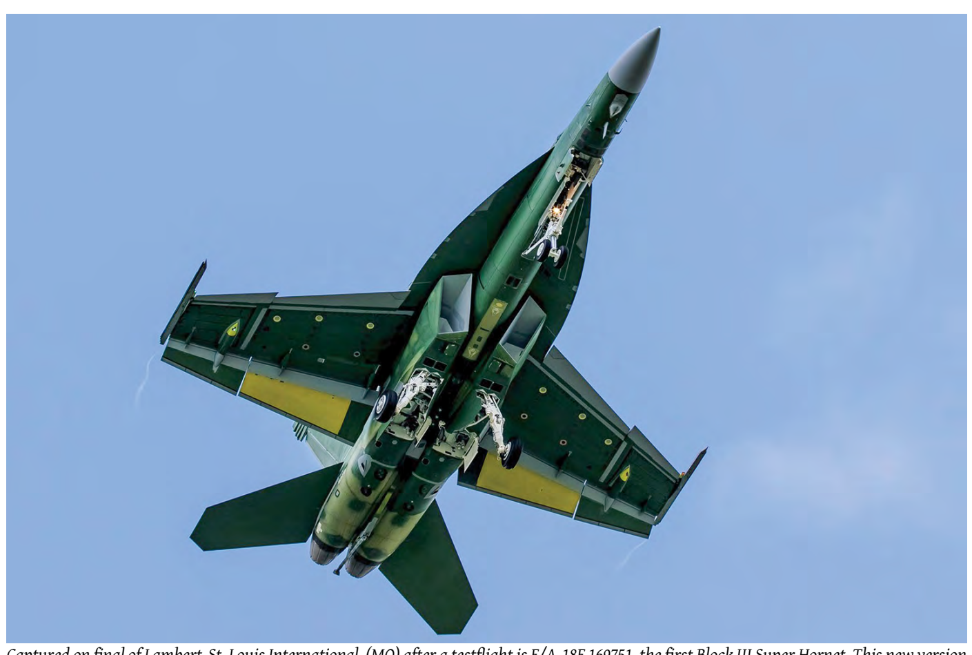
Captured on final of Lambert-St. Louis International (MO) after a testflight is F/A-18F 169751, the first Block III Super Hornet. This new version is capable of carrying shoulder-mounted conformal fuel tanks, among many other system improvements. (May 2020)