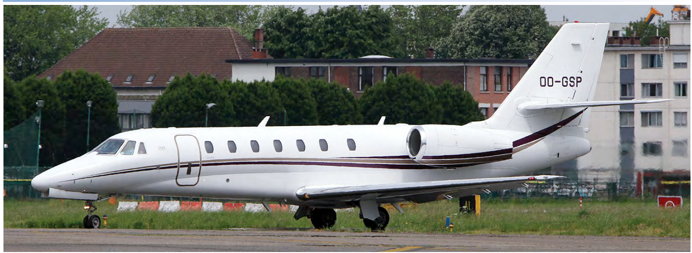
After being on the Luxembourg register for nearly ten years, former Citation Latitude LX-GSP was transferred to Air Service Liège as OO-GSP. It is seen here on the day of delivery after completing its flight from Zürich. (Antwerp, 22 May 2020,)