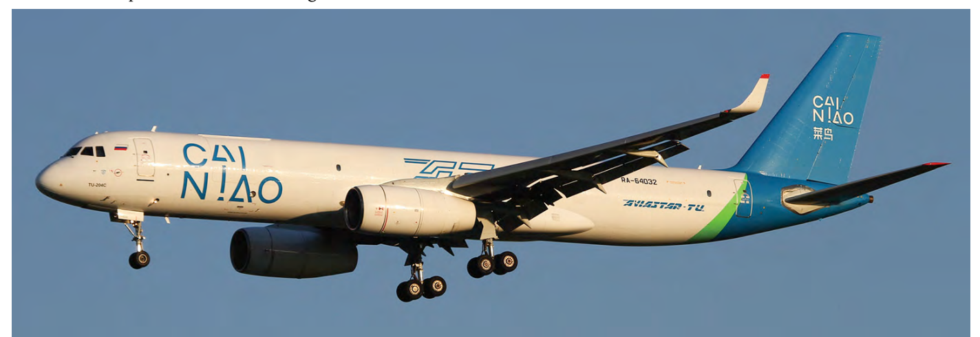
Aviastar-TU Airlines and the Cainiao group of companies signed a partnership agreement in 2019 to conduct regular cargo flights on the Hangzhou – Moscow route. Tupolev TU-204C RA-64032 was repainted in Cainiao colours in October 2019. (Liége, 15 May 2020,)