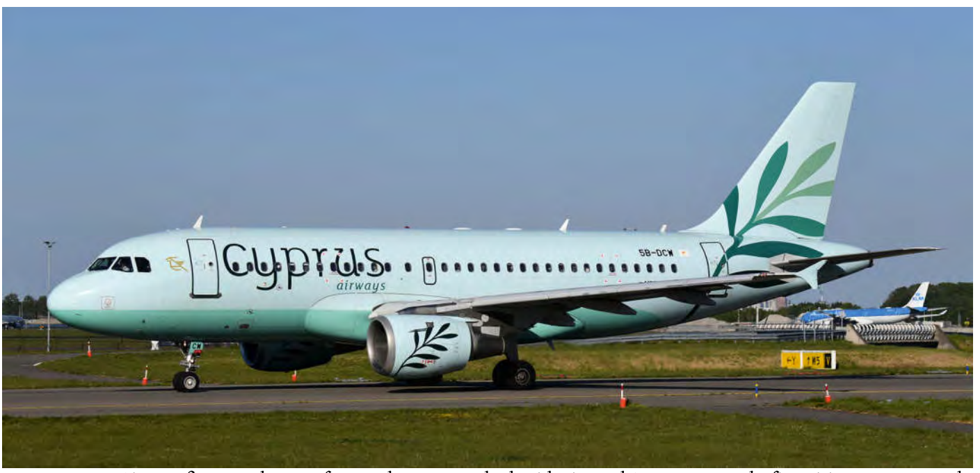
In May Cyprus Airways flew two charters, from and to Larnaca, both with pictured A319 5B-DCW. The first visit was on 6 May, the second on 27 May 2020. (Amsterdam-Schiphol, 6 May 2020)