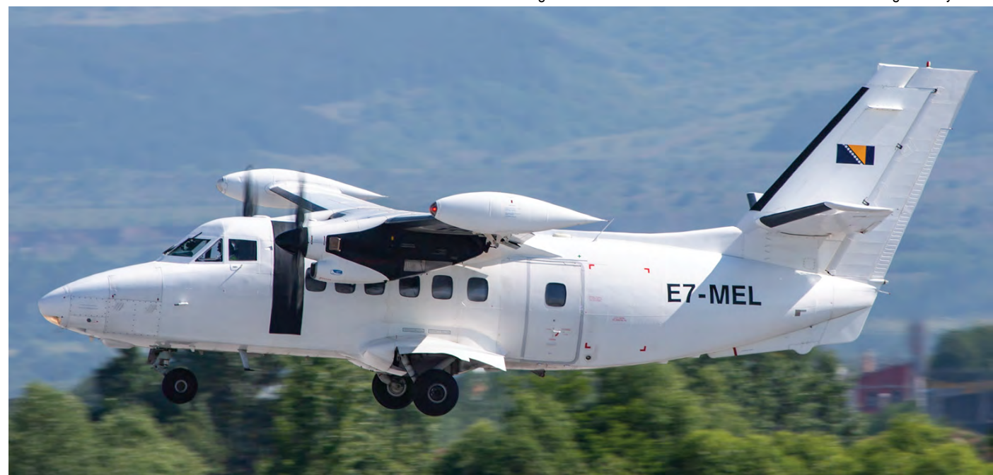
Not an exciting colour scheme but an exciting prefix, E7 of Bosnia and Herzegovina for this L-410 E7-MEL. It is seen here on approach to Sofia on 3 June 2020 on one of its several daily flights, between its hometown of Sarajevo and Sofia. The route has been served by this aircraft for the last couple of months. (Emil Dyulgerov)