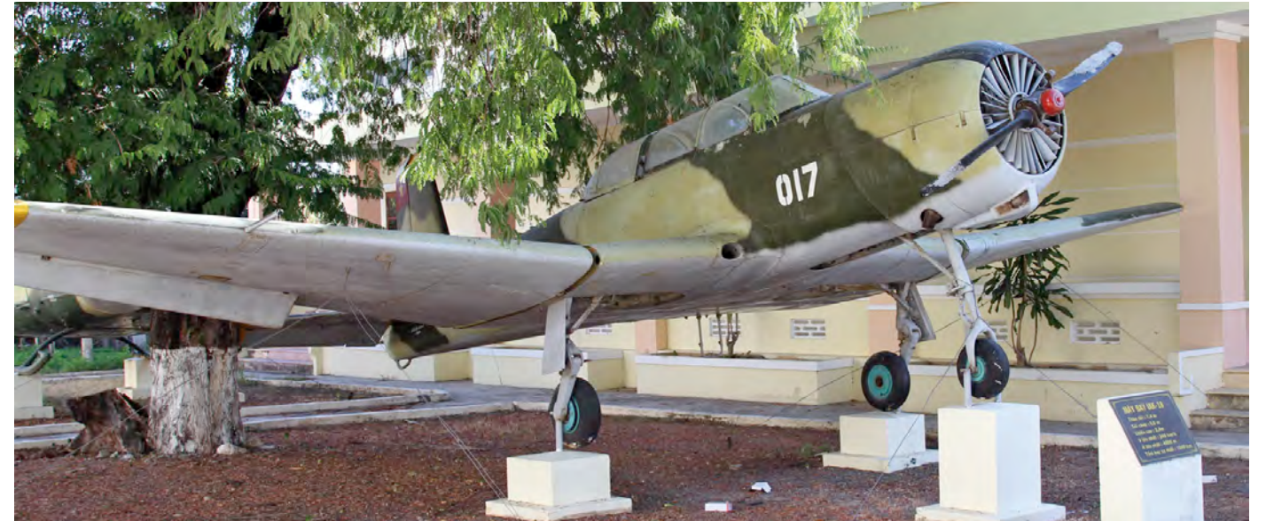
Tucked away in a corner of the base collection at Na Thrang in Vietnam, this PT-6 marked '017' sits preserved. The serial may have been chosen to highlight the fact that they operated 17, or it may actually be the real deal! (Na Thrang, 13 March 2020, Gert-Jan Mentink)