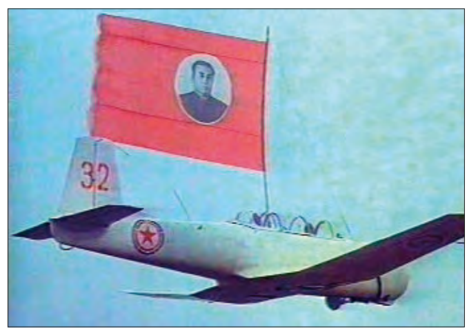
This PT-6 proudly bears the flag with the Great Leader Kim Il-Sung during a military parade. They also operate, or have operated, the Yak-18 and CJ-5 license built variant. Estimates of the PRK fleet range between 50 and 187 aircraft received. (32, Chinese internet)