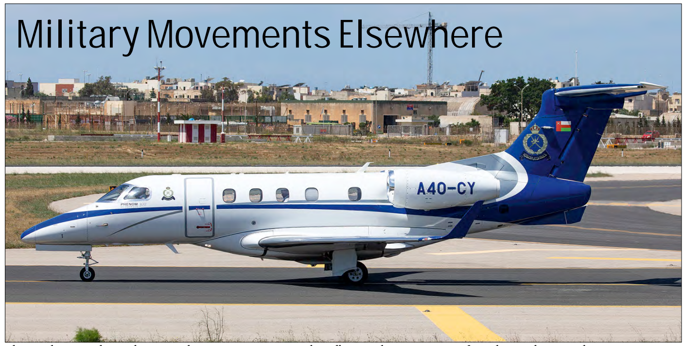
The Royal Oman Police Embraer 505 Phenom 300 A4O-CY visited Seville to send in an aircrew to ferry the Royal Oman Police CN235M A4O-CU back to its home base after undergoing high-level maintenance. Both aircraft visited Malta-Luqa for a fuel stop on their way to Muscat. (10 June 2020) 07-7187 C-17A 437th AW