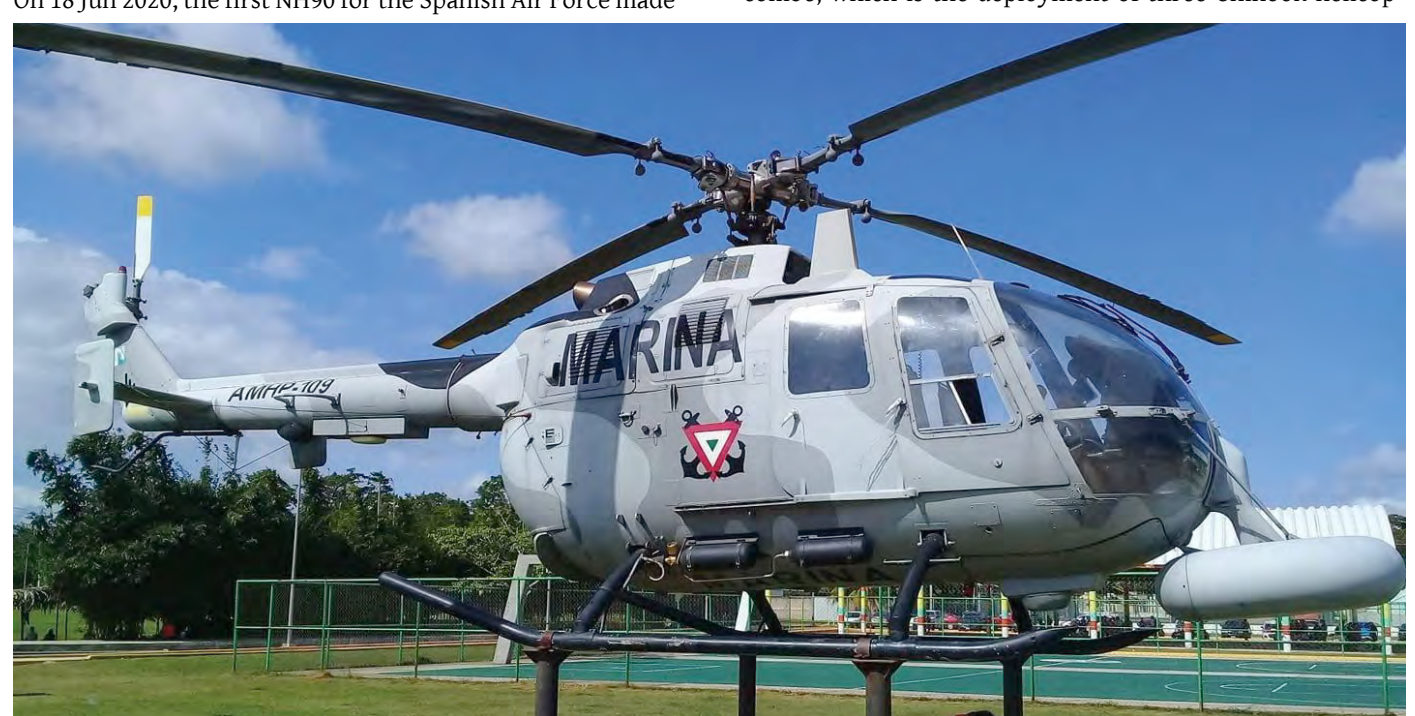
Cosoleacaque is a village in Veracruz state Mexico, close to the naval air station of Minatitlán. That is probably the reason the local sportsclub received an L-90 Redigo and this Bo105. (AMHP-109, Bo105CB-5, 04 January 2020, Ramirez Altamirano)

The UK government has decided to extend Operation Newcombe, which is the deployment of three Chinook helicop-