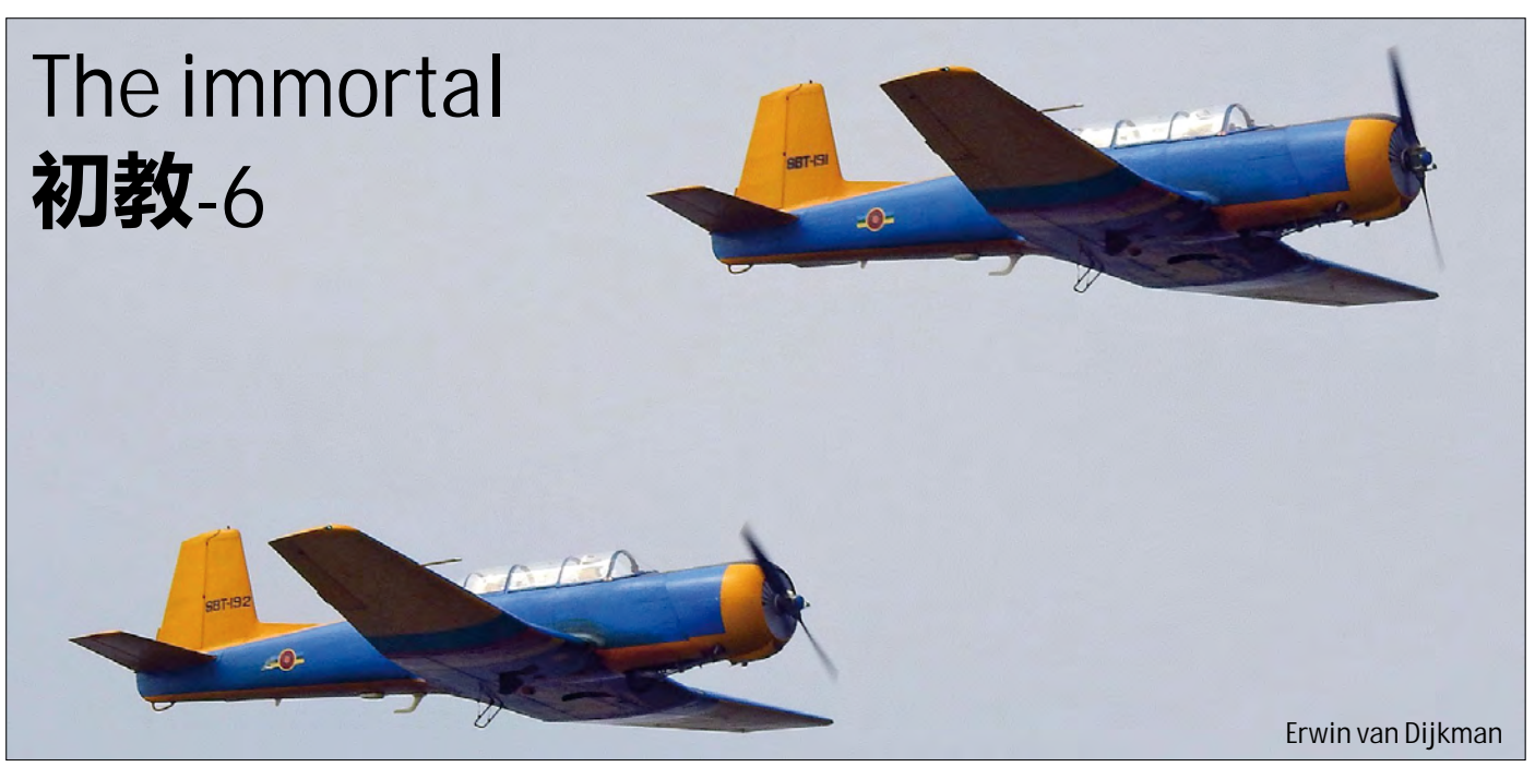
Each year on 4 February, Sri Lanka celebrates Independence Day. Usually an impressive military parade is held and last year at the 71st anniversary, the 'new' PT-6s were shown off. Six of these were delivered in 2018 from the new production line.

Maybe the CJ-6 is one of those unsung heroes, or we are getting itchy when Chinese information sounds more like propaganda, but fact is that nearly 3,000 of this trainer were made. And, they are still being manufactured! Also, about 15% of them fly on the Warbird scene, mostly in the United States. So there is a fair chance to encounter one of these sturdy workhorses. We will give some short historic notes, some explanation on the production, followed by the military users, and the known construction numbers.