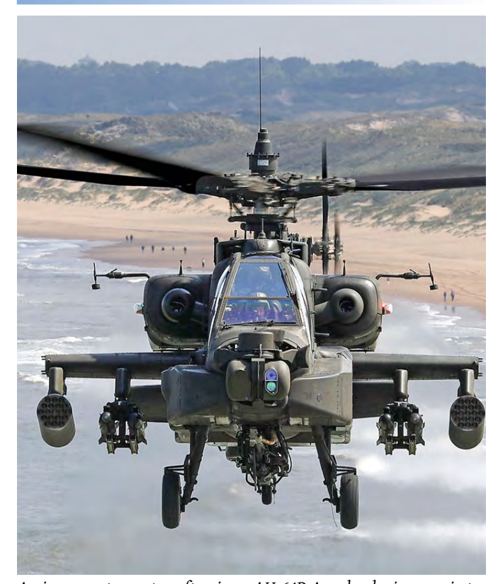
An image not seen too often is an AH-64D Apache during an air-to-air shoot. This Royal Netherlands Air Force Q-19 is photographed above the beaches of Scheveningen, where in the back, social distancing can be observed. (11 June 2020, Ralph Blok)

If you would like to subscribe to our digital magazine, go to www.pocketmags.com and search for "Scramble"