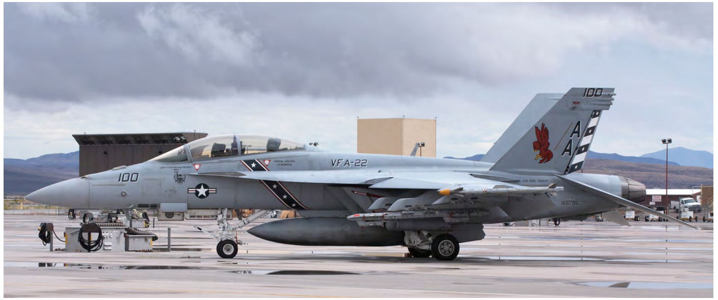
United States Navy F/A-18F Super Hornet 166795/NH-104, operating from the USS Theodore Roosevelt (CVN-71), crashed in the Philippine Sea on 18 June. Fortunately the pilot and the Weapons Systems Officer (WSO) ejected safely. (NAS Fallon (NV) 4 October 2010,)