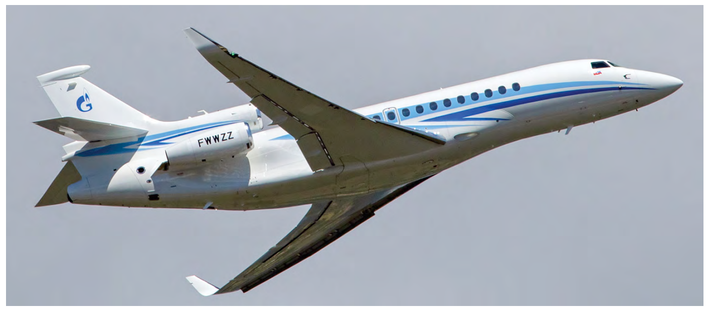
New Falcon 8X F-WWZZ (c/n 462) is seen departing from Geneva for a test flight above France. The colours easily betray the future operator, Gazpromavia. (22 June 2020, Robert Erenstein)