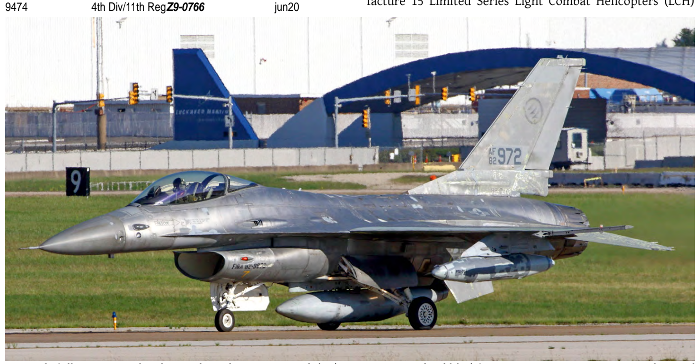
Stripped of all paint, F-16A (ADF) came through NAS Fort Worth (TX) on its way to Cecil Field (FL) for QF-16 conversion. It was previously stored at Davis-Monthan AFB (AZ) with 309th AMARG. (29 May 2020,)

If HAL is right, and the contract is closed this year, it will be a full four years after the Indian MoD cleared the acquisition in November 2016. After the clearance by the MoD, another year passed before the first Request for Proposal (RFP) was issued. On 22 December 2017, HAL received the RFP to manufacture 15 Limited Series Light Combat Helicopters (LCH)