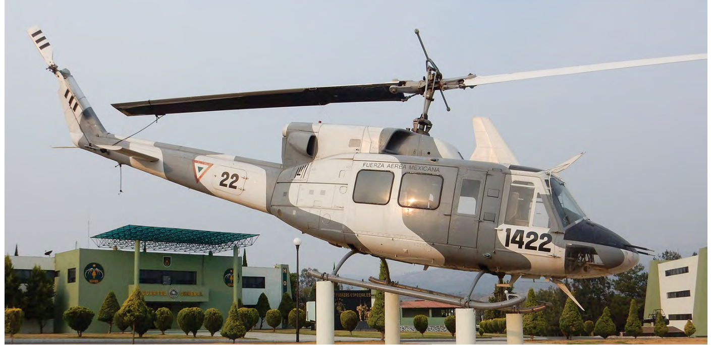
"Nothing will be scrapped", seems to be the motto in Mexico these days as many retired aircraft have found their ways to institutions and villages in recent years. This Bell 212, serial 1422, is now at Campo Militar 37-B. (Temamatla, April 2019)

1075 dam. 24feb78 flew by Cuban pilot 1076 w/o 24jan78 flew by Cuban pilot