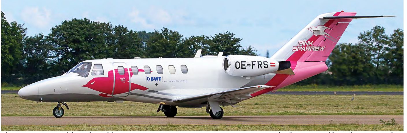
This Cessna 525A was delivered to Salzburg Jet Aviation in January 2016. Since June 2019 OE-FRS has been operated by Pink Sparrow in these colours. The bizjet is being operated for Austrian company BWT (Best Water Technology) hence the additional titles. (Rotterdam - The Hague, 14 May 2020,)