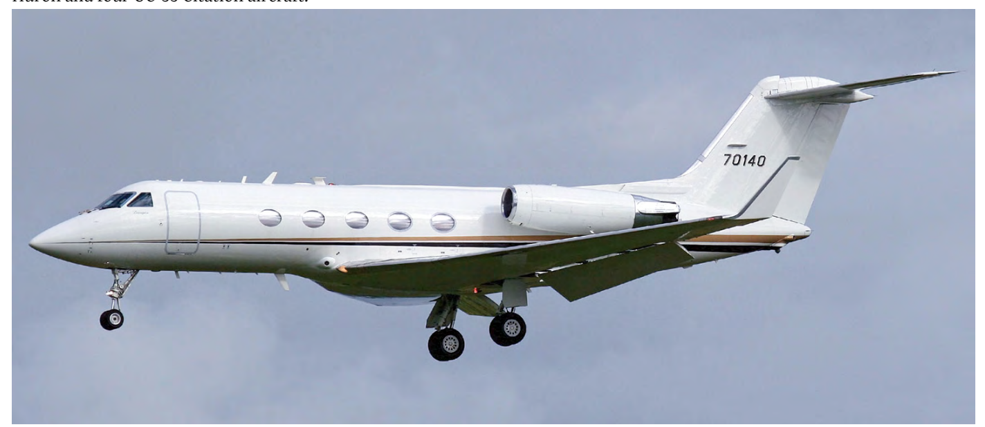
For ten years, the USAPAT maintained a detachment at Ramstein Air Base, Germany, which was equipped with a single C-20E. The aircraft shown here, 87-00140, arrived in 2004 and returned to the United States on 23 July 2014. On the same day, this detachment was officially disbanded. About a year before the aircraft left, on 10 September 2013, this Gulfstream visited Shannon Airport, Ireland.

Three of the four Regional Flight Centers did not survive and were disbanded. The only surviving one is located at Davison AAF, Fort Belvoir (VA), and it was renamed into the non-executive OSA-A Flight Detachment. The unit is equipped with a single C-12 Huron and four UC-35 Citation aircraft.