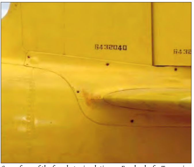
Crop of one of the few shots circulating on Facebook of a Tanzanian PT-6, at least it revealed the construction number 6432040 to us!