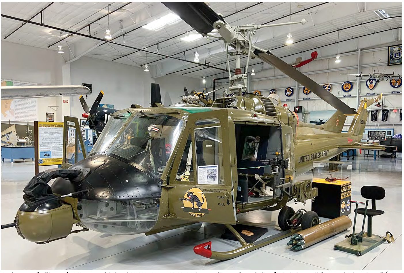
At the same facility as the Mustang, this iconic UH-1B Huey 64-13986, is according to the website of CAF Arizona Airbase a visiting aircraft (Mesa Falcon Field, 15 March 2020,)

moving forward. The major concern if things unravelled too quickly was of course being able to get home but as we were flying home from Los Angeles to Heathrow with a Delta/Virgin ticket, we decided to stay the course and continue.