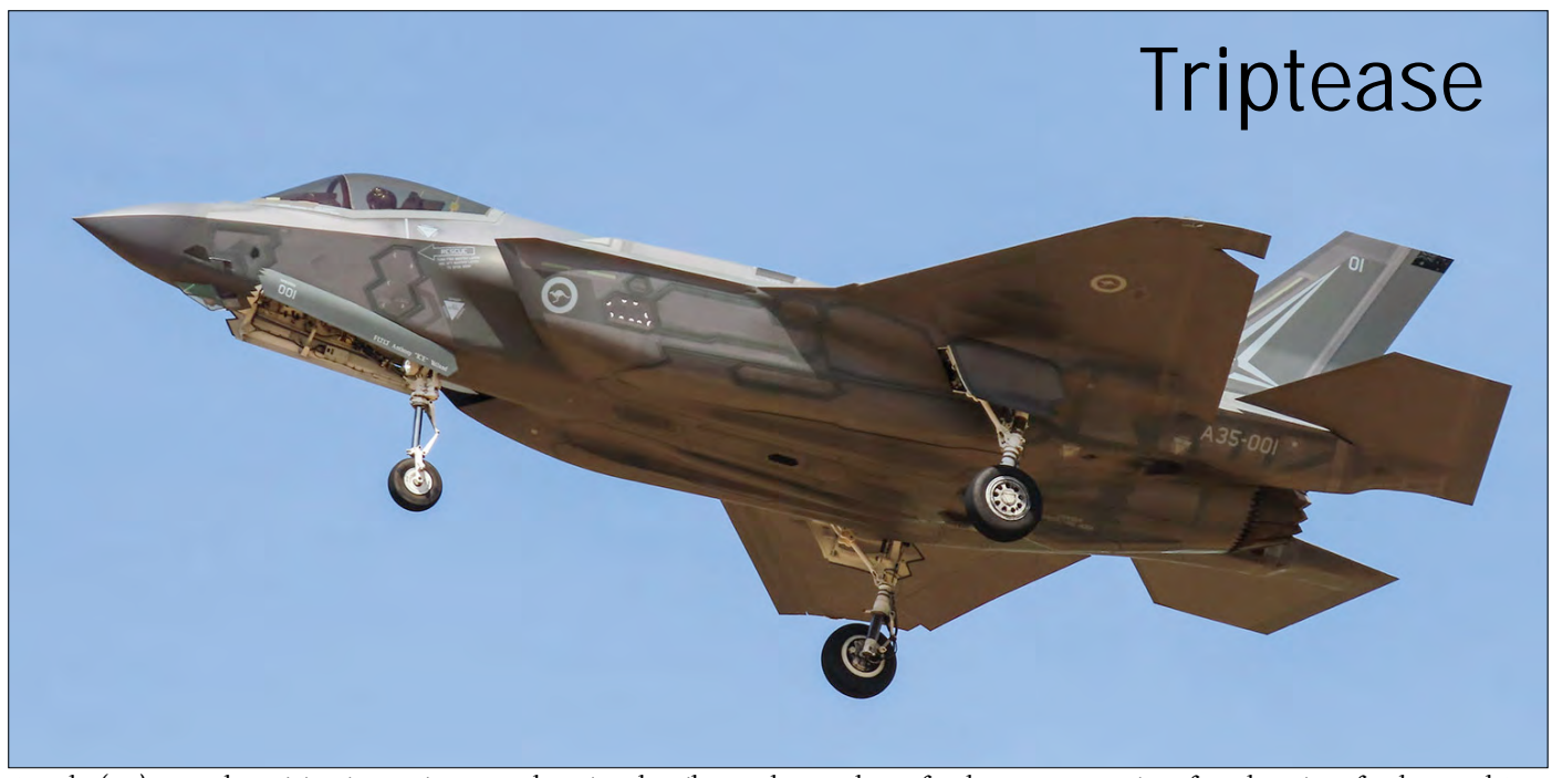
At Luke (AZ) several participating nations are educating the pilots and groundcrew for the next generation of combat aircraft. The Royal Australian Air Force has several F-35A Lightning IIs within the 56th FW, A35-001 in one of them. (16 March 2020, Grant Robinson)