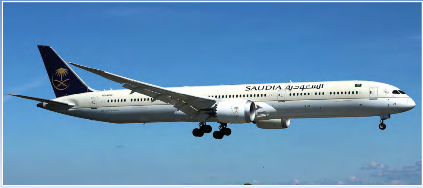
Cargo flights of Saudia are also operated with the Boeing 787, mostly with a -9 but occasionally with a -10, like HZ-AR24. (Amsterdam-Schiphol, 17 May 2020, Robert Eikelenboom)