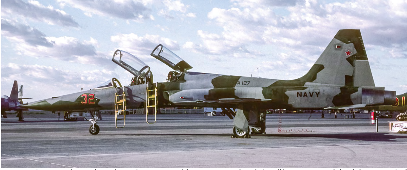
F-5F 160966/AF-32, seen here in the markings of VFA-127, one of the aggressor squadrons before all but VFC-13 were disbanded. VFA-127's final homebase was NAS Fallon (NV), where this image was shot. (23 August 1989,)