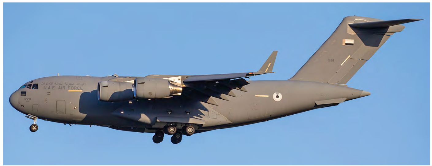
On 27 May 2020 a rare visitor was caught on camera by jochem Jottier at Liége Airport. C-17A 1228 is being operated by the United Arab Emirates Air Force Heavy Transport squadron based at Abu Dhabi.