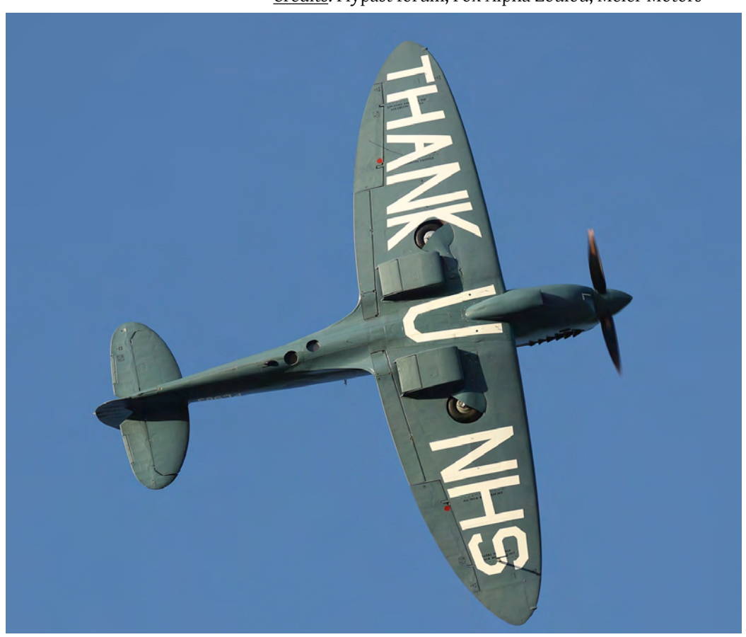
Great Britain is one of the countries that has suffered a tremendous number of casualties from the COVID 19 pandemic. And it is thanks to the people working in the British clinics and hospitals that the number has 19 pandemic. And it is thanks to the people working in the British clinics and hospitals that the number has 19 pandemic. And it is thanks to the people working in the British clinics and hospitals that the number has 19 pandemic. And it is thanks to the people working in the British clinics and hospitals that the number has 19 pandemic. And it is thanks to the people working in the British clinics and hospitals that the number has 19 pandemic. And it is thanks to the people working in the British clinics and hospitals that the number has 19 pandemic. And it is thanks to the people working in the British clinics and hospitals that the number has 19 pandemic. And it is thanks to the people working in the British clinics and hospitals that the number has 19 pandemic. And it is thanks to the people working in the British clinics and hospitals that the number has 19 pandemic. And it is thanks to the people working in the British clinics and hospitals that the number has 19 pandemic. And it is thanks to the people working in the British clinics and hospitals that the number has 19 pandemic. And it is thanks to the people working in the British clinics and hospitals that the number has 19 pandemic. And it is thanks to the people working in the British clinics and hospitals that the number has 19 pandemic. And it is thanks to the people working in the British clinics and hospitals that the number has 19 pandemic. And it is thanks to the people working in the British clinics and hospitals that the number has 19 pandemic. And it is thanks to the people working in the British clinics and hospitals that the number has 19 pandemic. And it is thanks to the people working in the British clinics and hospitals that the number has 19 pandemic. And it is thanks to the people working in the British clinics and hospitals

Credits: Flypast forum, Fox Alpha Zoulou, Meier Motors