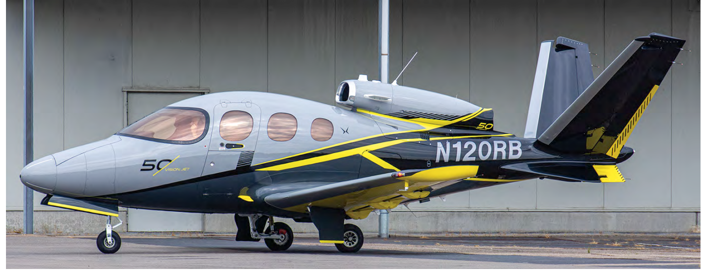
Cirrus SF50 N120RB was registered to APG Aviation on 9 June 2020 and is one of a few SF50s operating in Europe. This example is based at London-Luton. (Rotterdam-The Hague, 14 June 2020, Gideon van Dijk)