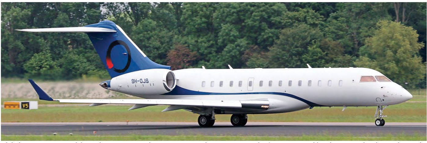
Global 6000 9H-OJS was delivered to OJets in April 2018. Being an indirect air carrier the fleet is operated by Elit'Avia Malta. (Rotterdam - The Hague, 22 May 2020,)