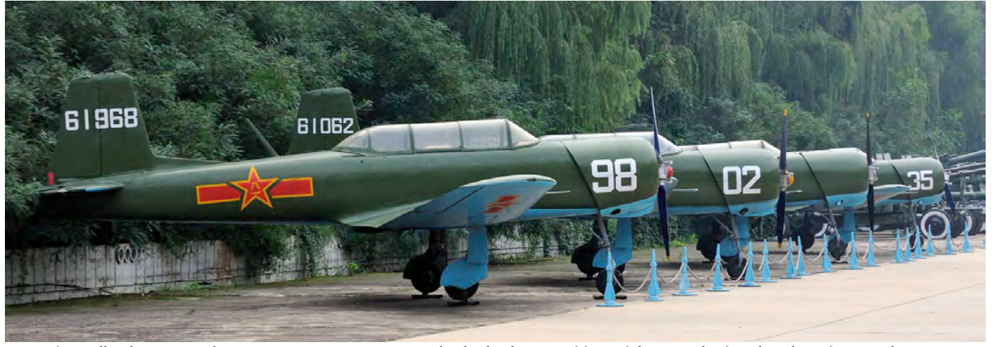
Most of us will only ever see the CJ-6 in a museum or as a warbird. This line up of four of them can be found in the infamous China Aviation Museum with exhibits partly inside a huge mountain cavern. Just outside, 61968 and 61082 that lead 'MiG-alley', were formerly operated by the 6th Flying Academy. (Xiaotangshan, 12 September 2014, Erwin van Dijkman)

couple of years as Factory 512 merged into Factory 320 and the construction numbers regained the 320 coding.