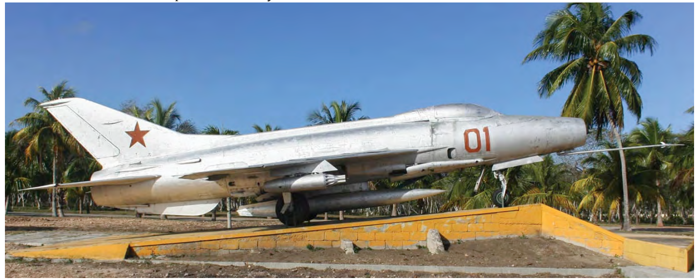
Following last month's DAAFAR 2020 article, here is another peek inside a Cuban air base. This MiG-21F-13 is preserved at Holguín to commemorate Soviet Il-28s and MiG-21s that were deployed here during the Cuban missile crisis of October 1962. The MiGs were officially handed over to the DAAFAR after the crisis. ("01 red", MiG-21F-13, Holguin)