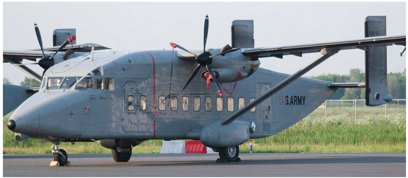
Pictured during a rare visit to The Netherlands, a C-23C in use by H(-)/171st AVN GA ARNG at Rotterdam The Hague Airport on 10 May 2006. Three C-23 aircraft made a fuel stop and stayed overnight while in transit from the United States to the Iraq. The deployed Sherpa aircraft rarely made headlines, but were a vital part of the logistics process allowing the US military to operate in this war-torn country. (Rene Sleegers). Only 93-01329 can be considered as confirmed since it was entered into the FAA civil aviation register as N446NA, with as model description C-23D.