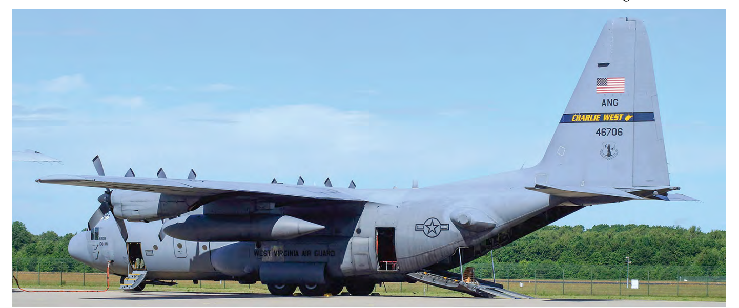
On 8 June 2020, C-130H 94-6706 was damaged during landing at Camp Taji (Iraq) when it overran the runway and collided into a wall. The Hercules belongs to the 158th AS of the Georgia Air National Guard. When this photo was taken, in happier times, it flew with the 130th AS, West Virginia ANG. (Eindhoven, 22 May 2014,)

Mi-35 This <u>Libyan Air Force</u> Mi-35 was stuck under a bridge while being transported into Tripoli. Sources say that it is the one which was captured in Tarhuna a few days ago, however this Mi-35 has different colour spray on the starboard side compared to the one in the video, which features the towing of the Mi-35 (possibly sprayed on the way). Also the Mi-35 of the video has the rotor attached and the registration number