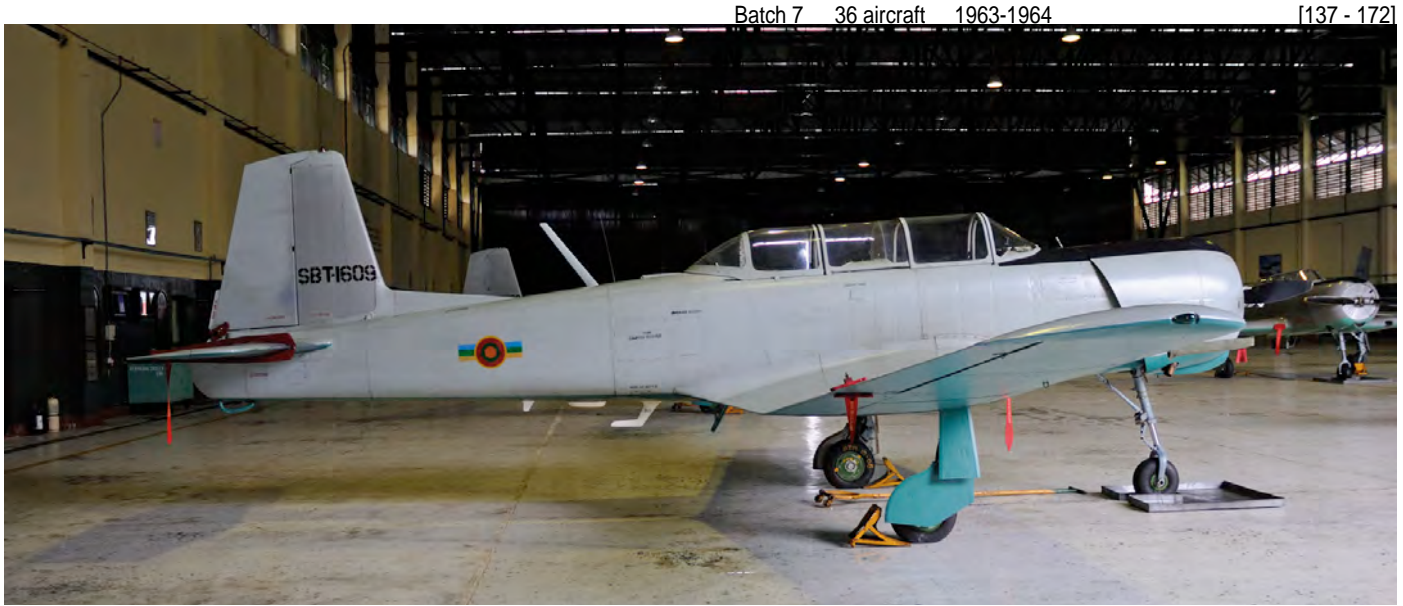
Sri Lanka is changing their serial system more often than a normal person buys a new coat. Luckily, in 2011 most could be checked on their construction number revealing ten to be batch 64 aircraft and two from batch 68. This SBT-1609 is now registered SBT-1162 and probably also repainted in the now standard blue and yellow colour scheme. (Trincomalee/China Bay, 7 February 2011, Erwin van Dijkman)