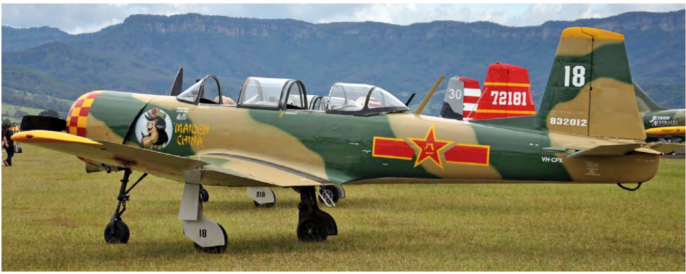
Australia has been at the forefront of incorporating the CJ-6 into the warbird scene. There has been an influx since the early nineties. Infamous operation is the one in which no less than eighteen were crated and imported in November 1995. Leading the flightline here at Wollongong/Illawarra is VH-CPX, correctly marked '832012' on its tail as that is the actual construction number.