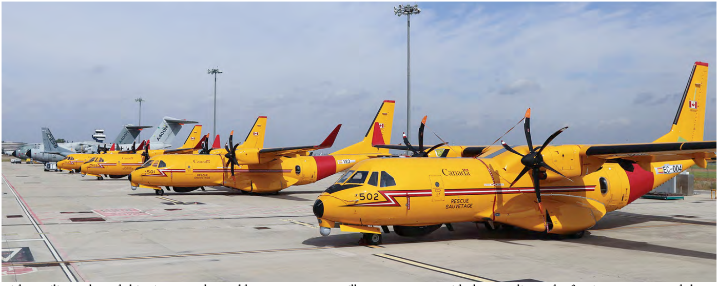
Airbus Military showed this picture to the world on 10 June 2020, to illustrate progress with the Canadian order for sixteen CC-295 and three-maintenance trainers. The fourth aircraft was ready for flight testing on this date (295501 to 295504, CC-295, Seville/San Pablo)