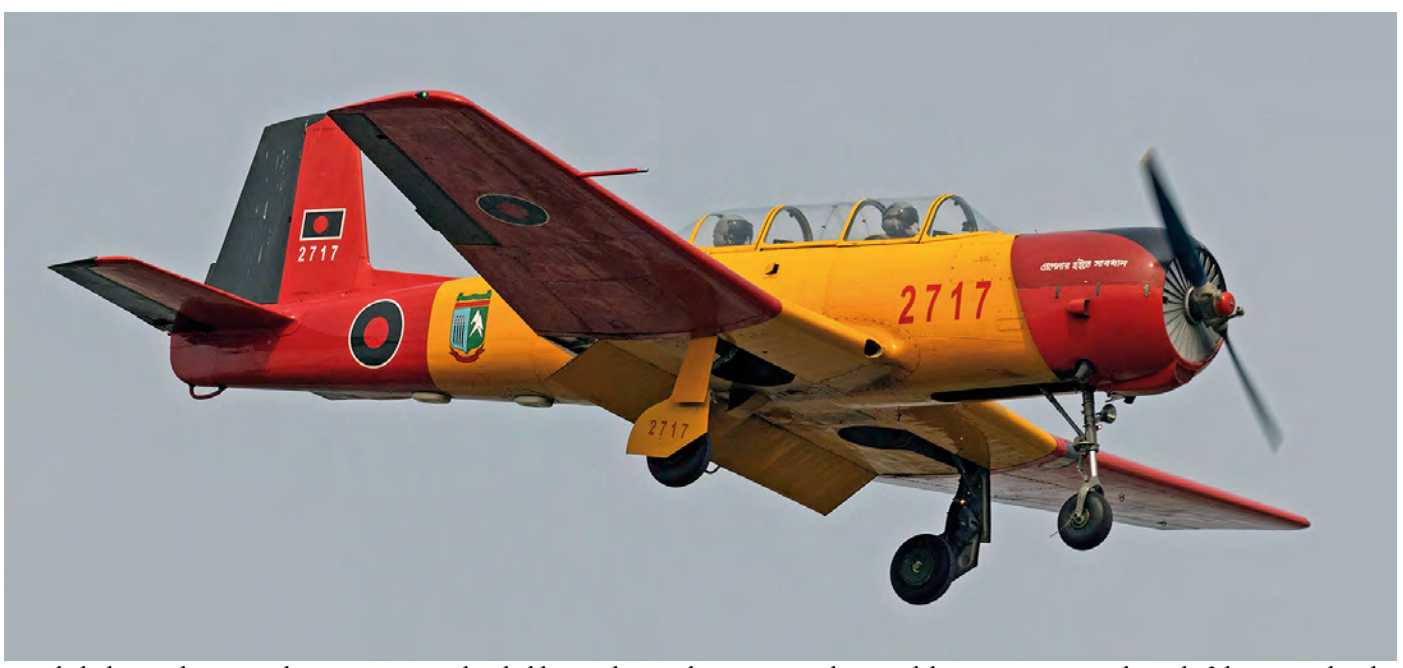
Bangladesh uses the PT-6 in large quantities. They hold a yearly parade on 16 December to celebrate Victory Day, the end of the war with Pakistan. To participate, the Jessore-based PT-6s are usually sent to Dhaka. (Dhaka/Hazrat Shahjalal Intl, 11 December 2019,)