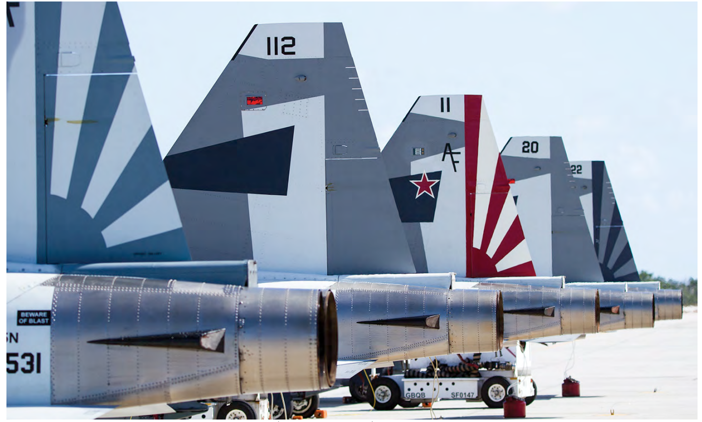
The different tailmarkings carried by VFC-111s Tigers.