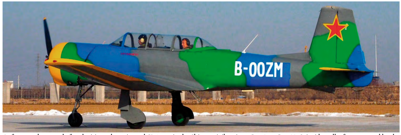
As far as we know, only four legitimately registered CJ-6s are in the Chinese civil register, B-0035 to B-0038. Coincidentally, four operated by the same registrar are now flying as B-00ZJ to B-00ZM. Maybe they are the same? (Datong/Beitong, 23 December 2016, Li Chuyi)