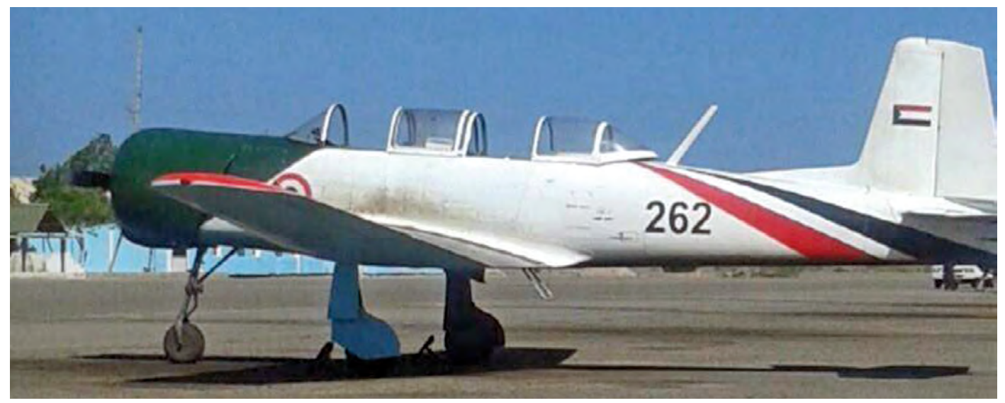
All we know about Sudan's PT-6s is taken from photographs posted on social media. The colour scheme resembles to some extent that used on the K-8s also on strength in this East African country. (February 2015, Hassan Abdullah)