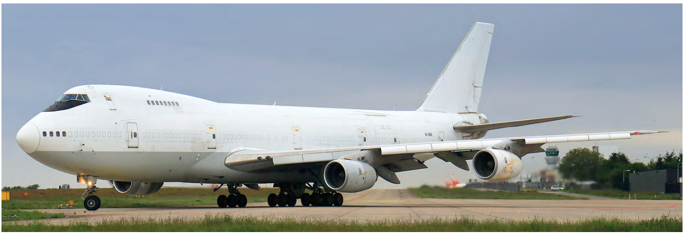
Originally delivered to British Airways in March 1987, this grand old lady was converted to freighter for Air Atlanta Icelandic, the second airline operating this aircraft. As 4L-GEN it was acquired in March 2019 by Georgian carrier Geo-Sky still going strong as a cargo aircraft. (Maastricht - Aachen, 3 May 2020,)