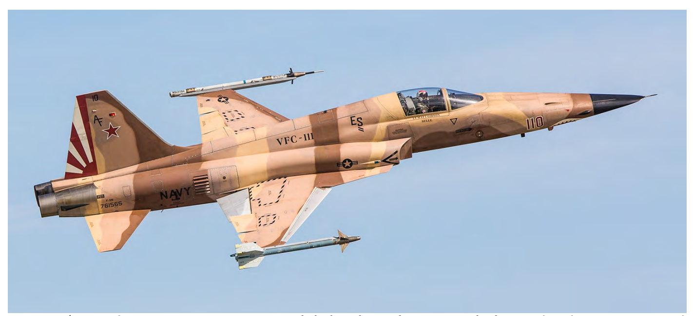
F-5N 761565/AF-110 is former Swiss Air ForceF-5E J-3040. Its sleek, classic lines make it apparent why this aircraft is a favourite among aircraft enthusiasts. (Boca Chica (FL), 23 December 2015)