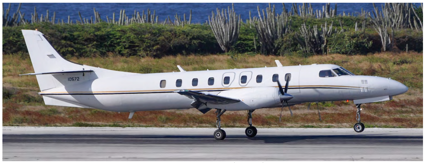
Both the Air National Guard and the Army National Guard use the Fairchild (Swearing) C-26 Metroliner. The Air National Guard aircraft are modified for surveillance duties and often used in counter-drug trafficking missions. In contrast, the Army National Guard examples are solely used for transport of both persons and cargo. The example shown het (91-00572) is shown here while visiting Hato (Curacao) on 13 February 2011. This aircraft is currently used by B(-)/2-245th AVN GA ARNG, which previously was known as Det.9 OSACOM GA ARNG. (Felix Martina).