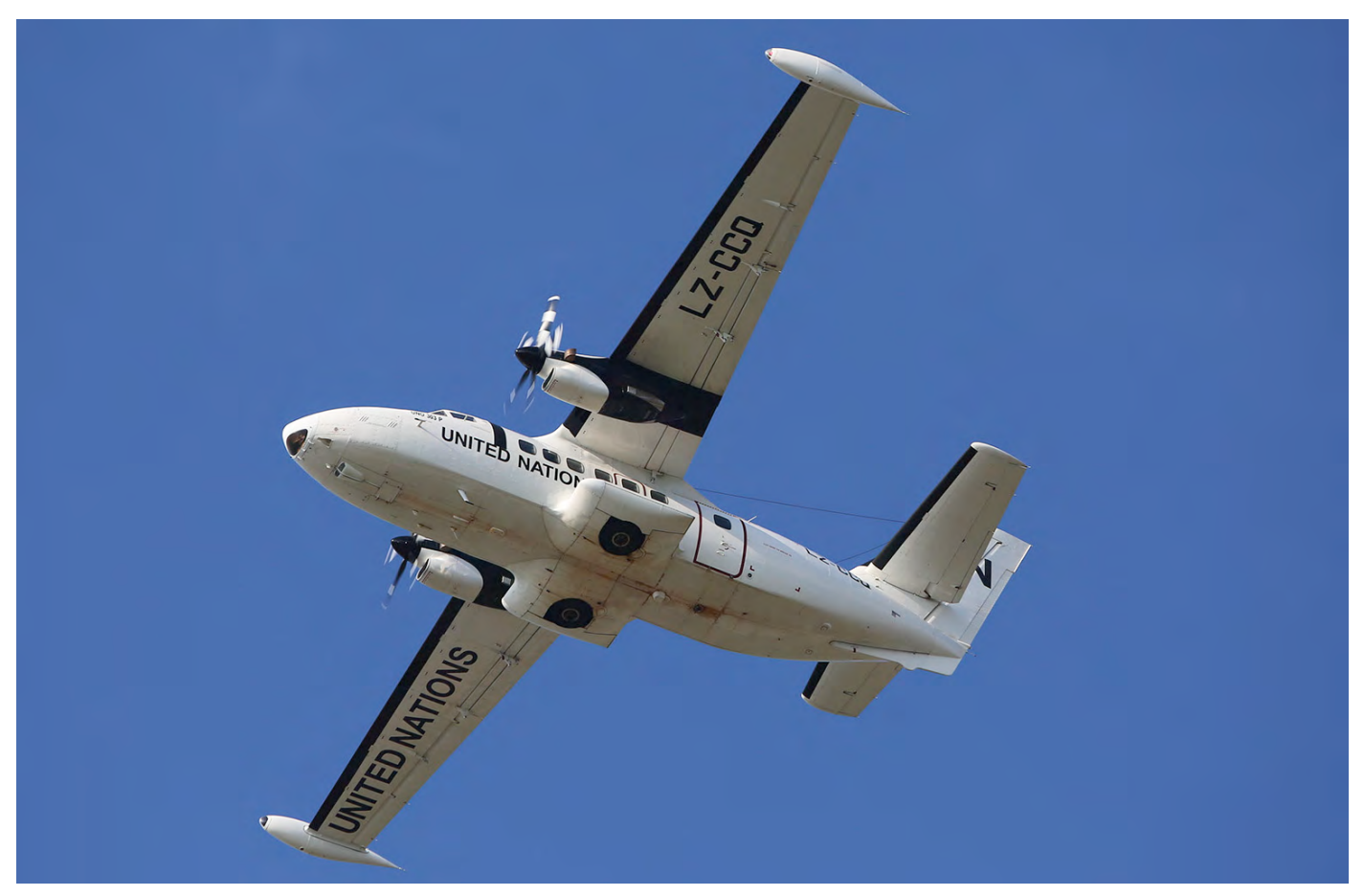
Although built in 1992 for Aeroflot, it was never delivered to Russia but stored for a long time until being delivered to South Korea in 2007. Funnily, it carried registration OK-KIM prior to its delivery to South Korea and after its return from there, but naturally this was not on purpose... Anyhow, it became LZ-CCQ in 2011 and was seen in Africa many times over the past years, operating on behalf of the UN. Back at its base in Sofia, it is seen here after take off for a test ride to Poprad on 2 June 2020. It now carries additional code 'UNO-303P'. (Emil Dyulgerov)