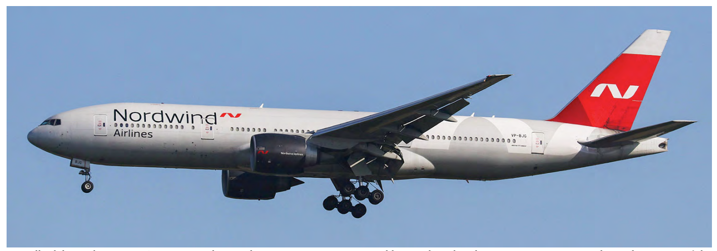
Initially delivered to AeroMéxico in March 2006 this Boeing 777 was acquired by Nordwind Airlines in 2018 as VP-BJG. This airline is one of the 'COVID-19' visitors. (Brussels, 18 May 2020,)