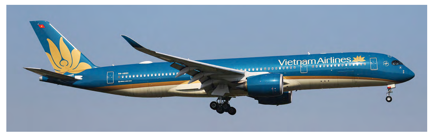
Vietnam Airlines took delivery of this Airbus A350 in August 2017. They mostly visit Belgium on government duties but VN-A893 paid a visit related to the COVID-19 virus. (Brussels, 27 May 2020)