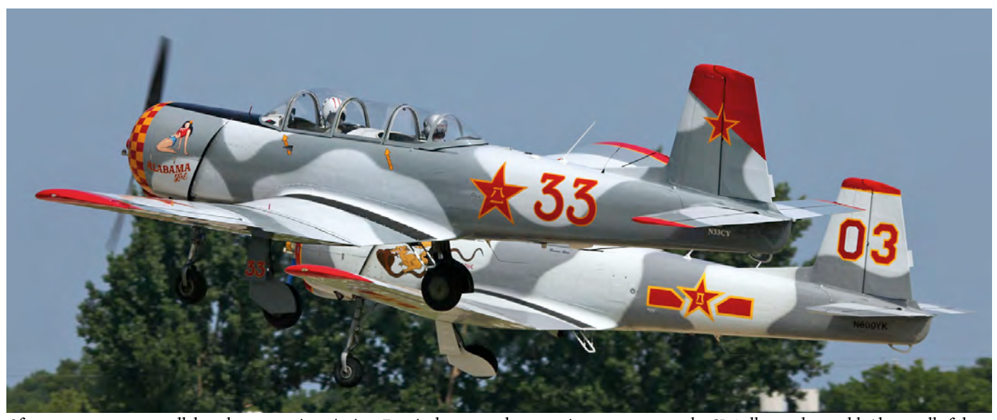
Of course we can argue all day about taste in painting. Fact is that many happy private owners use the CJ-6 all over the world. Almost all of them from former PLAAF training regiments, two were sourced directly from the factory. Unfortunately, some mistakes have crept in while registering them. The N600YK/'03' for example is unknown and registered as 'H2S001' built in 2001. (Oshkosh, 31 July 2014, David Alders)