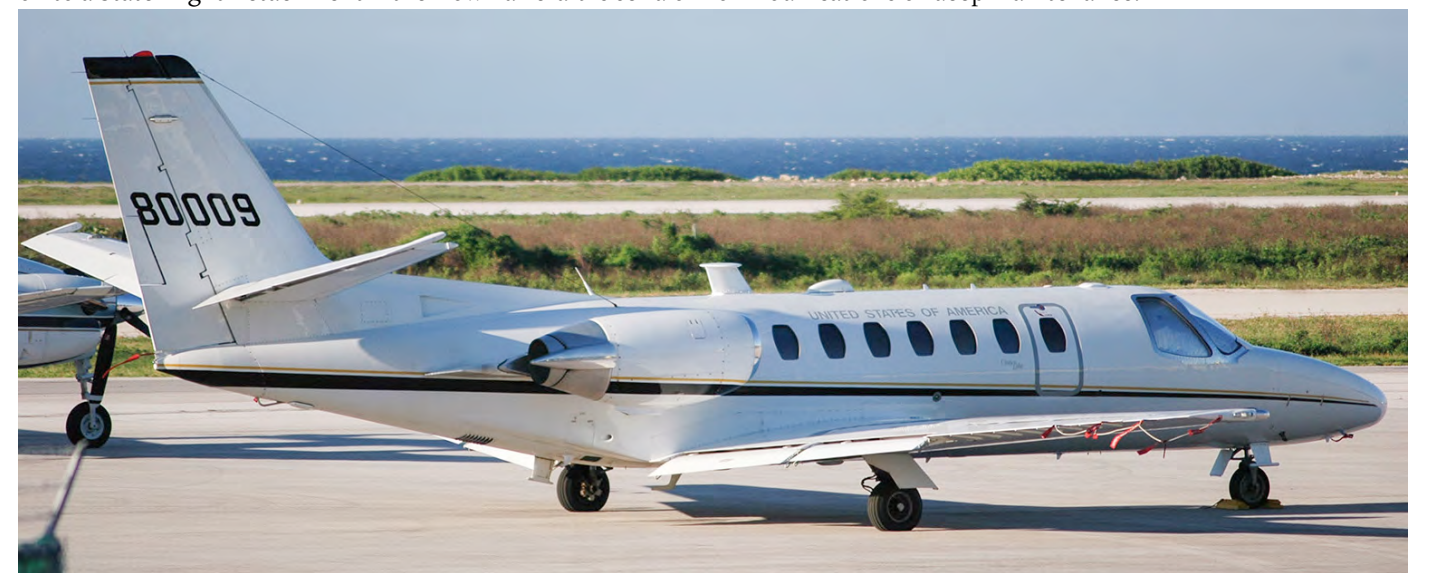
One of four UC-35A1 Citation aircraft (98-00009) assigned to the OSA-A Flight Detachment can be seen here on the tarmac at Hato (Curacao) on 16 June 2005. This unit was one of four Regional Flight Centers and the only one which survived the 2015-reorganization. (Felix Martina).

Of these four units only the one at Fort Belvoir (VA) survived. It was renamed non-executive OSA-A Flight Detachment. The official UE (Unit Equipment) of this detachment are a single C-12 and four UC-35 aircraft. However, ADSB data shows that usually two C-12s are in use. The most likely explanation is that an additional aircraft is kept in operational reserve here, and it is passed on to a State Flight Detachment if their own aircraft is send off for modifications or deep maintenance.