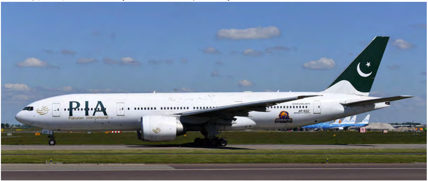
Also on the 6th of May, PIA - Pakistan International Airlines showed up with Boeing 777 AP-BGZ, which was also a first visit. (Amsterdam-Schiphol, 6 May 2020,)