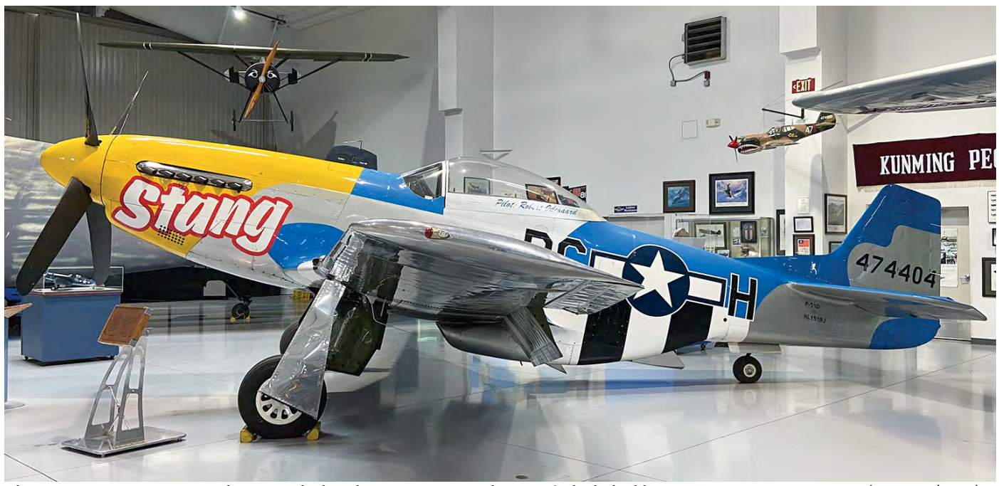
The Commemorative Air Force has several "detachments", 75 in total, most of which double as museums. P-51D NL151RJ (44-74404/BC-H) is part of the Arizona Airbase. (Mesa-Falcon Field, 15 March 2020,)

Both California and Washington States had by now declared a state of emergency and this was clearly going to affect things