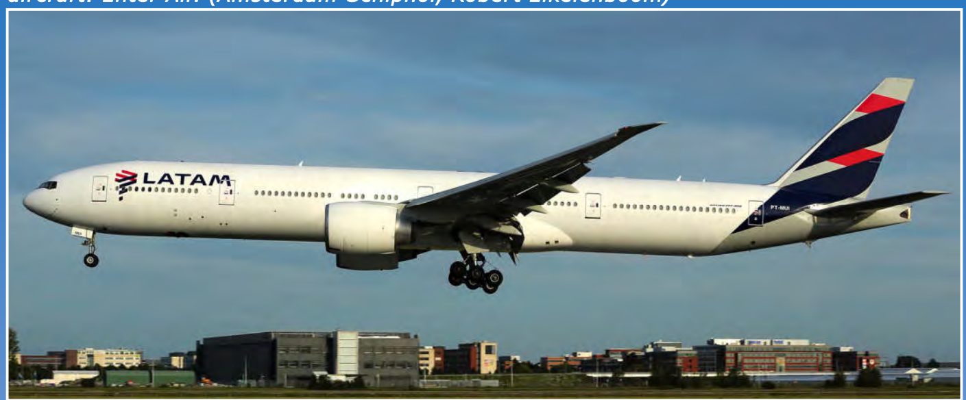
LATAM Airlines uses Schiphol as a stop-over on their cargo flights from Brazil to China and back. Several passenger Boeing 777-300ERs are used on this route. PT-MUI is seen here finishing a flight from Xiamen. (Amsterdam-Schiphol, 1 June 2020,)