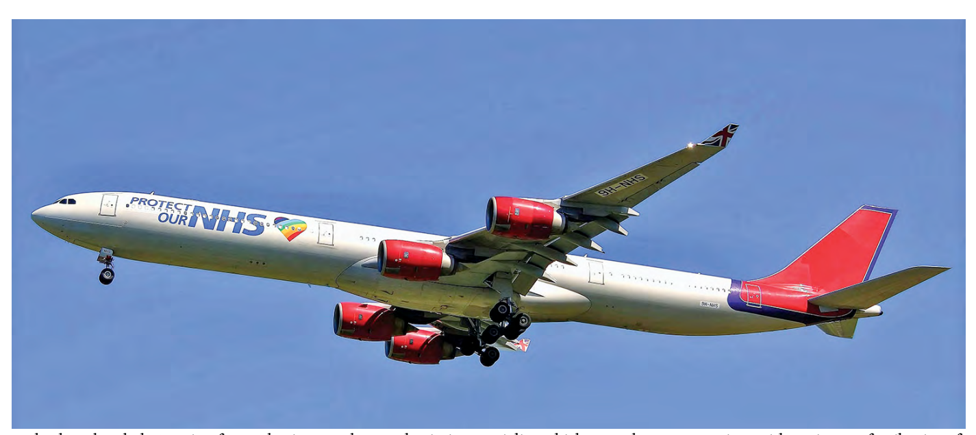
Malta-based Maleth-Aero is a former business and general aviation specialist, which started ACMI operations with Boeing 737 family aircraft in 2016. In April 2018 it announced a further expansion of its activities to include widebody aircraft with former Virgin Atlantic A340-600s. The long quad jets will be leased from the European Aviation Group. In spring 2020 the first two A340-600s were registered in Malta and a third one will follow in the very near future. All three aircraft wear titles to support the British NHS service. Shown here is former G-VWIN, with the applicable registration 9H-NHS. It has been operating cargo flights out of Bournemouth to China to pick up medical supplies and PPE since the second half of May. (Bournemouth, 26 May 2020,)

Aviation lessor <u>SMBC Aviation Capital</u> has announced it deferred the delivery of 68 B737MAX-family aircraft. The planes, that were not on the production line yet, and were planned to be delivered between 2021-2022, are now deferred until at least 2025. In an interview with FlightGlobal, the CEO said that the deferral was mainly driven by the challenges