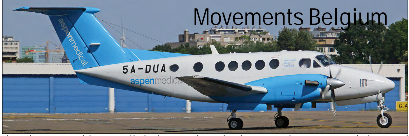
This Beech 200 was previously being operated by the Libyan National Meteorological Centre. Since at least May 2018 5A-DUA has been operated by Aspen Medical. The aircraft carries the Libyan Red Crescent logo on its left side. (Antwerp, 11 May 2020)