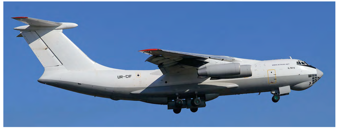
ZetAvia was established in April 2009. Although their website states a fleet of six Il-76T/TD aircraft, it only lists five with UR-CIF being one of those. (Eindhoven, 21 May 2020, Pascal Lambriks)