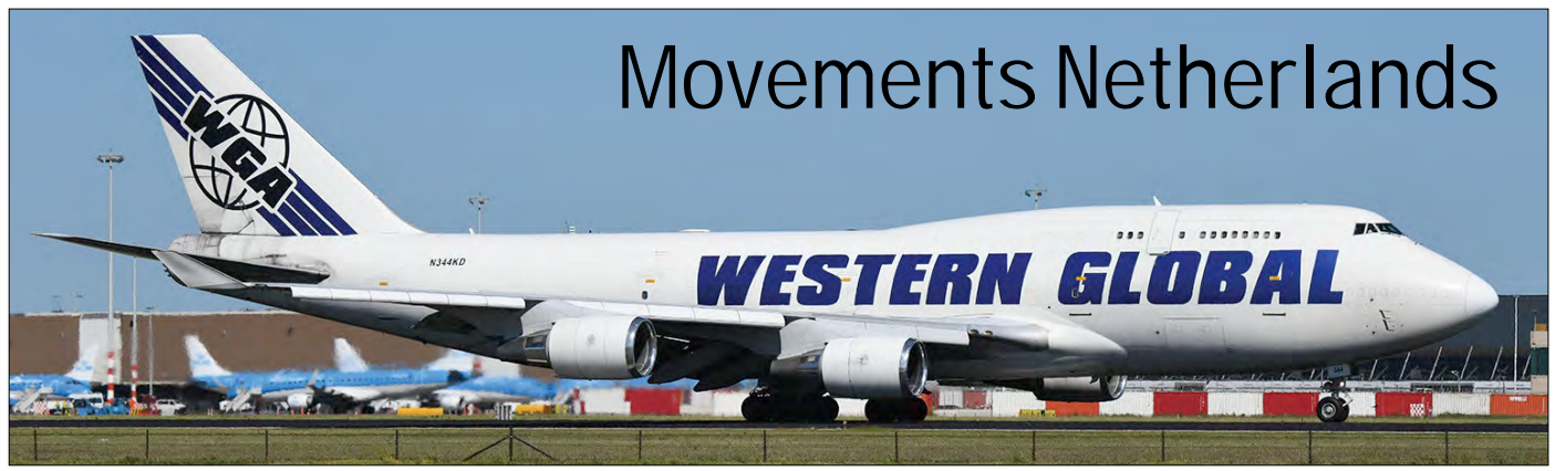
Western Global Airlines took delivery of this Boeing 747 already in December 2015. N344KD has been carrying these colours since April 2018. (Amsterdam - Schiphol, 31 May 2020,)