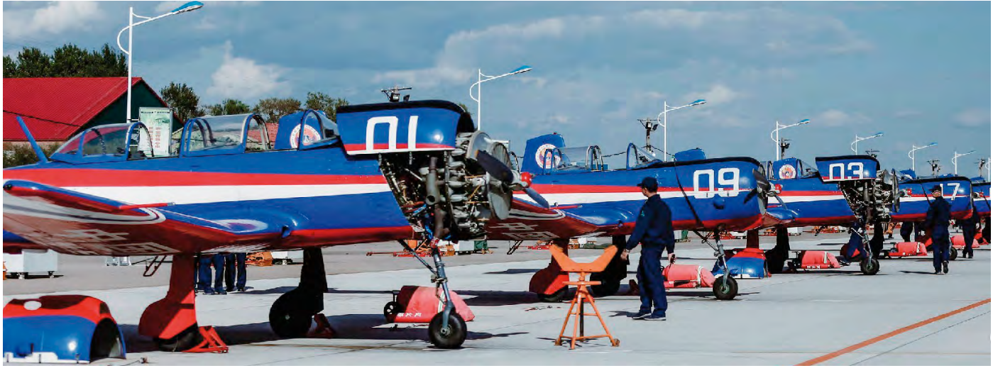
The PLAAF Sky Wing Aerial Demonstration Team performs yearly during the opening of the academic year at Changchun/Dafangshen that is near to their home base. Photographs of their aircraft provide us with some construction numbers. (Changchun/Datun, 16 December 2016)