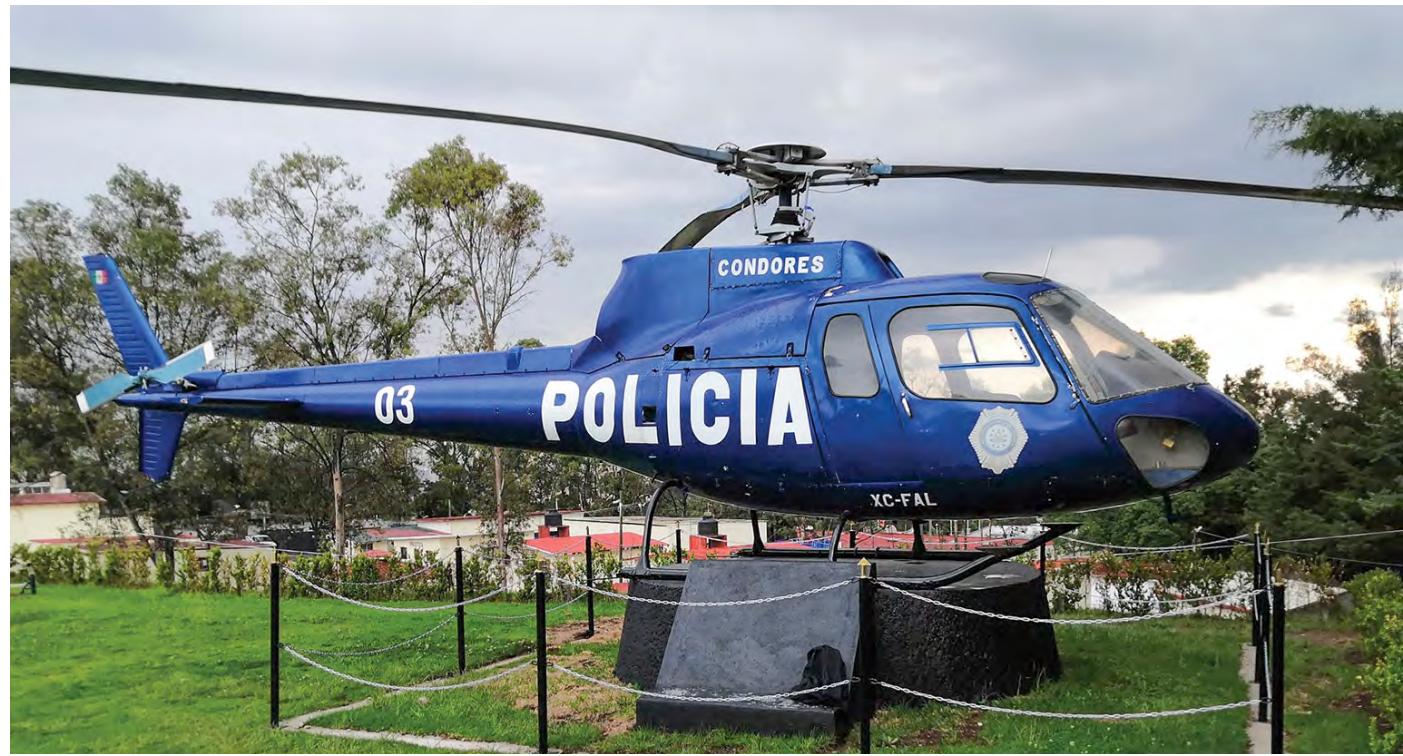
The police aviation unit of the capital district Mexico City (CDMX) is named Condores. One of their AS350s has found a resting place at the Instituto Desierto de los Leones, a police training centre. (XC-FAL/03, AS350B, 20 September 2019, Abi Sanchez)

See news section Morocco about the order for two former USAF C-130H Hercules transport aircraft.