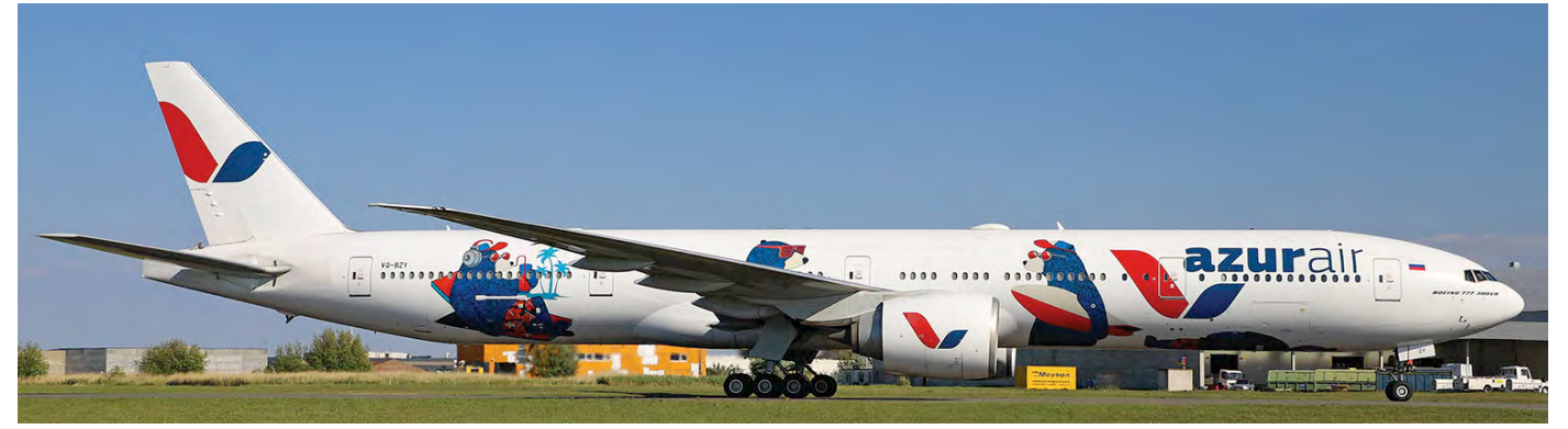
Delivered to Emirates as A6-EBD this Boeing was added to the fleet of VIM Airlines in 2017 as VP-BIN. Six months after that airlines ceased operating the B777 was acquired by Azur Air. VQ-BZY was the first Boeing 777 being added to the fleet and is painted in the so-called 'Azur Bear' livery.