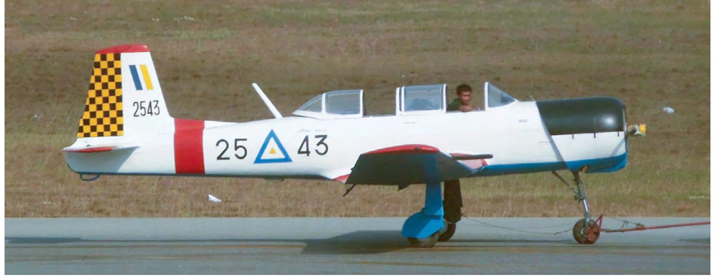
Arguably the most attractive looking PT-6s are the ones used by Myanmar. They do operate at least 50, uncertain since when. All we know is that they received a batch of 20 new aircraft in 2008. Seen in this unique albeit a bit hazy shot is 2543. (Yangon Intl, 1 April 2017, Adam Coppin)

We suspect this means there are/were actually fifty aircraft, registered 2501 to 2550.