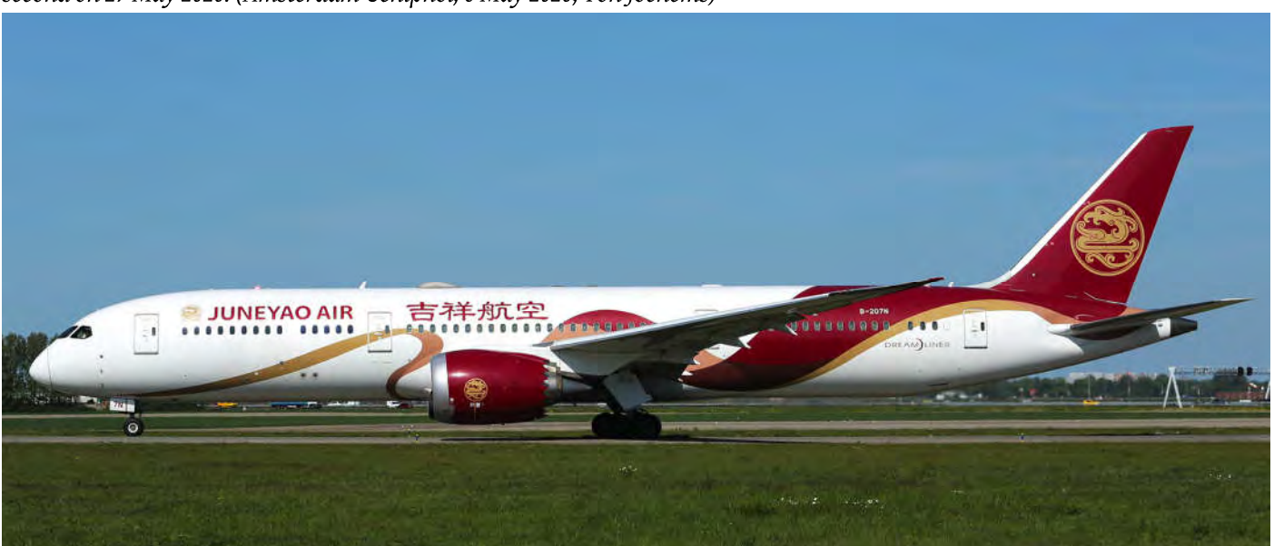
Juneyao Air flew lot of cargo flights with their Boeing 787 Dreamliners. B-207N, in a special Chinese Silk Ribbon colour scheme, showed up for the first time on 6 May. (Amsterdam-Schiphol, 6 May 2020,)