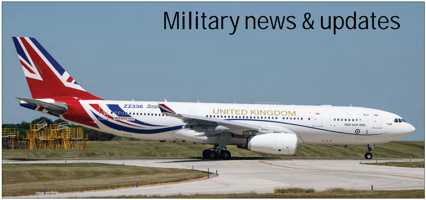
Voyager KC1 ZZ336 in its new 'Union Jack' inspired livery, taxiing at Cambridge airport for its delivery flight to RAF Brize Norton. Its departure was covered live by major news channels, probably to boost morale in these difficult times. (25 June 2020, Martin Fox)

Because of our standardization we sometimes use type, unit and serial presentations that may strongly differ from those used by the manufacturer or user. It is therefore possible that the information sent by you can deviate from the information we publish.