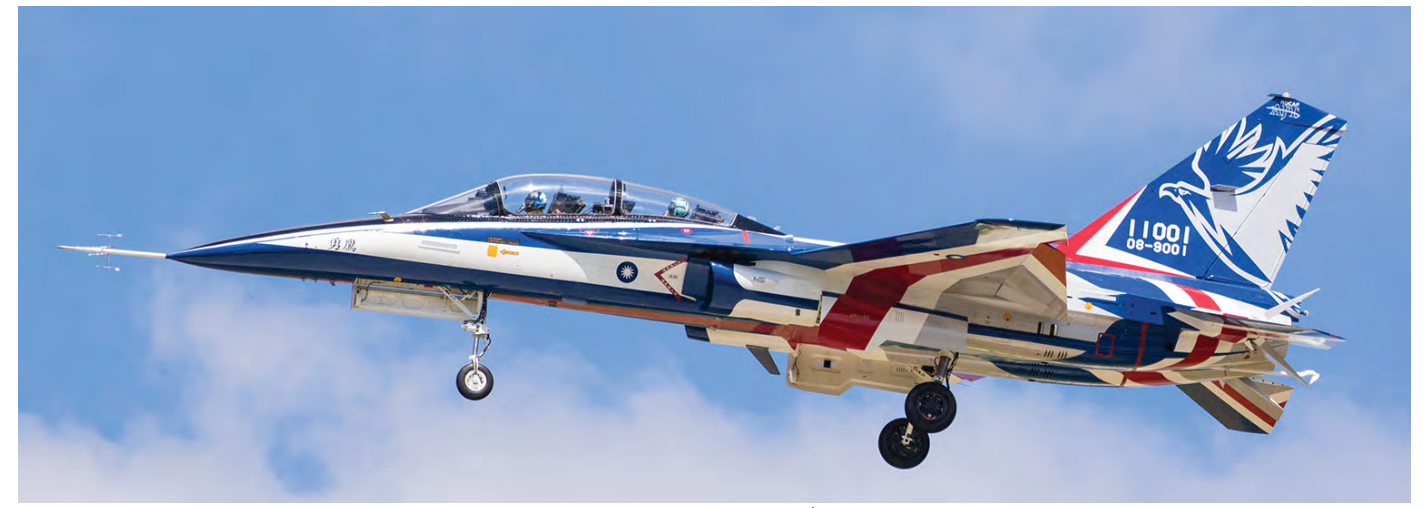
This is Taiwan's new advanced jet trainer, the AIDC AT-5 Yung Yin serial 11001/08-9001. It performed its maiden flight on 10 June 2020 and is set to replace the aging AT-3s. The factory plans to deliver 66 AT-5s to the Air Force. (16 June 2020, Ching Chuan Kang Air Base, Tsungfang Tsai)

for a number of years. The previous 0001 is a Fokker-Fairchild FH-227E which was delivered in December 1977. The aircraft is preserved at the Defence Services Museum at Naypyidaw since February 2016.