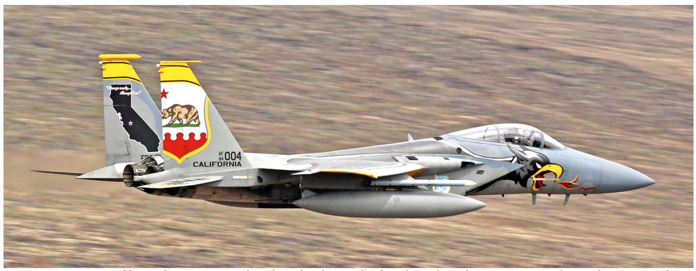
F-15C 84-0004 is operated by 194th FS, CA ANG and is adorned with special tail markings for 75th years existance of its mother wing, 144th FW. It ads to make this photograph all the more stunning... (Death Valley, 19 March 2019,)

Fairchild AFB (WA) was approved to become the new home for a dozen additional Boeing KC-135R Stratotankers that will begin arriving from McConnell AFB (KS) during fiscal year 2020. Because of the upcoming deliveries of the new Boeing KC-46A Pegasus tankers, it is expected that more Stratotankers will move to other USAF units. It was stated that following completion of thorough strategic basing and environmental analysis, Fairchild was selected because of its strategic location, high air refueling mission demand, and lower construction and renovation costs. As a first measure, the 97th ARS will be reactivated. Having been an inactive unit since 30 September 2004, the 97th ARS will be assigned to the 92nd Air Refueling Wing at Fairchild. At this moment Fairchild is already home to three KC-135 squadrons, 92nd ARS/92nd ARW, 93rd ARS/92nd ARW and 116th ARS/141st ARW (Air National Guard).