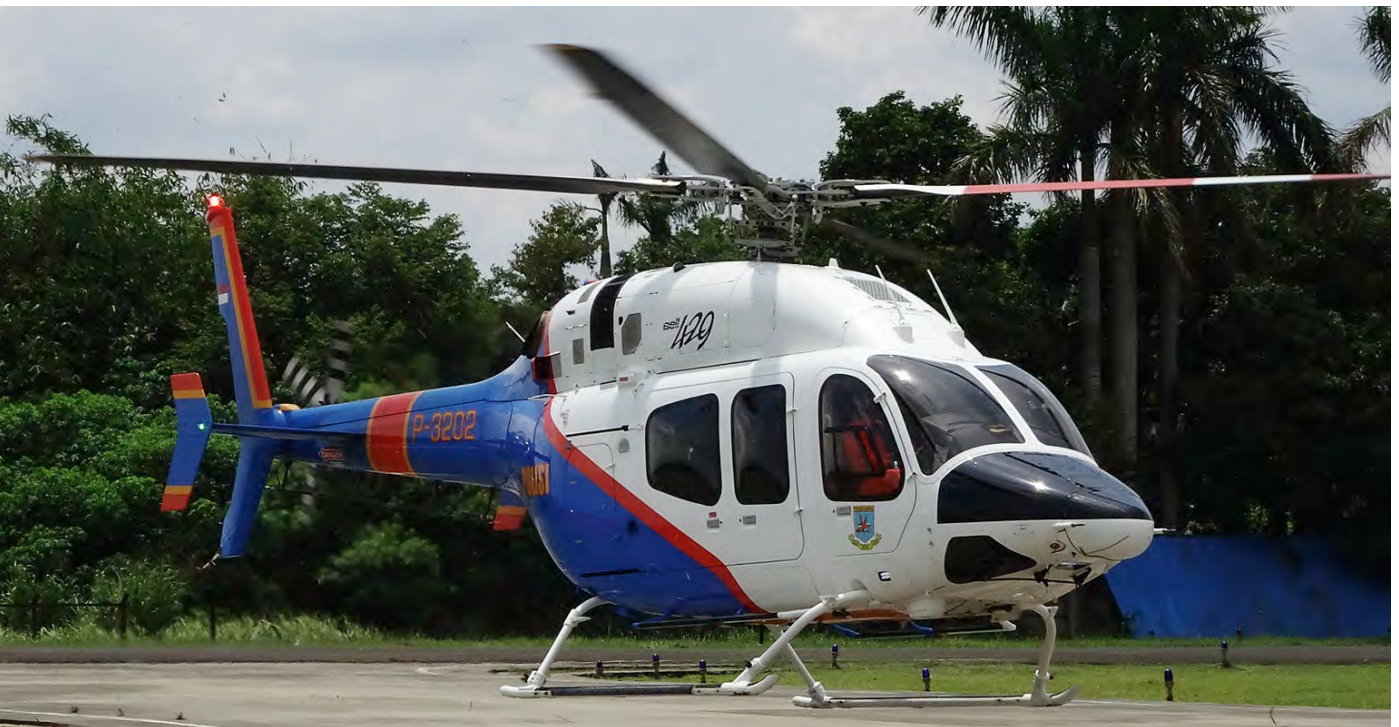
We seldom receive photographs of the Indonesian Police. They have received some new aircraft over the past years, like this Bell 429 P-3602 that was taken up on 5 December 2017. (Pondok Cabe, 6 December 2018)