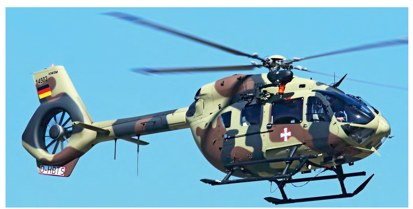
The future Serbian H145M 14502/D-HBTS (20236) is seen on a training flight at Manching-Ingolstadt. (24 April 2019)

crashed airplane than on 402. So for us it was not proof that is was 402 that crashed.