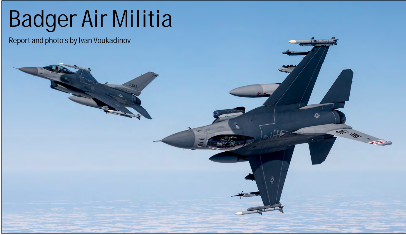
Two F-16s of the 115th Fighter Wing, 176th Fighter Squadron of the Badger Air Militia display their manoeuvrability high over Wisconsin.