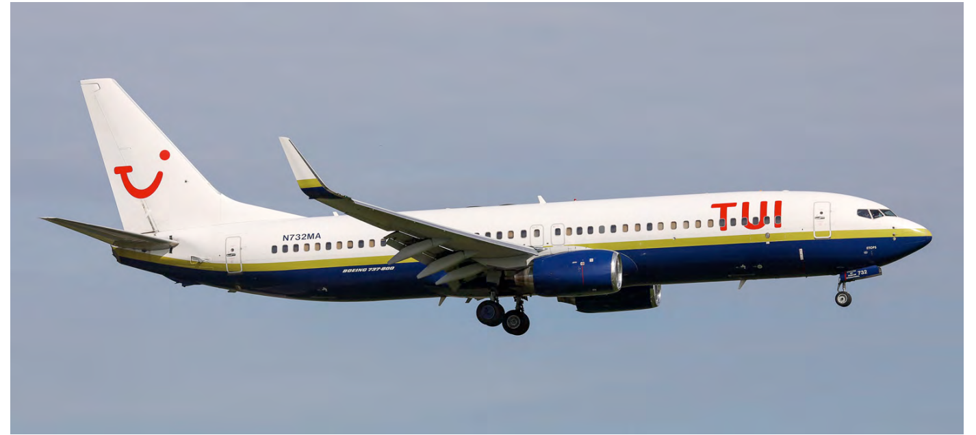
Jacksonville Naval Air Station's runway 10 with a lenght of 9,003ft was not enough for the Miami Air International Boeing 737 N732MA to come to a normal stop on the asphalt, on 3 May 2019. For Schiphol based spotters it is a familiar airframe as it has been used in the past to operate for TUI during the busy summer schedule. (Amsterdam-Schiphol, 4 July 2017, B.J. Floor)

<u>Credits</u>: ASN, Aviation Herald, B3A, JACDEC, Leo Hoogerbrugge, AINonline, morgenpost.de, aerotelegraph.com