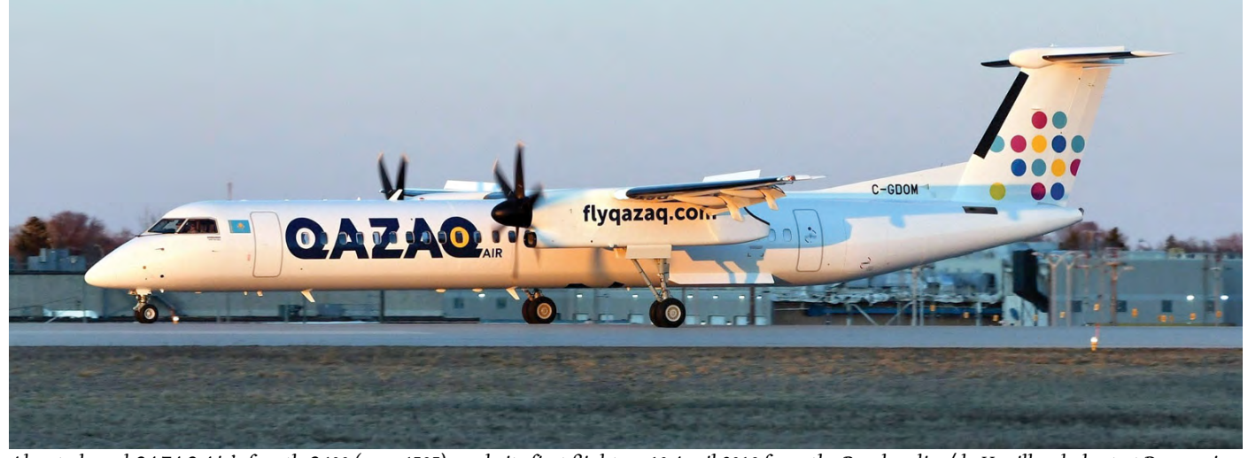
Almaty based QAZAQ Air's fourth Q400 (msn 4595) made its first flight on 10 April 2019 from the Bombardier/de Havilland plant at Downsview in Toronto (Ont.), using Canadian test registration C-GDOM. It was delivered to Kazakhstan as P4-FLY on 23 April. (Toronto-Downsview (Ont.), 15 April 2019, Frederick L. Larkin)