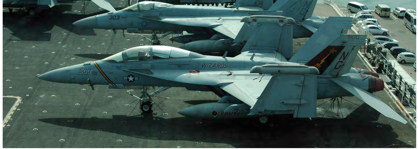
Electronic attack capability is provided by the EA-18G Growlers from VAQ-133 "Wizards". Seen here is CAG-bird 168376/NG-500.