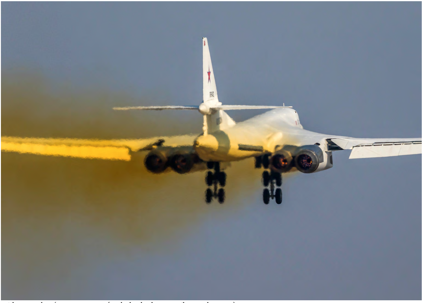
Without words.... (Tu-160, RF-94112/04rd, Shaykovka, 22 April 2019, Alex Snow)