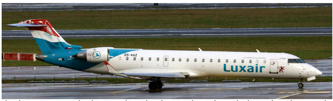
This Adria Airways CRJ701ER is leased to Luxair and is mainly used to operate the route from Saarbrücken to Berlin Tegel in a partnership between Saarbrücken Airport and Luxair. S5-AAZ was caught on camera while it operated the regular Adria Airways Ljubljana to Brussels service. (Brussels, 11 March 2019,)