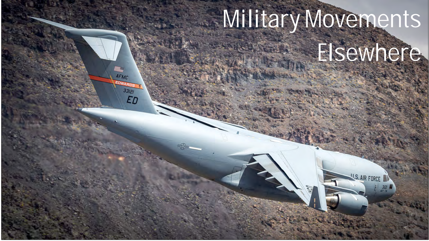
The low level flying area in Nevada features various stunning images of USAF, US Navy and US Marines fighters are most known to the general public. Keith Meachem visited the Death Valley area on 30 April 2019 and saw this Edwards 418th Flight Test Squadron C-17A 03-3121 passing through the Sidewinder Trail.