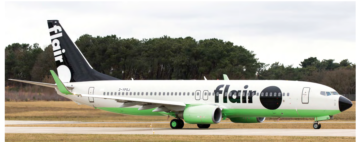
This Boeing 737 was another victim of the demise of Primera Air Scandinavia. It was reregistered from OY-PSJ to 2-YPSJ in February 2019 and as such it performed a test flight before being delivered to its new operator Flair Airlines. (Woensdrecht, 1 March 2019,)