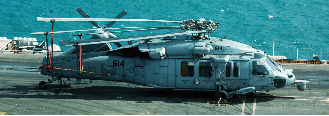
MH-60S 168553/NG-614 is part of the helicopter complement of CVW-9, operated by HSC-14 "Chargers". The other helicopter squadron embarked is HSM-71, which operates the MH-60R.

On board USS Mobile Bay were HSM-71 MH-60Rs 168133/702 and 167007/712 (not coded NG).