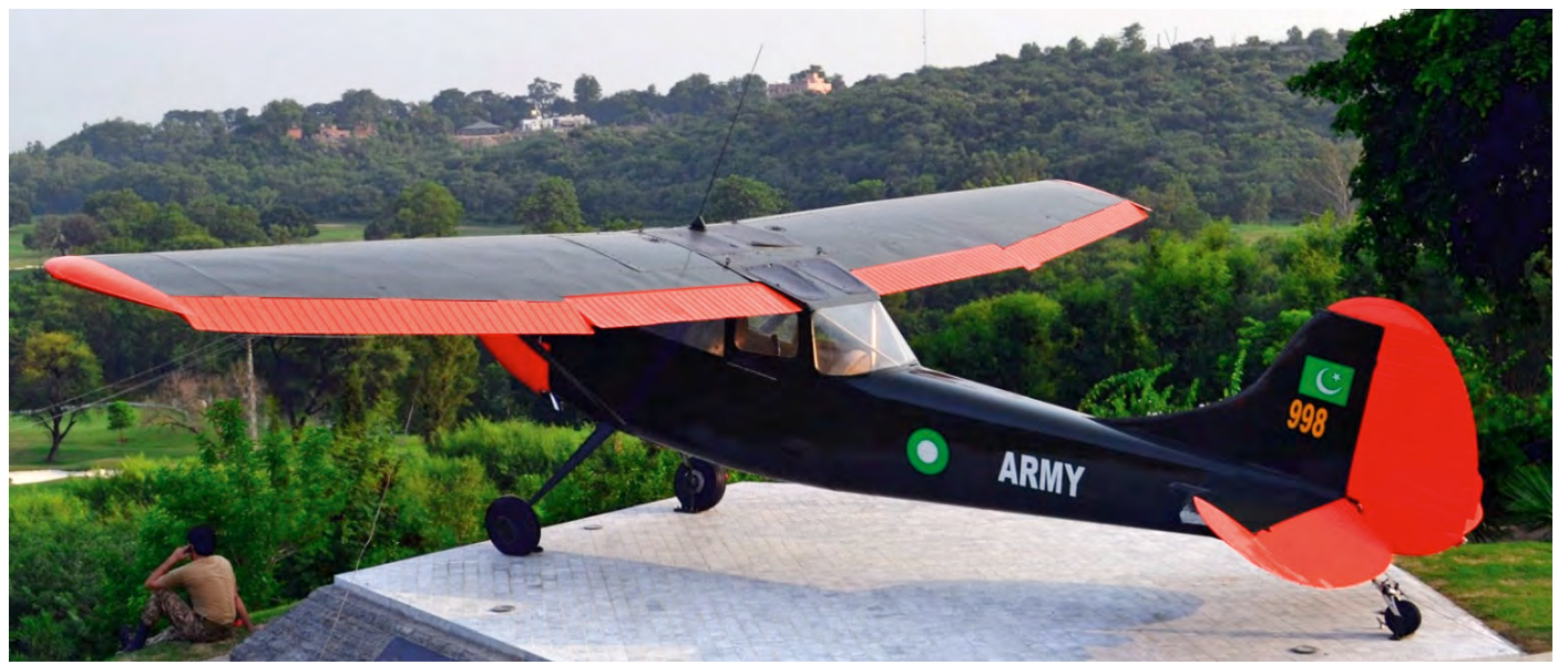
In Mangla Cantonment, Punjab, Pakistan, this fromer Army 0-1E (57-5)998 overlooks the Golf Course, (March 2019, Kashif Suleman)

had this on its tail and 50 years markings on its nose. That one used to be preserved at a gate to the South base housing area. It had disappeared by January 2018 but did not move to the memorial opposite the main gate to join 7637 there; that was an FT-6, refer below. Meanwhile, another one appeared at a spot deeper into the South base housing area also marked '623', at 30.23133°, 66.93518°. As a side note, there are/were three known PAF F-6s with serials ending in 623. These are 1623 that was written off 23 May 1981, 7623 that could be/likely is one of the above, and 9623 that was still preserved in Karachi January 2019.