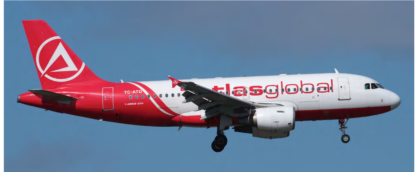
In November 1999 this Airbus was delivered to SABENA as OO-SSE. After it was withdrawn from use the airbus went on to serve with Khalifa Airways, National Air Services and Royal Falcon Airlines before it was added to the AtlasGlobal fleet in April 2015. (Amsterdam - Schiphol, 31 March 2019)