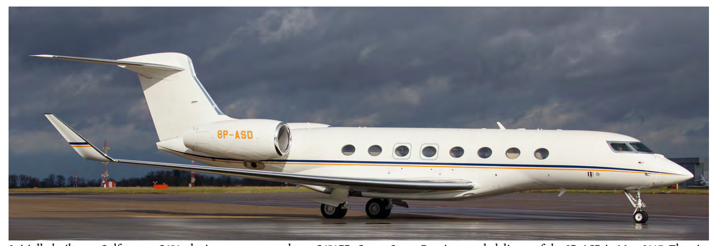
Initially built as a Gulfstream G650 the jet was converted to a G650ER. Grupo Santo Domingo took delivery of the 8P-ASD in May 2017. The aircraft was one of the visitors of the annual TEFAF this year. (Maastricht - Aachen, 14 March 2019,)