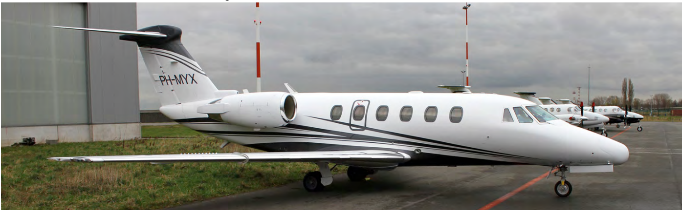
Aquired by Solid-aiR in 2008, this Cessna 650 was subsequently operated by Fleet Lease and ended up with ASL in 2012. PH-MYX has recently traded in its old orange colours for these new colours. (Antwerp, 1 March 2019, Walter Van Brempt)