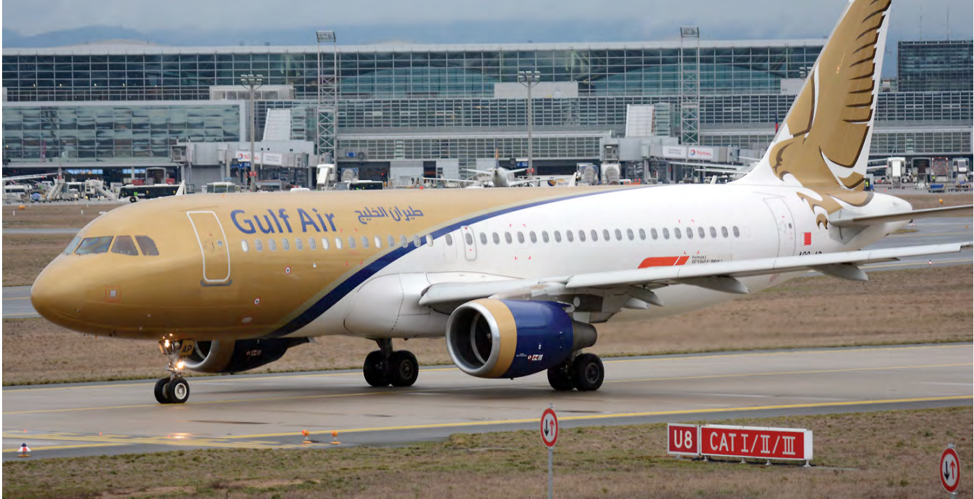
To spot Airbus A320s of Bahraini state carrier Gulf Air in Western Europe you can try it in Paris, Athens and Frankfurt. At the last airport Raymond van Dijkhuizen made this picture of A9C-AP on 27 January 2019.