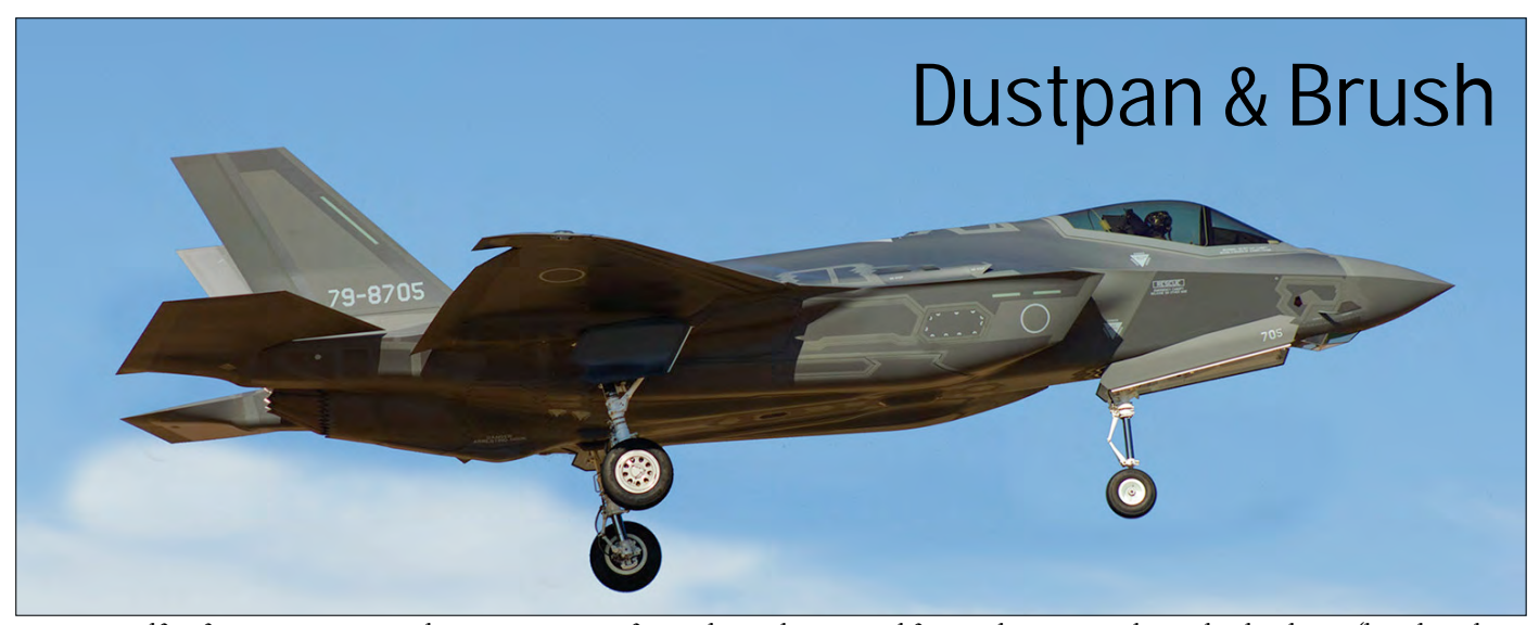
Japan Air Self-Defense Force F-35A Lightning II, 79-8705 of 302 Hikotai, disappeared from radar at around 19:30 hrs local time (less than thirty minutes after getting airborne) on 9 April 2019, 135 kilometres east of Misawa AB, and crashed into the Pacific Ocean. (Luke AFB (AZ), 22 January 2018, Thomas Backus)