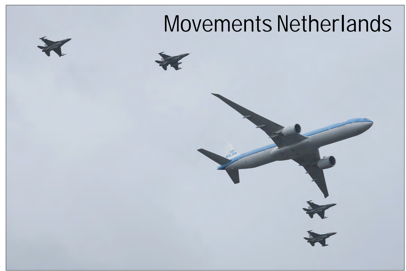
The Dutch Air and Space Center (NLR), KLM and GKN Fokker are celebrating 100 years in existence this year. The centenary was kicked off on the day this photo was taken. Part of the celebrations was a fly by of KLM Boeing 777 PH-BVG accompanied by four Dutch Air Force F16s (J-066, J-144, J-515 and J-616) flying over the center of Amsterdam. (Amsterdam, 14 March 2019,)