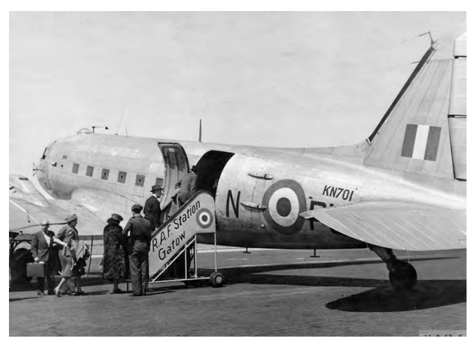
RAF Dakota KN701 based at RAF Gatow, was one of the aircraft that was used to transport German civilians in and out of Berlin

Plans to introduce a new currency (the Deutsche Mark) were something to which the Soviets were strongly opposed. But in June, the Western Allies continued their plans to do so, and as a reaction, the Soviets blocked all canals, motorways and railways leading to West Berlin as from 24 June 1948. It was one of the first major international crises of the Cold War. Within two days the first activities were there to support the two million people of West Berlin by the only possible way left: through the air! To work out this plan, the U.S. general in charge of the U.S. Occupation Zone in Germany, General Lucius D. Clay contacted his colleague, General Curtis LeMay