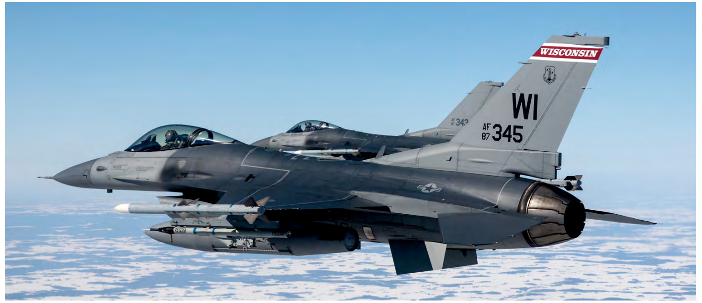
The 176th FS is using the following F-16Cs according to the Scramble database, all except a few "WI" coded: 86-0243, 86-0302, 86-0317, 87-0234, 87-0252, 87-0258/-, 87-0260, 87-0261/-, 87-0262/-, 87-0266, 87-0275, 87-0278/-, 87-0280, 87-0288, 87-0294, 87-0298, 87-0300, 87-0343, 87-0345, 87-0346, 87-0348/-, 87-0349/- and F-16D 88-0150/WI.