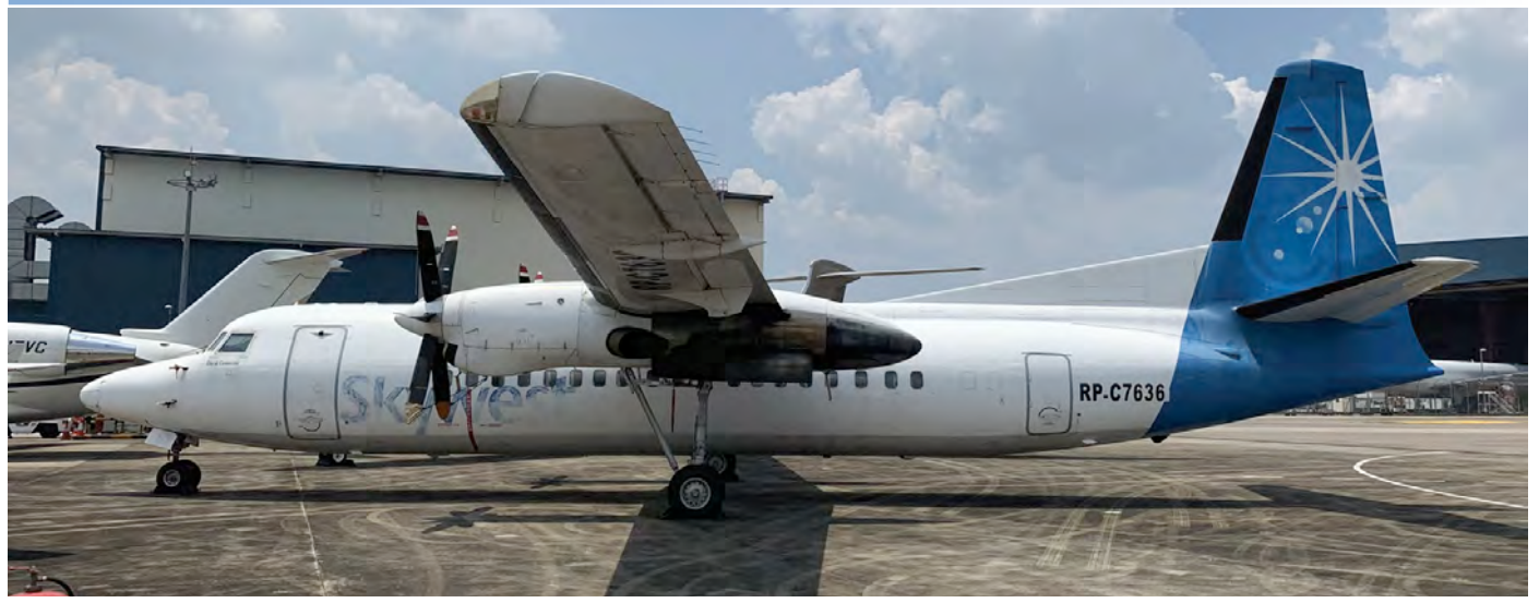
Philippine airline LEASCOR (Leading Edge Air Services Corporation) is busy buying Fokker 50s! They own six Fokkers, acquired from airlines around the globe. RP-C7636's (msn 20113, ex VH-FNH) former operator is not hard to guess, as it still sports the basic colours of Australian operator SkyWest Airlines (although it was operating for Virgin Australia Regional Airlines, it never got repainted however). The Fifty was flown to Clark International Airport, Philippines on 15 April. (Singapore-Seletar, 23 March 2019, Fred Crampton)