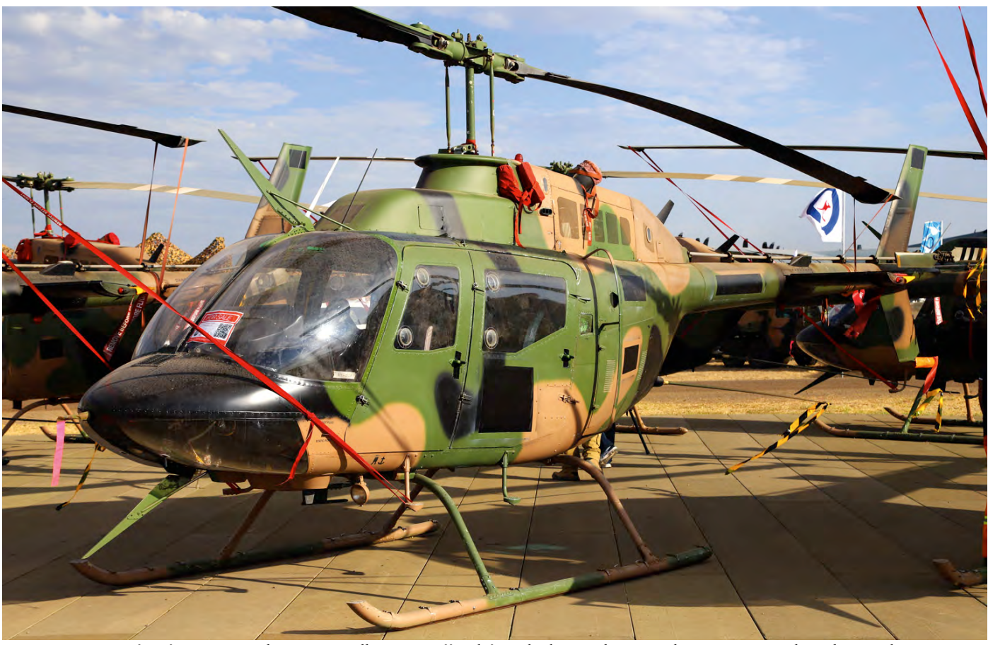
A17-025 was one of 22 former Australian Army Bell 206B-1s offered for sale during the Australian International Airshow and Aerospace & Defence Exposition at Avalon earlier this year. (Avalon, 28 February 2019,)