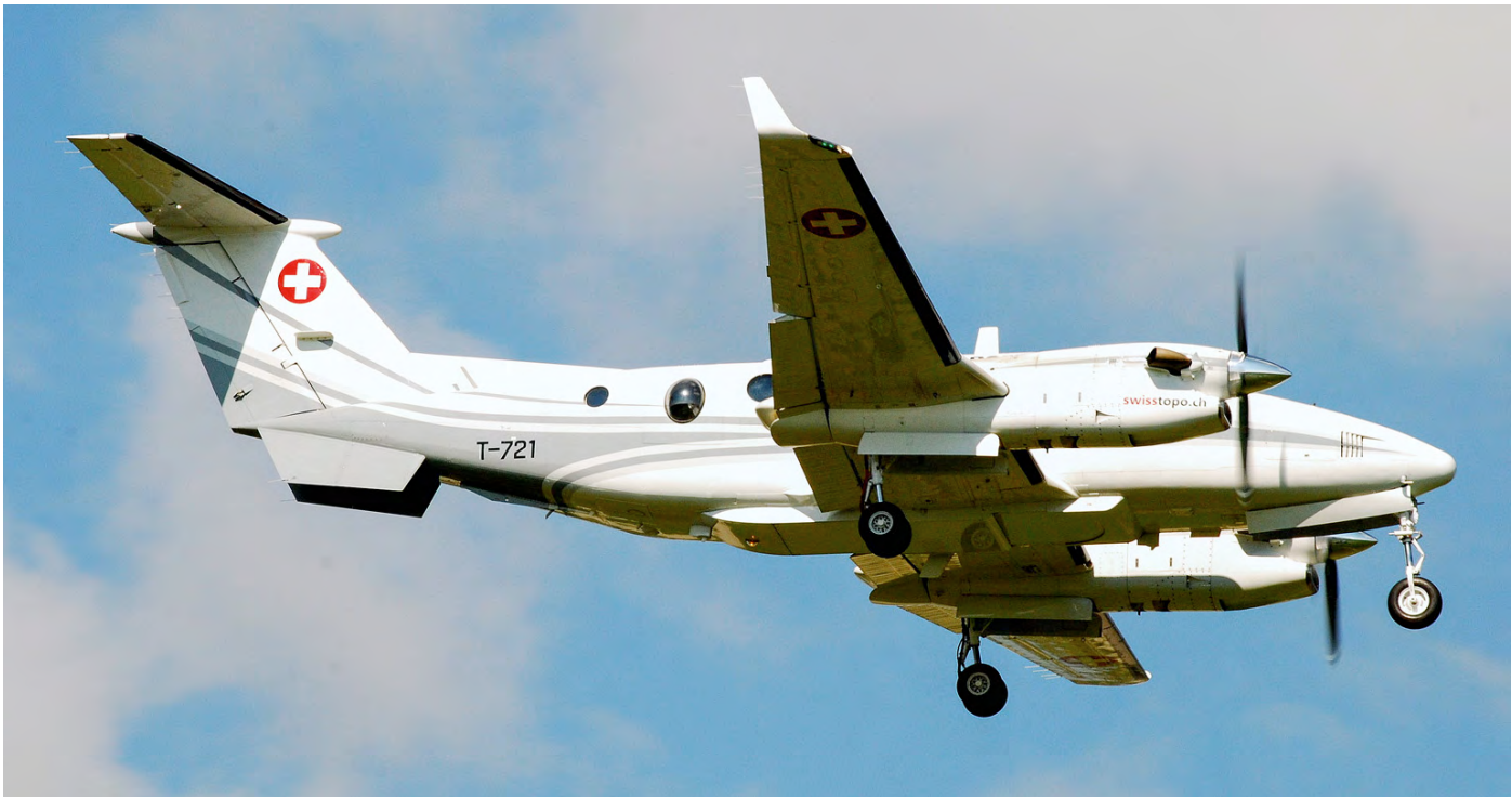
Swiss Beech 350 T-721 might have seen its last visit to the Netherlands as it will be replaced by two second hand Cl-604s (Leeuwarden, 9 April 2019)