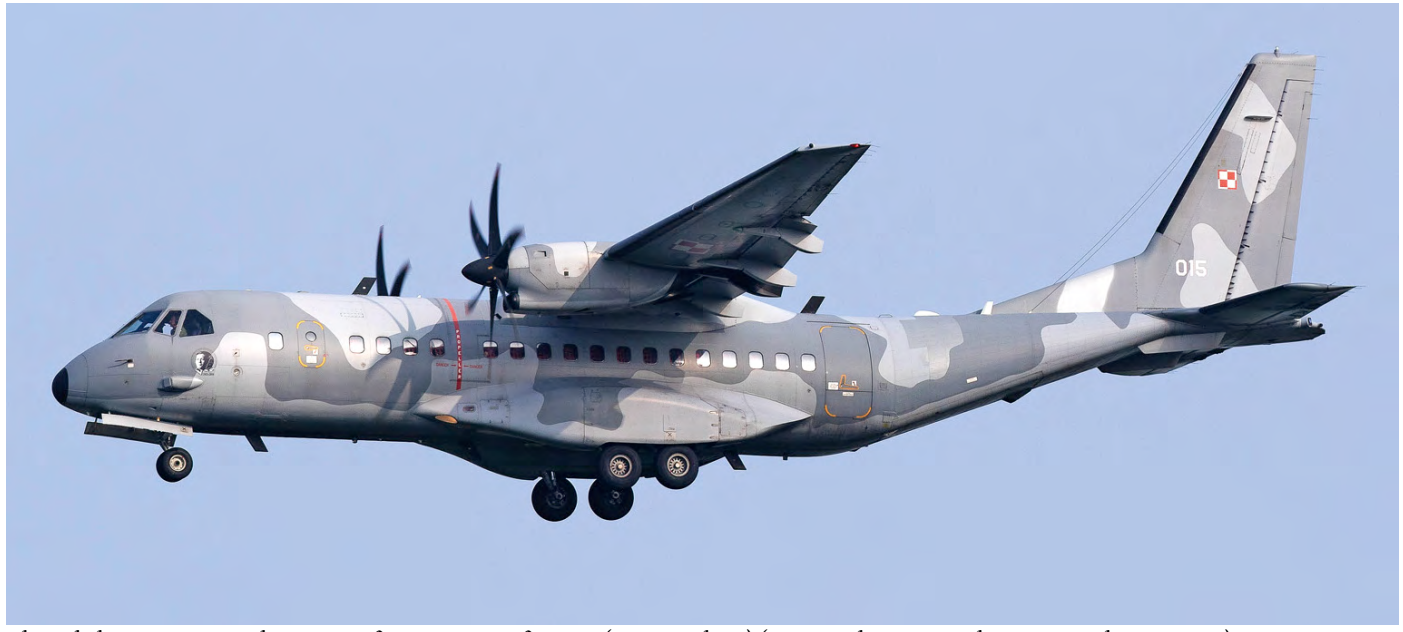
The Polish F-16s came with support of a C295M 015 of 8.BLTr (among others) (Leeuwarden, 29 March 2019, Manolito Jaarsma)