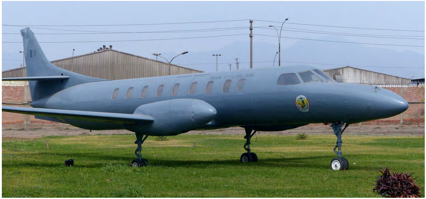
Thanks to our friends of Aeroprints.com we can present you this photograph of preserved C-26 serial 341. After serving as spares source for the three C-26s that are still active, it now rests on the lawn of Grupo 8. (Lima-Callao, 6 November 2018,)