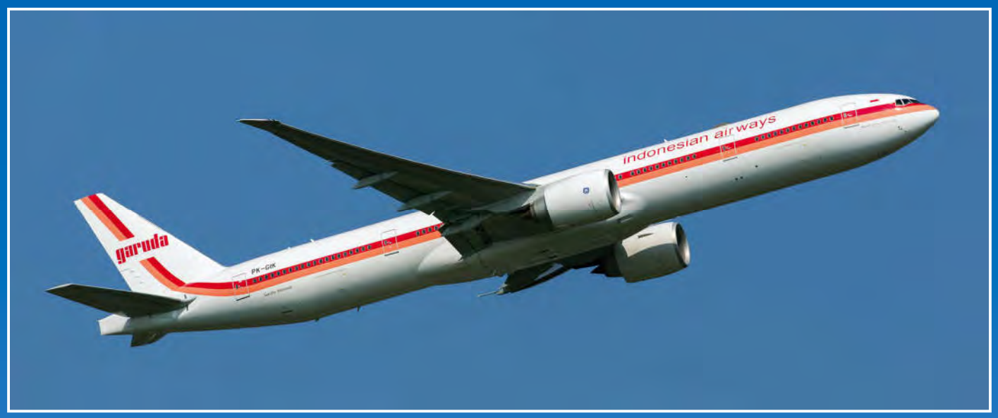
Garuda Indonesia took delivery of PK-GIK in January 2016. Since February 2019 this Boeing 777 is operating in these retro colours. (Amsterdam-Schiphol, 14 April 2019,)