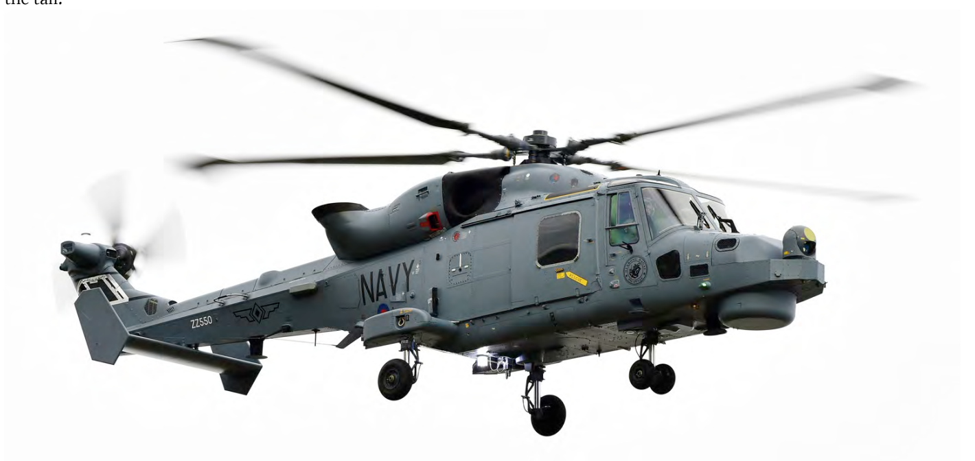
AW159 Wildcat 200 ZZ550 for the Philippino Navy was seen at RAF Shawbury on 21 March 2019 as 'Westland4'. (Taff Evans)

The Airbus VIP fleet in Thailand is still expanding. The surprising element this time is that the aircraft on order is an Airbus version that is already operating within the RTAF, being the Corporate Jet version of the A320. With the air force operating Airbus aircraft and the Royal Palace operating B737s it still remains to be seen where this aircraft will be used.