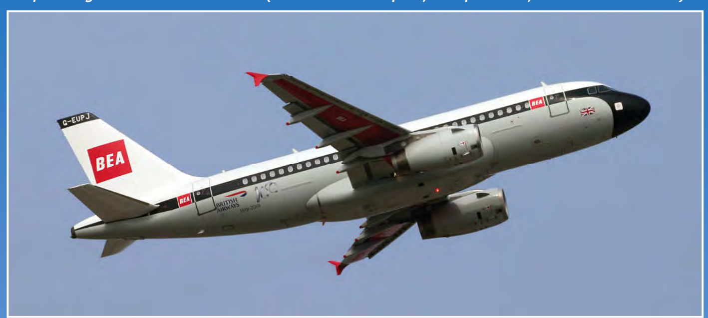
Due to 100 year British Airways four aircrafts are painted in retro colour scheme. Three Boeing 747s and an Airbus A319. G-EUPJ wearing the colours of British European Airways which flew from 1959 till 1968 in these colours. (London-Gatwick, 17 April 2019, Duncan Morley)