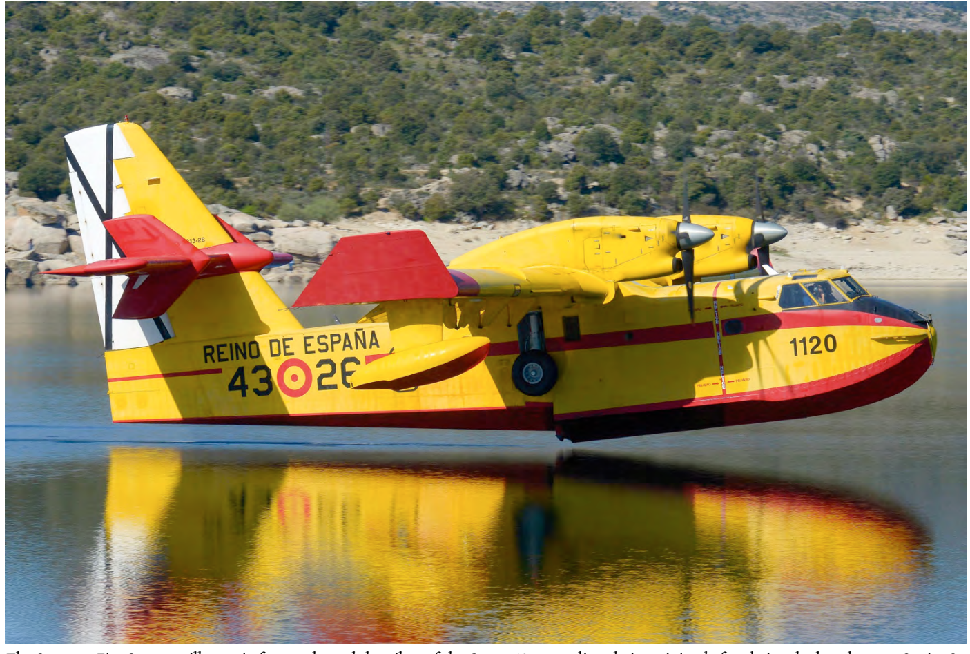
The Summer Fire Season will start in few weeks and the pilots of the Grupo 43 are ending their training before being deployed across Spain. On 29 April 2019 Paco Rivas visited the El Atazar Reservoir, north of Madrid and captured CL-415 UD.13-26 during its training flights.