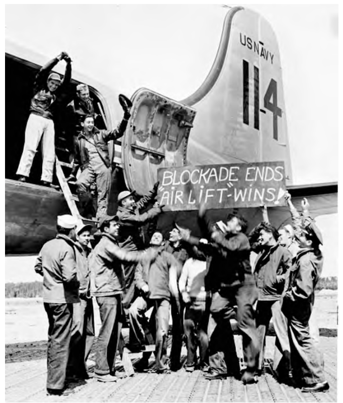
Happy crewmembers celebrate the end of the Airlift in front of U.S.Navy R5D-2 BuNo 39114

and C-54s together flew over 92 million miles in the process, almost the distance from Earth to the Sun. At the height of the Airlift, one plane reached West Berlin every thirty seconds.