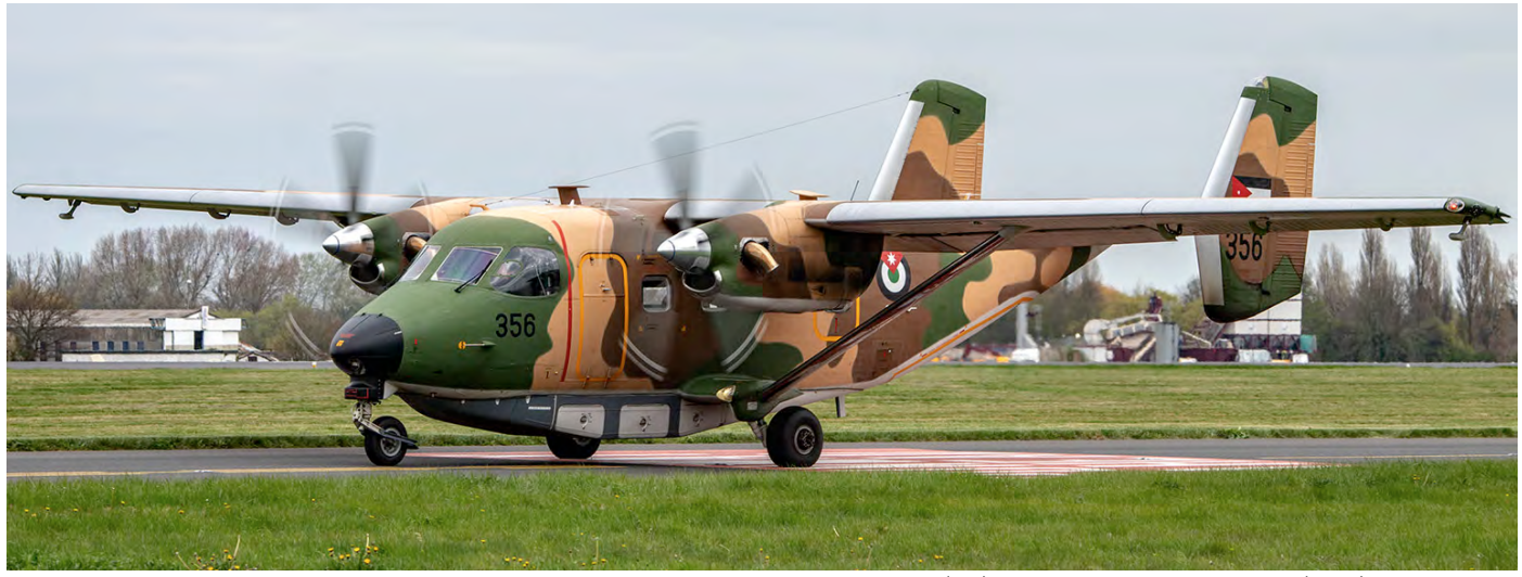
Westleigh Bushell photographed a rare and beautifull camouflaged aircraft at Southend (UK). A Royal Jordanian Air Force (RJAF) M28 Skytruck arrived at Southend from Prestwick (UK) and departed for a flight to Cannes (France) on 10 April 2019.

N507CS former RAF serial ZE704 model C2 N703CS former RAF serial ZE705 model C2 These two are configured for passenger and limited cargo