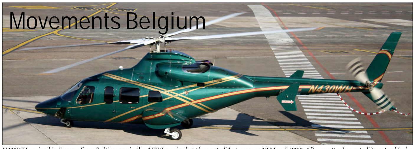
N430WH arrived in Europe from Baltimore via the AET Terminal at the port of Antwerp on 18 March 2019. After reattachment of its rotor blades it departed to Antwerp airport for fuel and than onwards to Bologna with a stop at Baden. (Antwerp, 22 March 2019, Walter Van Brempt)