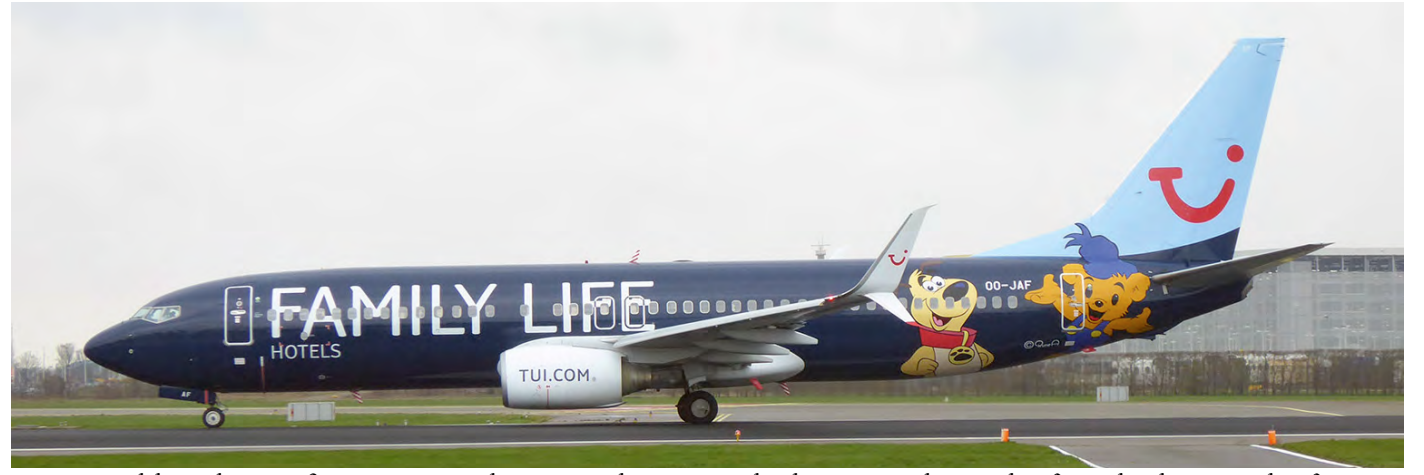
OO-JAF was delivered to Jetairfly in 2007. From February 2016 the Boeing 737 has been operated in Family Life Hotels colours. Family Life is a TUI Group hotel brand with a focus on children's activities and entertainment. (Amsterdam - Schiphol, 28 March 2019,)