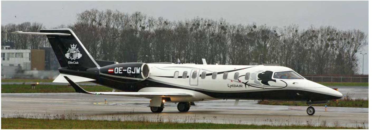
Although delivered to and operated by Avcon Jet this Learjet 75 carries LycoAir titles on its fuselage and Elite Club titles on its tail. LycoAir has its headoffice in Graz. Its bizjet fleet contains one Learjet 40XR and two Learjet 75s. (Maastricht - Aachen, 15 March 2019,)