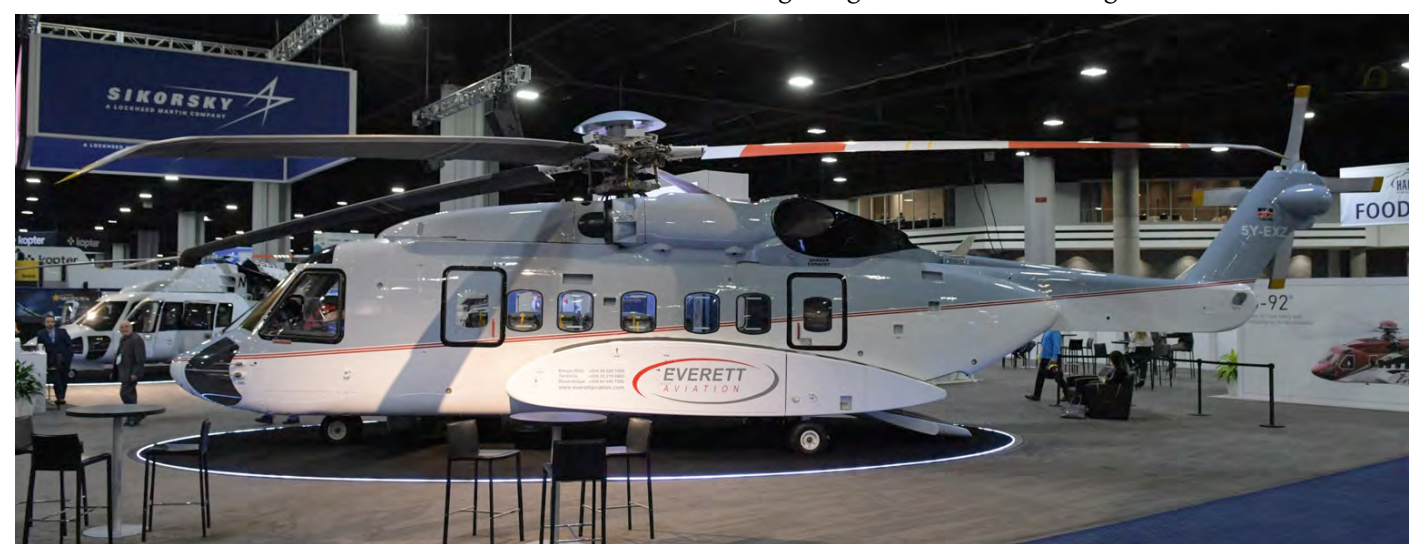
Lobo Leasing Limited signed a contract with Everett for a utility S-92A helicopter that will support oil and gas and utility operations. 5Y-EXZ will depart for Africa to conduct oil and gas and utility operations after the event has ended. It will initially be based at Everett's headquarters facility in Dar es Salaam, Tanzania. (Heli-Expo, 7 March 2019,)

Longstanding Airbus Helicopters customer Air Medical Group Holdings (AMGH) ordered 21 helicopters, a mix of single-engine H125s and twin-engine H135s.