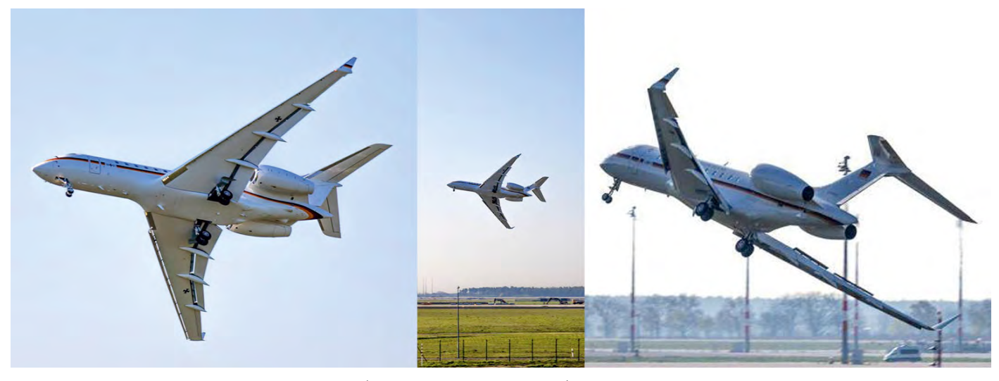
One of our top posts on Scramble Facebook News (over 213,000 people reached!) were pictures of Luftwaffe Global 5000, 14+01 of FBS BMVg, making a spectacular approach into Berlin-Schonefeld on 16 April 2019. It was performing a post-maintenance check flight en route to its base of Cologne when the pilots noticed something was not quite right. They wisely decided to return and Marcel Russ captured these amazing photos!

16apr19 CC-CYR BN-2B-27 A Britten-Norman Islander of <u>Archipiélagos Servicios Aéreos</u> crashed in a residential area of Puerto Montt, Chile, and burst into flames. The turboprop (with one pilot and five passengers, intending to fly to Chaiten Airport) impacted a house, 400 metres west of the runway at Puerto Montt-Marcel Marchant Airport, killing all on board. The house caught fire