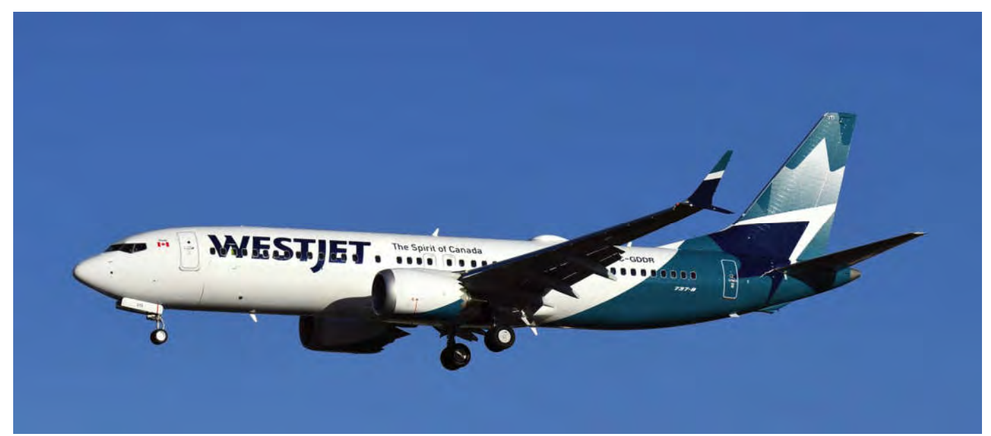
Since mid-March all Boeing 737 MAX are grounded after a second accident with this type. WestJet 737-8 C-GDDR was delivered at the end of January of this year but didn't fly to much. (Seattle-Boeing Field (WA), 21 January 2019,)