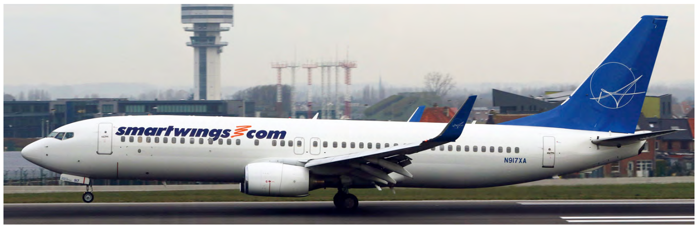
Also operating for SmartWings this summer is Boeing 737 N917XA. This aircraft did have SmartWings stickers attached prior arriving in Europe. (Brussels, 27 March 2019,)