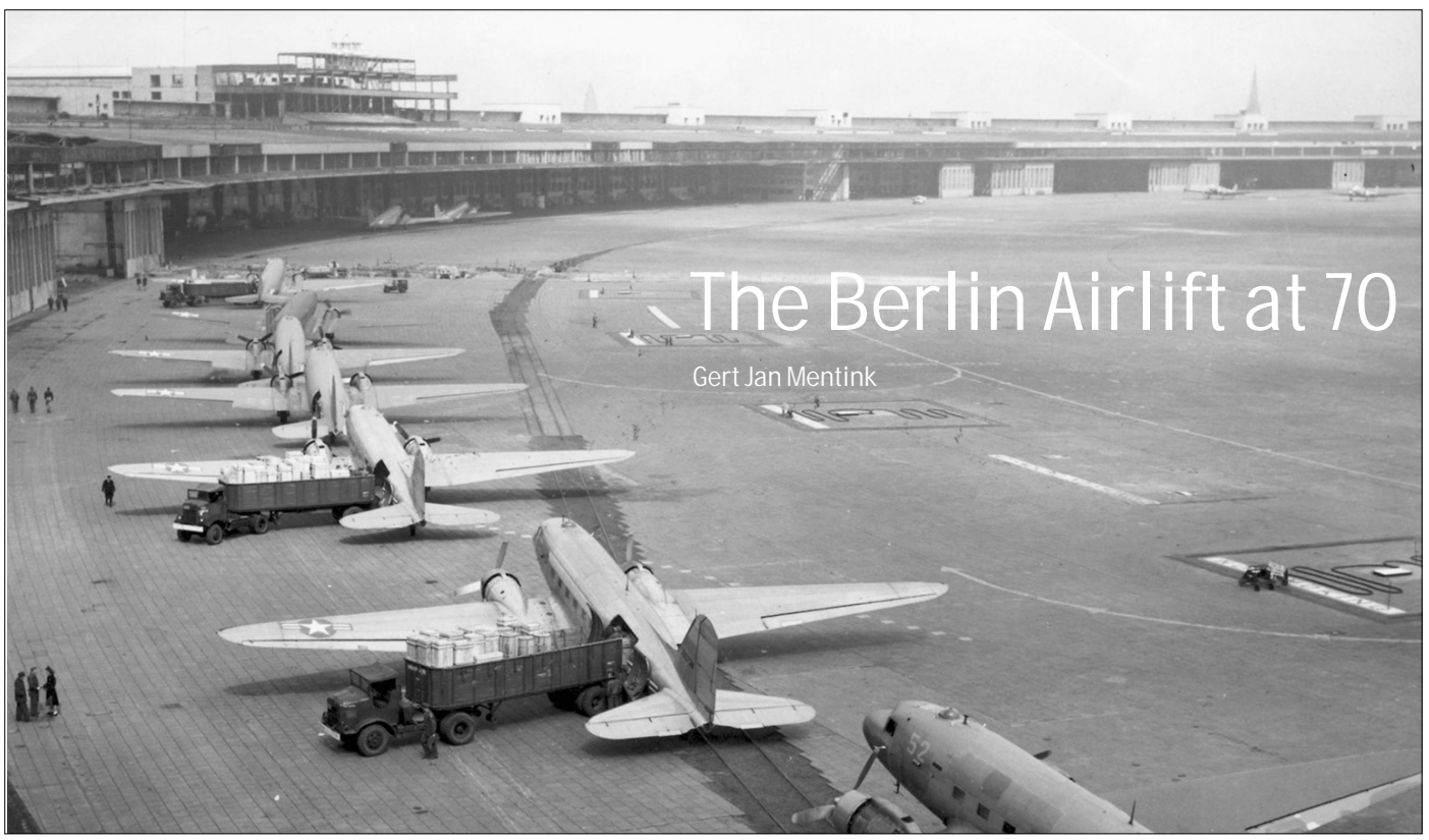
An image of Tempelhof airport with its typical horse-shoe shaped airport building. The scene obviously illustrates the early days of the Airlift in 1948, when most of the operated aircraft were C-47s. Only one C-54 Skymaster can be distinguished as no. 1 in the row