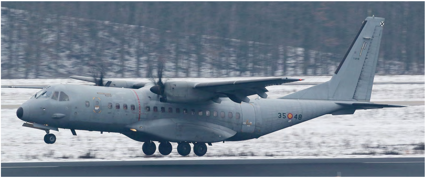
This Getafe based CASA C295M of the Ejército del Aire, T.21-10/35-48 of Ala 35, suffered a runway excursion at Santa Cilia De Jaca Airport on 3 April 2019. Michiel van Herten captured the transport aircraft in a nice winter scenery at Eindhoven on 1 February 2019.

O9apr19 79-8705 F-35A AX-05 w/o A Japan Air Self-Defense Force (JASDF) F-35A Lightning II disappeared from radar at around 19:30 hrs local time (less than thirty minutes after getting airborne), 135 kilometres east of Misawa AB, and crashed into the Pacific Ocean, at a point where it is 1,500m deep. The F-35A was one of a formation of four JASDF aircraft. According to the JASDF, the aircraft disappeared from the radar (in training situations, the