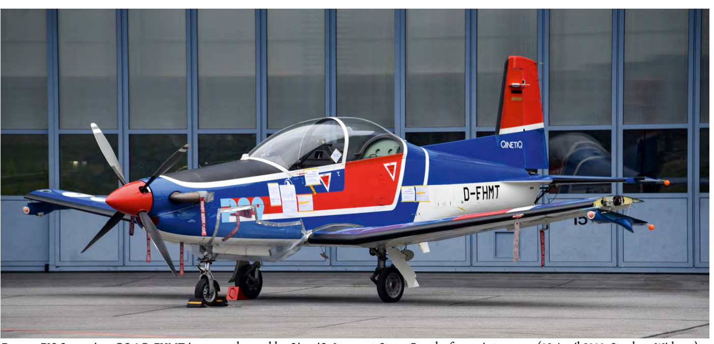
Former EIS Operations PC-9 D-FHMT is currently used by QinetiQ. It was at Stans-Buochs for maintenance. (12 April 2019, Stephan Widmer)

The French newspaper La Tribune reported in its e-mail issue on 25 April good news regarding the Rafale additional fighter deal, currently being negotiated between Egypt and France. The author of the article, Michel Capriol, quoted informed sources that the negotiations on twelve additional Rafale fighters are making significant progress after the United States recently approved the export of the US component of the SCALP-EG missiles to Egypt. The writer said that this step pleased the Egyptian Air Force Command, where Egypt would like to equip its Rafale fighters, including the ones of the additional deal, with SCALP-EG cruise missiles and Meteor missiles. But according to the sources of the French newspaper, it is still too early for the signing of the contract for the additional aircraft.