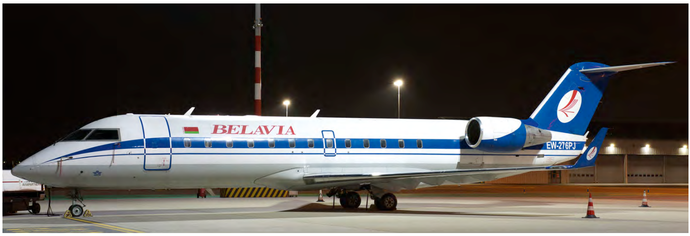
Belavia with Canadairjet equipment is rare in the Netherlands. EW-276PJ visited the low countries in relation to a football game. It was added to the Belarusian Airlines fleet in April 2009. (Rotterdam - The Hague, 20 March 2019,)