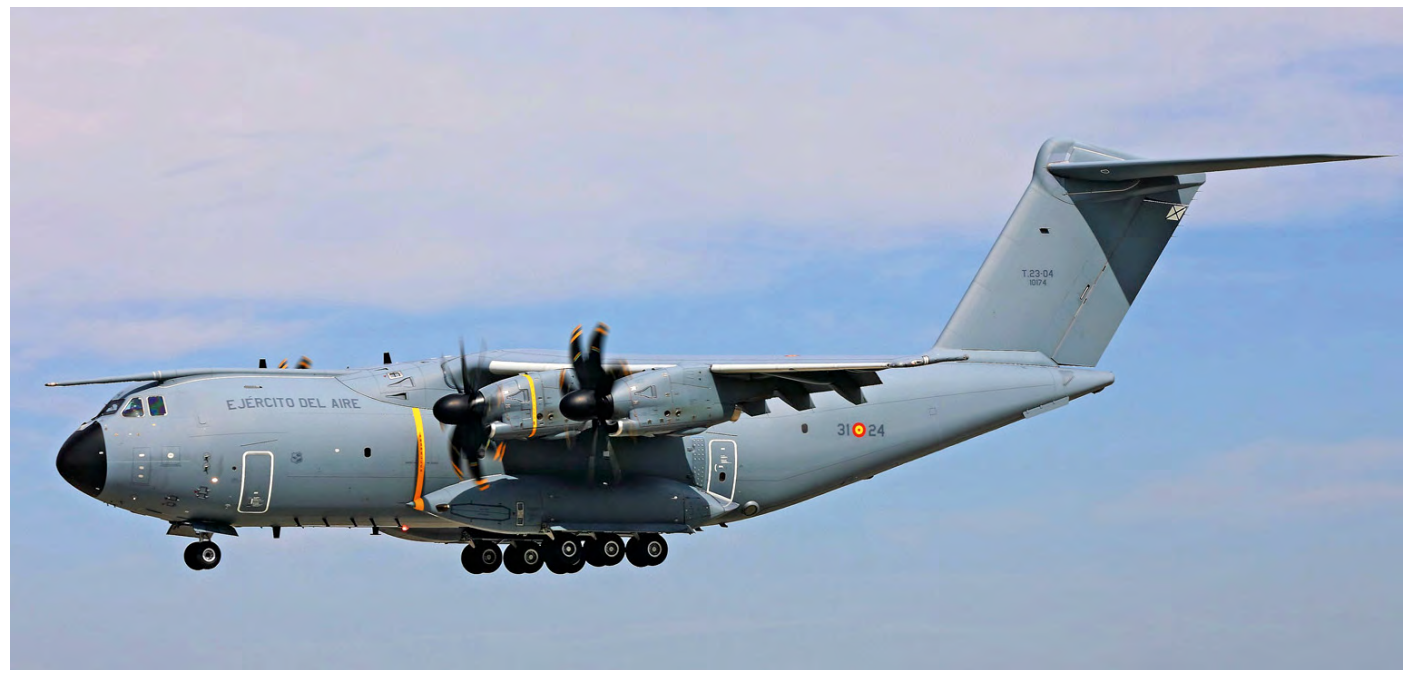
In Scramble 477 we showed you the second Spanish A400M, this time the third A400M makes its appearance.