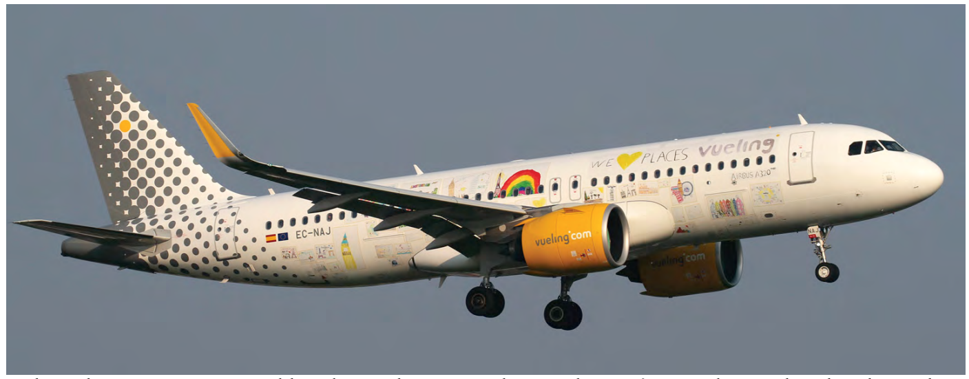
Vueling Airlines A320NEO EC-NAJ was delivered to Barcelona on 29 October 2018. The aircraft is painted in special "We love Places" colours. (Amsterdam-Schiphol, 7 April 2019, Robert Eikelenboom)