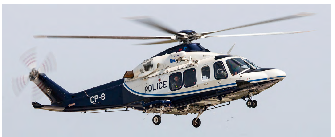
Cyprus Police Aviation Unit AW139 serial CP-8 was seen in the morning of 19 April 2019 arriving at Malta for scheduled maintenance with Gulf Med Helicopters. (Shaun Psaila)