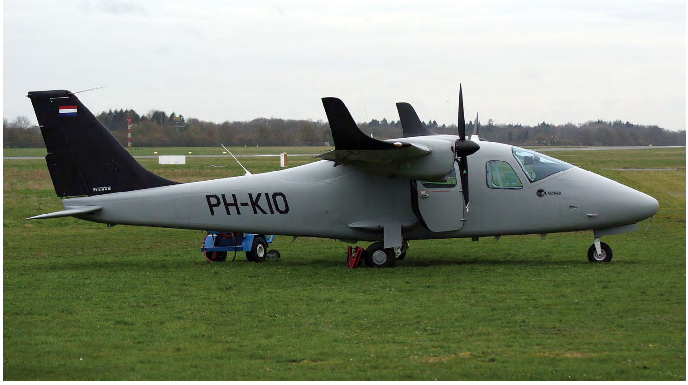
This Tecnam P2006T was registered in the Dutch register as PH-KIO on 27 February 2019. The aircraft is operated by Kavel 10 Aerial Surveys. (Groningen-Eelde, 26 March 2019,)