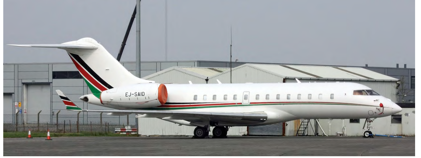
The newest addition to the GainJet Ireland fleet is this Global 5000 with msn 9486. It was delivered as T7-STK in March this year, but recently re-registered into the new style of Irish business aircraft EJ-SAID. It has not officially been entered into the Irish register. (Shannon, 11 April 2019,)