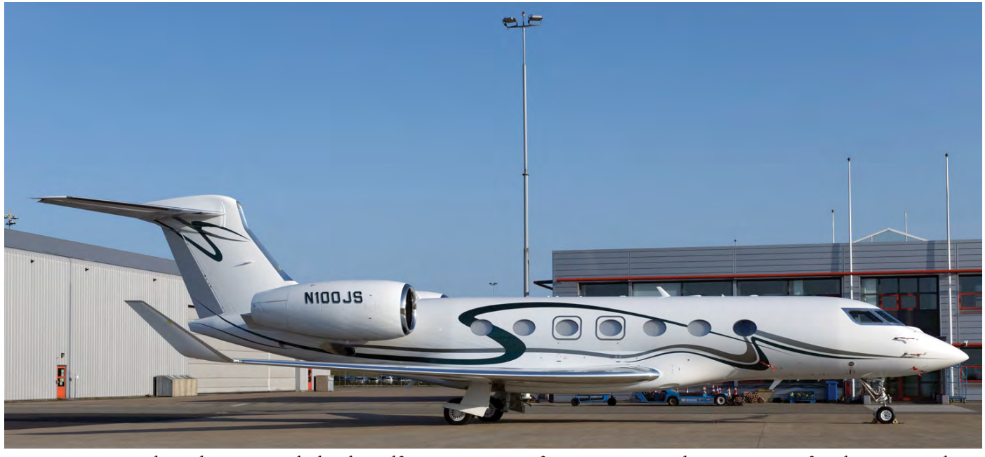
A very nice artistic colour scheme was applied to this Gulfstream 500 N100JS of JATO Aviation. Much more attractive for taking pictures than a thin cheatline only. (Rotterdam - The Hague, 22 March 2019, Frank de Koster)