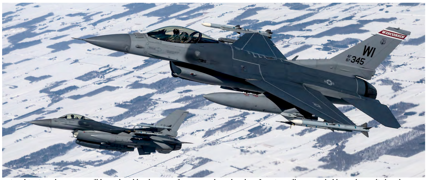
Enjoy this view, these F-16s will be replaced by the F-35A from 2023. The red Badger finstripe will most probably not be applied to the F-35A Lightning II.