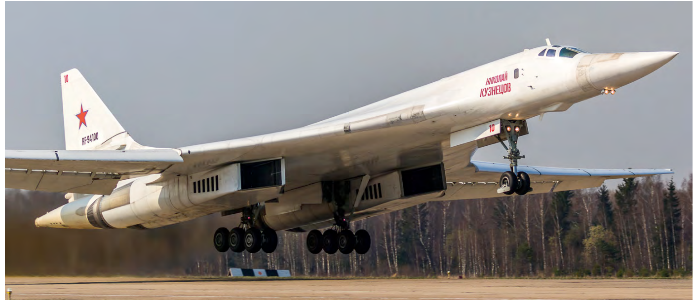
Like the opener of this section, this White Swan also participated in the dress rehearsal for the fly-by over Alabino, the actual Victory Day parade and subsequent rehearsal are over the Red Square in mosow of course. (RD-94100/10rd, Shaykovka, 22 April 2019,)

French news website La Tribune reported that Egypt officially notified France that it had chosen to award Leonardo the contract for the delivery of twenty AW149s for the Egyptian Navy as a ship-borne helicopter to be used in the new Mistral class assault ships. The French were hoping to sell them the NHIndustries NH90, but is seems they were way too expensive compared to the AW149. This news has not yet been confirmed by Leonardo.