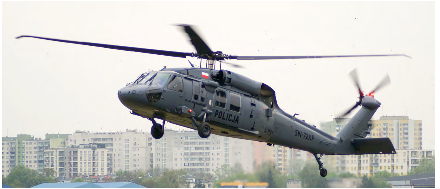
The Polish Police has taken delivery of its third S-70i Black Hawk on 26 April. (Warszawa/Babice, 27 April 2019)