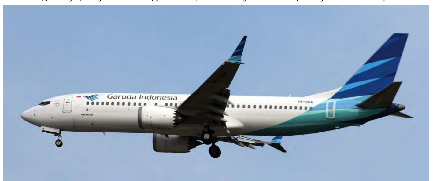
Garuda has ordered 50 MAX 8s. The first was delivered in December 2017. In between non where delivered and after the accidents they changed the order to MAX-10 and 787 Dreamliners. The sole 737-8 was seen at Singapore on 8 March 2019 by Jeep Stoker.