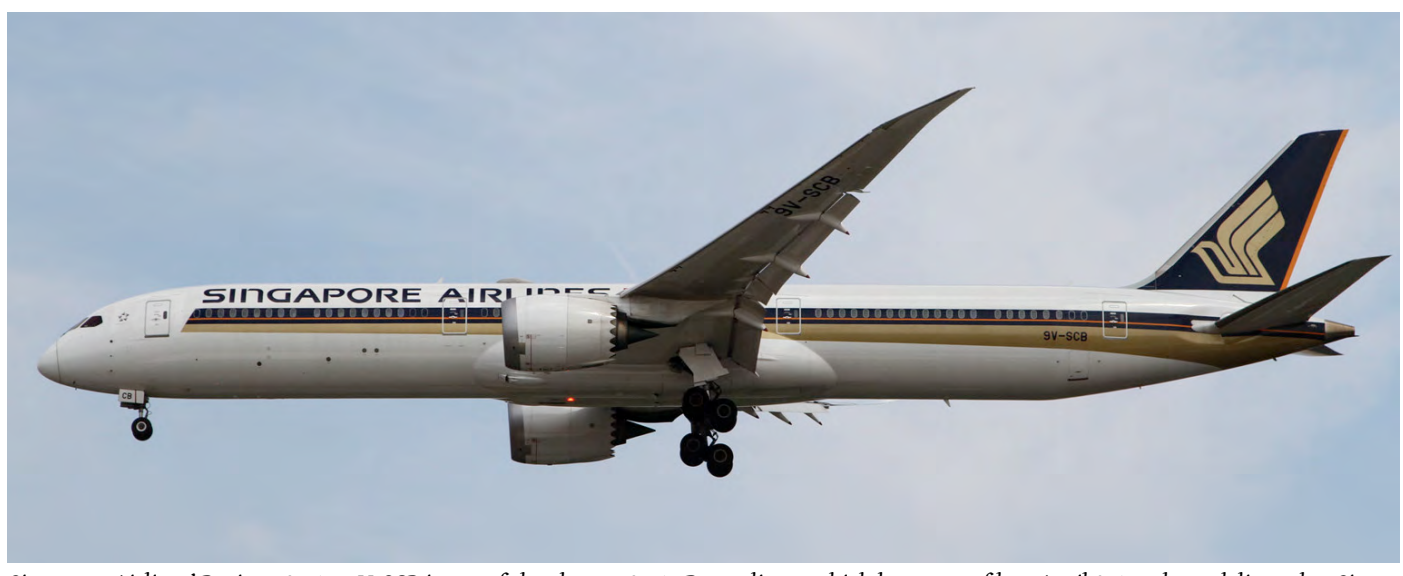
Singapore Airlines' Boeing 787-10 9V-SCB is one of the eleven 787-10 Dreamliners which have - as of late April 2019 - been delivered to Singapore Airlines. The airline has outstanding orders for 36 more 787-10s and options for 25. Singapore Airlines configures the 787-10 with 337 seats, including 36 in business and 301 in economy. The aircraft are used on medium-haul regional routes. (Singapore-Changi, 8 March 2019, Jeep Stoker)