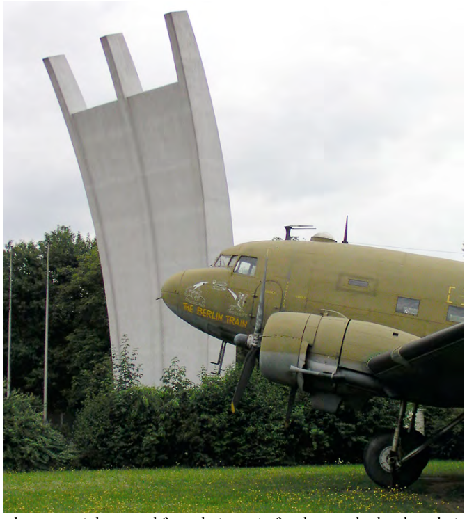
The memorial at Frankfurt Rhein Main for the people that lost their lives during the Berlin Airlift.

As mentioned before, the Airlift took its toll. Seventeen American and eight British aircraft crashed during the operation. However most of the 101 fatalities were due to nonflying accidents. The names of these 40 British, 31 American, one Australian (RAAF airman flying with No. 27 Squadron RAF) and 29 civilians (including eight German ground personnel) are inscribed in memorials both at Rhein-Main and Tempelhof.