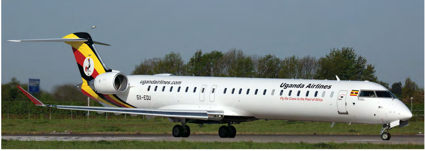
In April Uganda Airlines took delivery of two brand new Bombardier CRJ900 aircraft out of four it ordered in July 2018 at the Farnborough air show. The CRJ900s are configured with 76 seats in a two-class configuration. 5X-EQU is one of the first two aircraft and during its ferry flight from Canada to Entebbe it made a fuel stop at Maastricht-Aachen Airport. In addition to the CRJ900s, the airline has a firm order for a pair of Airbus A330-800s. (Maastricht-Aachen, 22 April 2019, Arjen Sleeuwenhoek)