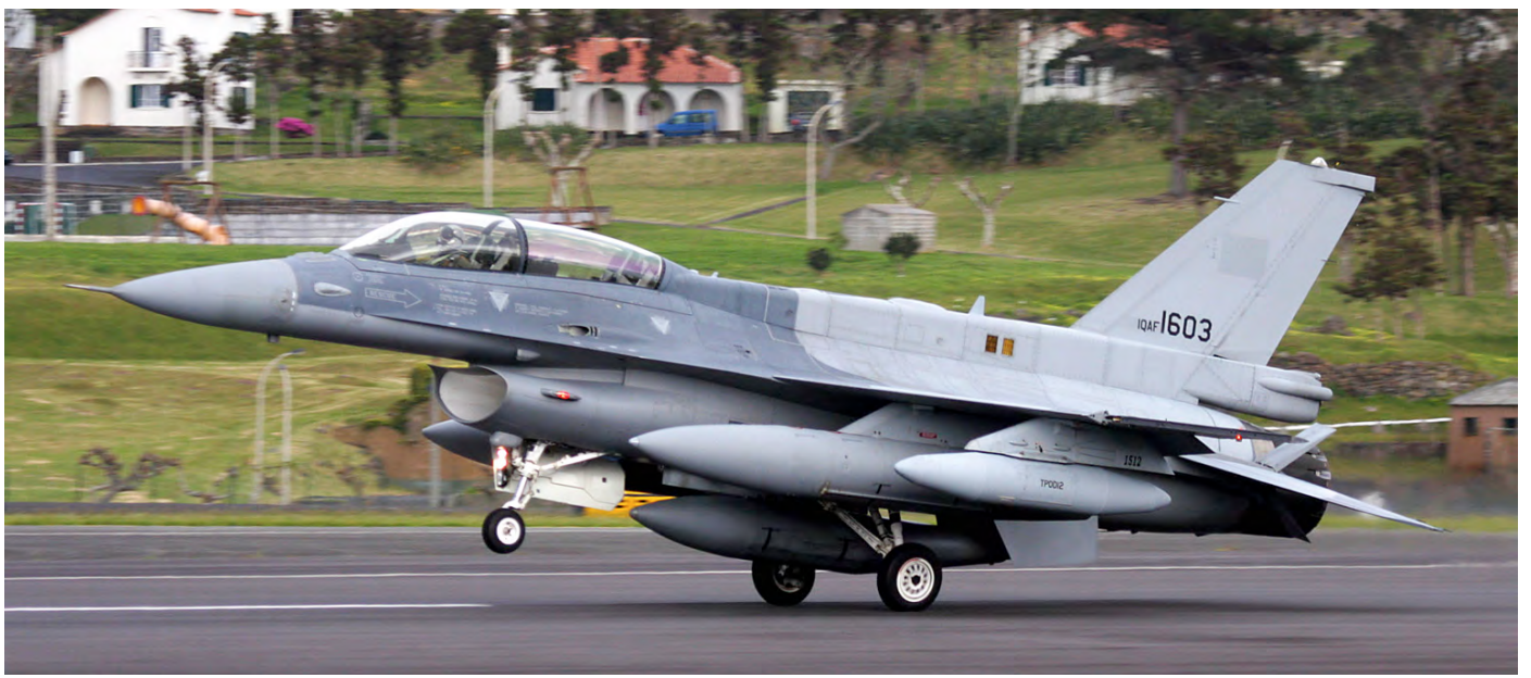
Iraqi F-16D-52 seen transferring to Iraq to be operated by 9th Fighter Squadron after its sojourn in the USA. (Lajes, 2 April 2019, Jaap Dubbeldam)

These four are tanker transport aircraft that are equipped with two hose and drogue refueling systems.