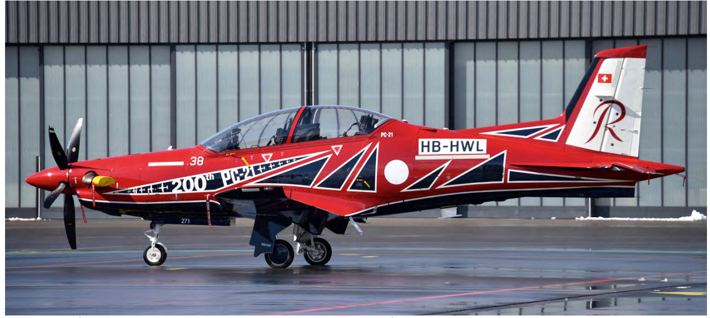
PC-21 A54-038/HB-HWL is the one and only 200th PC-21 built by Pilatus. A5407/HB-HWK was mistakenly marked as the 200th one in March. The matter was corrected, as this photo shows. (Stans-Buochs, 5 April 2019, Stephan Widmer)