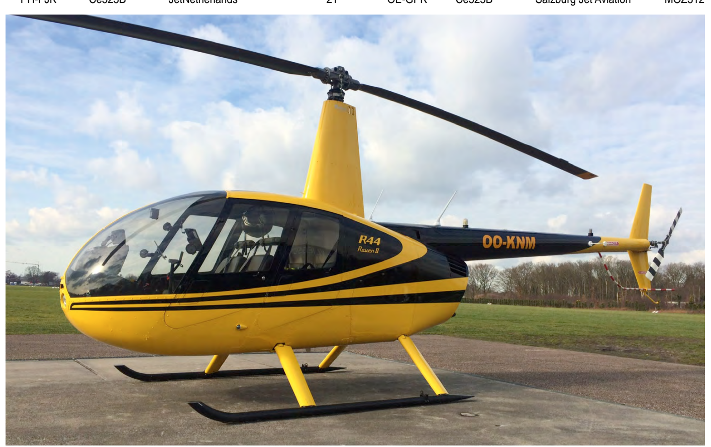
Operated by Air Technology Belgium is visited Hilversum on 12 February 2019. Robinson R44 00-KNM has become a regular in the Dutch skies.