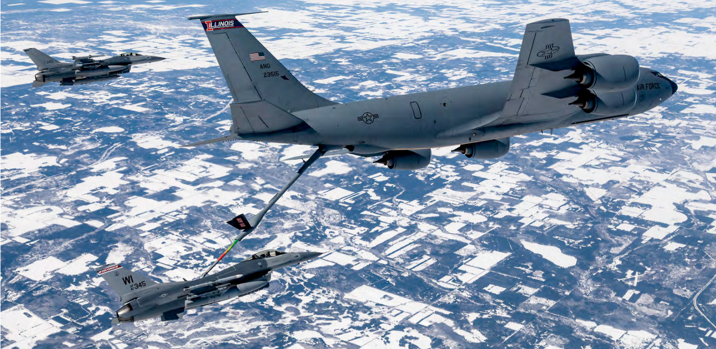
A KC-135R of the 108th Aerial Refueling squadron based at Scott AFB (IL) provides two 176th FS Vipers of necessary fuel over snowy Wisconsin.

In December 2017, it was announced that the 115th FW was chosen to become the second ANG unit to re-equip with the latest fighter in the US Air Force inventory, the F-35A Lightning II. This followed a systemized selection process, and is still pending an environmental impact review which should be concluded by mid-2019. If all goes according to plan, the first F-35s should arrive at Truax Field in 2023. Besides bringing new 5th generation capabilities to the skies over Wisconsin, it also highlights the fact that the Pentagon is investing into providing a long and bright future for the wing. The future stealth fighters will likely be the first F-35s to be put on alert status in support of Operation Noble Eagle, which will be another milestone in the F-35 program.