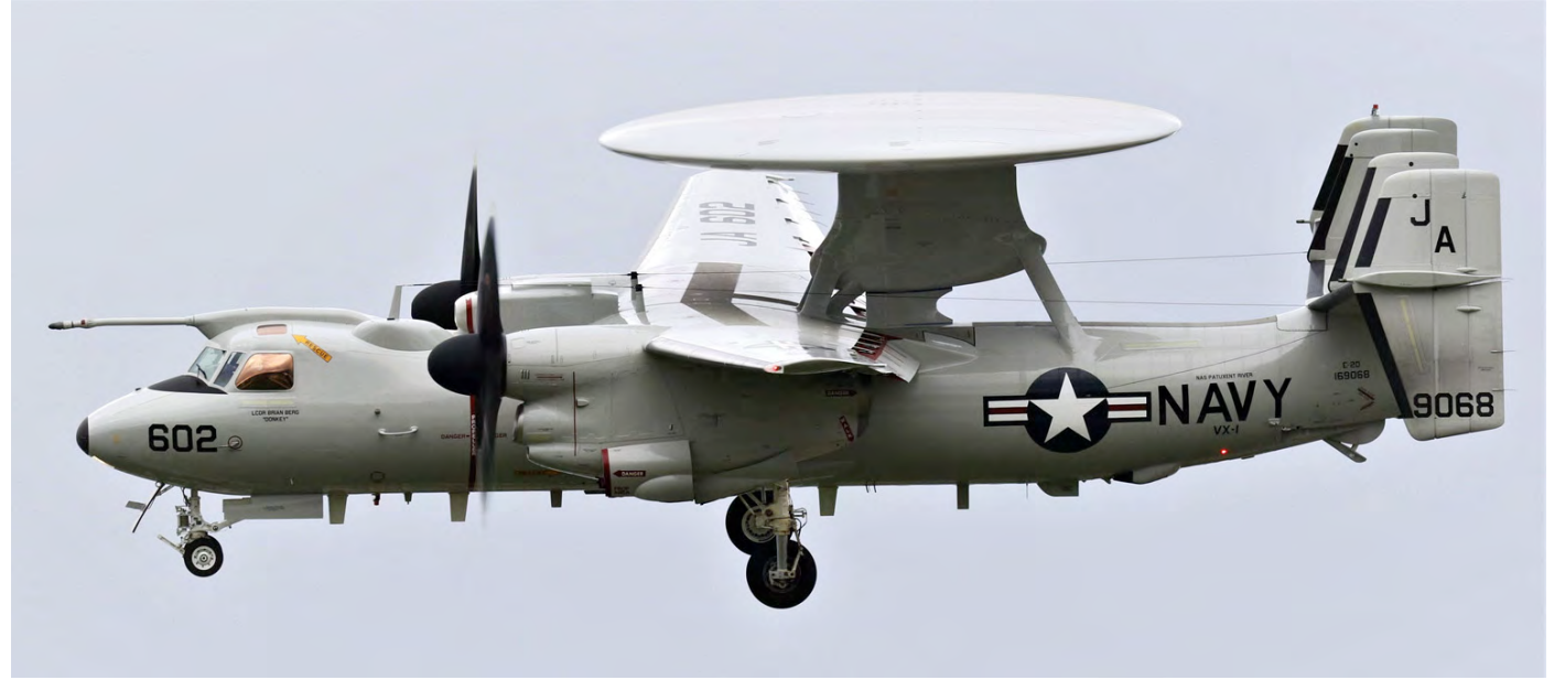
Brand new E-2D 169068/JA-602 belongs to VX-1 based at Patuxent River. However, it is captured at NAS Point Mugu here, showing off its inflight refuelling probe. (11 March 2019, Martin Uleman)