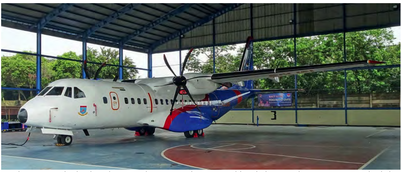
Not that surprisingly also the Indonesian Police operates the CN235M, although this example P-4501 was received only late 2018. (Tangerang/Pondok Cabe, 6 December 2018)