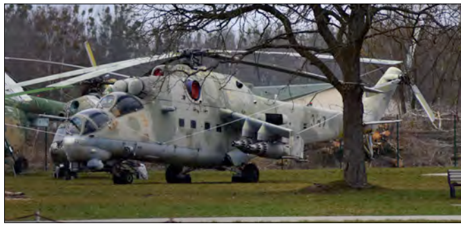
Former Berlin Gatow Mi-24P 96+43 is a recent arrival at the museum in Rechlin town. The former NVA serial 387 is showing again. A tree is in the way for a proper photograph. (22 March 2019, Erwin Alexander)

1260 G164A preserved, ex stored 1260 mar19