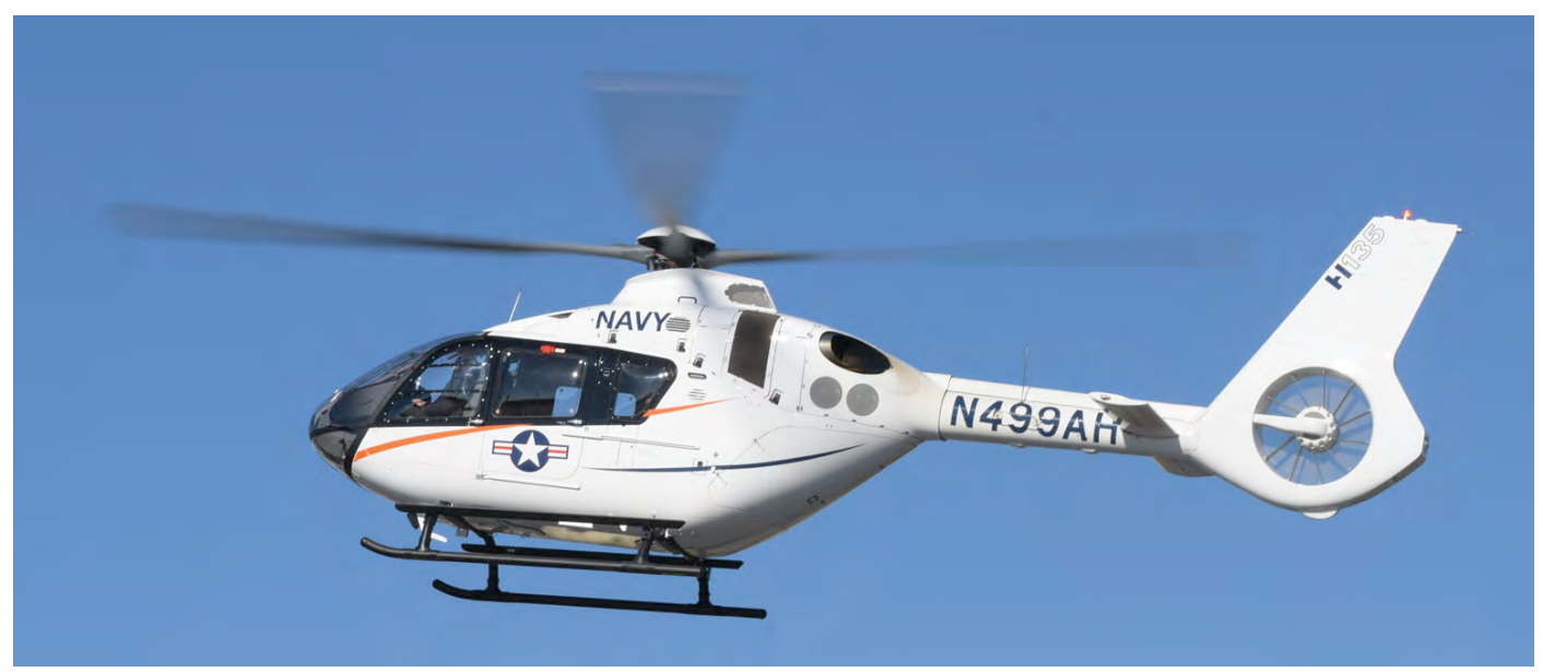
MD Helicopters was not the only company involved in a military race. Airbus Helicopters operated demo flights with H135 N499AH, addorned with NAVY marking. (Heli-Expo, 6 March 2019, Kenneth I Swartz - Vertical Flight Society)