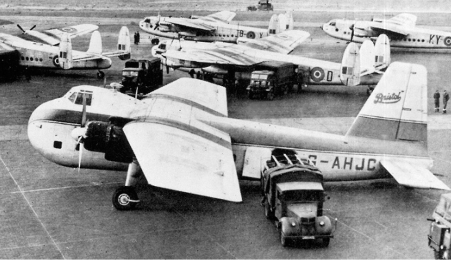
The British used every cargoplane they could find. Bristol 170 Mk IIA G-AHJC was used on the Berlin Airlift from September to November 1948. The aircraft was on lease to Silver City from the Bristol Aeroplane Company. It is accompanied by four RAF AVRO Yorks

candy to Germany. The children of Berlin were grateful for these treats and nicknamed the aircraft involved 'Rosinen-bomber' or 'Raisinbombers'.