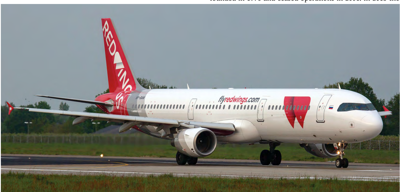
Latest addition to the fleet of Red Wings is Airbus A321-200 VP-BAN. The aircraft was picked up from the inventory of bankrupt Germania, where it flew as D-AGMA. Before delivery to Moscow-Domodedovo on 29 April 2019, it was painted in the new Red Wings colours at Maastricht. Arjen Sleeuwenhoek was present when the aircraft started its take-off roll for its delivery flight to Moscow.

On 17 April, <u>Uganda Airlines</u> took delivery of their first planes; two new Bombardier Commercial Aircraft CRJ900s. The aircraft, registered 5X-KOA and -KOB, are the first two of an order of four CRJ900s. Uganda Airlines also has orders for two Airbus A330-800s, of which the first is scheduled to arrive in December 2020. The original Uganda Airlines was founded in 1976 and ceased operations in 2001. In 2013 the