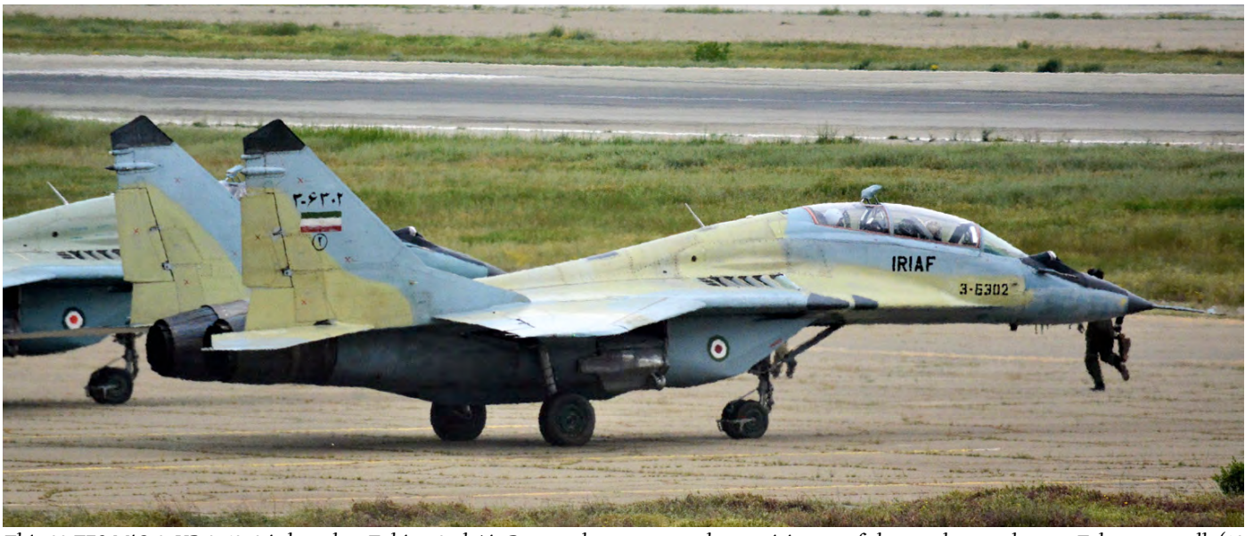
This 22 TFS MiG-29UB 3-6302 is based at Tabirz, 2nd Air Base and was among the participants of the yearly parade over Tehran as well. (18 April 2019)

F-2A 540 has most likely been modified at Gifu and was seen with a Sniper Targeting pod underneath the fuselage, just aft of the intake and right of the nose-gear. The unit of F-2A 561 was identified at last.