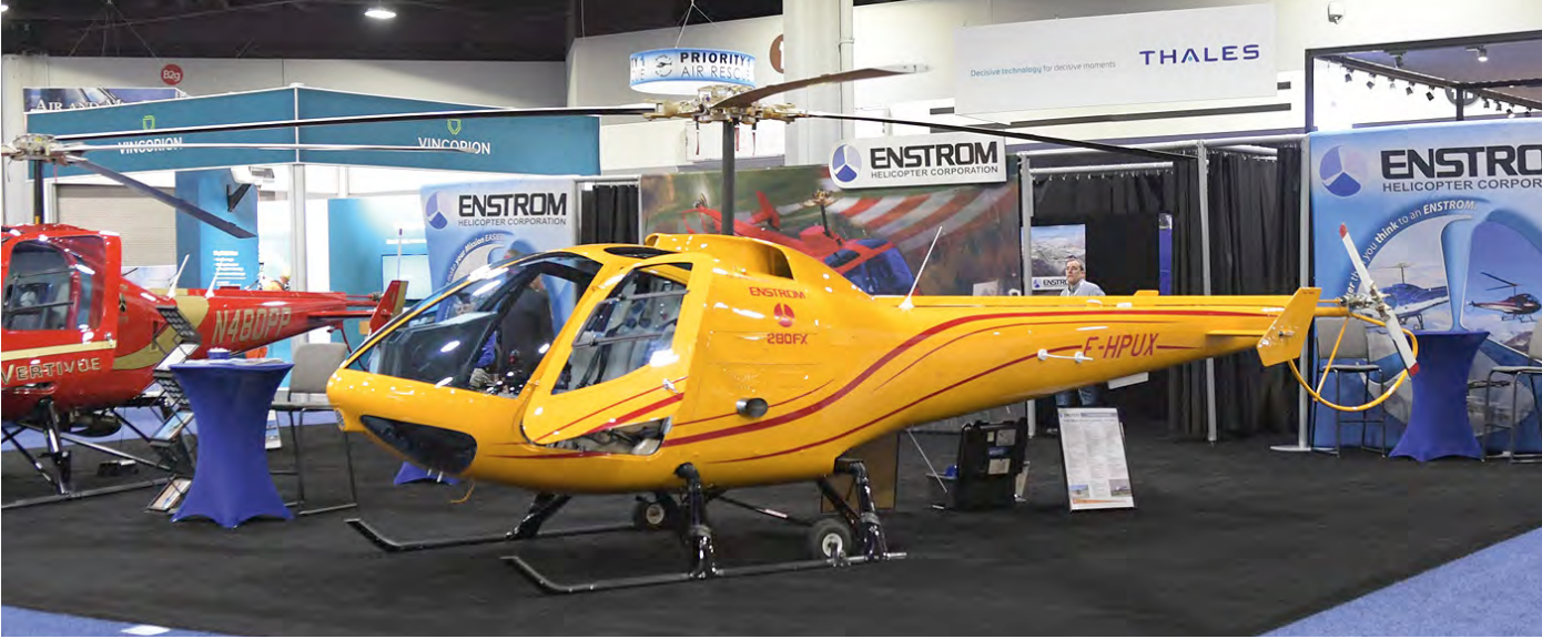
Enstrom delivered a series 280FX at the expo to a French operator. F-HPUX has yet to enter the French register.