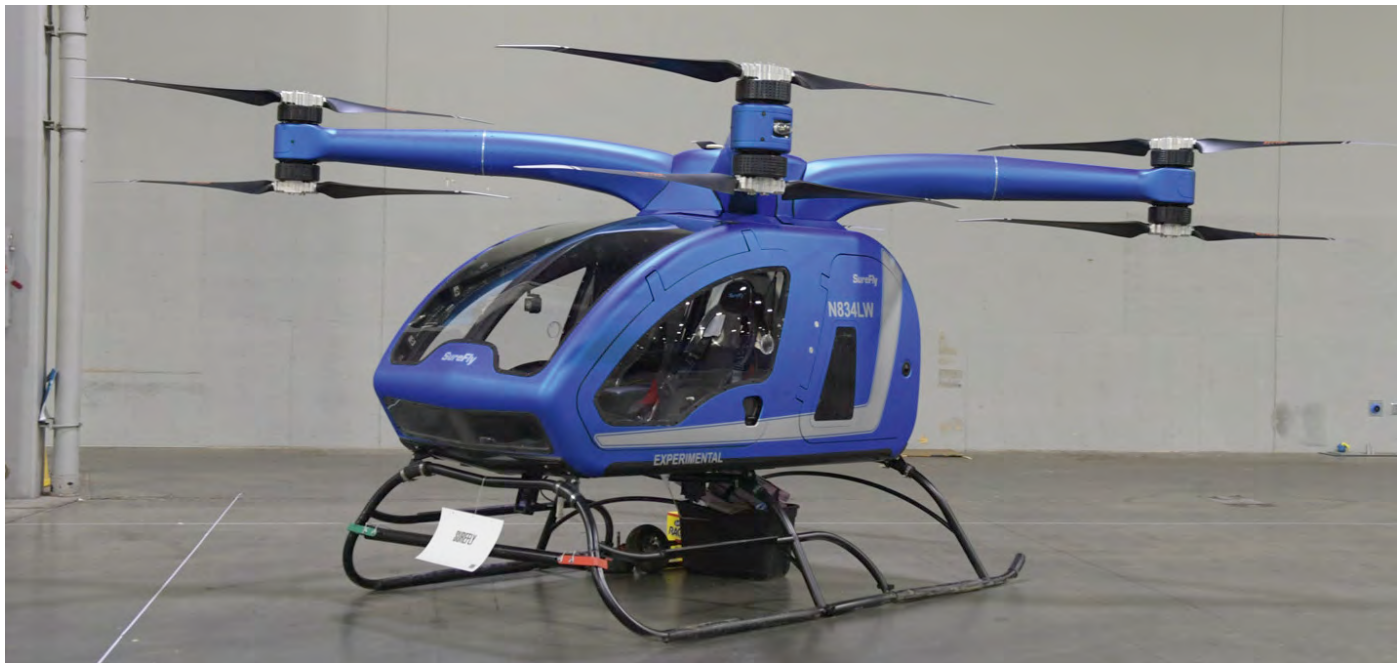
Workhorse Group was the second company at the expo with an air taxi concept. The main difference was that their craft Surefly N834LE has actually flown. (Heli-Expo, 6 March 2019,)