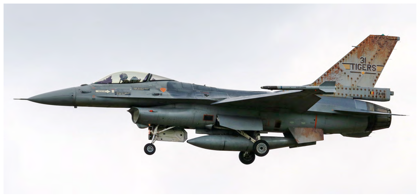
Tiger-tailed F-16AM FA116 with a distinctive 'rusty' finish. Creativity or a political statement? (Kleine Brogel, 17 April 2019)

became T.19A-01, than temporarily TR.19A-01 until registered back to T.19A-01 and now it has been reported as TR.19-01.