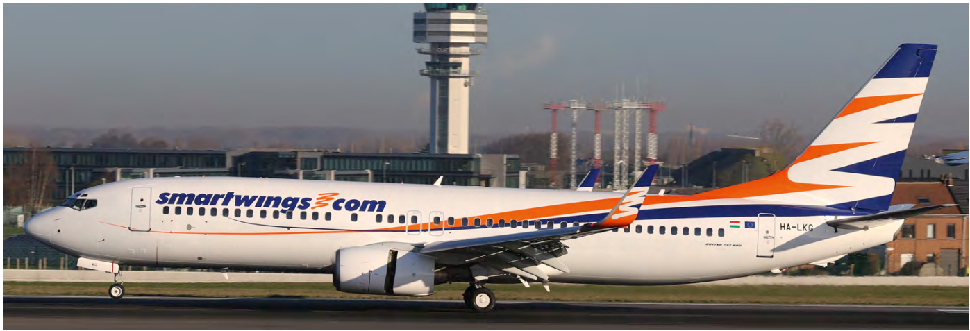
The sole Hungarian registered Travel Service Boeing 737 has changed its appearance and is flying in SmartWings colours since mid March 2019. (Brussels, 19 March 2019,)