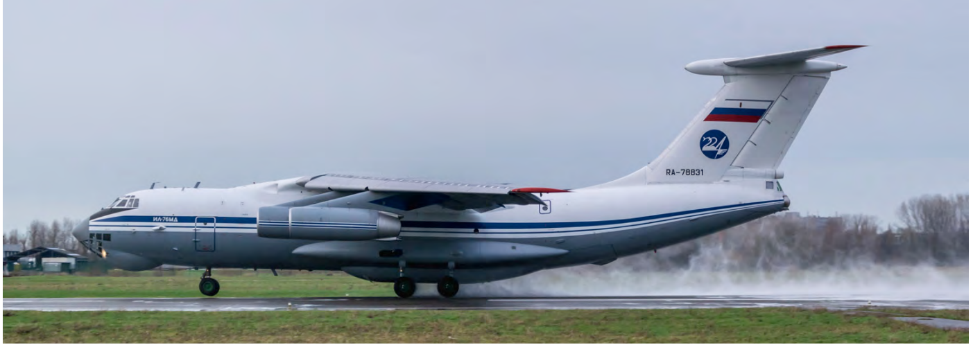
Line number 76-05 was delivered to the Soviet Air Force on 31 August 1990 as CCCP-78831. The markings of the Ilyushin IL-76MD were changed in mid 1994 to RA-78831. It is being operated by the 224th Flight Unit. (Ostend, 5 March 2019, Patrick Vercauteren)