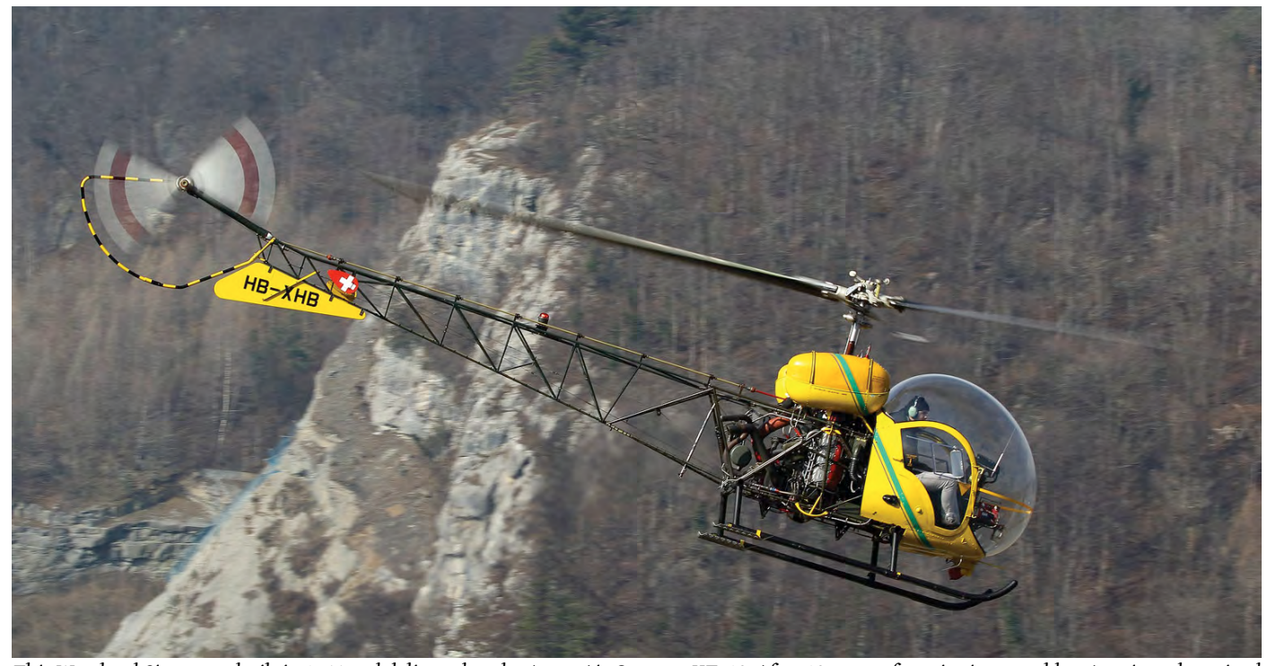
This Westland Sioux was built in 1966 and delivered to the Army Air Corps as XT512. After 12 years of service it was sold to Autair and received the civil registration G-BEPA. After a year it was transferred to Switzerland and re-registered as HB-XHB. This means the Sioux is already 41 years in service. (Balzers, 23 February 2019,)