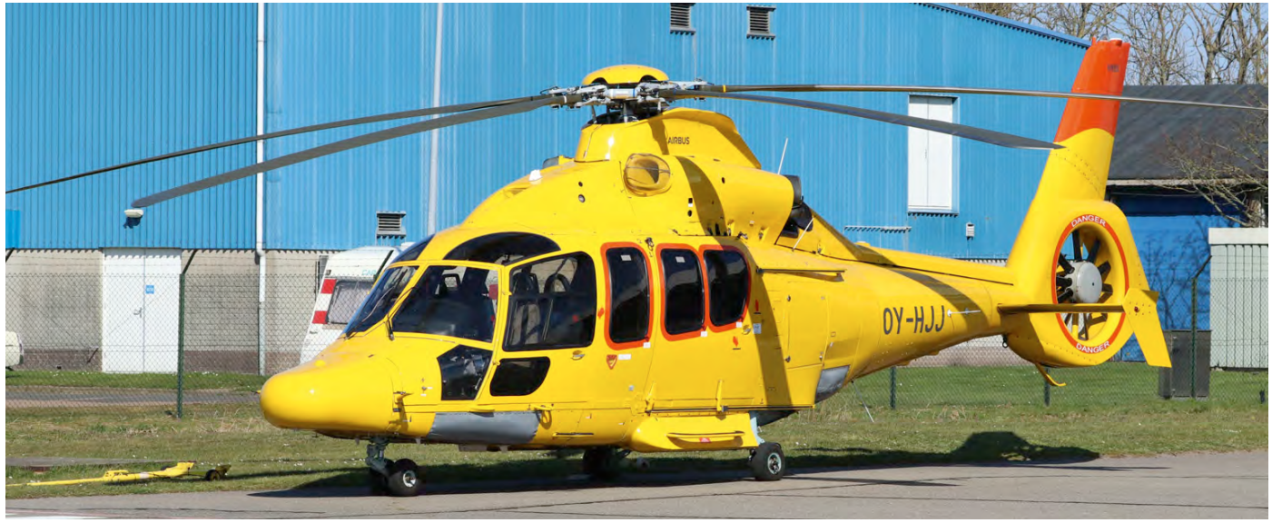
This Dauphin was delivered to DanCopter in 2007. It subsequently operated for Blueway as LN-OYD and Everett Aviation as 5H-EXO before it was returned to DanCopter. The Eurocopter EC155B1 was recently photographed in the basic colours of parent company NHV. (Den Helder - De Kooy 27 March 2019,)