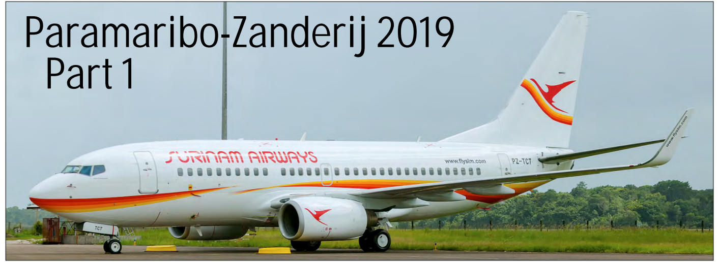
This Boeing 737 was the second new fleet addition for Surinam Airways. Although delivered in late December 2018 PZ-TCT operated its first service on 3 February 2019 as SLM729 due to a lengthy certification process. (Paramaribo, 10 January 2019, Andrew Muller)