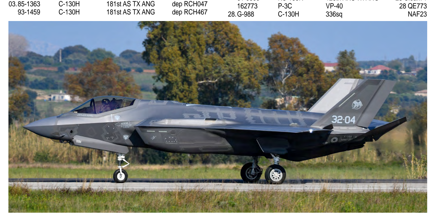
Early April exercise Inichios was held at Andravida. Unfortunately, we only received pictures and no report of the participants and visitors. F-35A MM7335/32-04 was one of the participants. (Andravida, 3 April 2019,)