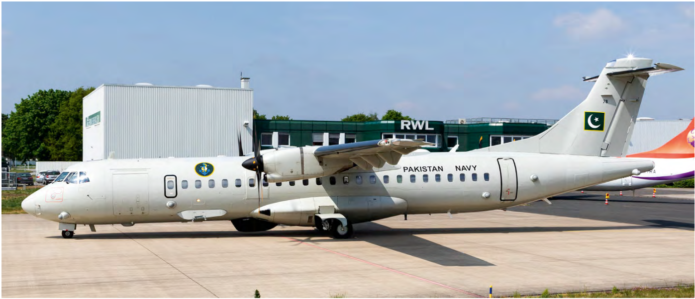
Pakistan Navy's ATR72 78 has been heavily modified by RAS Aviation at Mönchengladbach. Currently, test flights are performed and it will likely be delivered soon (30 April 2019, Jesse Vervoort)