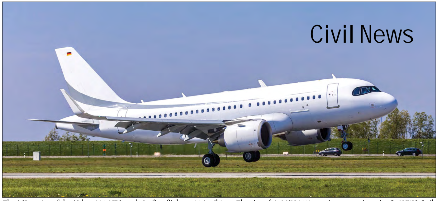
The ACJ version of the Airbus A319NEO made its first flight on 24 April 2019. The aircraft is MSN 8612 wearing test registration D-AVWG. Built for K5-Aviation, the aircraft will be outfitted with a VVIP interior by Fokker Techniek at Woensdrecht. K5-Aviation, who will operate the aircraft for an unnamed customer, will eventually register the aircraft as D-ANEO. (Hamburg-Finkenwerder, 24 April 2019, Bengt Lange)