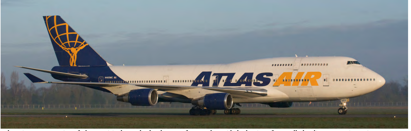
Atlas Air passenger aircraft do not visit the Netherlands very often. Such a wide body aircraft actually landing at Groningen is very rare so when Boeing 747 N465MC operated a military charter to that airport it also brought enthousiast en masse to the north of the country. (Groningen - Eelde, 27 March 2019, Sil Veenstra)