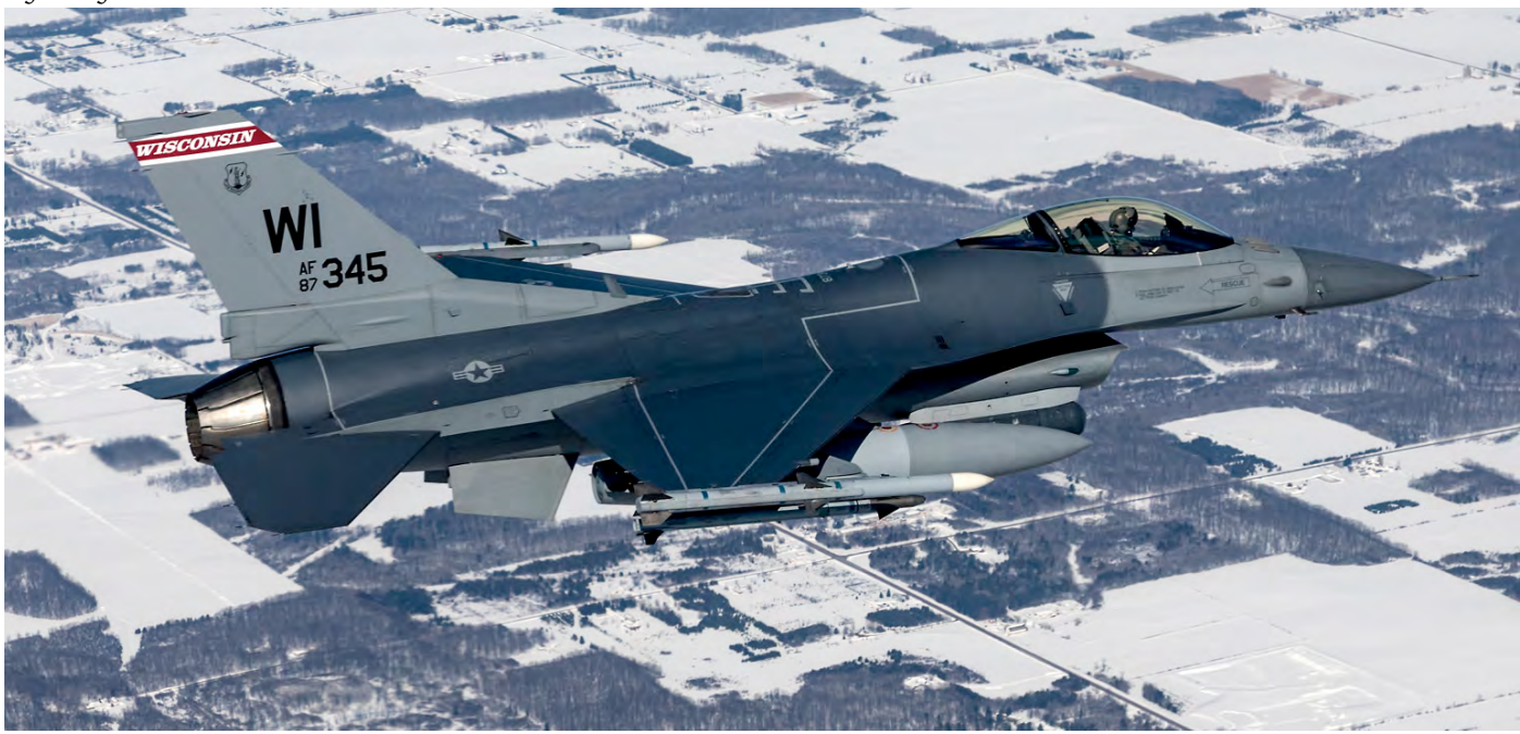
A classic picture of 87-0345, one of the Militia F-16Cs.