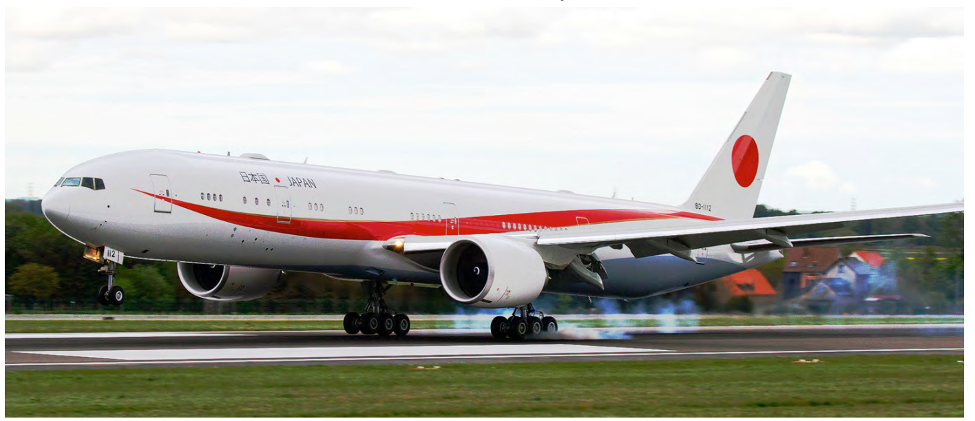
Prime Minister Shinzo Abe embarked the JASDF "Air Force One" Monday 22 April on an eight-day European and North American trip hoping to rally support to jointly tackle global issues such as free trade as chair of this year's Group of 20 summit. (Brussels, 25 April 2019, Dino van Doorn)