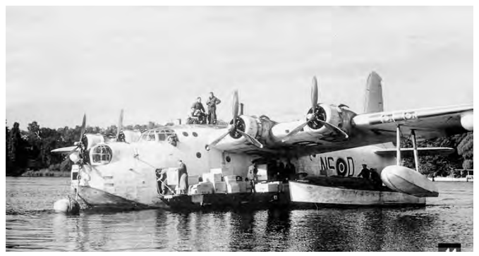
RAF Short Sunderland VB389 'NS-D' delivers its goods to the population of Berlin

Very soon it was clear that the aircraft available in Germany at that time (only two groups of USAFE C-47s) would not be able to deliver enough tons of supplies (maximum capacity of a C-47 was 2700 kgs) The USAFE, with 100 daily round trips