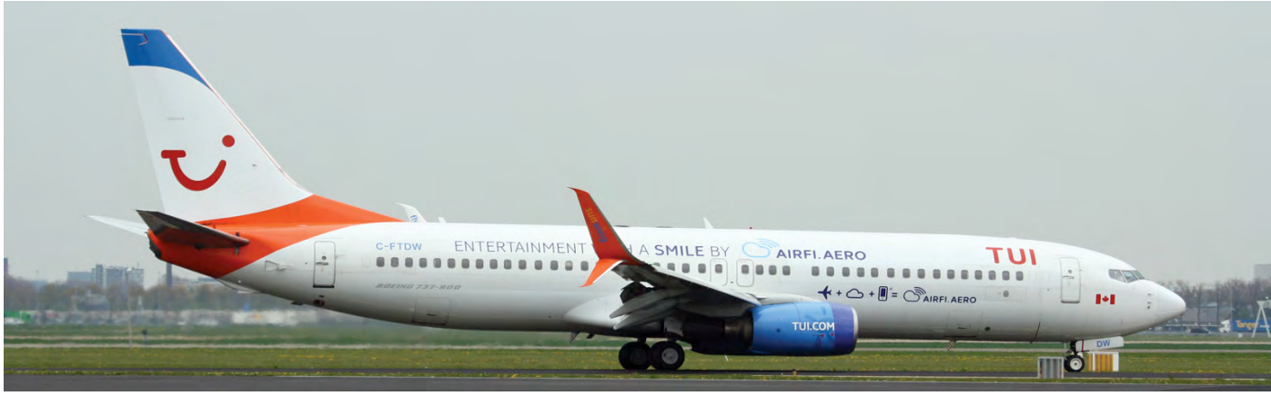
TUIfly Netherlands uses two Sunwing Airlines Boeing 737-800s during this summer season. Both aircraft remain on the Canadian register and are painted in special colours. One of them is C-FTDW and is the less colourful of the two as it only has additional titles promoting Airfi.aero, a company that sells AirFi Wireless IFE and Connected Crew cabin EPoS platforms to airlines and other mass transportation sectors. (Amsterdam-Schiphol, 17 April 2019, Maurits Niemeijer)

government decided to revive the national airline as the private alternative, Air Uganda, also failed.