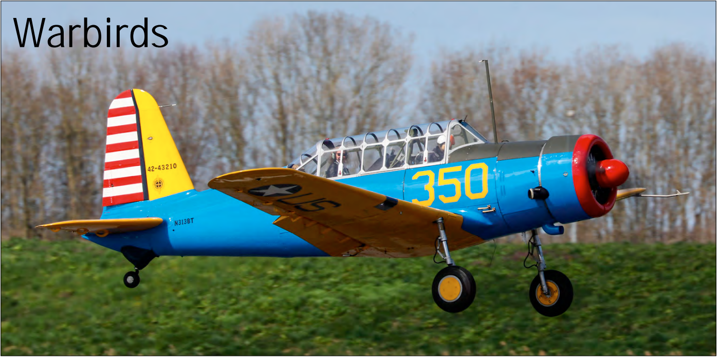
Thanks to our friend Berend Jan Floor we can show you how the latest Dutch warbird looks like. It is Vultee BT-13A Valiant N313BT which is owned by the Early Birds Foundation based at Lelystad. N313BT was built for the USAAF in 1943 as 42-43210. The trainer was fully restored in the USA in the years 2010 to 2015. It arrived in a container on 17 January and was soon assembled. It made its first flight in Holland on 22 March.