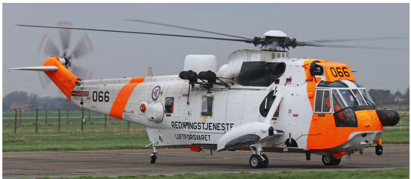
The 40sq Seaking farewell event brought some foreign visitors to Koksijde Airbase. Norwegian Sea King Mk43B 066 was one of them. It participated in a formation flight on the same day when this photo was taken (see Scramble #479, page61). The Westland Sea King is being operated by 330 skv. (Koksijde, 20 March 2019, Nik Deblauwe)