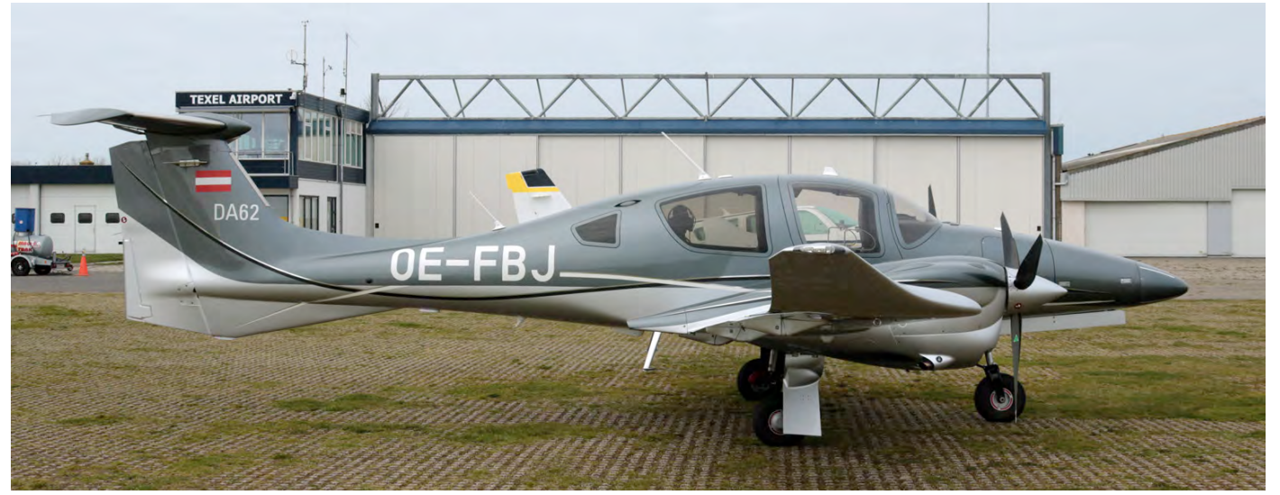
Build in 2017 Diamond DA62 was registered OE-FBJ. The registered owner is a company called Air Ranger who is based in Hungary. It is rumoured that the aircraft is actually owned by Dutch company Westerheide Management & Consultancy hence the reason for the Diamond to appear in the Dutch skies once in a while. (Texel, 28 March 2019,)