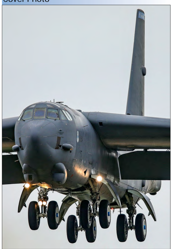
In order to perform high visibility missions along the Baltic States, Fairford enjoyed a detachment of six B-52s (Fairford, 20 March 2019 Mark Rourke)