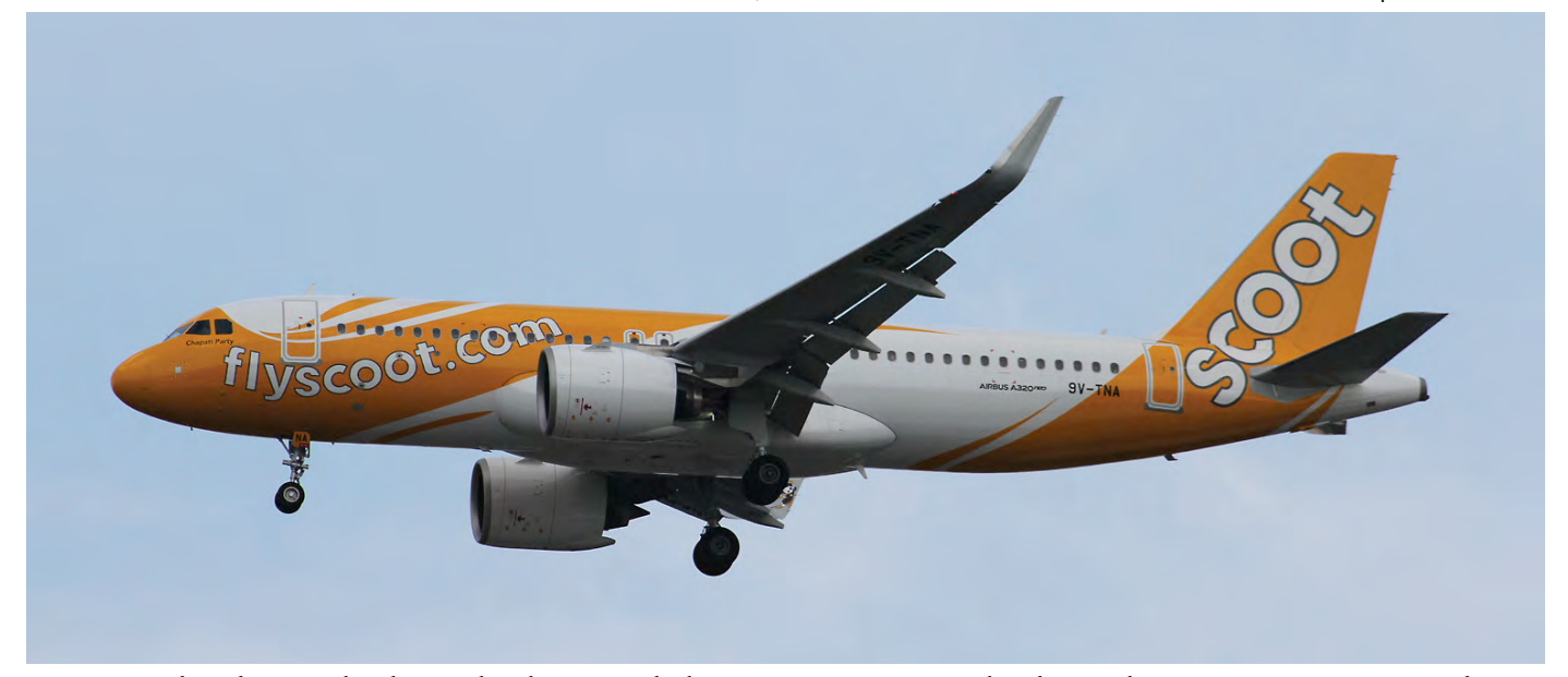
Singapore Airlines low-cost daughter and Airbus narrowbody operator Tigerair merged with sister low-cost carrier Scoot on 25 July 2017. Subsequently the Tigerair colours on the Airbus aircraft were replaced with the Scoot colours. Late 2018, Scoot added two brand-new Airbus A320NEO aircraft to its fleet. 9V-TNA was the first of the two and was delivered in October 2018. (Singapore-Changi, 8 March 2019)