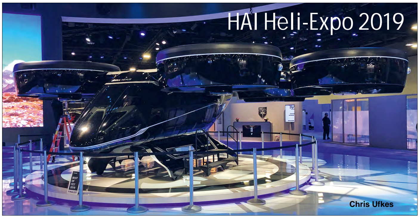
The 'nexus of transport and technology and of comfort and convenience' according to Bell. The hybrid-electric vertical takeoff and landing (eVTOL) aircraft was one of the highlights at this years Heli-Expo in Atlanta. The "air taxi" concept is powered by the Safran Hybrid-Electric Propulsion System (HEPS). (Heli-Expo, 7 March 2019,)

The annual HAI Heli-Expo took place at the Georgia World Congress Center in Altanta, Georgia from 4 till 7 March 2019.