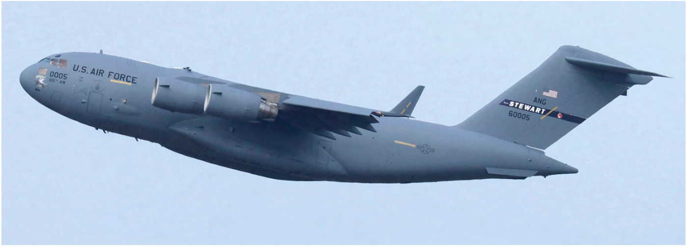
Hopefully we will receive reports of this years edition of Frisian Flag at Leeuwarden. This page shows some support aircraft,like C-17A 96-0005 of 137th AS based at Stewart (Leeuwarden, 27 March 2019,)