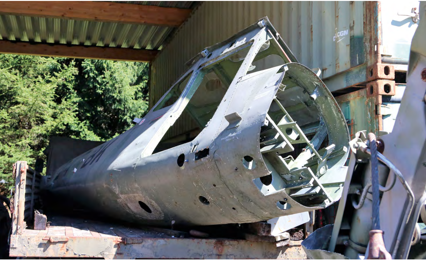
The fuselage of Austria L-19E Bird Dog 3A-BK is more than twenty years is storage at the Fahrzeug-Technik-Luftfahrt museum at Bad Ischl. (21 April 2019,)

lives at Vinstra. The aircraft could be here or at the nearby airstrip of Frya. The aircraft left Kjeller on 15 December 2019.