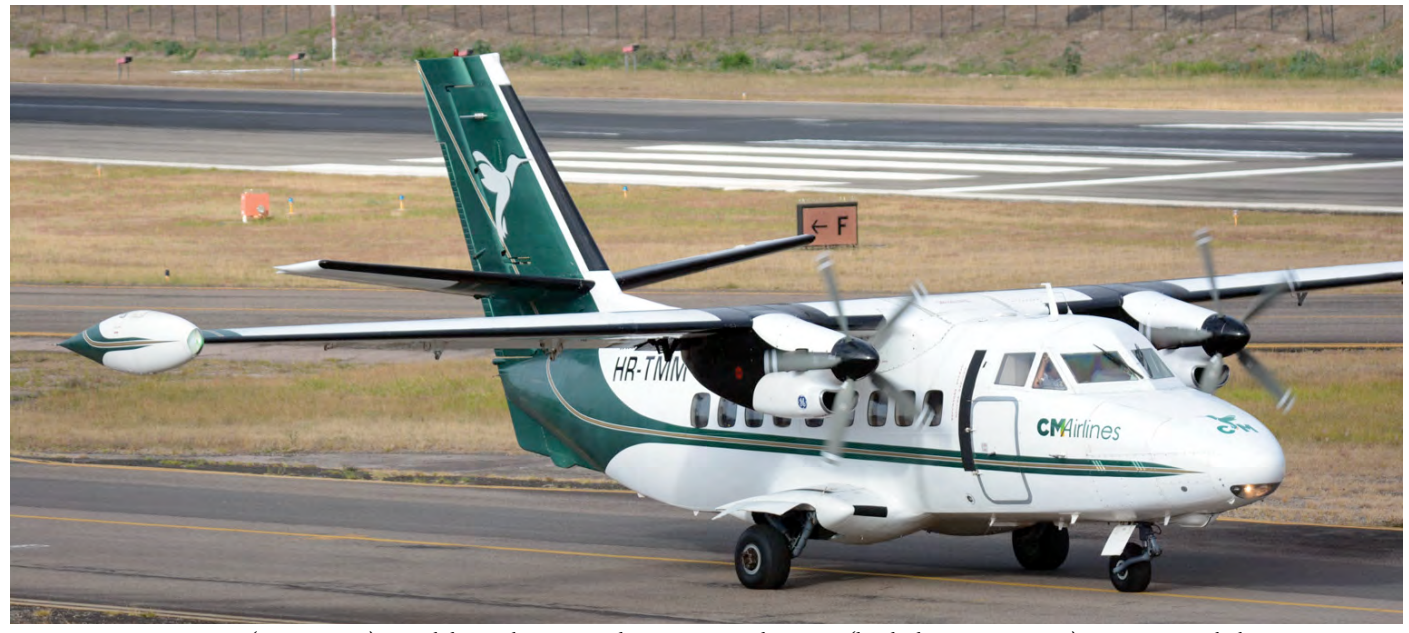
Let 410UVP-E HR-TMM (msn 902419) was delivered to CM Airlines in December 2012 (back then as HR-JMM). It got upgraded to L-410UVP-E9 (and HR-TMM) sometime after that as it was noted as such, still flying for CM Airlines, at Tegucigalpa – Toncontin on 3 February 2019. A few weeks later, on 21 February 2019, Raymond van Dijkhuizen took this picture at the same location.