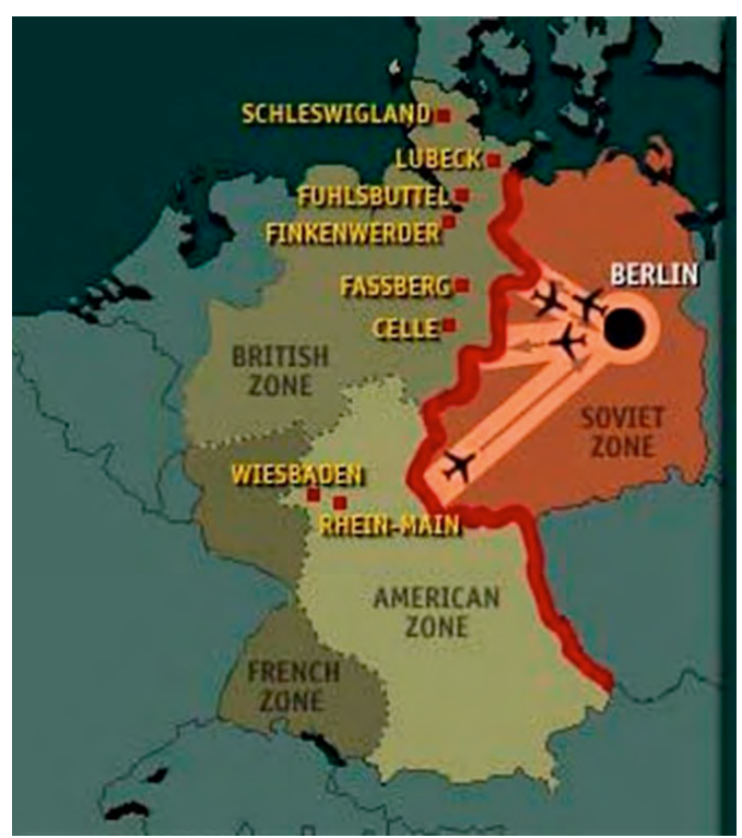
Map of the air corridors and important airfields during the Berlin Airlift

while the most Southerly corridor was used by the USAFE for the same purpose. The central corridor was used as exit route for both. Using the corridors to maximum efficiency, the aircraft would take off every four minutes, flying at equal speed, 1,000 feet higher than the flight in front. This pattern began at 5,000 feet and was repeated five times, a system referred to as 'the ladder'. Because of the short distance, USAFE C-54s initially flew to Gatow in British zone. But it was soon decided that these would fly from Rhein-Main and Wiesbaden to Tempelhof. Both at Gatow and Tempelhof a transport would land every four minutes (five in adverse weather), day and night! Soon a third airfield was constructed, this time in the French sector, Tegel. The heavy machinery to build the airfield was flown in by Fairchild C-82 Packets. Diverting a substantial amount of RAF flights to Tegel meant a relief for Gatow.