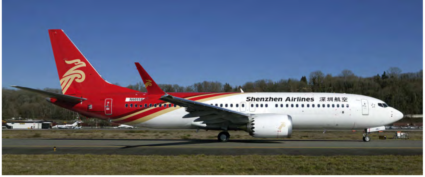
Due to the grounding a lot of MAXs are still at the three airfields of the Boeing factories in the Seattle surroundings. One of them is Shenzhen Airlines with test registration N6055X. Once delivered it will become B-208J. (Seattle-Boeing Field (WA), 5 March 2019,)