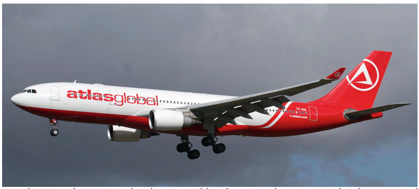
Previously in service with TAM as PT-MVL this Airbus A330 was withdrawn from use in March 2016. It was returned to its lessor as EI-GEX and delivered to AtlasGlobal as TC-AGL in December 2018. (Amsterdam - Schiphol, 24 March 2019)