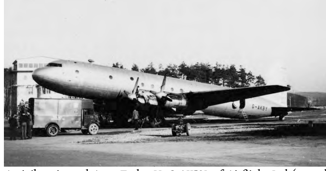
A civil registered Avro Tudor V, G-AKBY, of Airflight Ltd (owned by the wartime commander of No 8 Group RAF, Air Vice Marshal Donald Bennett) refuels at Wunstorf aerodrome during the Berlin Airlift, November 1948. Tudor V aircraft were used as fuel tankers during the Airlift.

Finally, on 12 May 1949, the Soviets lifted their blockade of Berlin at one minute after midnight. But the Allies continued to fly supplies to Berlin, suspicious that the Soviets would change their plans. Slowly decreasing the intensity of flying, the build-up of a comfortable surplus of supplies went on, soon eliminating night and weekend flying. By 24 July 1949, the surplus was large enough to restart an airlift, if needed. The Berlin Airlift officially ended on 30 September 1949. In total, the allies made 278,228 flights in the Airlift during which the USAF delivered 1,783,573 tons and the RAF 541,937 tons. Nearly 75% of the total 2,326,406 tons forwarded, was coal. The Royal Australian Air Force delivered 7,968 tons of freight and 6,964 passengers during 2,062 sorties. The C-47s