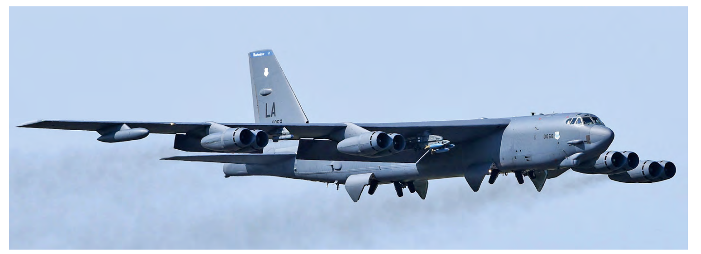
Taff Evans visited RAF Fairford on 1 April 2019 and encountered B-52H 60-0058 as can be seen above.