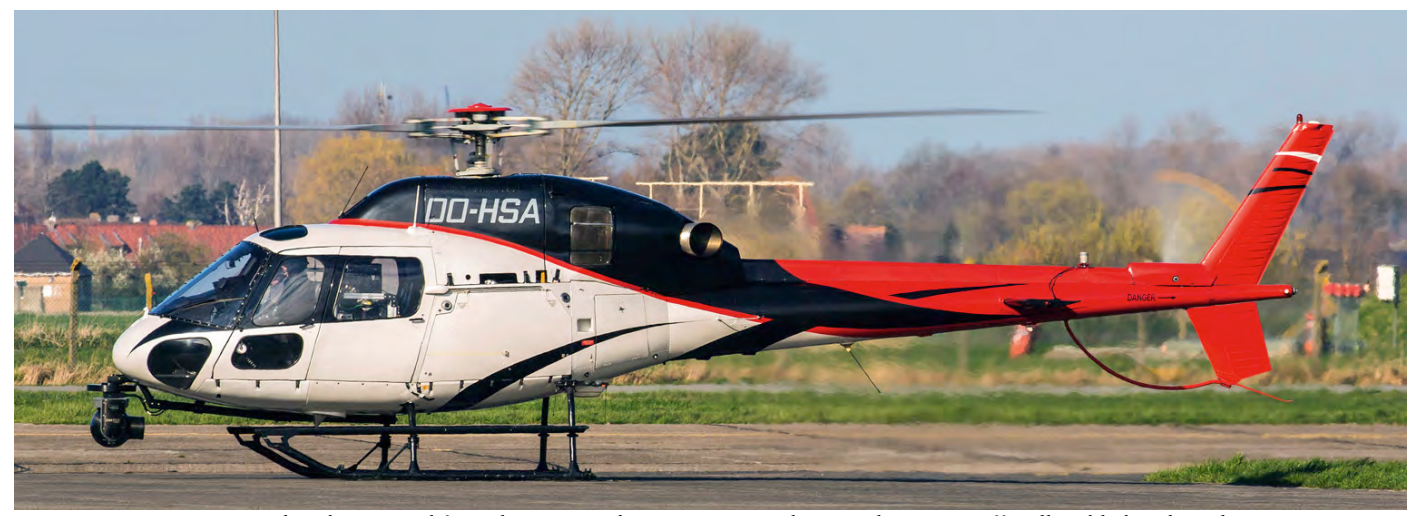
Registration OO-HSA was already reserved for Heli Service Belgium on 7 December 2017 but it was officially added to the Belgian register on 30 January 2019. The AS355N was used for aerial camera work during a cycling race when it was photographed. Attached was a cineflex camera with VRT cameraman Dirk Vandeneede also on board. (Koksijde, 28 March 2019, Wim Houquet)