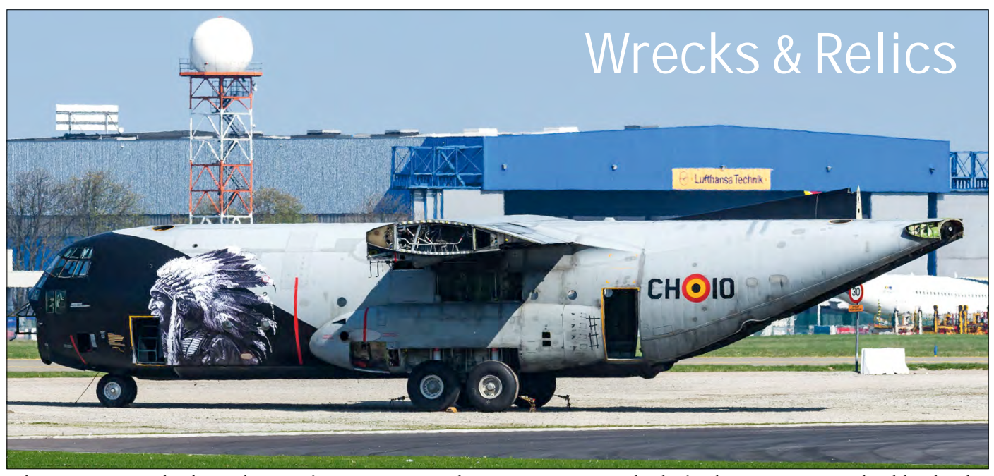
Belgium C-130H CH10 has been taken out of service on 20 December 2018. It is now in use by the fire department at Brussel Melsbroek. It has donated its tail section to CH07. (30 March 2019, Jonas Evrard)