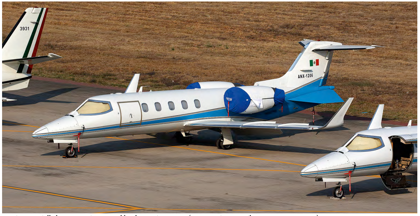
Learjet 31 serialled ANX-1206 is operated by the Mexican navy. (Santa Lucia, 23 April 2019,)