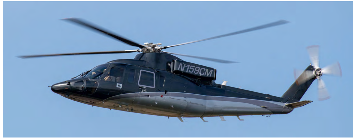
This Sikorsky S-76B entered service with the US Department of Justice in 2009 registered as N476CA. Its registration was ammended to N159CM in 2011. From August 2012 onwards the helicopter has been in service with the US Department of Homeland Security. It was photographed from the Titanic Memorial in Washington DC by Erwin Moedersheim on 11 April 2019 using callsign "Omaha 1".