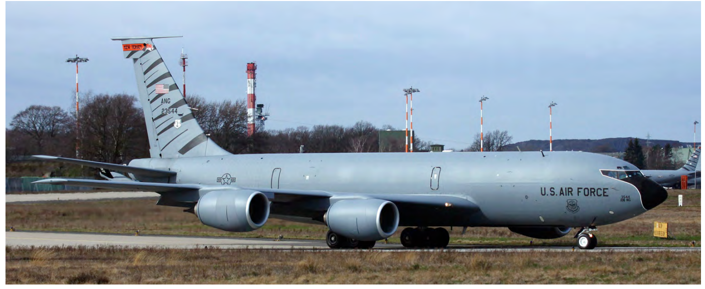
The USAF KC-135R deployment for March 2019 was performed by the New Jersey ANG and 141st Air Refueling Squadron as hosting unit. The 141st ARS stand-out from the regular KC-135 fleet because of its Tiger markings, 62-3544 is showing them clearly on 7 March 2019 prior to departure from Geilenkirchen and Rolf Flinzner was present near the fence.