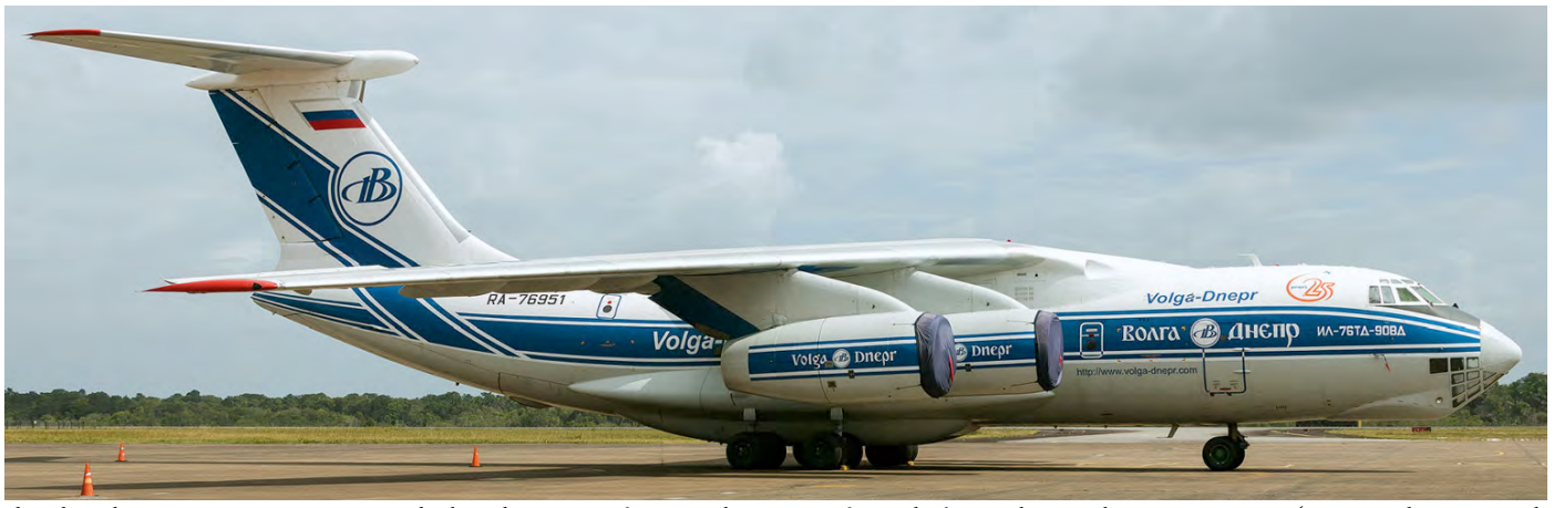
Ilyushin Il-76TD-90 RA-76951 was parked at the airport for a good amount of time before it departed to Santa Maria. (Paramaribo, 19 March 2019,)