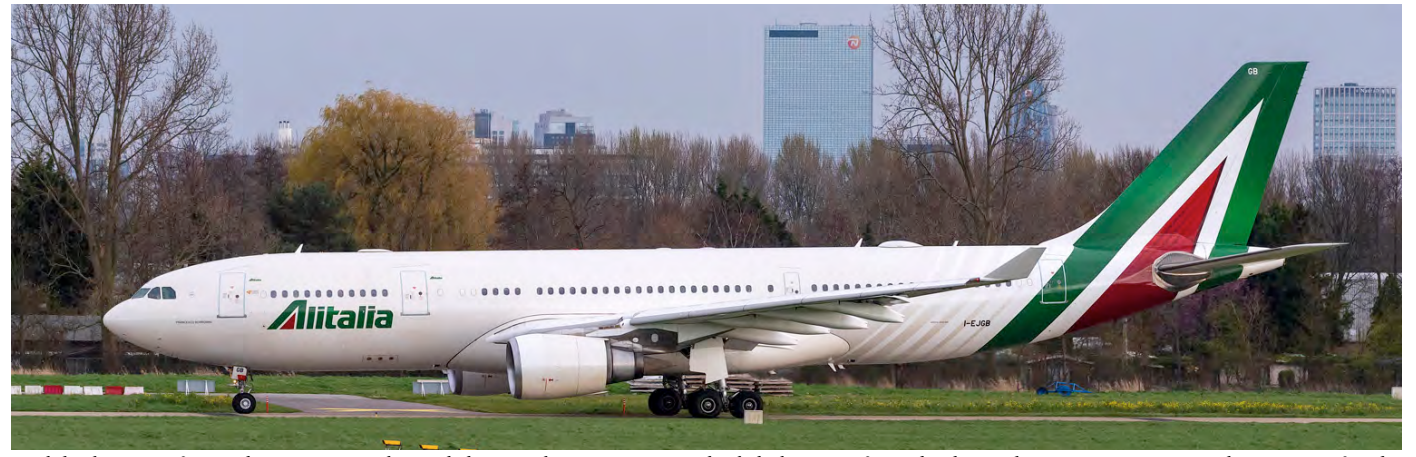
Widebody aircraft mostly visit Rotterdam while on a diversion. Two scheduled visits of an Alitalia Airbus A330 was quite a happening for the airport and its enthousiasts. I-EJGB has been part of the Alitalia fleet since June 2015. (Rotterdam - The Haque, 27 March 2019,)