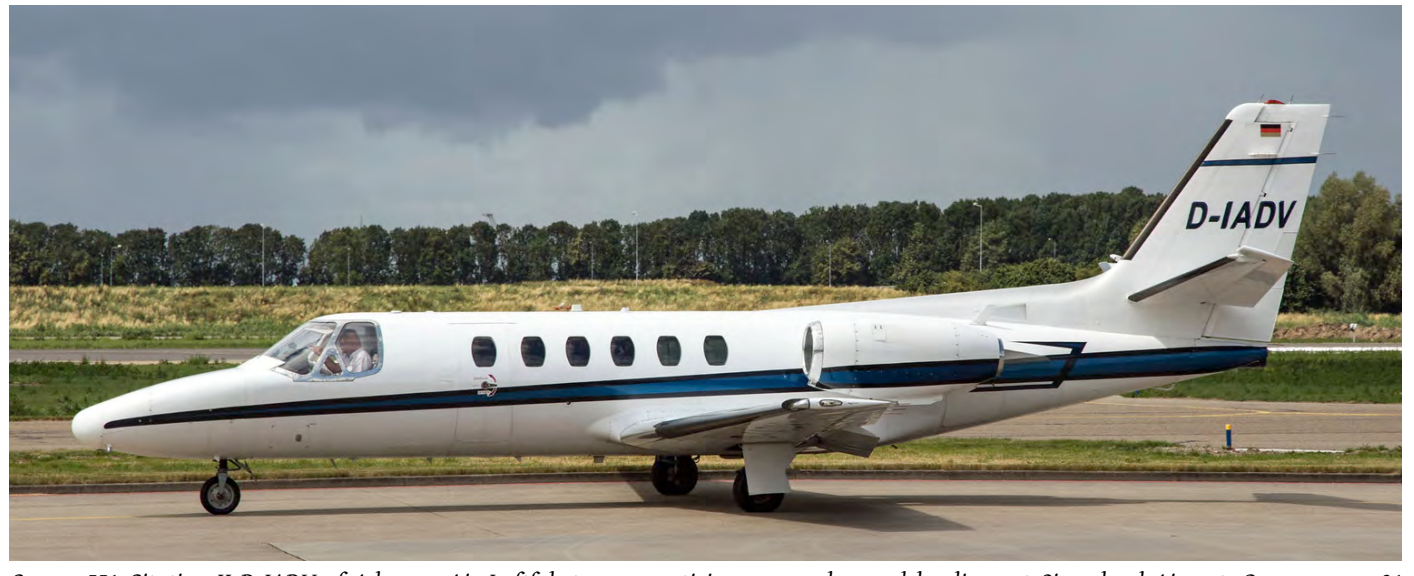
Cessna 551 Citation II D-IADV of Advance Air Luftfahrt was practicing approaches and landings at Siegerland Airport, Germany, on 24 April 2019 when, according to local authorities, the aircraft touched down short of the runway, causing the main landing gear to collapse. Richard Poeser captured the Citation when it paid a visit to Lelystad Airport, the Netherlands, on 21 June 2018.

F-35 is equipped with little "blocks" on top and underneath the aircraft, so it can be seen on radar) and the pilot did not respond to radio calls anymore. As a result, all twelve operational Lightnings, and one under production at Mitsubishi, have been grounded pending investigation into the crash. In the search for the crashed Lightning the following Japanese assets were used: two U-125As and two UH-60Js from the JASDF, one Orion, one SH-60J and five ships of the JMSDF, three ships from the JCG and one Poseidon of the US Navy. This is now the second F-35 that is lost in a crash. In September 2018, a US Marine Corps F-35B crashed near MCAS Beaufort (SC). The USMC pilot managed to escape safely with his ejection seat.