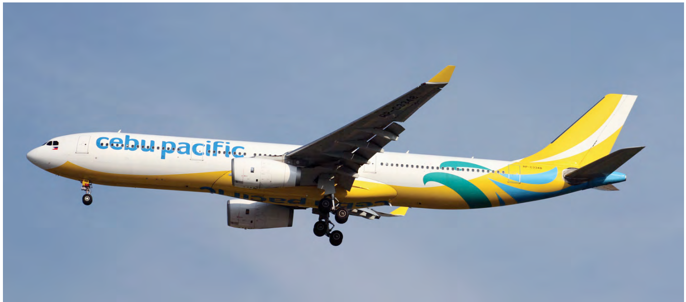
One day at Singapore-Changi shows a lot different carriers. One of them was Cebu Pacific Air A330 RP-C3348. This A330 has an all economy cabin with 437 seats. (Singapore-Changi, 8 March 2019, Jeep Stoker)