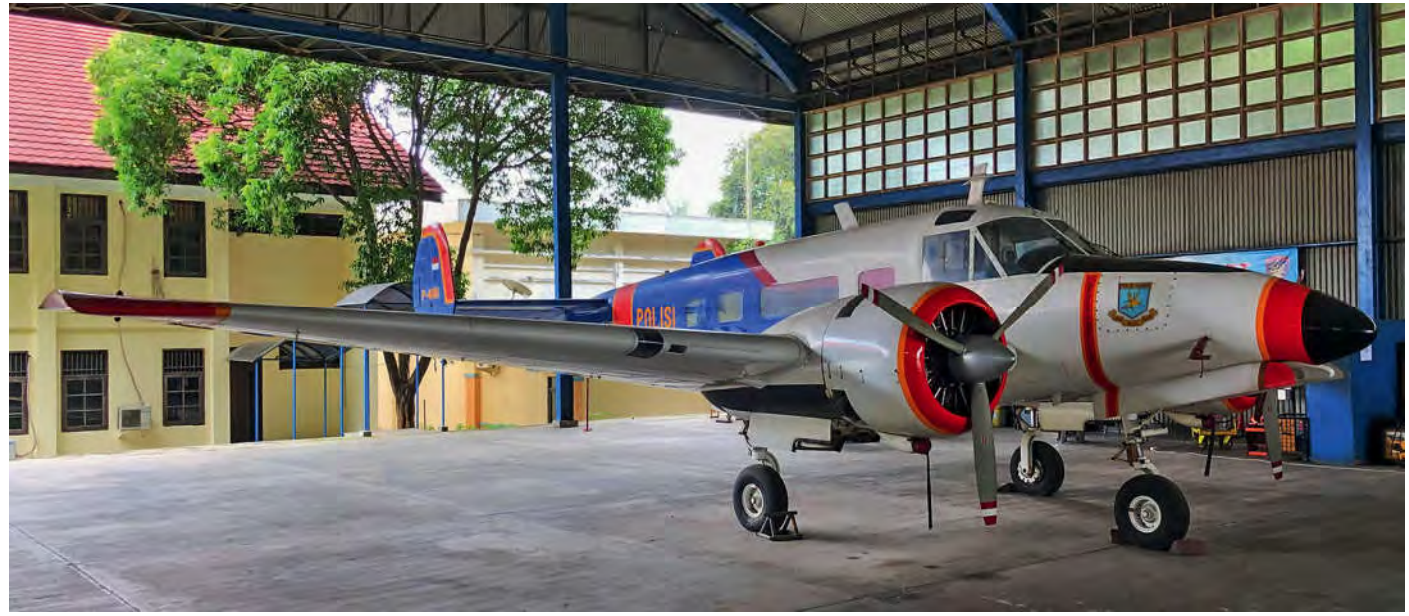
This month we were very happy to receive a lot of pictures of the Indonesian Polisi Undara. Some of which are shown here and all will be included in the OrBat at www.scramble.nl. The Beech H18 P-4001 is a special Beech 18 version as it features a nose wheel instead of the regular tailwheel. (Tangerang/Pondok Cabe, 6 December 2018)