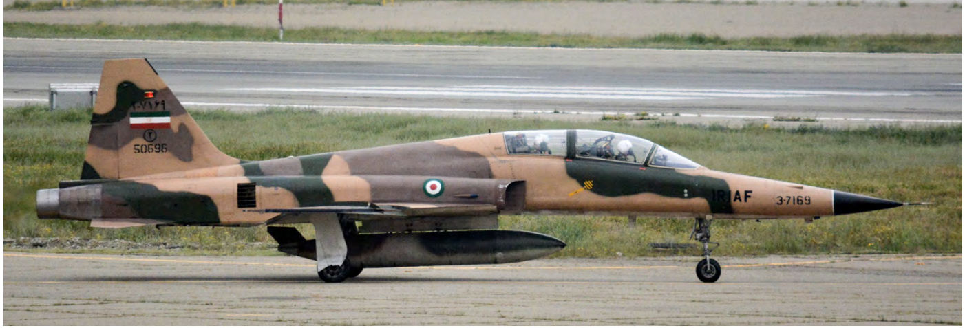
At the Armed Forces Day, several interesting military aircraft can be seen at Tehran-Mehrabad airport. F-5F 3-7169/50696 was among the very welcome visitors. It is wears 2nd Air Base markings, so it could still be with 21 TFS at Tabriz. (18 April 2019)

63-8540 ADTW ex 6 Hikotai 1040 mar19 13-8561 6 Hikotai ex IRAN(apr18) 1061 apr19