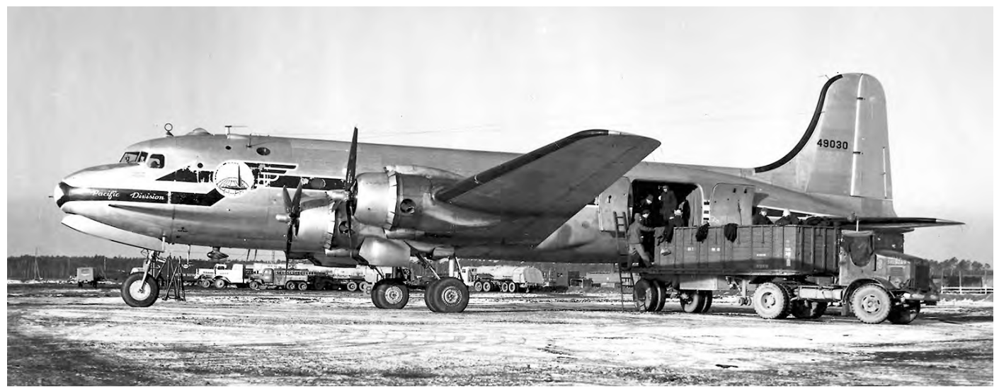
U.S. Air Force Pacific Division Douglas C-54E-1-DO Skymaster (s/n 44-9030) being unloaded during the Berlin Airlift. This aircraft was later converted to a C-54M and retired to the MASDC on 26 July 1965. Today it is on display at the USAF Air Mobility Command Museum, Dover Air Force Base (DE),USA.

With all the options for surface transport blocked, the only way was through the air. Unfortunately the Western Allies were only permitted the use of three air corridors. The Northerly corridor was used by the RAF to fly into Berlin,