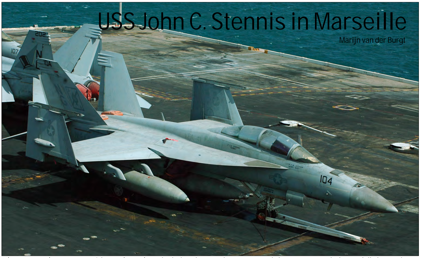
F/A-18F 166847/NG-104 is one of the 44 F/A-18E/Fs embarked on the USS John C. Stennis. It belongs to VFA-41 Black Aces. (All photos taken at Marseille, 28 April 2019,)

During the night from Friday 26 April to Saturday 27 April the huge nuclear powered aircraft carrier USS John C. Stennis (CVN-74) arrived in the port of Marseille for a five day visit.