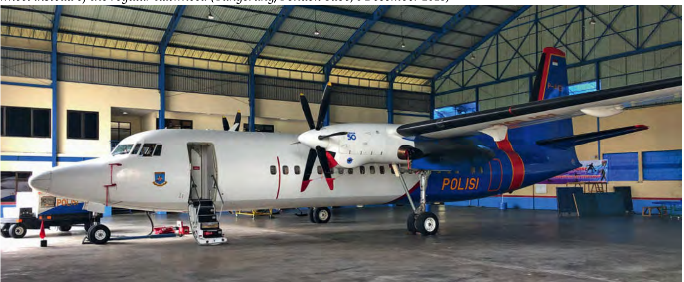
In 2004 the Police received this Fokker 50 P-4401 (than as P-2035) that had started its flying career with German operator DLT. (Tangerang/Pondok Cabe, 6 December 2018)