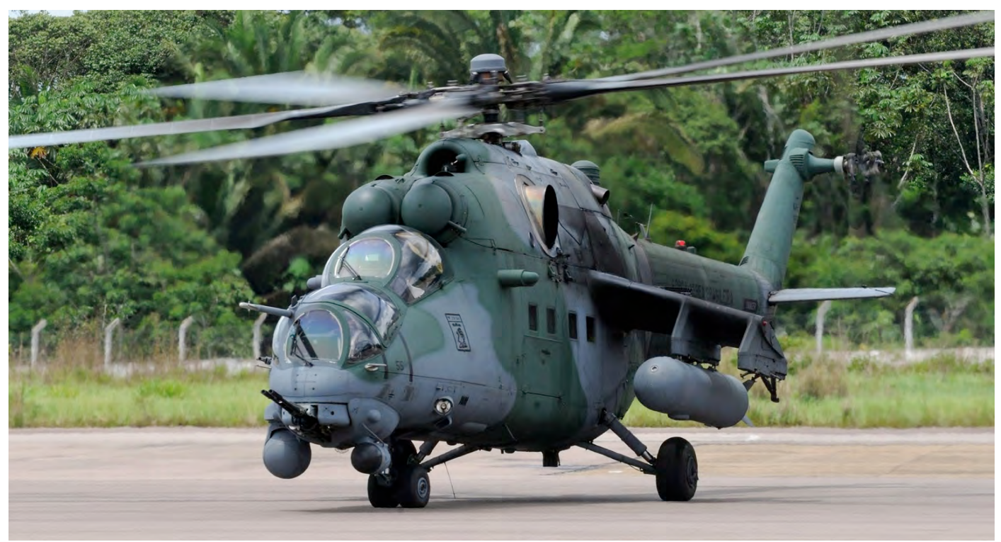
The first FAB 2^{\circ}/8^{\circ} GAv Mi-35M, called AH-2 locally, will be overhauled at Russian Helicopters new maintenance centre in Belo Horizonte. (8955, Porto Velho, 15 November 2011, Erwin van Dijkman)