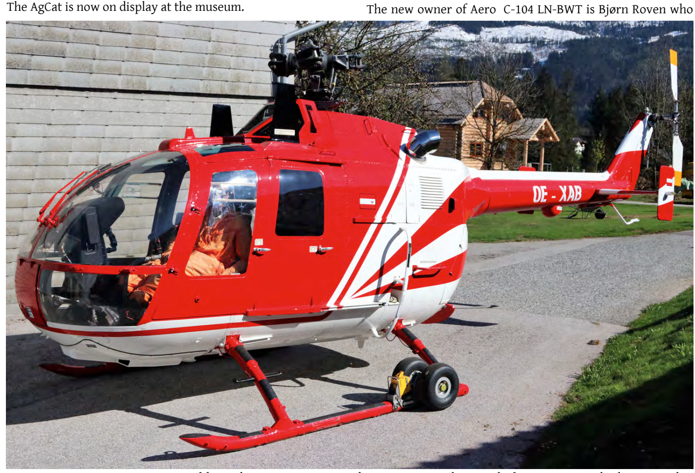
Former German Army Bo105M 80+35 in fake markings as OE-XAB at Autohaus Nemetz at Bad Mitterndorf in Austria. It used to be preserved on the roof of the company. (21 April 2019, Phil Adkin)