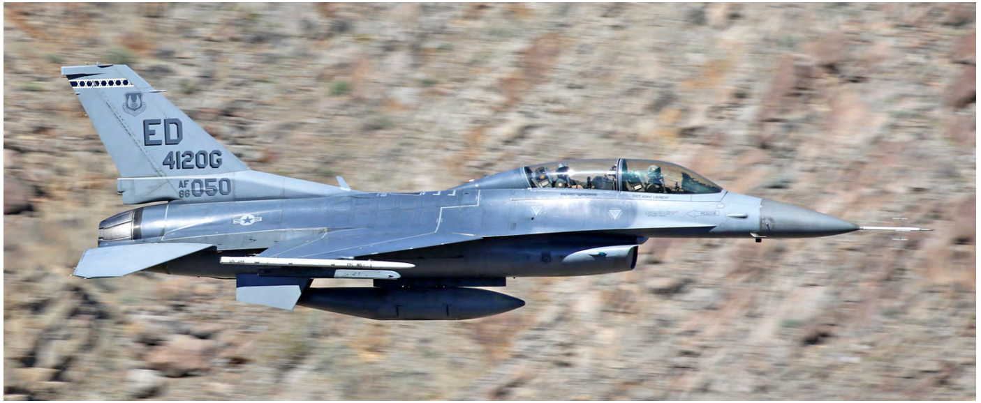
Aircraft from Edwards AFB are frequent visitor's of the Canyon at Death Valley. This is 412nd Operations Group CO-bird F-16D 86-0050/ED.