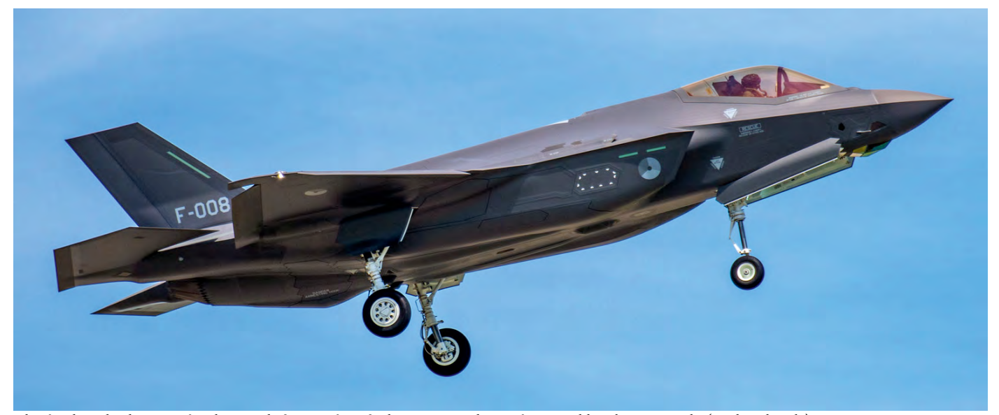
The final US-built F-35A for the Dutch flew its first flight on 16 April 2019 from Lockheed Fort Worth. (Carl Richards)

The ML bought 28 MiG-29s back in 1993 from Russia, but due to lack of money it was impossible to keep the fleet up to date. This resulted in storage for the first aircraft in 2010, slowly followed by all others. In 2010, only three MiG-29s had flown over 1,000 flying hours... in seventeen years!