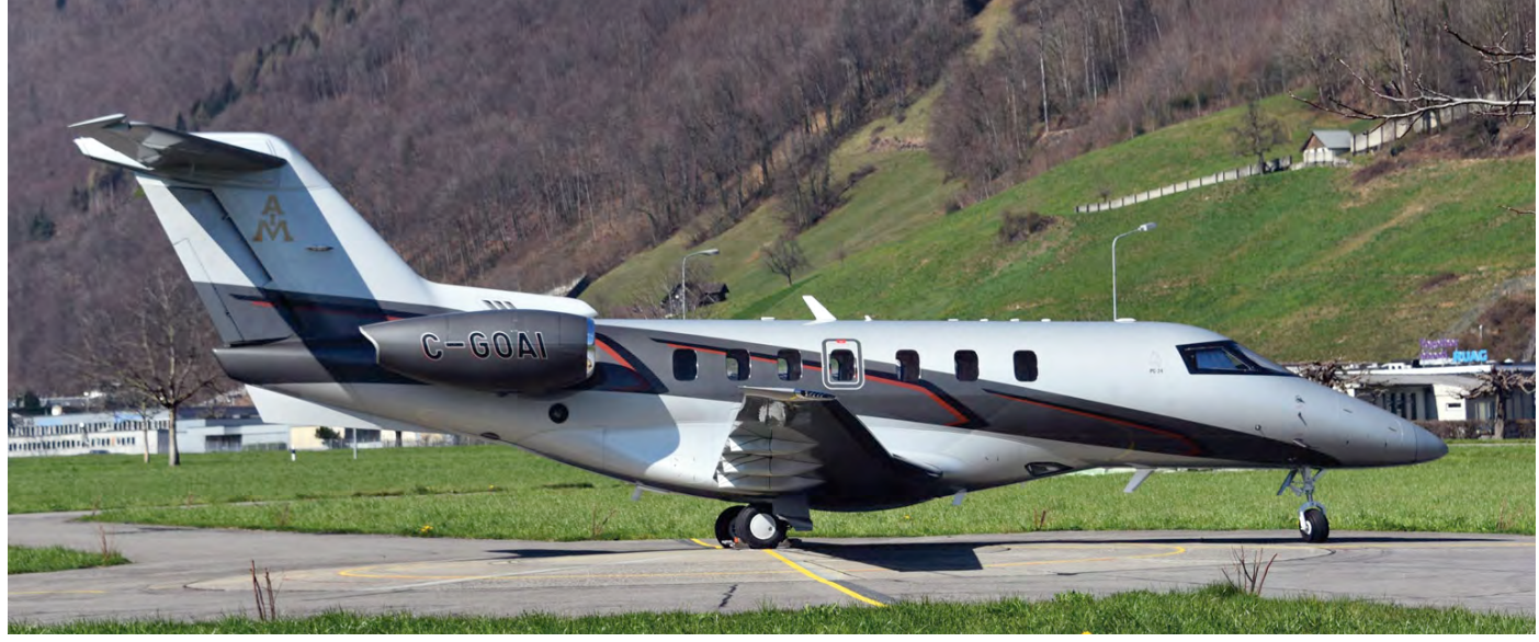
The first PC-24 which is already or will soon be delivered to a Canadian owner is this ex HB-VUJ with msn 135. The exact name of the owner is not known at this point but markings on the tail indicate the name or abbreviation AIM. (Stans-Buochs, 29 March 2019,)