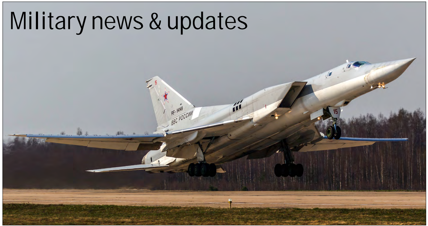
On the morning of April 22, in perfect sunny weather, the last training of the Victory Day Parade with a flight of the air group of 74 planes over Alabino took place (next two will be over Red Square). Among others, four plus reserve long range bombers Tu-22M3 took off from Shaykovka Air Base to join the main group. At the end of the training, the planes return back to the operational airfield.

Because of our standardization we sometimes use type, unit and serial presentations that may strongly differ from those used by the manufacturer or user. It is therefore possible that the information sent by you can deviate from the information we publish.