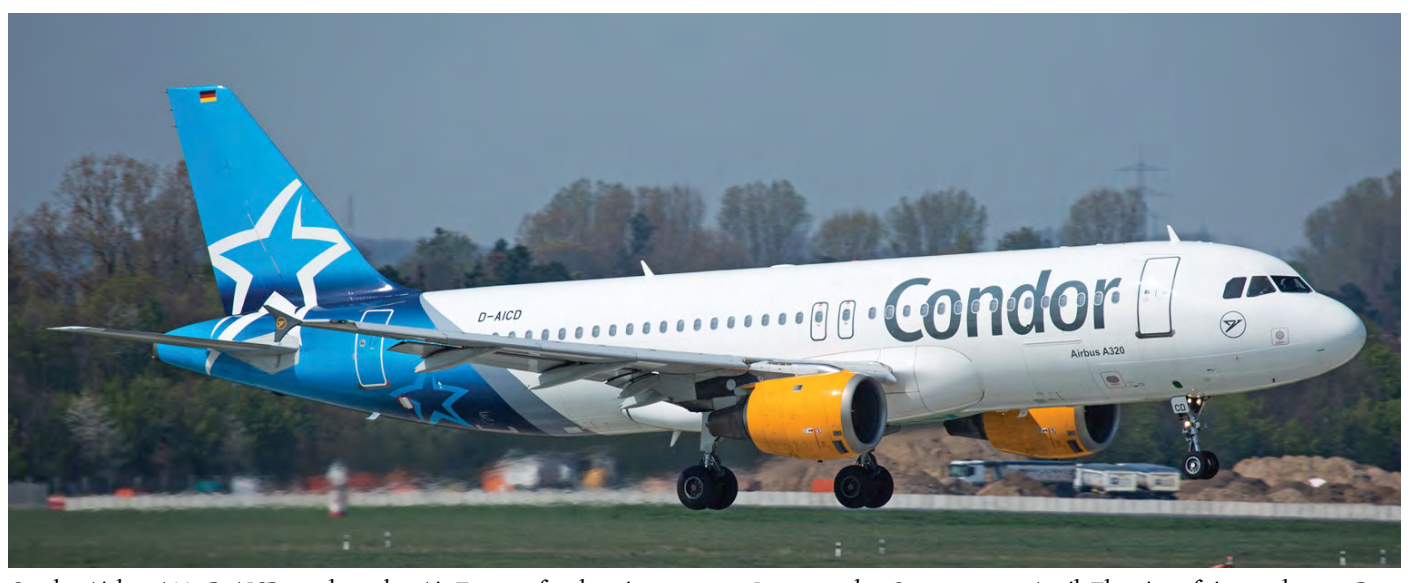
Condor Airbus A320 D-AICD was leased to Air Transat for the winter season. It returned to Germany on 9 April. The aircraft is seen here at Dusseldorf on 14 April with large Condor titles but still with AirTransat tail colours. (Marcus Steidele)