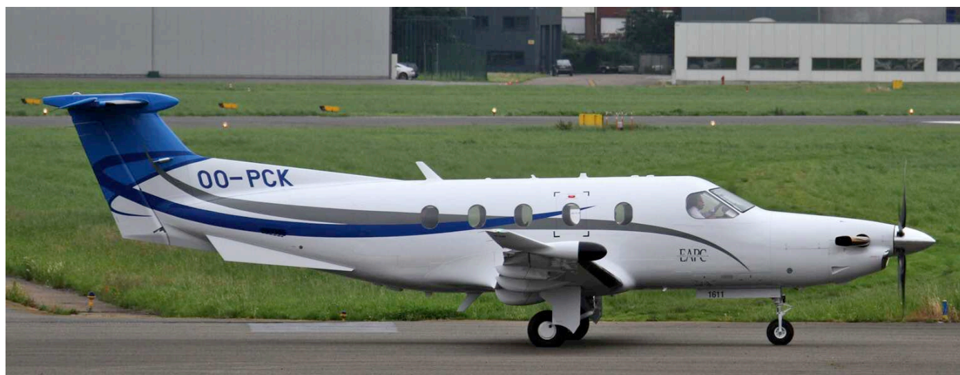
The European Aircraft Private Club is a cooperative company managing a fleet of aircraft for its shareholders. Pilatus PC-12 OO-PCK is the latest addition to the fleet. (Antwerp, 27 June 2016, Walter Van Brempt)