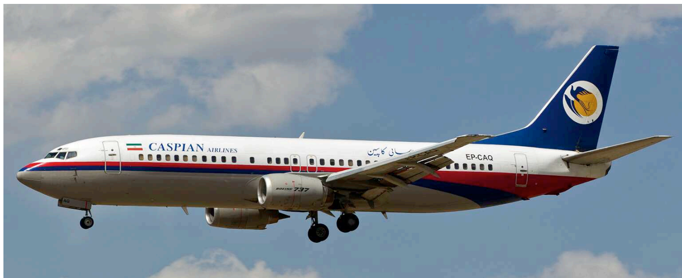
Caspian Airlines was founded in 1993 as a joint venture between Iranian and Russian business interests. It flies to destinations in Iran, Iraq, Turkey and the United Arab Emirates. EP-CAQ is one of two B737s in Service. (Tehran-Mehrabad, 30 May 2016)

For me a short meet and greet with all the guys because after two hours in the Terminal with a very good view on the ramp I boarded the first Iran Aseman Airlines Boeing 727 flight during this trip. In Iran I never asked about taking pictures on the ramp. At Shiraz they don't care anymore and in this case I had to take pictures of a lot of employees working on the ramp in front of the aircraft. The pilots already spotted me knowing I am one of those aviation geeks wanting to fly an "obsolete" Boeing 727 (EP-ASB). This flight I was treated like a popstar including a seat near the engines on row 29 including a visit to the flight deck at Mehrabad airport. When I left the airplane on the Iran Aseman ramp I saw the garden full of stored Hercules aircraft in front of me screaming for some very nice pictures but this time the security guy on the ground didn't like the idea. Again I had to delete pictures but thankfully only the ones I made of the Hercules aircraft. The rest of the afternoon was again for photography with a third