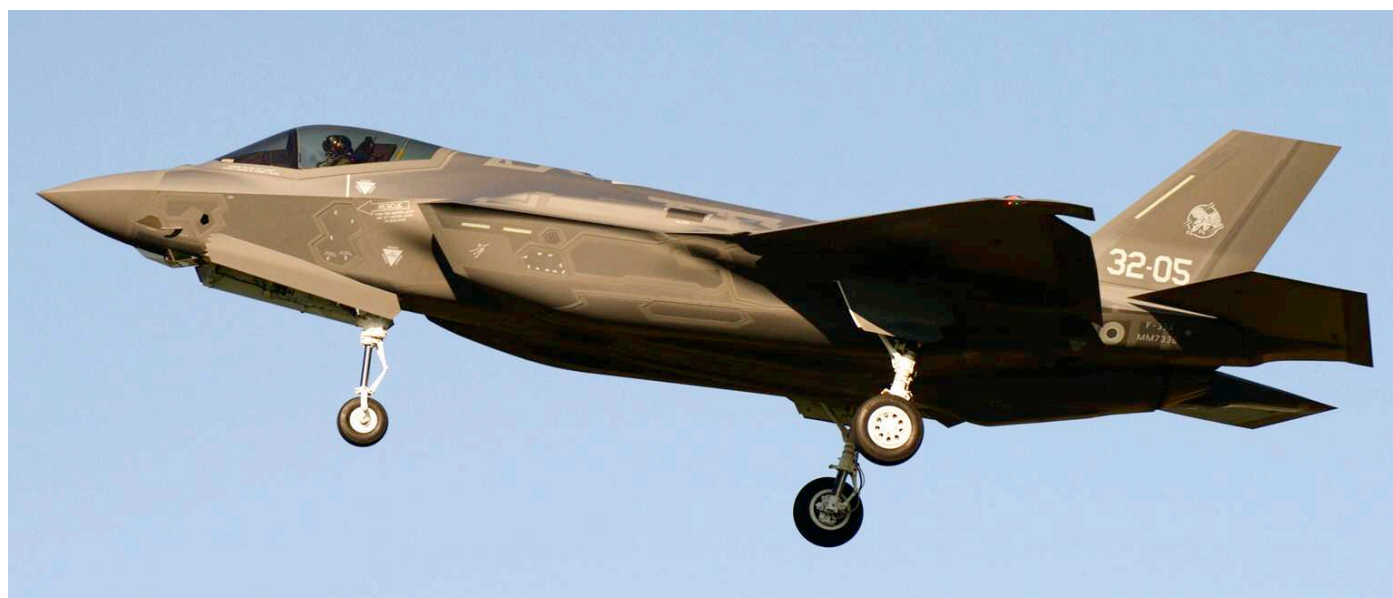
The fifth Italian manufactured F-35A was caught during landing at the Italian F-35 manufacturing plant at Cameri.

2002-2016 on their tails. At Nancy the renaming of ETD02.007 to ETD04.003 has taken place in May 2016