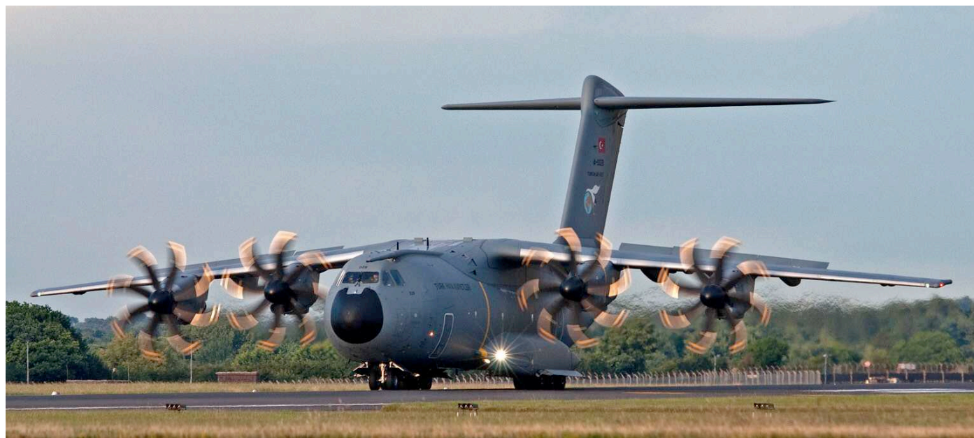
Photographed while lining up at the runway of Mildenhall was the latest addition for the Turkish Air Force transport fleet, A400M 14-0028. (11 July 2016,).