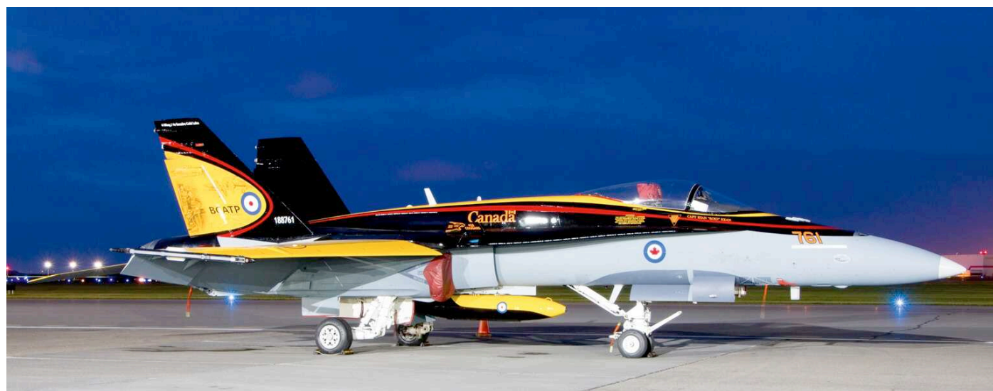
Each year the Royal Canadian Air Force paints their demo Hornet in a different paintscheme. This year CF-188 188761 is painted to honour the efforts of the British Commonwealth Air Training Plan. This training programme trained 131,553 aircrew for the Commonwealth and other nations between 1939 and 1945, a massive undertaking! (Calgary, 6 June 2016,)

Troops assigned to Task Force Spearhead (3-227th AVN) returned home to Fort Hood (TX) on 14 July 2016. Their UH-60L Black Hawk helicopters started to arrive around the same time in Bremerhaven (Germany) for sea shipment back to the Continental United States. During April 2016, ten UH-60M helicopters assigned to C/3-501st AVN already arrived at Ramstein AB (Germany) as air freight on board USAF C-5M Galaxy transport aircraft. Twenty-one addi-