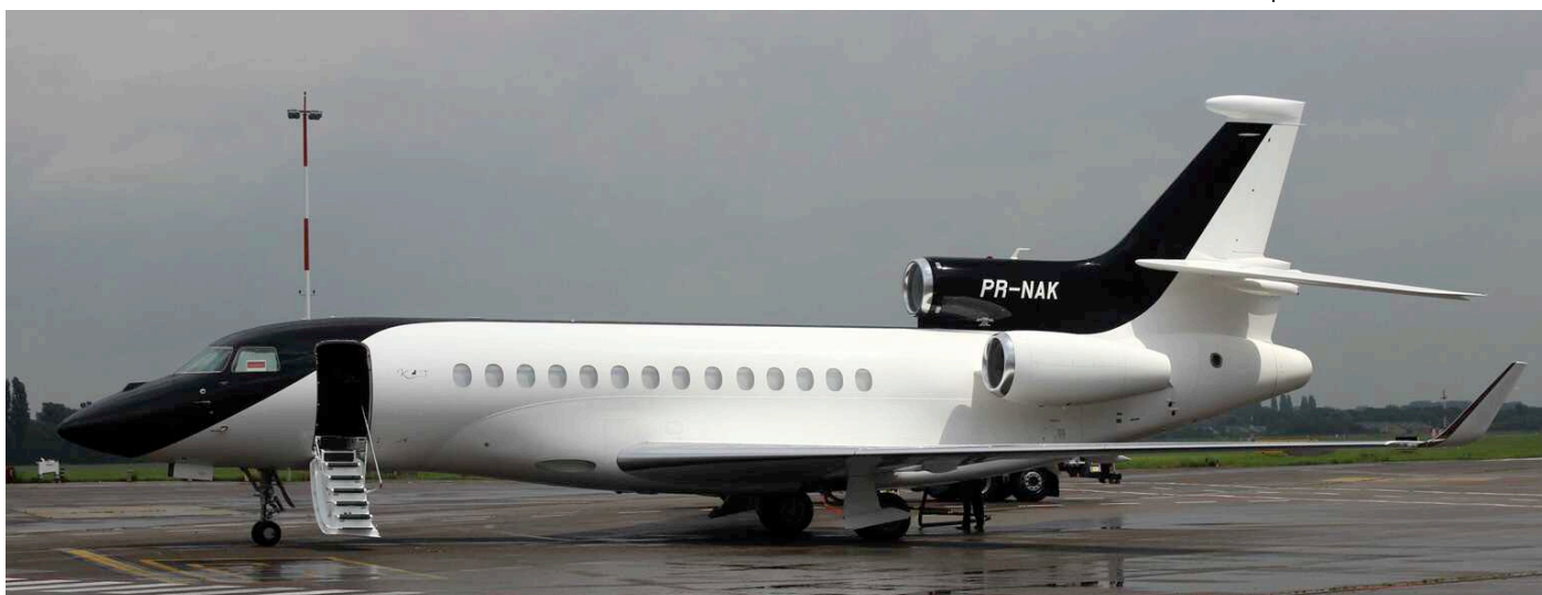
Falcon 7X PR-NAK was factory fresh delivered to Monza Negócios e Participações in December 2013. (Antwerp, 13 June 2016, Paul Soons)