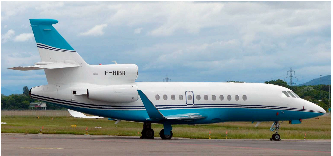
Visiting Geneva is always good for seeing many visiting business-jets and -props, also for good photo opportunities at both sides of the only runway they have. This Falcon 900LX with registration F-HIBR is operating for Dassault Aviation since May this year. (Geneva, 23 May 2016,)