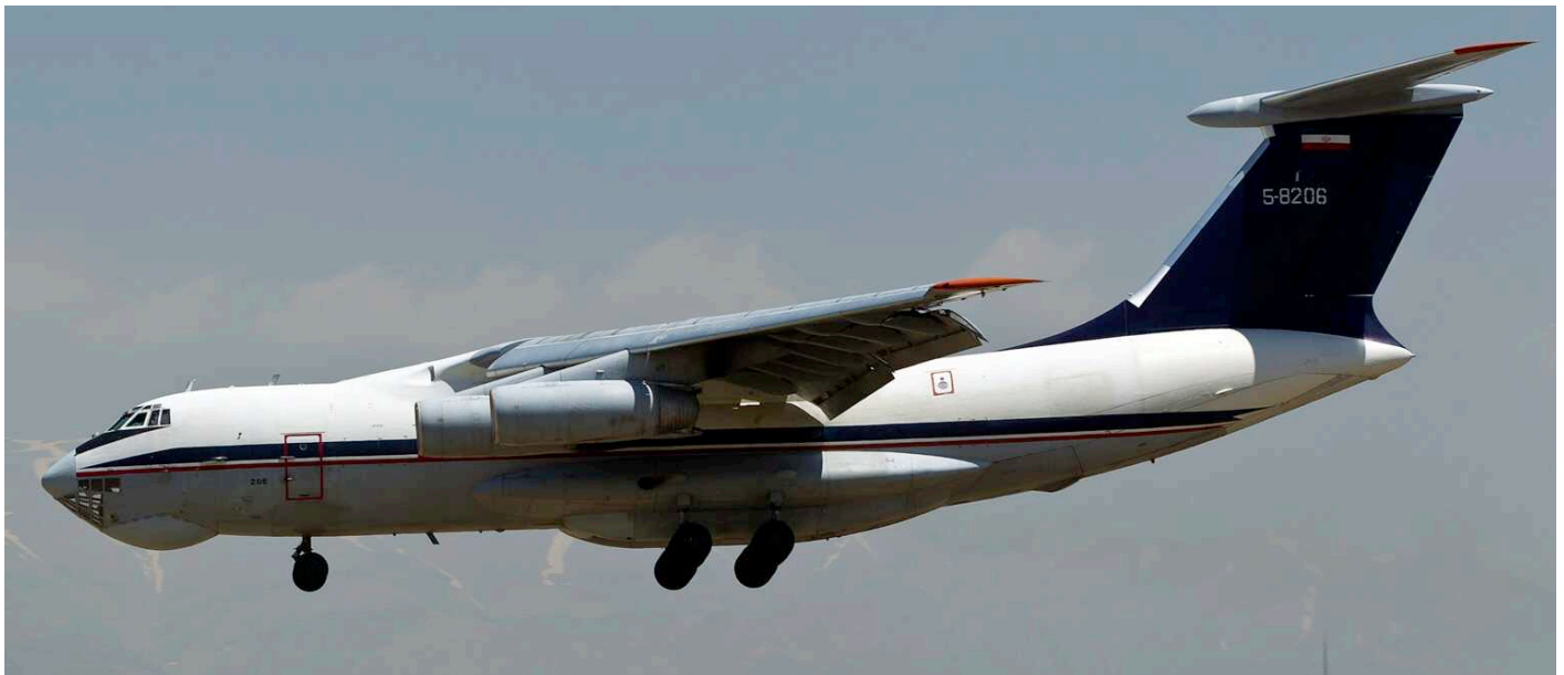
Tehran-Mehrabad is the Islamic Republic of Iran transport hub, however the Ilyushin 76 5-8206 is a nice visitor, as the home base for the Candid fleet is Shiraz-Shahid Dastghaib. (28 May 2016,)