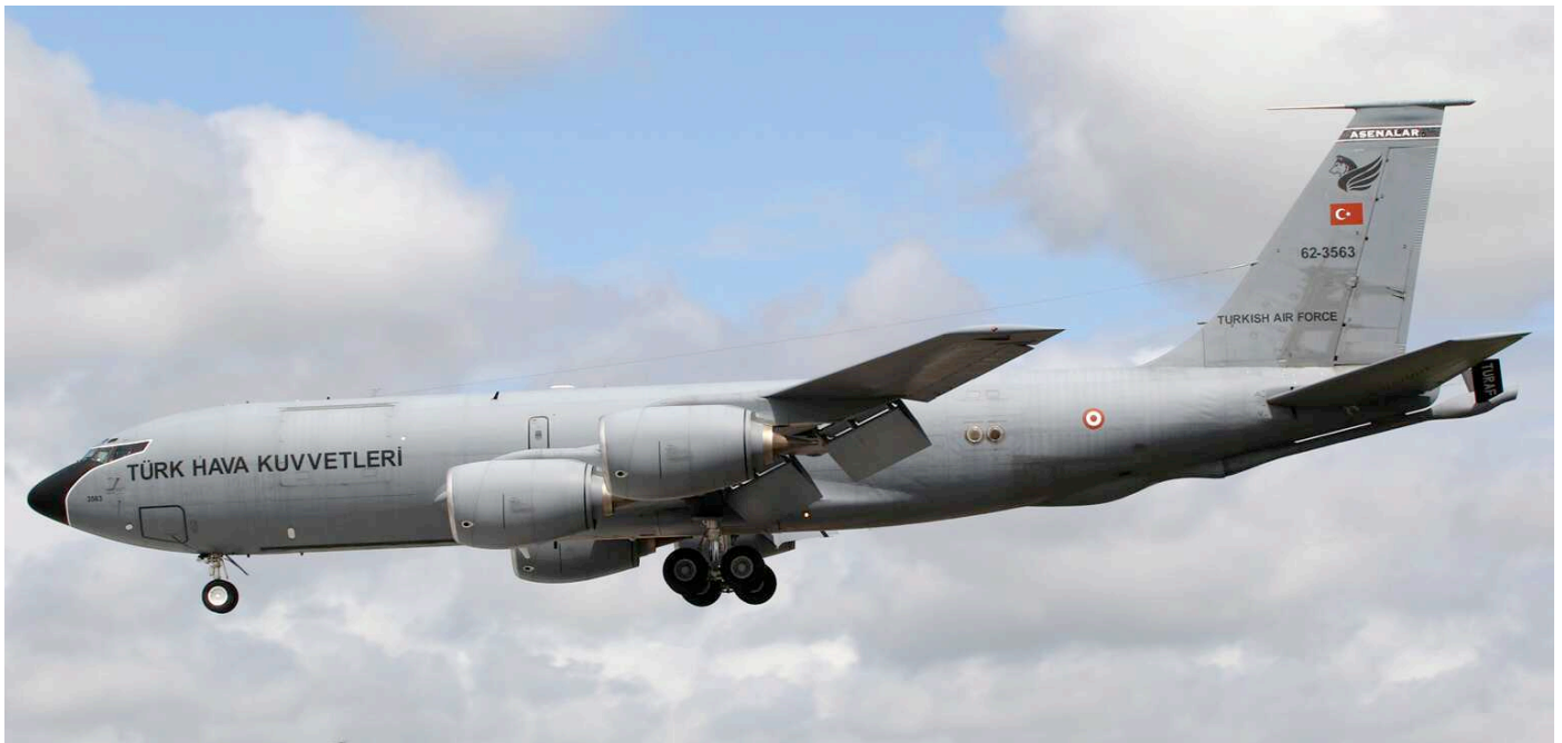
The Solo Turk demonstration team was dragged in from Turkey by THK KC-135R 62-3563. Less than within a week both Akinci, the home base of the F-16s, and Incirlik, the home base of the KC-135, were heavily involved in the coup attempt in Turkey which crushed the careers of many THK personnel. (Fairford, 11 July 2016,)