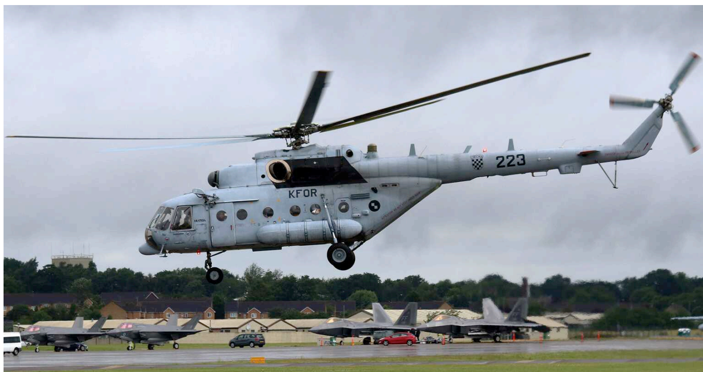
Another first timer at the RIAT was this Croatian Air Force Mi-171Sh based at Zagreb. The helicopter is one of a batch of ten new aircraft that were delivered in 2007/2008. (Fairford, 11 July 2016, Toon Cox)