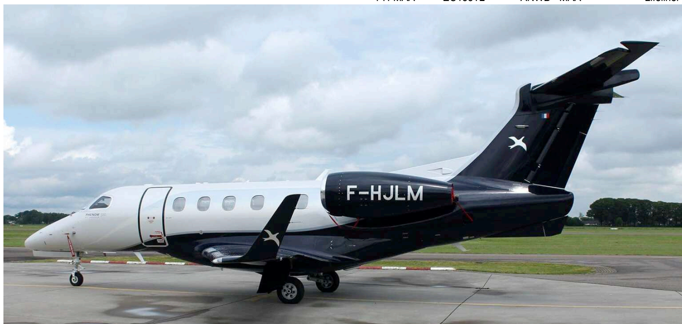
Phenom F-HLJM is registered to Brit Aero in Paris. On the same adres "La Mémoire de Paris" is located. This Embraer 505 was delivered in September 2015. (Deventer-Teuge, 15 June 2016, Ivo de Groot)