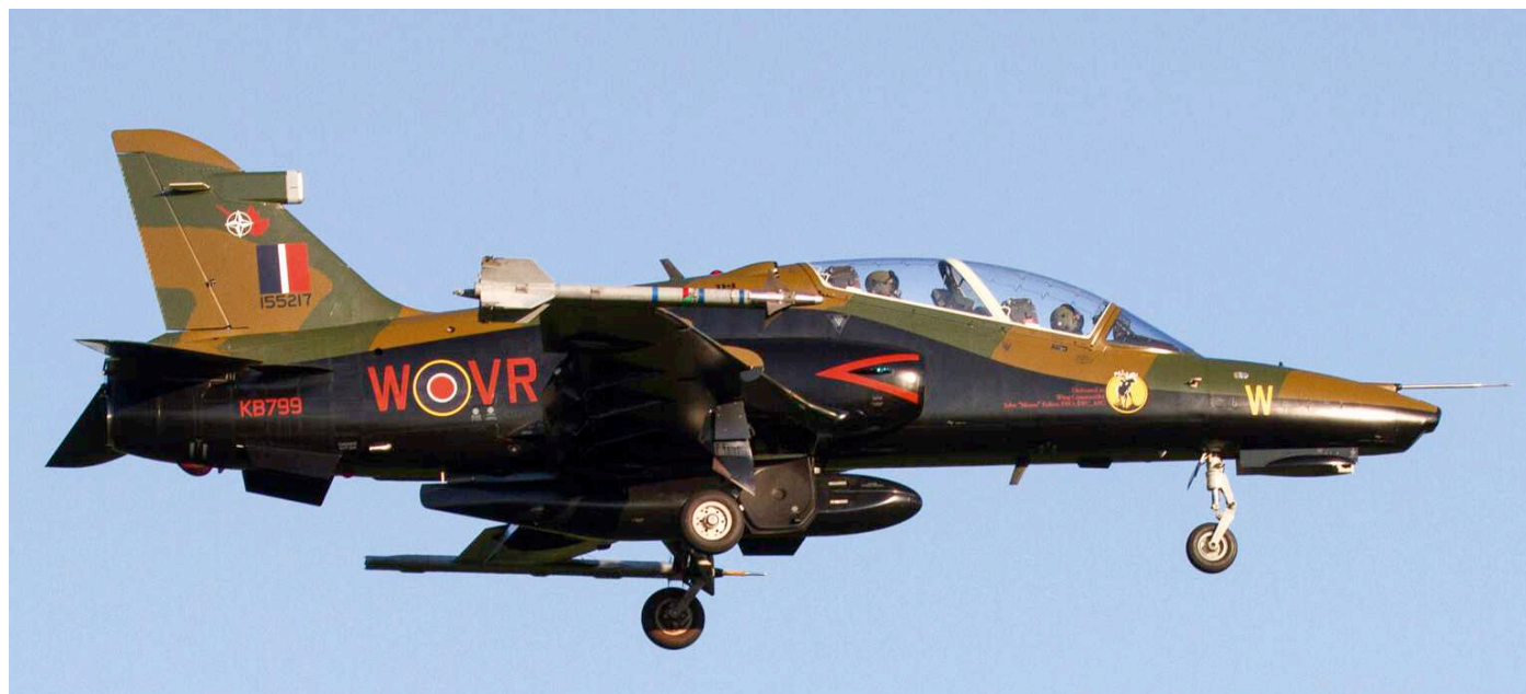
Another special Canadian colourscheme. CT-155 155217 is painted to celebrate the 75th anniversary of 419 Squadron. The code "VR-W" (inverted as "W-VR" on the right side) represents the Wellington bomber flown by the first squadron commander. Serial KB799 and the moose art signify the Lancasters operated by the unit. (Trenton, 23 June 2016,)

tional UH-60M Blackhawks arrived as sea freight at Bremerhaven (Germany) around 14 July 2016. These helicopters are believed to be assigned to A/3-501st AVN and B/3-501st AVN and five additional examples were not offloaded but shipped to the Baltic.