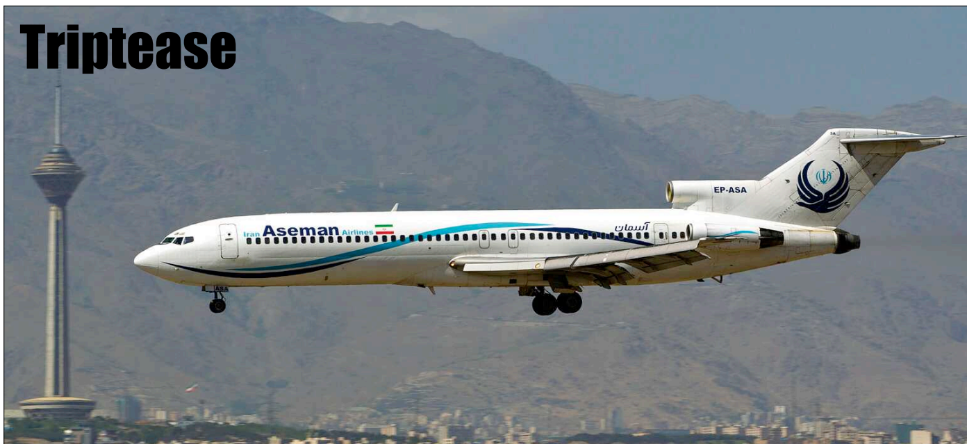
One of the few airlines to fly with the B727 is Iran Aseman Airlines. EP-ASA is part of their fleet and André Alders was able to capture it on final approach on 28 May 2016 (Tehran-Mehrabad).