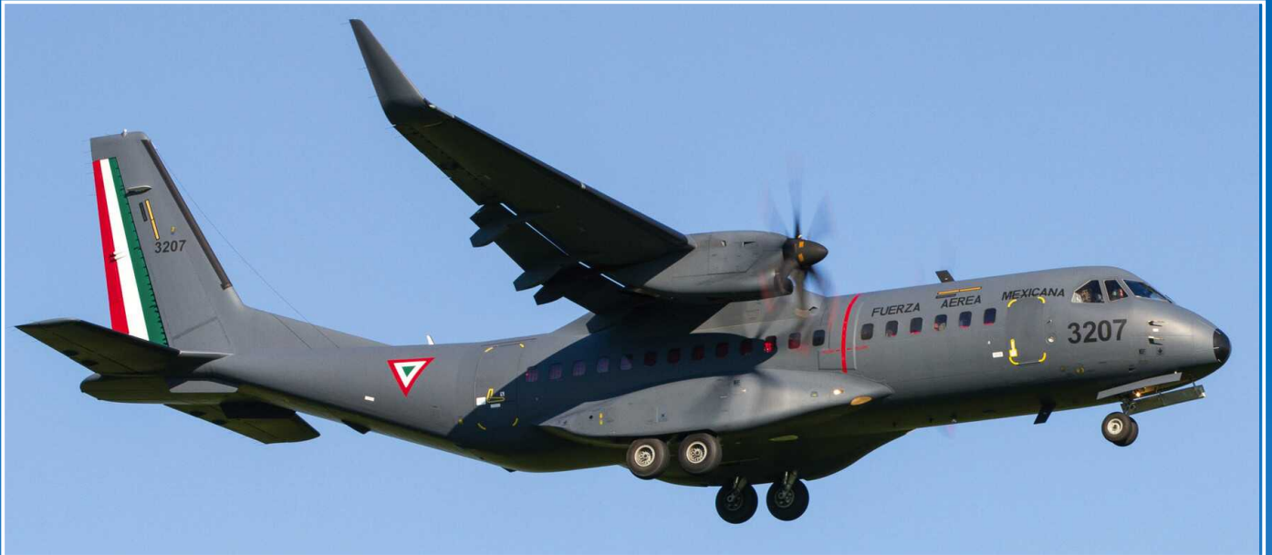
Probably not a daily visitor at CFB Trenton is this Mexican Air Force C295W 3207. (CFB Trenton (ONT), 24 June 2016,)