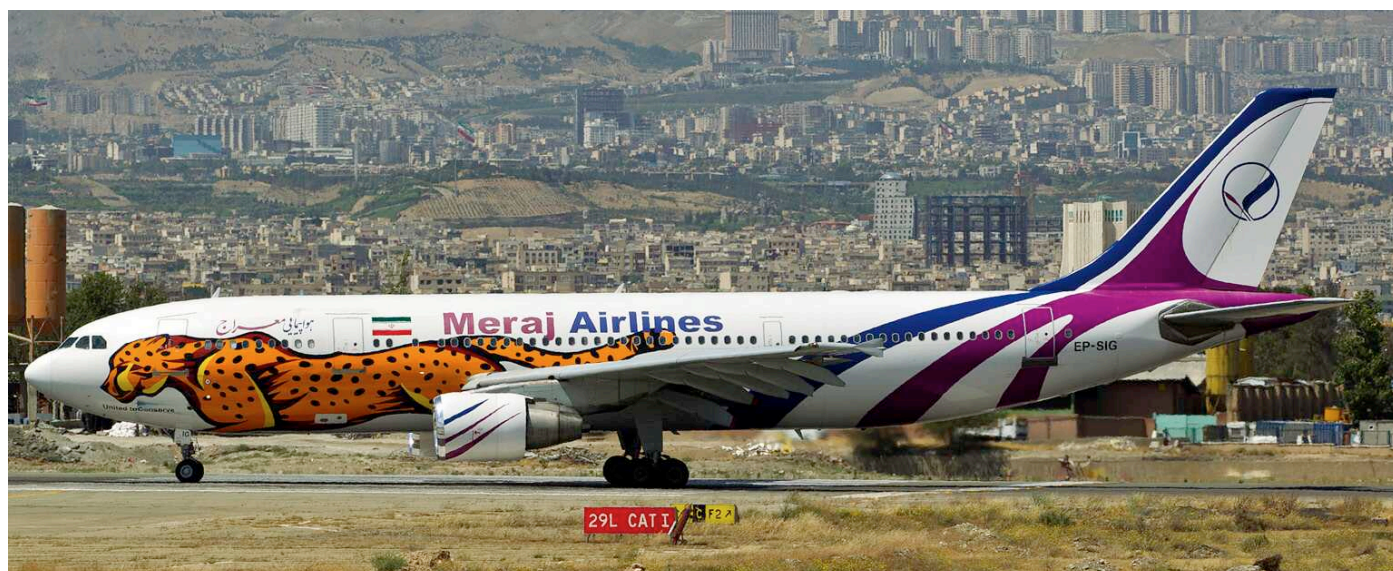
This special tiger A300B4-622R, registered EP-SIG, is operated by Meraj Air. Via the People's Republic of China and South Korea it ventured into Iran. (Tehran-Mehrabad, 30 May 2016,)

Iranian spotter. I took some pictures of a departing Iran Air Force B747-131F (5-8103) which could have been our joyflight today?