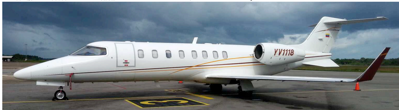
This learjet 45 was previously used as N396GC by the Citgo Petroleum Corporation, an indirect wholly owned subsidiary of Petróleos de Venezuela. In 2009 it was transferred to the parent company as YV1118. (Paramaribo, 25 June 2016,)