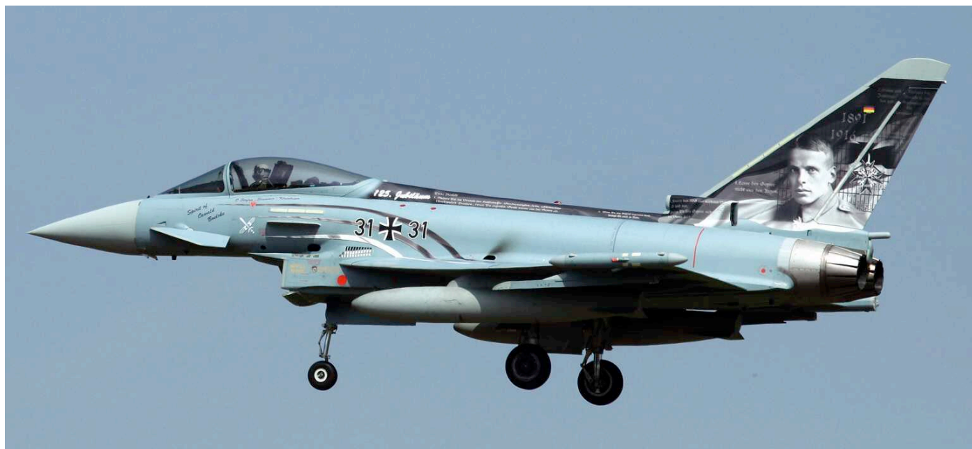
Rolf Flinzer was lucky to catch EF2000 31+31 on its first flight with this special tail of flying ace Oswald Boelcke. (Nörvenich, 21 July 2016)

From the Mirage 2000D front we can report that after fourteen years EC03.011 Corsica at Djibouti no longer uses the aircraft and only has Mirage 2000-5Fs. In June Mirage 2000Ds 603 and 623 were seen with their codes removed and replaced by shark mouths. They also carried large red banner with