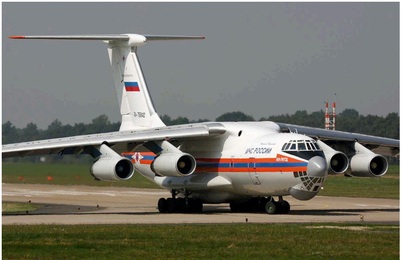
Il-76 RA-76840, operated by the Russian Ministry of Emergency Situations (or abbreviated as MchS Rossii in Russian, as you can see in the picture), disappeared from radar on 1 July 2016 after departing Irkutsk to extinguish a number of fires burning about fifty miles from the city, in the Bayanday district of the Irkutsk region. Early reports and speculation is that the aircraft made its drop and then turned into rising terrain. Visibility at times were reportedly down to zero. The Ilyushin is seen here at Geilenkirchen on 10 August 2009 by Arjen Sleuwenhoek.

The Sukhoi 22 of the Syrian Arab Air Force, conducting a training flight out of Dmeir AB, crashed under unknown circumstances near Jayrud. There are conflicting reports about a technical failure of the fighter or that it was downed. The pilot managed to eject and is said to have been captured.