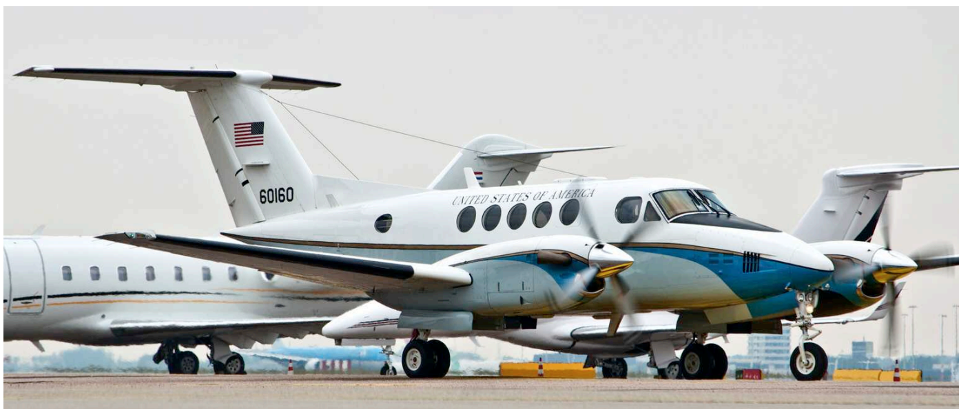
The United States Air Force still uses around sixteen C-12C. Many of these are at least 40 years old, but still going strong after all these years. They are mainly used to support embassies around the world. 76-0160 is in use with the Budapest embassy since early 2016. (Amsterdam-Schiphol, 1 June 2016, Gideon van Dijk)