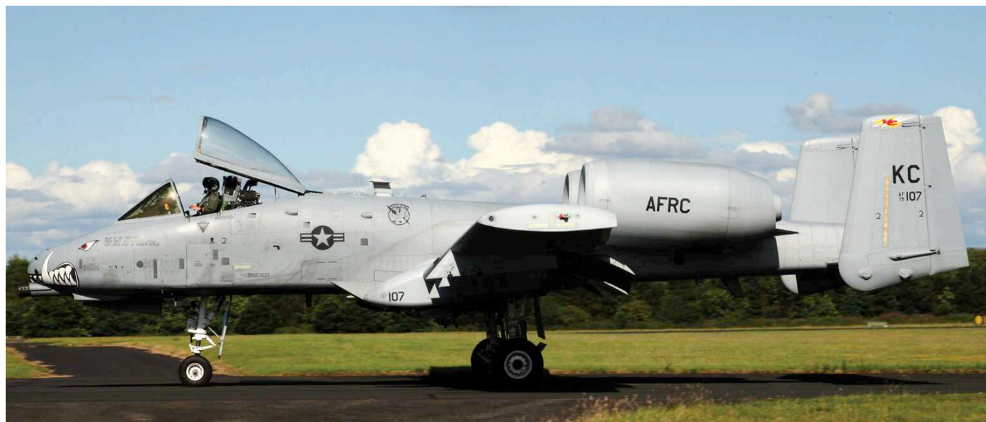
In July a special operations exercise took place in the northern part of the UK. Participating were eight AFRC A-10's from the 303rd FS at Whiteman AFB in Missouri. After the exercise the aircraft relocated to Estonia for further exercises. (Leeming, 18 July 2016,)