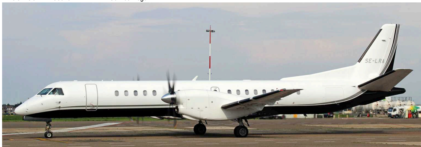
Although registered to SAAB, this Saab 200 is partially being operated by Almedalsflyget on seasonal charter flights. (Antwerp, 7 June 2016,)

Credits: ASA Belgium vzw, Luchtzak.be forum.