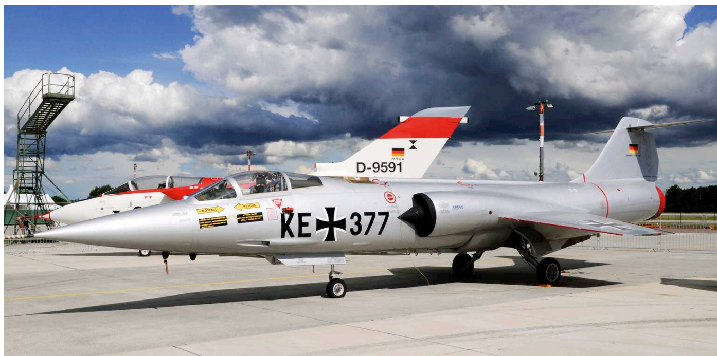
The static display at the Airbus Defence & Space Familientag at Manching included some historical aircraft. F-104G KE+377, c/n 7077 and ex 22+07, restored by Airbus in its original silver colours. (Manching, 18 June 2016, Martin Bach)