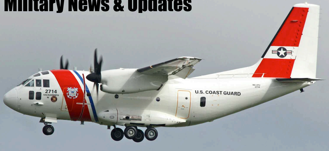
The US Coast Guard has brought its latest HC-27 with serial 2714 to the 2016 Farnborough Airshow. The USCG started operating with the Spartan only two months earlier at Sacramento air station. (Shannon, 18 July 2016, Malcolm Nason)

Because of our standardization we sometimes use type, unit and serial presentations that may strongly differ from those used by the manufacturer or user. It is therefore possible that the information sent by you can deviate from the information we publish.