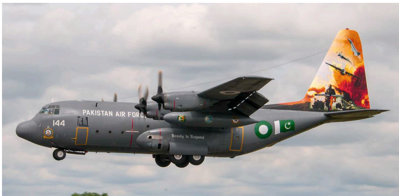
Returning to the RIAT for the 2016 edition was the Pakistan AF with one of its C-130s which was actually a L100-30. Unfortunately the aircraft was the same aircraft as the one in the 2006 edition of the RIAT. This year the Pakistan AF won the Concour de Elegance trophy. (Fairford, 6 July 2016, Ron Skinkis)