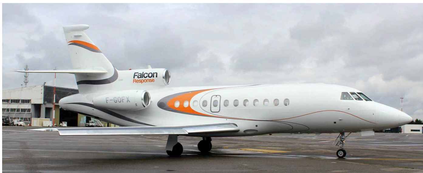
FalconResponse is an expanded AOG support services launched by Dassault in May 2015. Falcon 900 F-GOFX is the aircraft used for this service, being operated by Dassault Falcon Services. (Antwerp, 15 June 2016,)