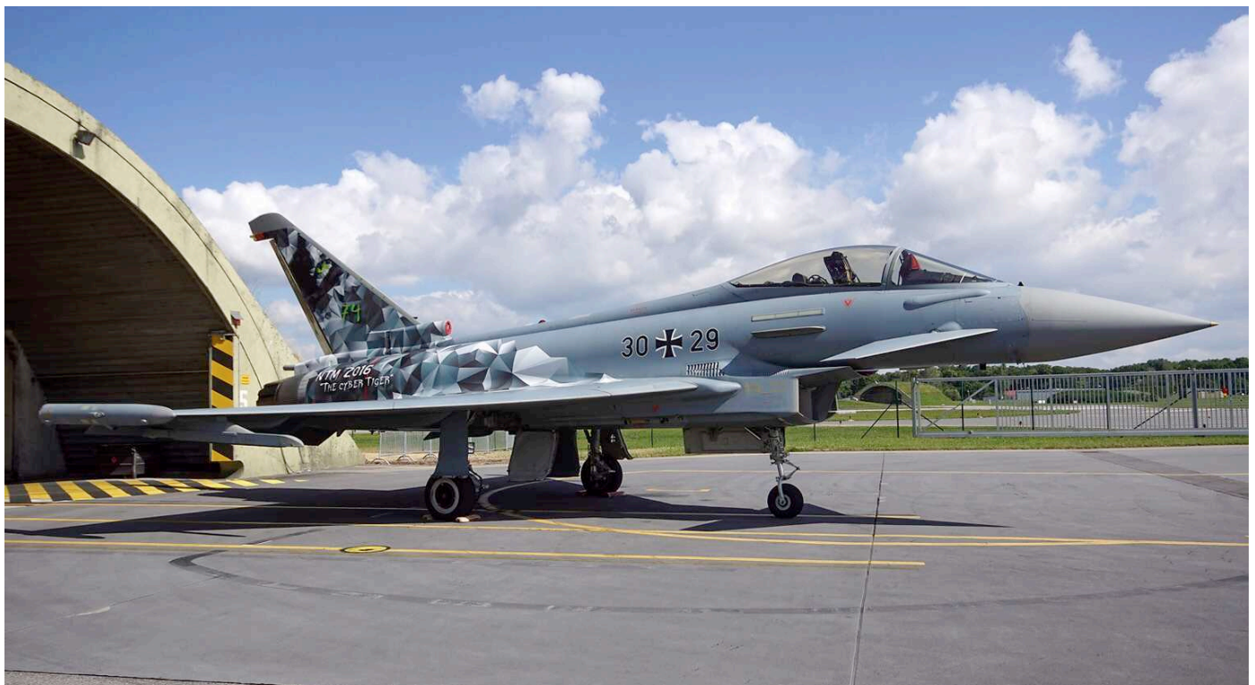
TLG74 painted EF2000 30+29 for this year's NATO Tiger Meet at Zaragoza. The aircraft participated in various events afterwards including the Tag der Bundeswehr at its home base Neuburg. (Neuburg, 10 June 2016)

30+73 EF2000 TLG 73 $ 44+79 Tornado IDS nm $ J-008 F-16AM 313sq J-136 F-16AM 313sq ZK030/U Hawk T2 4(R)sq ZG777/135 Tornado GR4 nm 2369/CHB AS532UL n.n. 56/2-EG Mirage 2000-5F EC01.002