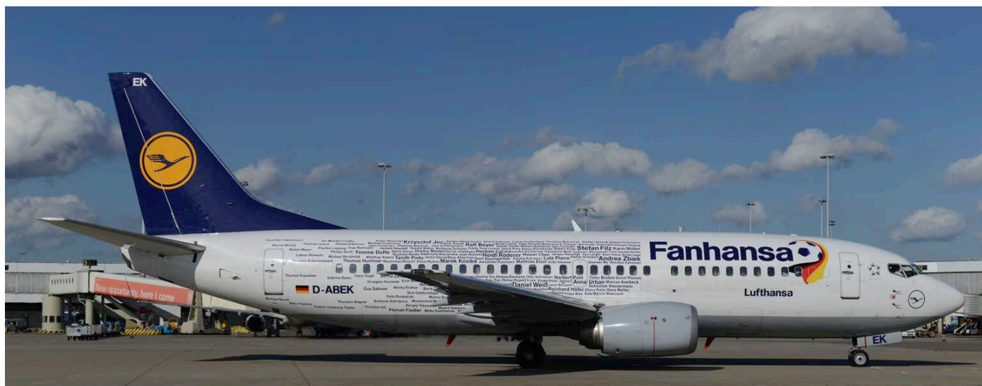
This 1991 Boeing 737 is one of the last seven of the type in the Lufthansa fleet. D-ABEK operated its first flight in the Fanhansa livery on 6 June, transporting the German national team to Chambéry Savoie Airport. The next day the aircraft operated its first regular passenger service from Frankfurt to Munich. (Amsterdam-Schiphol, 27 June 2016, Ton Jochems)