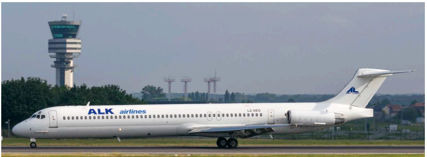
ALK Airlines is a Sofia, Bulgaria based airline, founded in 2016. Its sole aircraft is MD-82 LZ-DEO although it is rumoured that the company will take delivery of several Fokker aircraft. (Brussels, 9 June 2016, Wouter Cooremans)