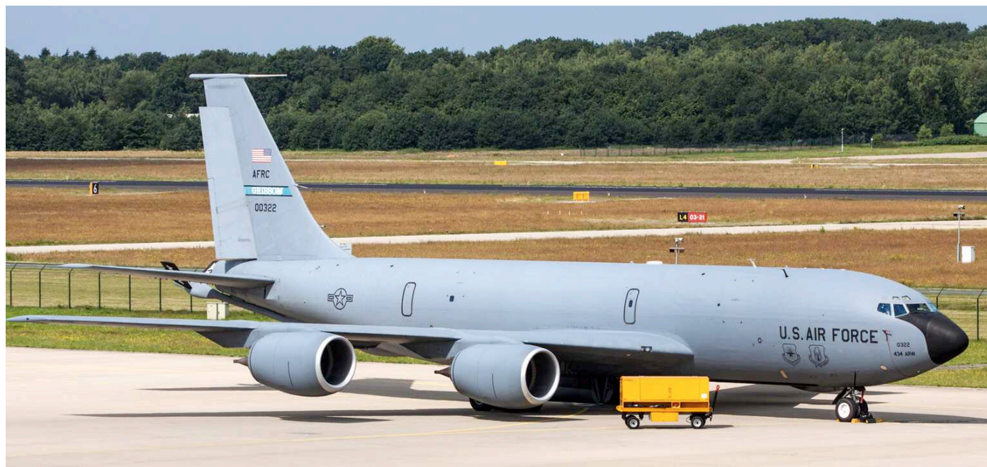
The 72nd Air Refueling Squadron is a United States Air Force Reserve squadron, assigned to the 434th Operations Group. KC-135R 60-0322 had departed Powidz, Poland and was routing westbound when the aircraft experiencing technical difficulties. Loosing navigational equipment including autopilot caused it to divert to Eindhoven. (Eindhoven, 19 June 2016, Hermen Goud)