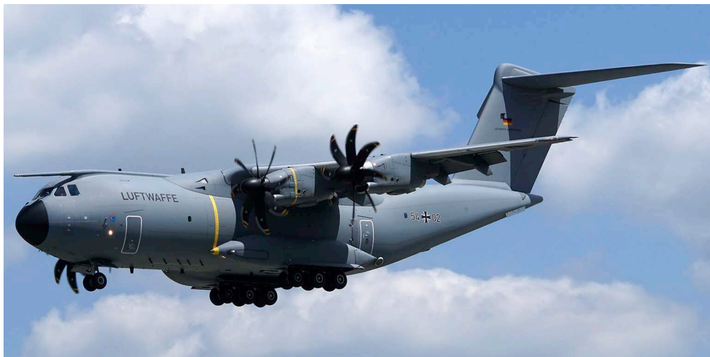
A400M 54+02 is one of four A400s that have been delivered to the Luftwaffe so far. The 54+02 is seen here landing at Neuburg for this year's Tag der Bundeswehr. (Neuburg, 10 June 2016, Lukas Kinneswenger)

40+58 Alpha Jet A AWS 41+06 Alpha Jet A AWS TGrp31/HFWS mks (80+10) Bo105M AWS Outside (87+10) ? Bo105P AWS 91+62 P149D AWS HFWS badge