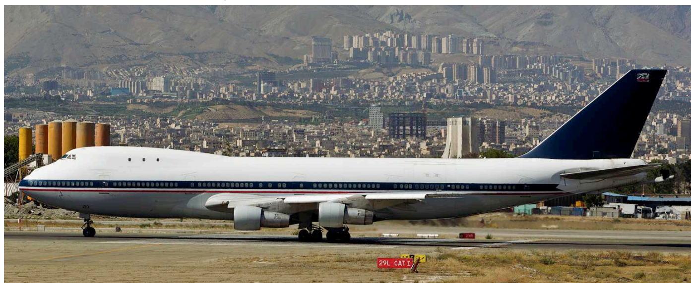
The Iranian Air Force still has five Boeing 747s operational out of at least 34 airframes, delivered during and after the rule of the Shah. One of them is B747-131F 5-8103. (Tehran-Mehrabad, 28 May 2016,)