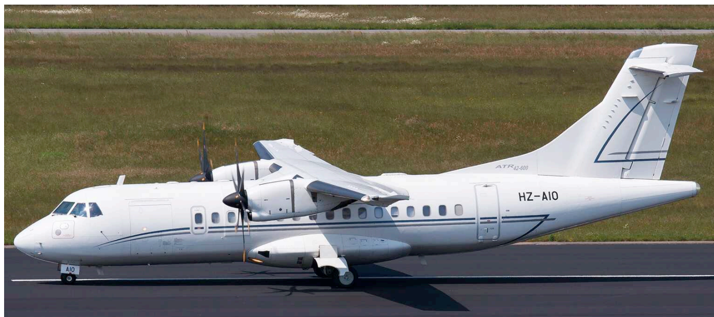
Alpha Star Aviation Services is a Riyadh, Saudi Arabia based company. ATR42 HZ-A10 has been part of their fleet since October 2012. (Woensdrecht, 7 June 2016,)

31. PH-PXF EC135P2+ Nationale Politie ZXP06 PH-PXY AW139 Nationale Politie ZXP25