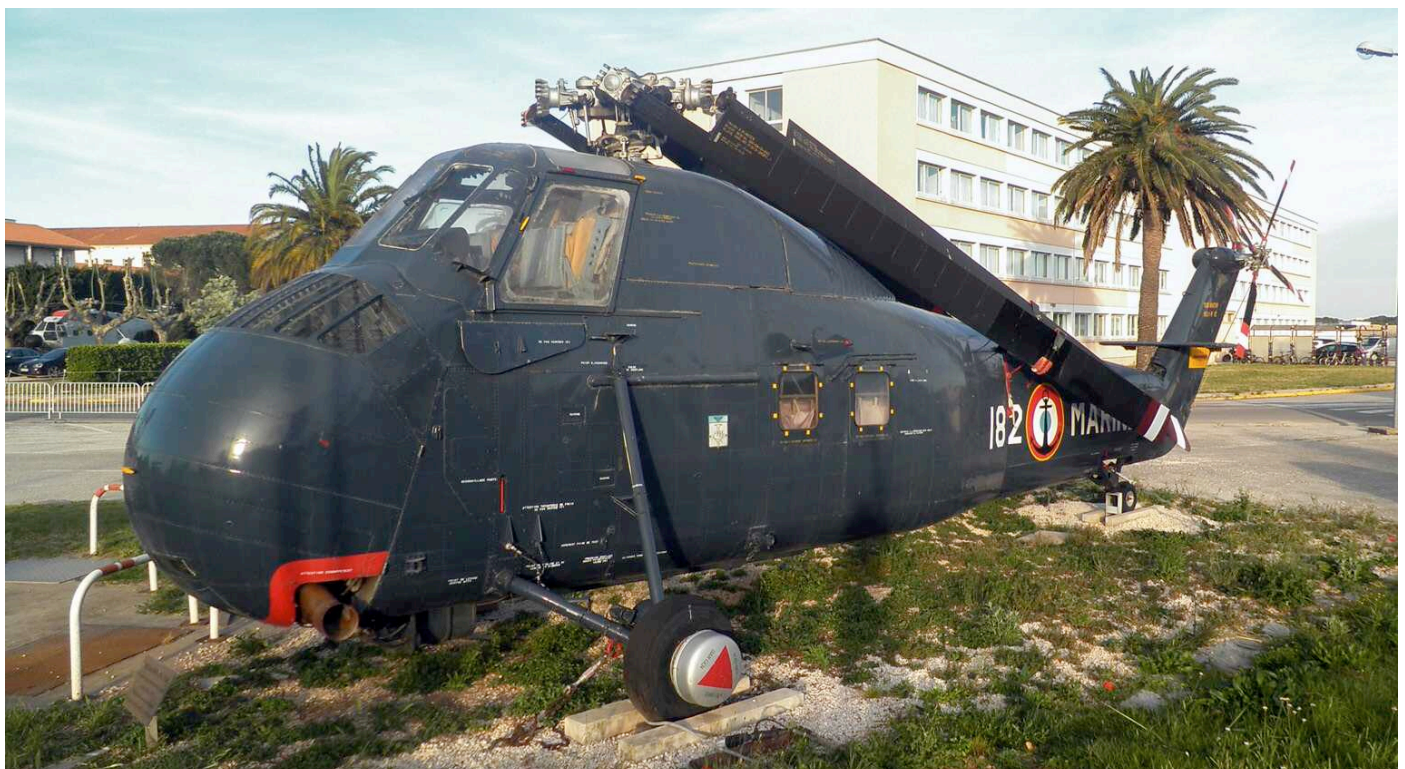
Preserved at Hyères-La Palyvestre is this HSS-1 182