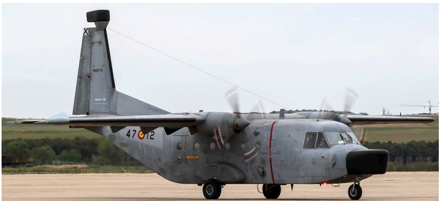
A nice taxi shot of a seldom seen C-212 ELINT with serial TM.12D-72 was taken at his home base Torrejón de Ardoz. (5 May 2016,)

In June 2015, ZK013/D was last reported active with 4(R)sq, since then it was first reported stored at RAF Valley. Since February 2016, it was reported with the Hawk Service Flight (HSF) at RAF Valley being restored for service. In June 2016, it was reported active again with 4(R)sq.