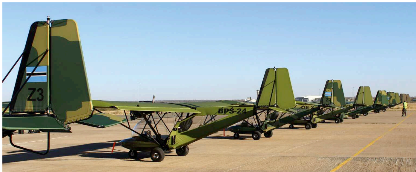
The newest aircraft in the inventory of the Botswana Defence Force is the Bat Hawk C. The ones marked as 'OE-x' with the camouflaged tails are from the Air Force, the ones marked as 'BPS-x' with the light green tails are from the Botswana Police Service and the ones at the end of the line with the drab green tails are from the Wildlife and National Parks Department, marked as 'WNP-Bx'. (Francistown, 17 June 2016, Micro Aviation)

flaged tail boom. Aircraft OE-5 had no Botswana flag on the tail on delivery.