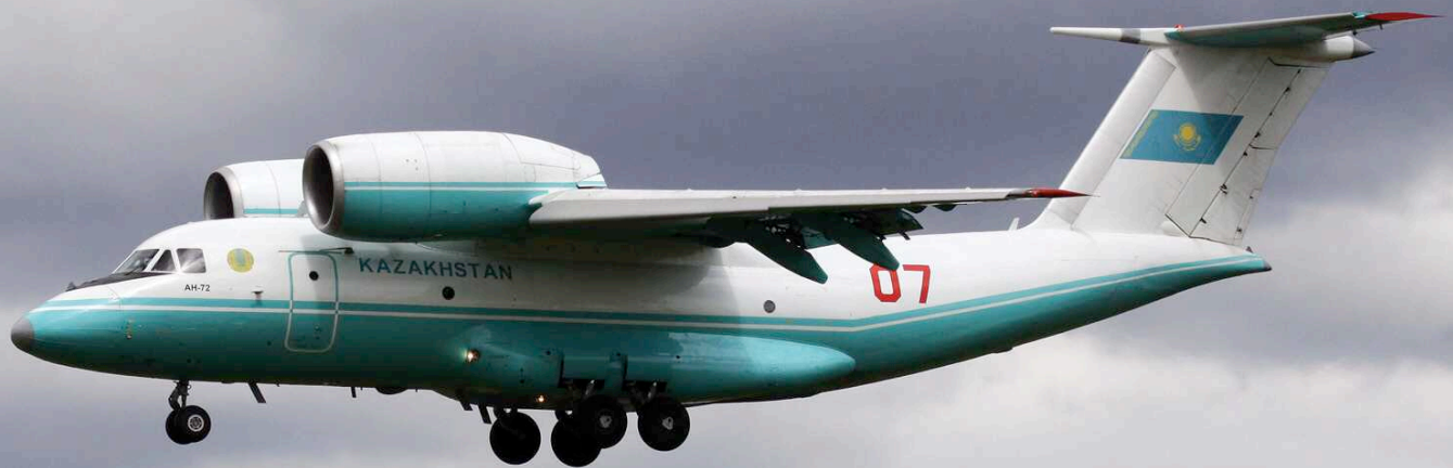
The Kazakhstan Air Force is operating two second hand An-72s, both aircraft were manufactured around 1994 and delivered to the Kazakhstan AF around 2011/2012 and based at Almaty. An-72 07 visited Mildenhall in mid July while its sister aircraft 08 visited Mildenhall in late July. (Mildenhall, 13 July 2016, Rolf Flinzner)