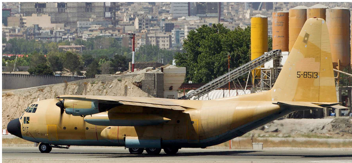
Iran has operated over the times no less 60 plus examples of the Hercules, of which C-130H 5-8513 is one of them. (Tehran-Mehrabad, 28 May 2016)