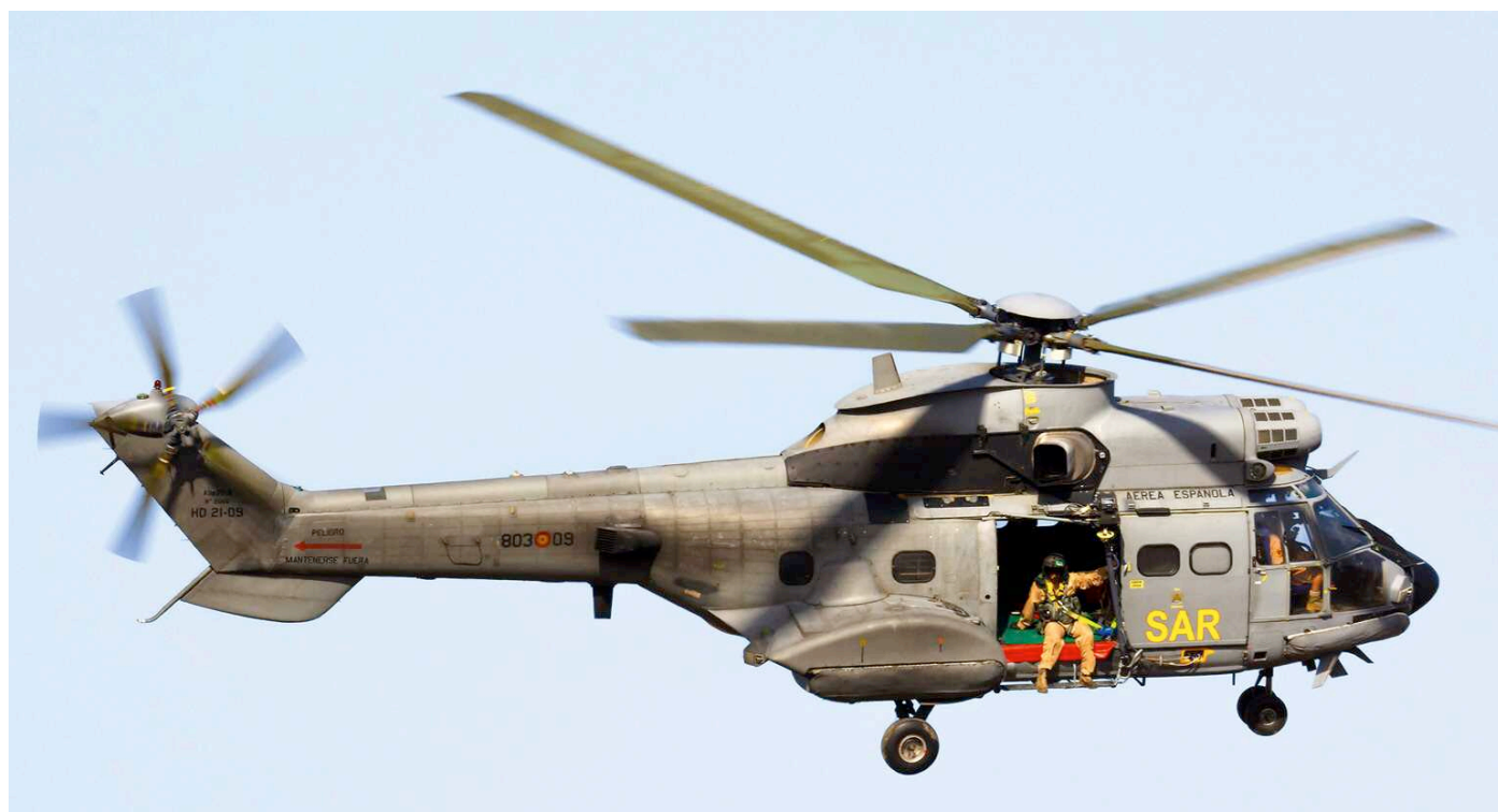
Spanish Air Force AS332B HD.21-09 took part in a national exercise in the vicinity of Murcia with other assets of the Spanish Air Force and Navy. (Murcia, 30 June 2016,)