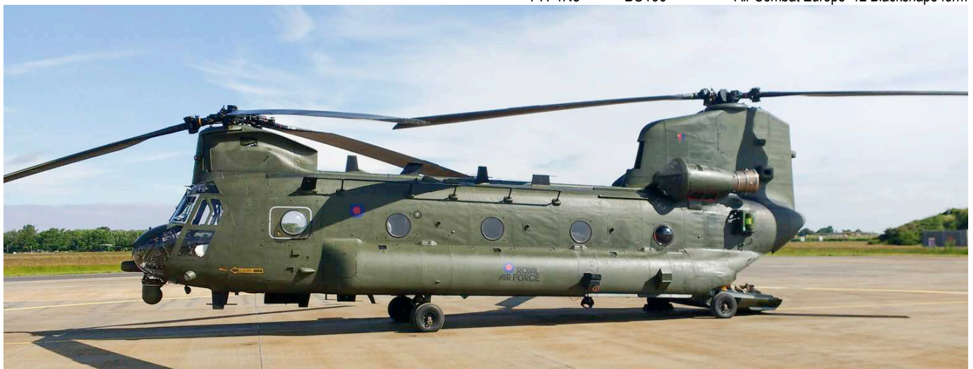
Chinook ZA707 is part of the Odiham Wing. RAF Odiham is a Royal Air Force station situated in Hampshire, England. It is the home of the Royal Air Force's Chinook fleet. (Den Helder, 17 June 2016, Edwin Daalder)