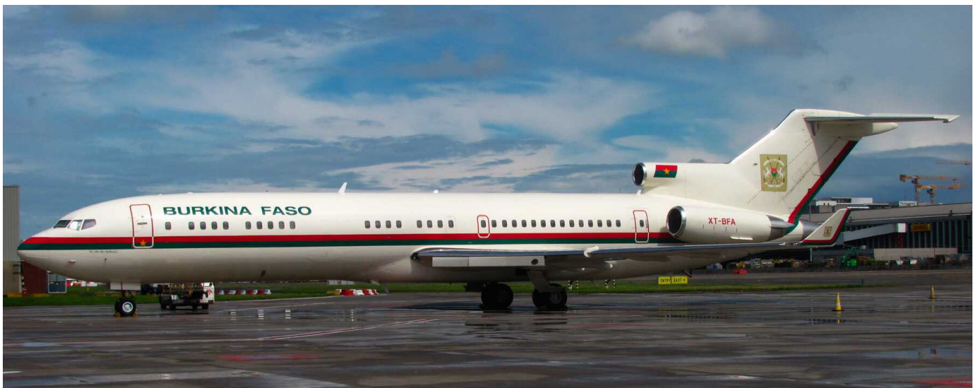
An exotic Boeing 727 is XT-BFA of the Burkina Faso government. It can be seen in Europe quite often on fields like Brussels or Paris-Le Bourget. The aircraft was originally delivered to TAP Air Portugal on 2 March 1981 with registration CS-TBY. Burkina Faso took delivery of it in May 2005. (Brussels, 15 June 2016, Eric Vangeel)