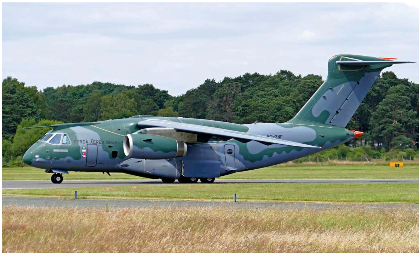
Embraer sent its sole airworthy KC-390 to this year's Farnborough airshow. Despite its civil registration PT-ZNF, the aircraft was wearing the standard Brazilian AF colour scheme. (Farnborough, 7 July 2016,)