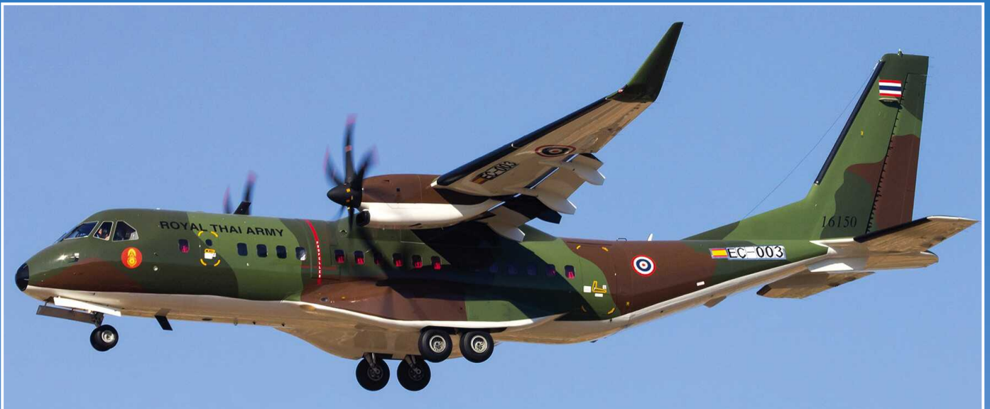
This first of a batch of about six new C295W on order by the Royal Thai Army, the 16150, was seen at its first stop on its delivery flight from its birthplace Sevilla, still wearing its Airbus registration EC-003 (Malta-Luqa, 26 July 2016)