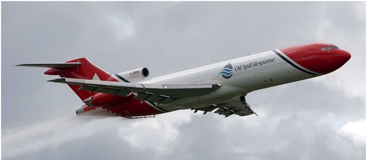
Boeing 727-2S2 G-OSRA is owned by T2 Aviation Ltd. This 727 is operated for Oil Spill Response Limited, together with sister ship G-OSRB. They are both fitted with internal tanks, pumps and a spray boom to deliver dispersant liquid. G-OSRA is seen here demonstrating its capabilities at Farnborough Air Show.