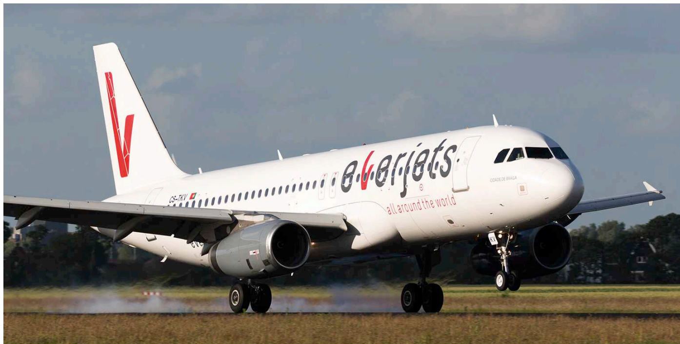
Everjets is a new Portuguese airline, which started operations in 2015. They currently have one aircraft, this Airbus A320 CS-TKV. Former operators of this aircraft are Silkair, Vista Georgia and Hermes Airlines. The Airbus visited Amsterdam-Schiphol on a flight for TACV-Cabo Verde Airlines on 2 July.

The government has ordered two DHC-8-400s with Bombardier. When delivered, they will probably be placed with the