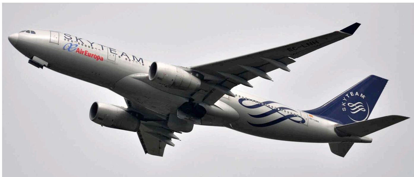
Destined for Jet Airways, this former Livingston Energy Flight Airbus A330 was withdrawn from use in September 2010. It was added to the Air Europa fleet as EC-LNH in June 2011. (Amsterdam-Schiphol, 12 June 2016, Frank Doornbos)