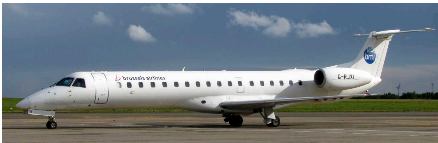
Embraer 145 G-RJXI was delivered to bmi Regional in June 2001. The aircraft is being leased to Brussels Airlines from July 2014.