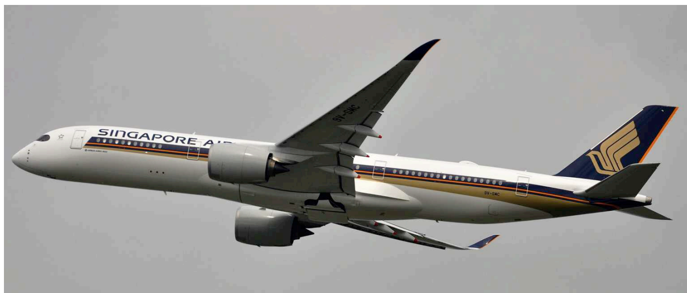
9V-SMC, the third Airbus A350 for Singapore Airlines, was added to the fleet in May 2016. (Amsterdam-Schiphol, 12 June 2016,)