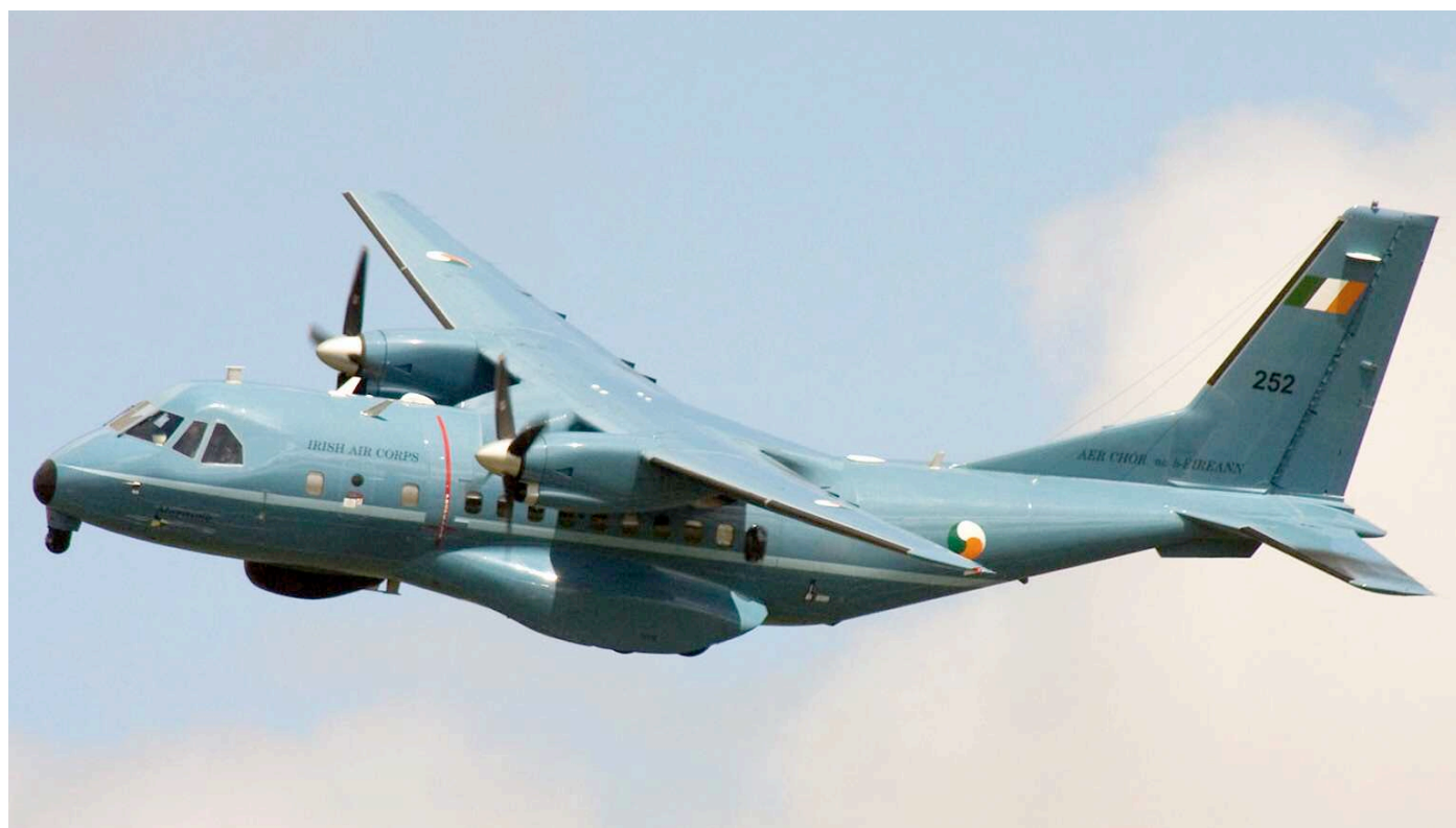
The modest Irish Air Corps sent one of its two aircraft strong CN235 fleet to the RIAT being 252. The other aircraft is 253. (Fairford, 11 July 2016,)