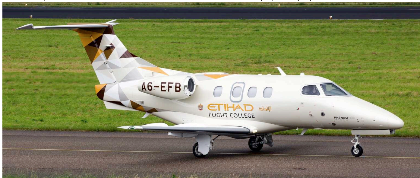
Etihad Flight College ordered four Phenom 100Es, two of them are already delivered through The Netherlands, A6-EFC through Amsterdam-Schiphol and this one, A6-EFB via Rotterdam-The Hague airport as shown on this picture. (Rotterdam-The Hague, 21 June 2016, Maarten Visser Sr.)