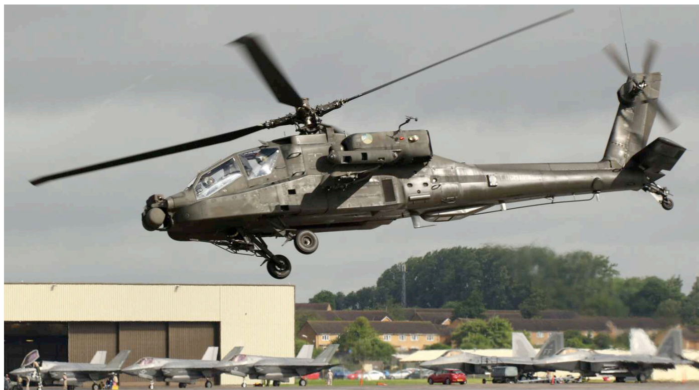
Despite the very limited KLu participation in this year's RIAT the Apache demonstration team was present performing its impressive routine. This year a standard coloured aircraft is used for the demonstrations. (Fairford, 11 July 2016,)