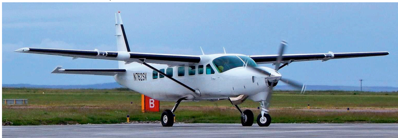
Cessna 208B N762SV started its delivery flight to the Netherlands on 25 June when it departed DeKalb Taylor Municipal Airport. The aircraft was caught on camera when it taxied away at Wick Airport en route to Texel, the Netherlands. (Wick, 28 June 2016)