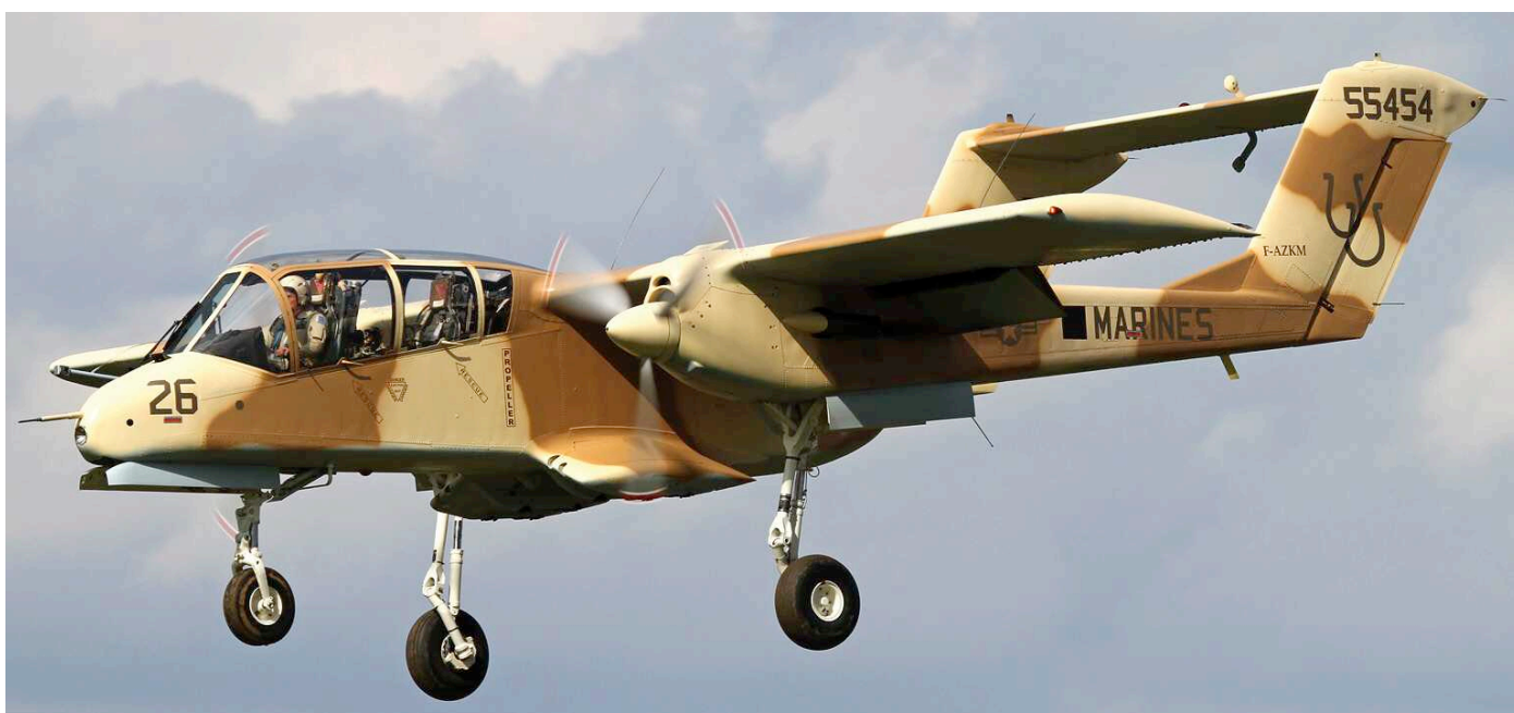
This North American OV-10B F-AZKM has the attractive colourscheme of a USMC OV-10A Bronco, but has never seen action with the Marines. The aircraft is actually a former German Air Force target tug, 99+24. It belongs to the Musée Européen de l'Aviation de Chasse at Montelimar. The real 155454 still serves as an observation plane in the US Forestry Services as N400DF. (La Ferté Alais, 15 May 2016,)