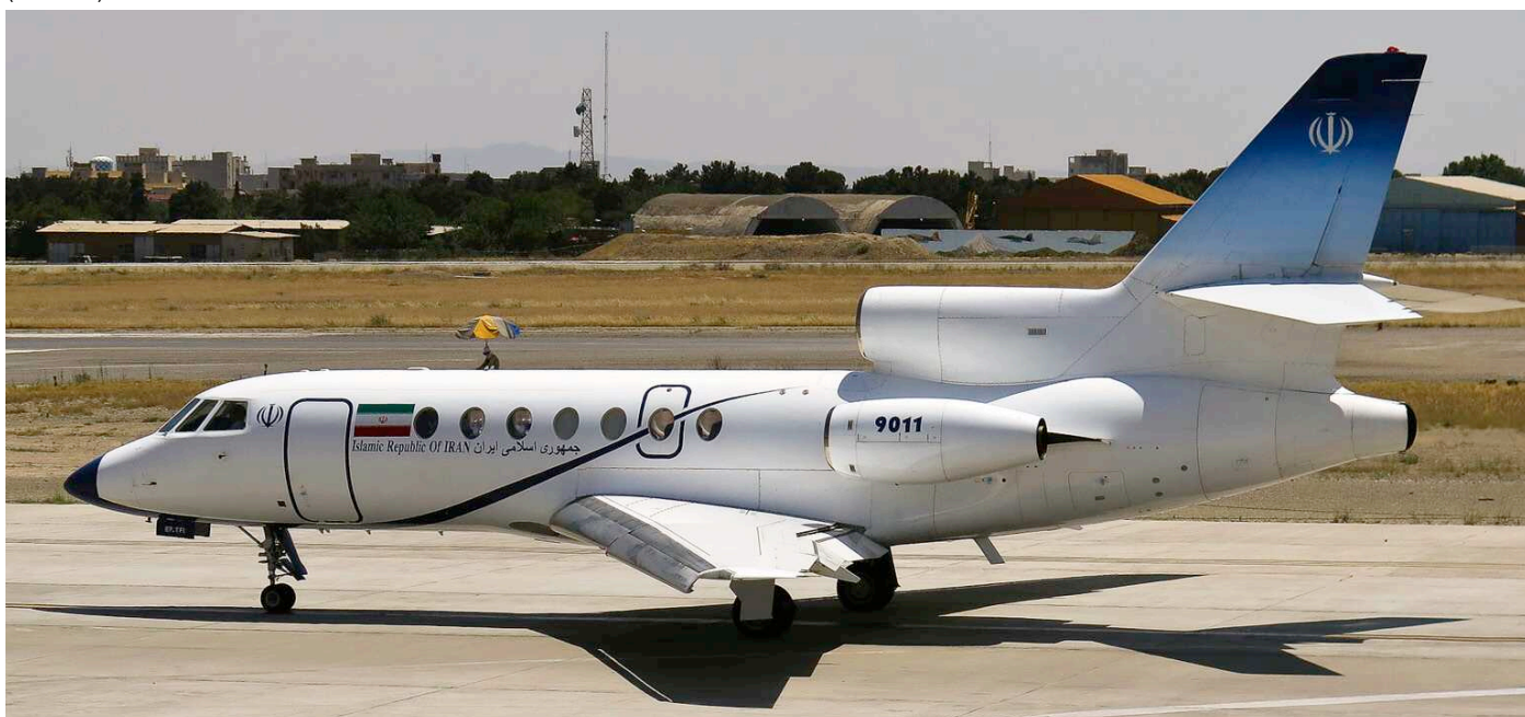
EP-TFI is a Falcon 50 operated on behalf of the Islamic Republic of Iran Government. It is also registered 9011. (Tehran-Mehrabad, 27 May 2016)