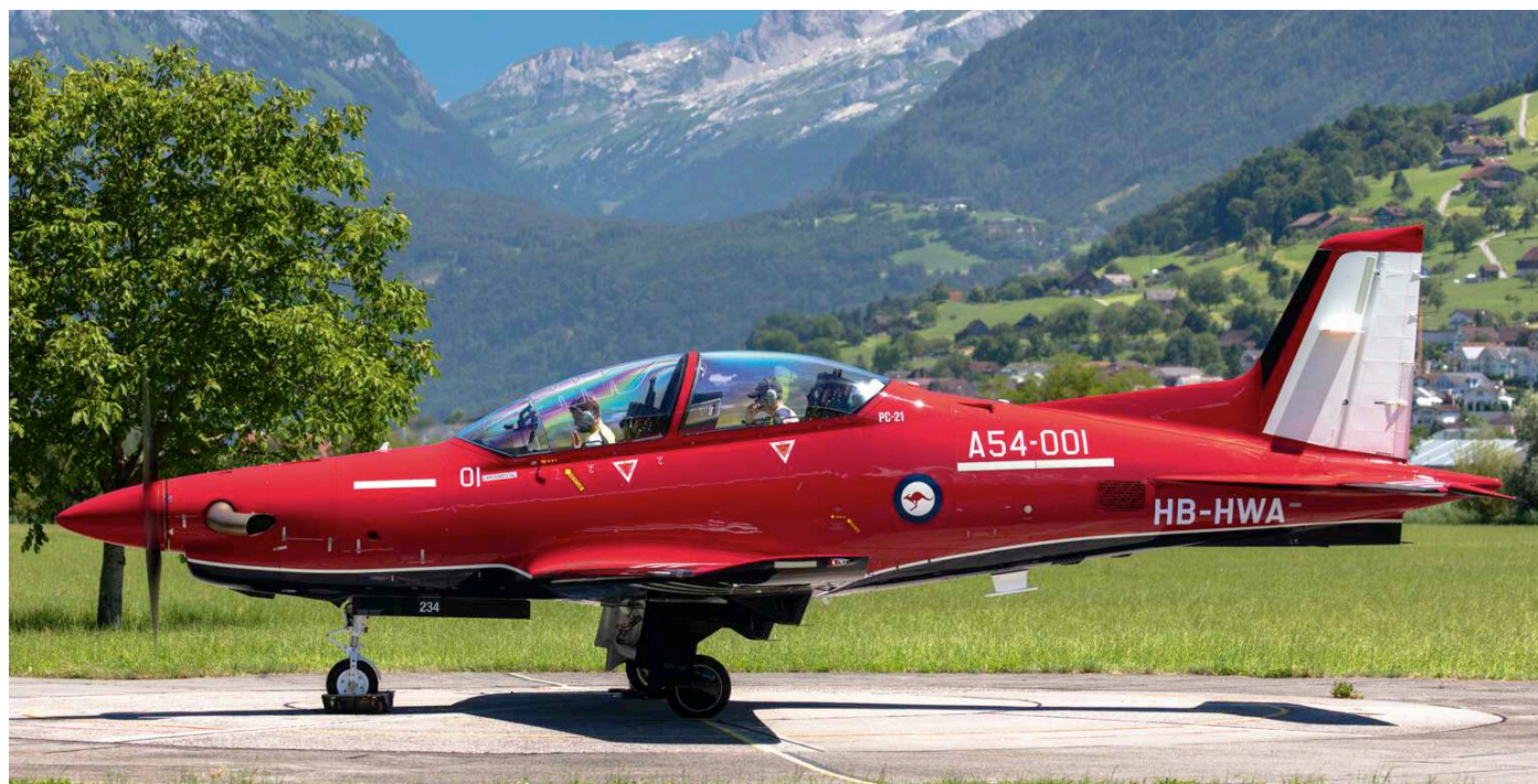
On 18 July the first PC-21 for the Royal Australian Air Force did its first engine run. It is seen here on the day after that, at Pilatus' production facility in Stans. (19 July 2016,)