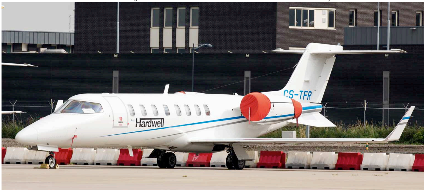
Well known Dutch DJ Hardwell needs to travel a lot during the summer time. For his convenience he is using bizjets. This Omni aviation Learjet 45 is adorned with his name during the time he will use CS-TFR. (Rotterdam-The Hague, 28 June 2016,)