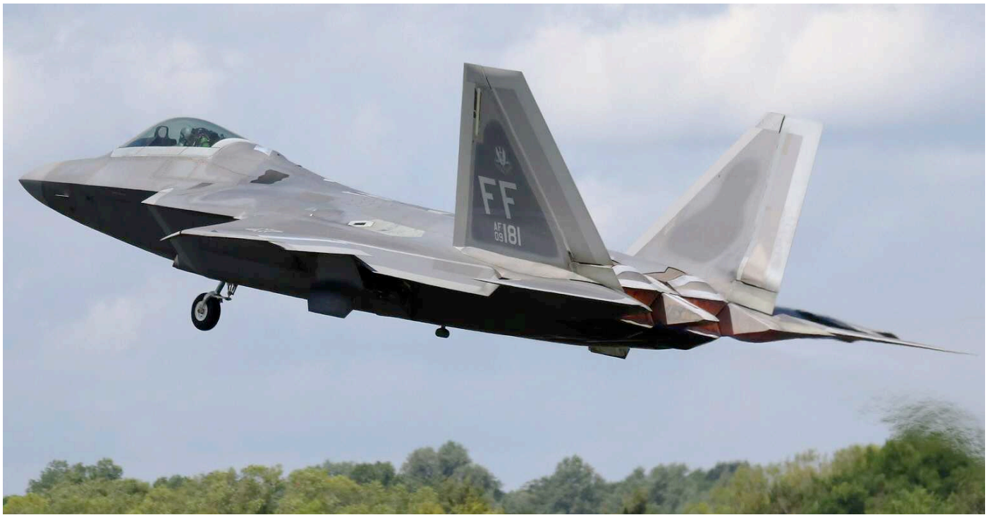
After an absence of eight years, this year's RIAT featured the USAF F-22 Raptor again. The two aircraft came from the 1st FW at Langley AFB. (Fairford, 10 July 2016,)