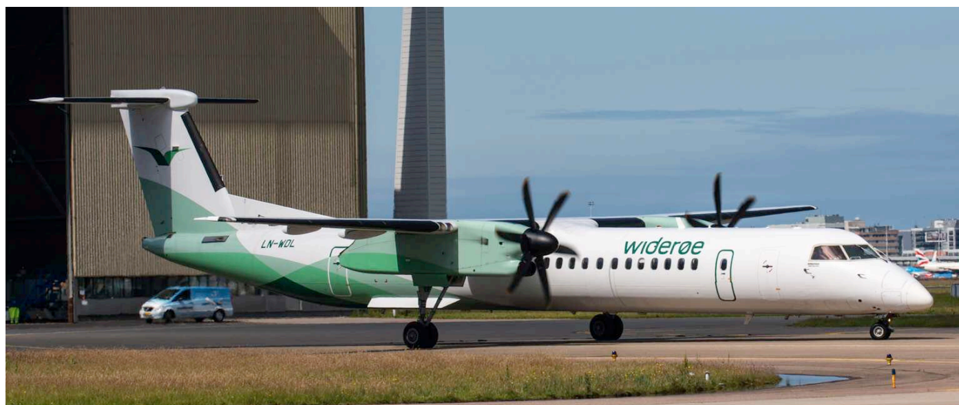
Widerøe's Flyveselskap is one of the largest operator of the DHC-8 in Europe. LN-WDL was added to the fleet in December 2011. (Amsterdam-Schiphol, 22 June 2016,)