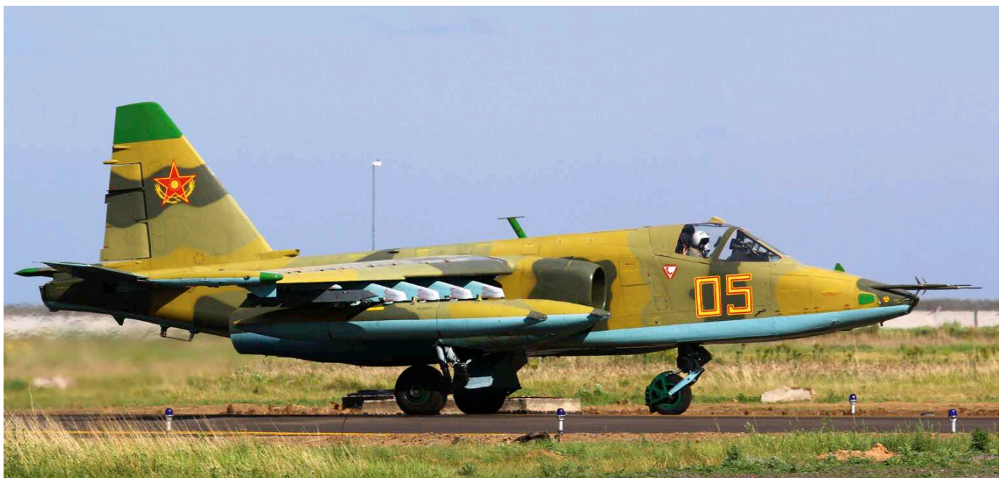
Kazakhstan still operates around fourteen Su-25/Su-25UBs. Earlier this year the Air Force started a programme to significantly upgrade their combat effectiveness. (05 yellow, Astana, 5 June 2016, Pieter van 't Hof)

C-2 68-1203 ADTW ex Kawasaki 3 jul16 First mass produced C-2 was handed over to the JASDF on 30 June 2016. Two more units will follow this (fiscal?) year, two in 2017 and three in 2018. For the moment this C-2 will be tested by the Gifu test unit before transfer to the first operational unit 403 Hikotai at Miho.