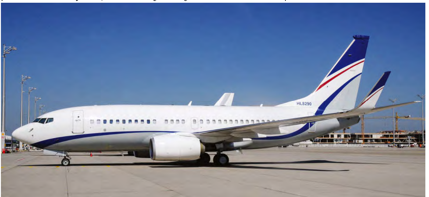
Boeing 737 BBJ HL8290 was delivered to Korean Chaebol Hyundai in July 2014. (Munich, 8 September 2021)