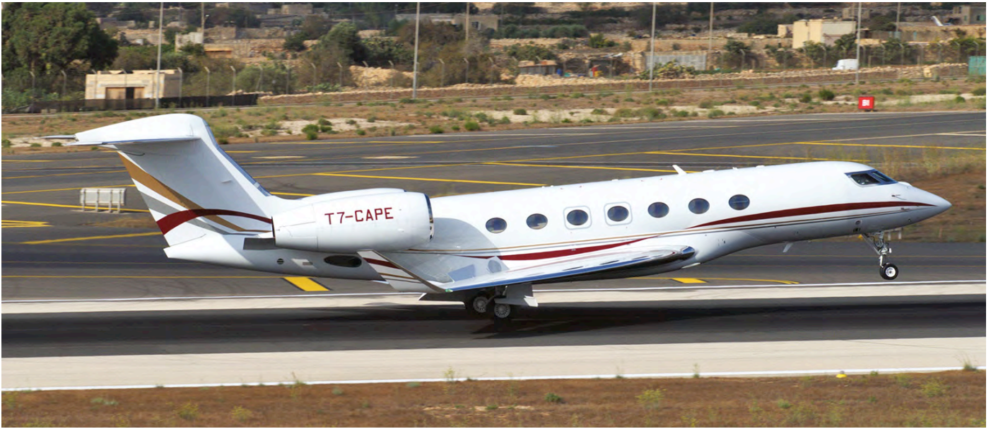
Gulfstream G600 T7-CAPE was the first G600 registered in Europe, back in September 2019. It was registered as M-CAPE upon delivery, but changed to T7-CAPE in May 2021. The jet is operated by Irvine Laidlaw, a Scottish multi-millionaire. (Malta, 1 September 2021, Mario Caruana)