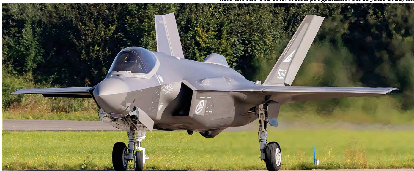
Among many others, Dino van Doorn was present at Leeuwarden to witness WIC-action. He sent us some great shots and we picked this Royal Norwegian Air Force F-35A 5207 to show its sleek lines and drag chute housing. (8 September 2021)

On 21 July 2021, both ZJ187 and ZJ195 arrived at RAF Brize Norton for air freight to the USA where they will be inducted into the AH-64E conversion programme. On 15 June 2021, the