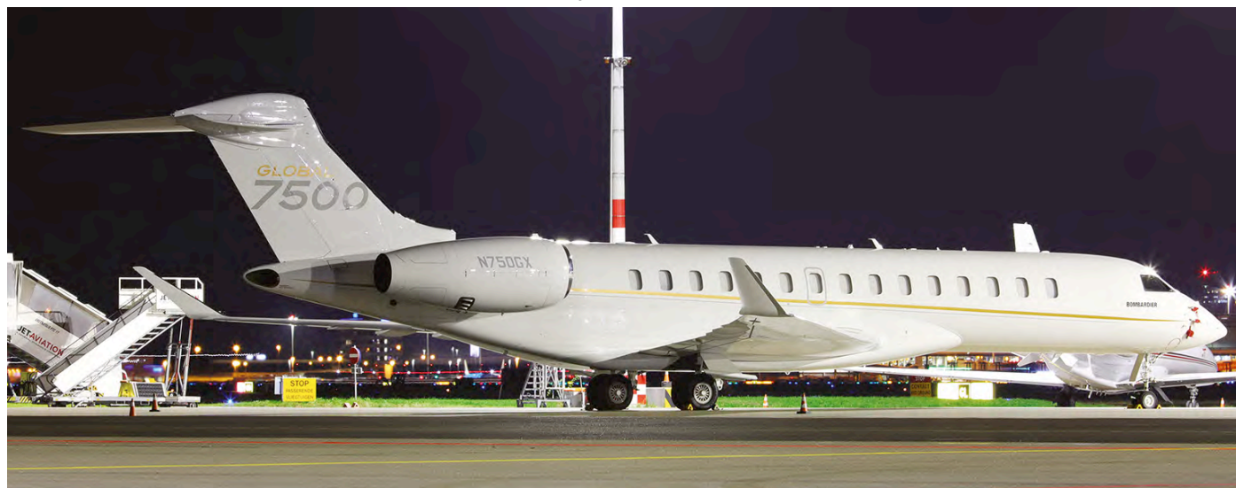
It appears that Bombardier's newest Global 7500 demonstrator is N750GX, with msn 70068. It was registered to Global Flight, a company which Bombardier often uses for its demonstrators, on 28 May 2021. (Amsterdam-Schiphol, 28 September 2021,)