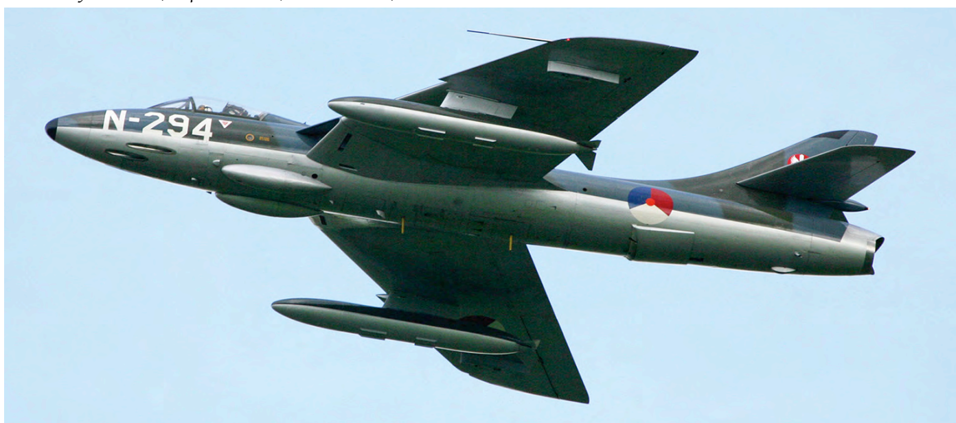
A sharp contrast to the based F-35s is this Hunter F6A G-KAXF. The former XF515, painted as Dutch N-294, has Leeuwarden as its (summer) home base. (13 August 2021,)