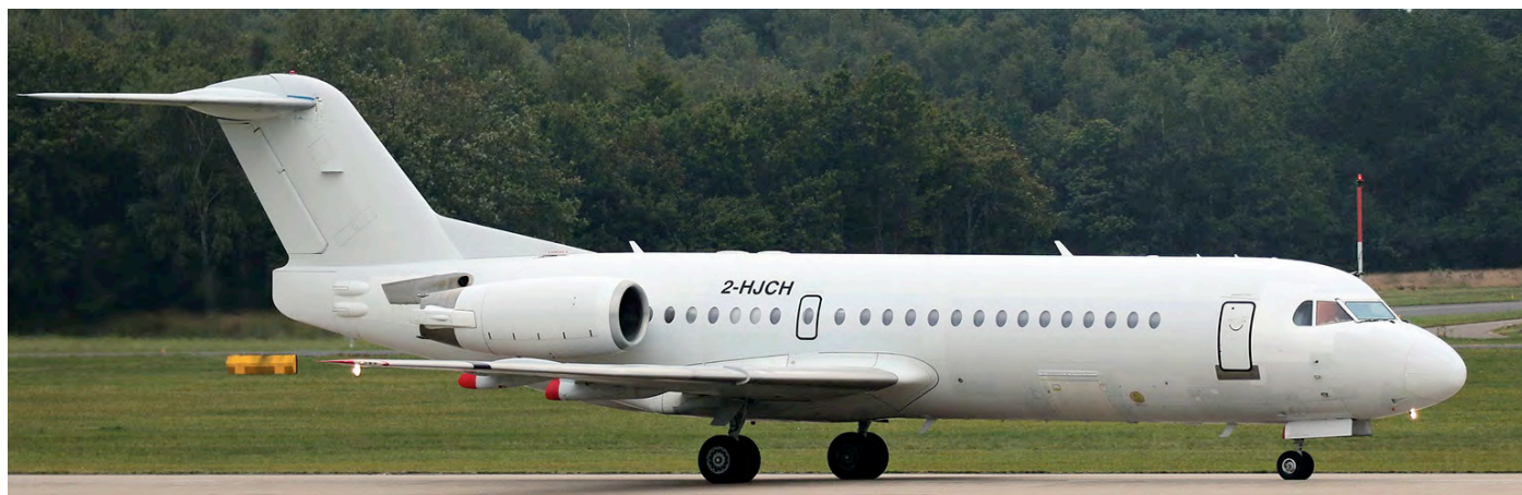
Fokker 70 2-HJCH arrived at Woensdrecht on 24 September after spending a few years in the Carriibbean. (Woensdrecht, 24 September 2021, Ralph Hamaker)