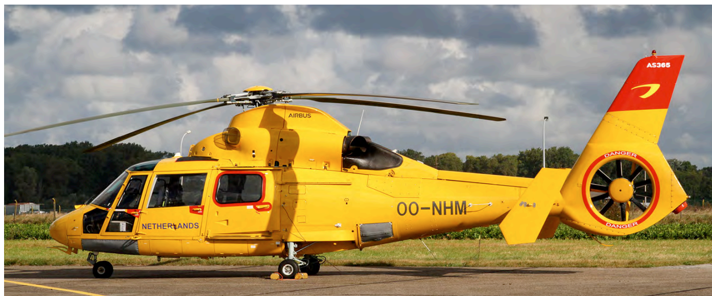
AS365N3 OO-NHM from NHV, was one of the visitors during the Galileo SAR Meet at Koksijde which was held from 27 September till 1 October. This helicopter is used by the Dutch Coastguard. More information about this meeting could be found also at our website in the Military news section. (Koksijde, 29 September 2021,)