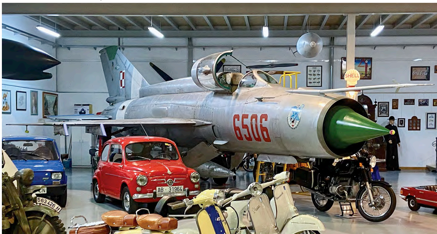
Although this Polish MiG-21MF 6506 has been at Barrax, Spain, for over twenty years, it is not often seen as it is with a private collector in a spottersproof building. (22 October 2021,)