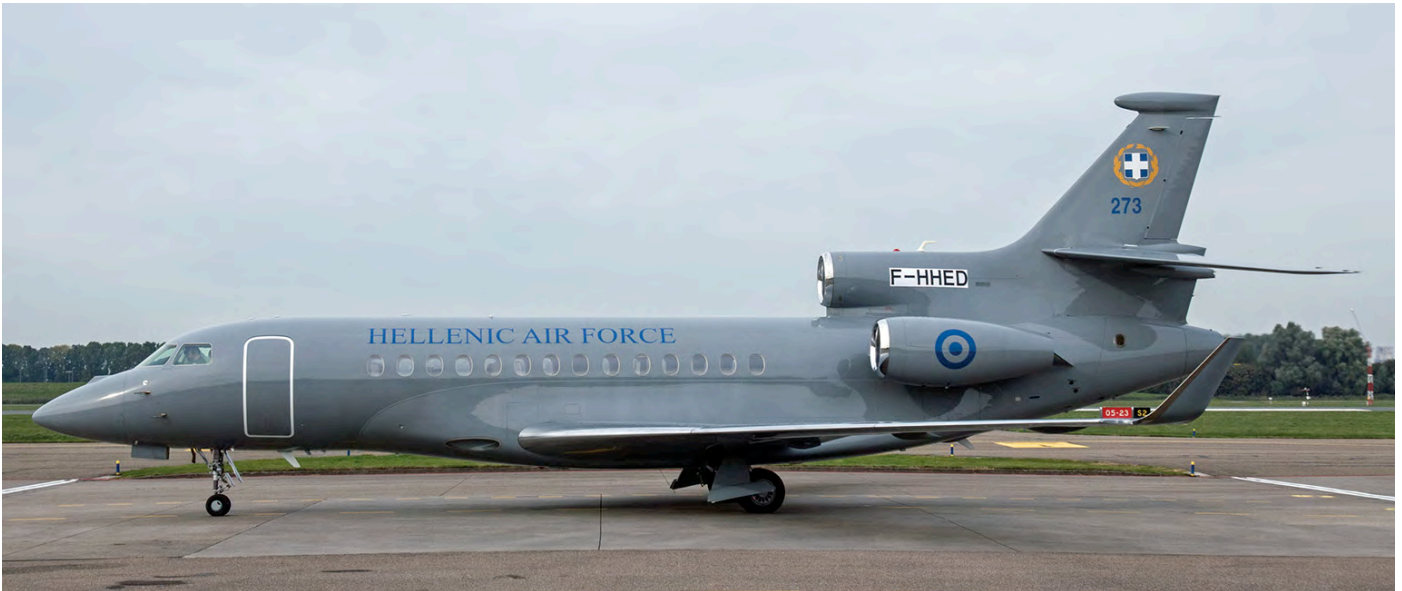
A big surprise emerged from the Satys paint shop at Lelystad mid-October. Falcon 7X F-HHED clearly shows its future operator and serial: the Hellenic Air Force, serial 273. It left after two days. (Richard Poeser, 18 October 2021)

from NATO Airbase Geilenkirchen will provide airborne early warning coverage for the British military forces.