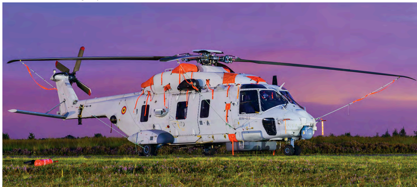
After the Sunset Show at Sanicole, and well after sunset itself, the opportunity rose to make some long exposure shots of the parked helicopters. NH90 RN01 of 40sq had already been tucked in for the night long before dark. (Leopoldsborg, 10 September 2021, Erik Sleutelberg)

FA87, FA101 F-16AM 2w special c/s E-191 F-16AM Esk 727 special c/s 6807 MiG-21MF75 Esc861 J-5026 F-18C nb ZJ916/916, ZJ937/937 Typhoon FGR4 29(R)sq (03)/F-TGCH, (04)/F-TGCI EA330SC EVAA 05/F-TGCI EA330LC EVAA 44/2-EQ Mirage 2000-5F GC01.002 special tail 55/2-EU, 63/2-EM Mirage 2000-5F EC01.002 02/709-FD, 08/709-FJ PC-21 EPAA00.315 14/709-FP PC-21 EPAA00.315 (139)/4-GR Rafale C ETR03.004 demo c/s 140/4-GS Rafale C EC01.004 147/XS TBM-700A ET01.041 C-FPSH Do228-201 Summit Air D-FOOD PC-12/47E F-AZES MD312 as 226/319-CG F-AZKM OV-10B (99+24) as 55454 USMC F-AZNN Yak-11 (ex Egypt AF) 25111/05 F-AZPZ CM170 as 413/312-PF& 315-JB F-AZTL T-6G (115102) as 117207/CR-311 F-HDBV EA330SC HB-RCF D-3801 as J-143