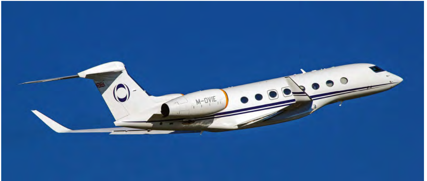
Interesting registration M-OVIE on this Gulfstream G650. Together with sistership G-550 M-USIC, the aircraft is operated on behalf of the Ineos group. The registrations would suggest a company in the entertainment business, but it is a British petrochemical company. (Geneva, 14 October 2021,)