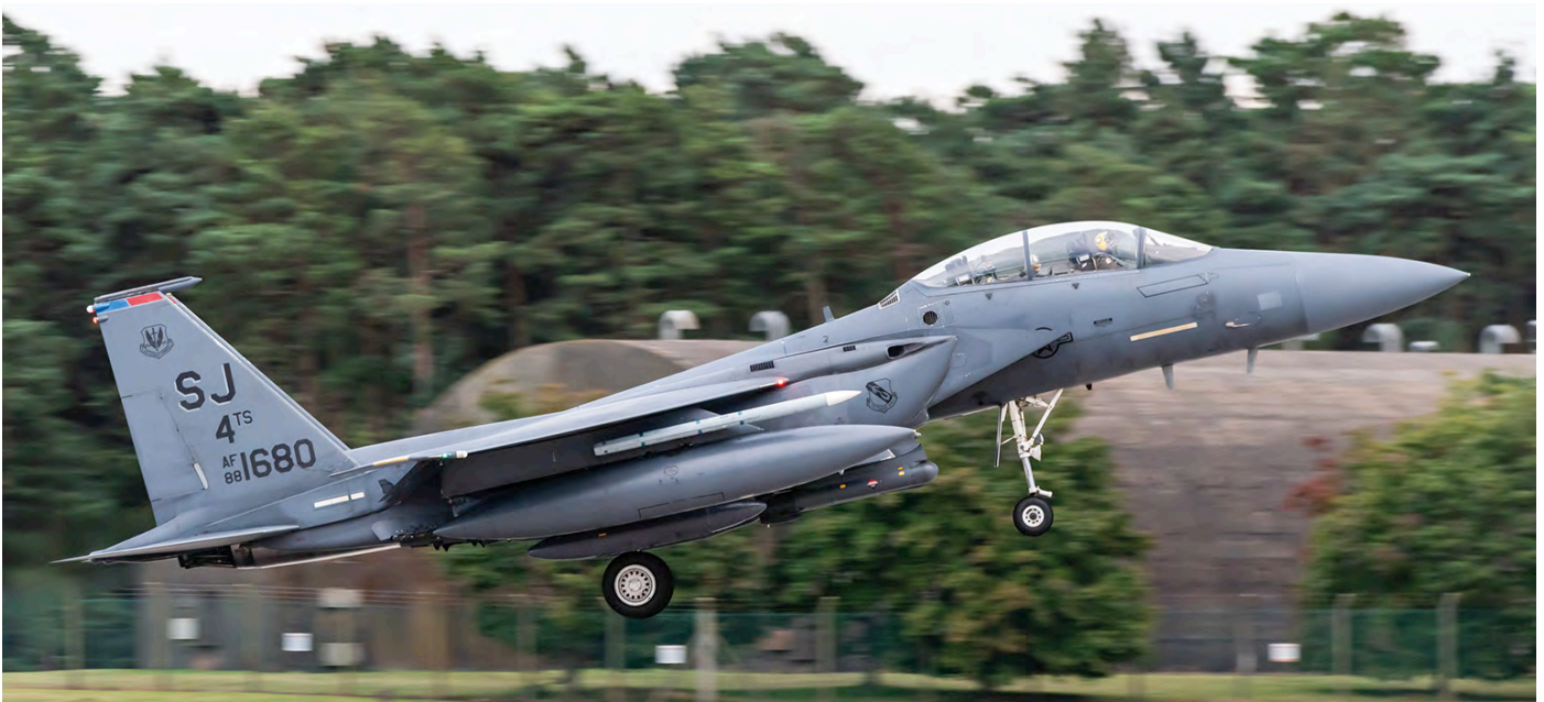
On 4 October, fifteen F-15Es arrived at RAF Lakenheath from the 4th Fighter Wing at Seymour Johnson. They included this Eagle, 88-1680/SJ carrying the unusual marks of the 4th Training Squadron which is not common on this side of the Atlantic. Presumably, the deployment to the Middle East to take over from the current Lakenheath detachment, is by the 336th FS as most of the crews were wearing yellow flight helmets. (Martin Fox)