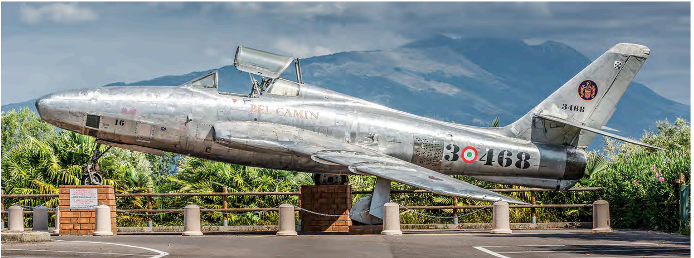
RF-84F MM54-7471 (marked as 3468/3-468) is still preserved Villa Belcamin at Bussolengo, Italy. (2 September 2021)