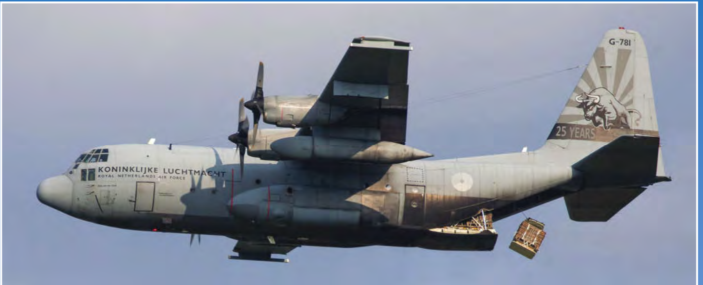
Cargo dropping is demonstrated by Koninklijke Luchtmacht C-130H G-781 of 336 squadron over Deelen on 6 September 2021. (Manolito Jaarsma)