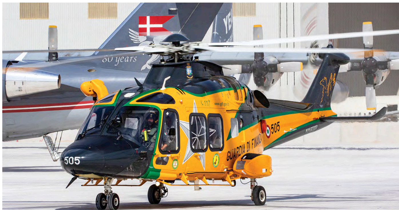
Delivered to the Centro di Aviazione Guardia di Finanza last January, UH-169A MM82000 was a good catch among the Italian participation at the Malta Air Show. The helicopter in its great livery is seen here while taxiing at Luqa on 24 September 2021.

Red Arrows Hawk T1(AW): XX188, XX219, XX242, XX245, XX278, XX295, XX310, XX311, XX319, XX325