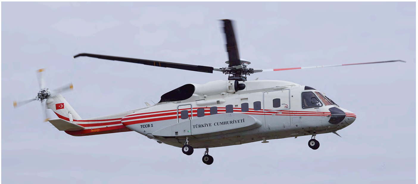
A surprise at Prague, this Turkish S-92 showed up with a new serial, TCCB 1, previously EM-001. TCCB stands for Türkiye Cumhuriyeti Cumhurbaşkanlığı or Presidency of the Republic of Turkey. (17 October 2021, Václav Kudela)

following Apaches were officially stricken from the UK military register: ZJ181, ZJ194, ZJ196, ZJ217, ZJ222 and ZJ227. All were previously shipped to the USA to be inducted into the AH-64E conversion programme.