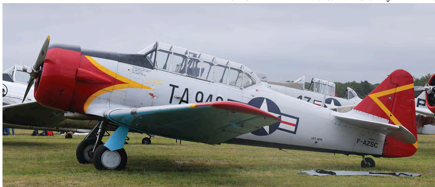
On the flightlines at La Ferté was AT-6D F-AZSC, the former Spanish C.6-154, in a USAAF livery with code TA-943. Interestingly, it has been given a data block below the cockpit, correctly mentioning its construction number 88-15943. (28 August 2021,)

D-ACLG B737-46JSF CargoLogic Germany 16 EC-JAD ATR42-300 Swiftair 16 EI-DPI B737-8AS Ryanair 18 N800AJ CL-601-3A 16-19 OK-BET Ce525 16 OK-ELO CeT303 18 OK-LLL PA-46-500TP 18 OK-PBK Ce525B 16 OK-PLS L-200A 16 OK-PRM PC-12/47NGX 16 OK-PVN PC-12/47NGX 18 OK-SWW B737-7Q8 Smartwings 19 OK-TSF B737-8GJ Smartwings 16,19 OK-TST B737-86N Smartwings 18