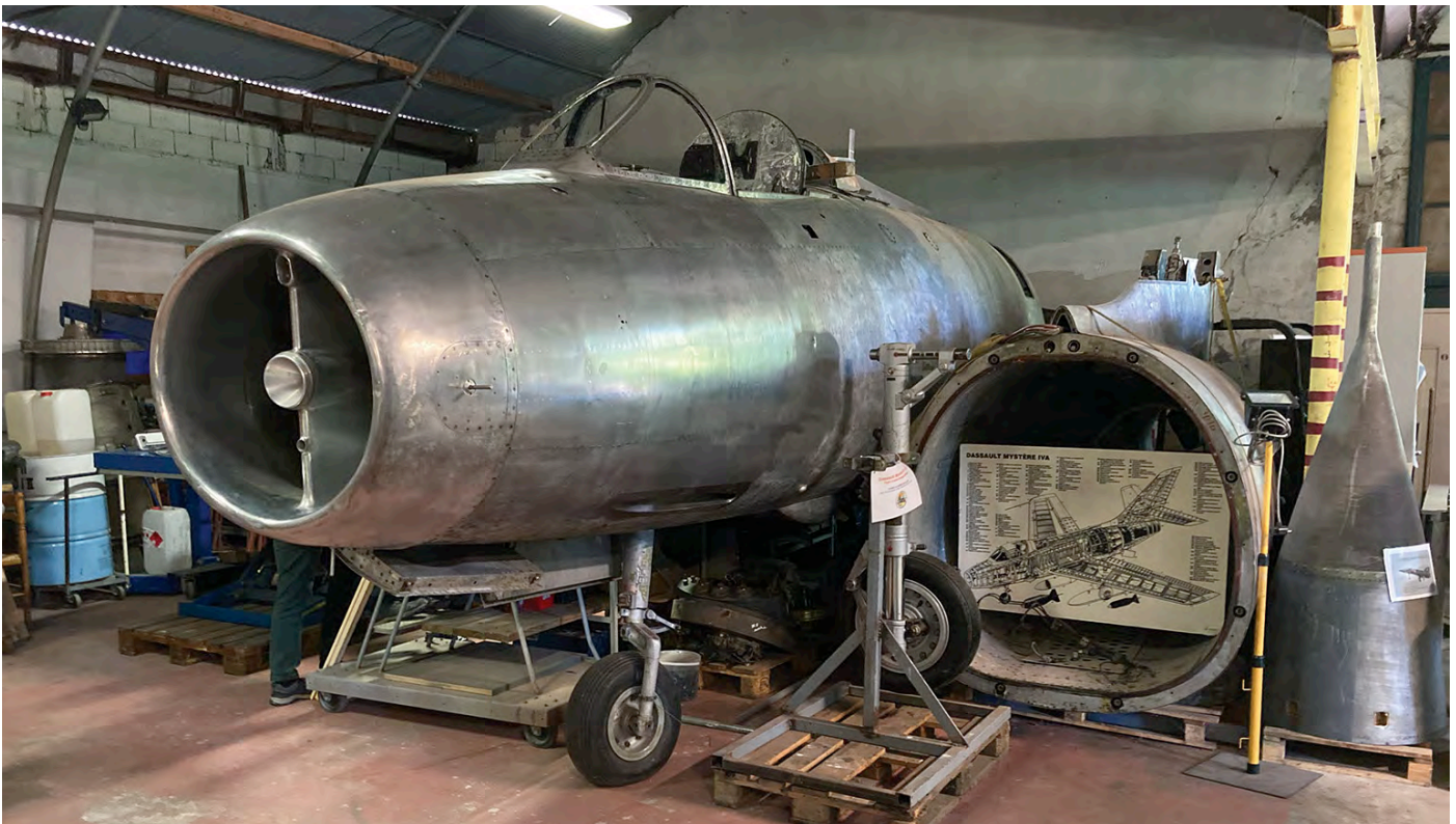
The Ailes Anciennes de Haute Savoie from Excenevex, France, is in the process of restoring Mystère 4A 33. (2 October 2021, Leonard van Teeffelen)