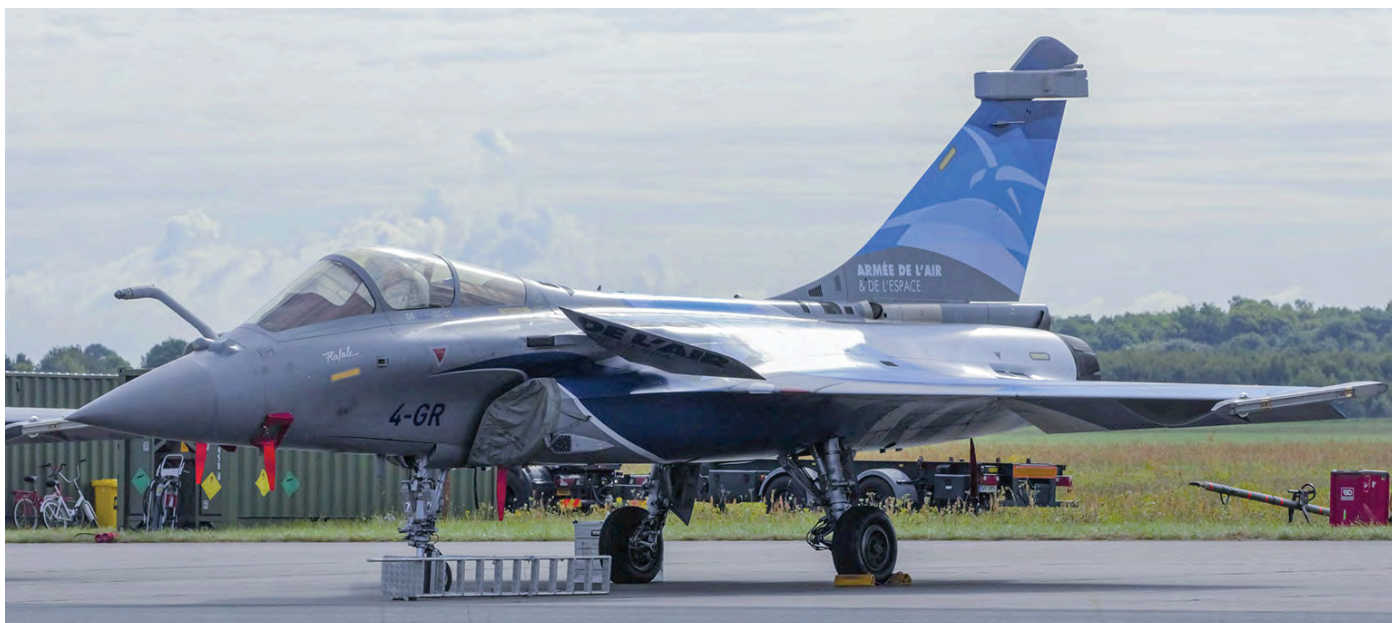
Photographed at AeroBaltic 2021 in Gdynia on which we reported last month, Rafale C 139/4-GR in its display livery also took part in the shows of La Ferté and Luxeuil. (Oksywie (Babie Doly, Gdynia), 21 August 2012,)