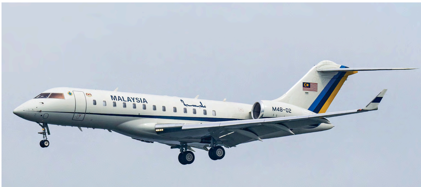
Probably a short hop for this Global Express, Malaysian Air Force's M48-02 visited Singapore-Changi on 7 September 2021. The aircraft, operated by 2 Skuadron was photographed by Hans Jacobs.