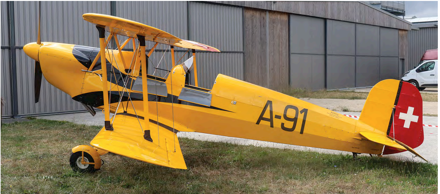
Spanish CASA 1131E F-AYKG is a new arrival at La Ferté-Alais. It carries fake Swiss markings, but is really E.3B-433 (ex N8TE and N433WN). Its identity is confirmed by its construction number 2034 on the construction plate. (28 August 2021, Otger van der Kooij)