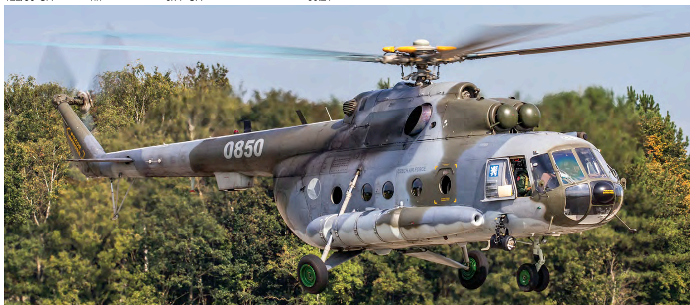
Together with two US Army CH-47Fs, Czech Mi-17 0850 of 243 vrl operated out of Volkel to participate in exercise Falcon Leap, dropping parachutists at various altitudes over drop zones in the Netherlands. (Rob Hendriks, Volkel, 14 September 2021)