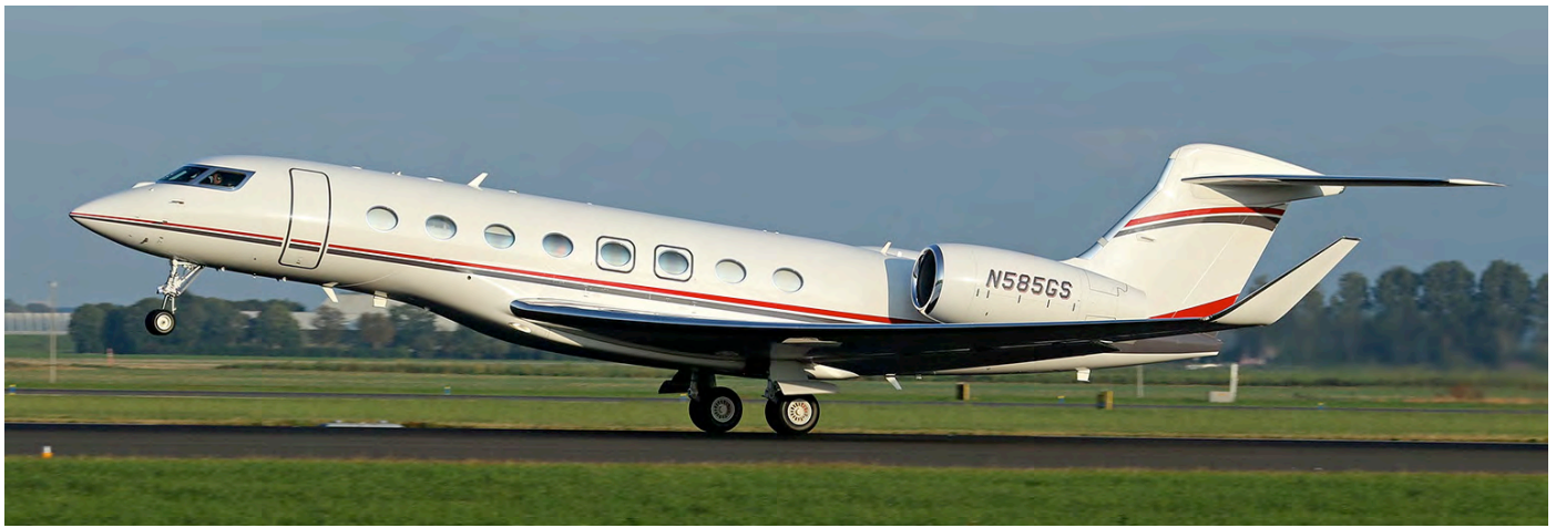
Farmaceutical company Gilead Sciences Gulfstream 650ER N585GS is seen here rotating for its flight back to the USA after spending a few days at Schiphol. (Amsterdam-Schiphol, 16 September 2021, René Verschuur)