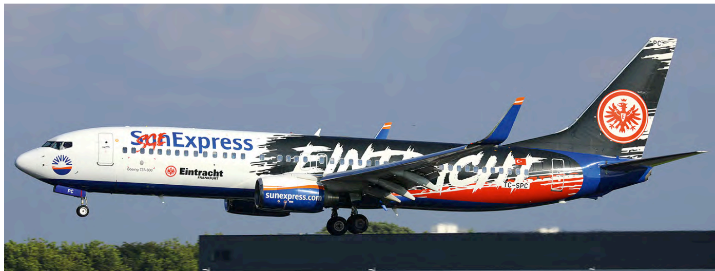
Sun Express' Boeing 737 TC-SPC used to fly for the German branche Sun Express Germany as D-ASXX. The latter had painted this aircraft in Eintracht Frankfurt colours to promote their partnership with the German football club. (Amsterdam-Schiphol, 16 September 2021, Robert Eikelenboom)