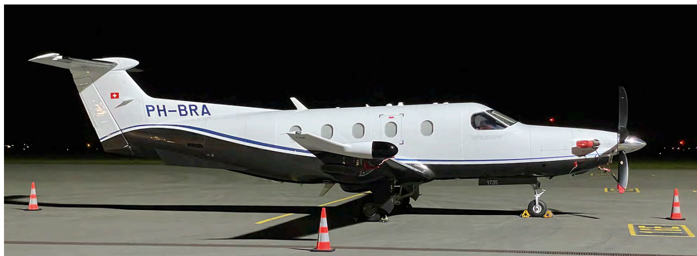
This Dutch registered Pilatus PC-12 PH-BRA has been flying around for Flying Partners since 2017. It was seen in the late hours of 30 September by Gert-Jan Mentink at Ostend.