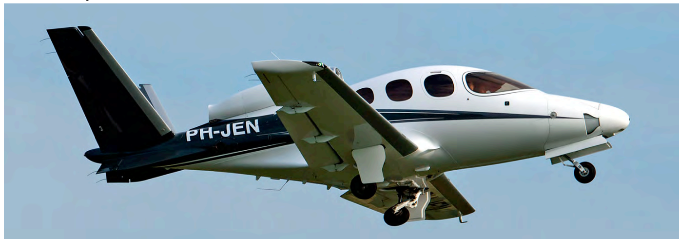
PH-JEN is the only Dutch registered Cirrus SF50 to date. Simen Dorschman took a picture of the aircraft just after take off from Groningen Eelde airport. (07 September 2021)