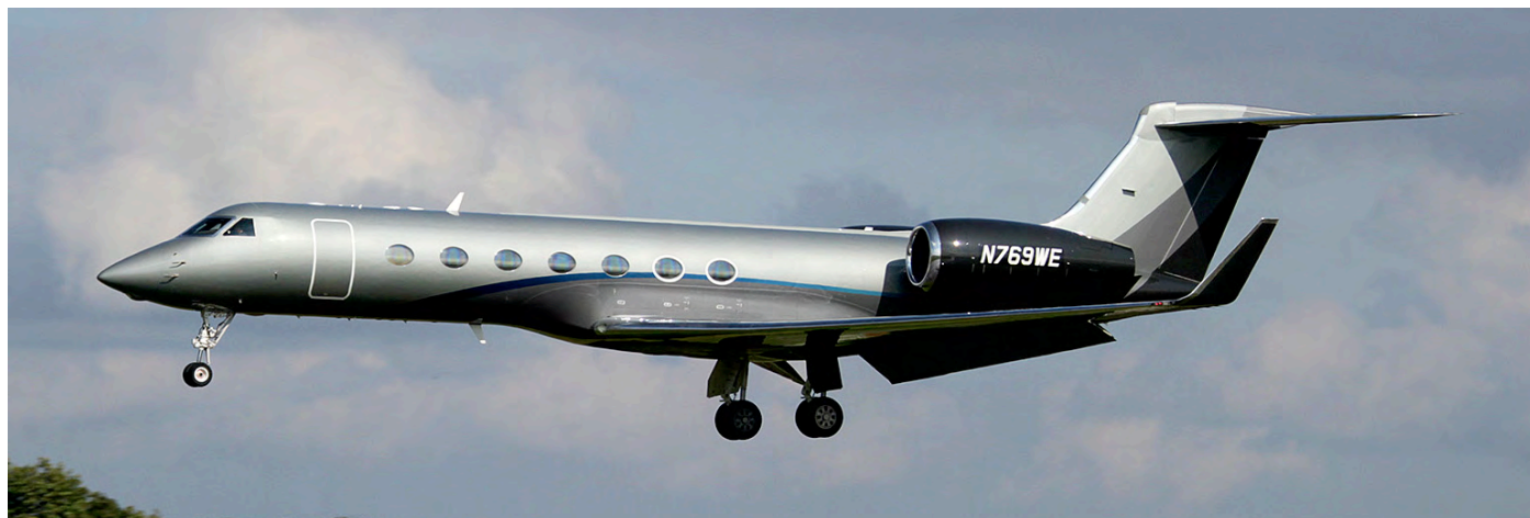
This 2004-built G550 N769WE has been owned by Belagrsko Aviation since April 2021. (Antwerp, 24 September 2021,)