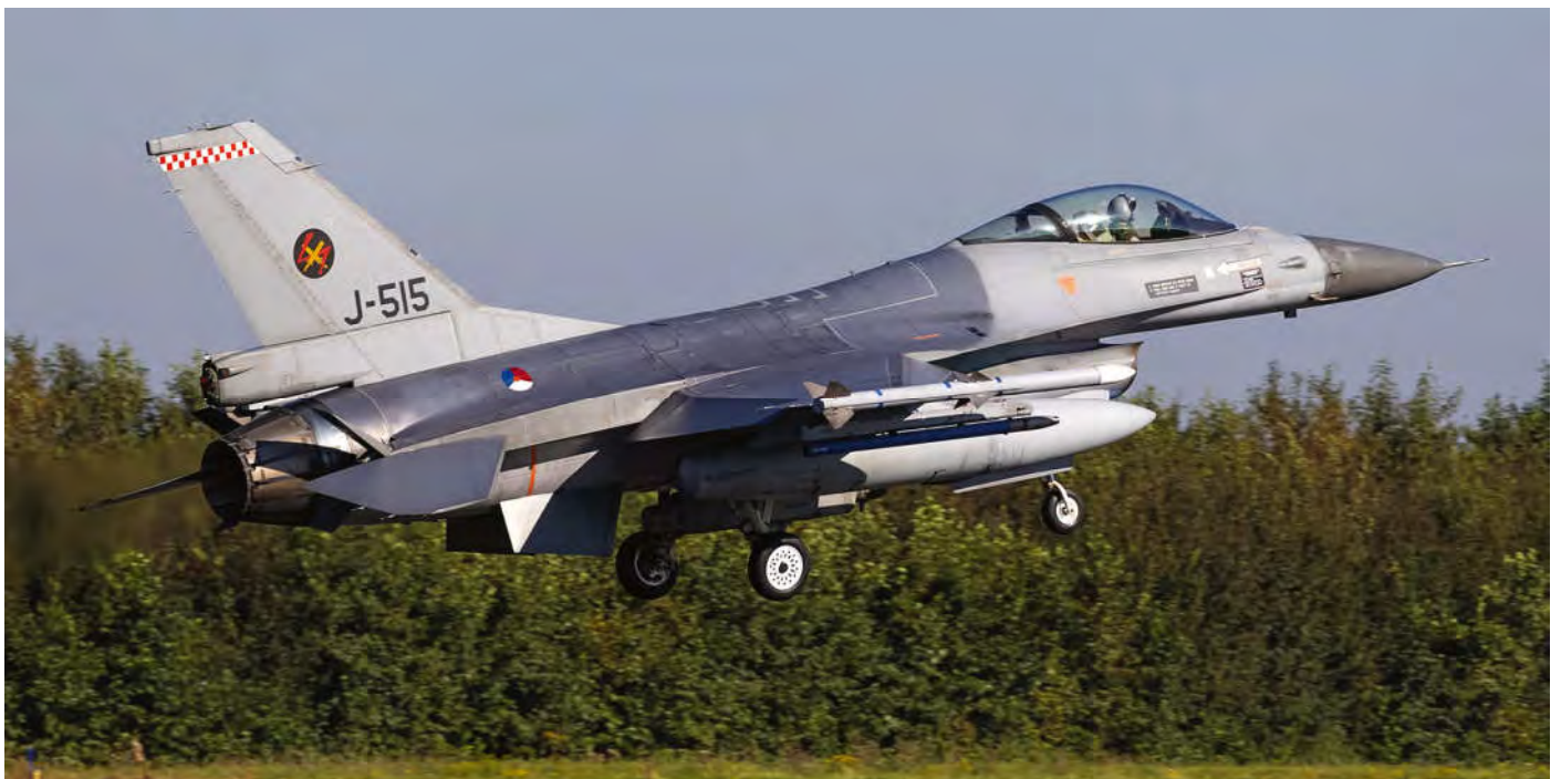
F-16AM J-515 of Volkel's 312 squadron is pictured in Frisian sunshine as well on 8 September 2021.