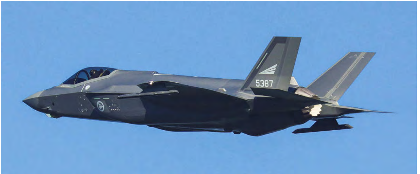
The Weapon Instructor Course (WIC) held at Leeuwarden is the cover theme of this month. Norwegian F-35A 5387 of skvadron 332 was deployed for a few weeks and is seen here taking off in spectacular fashion.