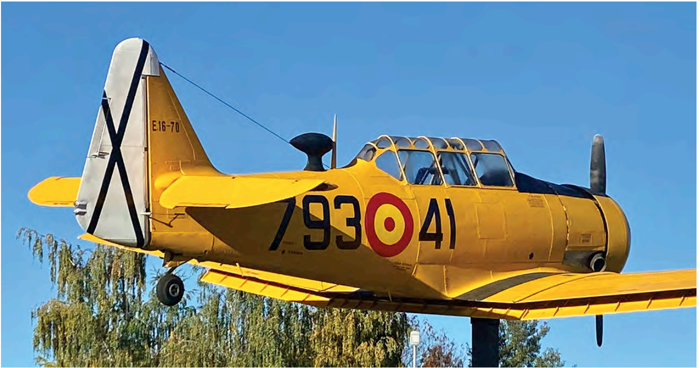
Spanish T-6G E.16-70/793-41 has served for more than 30 years as instructional airframe at León Air Base. In September 2021 the Harvard was pole mounted in splendid condition at the village of Valverde de la Virgen, which is near the main gate of the air base. (24 October 2021, Hans van der Vlist)