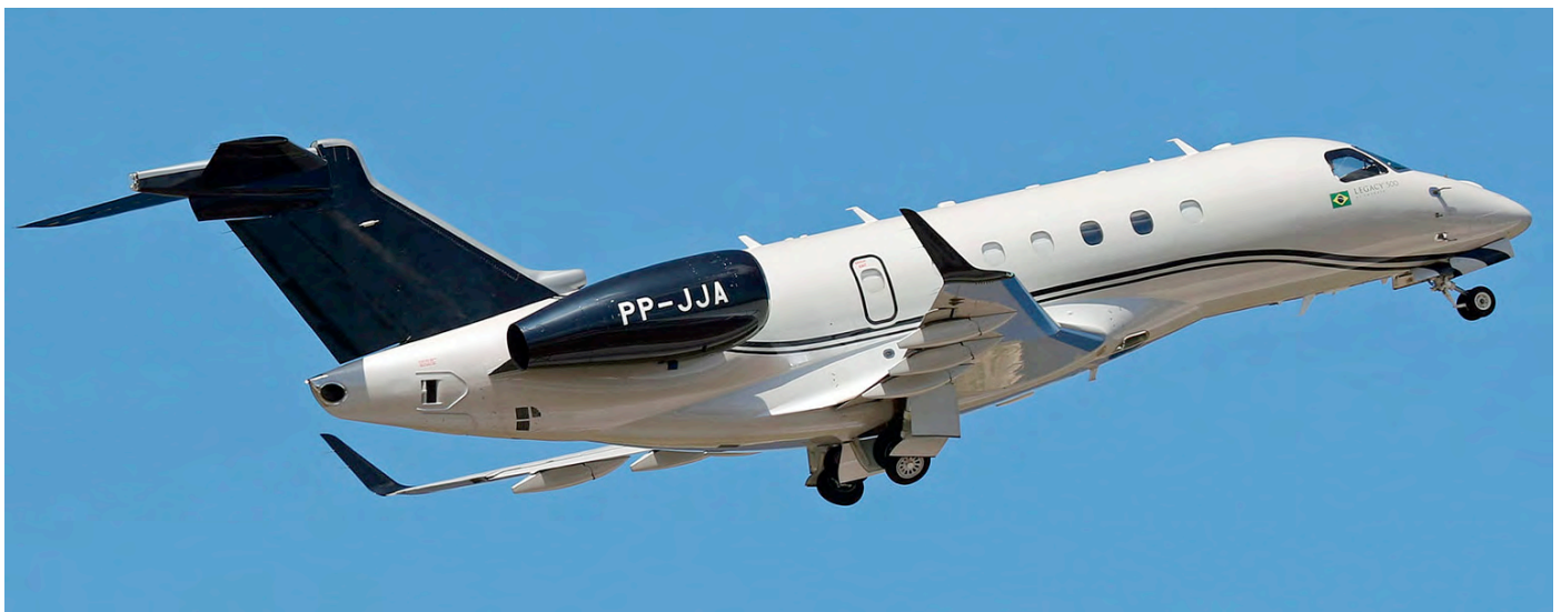
Seen taking-off from Curacao back to Brasil is Legacy 500 PP-JJA. (26 September 2021, Larry Every)