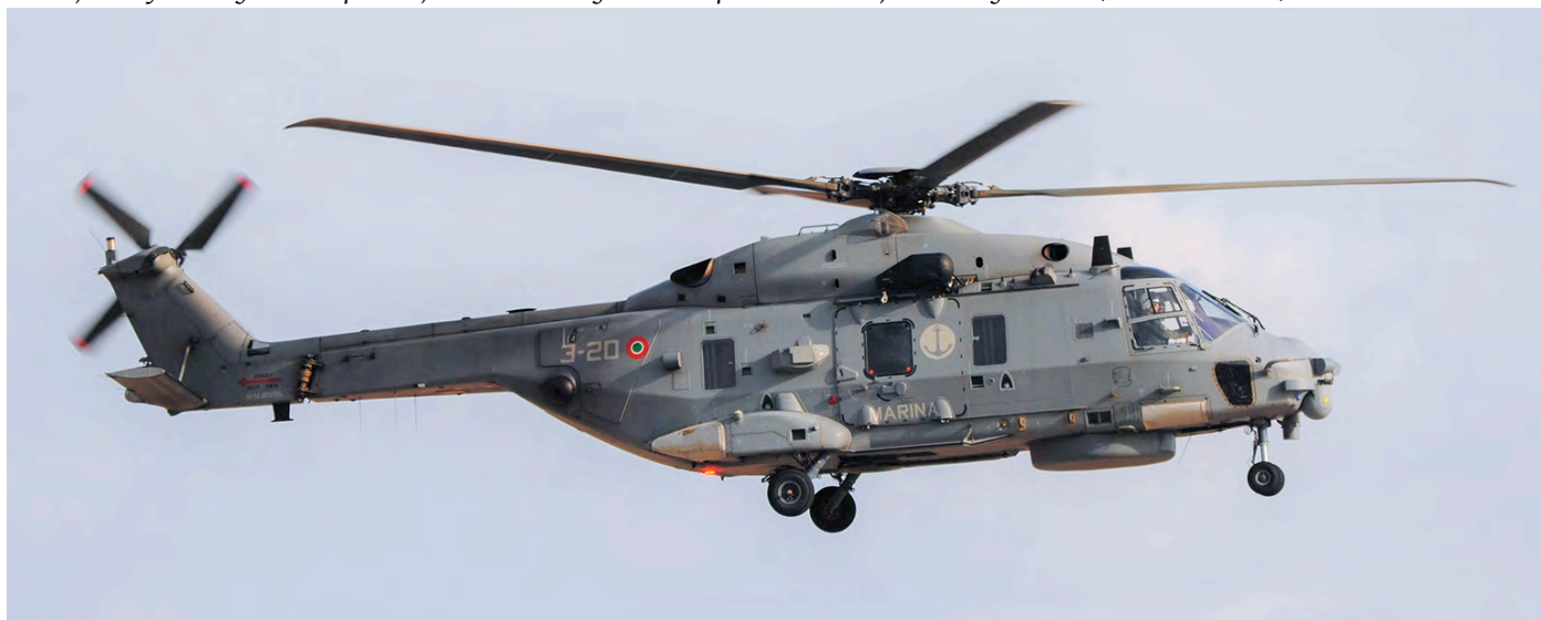
The nation obviously co-starring in the Malta Air Show was neighbouring Italy, participating with three fighter jets and five helicopters. Among the latter was this NH90, locally designated SH-90A, MM81595 of the Marina Militare. (Malta-Luqa, 24 September 2021,)