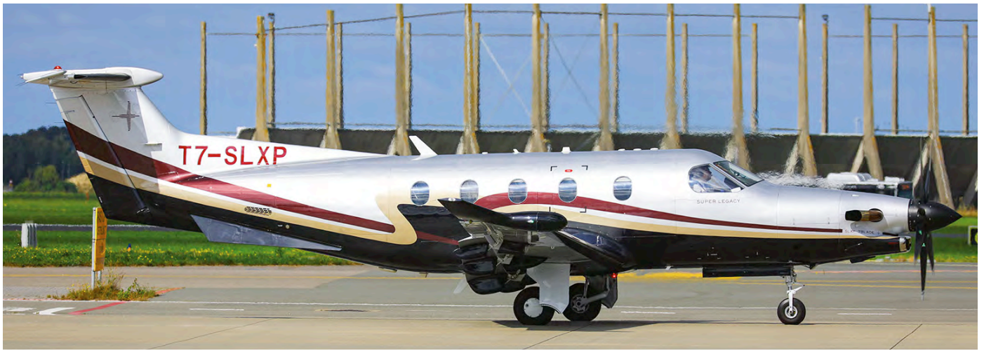
As far as we know, only two PC-12 Super Legacy XP aircraft exist. One of them is 2-FLYT, and T7-SLXP, shown here, is the other one. The Super Legacy XP is an upgraded older PC-12/45 or PC-12/47 variant, and features improvements to its power plant, propeller, cabin soundproofing and interior detail. T7-SLXP is the only 7-bladed variant. (Amsterdam-Schiphol, 16 September 2021, Robert Eikelenboom)