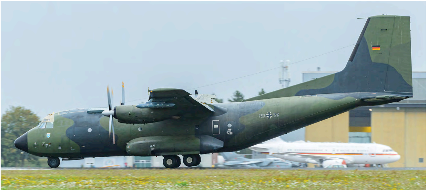
The Transalls themselves at Hohn were not at all ready to stop flying yet. Erik Sleutelberg witnessed how the crew of LTG63's 50+79 had to work hard to convince their aircraft to return to solid earth, at the conclusion of the six-ship formation flight on 23 September 2021.