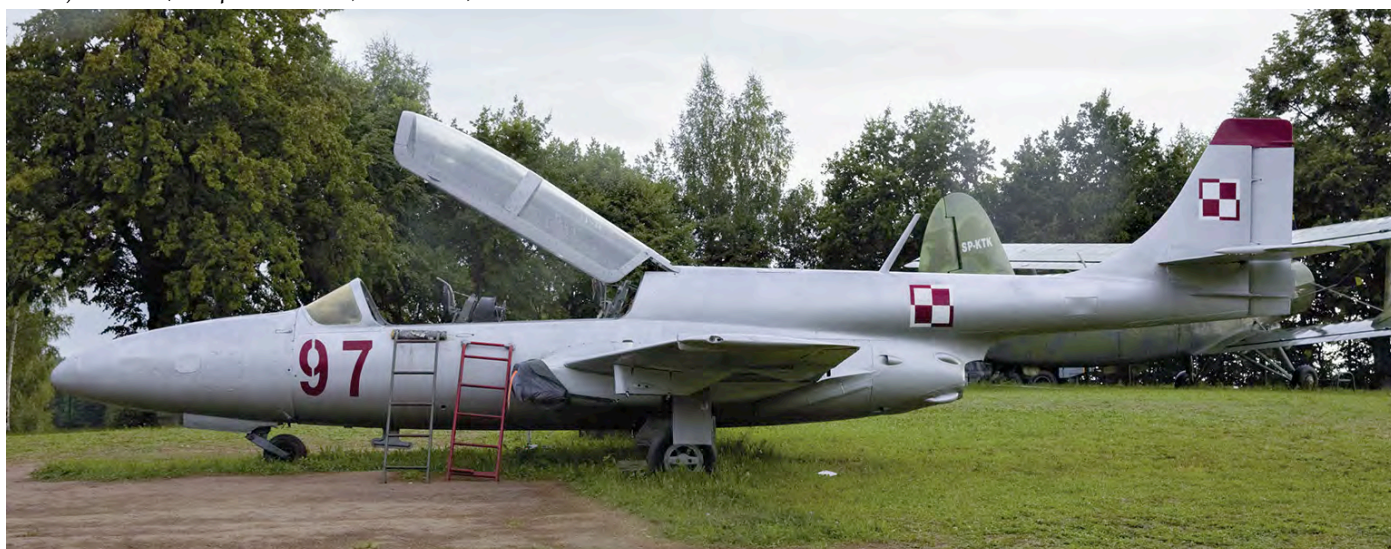
A new collection named Muzeum Dywizjonu 303 is established in a field near Gierłoż, just east of Ketrzyn. One of the aircraft in the collection is TS-11 801, marked as 97. ( 19 August 2021, Martin Uleman)