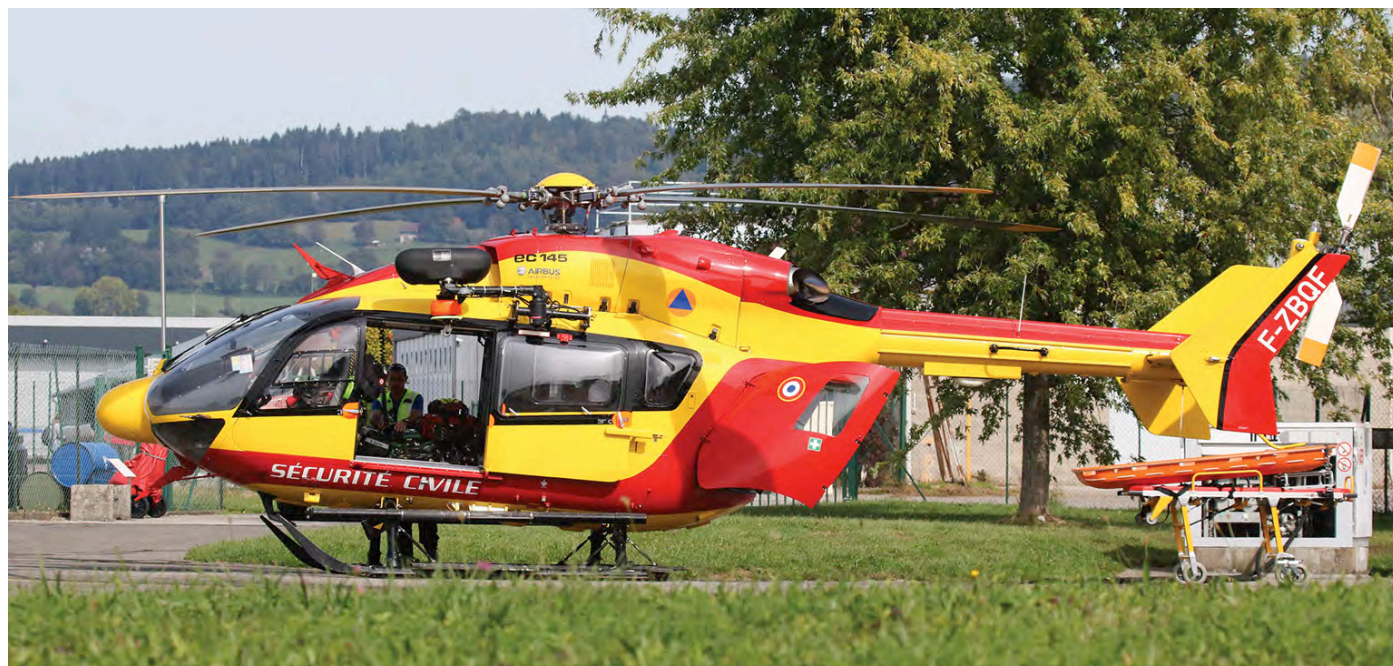
Anney is one of many locations in France where helicopters of the Sécurité Civile are based to support the local population. Leonard van Teeffelen visited Anney on 2 October 2021 and pictured EC145 F-ZBQF in beautiful autumn light.

0282 Leonardo MW f/n, full mks 50282 oct21