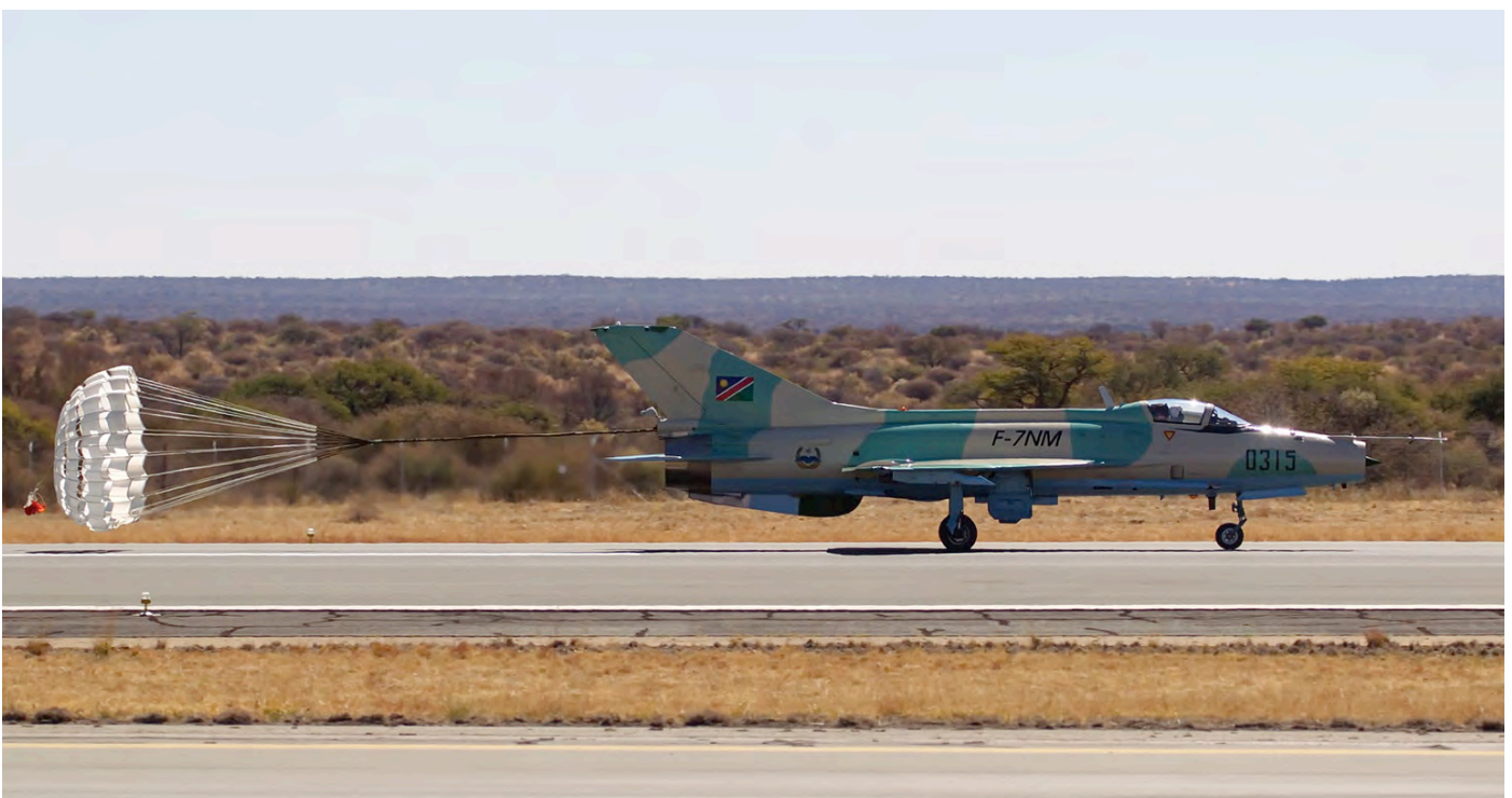
We already published the above F-7NM (exact type is hard to miss...) but back then it was still operational. On 15 October 2021, serial 0315 was badly damaged after it overran the runway at Ondangwa's Andimba Toivo Ya Toivo Airport, ending up upside down. (Windhoek, 1 August 2015, Charles Hugo)

19oct21 XB-RQE Ce401 401-0268 w/o The sole pilot of the Servicios Murbarqui owned Cessna 401 was killed after it crashed shortly after take-off from Tapachula International Airport's runway 05, Chiapas. It was bound for San Luis de Ocosingo Airport, Chiapas, for the release of Mediterranean flies.