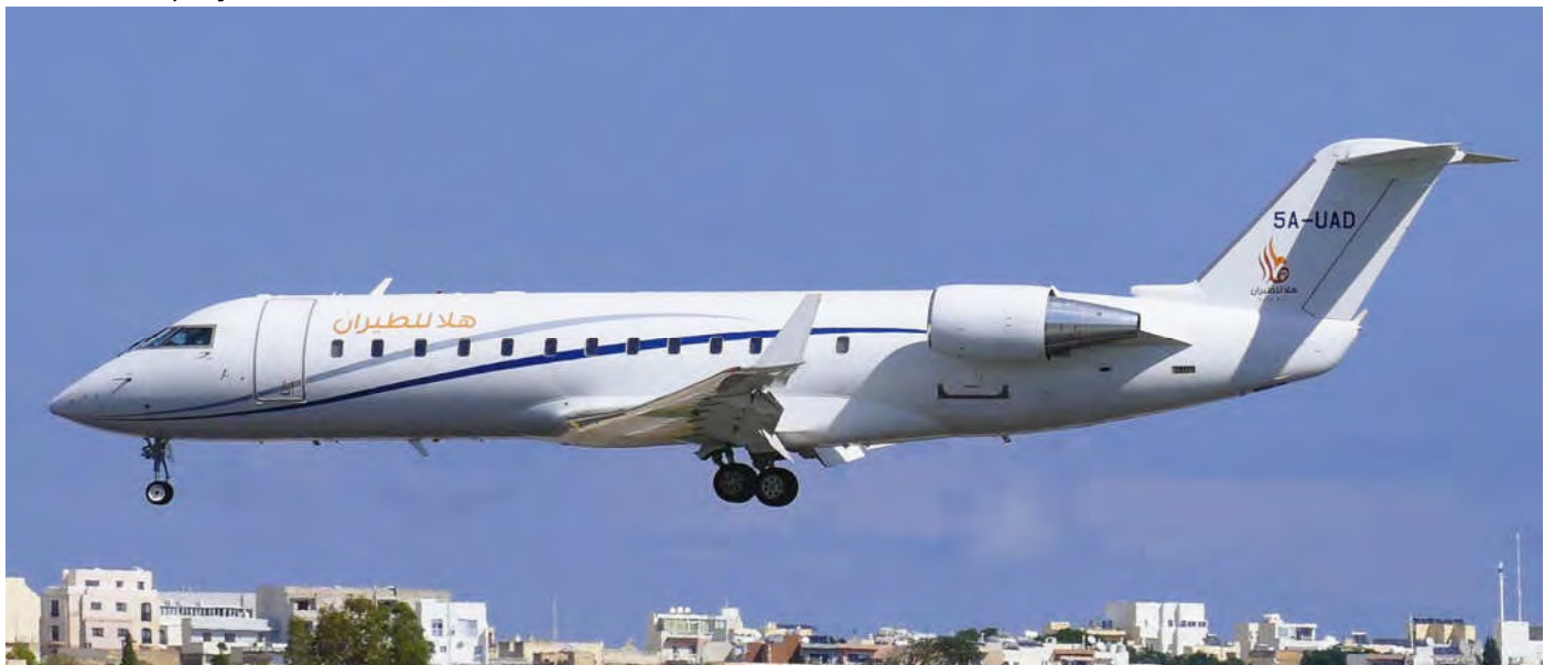
Libyan VIP charter operator Hala Air launched services in early November 2020. It mainly caters for diplomats, business leaders and political VIPs. Their only aircraft is this Challenger 850 registered as 5A-UAD. (Malta-Luqa, 17 October 2021,)