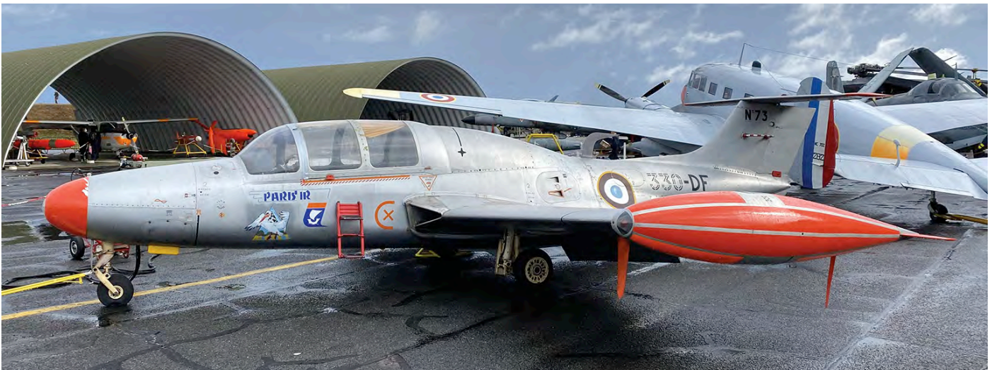
During one weekend a year in September nearly all French museums open their gates for free for the general public. This is a good opportunity to check the Conservatoire de l'Air et de l'Espace d'Aquitaine (CAEA) collection at Bordeaux- Mérignac. MS760 Paris 73/330-DF was one of the many aircraft parked outside. (18 September 2021, Chris Horts)