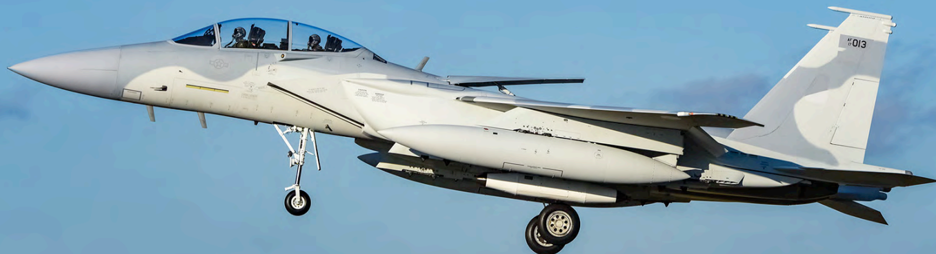
Ababil on finals! The Qatar Emiri Air Force received its first quartet of F-15QAs, locally named Ababil (a kind of birds) staging through RAF Mildenhall on 28 October 2021. Shown here is FMS serial 17-1013.

Because of our standardization we sometimes use type, unit and serial presentations that may strongly differ from those used by the manufacturer or user. It is therefore possible that the information sent by you can deviate from the information we publish.