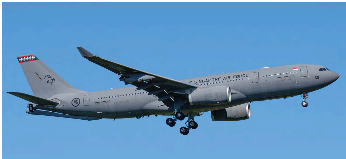
Allegedly helping out the USA, Republic of Singapore Air Force A330MRTT 762 is seen arriving at Ramstein on 3 September 2021. The tanker, operated by 112 squadron was photographed by Han Kaap.