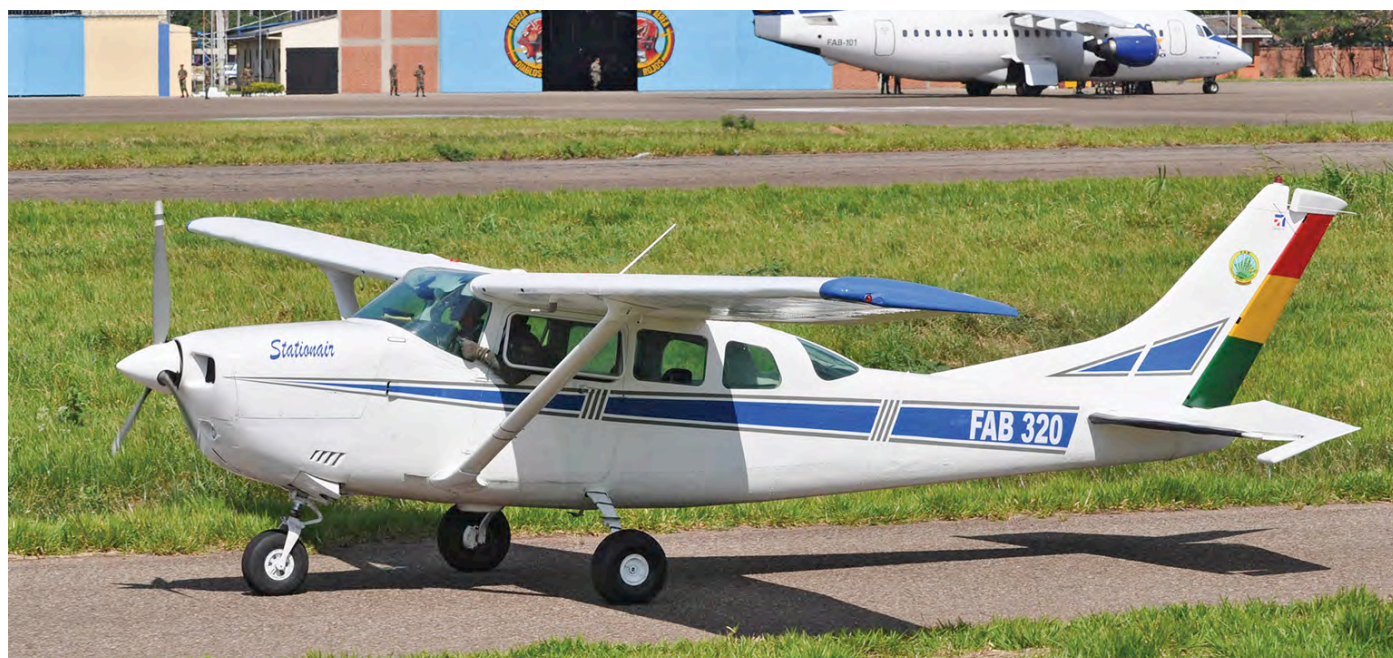
The Fuerza Aérea Boliviana lost Cessna Stationair FAB-320 after it crashed under unknown circumstances, on 9 October 2021. Wim Sonneveld was lucky to see the 206 on 12 October 2013, basking in sunshine, at El Trompillo.