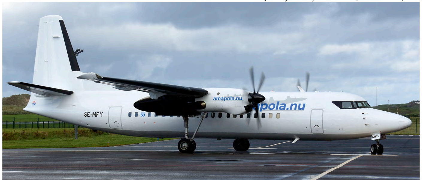
No Fokker news this month, but we do have a picture a "new" Fokker 50. SE-MFY is the latest addition to the twelve strong Fokker 50 fleet of Swedish airline Amapola. It is ex OO-VLS of Air Antwerp, It was painted in these colours at Lelystad between 8 July and 20 July, before being ferried to Malmo on delivery. (Donegal, 01 October 2021,)

Spirit Airlines has decided to lease additional A320neos. The airline reached a deal with SMBC Aviation Capital to lease six more A320neos, which will be delivered between September 2022 and February 2023. The six are coming from SMBC's existing orderbook with Airbus. Next to this addition, the airline also sold and will lease-back fourteen A320neos it had on order directly with Airbus. Spirit also signed a lease-agreement with AerCap for twenty A320neos, which will be delivered between 2022 and 2024. These will also be coming from the existing order book AerCap has with Airbus. In total, the airline now has open orders and lease-commitments for 35 A319neos (directly with Airbus), 89 A320neos (49 directly with Airbus, twenty with SMBC and twenty with AerCap) and 30 A321neos (twenty directly with Airbus, ten with ALC).