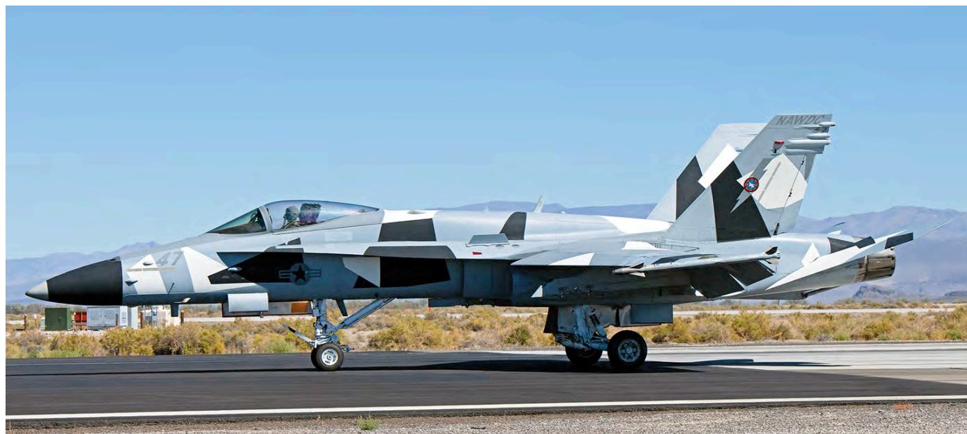
This F/A-18C recently transferred from VFC-12 Fighting Omars to NAWDAC. It carries an arctic camouflage that VFC-12 has on a few of their jets, but is the first Hornet to carry this camouflage at Fallon. (20 September 2021,)

Concerning 09-72118, various conflicting reports reached us mentioning codes 18F and 18G between November 2016