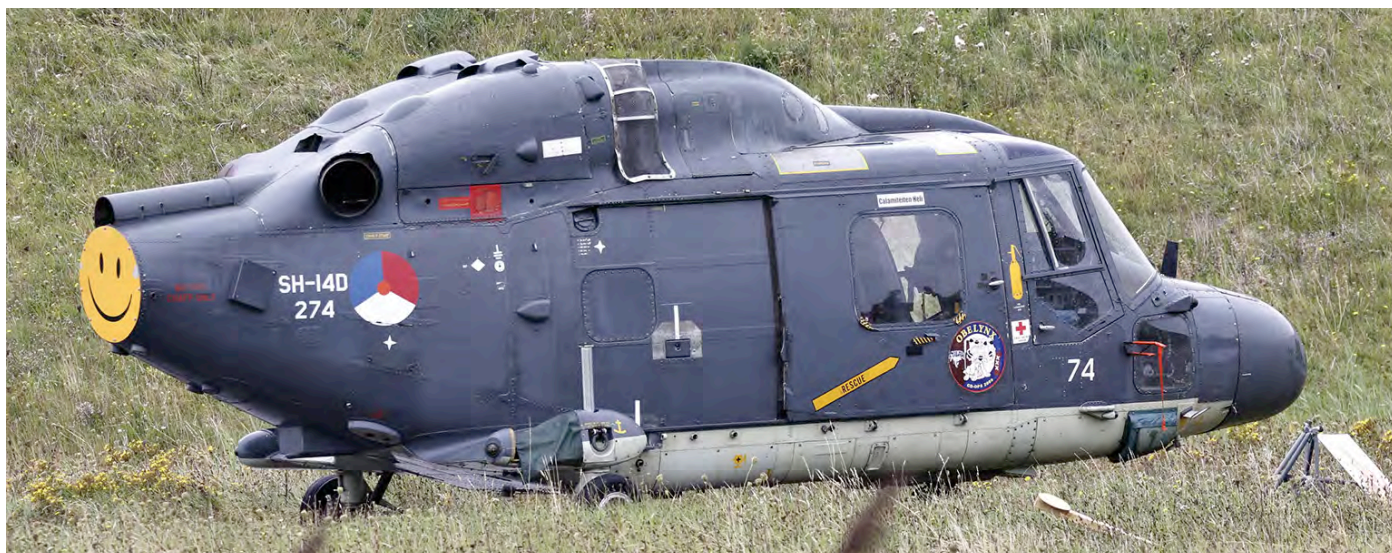
Dutch navy SH-14D 274 is used by the fire fighting department at De Kooij. It is not often that this aircraft can be seen outside, it is normally locked away in a shed. (2 September 2021, Martin Uleman)