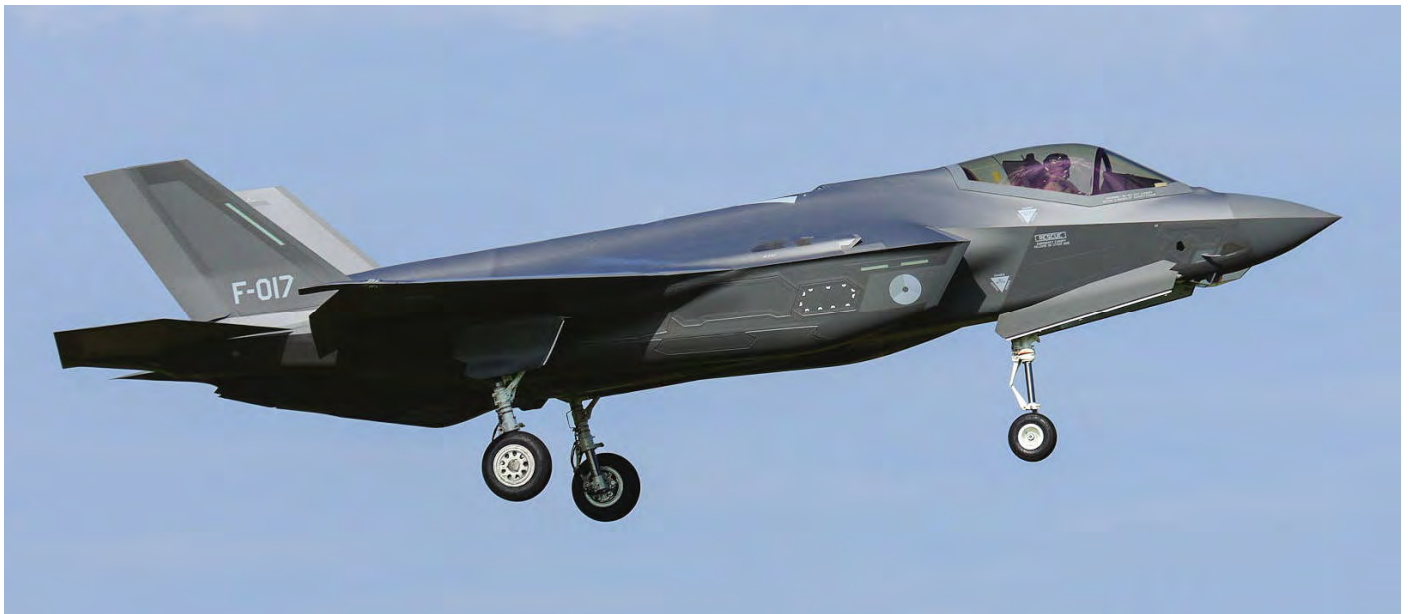
Another participating F-35A is F-017 of locally based 322 squadron. (Richard Baas, 20 September 2021)