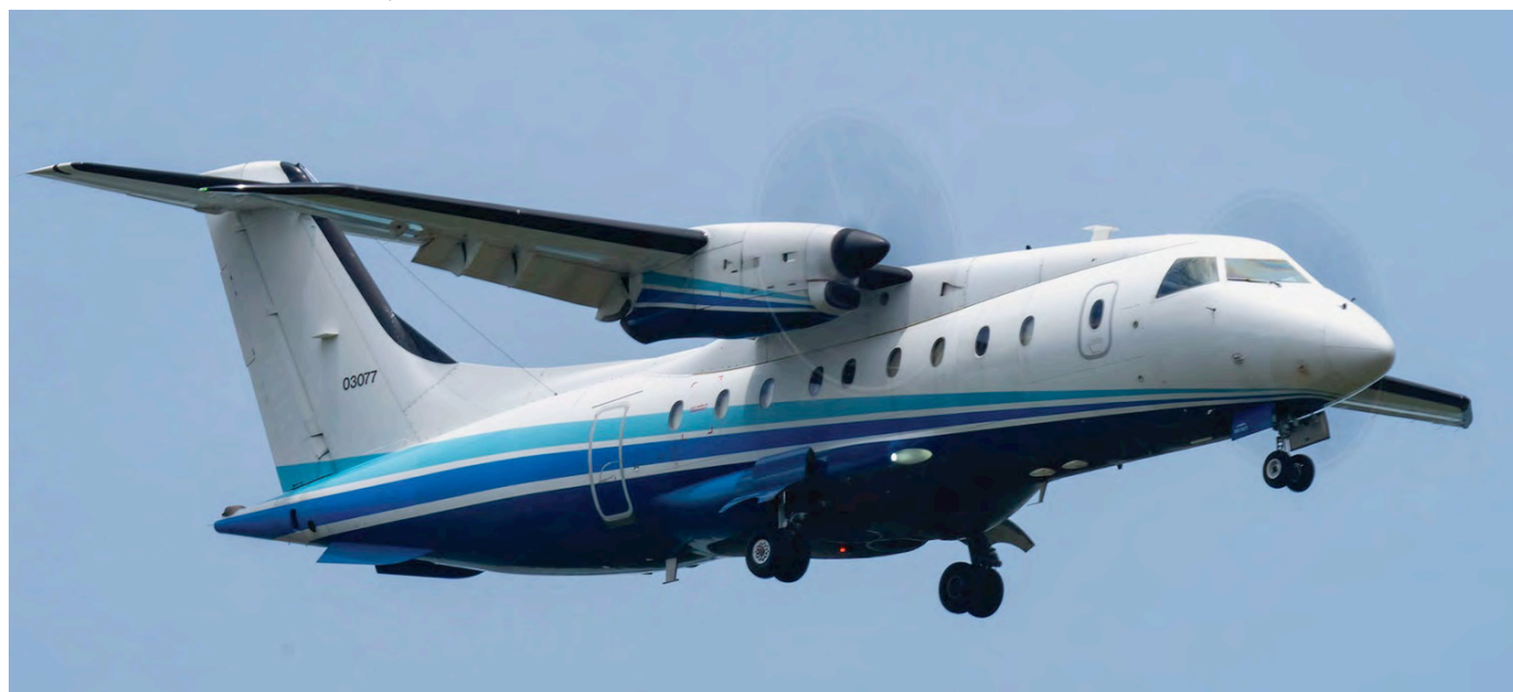
The fleet of USAF C-146s is quite active in Asia. Paya Lebar was visited by 10-3077 on 10 September 2021. (Hans Jacobs)

17-5867 181st AS ex 41st AS 382-5867 oct21