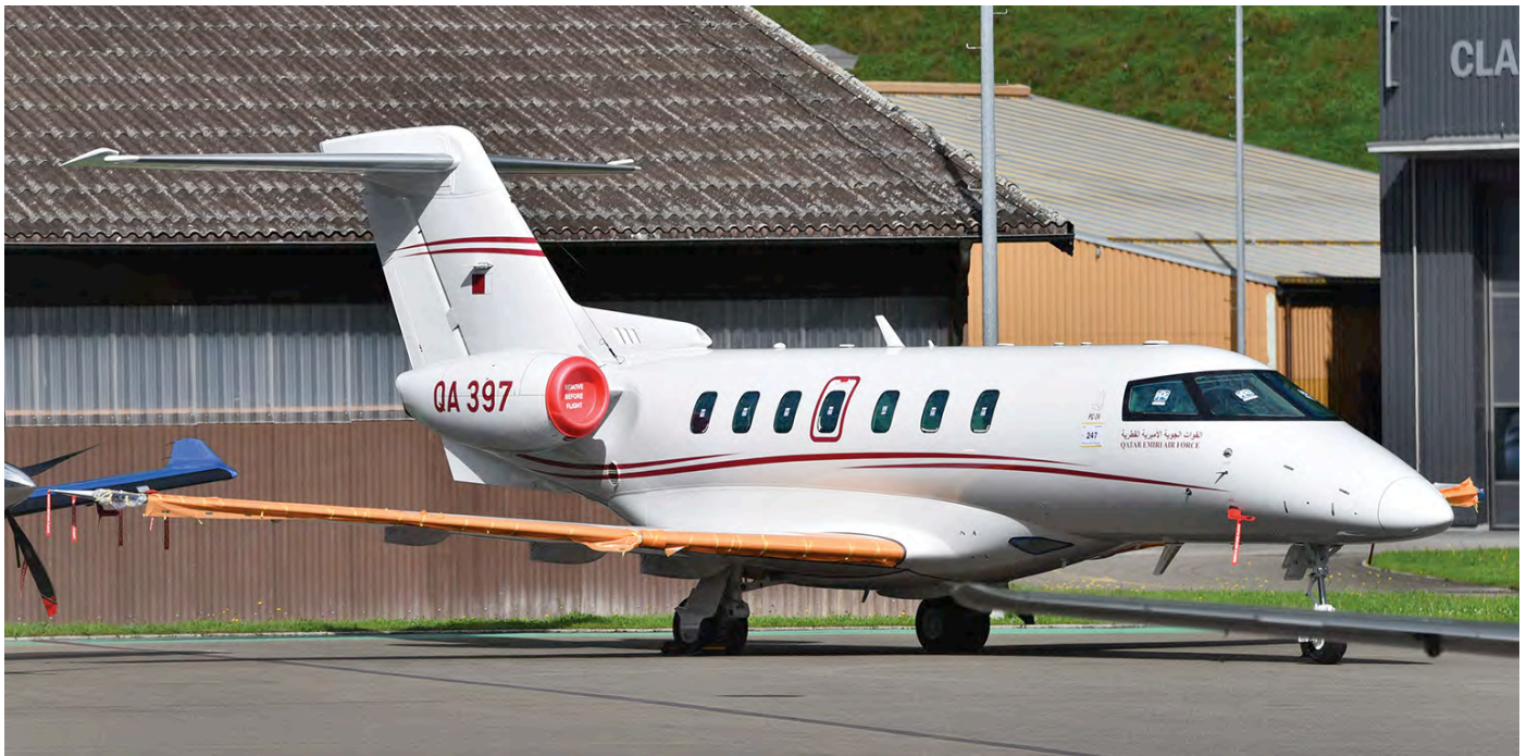
Seen on 28th October in Stans: the first PC-24 for the Qatar Emiri Air Force, QA397, 247). It is temporarily registered as HB-VZA, ready to do a test flight. Meanwhile, the flag of Qatar in the tail and the description 'Qatar Emiri Air Force' under the cockpit window are now covered to hide its destination. (Stans/Buochs, 29 September 2021)

Returned from overhaul at Gifu at the end of September and is still in the old camo colours.