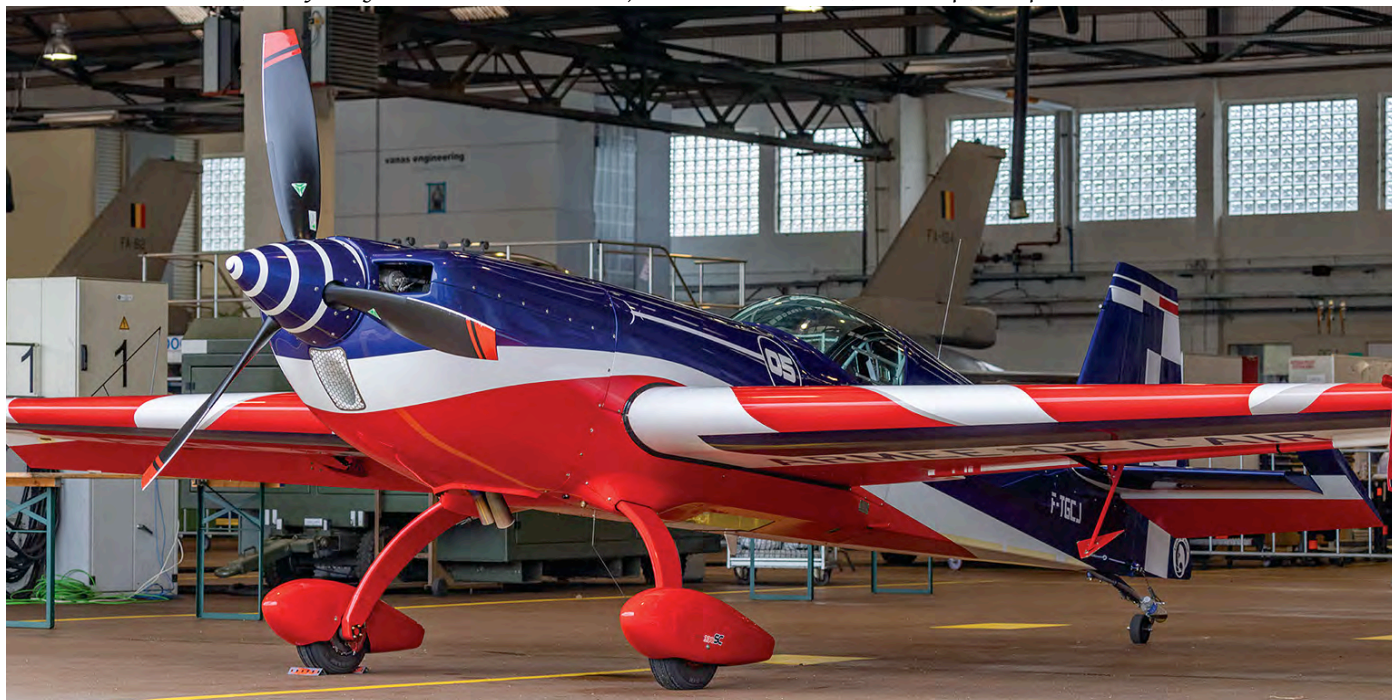
Based at Salon de Provence, the Equipe de Voltige de l'Armée de l'Air (Aerobatics Team of the French Air Force), EVAA in short, is the operator of EA330SC 05/F-TGCJ. This one, with the serial applied externally in a fitting format, was staying at Kleine Brogel for the Sanicole Airshow and photographed by Dino van Doorn on 11 September 2021. EVAA Extras also participated in the shows of La Ferté and Luxeuil.