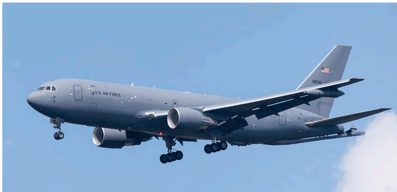
Tim Wolfe supplied a photo of KC-46A 18-46041, flown by the Edwards AFB Flight Test Unit, testing the Wing Aerial Refueling Pod System (WARPS). It is on a two month TDY for testing the system with F-15s and was seen landing at Seymour Johnson AFB, NC on 29 September 2021.