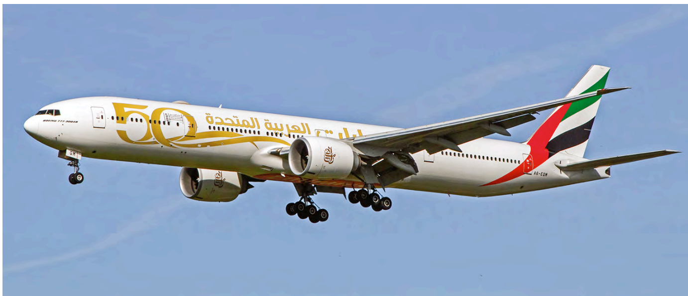
Emirates Boeing 777-300ER A6-EQM was painted in special “Year-of-the Fiftieth” colour scheme in September. As of late October, two Emirates A380s and four 777-300ERs wear these special colours to mark the UAE’s landmark Golden Jubilee celebrations. On 2 December, the UAE will celebrate the 50 year anniversary of their unification and independence. (Geneva, 19 October 2021, Robert Erenstein)

B737-300s. Its last aircraft in the fleet, YR-CBK (25162) has been stored at Craiova since 30 June 2020.