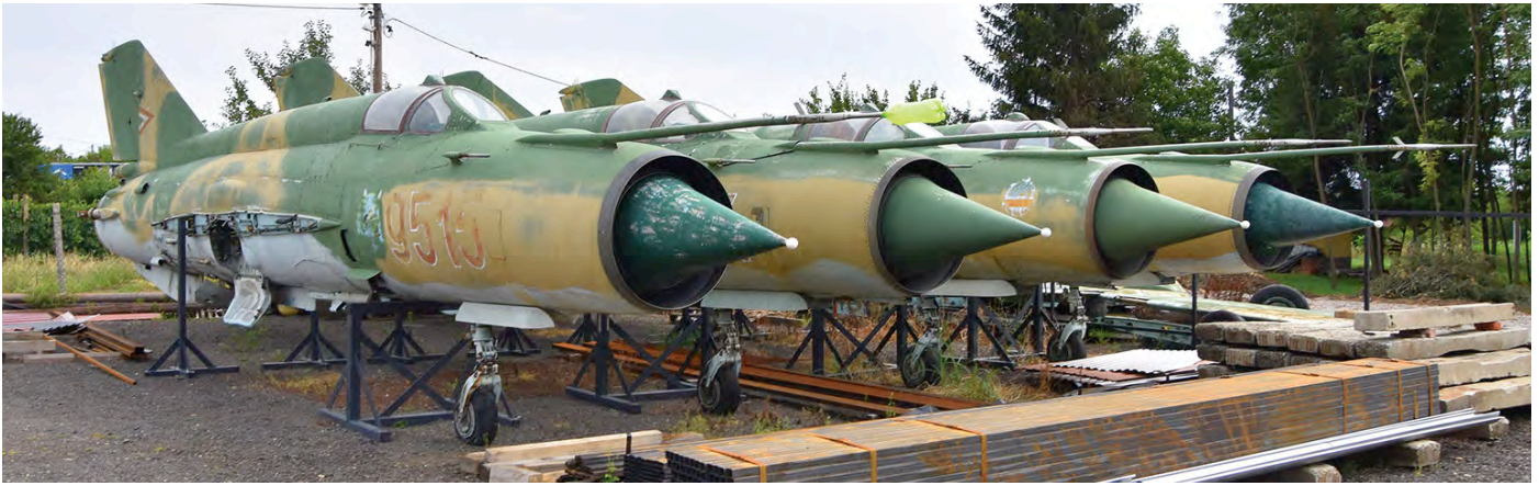
Hungarian MiG-21MF 9515 heads a line of two MiG-21MFs and two MiG-21bisAPs in an open storage at Hatvan. (6 September 2021, Erwin Alexander)

WD319 Chipmunk T10 F-AYDC C1/0256 sep21 The first three are in the large hangar on the east side, across the public road. The Chipmunk is next door and used to be OY-ATF (based at Ringsted). MS733 61/F-BKOG is no longer here. Also the stored MS733s at the garage in the nearby village have gone.