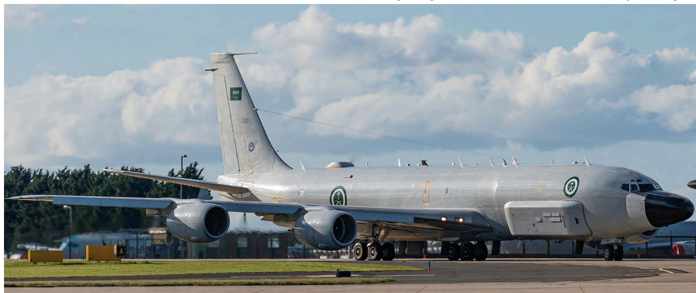
On the morning of 30 September 2021, Royal Saudi Air Force RE-3A, 1901 from 19 Sqdn arrived at RAF Waddington for a night stop on the way to the USA for rework. This is a very rare beast in the UK and in fact this part of the world.

Was operated by 1st Region with the name Etopirika but noted at Akita with the name Hakutaka. This means it has changed regions and is now flown from Sendai by 2nd Region.