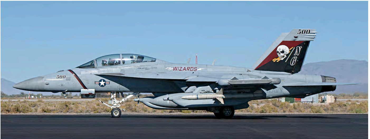
The Wizards CAG bird showing off the Squadrons colors of black and maroon on a ribbon in front of the cockpit wrapping around the fuselage. It appears that VAQ-133 Wizards has updated their squadron tail markings. Traditionally, they had the trident and an atom symbol, but now, there is a skull superimposed over that pitchfork, and the atom is on its forehead. (NAS Fallon, 20 September 2021, Nate Leong)