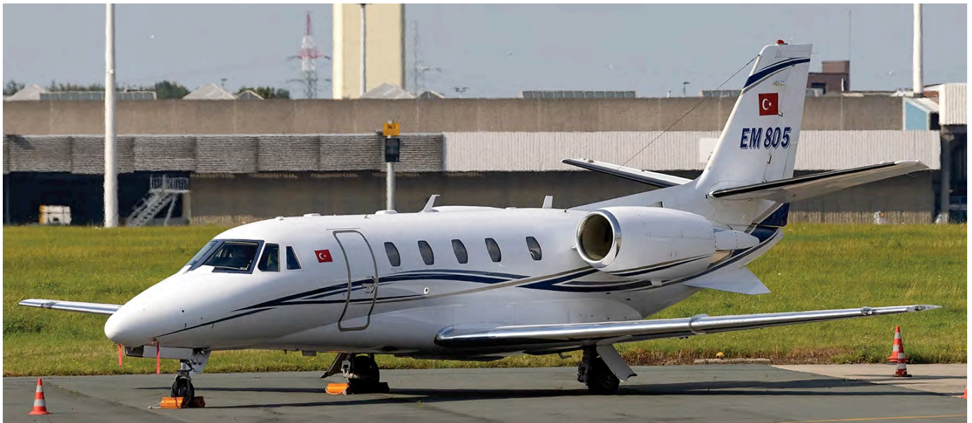
Another nice Brussels visitor was Cessna 560XLS+ EM-805, operated by Emniyet, a branch of the Turkish Ministry of Interior. It was photographed on 16 September 2021 by Dino van Doorn.