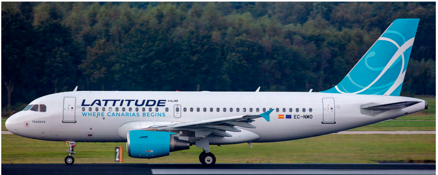
Real Sociedad chartered Latitude Hub A319, EC-NMO, to fly their team back to San Sebastian the day after the Europa League match against PSV Eindhoven which was held on 16 September. (Eindhoven, 17 September 2021, Bjorn van de Moosdijk)