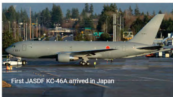
First JASDF KC-46A arrived in Japan