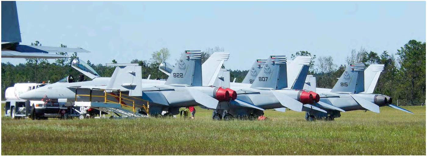
Kuwait is in the process of receiving their F/A-18E. This flock consisting of 807, 815, and 822 were seen at Stennis Intl/Bay St. Louis, quite a catch! (23 September 2021)