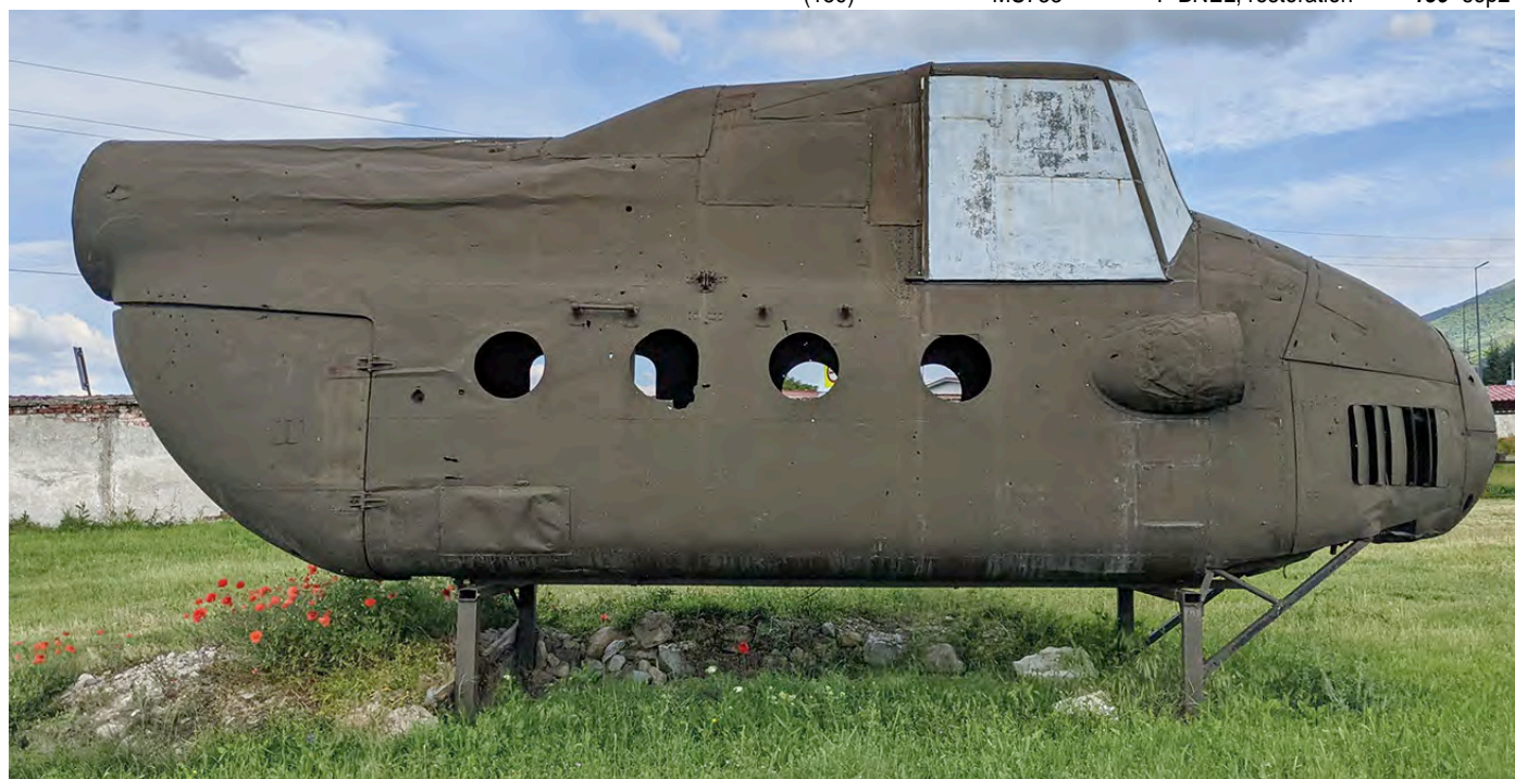
Not looking very spectacular, but this Bulgarian Mi-4 18 is still an interesting aircraft. It is used as instructional airframe at the barracks at Karlove and came from the nearby range at Anevo. (3 June 2021, Ivan Voukadinov)

(289) MH1521M F-GLMF, stored 345 sep21 (100) MS733 (F-BMMR), stored 100 sep21 (159) MS733 F-BNEL, restoration 159 sep21