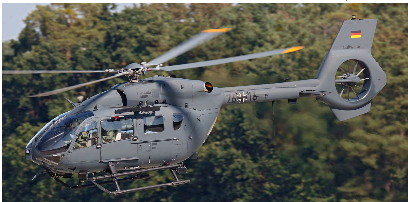
New kid on the block of WTD-61 at Manching is H145M 76+16, the first one of a Luftwaffe follow-on contract of the H145M. It was seen at its home base on 14 September 2021.

The last three Sentry aircraft in use were ZH101/01, ZH103/03 and ZH106/06. All three are currently stored at RAF Waddington pending disposal. They type is being replaced by three Wedgetail AEW1 aircraft in 2023, which will be stationed at RAF Lossiemouth. As an interim solution, NATO E-3A aircraft