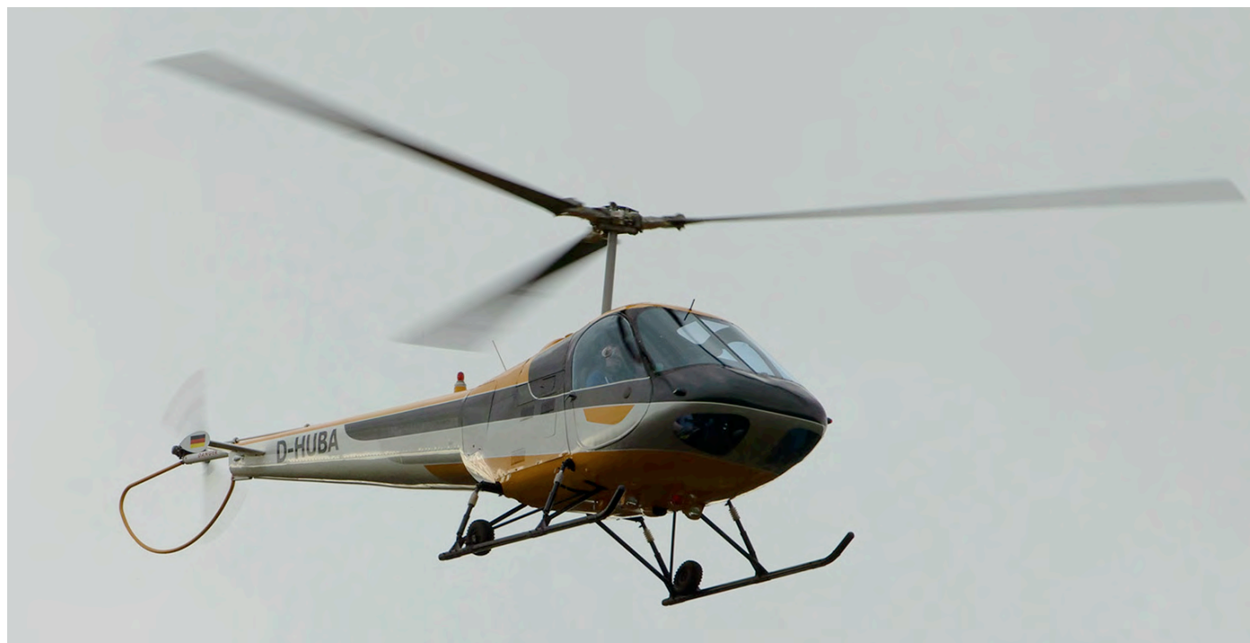
Enstrom F28A D-HUBA is one of the more than 1,200 built Enstrom F28 and variants. The original design of the helicopter dates back to the 1960s and was produced by Enstrom from 1965 onwards. (Twente, 19 September 2021, Arjen Vonk)

September 2021 03.HI1052 ERJ145ER Sky High Aviation N578CJ Ce525 Central Charter De Colombia 04.ZS-JNE Ce421 arr 07.PS-BMD Lj31A Brasil Vida Taxi Aereo 08.N578CJ Ce525 Central Charter De Colombia 10.HI1052 ERJ145ER Sky High Aviation N560SW EMB120ER(F) Ameriflight PH-FBH AW139 DCCG 14.N876RA Ce560XL Parminter Investments 15 16.N651MK Sabre 65 My Jet 17.HI1053 ERJ145ER Sky High Aviation N566SW EMB120ER(F) Ameriflight 18.N470PR Beech A100 Prinair N777SJ Falcon 7X Jon L. Stryker 26 24.HI1052 ERJ145ER Sky High Aviation HI955 Ce560XLS Helidosa N560SW EMB120ER(F) Ameriflight 25.D-ASIM Falcon 7X Air Hamburg 26 AHO9393