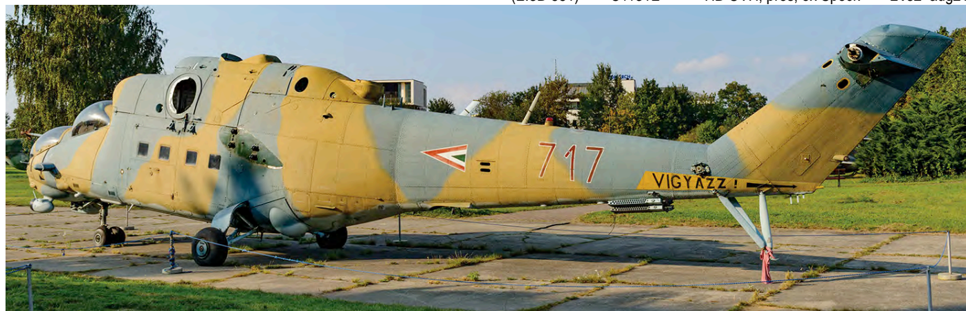
In 2020 two Polish Mi-24Vs were reported as stored at the Muzeum Lotnictwa Polskiego at Kraków Rakowice. By mid-2021 these two were seen at Inowroclaw and in the museum they are now replaced by Hungarian Mi-24V 717. A month earlier this aircraft was still stored at Szolnok. (14 September 2021, Erik Sleutelberg)

Colmenar Viejo HT.17-02/ET-402 CH-4D stored oct21