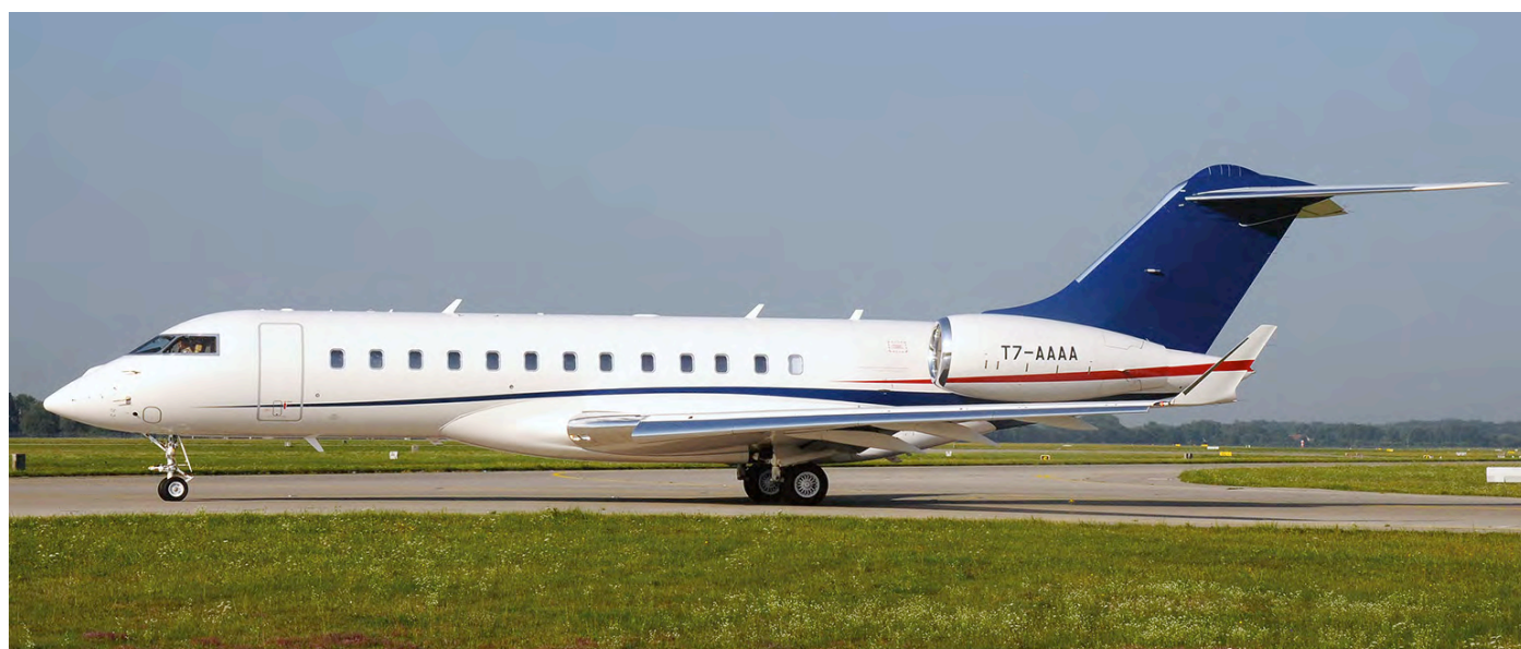
Bombardier Global 6500 (msn 60016) was delivered to Starjet in March this year, registered as T7-AAAA. Bombardier's registrations for this new Global were C-GK BX and N63GX. (Munich, 15 August 2021)