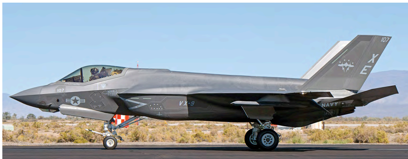
This F-35C Lightning II comes from VX-9 Vampires at NAWS China Lake (CA). It participated in the current Top Gun class. (NAS Fallon, 20 September 2021,)

Credits: FAUnaticos, Clive Bartram, Danny Bonny, Ian Carroll, Pete Cole, Juan Cosmo da Penha, Edwin de Greeuw, Damiano Gualdoni, Joris Heeren, Andy Marden, Daniele Mattiuzzo, Alan Nightingale, Jeff Rankin, Jos Stevens, Peter Weinert