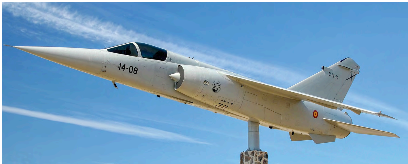
On Friday 24 September Spanish Mirage F1M C.14-14/14-08 was unveiled as a monument in the town of Boadilla del Monte, a mere 20 kilometres west of Madrid. (19 September 2021, Paco Rivas)