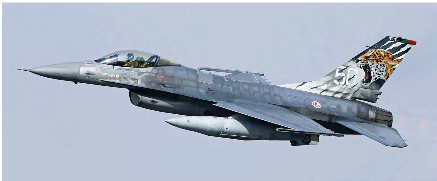
The F-16s of Esq201 and Esq301 at Beja are operated in one pool, but Esq301 Jaguares is the one with the tiger tradition. F-16AM 15105 with its beautiful '50 years' tiger tail departed from Kleine Brogel on 13 September 2021 after the Tiger Meet.