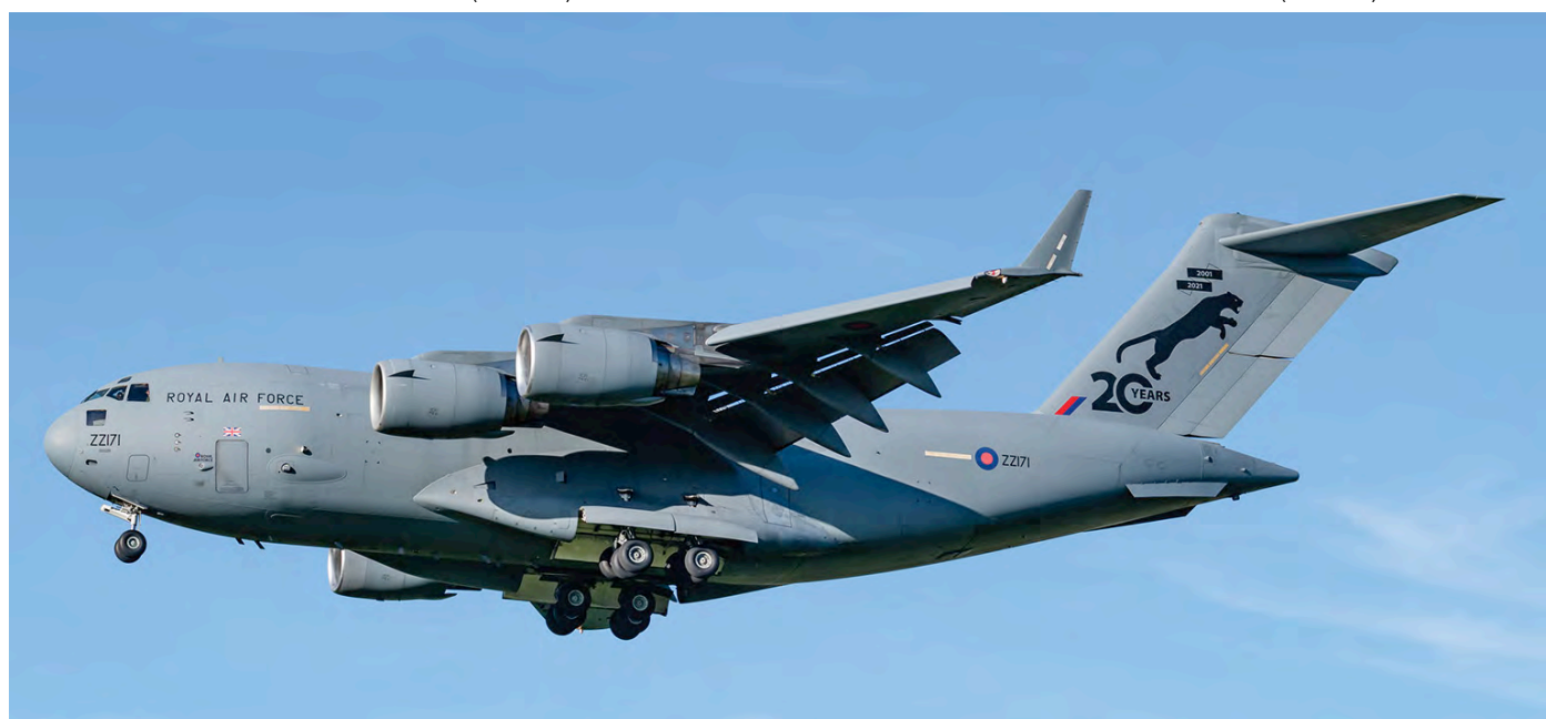
Royal Air Force C-17A ZZ171 received extra anniversary markings, celebrating 20 years (already!!) of C17 service within the RAF. It was seen landing at Brize Norton on 21 October 2021.