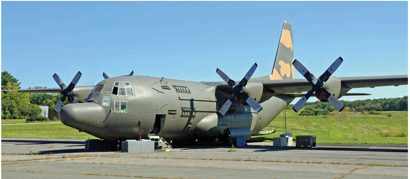
While on a visit to Stratton ANG Base to photograph LC-130s, Raymond Rivard visited the Empire State Aerosciences Museum located on Schenectady County Airport, near Albany, NY. They have a very good collection of aircraft there. Capturing the photographer's interest was this Operation Credible Sport (ed. attempt to free hostages in Iran in 1980) YMC-130H 74-1686 being restored. (16 September 2021)

AFTD Aviation Flight Test Directorate at Huntsville (AL) BEST BEST Aircraft Consolidation Facility at 248 Dunlop Blvd, Huntsville (AL) Boeing Mesa Boeing at Mesa (AZ)