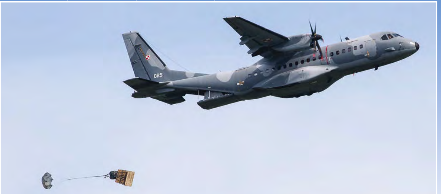
Regular participant of Falcon Leap is the Polish Air Force. Manolito Jaarsma pictured C295M 025 of 8 BLTr over Deelen on 6 September 2021 dropping a load.