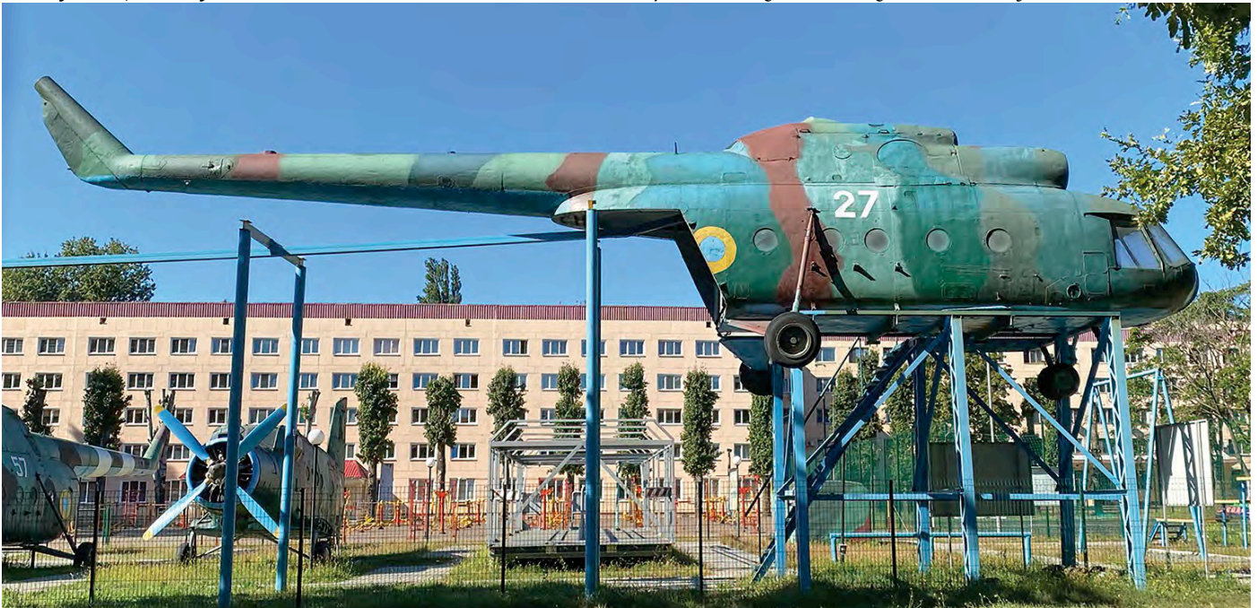
Ukraine Mi-8T 27 white is one of the four aircraft present on the grounds of the Military Academy in Odessa. (20 September 2021)