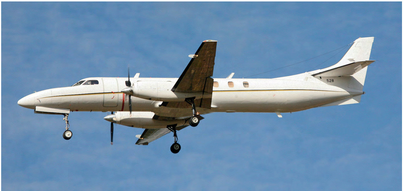
Rather anonymous looking C-26D 900528 at Ramstein on 30 September 2021. This US Navy bird is operating from Naples, Italy and is only displaying the last three of its serial.