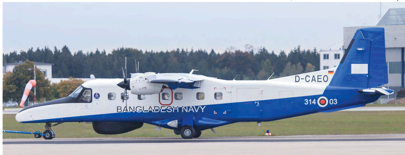
On 19 October 2021 this 314-03/S3-VHS, the first of two additional Dornier 228NG for the Bangladesh Navy emerged from its stable. That stable used to be called Dornier and RUAG but is now owned by General Atomics AeroTec Systems. (Oberpfaffenhofen, Alexander Lutz)

MD530F ... maintenance trainer at OAKB aug21 258 wreck at OAKB 0258FF aug21 301 left behind at OAKB, disabled 0301FF oct21 327 ex OAMS, now at OAKB 0327FF sep21