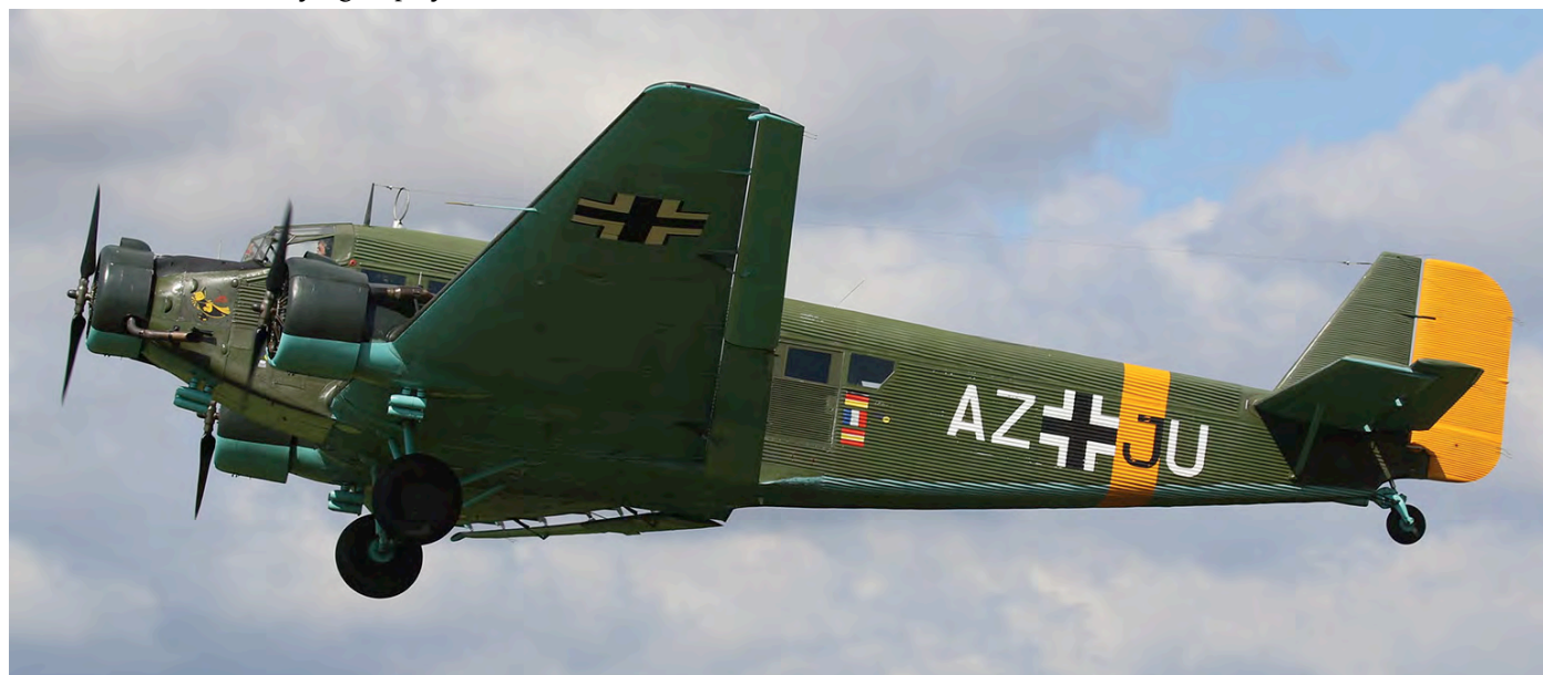
Even in her second life as a large warbird, CASA 352 F-AZJU has become a veteran. Amicale Jean-Baptiste Salis has been operating this propliner at air shows now for over 18 years, after a 12-year restoration. (La Ferté-Alais, 28 August 2021,)

The nine jets marked with # performed the Tiger Tails flyby on Sunday, although just five of them actually had some form of tiger markings. For the Rafale M and both dual F-16s this was their only part in the flying display. The other two Rafales were used by Vautour Bravo. The Danish T-17s are flown by the Baby Blue team, six aircraft nowadays, but without their usual leader in Belgium. T-415 has a gorgeous silver and dayglo coat to honour 75 years of Chipmunks. The full text on the SF260 tails reads '50 Years SF-260 Serving Belgian Air Force 1969 - 2019' and they wear additional Red Devils and '75 Years of Freedom - Belgian Air Force' stickers.