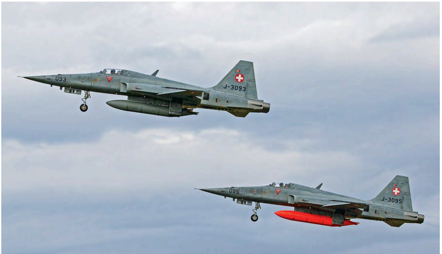
Robert Erenstein visited Payerne on 20 October 2021 and photographed a lot of Swiss Air Force action. One of the active F-5Es was J-3095, mated to a rather inconspicuous fuel-tank. And is that a small painted edelweiss on its nose, the national flower of Switzerland?