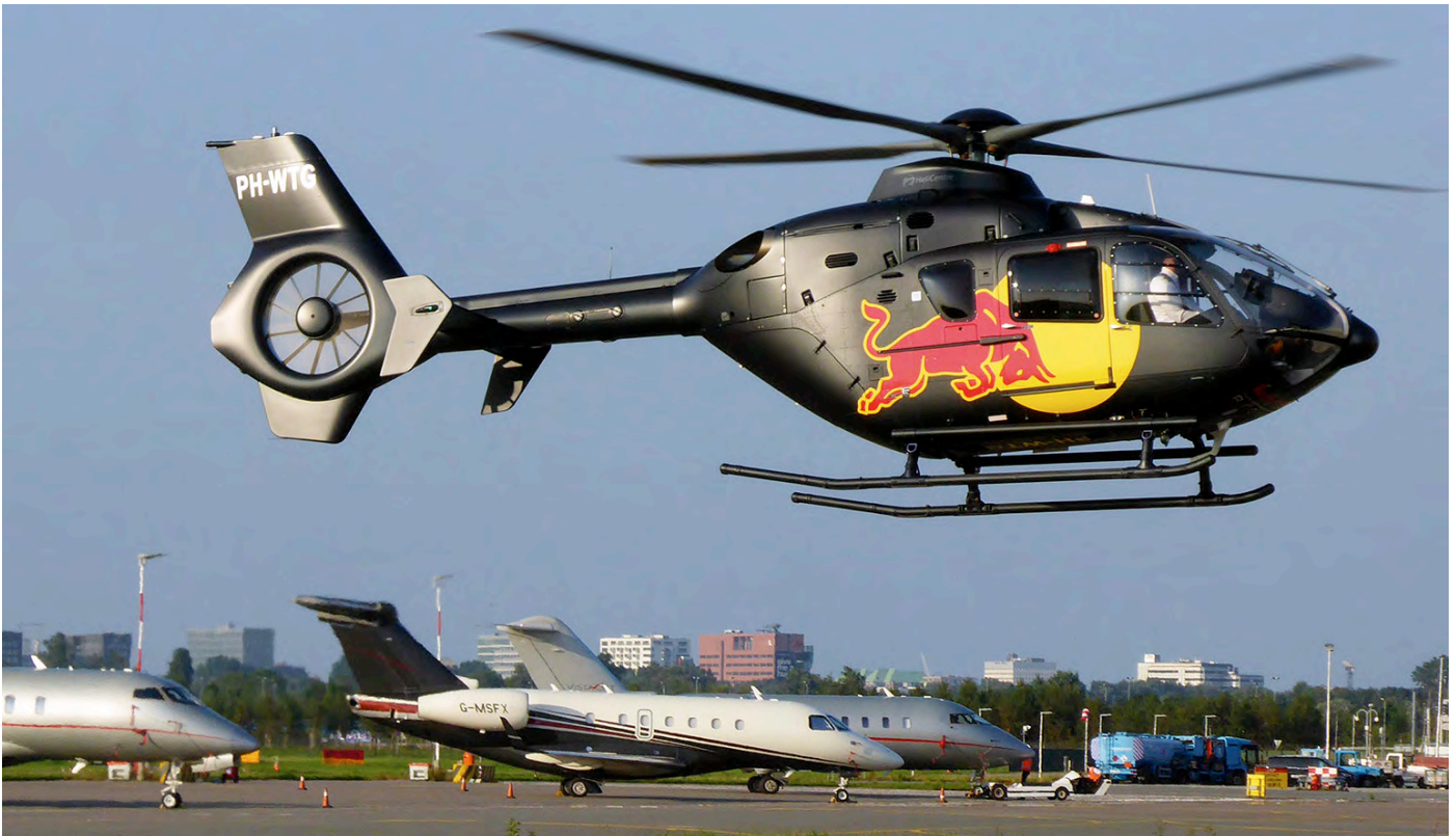
HeliCentre's EC135 PH-WTG was used to fly the Red Bull team members and dignitaries during the Dutch Formula 1 Grand Prix to and from the Zandvoort racing circuit. For this occasion a big Red Bull sticker was placed on either side of the helicopter. (Amsterdam-Schiphol, 02 September 2021, AdJan Altevogt)