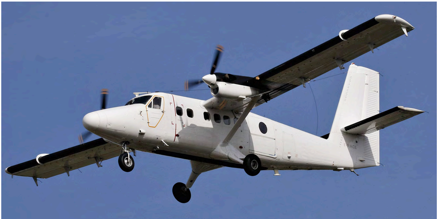
Easily mistaken for a civilian Twin Otter in this anonymous guise, Martin Uleman recognized registration F-RACE on ADSB to be a French Air Force aircraft and stopped at Brussels for a photo on 28 September 2021. Its serial 300 is not visible on the photo and most likely not even applied.