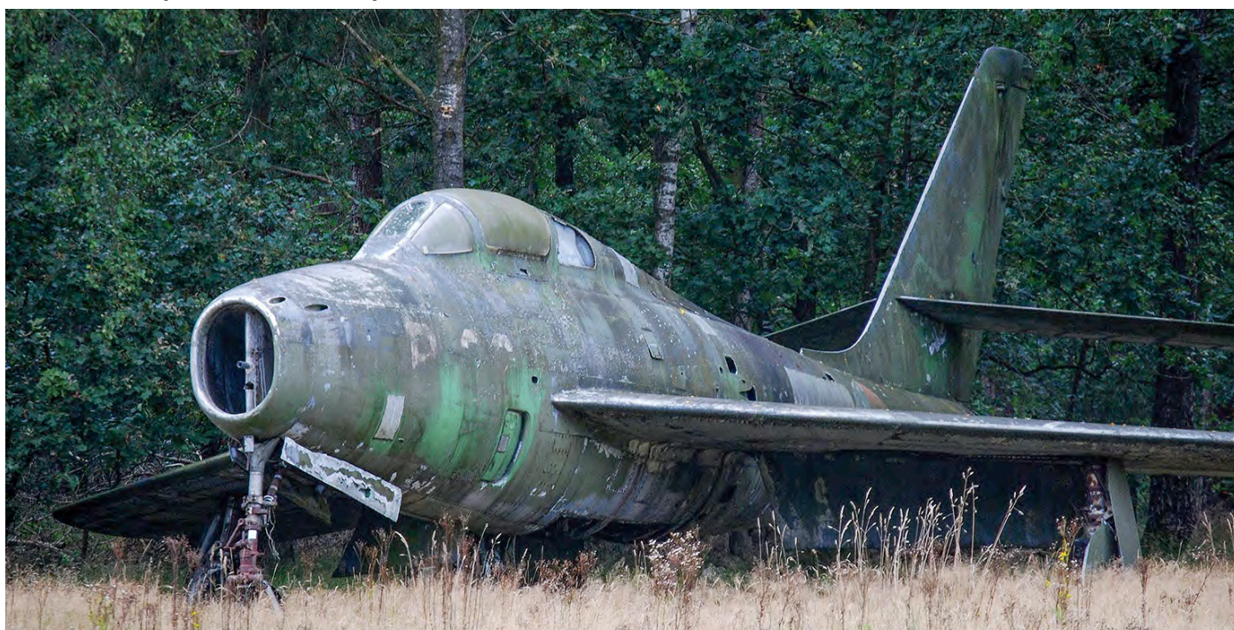
Dutch F-84F P-224 is one of the two F-84s still at the army base at Reek. (26 August 2021, Carlos Geurts)