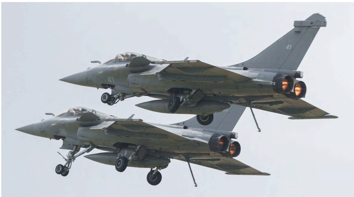
As stated above, Air Legend 2021 gave a nice mixture of historic and modern aircraft. The French Navy, the Marine Nationale, was present with several types in its inventory, including these two Rafale M shipboard fighters, 36 and 41.