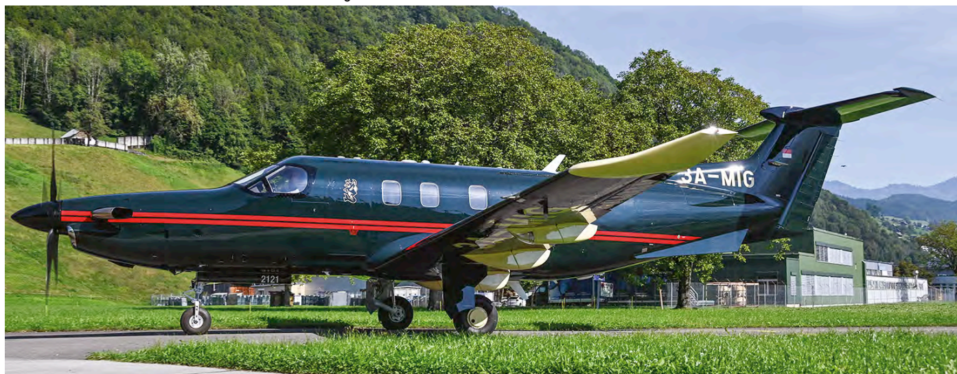
Whilst the previous 3A-MIG, PC-12/47E msn 1651 was painted in a white/grey colourscheme, the new 3A-MIG is almost completely black. This is one of the newer NGX variant, its msn being 2121. Deliveries of the PC-12 NGX are proceeding at a very rapid pace! (Stans, 23 September 2021, Stephan Widmer)