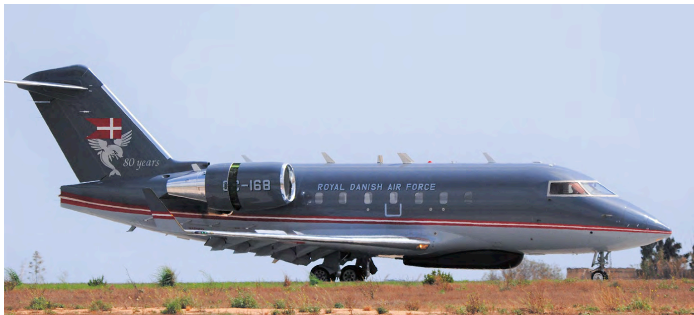
Royal Danish Air Force CL-604 C-168 was one of the participants of the Malta Air Show and seen arriving and photographed by Frank Call on 23 September 2021. The Challenger is one of four operated by Eskadrille 721 from its base at Alborg.