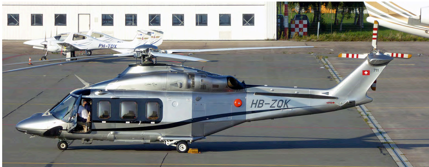
Another helicopter used during the Dutch Grand Prix weekend was Lions Air HB-ZQK. The AW139 flew all the way from its home base Zurich to Schiphol just for the occasion. (Amsterdam-Schiphol, 02 September 2021, AdJan Altevogt)