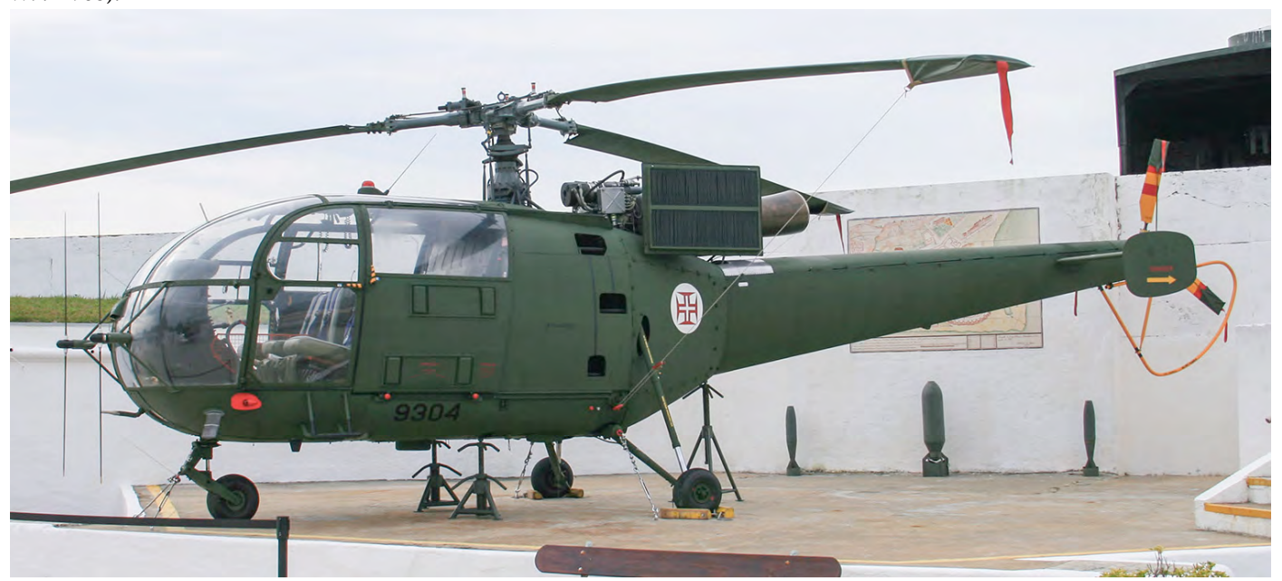
Alouette 3 19304 was handed over to the Museum of Combatants at the Fort of Bom Sucesso in the harbour of Lisbon on 5 November. This museum also has the forward fuselage of G91R/4 5420 on outside display. (13 November 2020, Rui Ferreira)

XZ233/636 Lynx HAS3S 010 nov20 Jet Art Aviation took delivery of a Lynx from Everett Aero on 19 November 2020.