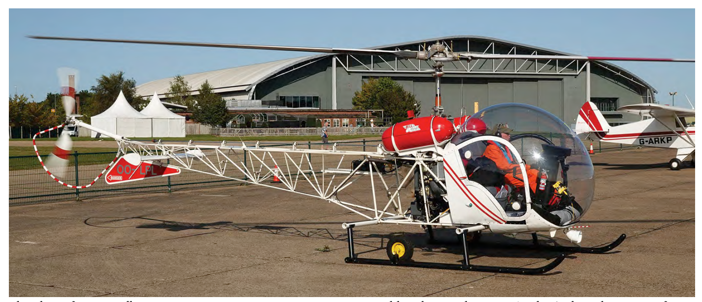
This photo of Agusta-Bell 47G 00-LPL can cause strong M.A.S.H. sentiments. Although painted in a very 'civilian' colourscheme, it is a former military machine. It started its career flying for the ALAT (French Army) as 069. Declared surplus the helicopter became F-BHPG. In May 2019, after being testflown as F-BXXK, the machine left for Belgium. It was registered there as OO-LPL in June 2019. At the moment it is still based at Leopoldsburg, Belgium, but not for long: the chopper is said to be sold to France on 23 November 2020. (Duxford, 17 September 2020,)

the Sea Vixen to the air. The fighter, affectionately known as "Foxy Lady", was truly one of a kind, as it was the only airworthy Sea Vixen in the world. At least she was until 27 May 2017 when the aircraft made a wheels up landing at Yeovilton. It unavoidably resulted in considerable damage to the underside of the aircraft. In the period since then, Navy Wings have done their utmost to find funding for the repairs, which were estimated at just over GBP 2 million but unfortunately failed to get this amount together. And that is why the Board of Trustees of Navy Wings has reluctantly made the decision to stop investing vital funds into preparing her for flight. Instead Navy Wings will now focus their efforts on the Sea Fury FB11 VR930 and aim to get her flying alongside the Sea Fury T20 VX281 (G-RNHF) making a magnificent Sea Fury Pair.