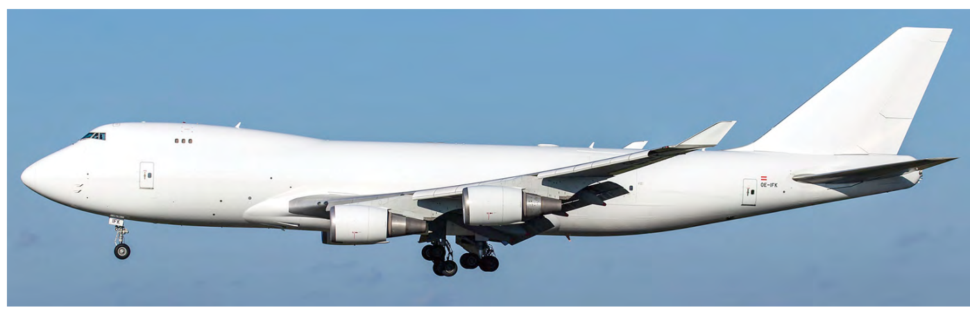
Although unfortunately still all white, OE-IFK is one of a pair of Boeing 747-4KZF freighters new to the ASL Airlines Belgium fleet. Both aircraft (this one and OE-IFM) were originally destined for Nippon Cargo Airlines but not taken up by them. (Liège, 31 October 2020, Jochem Jottier)