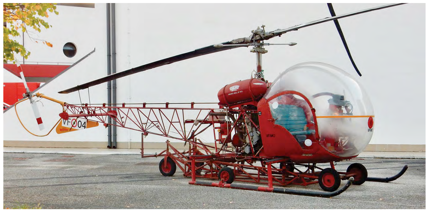
Updating Scramble 497's info about Marghera. AB47G-2 VFMO/VF-04 is not stored, as can be seen from this picture by Hans van der Vlist on 23 September 2020, but is preserved. A more accurate location for the VVF training facility is reported as Venezia Mestre.