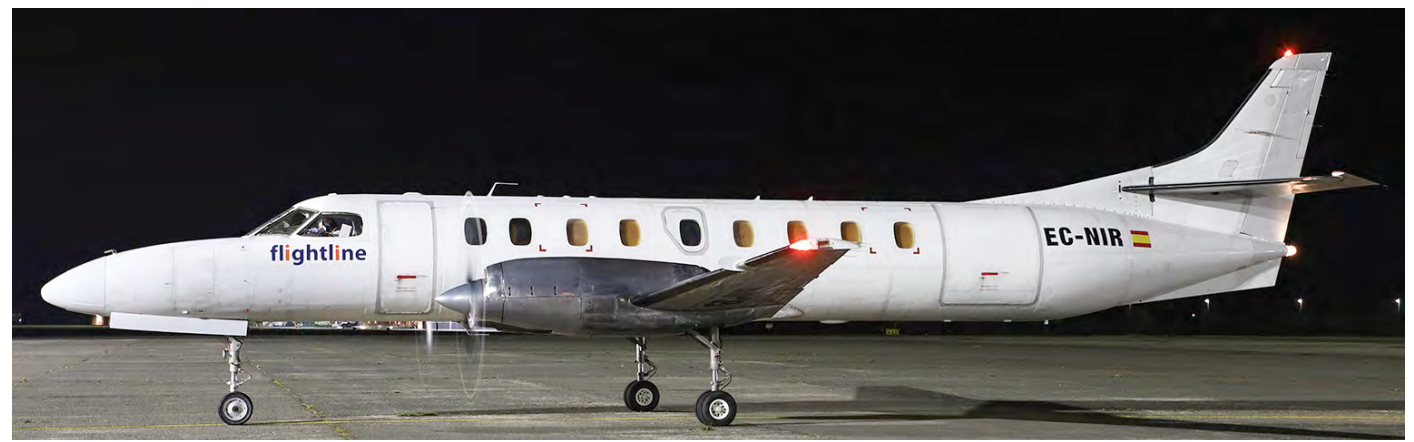
Previously operated by Aeronova as EC-IXL, this SA227AC Metroliner has been added to the Flightline fleet as EC-NIR. (Ostend, 7 October 2020,)