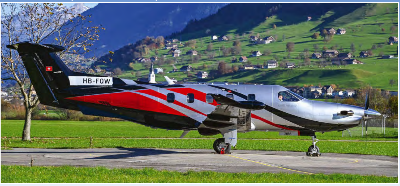
The last colourful PC-12 is the HB-FQW, which will become N856SM. (2 November 2020)