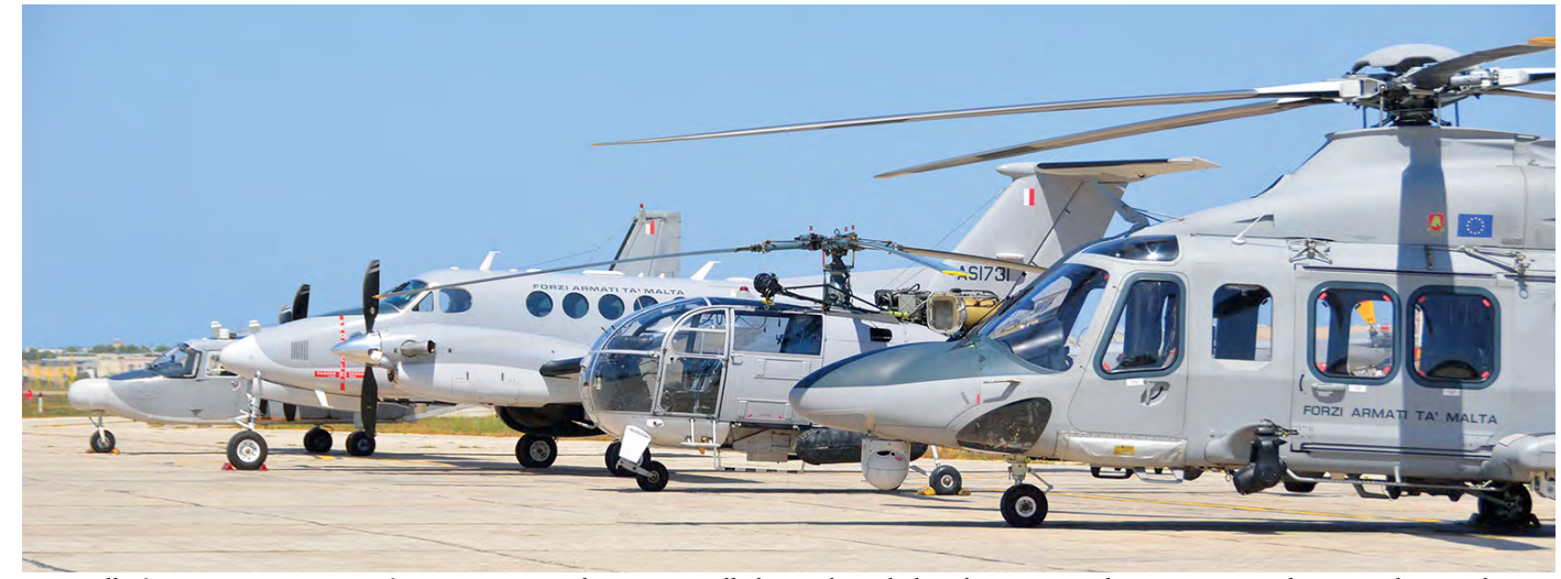
Especially for our reporters, one of every operational type was pulled outside and placed on a "static line" in great Maltese weather conditions. (31 August 2020, Rene Sleegers)

The expulsion of the Libyan mission made links with Italy grow stronger, resulting in Italy pledging to recognise Malta's neutrality and offering a greater level of assistance. In the beginning, the SAR tasks were flown by Aeronautica Militare (Italian Air Force) AB204Bs and later on by AB212s