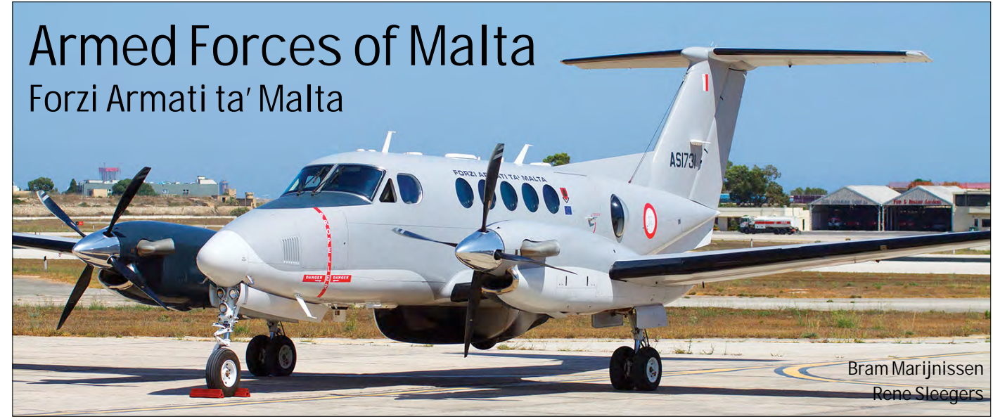
The big game changer for the Armed Forces of Malta was the Beech 200 MPA. This is the newest Beech which was delivered in 2017. Photos in this article were taken at Malta-Luqa, unless otherwise noted. (31 August 2020, Bram Marijnissen)

With almost all air shows and exercises having been cancelled worldwide in 2020 due to the COVID-19 pandemic, we managed to visit the Armed Forces of Malta in the period that it was safe and also allowed to travel.