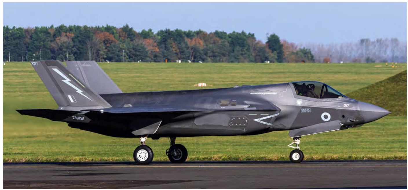
Working up the F-35 to frontline service is the main theme of this page. F-35B ZM151/017 of 617sq participated in exercise Crimson Warrior for this goal at Marham. (4 November 2020)