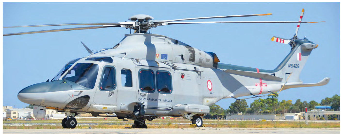
The year 2016 was a milestone for the Armed Forces of Malta because the very first mission with a completely Maltese crew was flown, with an AW139. This shiny AS1428 was framed by author Rene Sleegers on 31 August 2020.

The AFM is patrolling a very large area around Malta: 60 kilometres to the north (to Sicily, Italy), 800 kilometres to the east (to Crete, Greece), 350 kilometres to the South (to Libya) and 300 kilometres to the West (to Tunisia). Italy and Greece are very helpful when the AFM reports an illegal immigrant