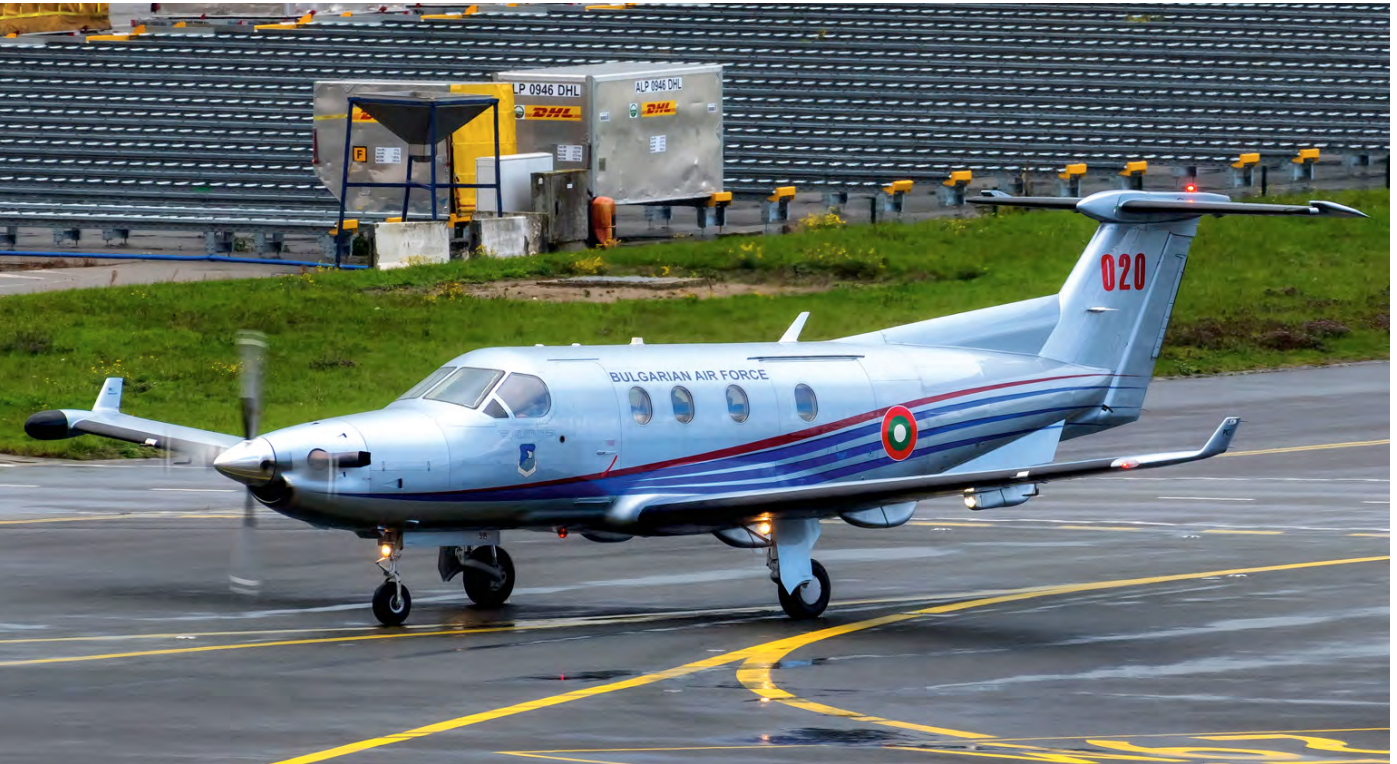
A rather rare visitor to the BeNeLux countries is Bulgarian PC-12M 020. The bizprop was converted by Pilatus from a model /45 into this version, before being delivered to the 16 Transportna Aviacionna Basa (16.TrAB) at Sofia. The unit badge is visible on the nose. (Brussels, 11 October 2020, Kenny Peeters)