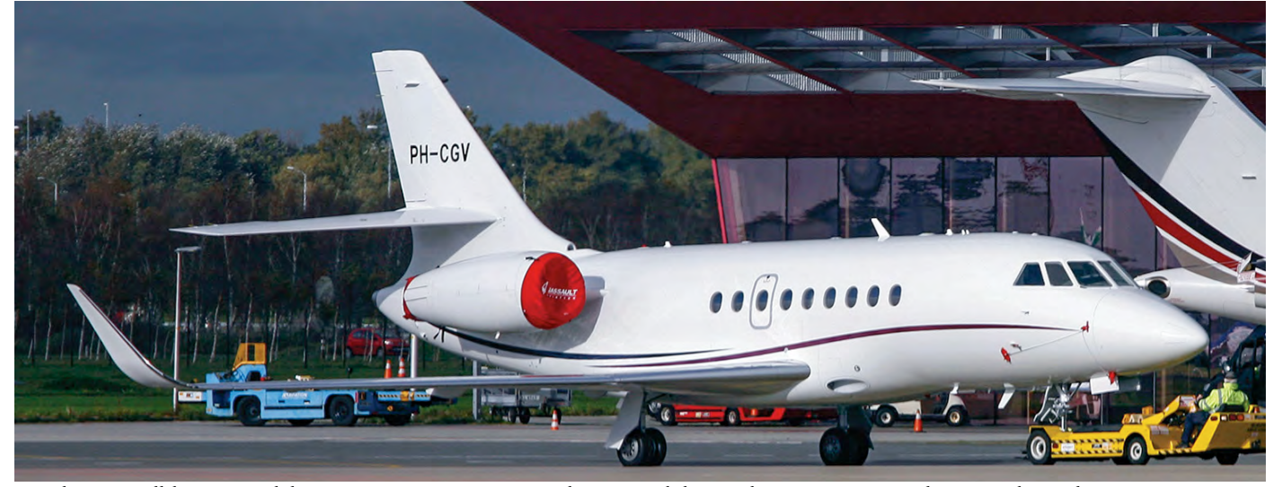
Air Alsie is a well-know Danish bizjet management company. They entered the Dutch register in September 2020 when Falcon 2000LXS PH-CGV was delivered. (Amsterdam - Schiphol, 26 October 2020,)