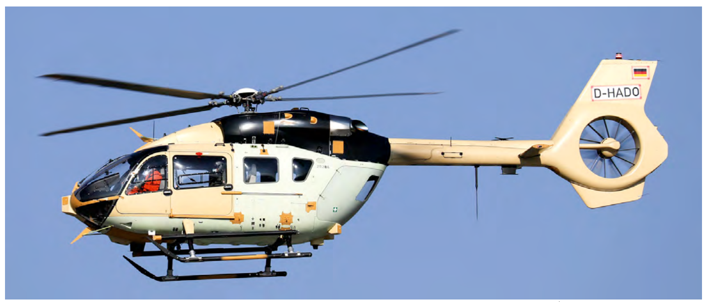
The Airbus Helicopters H145 is a very popular helicopter on both the civil and military market. H145 D-HADO (with its constructionnumber 20284 clearly visible) was photographed at Manching during one of the many testflights which are normally performed before helicopters will be handed over to the customer. This particular example is destined for the Hungarian Air Force and its future serial will be "05". (5 November 2020, Josef Gietl)

The IAR330 is the Romanian-built version of the Aérospatiale SA330 Puma helicopter, manufactured by IAR Brasov. Romania bought a licence to manufacture the French helicopter on 30 July 1974. The first licensed built Puma was flown on 22 October 1975 under the designation IAR330L.