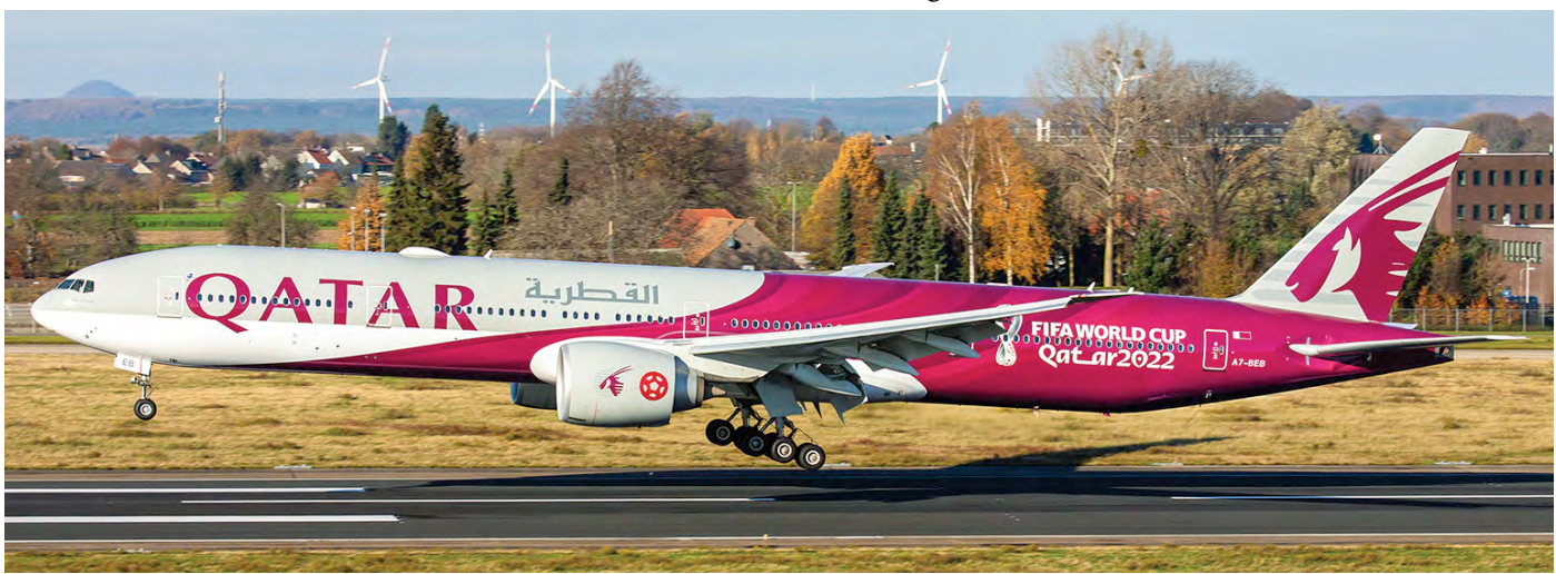
Qatar Airways Boeing 777-300ER A7-BEB was painted in special "FIFA World Cup Qatar 2020" colours early November. The Triple Seven features a distinctive FIFA World Cup 2020 branding to commemorate the airline's relationship with FIFA. It is the first aircraft in Qatar's fleet to wear these colours as more aircraft will follow. The Boeing made its first flight in these colours on 21 November 2020, exactly two years before the kick-off of the tournament in Qatar on 21 November 2022. The inaugural flight of the aircraft in these special colours was between Doha and Zurich, reiterating the airline's commitment to the FIFA by flying to the home of FIFA in Switzerland. Three days later Bjorn van der Velpen was able to picture the aircraft during landing at Maastricht, while operating a cargo flight.

<u>Airlink</u> has introduced a new corporate image. The airline has decided to relaunch itself as an independent airline after ending its franchise contract with South African Airways. The first aircraft painted in the new livery is ERJ190 ZS-YAB. It was unveiled to the world by the company on 12 November. Currently, the airline has a fleet of more than 40 planes, consisting of the Cessna 208, the ERJ135/145, ERJ170 and