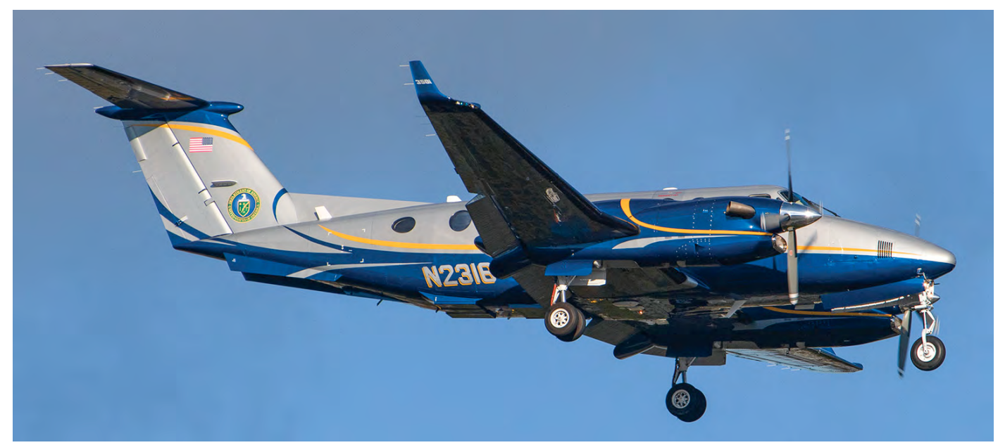
Although the logo on the tail reads Department of Energy, N2316 is one of three King Air 350i's operated by the National Nuclear Security Administration. This government agency is part of the Department of Energy and is responsible for national security by means of nuclear science. (Andrews AFB (MD), 22 October 2020, Tim Wolfe)

This free service replaces an eventual new edition of the Soviet Transports book which nowadays would simply be too expensive to produce. This as a total rundown of all files in early 2019 shows a new book would equate over 1,800 pages, where it to be published in the same format, A4 with a small letter type. Ae-270 photo 12sep20 in the Air Park at Zruc with a fake required.