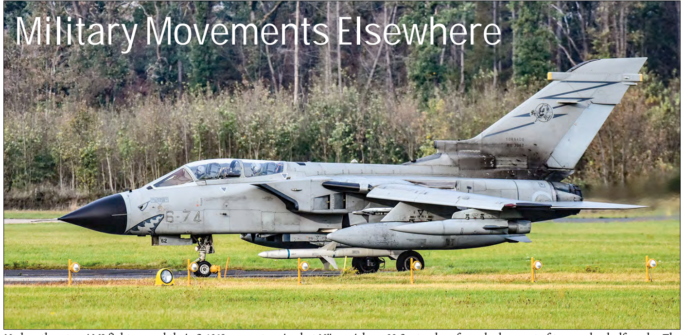
No less than ten AMI fighters and their C-130J support arrived at Nörvenich on 28 September, for a deployment of two-and-a-half weeks. The fighter contingent consisted of two AMXs, two Eurofighters and six Tornadoes. While the first two types did quite some shuttling between Italy and Germany, the Tornadoes stayed, apart from one being swapped. Wim Sonneveld caught MM7062/6-74 entering the runway for a mission on 13 October 2020.