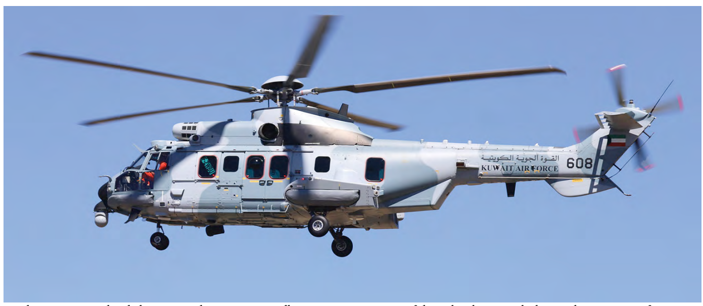
Pandemic or not, Airbus helicopter production at Marseille continues apace. One of the orders being worked on at this moment is for Kuwait, which ordered about two dozen H225Ms. Future serial 608 was noted by Alan Macey at its place of birth on 31 August 2020 as F-ZWBU.

Force Museum; only four Buffalos are left in service.