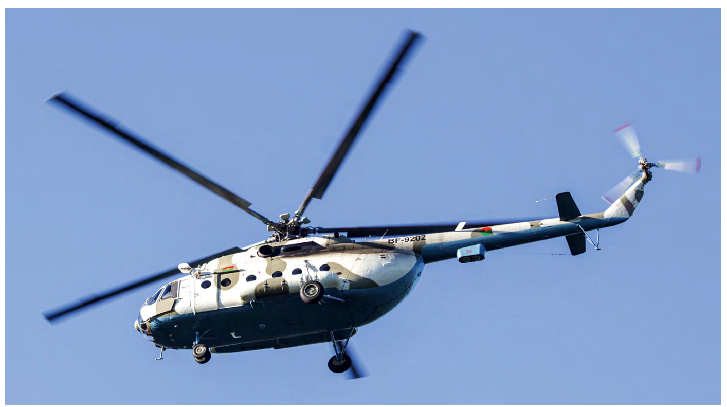
Burkina Faso Mi-17 BF-9202 is currently present for heavy maintenance with the LOM Praha facility at Kbely Airport. On 6 November 2020, this Hip was photographed during one of her post-maintenance testflights at Kbely Airport. (6 November 2020, Vaclav Kudela)