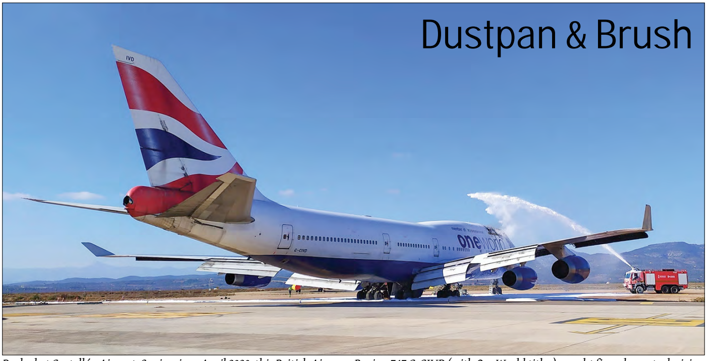
Parked at Castellón Airport, Spain, since April 2020, this British Airways Boeing 747 G-CIVD (with OneWorld titles) caught fire when a technician was cutting an oxygen line on the flight deck and sparks from the cutting wheel were caught by insulation material. Technically, it is not being broken up yet, but given it will be broken up soon, this will go down as a write off.