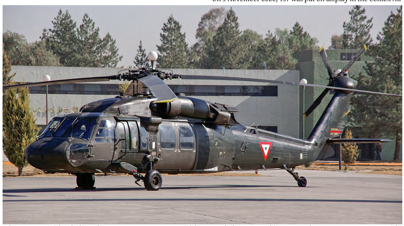
A longtime user of the Black Hawk, Mexico's EA.101 operates six of these very dark S-70A-24A, like 1098 seen here, since 1994 in support of the army's special forces. Enrique Giese saw it on air force day, 10 February 2020, at home base Santa Lucia.

115457 pres CYQQ ex 442sq 11 nov20 On 5 November 2020, 457 was put on display in the Comox Air