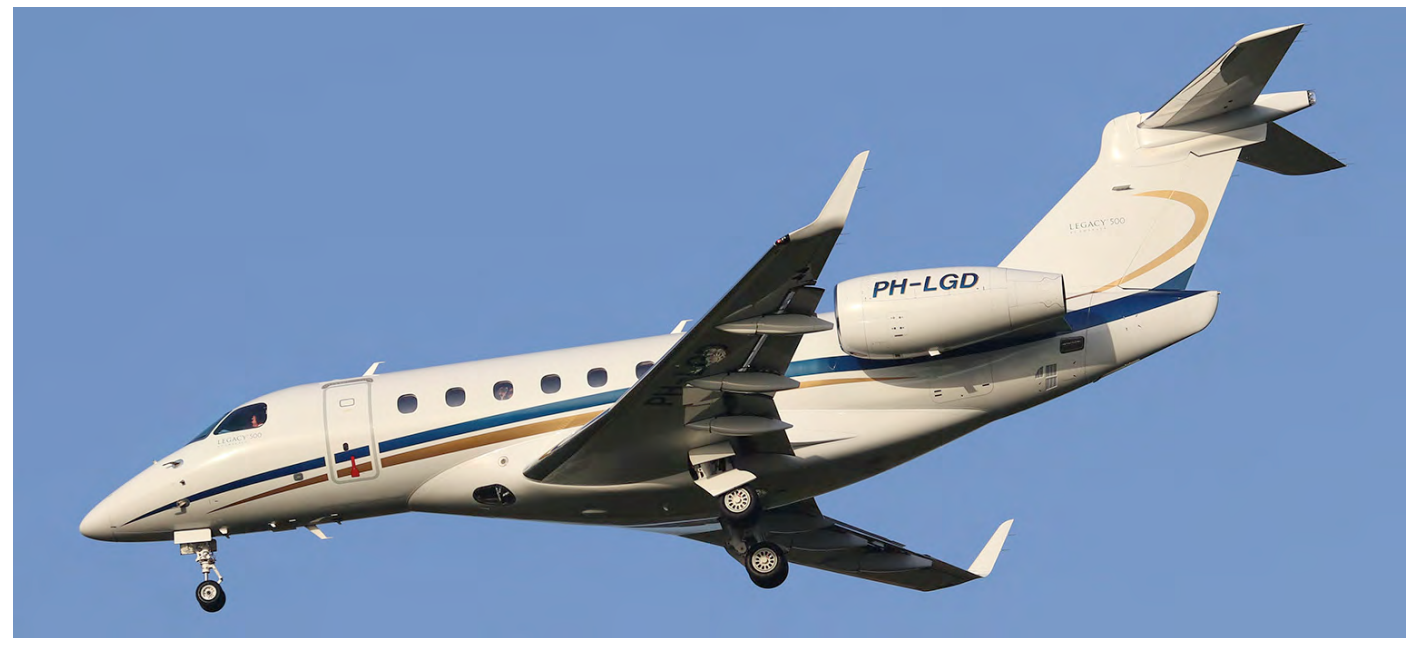
Seen here arriving on its delivery flight at Eindhoven is Legacy 500 PH-LGD. This is the first Legacy 500 to enter the Dutch register and flies on the AOC of Air Service Liège. It replaces Cessna 525B PH-FJK, which was previously based at Eindhoven. (7 November 2020)