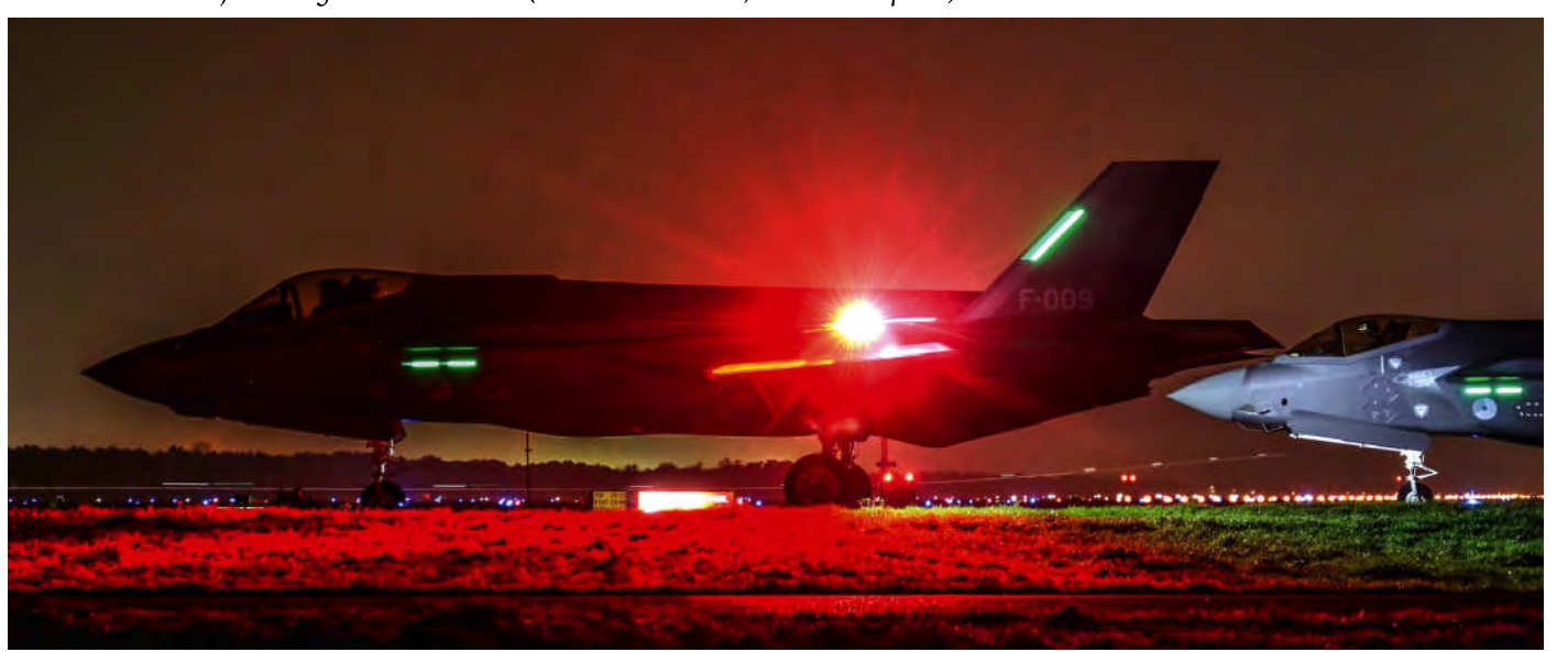
The RNLAF played its part at Volkel, where exercise Frisian Lightning II was held. This was the first out-of-area deployment of the RNLAF F-35As, with F-009 seen here. (11 November 2020,)