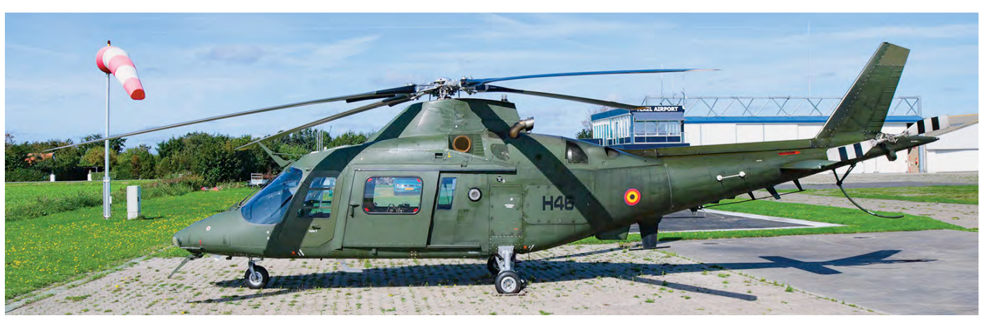
Mike de Bruijn took this photo of Belgian Air Force A109BA H46 while the crew took a lunch break. The Agusta A109BA Hirundo is a version of the Agusta A109 created for the Belgian Army based on the A109C with fixed landing gear. (Texel, 4 September 2020)