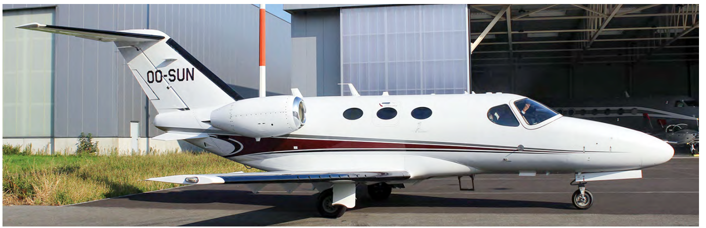
00-SUN was one of two Citations that were added to the Air Service Liège fleet this month. The Cessna 510 Mustang was previously registered as D-IUNQ. (Antwerp, 17 October 2020, Paul Soons)