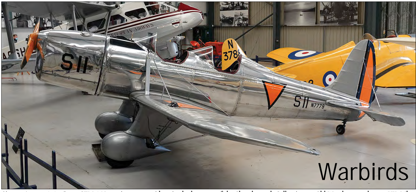
Since 7 August 2020, Ryan STM-2 N7779 is a new resident in the hangars of the Shuttleworth Collection, at Old Warden aerodrome, UK. What makes it special, that this trainer is a genuine former Marine Luchtvaart Dienst (Netherlands Naval Air Service) veteran which used it as S-40 (with hyphen). It was taken over by the RAAF as A50-31 and flown as such until November 1945. The Ryan was then sold as VH-AGZ but did not remain in Australia. The STM was exported to the USA in 1969 where it was flown as N288Y and later as N7779. One can only wonder about the reasons why a previous owner decided to give the machine the serial S11 (without hyphen, like the original S11), while it is in fact the S-40 (Old Warden, 26 September 2020,)