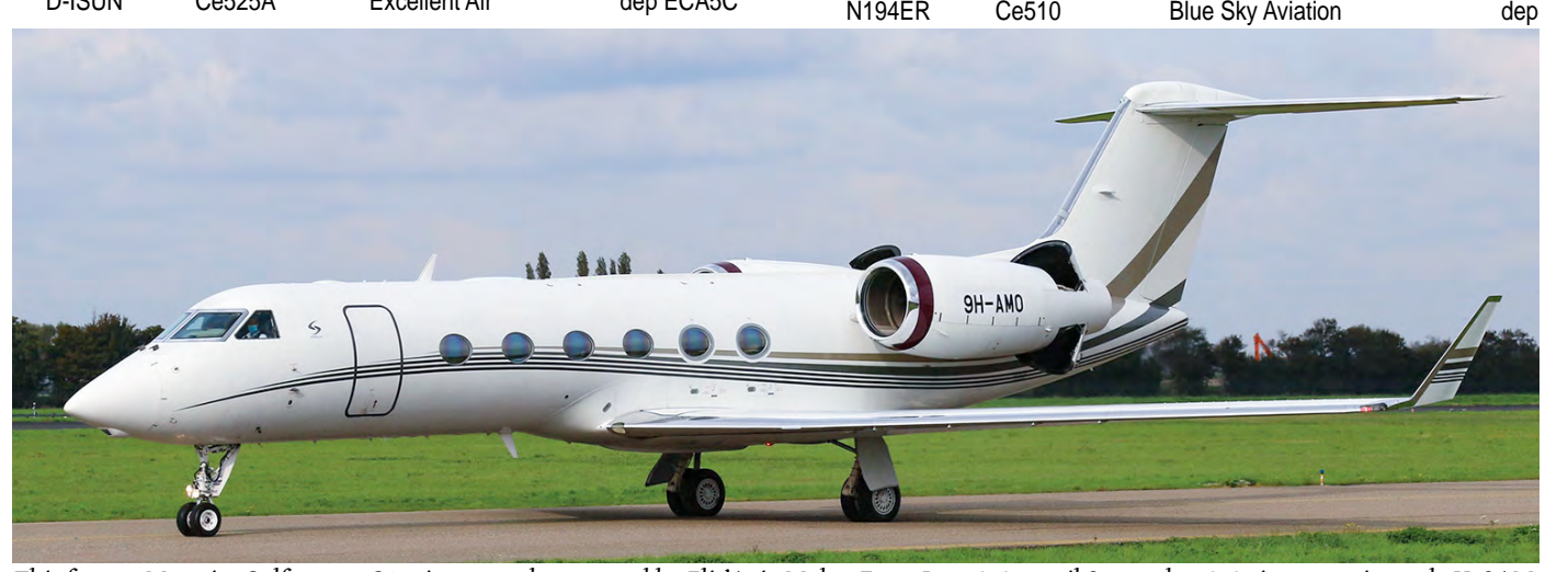
This former Metrojet Gulfstream G450 is currently operated by Elit'Avia Malta. From June 2020 until September 2020 it was registered 9H-OAM, but was reregistered to 9H-AMO in September 2020. (Rotterdam - The Hague, 13 October 2020,)