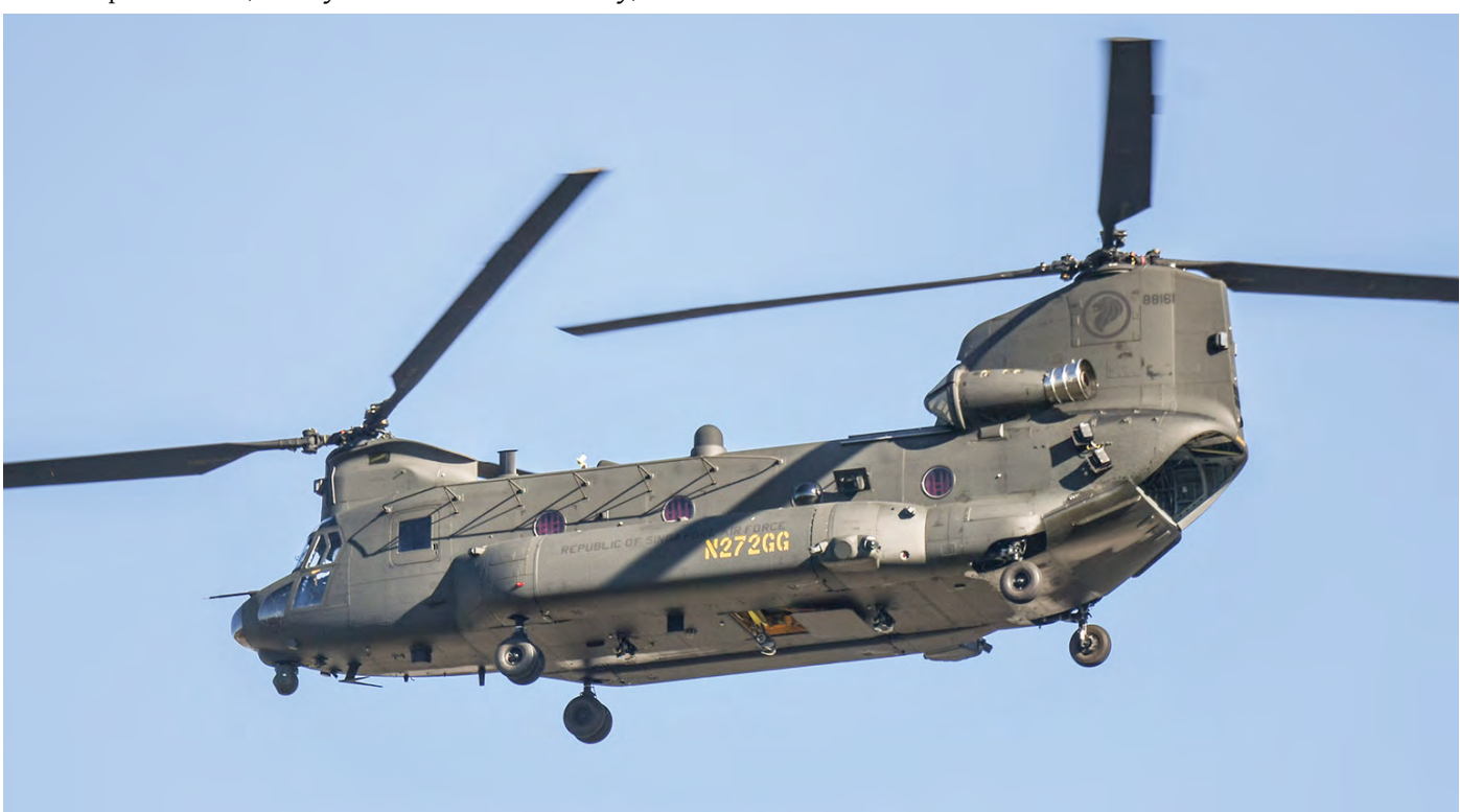
The second CH-47F Chinook for the Republic of Singapore Air Force, serial 88161 and test registration N272GG, was photographed by Vincent Games during a test flight near Wilmington/New Castle (DE). (18 November 2020)