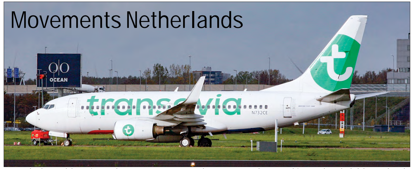
PH-XRV has been withdrawn from use by Transavia. It was registered N732CE on 22 October 2020 and first noted at Schiphol the next day. The aircraft is temporarily registered to TVPX Aircraft Solutions and will be delivered to Bahraini based airline Texel Air after freighter conversion at Tampa-International (FL). (Amsterdam - Schiphol, 26 October 2020)