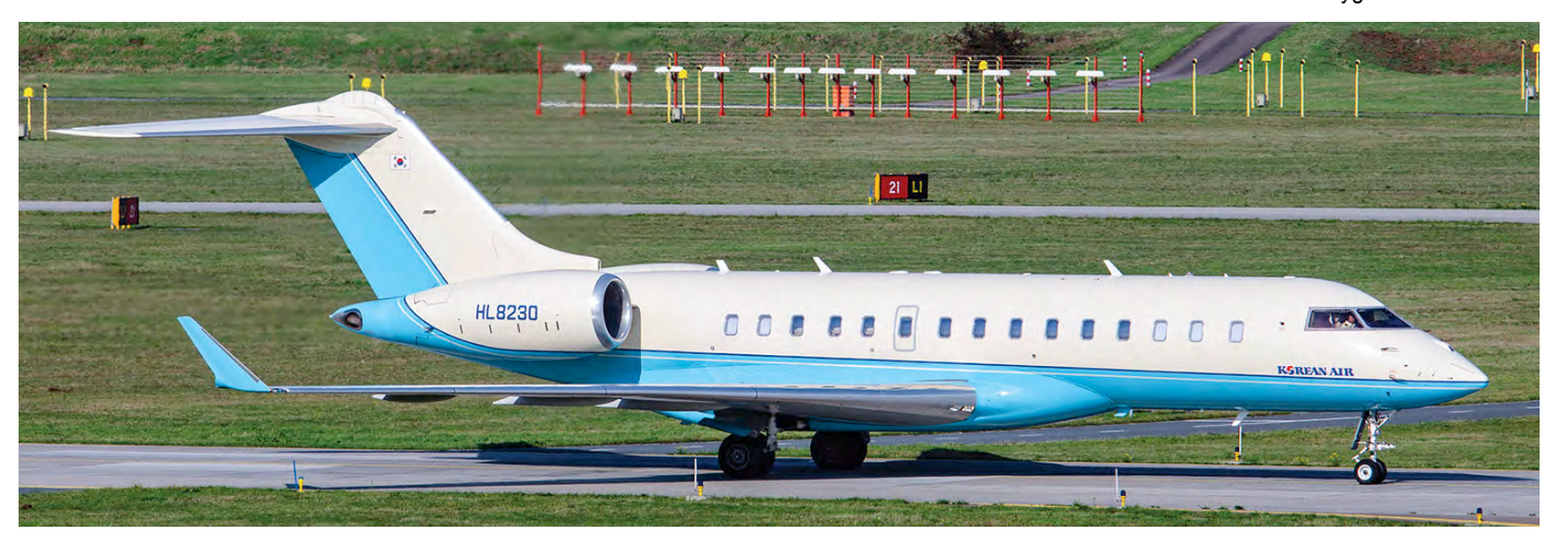
Eindhoven does not see many Korean Air visits. The arrival of Global Express XRS HL8230 did attract some attention. (Eindhoven, 9 October 2020, Luca Neggers)