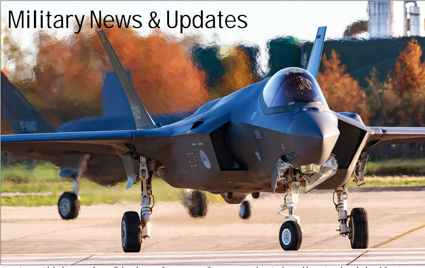
To train a rapid deployment of a small detachment of F-35s to a conflict area somewhere in the world, 322 Squadron deployed four F-35As to Volkel airbase for a period of two weeks. This excercise called "Frisian Lightning II" is part of the training syllabus of 322 Squadron to reach Initial Operational Capabilty (IOC) by the end of 2021. Seen here are F-35As F-009 and F-010 while lining up onto the runway. (18 November 2020)

Because of our standardization we sometimes use type, unit and serial presentations that may strongly differ from those used by the manufacturer or user. It is therefore possible that the information sent by you can deviate from the information we publish.