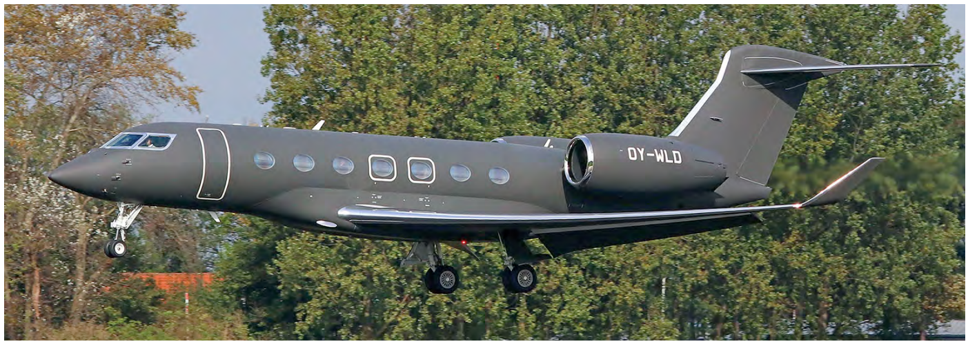
Blackbird Air Charter is a small Danish bizjet operator. Its aircraft are mostly known by the grey colours. Gulfstream G500 OY-WLD was added to the fleet in October 2019. (Rotterdam - The Hague, 13 October 2020, André Wadman)