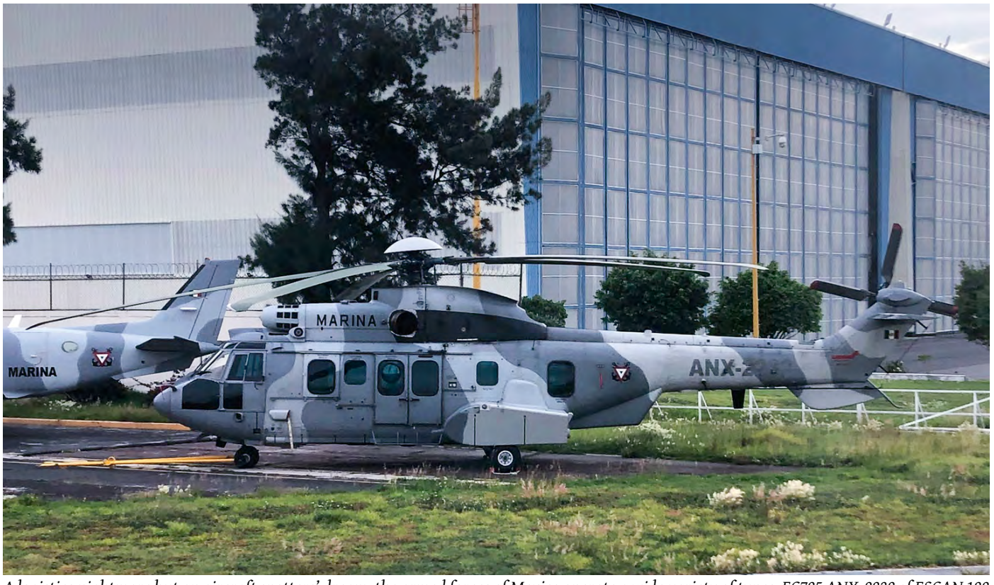
A logistics nightmare but an aircraft spotters' dream, the armed forces of Mexico operate a wide variety of types. EC725 ANX-2232 of ESCAN 122 is one of only three in use by the navy. Jaap Zandhuis made this picture on its Mexico City apron on 24 August 2020.