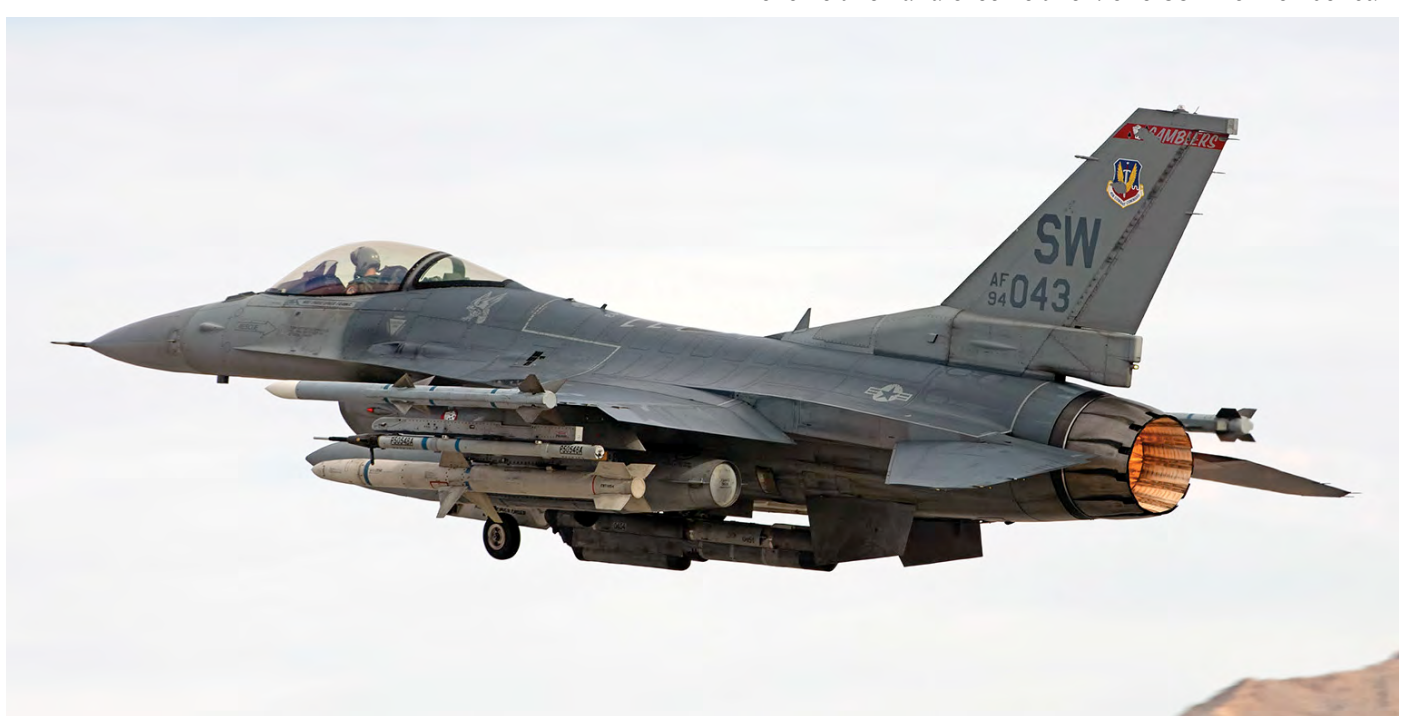
The United States Air Force Aircraft Accident Investigation Board (AAIB) released the final report on the mishap involving an F-16 that crashed on 30 June 2020. We got the serial wrong one time, this month we have the official serial. It is 94-0043/SW of 77th FS "Gamblers". They cited pilot error, leadership failures and a faulty ejection seat as causes to the accident. Nate Leong captured it during take-off from Nellis AFB (NV) on 2 February 2017, for Red Flag 2017-1, when it was armed to the teeth.

12nov20 UH-60A+ W/o A US Army Multinational Force and Observers (MFO) Black Hawk crashed on Tiran Island, off the coast of Sharm-el-Sheikh (South Sinai governorate, Egypt). Eight occupants lost their lives in the accident, among them six US citizens, a French citizen and Czech citizen. One US MFO member sur-