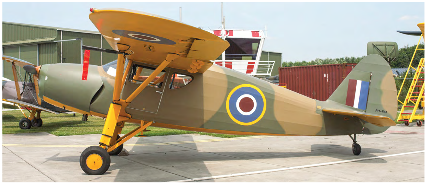
On the previous page we reported on the restoration project of Fairchild F24 N81255 at Hoogeveen airport, in the Netherlands. For those of you who are not aware of how such an aircraft looks like: here is a photograph from our files of another Dutch Fairchild Argus, PH-FAI. This machine is a long time resident of the Early Birds Foundation at Lelystad airport. PH-FAI was restored to airworthy condition and is flown in RAF livery with serial FS537. Its wheels are nowadays covered with spads. (Lelystad, 5 July 2008, Gert Jan Mentink)

The curtain has fallen for De Havilland Sea Vixen FAW2 G-CIVX (XP924). Owner Navy Wings has recently taken the difficult decision to cease the activities aimed at returning