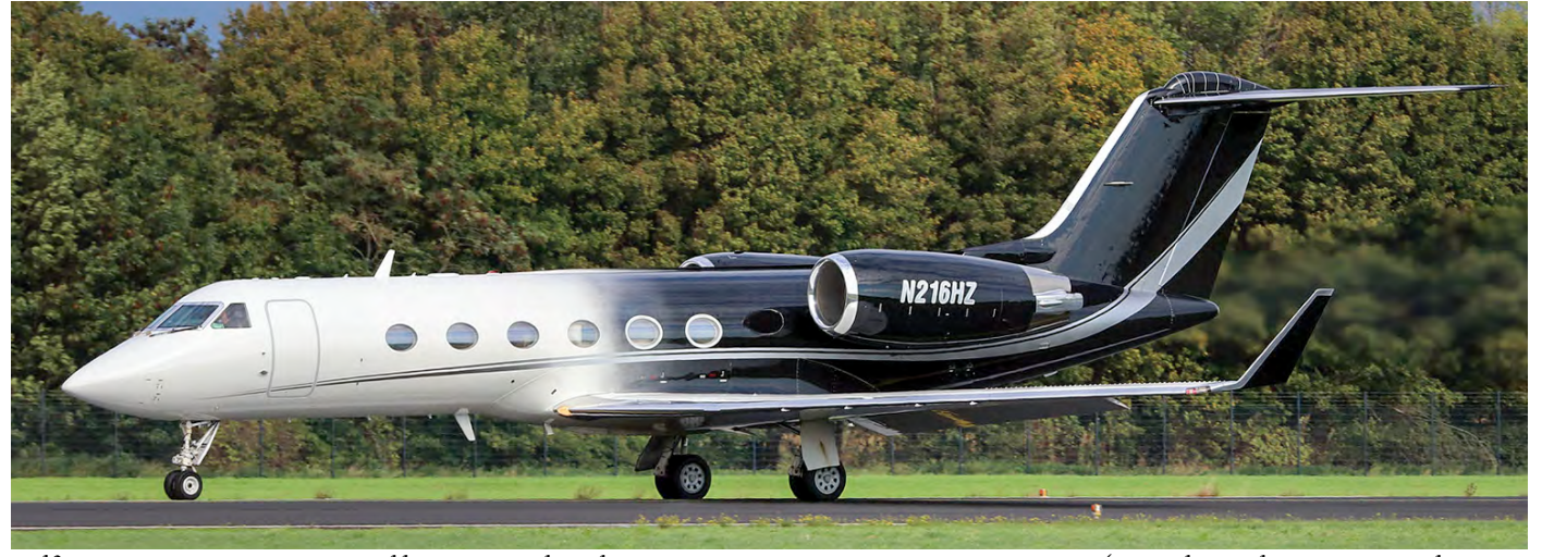
Gulfstream G-IV N216HZ is operated by Las Vegas based Newport Executive Transportation since 2019. (Rotterdam - The Hague, 9 October 2020,)