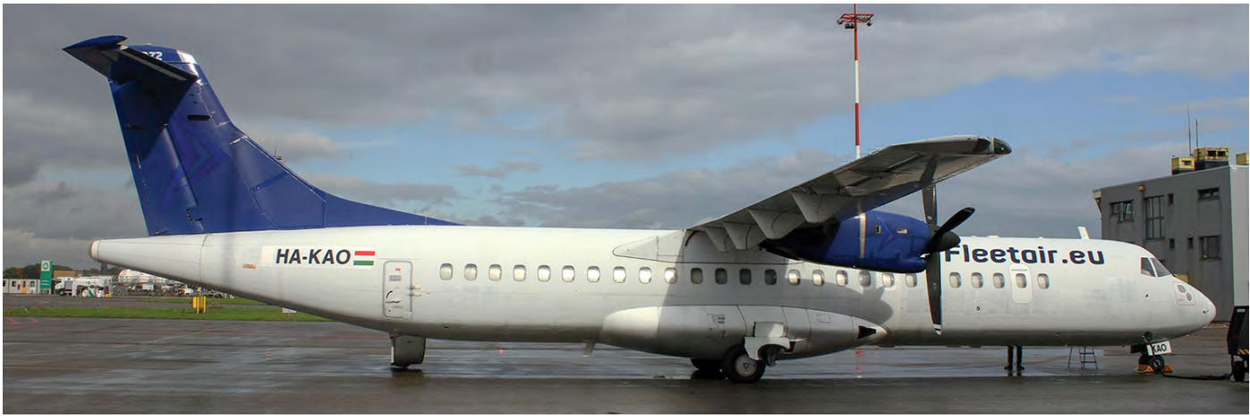
This ATR72 was acquired by Fleet Air BG in January 2020. In July 2020, it was transferred to Fleet Air International as HA-KAO. (Antwerp, 7 October 2020, Walter Van Brempt)