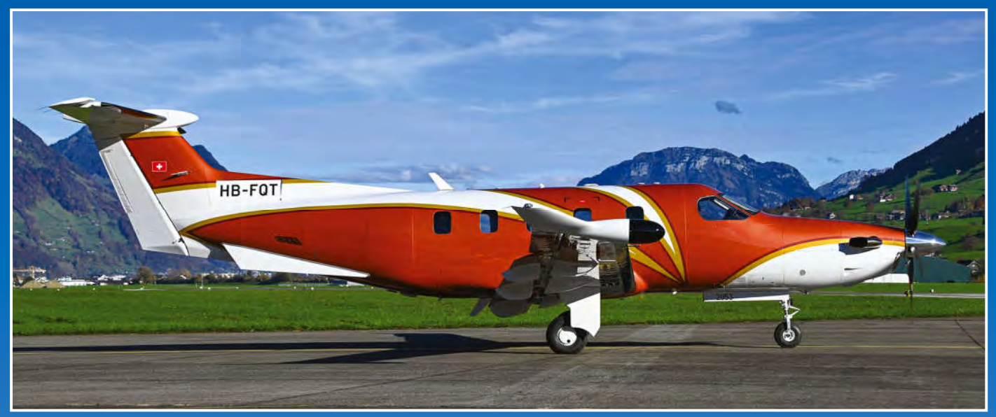
A colourful PC-12 to kick off this Pilatus-page. HB-FQT is c/n 2053, the future identity is yet unknown. All of these photos were taken by Stephan Widmer at Stans-Buoch. (2 November 2020)