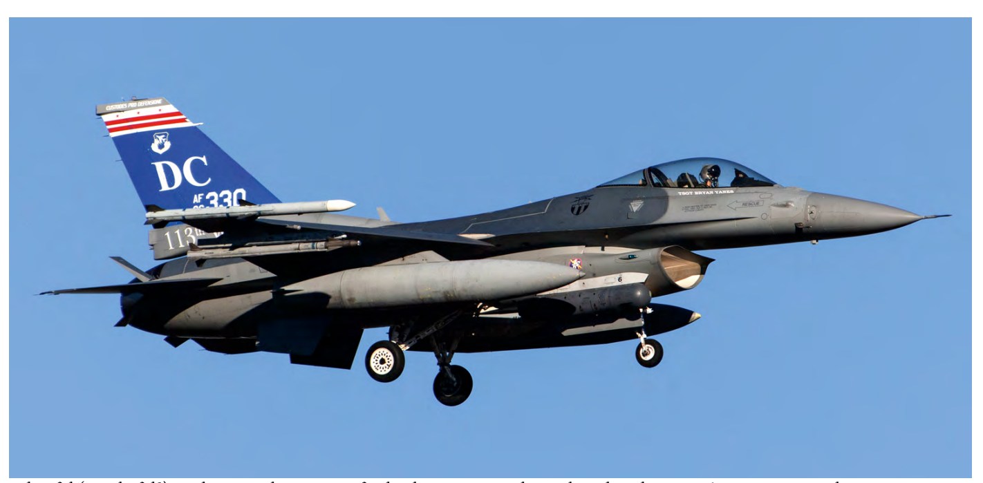
Colourful (or colorful?) markings on this District of Columbia Air National Guard 113th Fighter Wing's F-16C 86-0330 when it returns to its Andrews AFB on 9 November 2020.

helicopters to replace the HH-60G Pave Hawk.