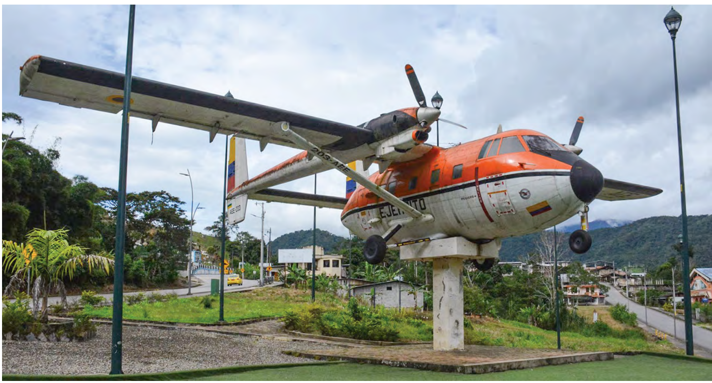
In October 2014, the two booms of IAI201 AEE-203 were seen at Rio Amazonas and the spotters were told the aircraft itself was to be preserved in Zamora. As it turned out, it was in the village of Cumbaratza that it found its last resting place. The Arava had to make do without its wings for a couple of years but nowadays they have been mated with the plane again and it received a new white and orange paint job, in lieu of its old camo jacket. (Cumbaratza, 14 June 2020, Alcivar Lupercio)