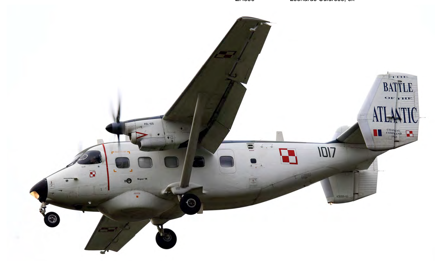
M-28B Bryza 1R 1017 is one of the active Bryza's in the Marynarka Wojenna Rzeczypospolitej Polskiej (Polish Navy). This M-28 of the 44.BLotM was photographed during landing at Dêblin and is normally based at Cewice.