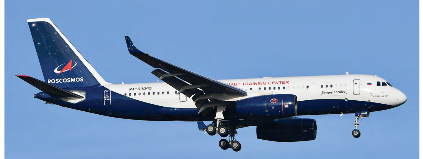
RA-64045 Tu-204 Roscosmos with extra Cosmonaut Training Center titles, arrived at Köln-Bonn as flight CPK9803 from Chkalovsky near Moscow. It brought a group of Russian cosmonauts, that continued their journey on a Gulfstream 5 (N280PH) to Houston-Ellington. (7 November 2020, Anton van Ruiten)