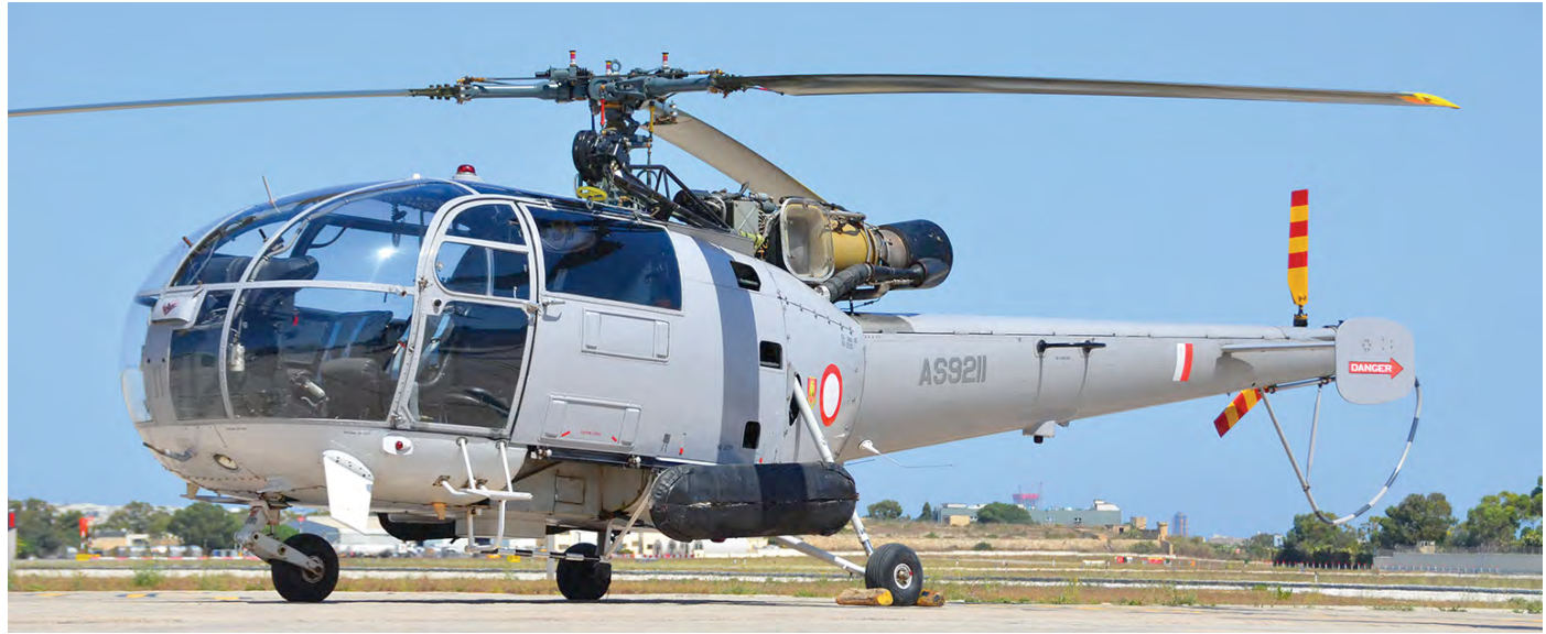
Still going strong is this ex Libyan Police Alouette 3, AS9211, which was delivered to Malta on 24 December 1992. In total, Malta received three Alouette 3s donated by Libya. (31 August 2020,)

From 2003 until 2007, while Moammar al-Qadhafi was the leader of Libya, illegal immigration was at a low level but after 2007, something changed and it grew explosively, becoming "big business". At that moment, the AFM needed a bigger airplane than the Islanders they had in use and a Spanish CASA 212 was leased. The CASA was flown by a Spanish pilot but with an otherwise Maltese crew.