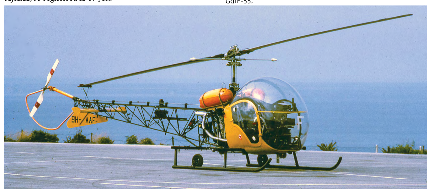
In 1972, with the delivery of four Bell 47s, the name Malta Land Forces changed to Armed Forces of Malta and the AFM Helicopter Flight was born. Joe Ciliberti captured the newly arrived 9H-AAF that same year at Pembroke Grounds, from where the Air Wing operated in its first years.

Both Hughes 500s were former Guardia di Finanza Hughes, serials respectively MM80848/GdiF-49 and MM80854/GdiF-55.