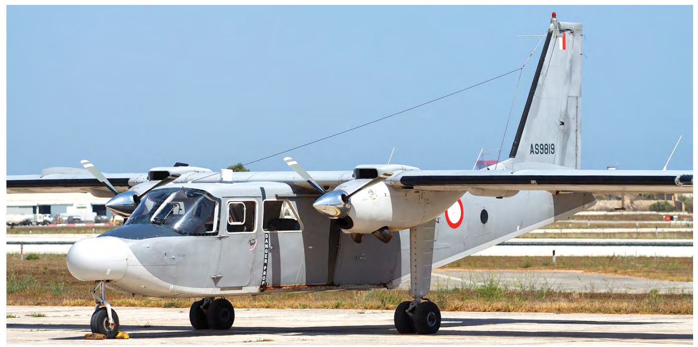
This Islander with serial AS9819 will be getting a major overhaul to extend its lifetime. Unfortunately, its brother will not be flying anymore. (31 August 2020,)

In 2019, the transition to night vision started for rotary pilots which is also a big game changer for the SAR tasks.