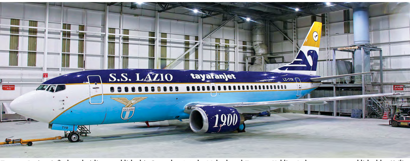
Tayaran Jet is a Sofia-based airline, established in December 2017 by Malta based Tayaran Holding Ltd, a company established by Sicilian entrepreneurs. Tayaran Jet applied for initial certification to Bulgaria's General Directorate of the Transport Ministry in February 2018 and launched revenue services under an ACMI (aircraft, crew, maintenance and insurance) contract with Air Moldova, on 19 May 2018. It operates most of its flights in and out of Italy. The airline operates a fleet of three Boeing 737-300 aircraft. One of them is LZ-TYR, which was painted in this special "Società Sportiva Lazio" colours at Shannon early November. (12 November 2020,)

Russian manufacturer Irkut, part of United Aircraft Corporation, rolled-out their first MC-21-310 on 11 November 2020. Slightly deviating from the previous four MC-21-300 prototypes the -310 is the designation for the MC-21 build with domestic-built Aviadvigatel PD-14 turbofan engines. This is the Russian build alternative to the Pratt & Whitney PW1400G engines. During the roll-out the airframe was bare metal without any markings however the airframe should be msn MC.0012 , according to the Soviets Transports database. The airplane has been handed over to the flight-test division and will undergo ground manoeuvring and engine testing prior to the first flight in December 2020.