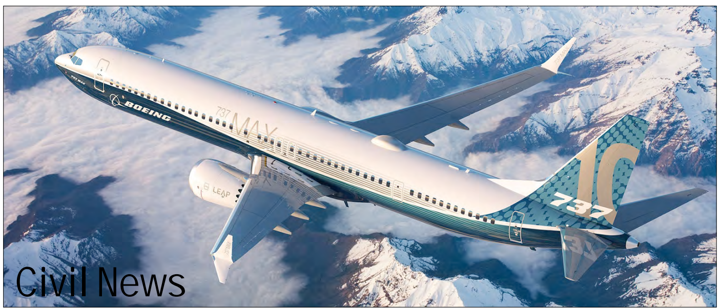
After a grounding of more than twenty months, the US FAA finally announced that it has approved Boeing's modifications to the Boeing 737 MAX and that the aircraft was cleared to fly again. Aviation authorities in other countries will probably follow the FAA in the coming months, so Boeing can prepare itself for a busy 2021! All 737 MAX aircraft that have been in storage must undergo a comprehensive activation process before they can be considered ready for return to service. After each airplane is prepared, it will be thoroughly inspected against a robust set of criteria defined by the FAA. There are more than 800 737 MAX airplanes built so far. Just over half of them have not yet been delivered and are still at various Boeing sites in the US. The others were delivered and are in airline fleets around the world. (Boeing)