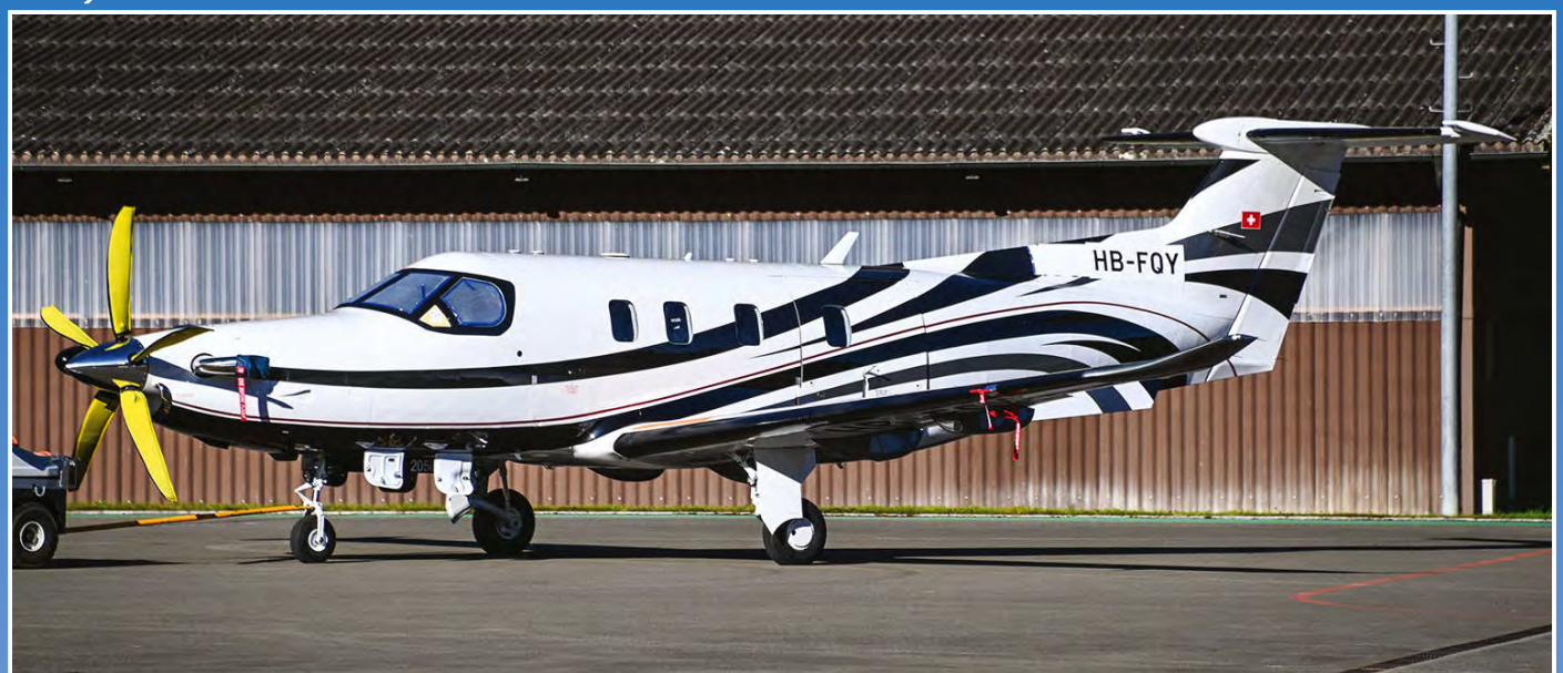
PC-12 NGX HB-FQY ,to be N928PG, is resplendent in what almost looks like a zebra-inspired colour scheme. (13 November 2020)