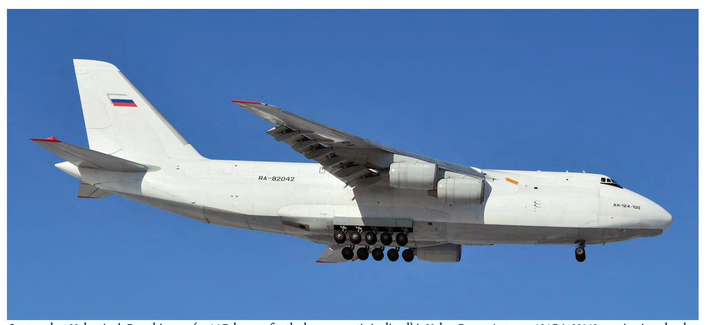
Captured on Valentine's Day this year (so 14 February for the less romantic inclined) is Volga-Dnepr Antonov 124 RA-82042, coming in to land at Toronto-Lester B. Pearson International Airport (ON), as seen by Frederick K. Larkin. Almost nine months later, on 13 November, it suffered an uncontained engine failure, resulting in a crash landing at Novosibirsk-Tolmachevo Airport, Russia. It was operating flight VI4066 from Seoul-Incheon to Vienna-Schwechat, with a planned stop over at Novosibirsk. It was leaving for Vienna when the accident happened.

vived and was evacuated. The crash has been attributed to a technical failure rather than any form of foul play, including militant activity. This unit is supporting the MFO, an international peacekeeping force tasked with overseeing the peace treaty between Egypt and Israel.