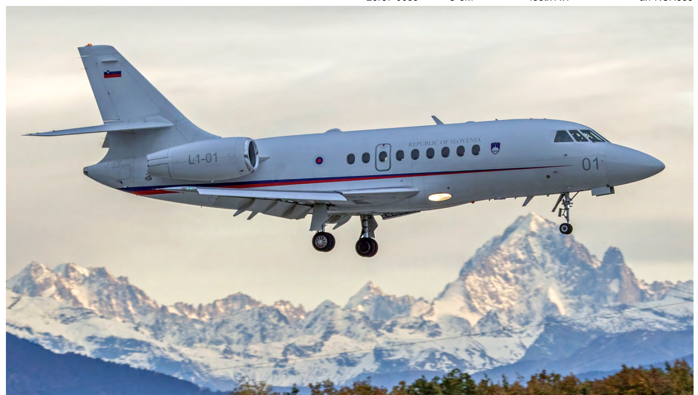
The Jura Mountains provide a scenic backdrop for Falcon 2000 L1-01, even if the sun chose to hide as it was landing. Based at Ljubljana, the bizzer entered government service in August 2009, as S5-ABR. Since March 2013, it resides with 152.LEESK, after receiving its military serial. Despite this change, It wears no military markings, but simply the "Repubic of Slovenia" titles and the state's coat of arms. (Geneva, 25 October 2020, Robert Erenstein)