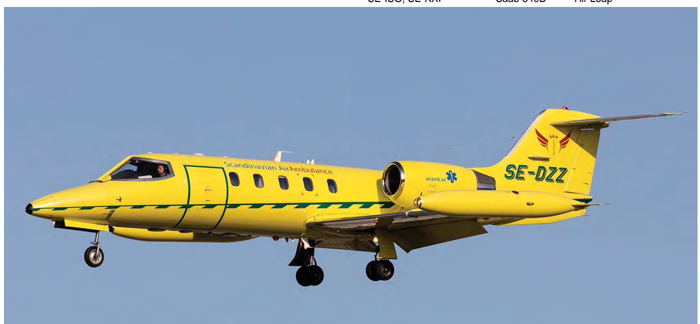
Scandinavian AirAmbulance is a service provided by contractor company Babcock to the governments of Sweden, Norway and Finland. The headquarters is located at Stockholm-Arlanda. Learjet 35A SE-DZZ is one of nine fixed-wing aircraft and the sole Learjet in service. (Stockholm-Bromma, 17 September 2020)