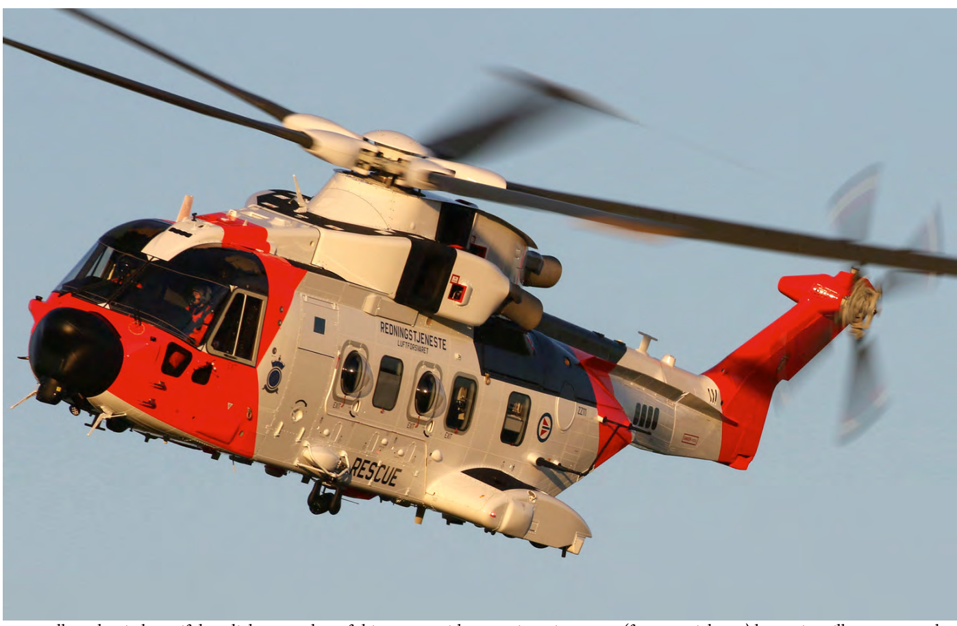
An excellent shot in beautiful sunlight was taken of this AW101 with testregistration ZZ111 (future serial 0280) on 4 November 2020 at Yeovil. This AW101 is intented for the Norwegian Air Force and took its first flight on 3 November 2020.

threatening the vital allied supply convoys from the United States.