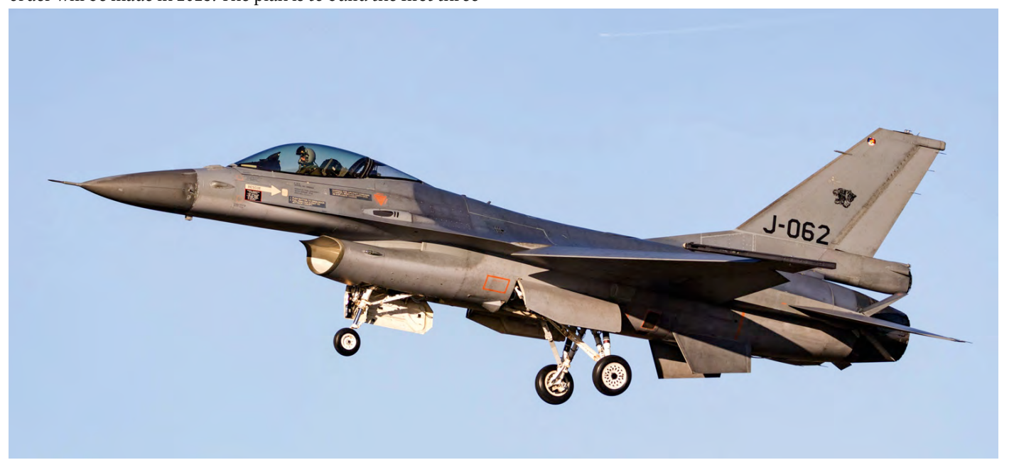
After more than 3 years being used as donor for other F-16AMs on Volkel airbase, F-16AM J-062 was moved via a trailer in August 2019 to Woensdrecht for maintenance at LCW. This Monday it made its first flight since 2015 (note the different 313sq badge and the additional 900sq badge on top of the tail). It is still on Woensdrecht today. (23 November 2020, Joe Peartree)

In November 2019 the first two H145s were delivered to the Magyar Légierö, followed by another two in December 2019 which makes it four in total for 2019 which is exactly according to the delivery schedule. This delivery schedule mentions that there should be twelve H145s delivered in 2020 which means that one needs to be delivered in the coming month. The last four should be delivered in 2021. Serials 05 and 06 are being used as training helicopters and are supposed to be the last two that are going to be delivered.