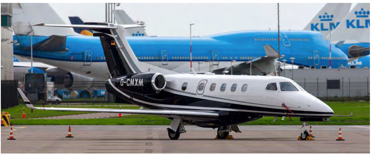
D-CMXM is the newest of five Phenom 300s operated by Air Hamburg. It joined the fleet in June 2020 and is one of 36 aircraft flown by Air Hamburg. (Amsterdam-Schiphol, 15 November 2020, Walter Heukensfeld)