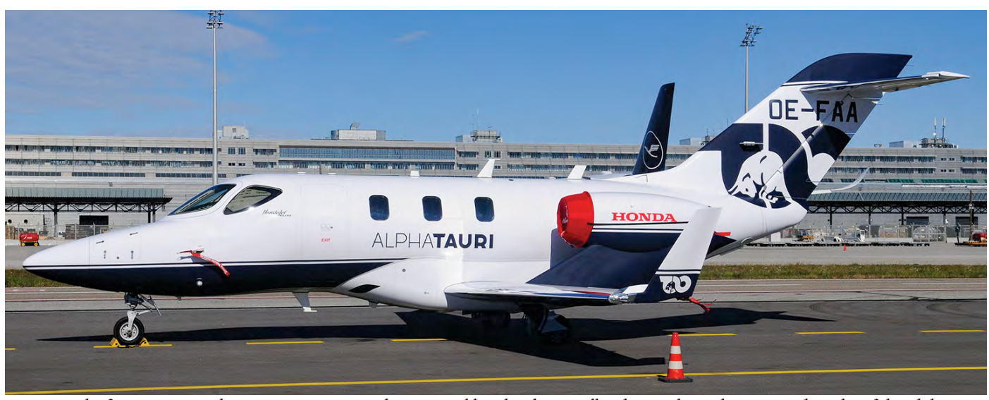
OE-FAA is the first HA-420 on the Austrian register and is operated by The Flying Bulls. The HondaJet Elite carries the titles of the AlphaTauri F1 team, Red Bull Racing's sister team which was formerly known as Toro Rosso. (Munich, 4 October 2020)