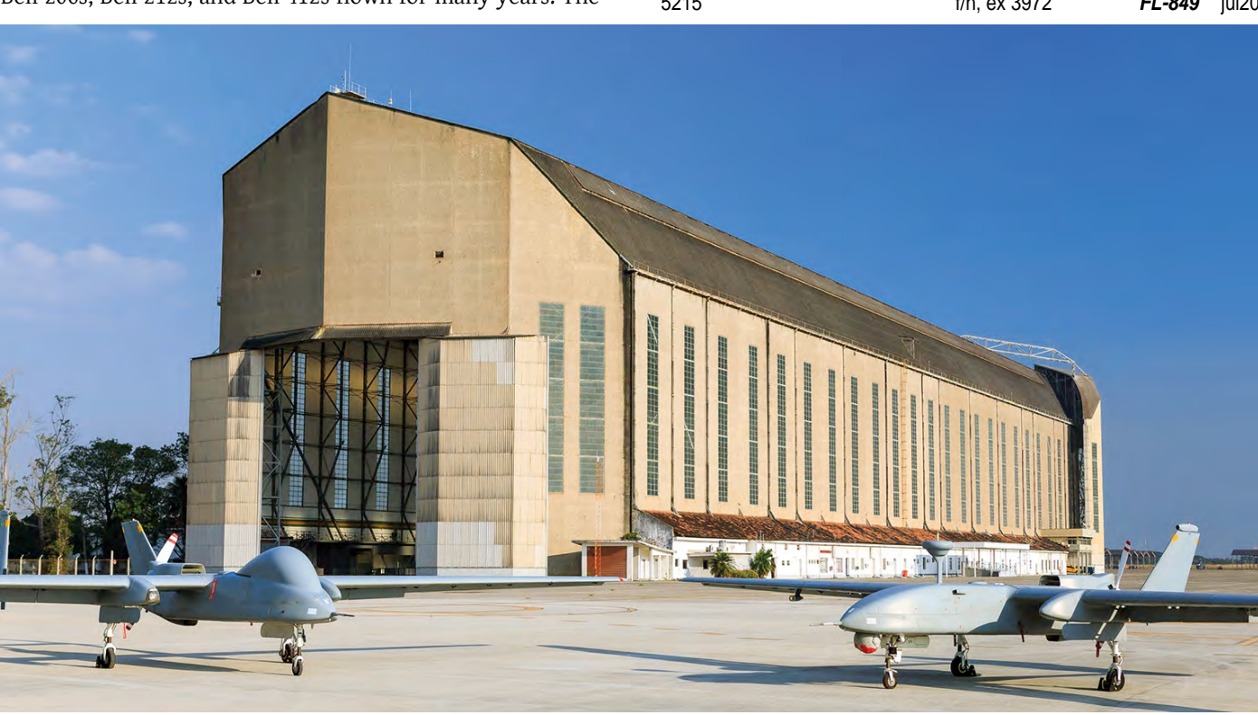
The Brazilian air force RQ-1150 is a VANT. Let us translate that... These machines are 'veículo aéreo não tripulado', or unmanned aerial systems, as we refer to them. Originally delivered as Heron I to the Federal Police and incorporated by 1°/7°Gav to operate along their P-3AM Orions. (Santa Cruz, 23 July 2020,)

3972 reregistered as 5215 FL-849 5215 f/ n, ex 3972 FL-849 jul20