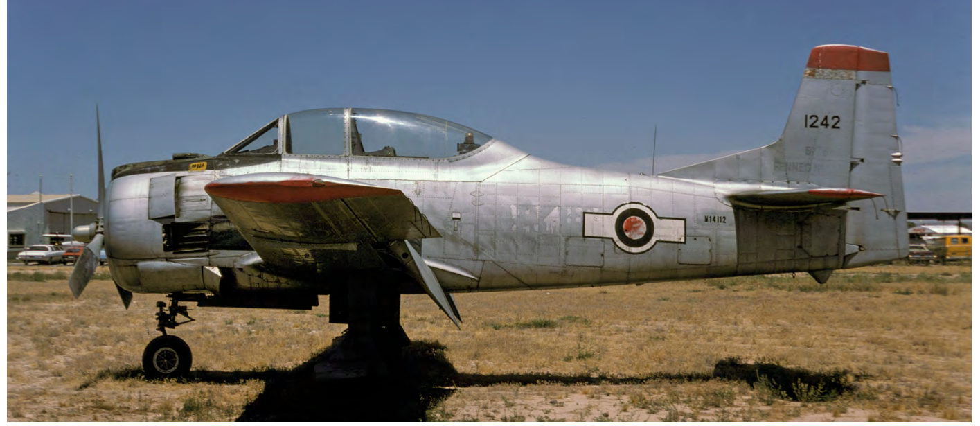
The Haiti Air Corps received at least thirteen T-28 derivatives, of which eleven were confirmed as Fennecs. Most of these were sold back to the USA for use as warbirds like this N14112 (ex 1242).