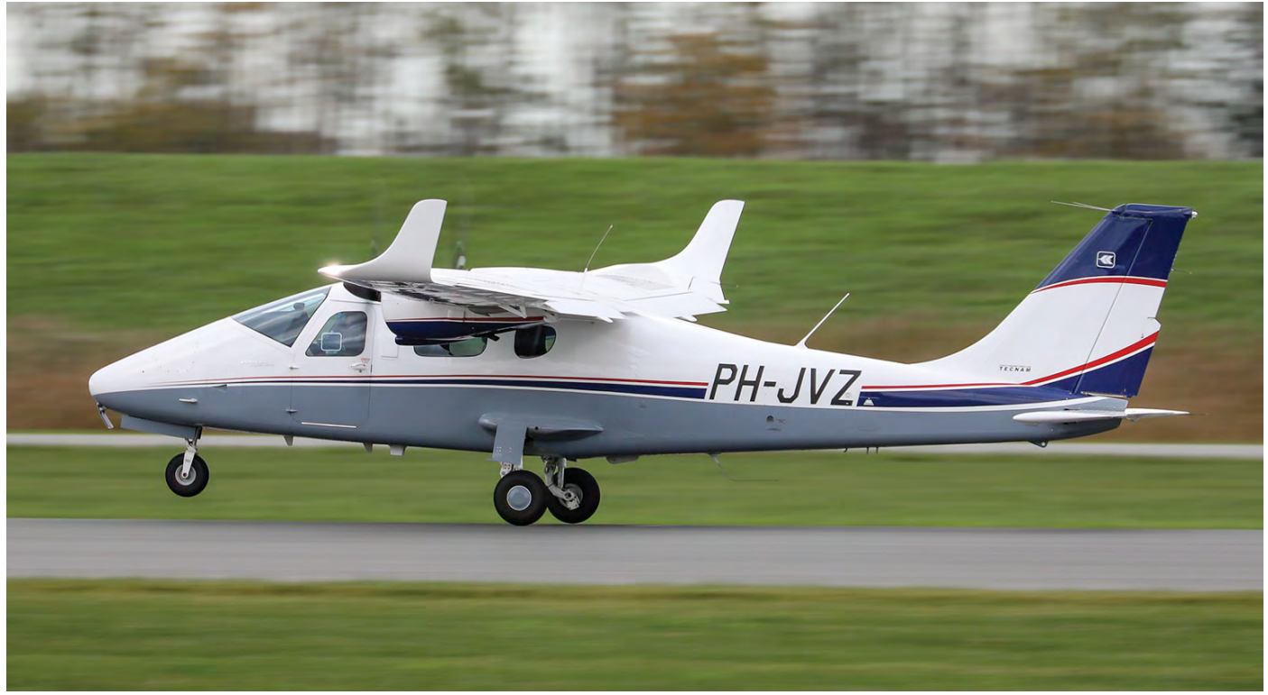
PH-JVZ arrived at Lelystad on delivery from Capua, Italy on 28 October 2020. This Tecnam P2006T is a Mk.II Premium Edition. The aircraft is owned by ZX Machines bv. (Lelystad, 3 November 2020, BJ Floor)

Credits: Inspectie Leefomgeving en Transport.