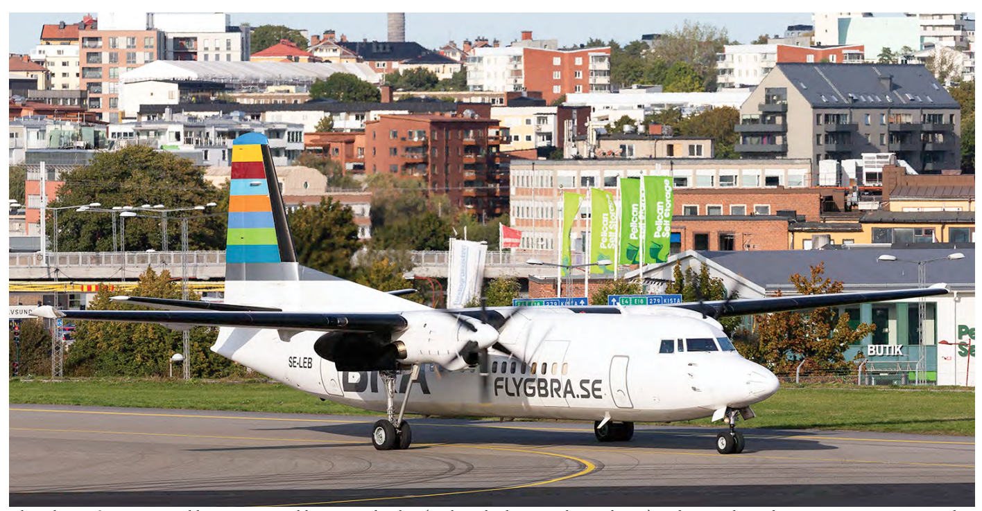
This photo of SE-LEB, a Fokker 50 operated by Amapola Flyg (and in Flygbra.se colour scheme) is showing how close Bromma airport is within the Stockholm city limits. (17 September 2020, André Alders)