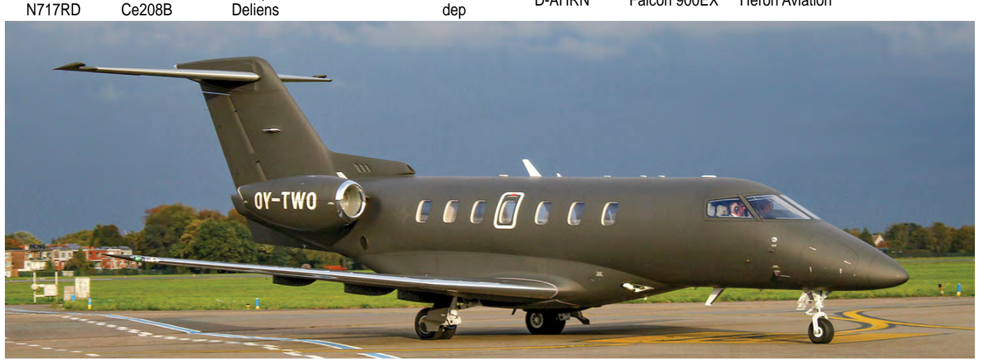
Well-known for its distinctive grey colour, PC-24 OY-TWO is part of the Blackbird Air Charter fleet. (Antwerp, 18 October 2020, Walter Van Brempt)