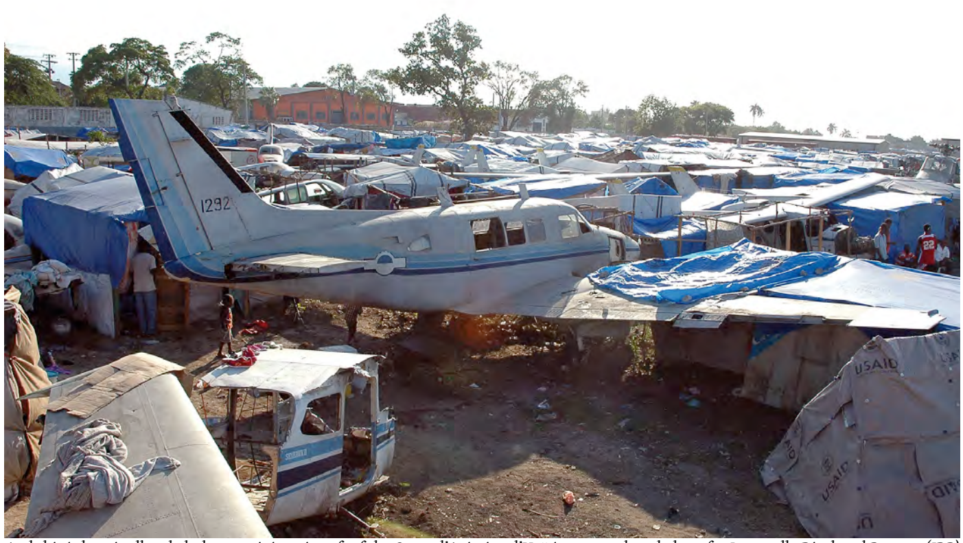
And this is how it all ended, the remaining aircraft of the Corps d'Aviation d'Haïti were used as shelters for Internally Displaced Persons (IDP) at their former home base Bowen Field (Ancient Aerodrome Militaire). Clearly seen in this picture is the penultimate delivery, Beech 65-80 serial 1292 amidst scores of other aircraft, the twin booms of the Cessna 337 coming to good use to support tent constructions. The entire site had been cleared by September 2013 (03 April 2010, Wim Sonneveld).