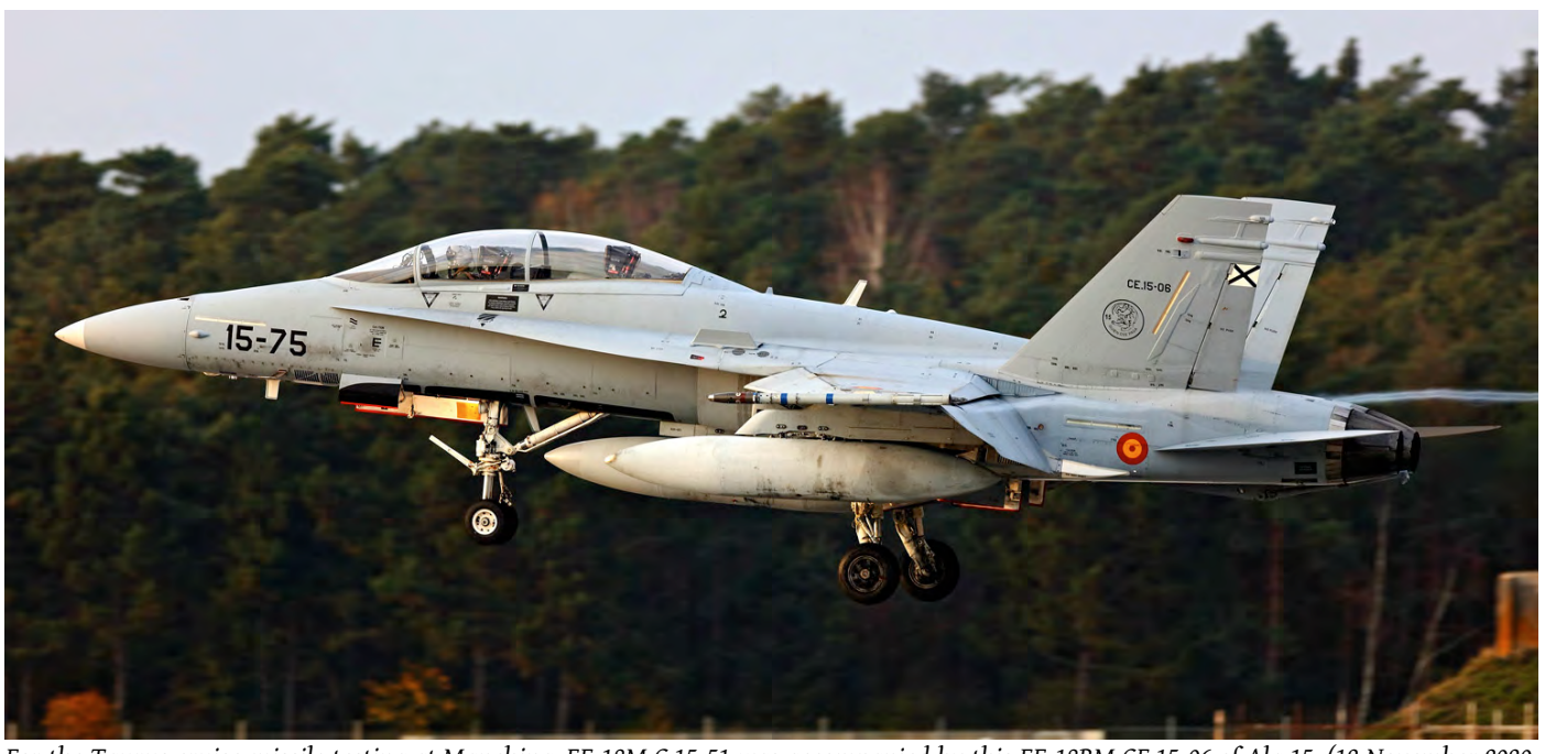
For the Taurus cruise-missile testing at Manching, EF-18M C.15-51 was accompanied by this EF-18BM CE.15-06 of Ala 15. (12 November 2020,)