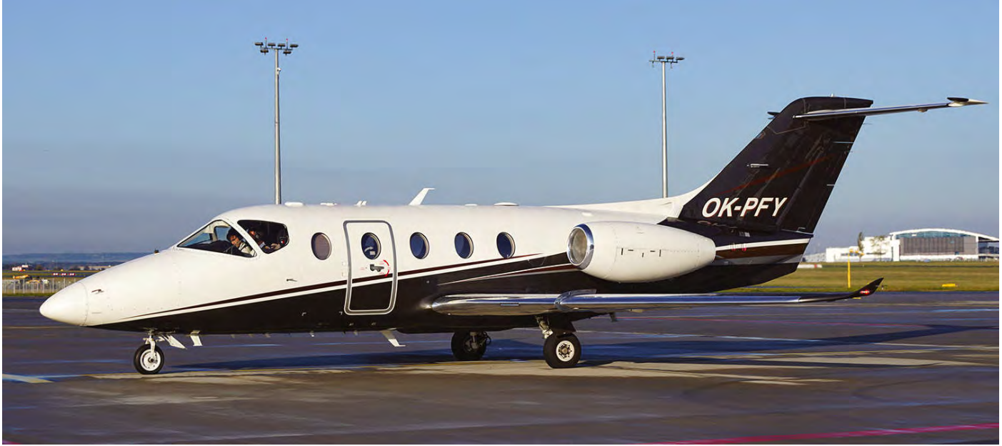
Flexjet's European subsidiary has recently sold off most of its Nextant 400s. A couple of these were sold to Czech-based Time Air, with OK-PFY being former G-FXRJ. (Prague, 24 October 2020, Václav Kudela)