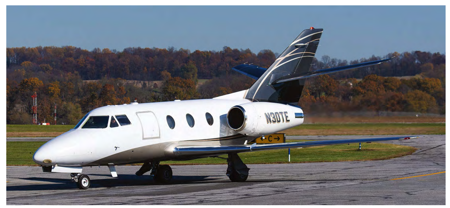
The number of Falcon 10s still active in the world is dwindling, therefore it is nice to see one still active. N30TE (c/n 152) was born in 1979 and has been active in the US, Japan, Sweden and France. (Frederick (MD), 7 November 2020,)