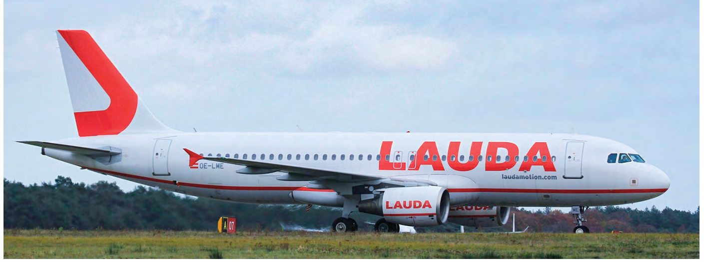
Previously with FlyNas as VP-CXY this Airbus A320 was destined for LaudaMotion. Currently registered as OE-LME, it will probabely become 9H-LME and will be operated by Lauda Europe. (Woensdrecht, 28 October 2020,)