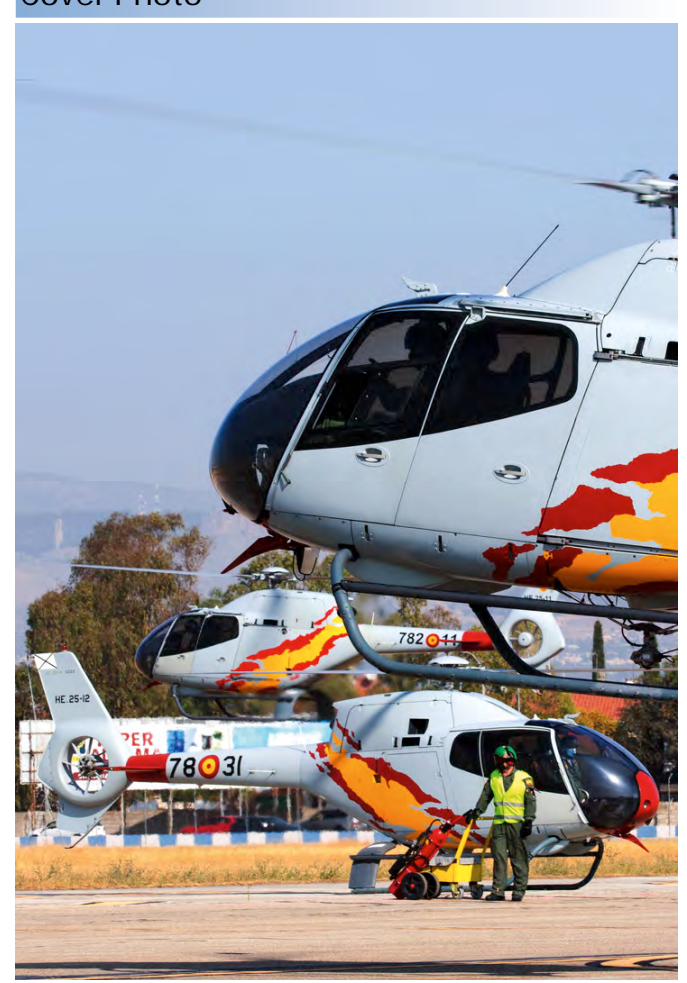
A "stack" of three EC120Bs of Ala78/Esc782 at Granada-Armilla during a base visit on 01 October 2020. These colourful helicopters also make up the helicopter demo team Patrulla Aspa.

As winners of the coveted NSK trophy in 2019, Scramble has the honour of organising the next edition of the Nationale Spotters-Kampioenschappen. Normally speaking, that would happen at the end of the year. But, and here is that recurring theme of 2020 again, due to COVID and the local restrictions in the Netherlands, we have decided to cancel the 2020 edition altogether. It was not an easy decision to take, but we aim to organise the next Aviation Day (which includes the NSK) in 2022!