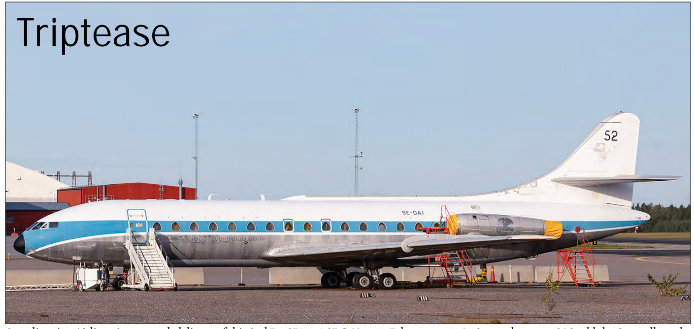
Scandinavian Airlines System took delivery of this Sud Est SE210-3 SE-DAI on 10 February 1966. In September 1971, SAS sold the Caravelle to the Swedish Air Force and was registered 85210 (code 52 still visible). In 1999, the Caravelle was withdrawn from use and registered to Le Caravelle Club on 28 January. The Caravelle reverted to the former civil registration the same day. (Stockholm-Arlanda, 18 September 2020, André Alders)