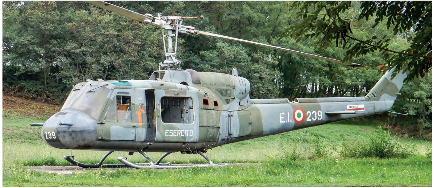
AB204B (MM80393)/EI-239 sits on a concrete patch at the Scuola di Fanteria di Cesano. It is visible from outside the barracks. (Cesano, 25 September 2020)