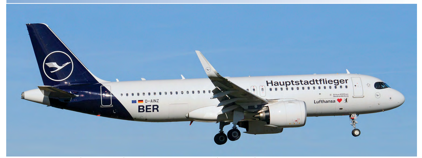
After the "Siegerflieger" (B747-8 D-ABYI) and the "Mannschaftsflieger" (A321 D-AISQ), Lufthansa introduced a third "Flieger" in October, the "Haupstadtflieger". The reason for these titles is of course the opening of the new Berlin-Brandenburg Airport (IATA code BER). Airbus A320 D-AINZ is the lucky aircraft to wear these titles. It was delivered to Lufthansa on 4 August and is also the first Lufthansa A320neo to wear the Zorro mask. Lufthansa's Haupstadtflieger" is seen here on finals at Munich after a flight from (of course) Berlin-Brandenburg Airport on 14 November 2020.