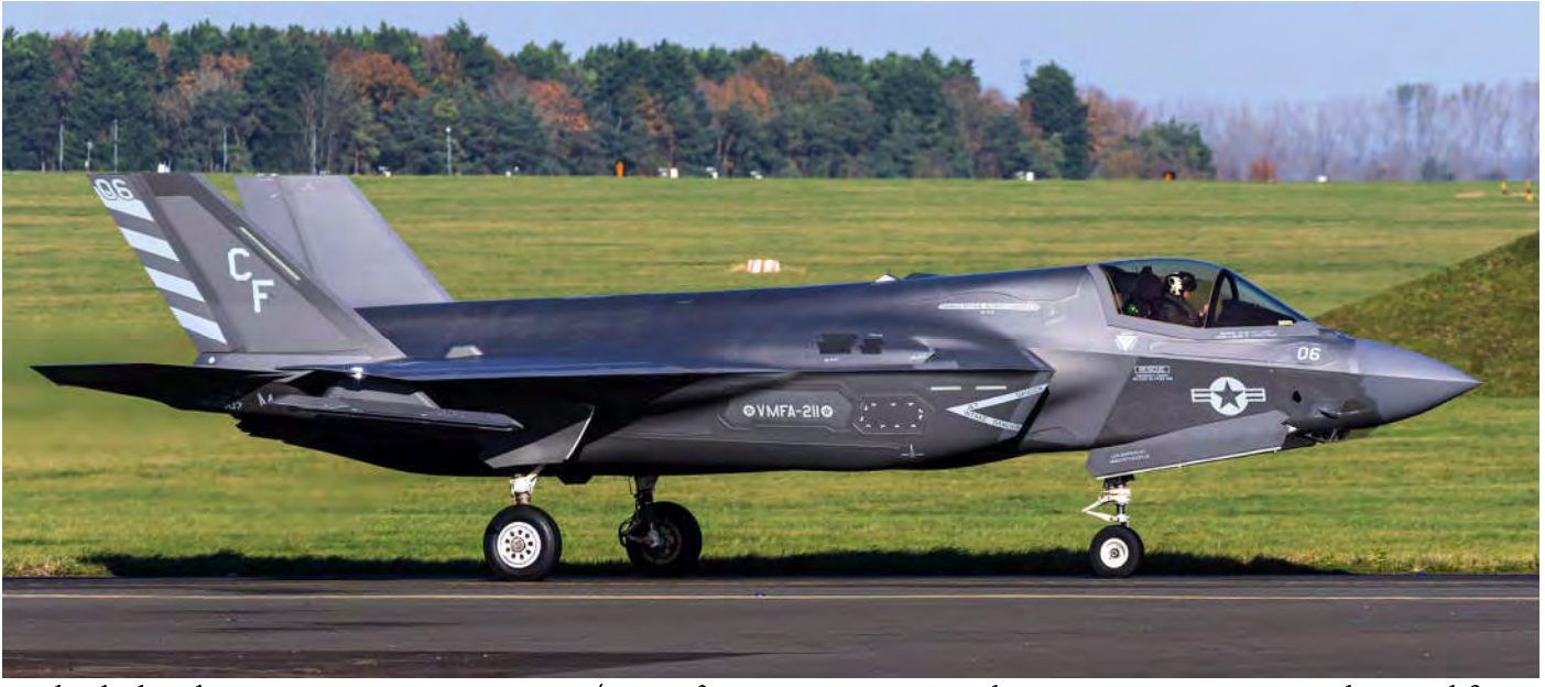
Lastly, deployed US Marine Corps F-35B 169607/CF-06 of VMFA-211 participated in Crimson Warrior at Marham and flew a mission with its RAF buddies. (4 November 2020,)