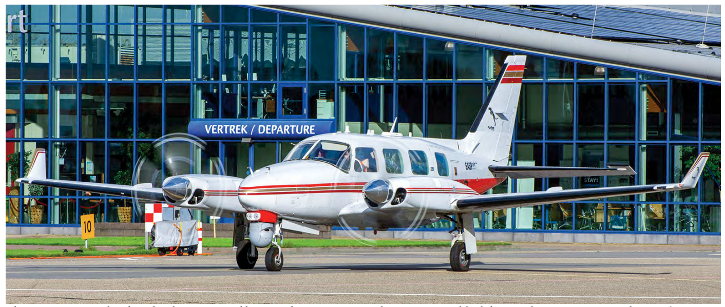
The Piper PA-31 on the photo has been operated by 2 Excel Aviation since February 2017. Dubbed the 'Panther' Maritime Patrol Aircraft, G-SCMR is being used for sensor trails in cooperation with Dutch company EASP Air. (Den Helder, 7 October 2020, Erwin Stam)