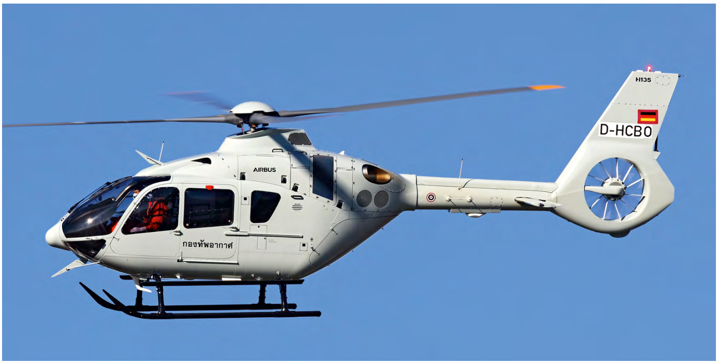
Another H135 visited Manching for a testflight out of the Airbus Helicopters facility in Donauwörth. H135T3H, registration D-HCBO is the second H135 already active with Airbus Helicopters. In February 2020, the Royal Thai Air Force signed an order for six H135s and will use the helicopters for basic helicopter training. (18 November 2020, Dietmar Fenners)