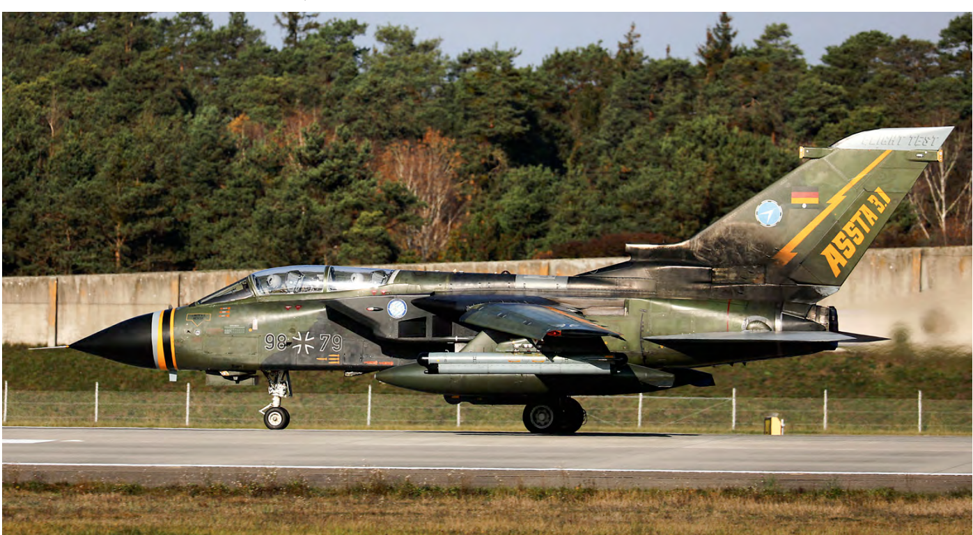
Tornado ECR test aircraft 98+79 of WTD61 was seen lining up on the runway of Manching on 5 November 2020, still wearing its ASSTA 3.1 markings but already flying for the ASSTA 4.1 upgrade program. This Tornado was actually the only German Tornado that was converted from IDS to ECR.

During the UN mission, one IAR330 was damaged at Douentza base. The Puma from the Carpathian Pumas Detachment was damaged by a storm on 10 August 2020. Two helicopters were conducting a reconnaissance mission and had landed for refueling at the UNO Base at Douentza. A sudden storm unfolded and one of the two helicopters was blown over. This helicopter was transported home on board a Boeing C-17A Globemaster III on 23 October 2020.