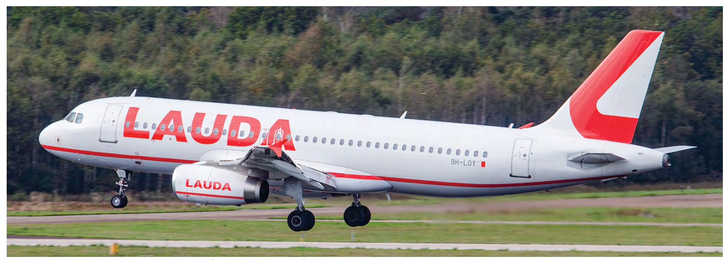
Lauda Europe is the successor of Lauda (dba LaudaMotion). The company is legally based in Malta and the result of a conflict between Lauda and Ryanair, the labour union and the Austrian government. Airbus A320 9H-LOY is former OE-LOY. (Eindhoven, 9 October 2020,)