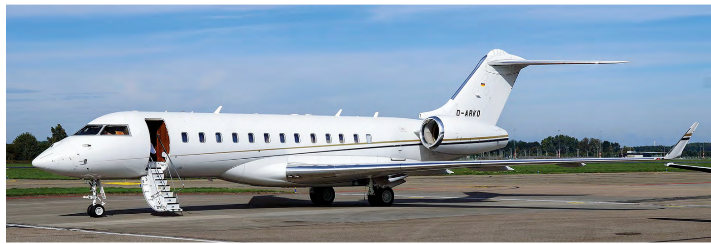
Global Express XRS D-ARKO was ferried to Lelystad for paint work. We usually show you the end result but the aircraft departed all white so this is the before photo. Operator K5-Aviation apparently needs some colourful inspiration. (Lelystad, 2 October 2020)