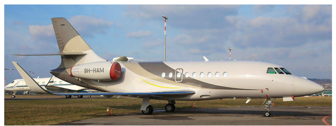
Avcon Jet took delivery of this Falcon 2000LX in June 2012 as OE-HAM. It was transferred to Avcon Jet Malta in February 2016. The aircraft has kept the colours in which it was delivered. (Zurich, 25 January 2019,)