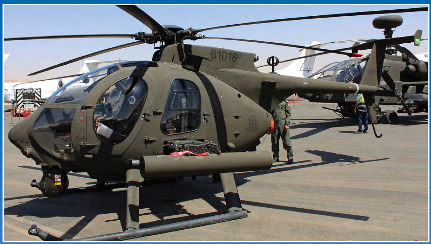
61016 is a Boeing AH-6i and is used by the Saudi Arabia National Guard. Some 36 examples have been ordered and most must have been delivered by now.