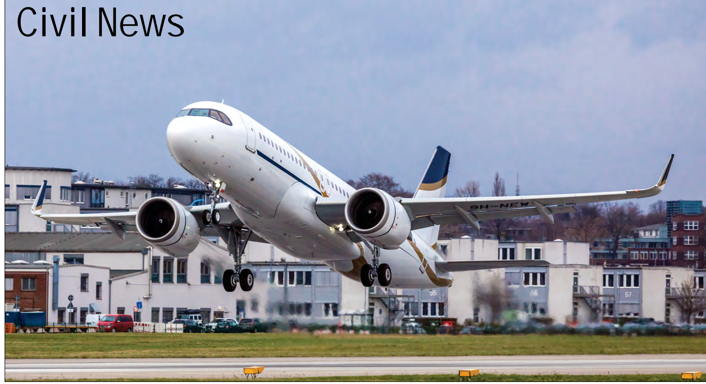
On 22 March, Airbus delivered the second A320ACJ NEO, the corporate jet version of the A320NEO. On that date, the 9H-NEW registered aircraft was ferried to Indianopolis (IN) for interior outfitting. The aircraft will be delivered to Swiss company Air Luther, but will be operated by Comlux Malta. The aircraft is seen here during its first flight at Hamburg Finkenwerder on 12 March.