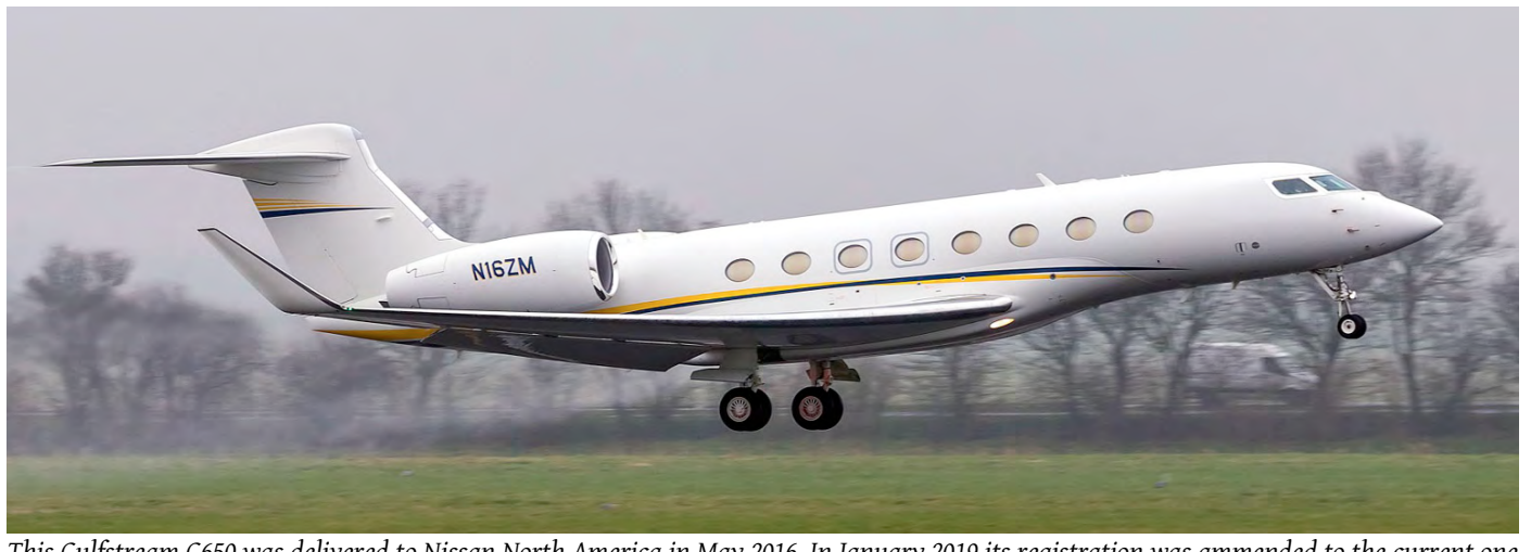
This Gulfstream G650 was delivered to Nissan North America in May 2016. In January 2019 its registration was ammended to the current one N16ZM. (Rotterdam - The Hague, 1 February 2019,)