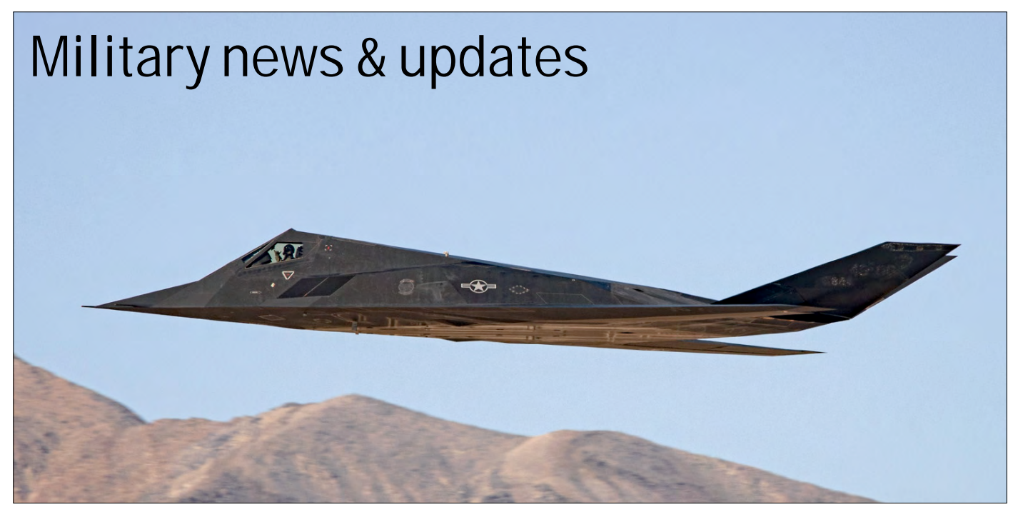
Zooming by at Death Valley and clearly aware of the photographer, this F-117 jock makes the Shaka sign. As we revealed, the F-117 was brought back to active service and we suspect this may be one of the last flights before the type is returned to storage. (27 February 2019, Dan Stijovich)

Because of our standardization we sometimes use type, unit and serial presentations that may strongly differ from those used by the manufacturer or user. It is therefore possible that the information sent by you can deviate from the information we publish.