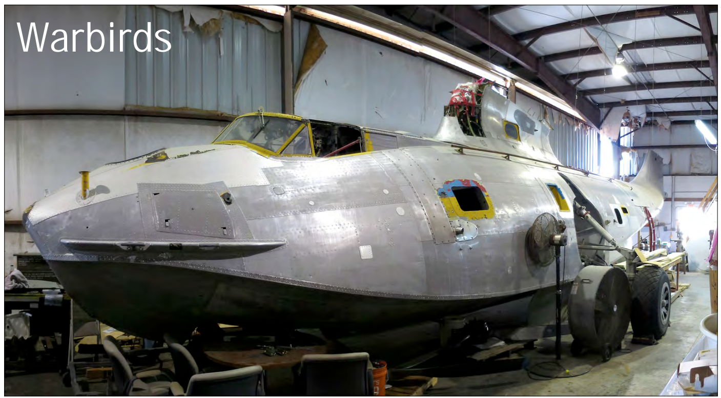
One of the Scramble editors on treasure hunt, discovered this fully stripped Catalina fuselage in one of the American Aero Services hangars at New Smyrna Beach Municipal Airport (FL). The vintage amphibian is still owned by the Collings Foundation. Before the foundation bought the Dutch Catalina PH-PBY, they had already acquired former Gouvernement de Quebec Canso C-FPQK Tanker # 712. Initially American Aero Services started a full restoration to flying condition, but the acquisition of PH-PBY changed things. Now C-FPQK lies somewhat pittyful, waiting for things to come. (Jaap Dijkstra, 8 March 2019)