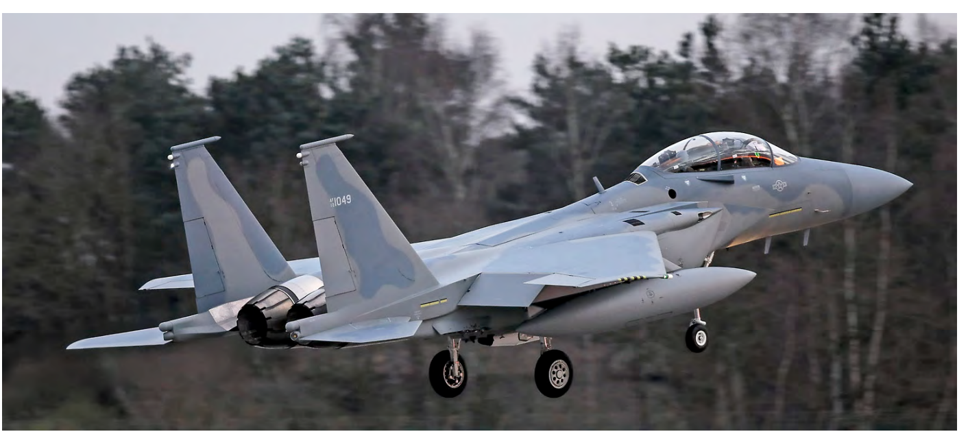
Mark Rourke was present at RAF Lakenheath to catch four new Boeing F-15SA Eagles on the early evening of 26 March 2019. The ferry of Retro61 flight was supported by McDonnell Douglas KC-10A Extender 84-0189 as Gold 11. The four F-15SA were 12-1046 as Retro61, 12-1049 as Retro62, 12-1074 as Retro63 (photo), and 12-1075 as Retro64. They departed towards Saudi Arabia early morning 28 March 2019. We count around twenty new buil F-15SA still to be delivered.