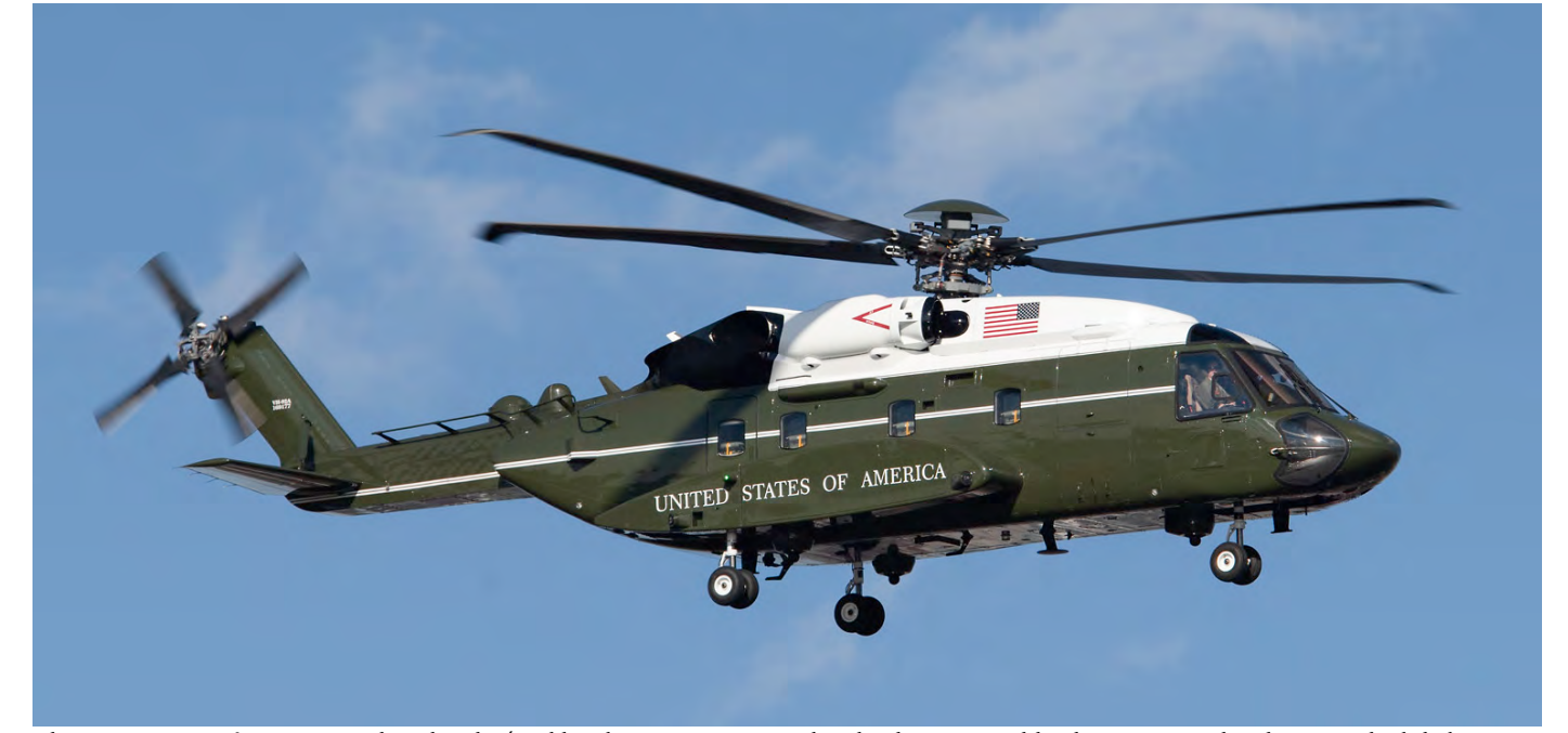
The newest recuit for HMX-1 is the Sikorsky/Lockheed Martin S-92 Superhawk. The VH-92A, like the 169177 on the photo, is scheduled to enter service in 2020, replacing the VH-3Ds and VH-60Ns. (Washington (DC), 04 March 2019,)

Unmanned Aerial Systems (UAS) for the US Navy. The contract procures the technical expertise of field service representatives, logistic experts and test support to ensure the MQ-4C Triton and mission control and operator training systems are fully sustained and mission capable. The work is expected to be completed in March 2020. The Triton, built for the US Navy, supports a wide range of missions including maritime Intelligence, Surveilannce and Reconnaissanse (ISR) patrol, signals intelligence, search and rescue and communications relay. The aircraft can fly over 24 hours at a time, at altitudes higher than 10 miles, with an operational range of 8,200 nautical miles.