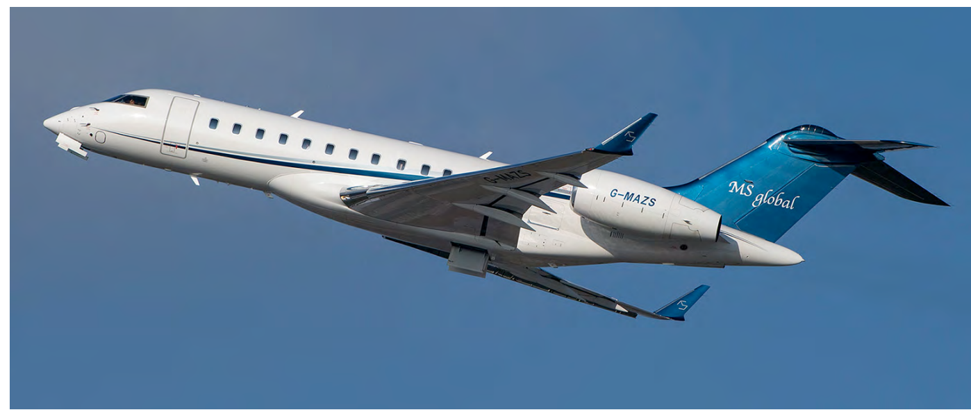
A company called M-BMAL Ltd. was listed as the owner for a Global 6000 registered M-BMAL in March 2014. In October 2014 Albinati Aviation became the operator and registered the jet 9H-SMB. In March 2018 Gama Aviation became the current operator and registered it G-MAZS. (Zurich, 21 January 2019,)