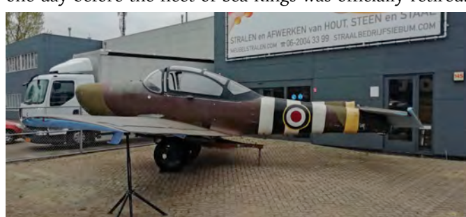
FWP149D 90+36/00-LWG at its new location, Straalbedrijf Siebum, in Apeldoorn (28 March 2019)

RS03 Sea King Mk48 WA833 mar19 The town of Koksijde has bought RS03 on 20 March for 1 Euro, one day before the fleet of Sea Kings was officially retired.