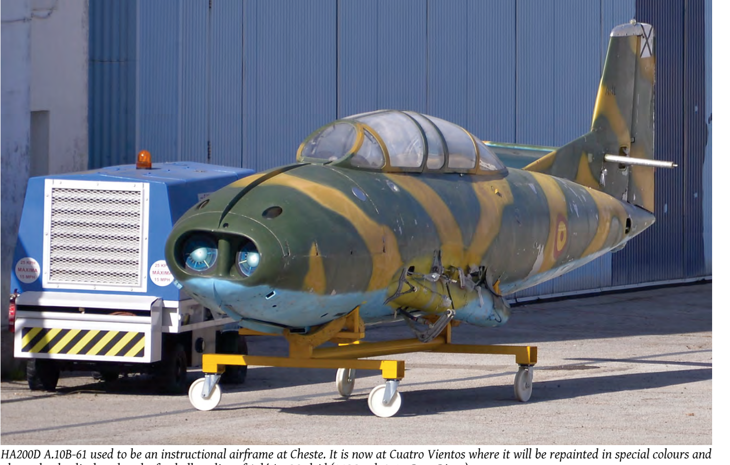
HA200D A.10B-61 used to be an instructional airframe at Cheste. It is now at Cuatro Vientos where it will be repainted in special colours and planned to be displayed at the football stadion of Atlético Madrid (16 March 2019, Paco Rivas)

Updating EMOOS; Both An-26Bs (03 blue, 05 blue) and five Mi-8s (20 blue, 22 blue (marked as 23 blue), 24 blue, 27 blue and unmarked spares aircraft) were still stored in February 2019, while L-39C 03 blue was still preserved. Gone have Su-7B 01 red and An-2s 15 yellow and 58 blue.