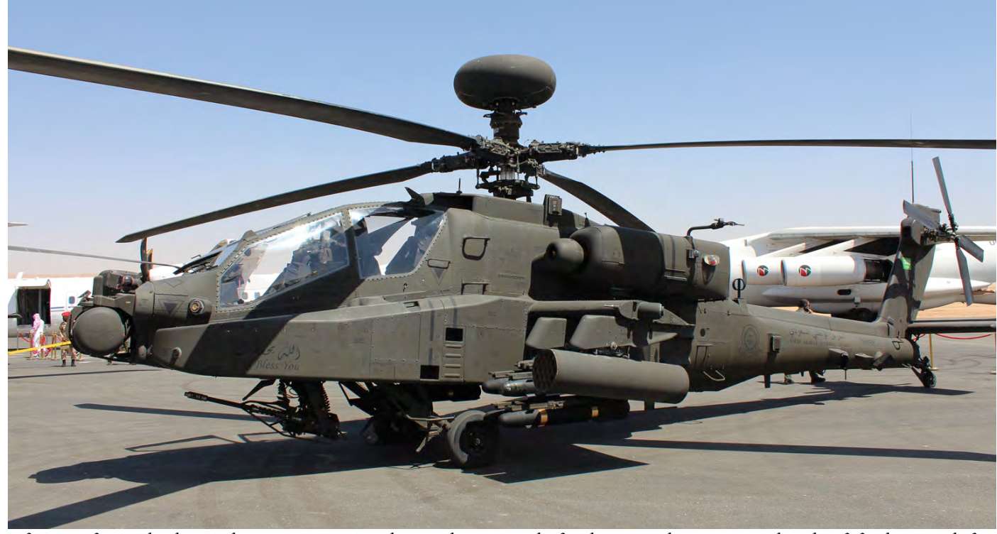
A first note for our database is this Boeing AH-64 Apache Guardian 40015. The fiscal year serial is 14-00015 and on the aft fuselage, just before the tail boom, RSLFAC is depicted (Royal Saudi Land Forces Aviation Command).

skills of our adversaries". The well-known private company Draken International is currently on contract at Nellis AFB (NV), where it supports the USAF Weapons School and major exercises like Red Flag. But now the USAF plans to award two more contracts in 2020, setting up a permanent presence of private adversary air at Klamath Falls Int/Kingsley Field (OR), and Holloman AFB (NM). The awards will be part of a broader multi-award contract, known as Combat Air Force Contracted Air Support (CAF/CAS), worth up to USD 6 billion for 40,000plus hours of adversary air at twelve fighter bases and nearly 10,000 hours to help train joint terminal attack controllers at nine Army bases. Kingsley Field is home to the 173rd Fighter Wing, the sole formal training school for the F-15 Eagle, while Holloman's 54th Fighter Group - a detachment of the 56th Fighter Wing at Luke AFB (AZ) - hosts F-16 pilot training.