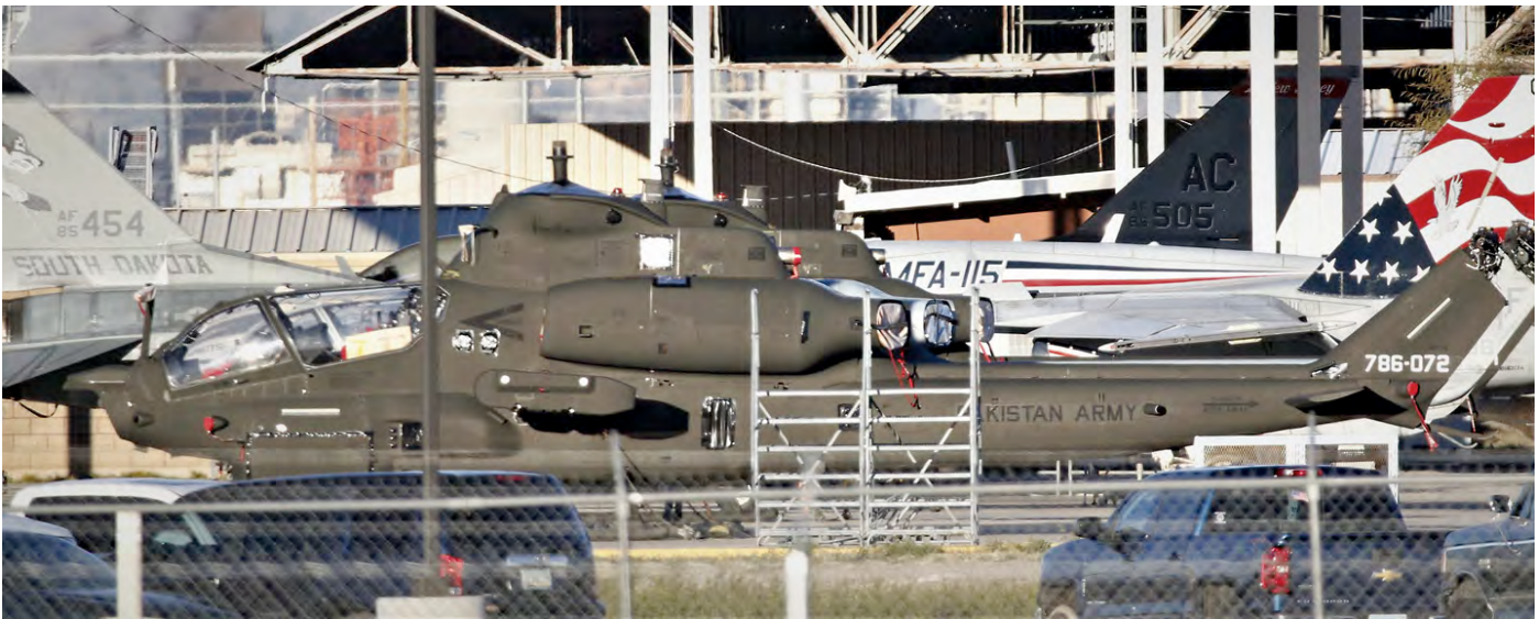
Nine Pakistani AH-1Z are stored at 309th AMARG. This is of course not the first time the Pakistanis suffered a delivery ban from the USA... (786-072, Davis Monthan AFB (AZ), 26 February 2019,)