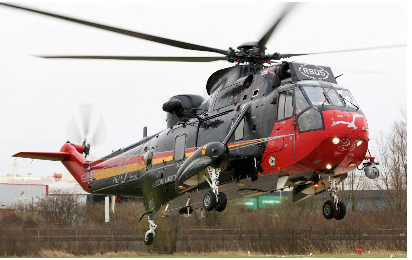
RS05 is specially marked for its 25th year anniversary in service. It was officially withdrawn on 21 March but was ferried to Ostend for the local technical school on the 26th. (Amsterdam Heliport, 12 March 2019,)

RAF Topcliffe, RAF Linton-on-Ouse, RAF Waddington, RAF College Cranwell, RAF Coningsby, RAF Donna Nook, RAF Holbeach and RAF Wyton.