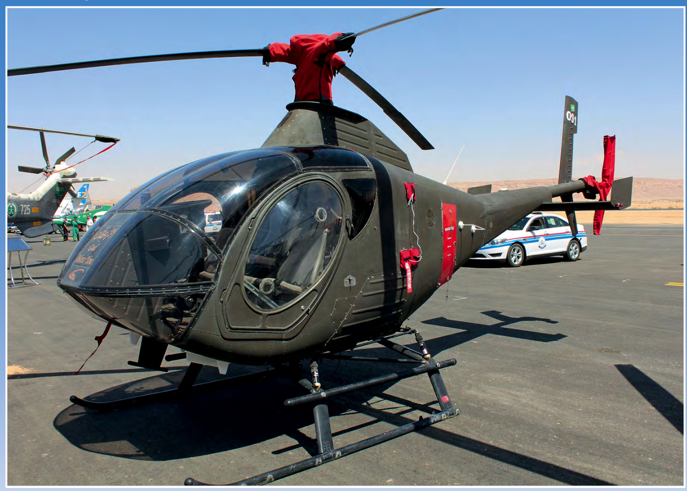
Sikorsky Schweizer S-333 with serial 091 is one of the two noted so far with the Royal Saudi Land Forces (RSLF). The RSLF uses the type for pilot qualification, instrument and night flying training. The size of the RSLF fleet is unknown, although between seven and thirty is mentioned by various sources. (Keith Doughty, Al Thumamah, March 2019)