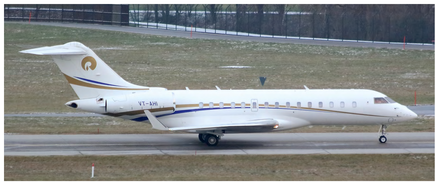
Reliance Industries Limited is an Indian conglomerate holding company. Global 6000 VT-AHI was acquired by the company in July 2015. (Zurich, 24 January 2019,)