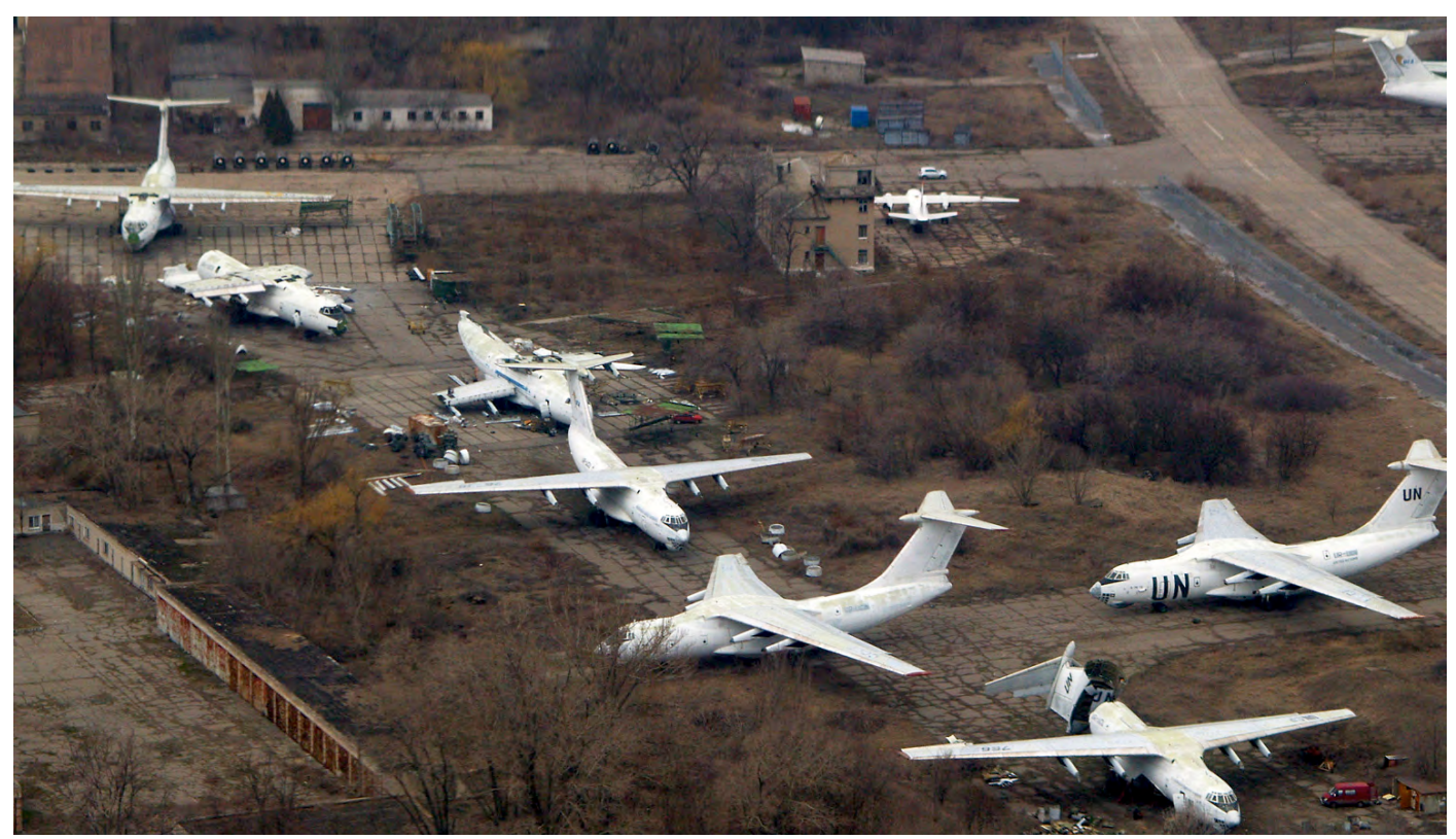
Ukraine inherited some State Aircraft Plants as well as a sizeable fleet of Il-76s when the Soviet Union dissolved. At Zaporizhzhia/Mokraya, they do not only maintain aircraft, but they also scrap them. (23 March 2019, Airhitcher)

The following Viking TX1 gliders are undergoing repairs by SERCO at RAF Syerston. All were confirmed present in January 2019: