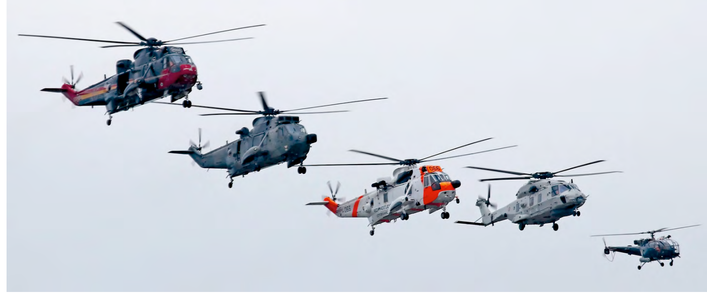
We say goodbye to the Belgian Sea King! The last one, RS05, is seen here flying in formation with an Alouette III and NH90s as well as foreign colleagues, Norwegian and German Sea Kings. (Koksijde, 20 March 2019,)

Kendrew Barracks (former RAF Cottesmore), National Memorial Arboretum at Alrewas (Burton-on-Trent), SECA Stafford, RAF Cosford, RAF Shawbury, DECA Sealand, RAF Valley, BAES Warton, BAES Samlesbury, RAF Spadeadam, RAF Leeming,