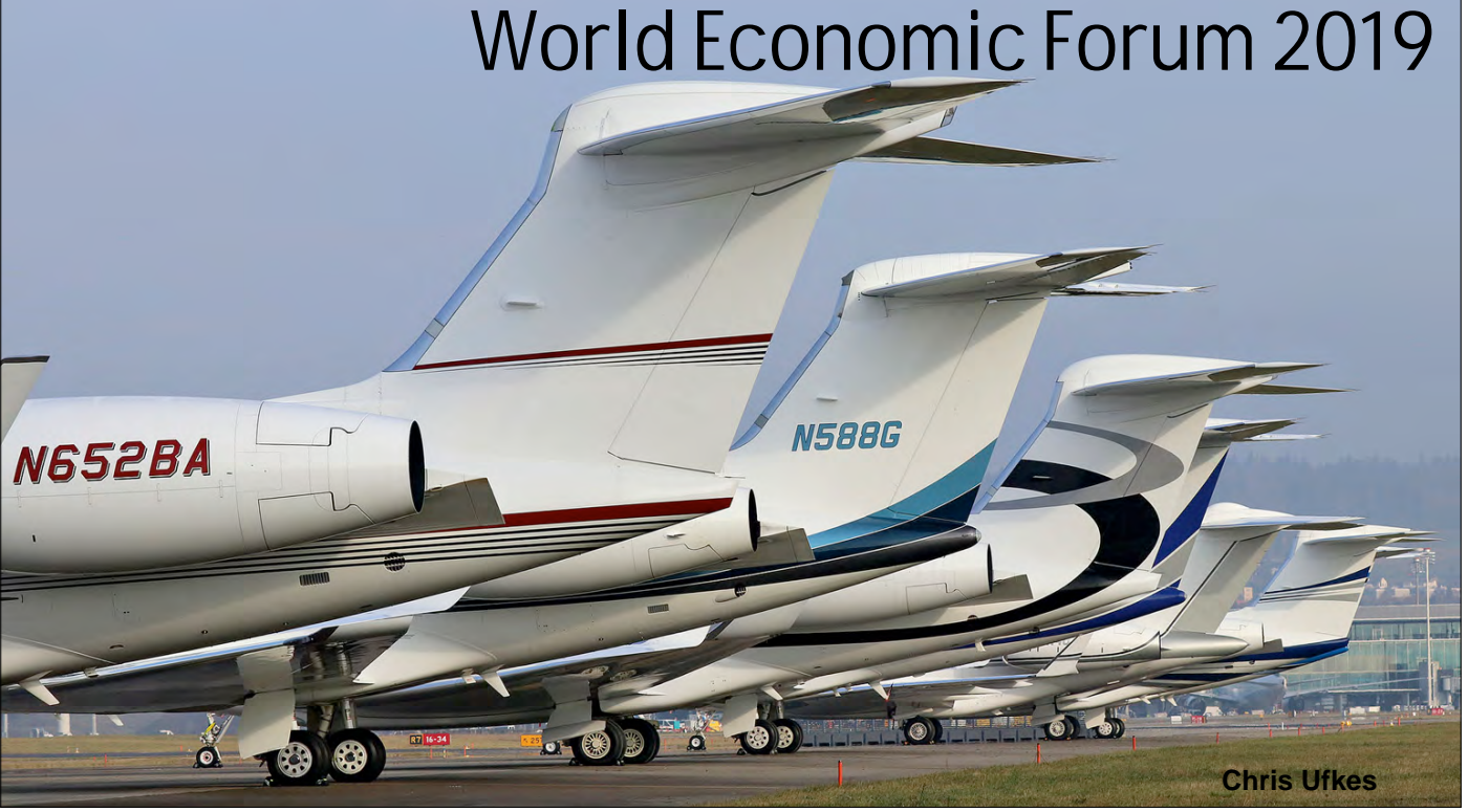
Finding a suitable opening photo is always a challenge. This time it is tails galore, caught on camera by Maarten Visser Sr during a Zurich platform tour on 23 January 2019.

The World Economic Forum took place from 22 till 25 January 2019 at the Davos-Klosters in Świtzerland. The World Economic Forum Annual Meeting is the only yearly gathering that brings together leaders of global society. Participation is by invitation only and reserved for members of the Forum's communities. The annual meeting featured a robust humanitarian agenda. Climate change, income disparity dominated the final debate. The 49th annual meeting closed with initiatives to address global problems.