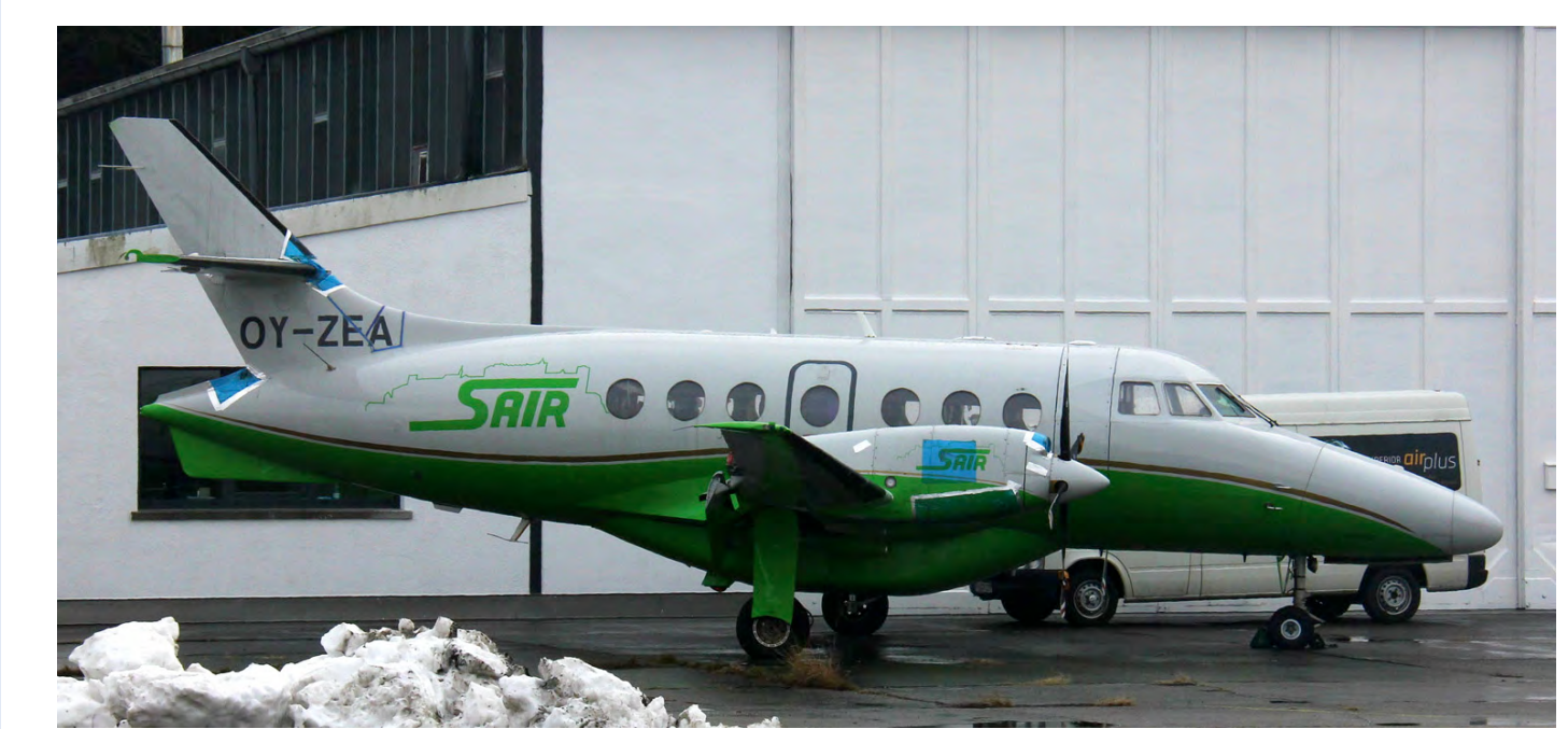
This Jetsteam was one of two aircraft destined for S-Air Salzburg. The former Blue Islands aircraft was withdrawn from use in November 2014. Although registration OY-ZEA is visible on its fuselage its former registration G-ISLC is still current with the UK Civil Aviation Authority. (Friedrichshafen, 9 January 2019, Juha Ritaranta)