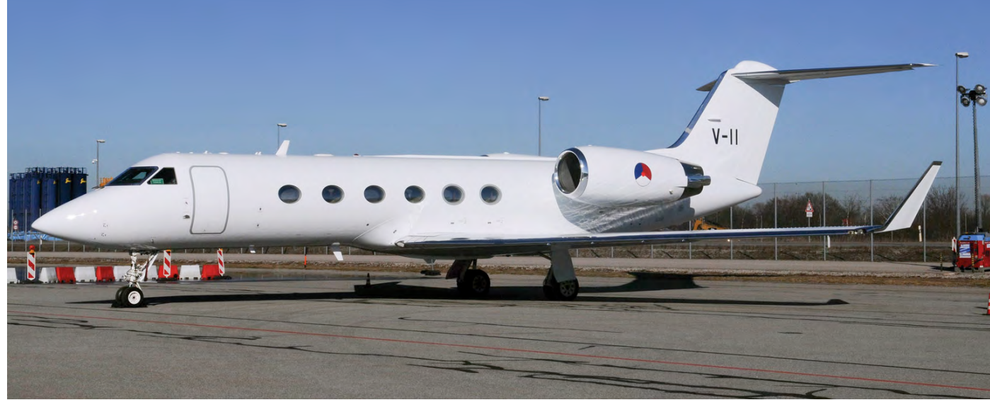
In the final year of operation Netherlands Air Force 334sq G-IV V-11 was stripped from its titels and only carries its registration and roundel. Besides of the Government B737-700BBJ, the Gulfstream 4 was used for delegation transport into Munich and captured in basking sun on 15 February 2019.