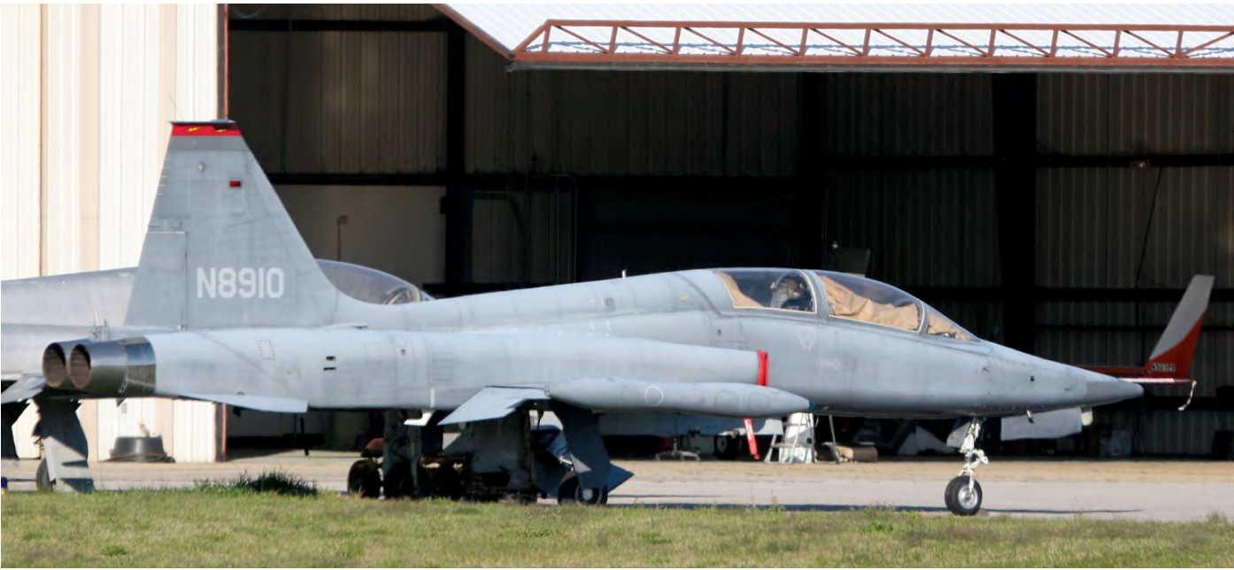
After its carreer within the Royal Netherlands Air Force as K-4003, this NF-5B became civil in the USA. In 2013 it went as N8910 to the United States Aviation Museum Inc, Tulsa (OK). On 7 March 2019 is was photographed by Jaap Dijkstra at St. Augustine (FL), in line with some, not airworthy, former Jordananian F-5Es and Fs.

... Ala 22 ex HP1677IA 14738 mar19 Four second-hand Koalas are on order to replace the ill-fated Dhruvs. The first arrived 14 March.