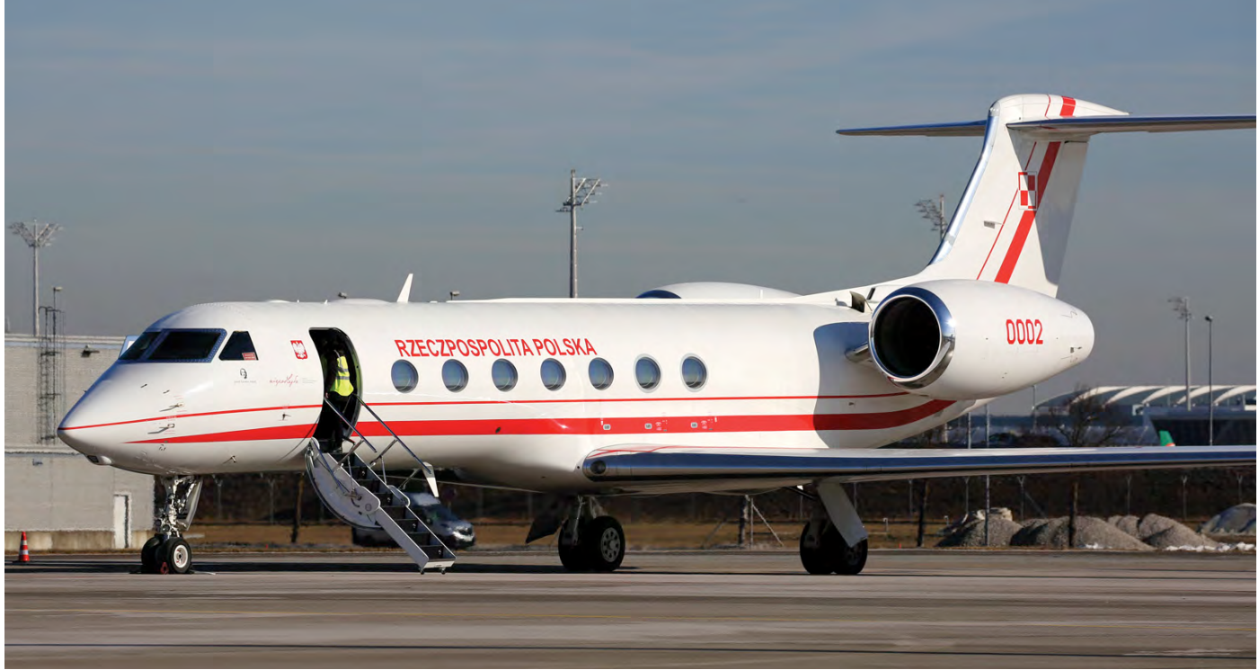
Poland visited the Munich Conference as well and used their Embraer 175s and Gulfstream 550 fleet, like 0002 seen here. The Gulfstream is one of two in use with the 1.BLTr and was delivered in August 2017 as addition to the VIP transport fleet.