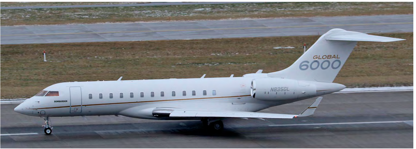
The Bombardier Aerospace Corporation bizjet was seen the day the annual meeting officialy ended. Global 6000 N835GL has been the corporate chariot since December 2018. (Zurich, 26 January 2019,)

Personal copy Distribution to a third party is not allowed