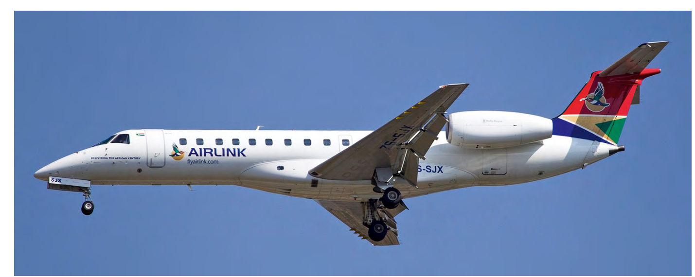
In 2001 this Embraer ERJ135LR was delivered to South African Airlink. The company changed the titles to Airlink on ZS-SJX in 2008. (O. R. Tambo International Airport, 18 March 2009,)

Addis Ababa in the morning of 10 March before departing for that faithful flight. The following day, 11 March, the airline announced that both the Cockpit Voice Recorder (CVR) and Flight Data Recorder (FDR) have been recovered.