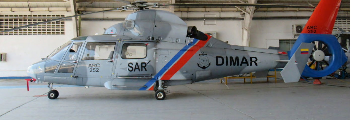
Two second-hand AS365N Dauphins were added to the air fleet of the Colombian navy recently. One of these, ARC252, was photographed with its unit Grupo Aeronaval del Caribe at Barranquilla. (Johnny Von Rod, 1 March 2019).