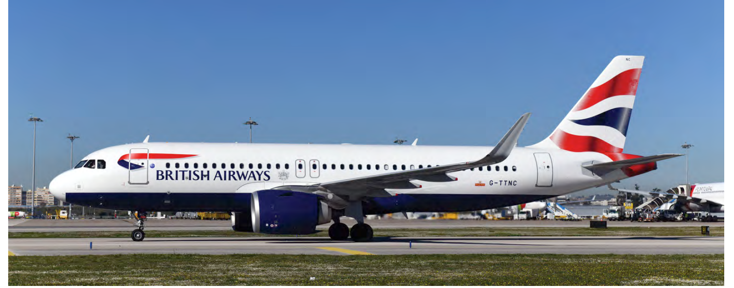
British Airways has ordered 25 Airbus A320 NEO aircraft. Ten of them have been delivered so far. G-TTNC is one of them and was ferried from Toulouse to its homebase London-Heathrow in June 2018. (Lisbon, 19 March 2019,)