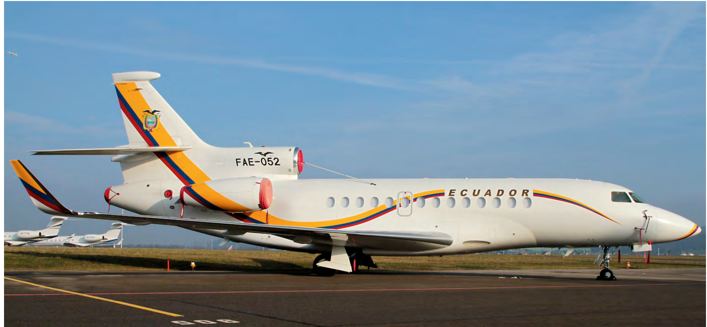
This Falcon 7X FAE-052 visited this year's World Economic Forum. Ecuador received it in 2012, so it is already in its seventh yearof operation with Ala 11. (Zurich-Kloten, 23 January 2019,)

F-15J 868 was seen departing Komatsu, for the moment no confirmation it went to Nagoya. 933 was seen arriving at Naha after overhaul.