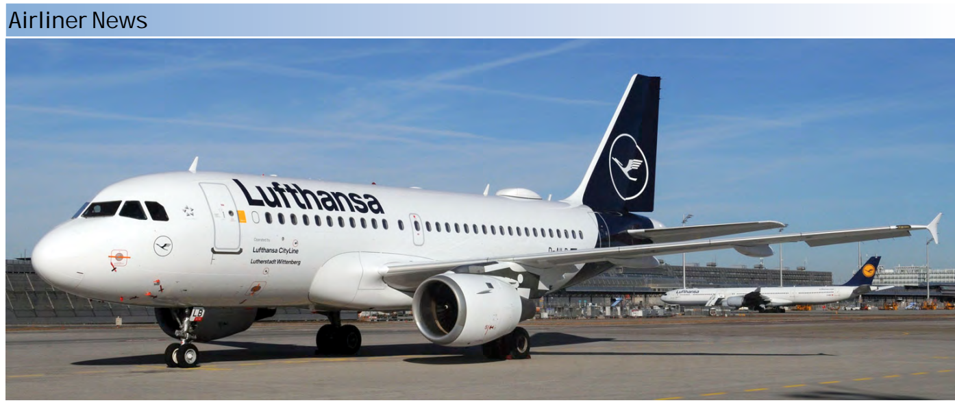
In January 2019, Lufthansa Airbus A319 D-AILB was painted in the new Lufthansa colour scheme. In that same month the aircraft was also transferred to Lufthansa Cityline as can be seen by the small titles "Operated by Lufthansa Cityline" stickers . It is the first A319 to be transferred to Lufthansa Cityline. Four more aircraft of the same type will follow by the end of 2020 and all aircraft will be based at Munich. The transfer is the result off a new agreement between Lufthansa CityLine and pilots' union "Vereinigung Cockpit" on new employment conditions for their approximately 650 pilots. The collective bargaining agreement also sets the stage for the introduction of a new, future-proof aircraft type at Lufthansa CityLine in the form of larger A320 family aircraft. Lufthansa CityLine will begin operating Airbus A319s on its regional network, which will be taken over from the parent company Lufthansa in Spring 2019. (Munich, 23 February 2019)