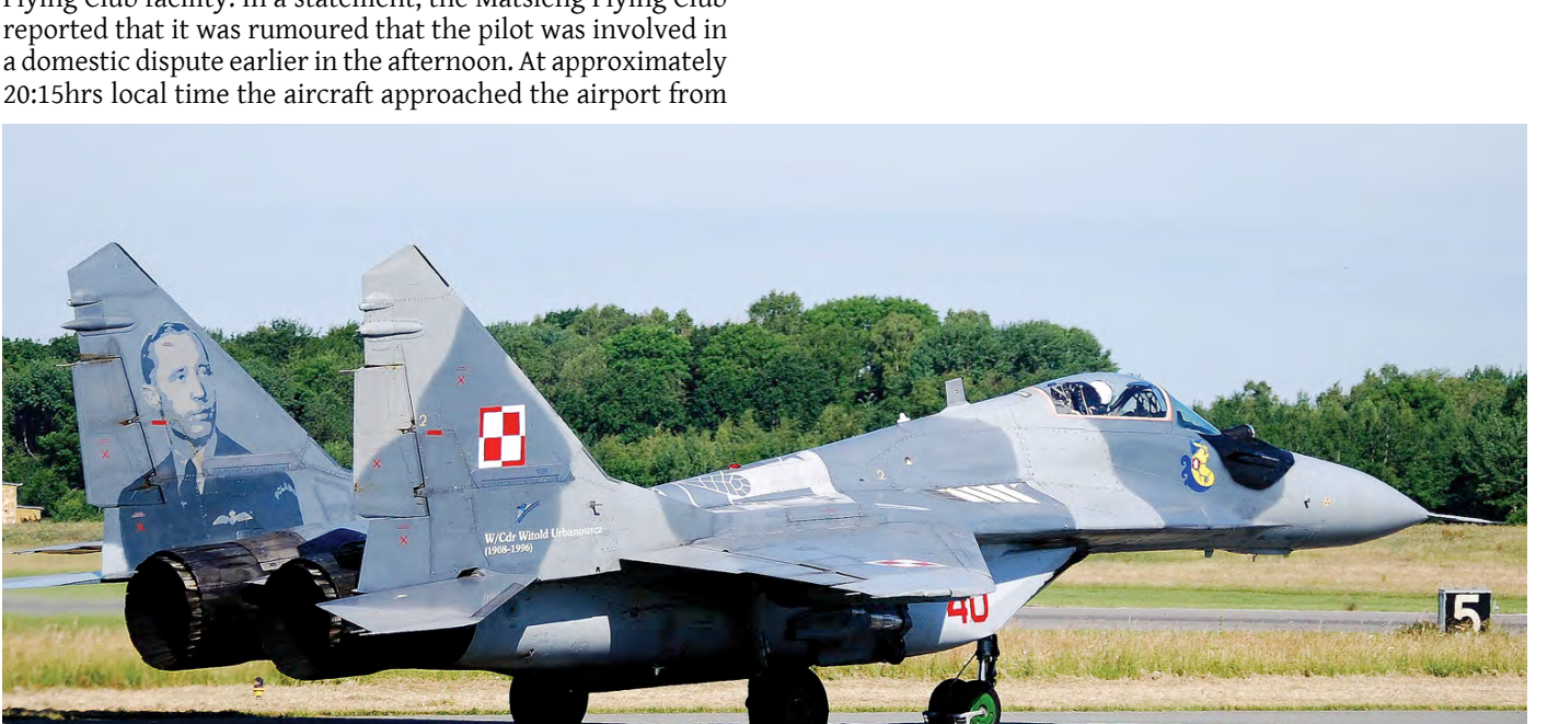
A Polish Mig-29 came down in Mazovian Voivodeship shortly after take-off. Luckily the pilot of the fighter with serial 40 managed to eject. (Florennes Air Base, 15 June 2017,)

Credits: ASN, Aviation Herald, B3A, FlightGlobal