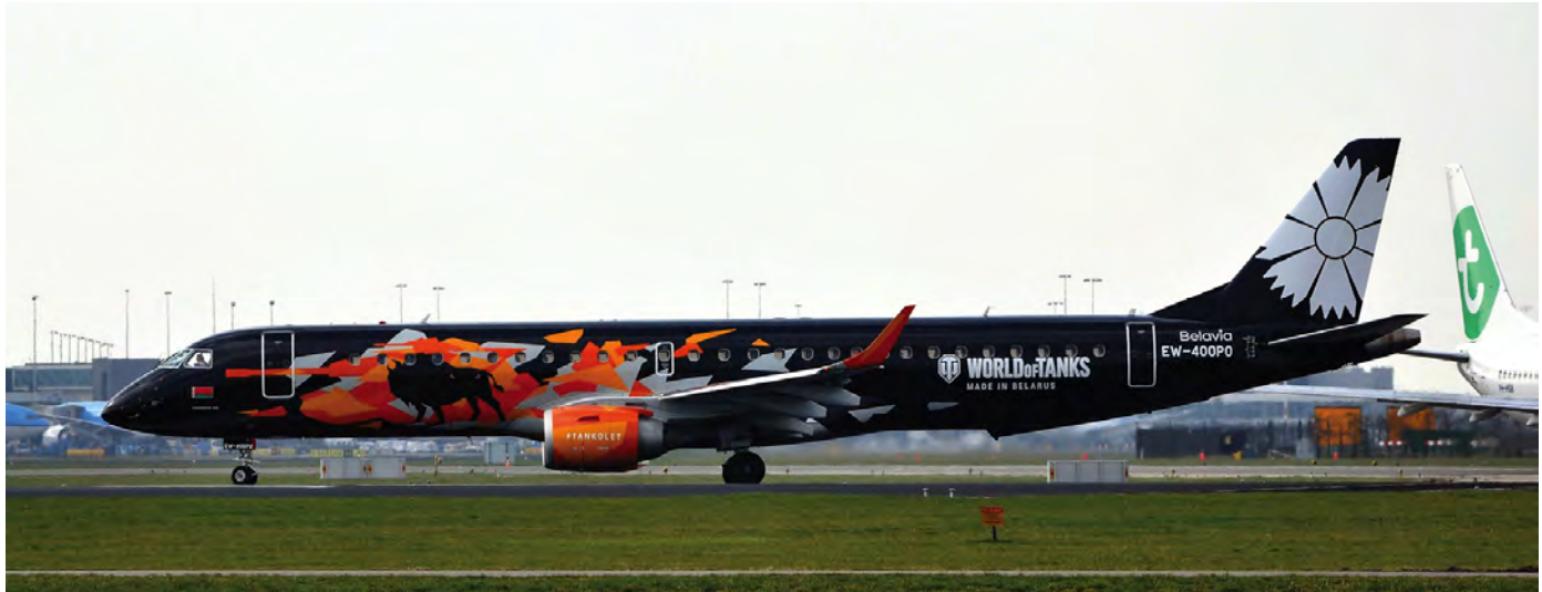
Belavia has painted a second aircraft in a World of Tanks colour scheme. This videogame is one of Belarus' best-selling export products. Further you will see a silhouette of a European bison which is a sort of national symbol of Belarus. (Amsterdam-Schiphol, 2 March 2019, Frank Doornbos)