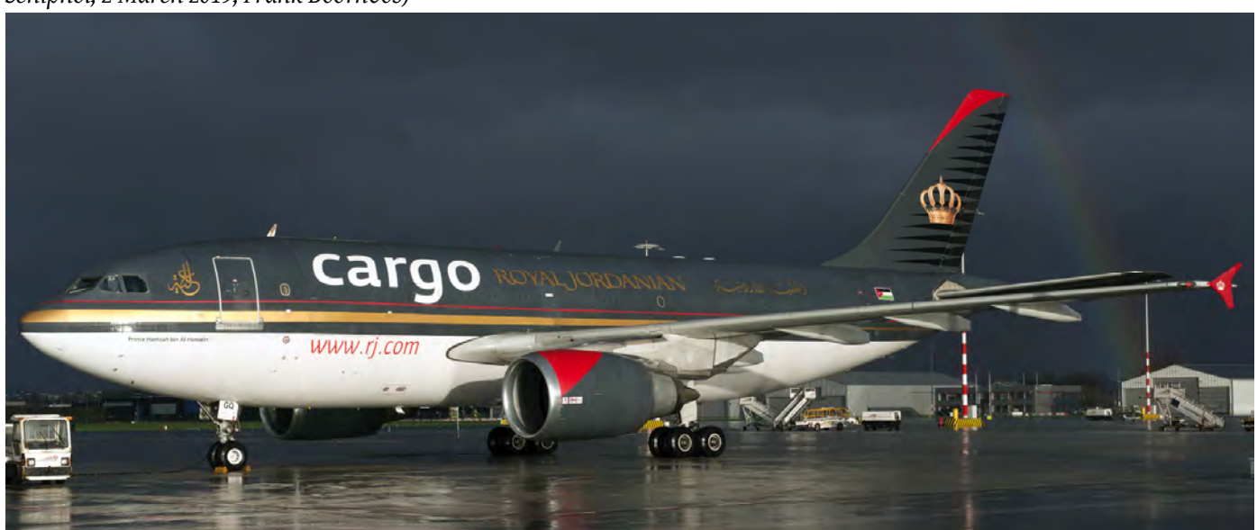
Because of the closure of Maastricht-Aachen airport due to bad weather conditions, Airbus A310 JY-AGQ of Royal Jordanian Cargo was diverted to Rotterdam-The Hague. Later that day it departed to its original destination. (Rotterdam-The Hague, 10 March 2019,) Personal copy

Distribution to a third party is not allowed