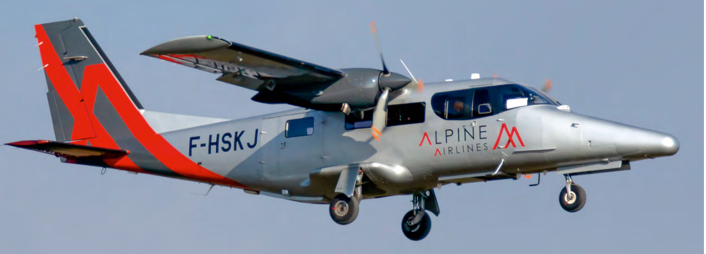
Based at Chambéry airport Alpine Airlines is the only airline to offer commercial flights to Courchevel Altiport. AP-68TP-600 Viator F-HSKJ is the only aircraft of its type in the fleet and was delivered in 2017. (Zurich, 19 January 2019, Thomas Szecsko)