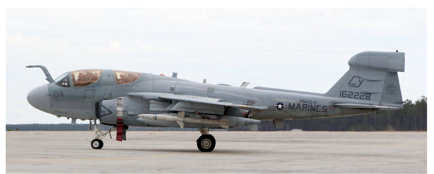
On 8 March 2019 it, unfortunately, finally happened; the US Marines Corps deactivate their last EA-6B Prowler squadron, VMAQ-2. It also marks the end of the Grumman A-6 family which started over six decades ago.