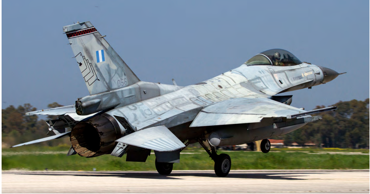
F-16C 056 carries a checkered black red tail band. It also has the four suites of aces with an arrow of "Velos" 341 Mira on the rudder.

The 335 Mira is the oldest squadron of the EPA, as it was established when Greece was under German occupation, in October 1941 at the Palestinian airport of Akir. The squadron was initially equipped with Hawker Hurricanes. In October 1953, the 335 Mira became the first squadron that replaced the propeller aircraft with jets, the F-84G and the RT-33A types. In May 1965, it received the legendary F-104G Starfighter which kept them operational until May 1992. On 3 April 1993, the squadron received the A-7E and TA-7C Corsairs. They were kept operational until 2008 when operations were temporarily suspended in preparation for the acceptance of the modern F-16s.