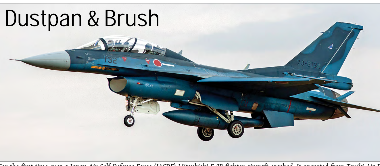
For the first time ever a Japan Air Self-Defense Force (JASDF) Mitsubishi F-2B fighter aircraft crashed. It operated from Tsuiki Air Base in Fukuoka Prefecture and disappeared into the Sea of Japan (also known as East Sea) near Yamaguchi Prefecture on 20th February. The aircraft involved is F-2B 73-8132. Seen here on finals of Matshushima AB still in good shape. (19 October 2009, Dino van Doorn)