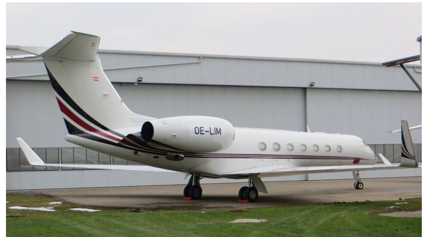
This Gulfstream G550 was delivered to NetJets Europe in 2008 as CS-DKJ. Early January 2019 the aircraft was added to the Avcon Jet fleet as OE-LIM. (Altenrhein, 22 January 2019)