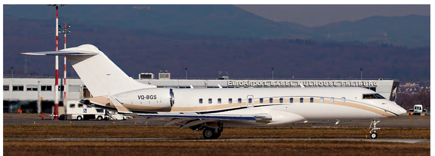
Aero Toy Store took delivery of this Global Express XRS as N754TS in July 2007. From November 2009 it is registered VQ-BGS with Macsteel Jet Services listed as operator. It seems that the Global is at the airport for maintenance purposes. It was caught on camera during a local test flight. (Basel Mulhouse Freiburg, 26 February 2019, LFSB Planes Pictures)