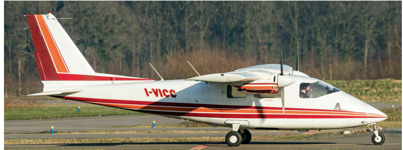
Partenavia P-68 I-VICC is no stranger to the Dutch skies as in 2016 the aircraft was based at Rotterdam for a while. This time the aircraft has been leased by Slagboom & Peeters Aerial Photography. (Teuge, 23 February 2019,)