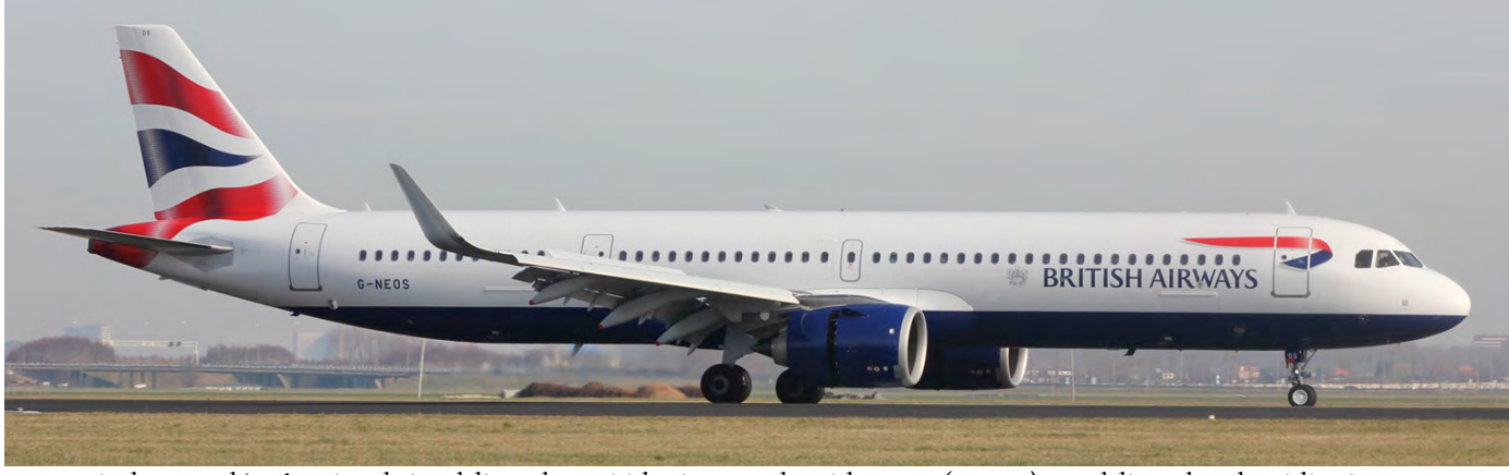
G-NEOS is the second 'NX' variant being delivered to British Airways. The Airbus A321(-251NX) was delivered to the airline in January 2019. (Amsterdam - Schiphol, 17 February 2019)