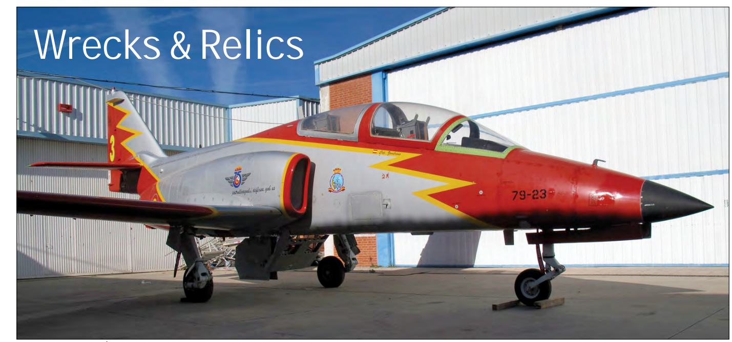
Former Patrulla Águila CASA101EB E.25-23 arrived by road at the Museo del Aire at Cuatro Vientos on 11 March 2019. It was put directly on display. (16 March 2019, Paco Rivas)