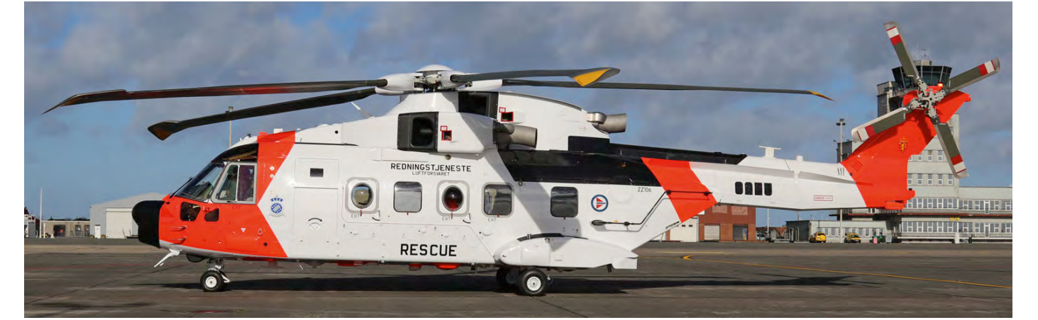
While enroute on delivery to Norway this AW101 marked as ZZ106 made a stop at Ostend for some fuel. Nik Deblauwe was able to catch future 0275 on camera on 7 February 2019.