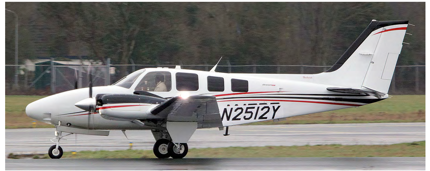
While on its way to Japan on delivery to its new owner Beech G58 N2512Y made a fuel stop at Groningen - Eelde airport. Menno Molenaar was able to photograph the aircraft on 8 February 2019. Its registration was cancelled on 15 February 2019.