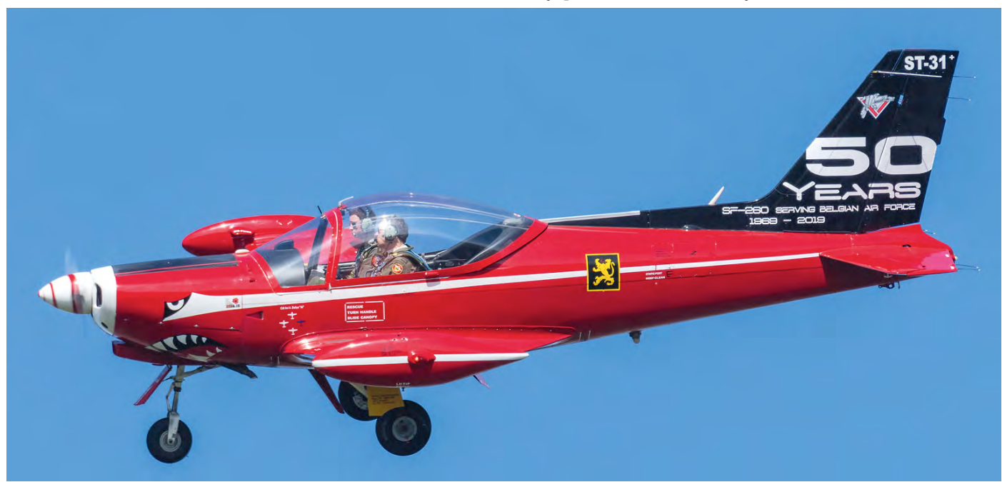
Celebrating the 50th (!) anniversary of the SF260 in Belgian service, at least four have received special tail markings for this remarkable feat. So far, ST-02, ST-30, ST-35 and this ST-31 have the black tail. (Kleine Brogel, 22 March 2019)

This will be the last time that the Tornado is mentioned in this section of our magazine! On 30 March 2019, the Tornado was officially withdrawn from use. We are working on providing a detailed historic overview of the Tornado in service with the RAF, from development until the last flight. If you have any photo material which you want to make available for