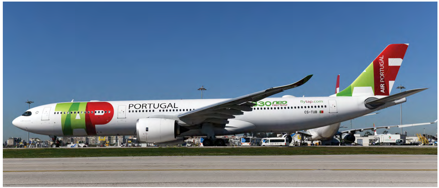
TAP Air Portugal is the launch customer of the Airbus A330-900neo, with nineteen planned for delivery until the end of 2019. The first aircraft delivered is CS-TUB, which is shown here. It was ferried from Toulouse to Lisbon on 28 November 2018. (Lisbon, 19 March 2019, Ton Jochems)