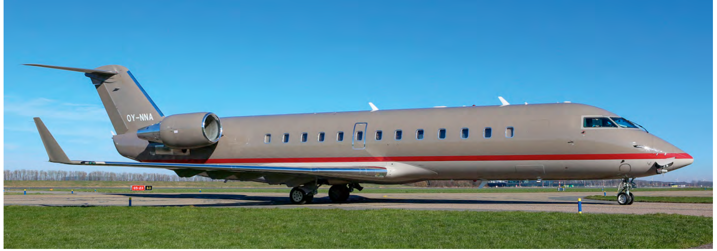
Delivered to ExecuJet Europe in 2009 as D-AANN this CL-850 was transferred to ExecuJet Scandinavia in 2011 and registered OY-NNA. The Challenger arrived with its Air-Driven Generator (ADG) deployed for an unknown reason. (Lelystad, 24 February 2019,)