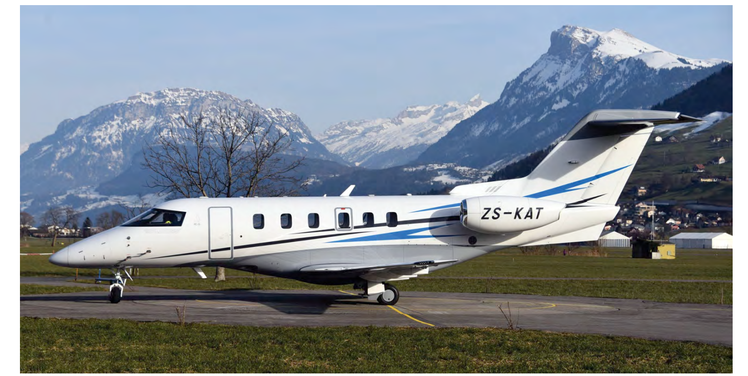
A typical ambience picture at Stans-Buochs with this PC-24 ZS-KAT with construction number 130 doing a compass swing at its place of "birth". The new owner/operator in South Africa was not known at this time of writing. (Stans-Buochs, 20 February 2019, Stephan Widmer)