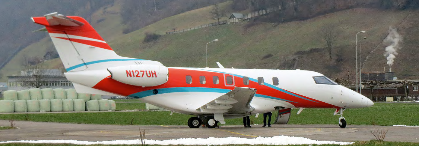
While this Pilatus was photographed with registration N127UH it is still officially registered HB-VUB. The aircraft is destined for U-Haul, an American moving equipment and storage rental company. It was photographed while doing engine runs. (Stans - Buochs, 21 January 2019, Tony Szulc)