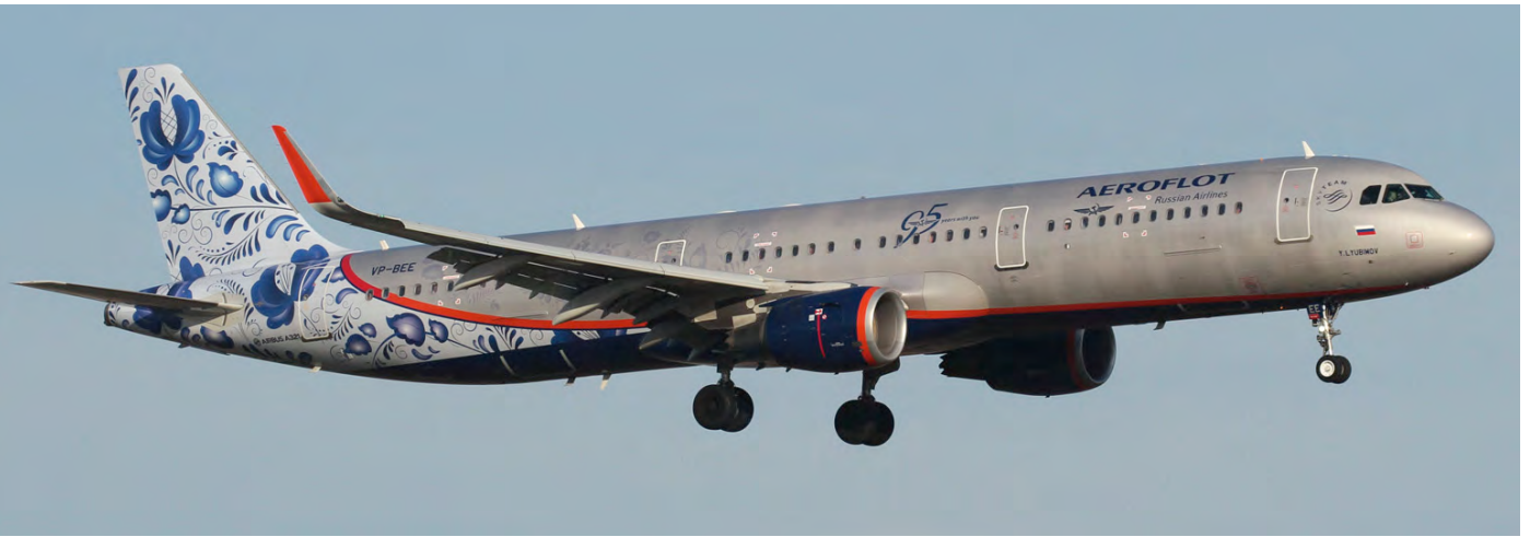
Aeroflot took delivery of this Airbus A321 in January 2017. From April 2018 VP-BEE has been operating in 95th Anniversary colours. (Amsterdam - Schiphol, 17 February 2019,)