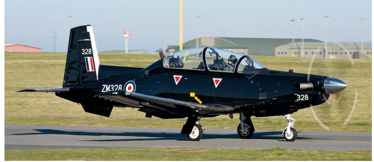
The Texan T1s ZM324 & ZM328 have started flying at RAF Valley and the nearby RLG (Relief Landing Ground) RAF Mona. They are using the 'Anglesey' and 'Gauntlet' call signs. (RAF Valley, 26 February 2019, Hywel 'Taff' Evans)

Some photos of some logbooks were found on Facebook. On one of the photos the first two digits of a construction number are readable, 54. On another photo, of the same book,