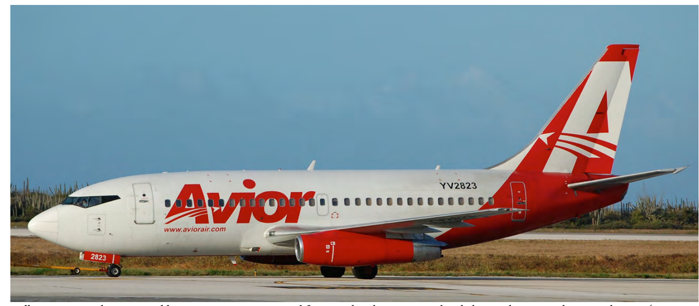
Still going strong this 35 year old Boeing 737. YV2823 started flying with Delta in 1984 and ended up with Avior Airlines in July 2012. (Curaçao -Hato, 19 February 2019, Geurt van den Berg)