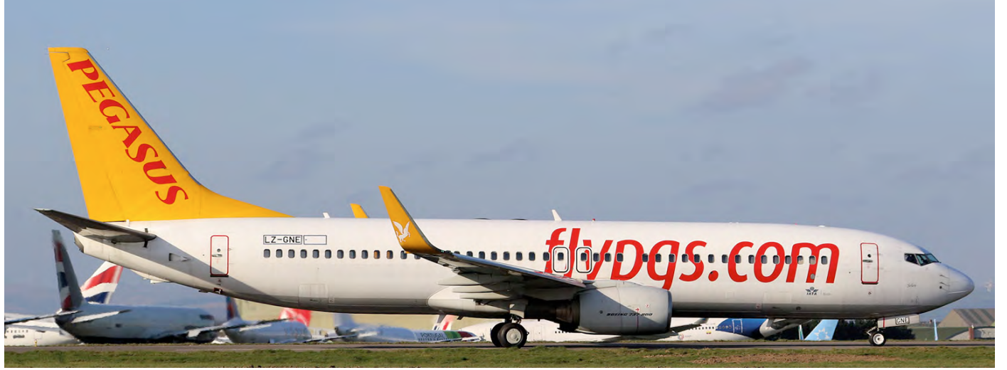
This Boeing 737 entered service with Pegasus Airlines in July 2009 as TC-AAR. It was withdrawn from use in September 2018. In January 2019 the airliner was flown to Woensdrecht. While at that airport its registration was changed to LZ-GNE and subsequently the aircraft was flown to St. Athan for part out work. On the day it arrived from Woensdrecht at its fina