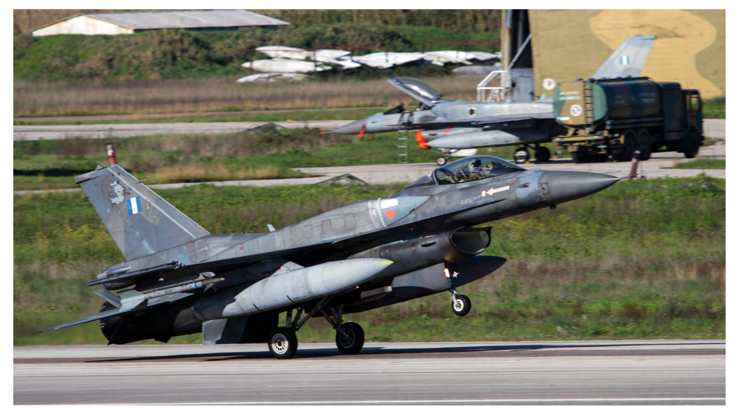
530 is a F-16C block 52+ with Conformal Fuel Tanks (CFT). On the tail is a drawing of a ghost, indicating "Fantasma" 337 Mira is the owner. (24 March 2018)

The 336 Mira was established on 25 February 1943 in Cairo (Egypt) and it was also equipped with Hurricane aircraft. The squadron followed the exact steps of its "sister" squadron and in 1953, it also received the F-84G and five years later it transitioned to the newer F-84F. In 1965, the squadron also received the F-104G which was flying until 31 March 1993. The squadron received also the A-7 Corsair II and was the last one to withdraw them. Since March 2008, when the deactivation of its sister squadron took place, the 336 Mira received all the remaining Corsairs, becoming the last Corsair Squadron in the world. The famous retiring ceremony took place on 17 October 2014, marking the end of another era for the EPA.