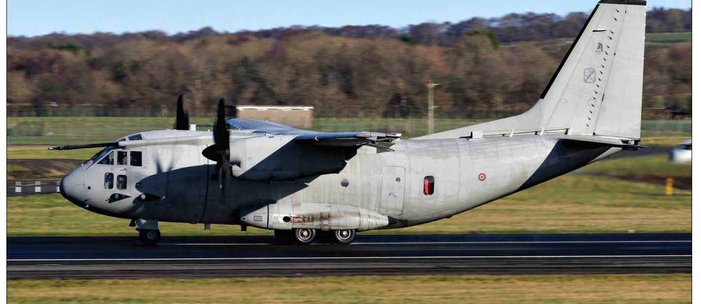
Italian Air Force C-27J MM62218/46-82 visiting Glasgow Prestwick on the 2 February 2019 as IAM4670 on a fuelstop while heading for Keflavik, captured by Douglas Connery.