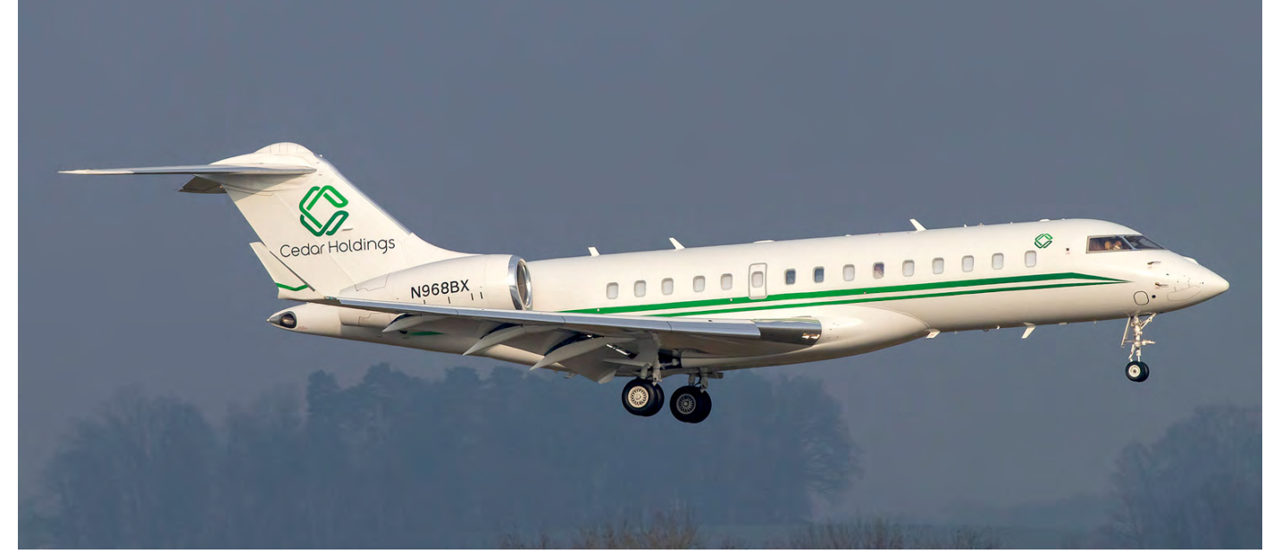
In January 2016 this Global 6000 was registered N968BX. Although it is linked to a company called Grand Oriental Global Investments the titles and logo on the aircraft tell a whole other story. (Zurich, 21 January 2019,)