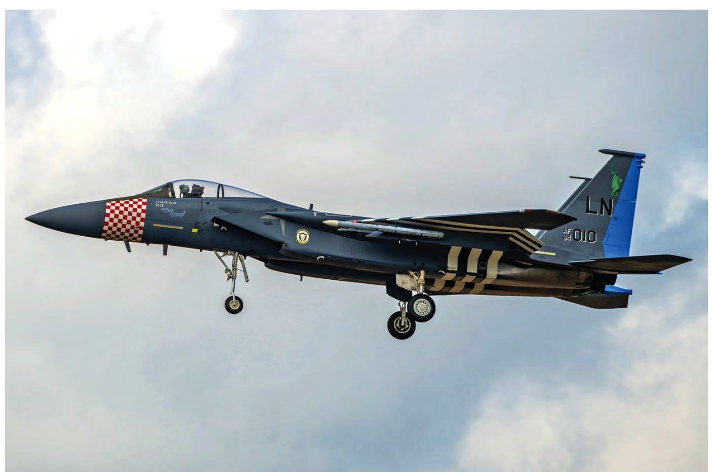
Also F-15C 84-0010/LN of 493rd FS/48th FW is painted in the commemorative colours for the upcoming D-Day celebration. One more Lakenheath F-15 is expected to be painted in the special colours. (Lakenheath, 21 March 2019, Martin Fox)

Slowely but surely in Europe and other places around the world things are gearing up for the commemoration of 75 years D-Day invasion of Normandy next June. The red paint scheme on F-15E 97-0219/LN flown the 492nd FS/48th FW resembles the paint scheme worn during the invasion by 48th Fighter-Bomber Group on their P-47 Thunderbolts. Under the cockpit, also the Mad Hatters badge is painted, although the squadron received this nickname not until 1960. It took 640 man hours and 15 000 Dollar worth of paint to apply the special paint scheme (Lakenheath, 21 March 2019, Martin Fox)