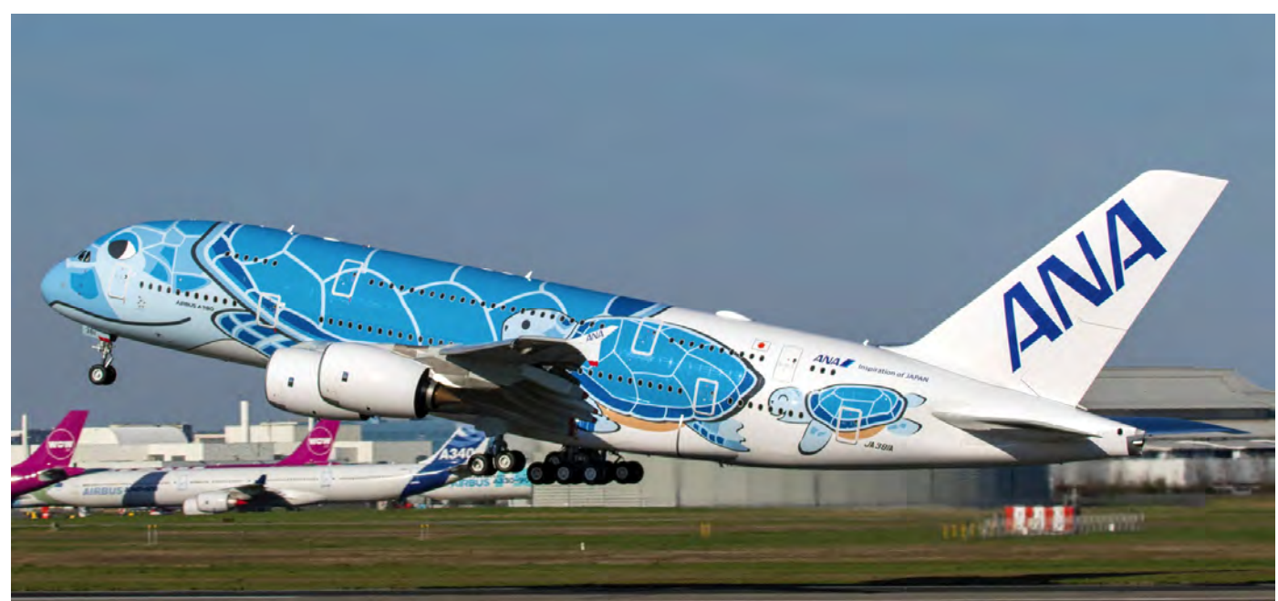
ANA – All Nippon Airways took delivery of its first of four Airbus A380s. The aircraft is painted in the Flying Honu colorscheme. JA381A was delivered on 20 March from Toulouse to Tokyo. (Toulouse, 20 March 2019, Robert Erenstein)