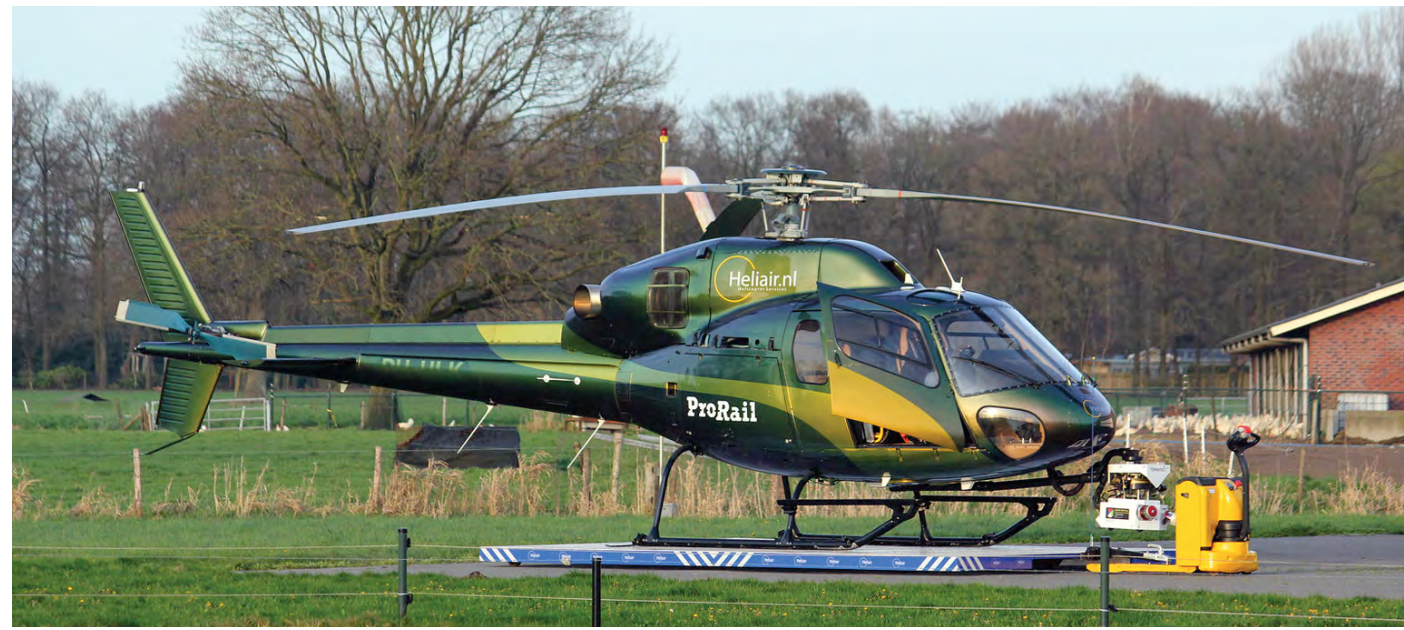
ProRail will regularly fly a helicopter above the tracks to take aerial photos and laser scans of the tracks. They make recordings to update the topographical map and make 3D views of stations. For this they use the AS355N PH-ULK from Heliair. (Harskamp, 23 March 2019,) Personal copy Distribution to a third party is not allowed