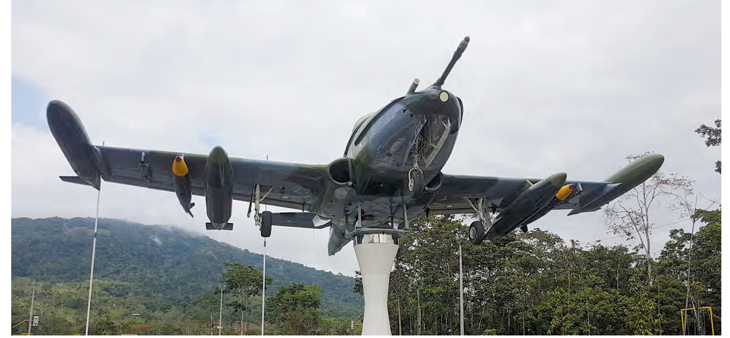
The fleet of Ecuadoran A-37Bs has been withdrawn for some years now, being replaced with the A-29B Super Tucano. This one, FAE-378, was preserved for posterity at Gualaquiza. (11 February 2019,)

The serial of this Il-76MD was presented on the aft fuselage instead of on the upper tail section.