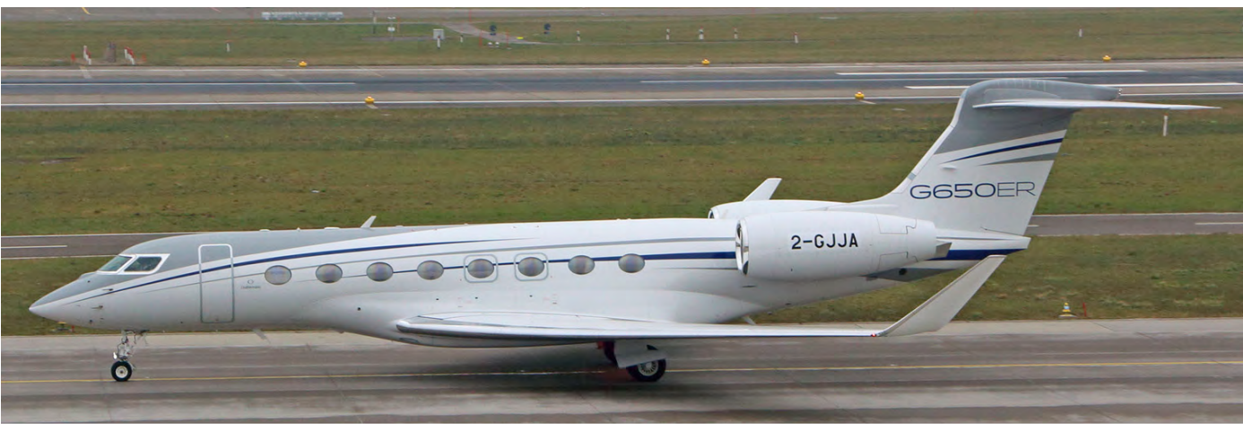
The former Gulfstream company demonstrator has been sold to GainJet Ireland in December 2018. The G650ER was registered 2-GJJA but has retained these colours. (Zurich, 22 January 2019,)

Personal copy Distribution to a third party is not allowed