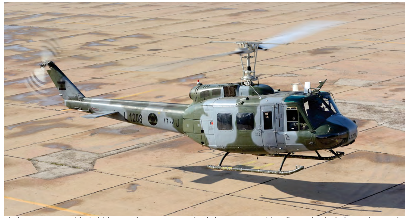
The latest incarnation of the faithful Huey is the Huey II. Equipped with the transmission of the Bell 212 and with a higher rated engine, this has rejuvenated the proven design and they are set to be around for a while yet. After being used in mix with the UH-1H, all Huey IIs are now nominally on 12sq strength; although one was with the Kleyate delegation too.

to do an area check of the route. As said, the preparation and execution is meticulous in every detail. We witness another crucial moment, literally at the moment the marshal clears 'Black 1' for taxi out, he is motioned to the cockpit by the formation leader. At this very moment, a medical emergency occurs and stand-by medevac UH-1H-II L1205 is hurriedly started up, a medical attendant comes running with his big medical bag slung over his shoulder, as he mounts the Huey