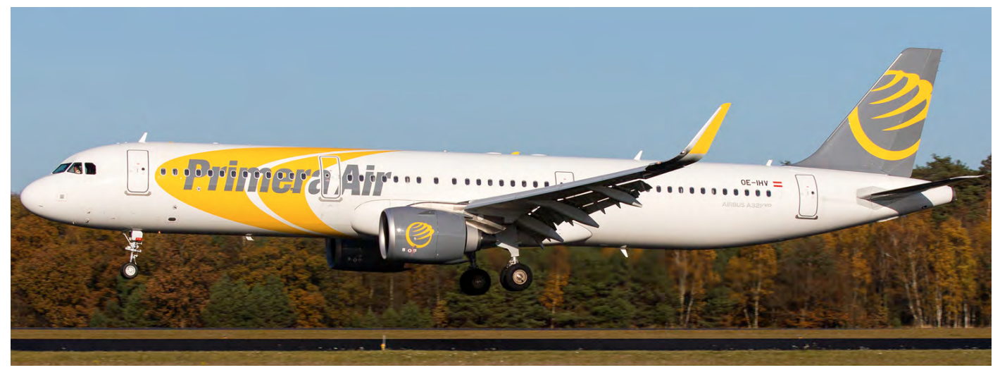
This Airbus A321 neo was delivered to Primera Air in April 2018 but had a short career with the airline when Primera Air went bankrupt. Former OY-PAA was reregistered to OE-IHV at Malta in October 2018 and is reportedly destined for TAP Air Portugal. (Woensdrecht, 13 November 2018,)