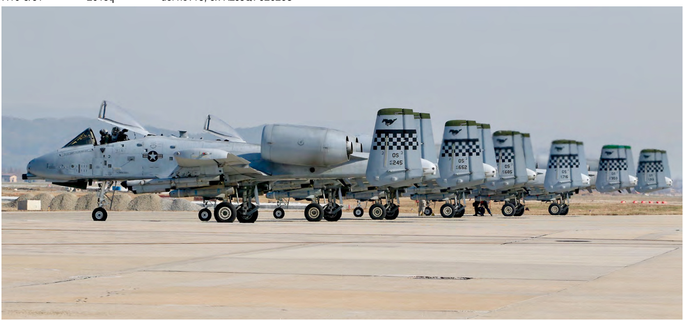
During a base visit to Osan AFB Robbert Snijders captured this line-up of six A-10C Thunderbolts. First one is 80-0245/OS, being part of the 25th FS/51th FW. In one next Scrambles a full report of the base visit will appear. (Osan, 20 November 2018)

334 12th Helic.sq c/n update 70-3298 nov18 Earlier we reported 3rd Helicopter Squadron as the tenant of the Sikorky's, the above squadron is a correction.