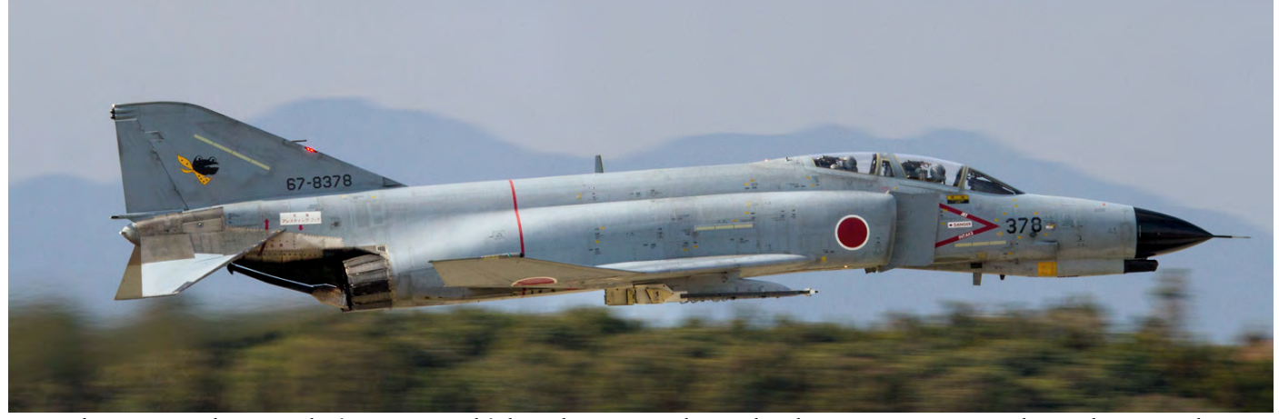
First in, last out! 301 Hikotai was the first operational fighter Phantom squadron within the JASDF, it was activated at Hyakuri in October 1973. It spent most of its time at Nyutabaru after having moved there in 1985 but returned to Hyakuri in 2016 where it will end its Phantom operations in FY2020. The frog badge, as seen here on 67-8378, has a Hyakuri connection as a specific frog species is only found in this area.

302 Hikotai will withdraw its remaining Phantoms in March 2019, 501 Hikotai will follow in 2020 and 301 Hikotai will draw the final curtain most probably the same year. Although 301 and 302 Hikotais are due to permanently move to Misawa following the transition to the F-35, it is unclear for 501 Hikotai if it will then transition to a new aircraft type.