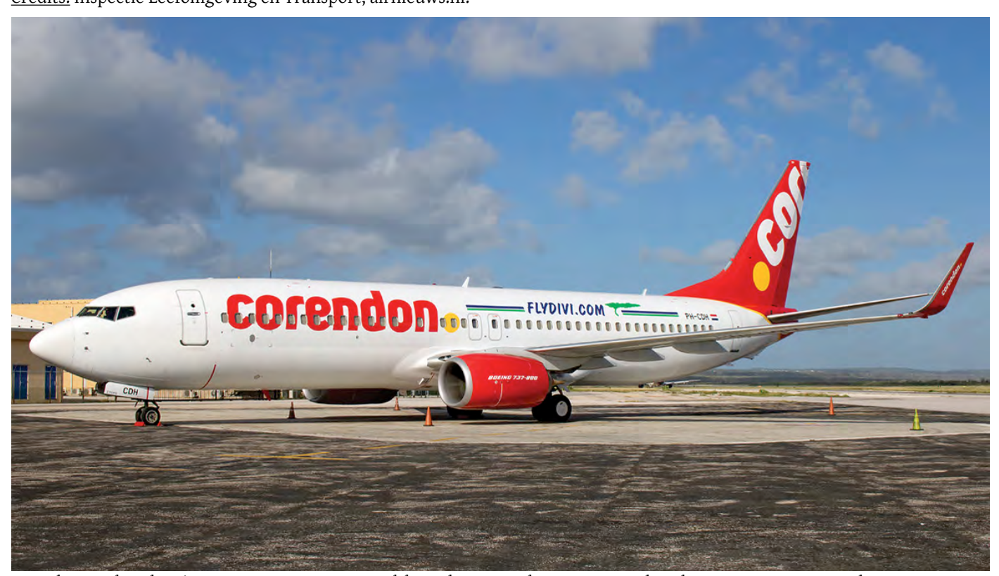
Corendon Dutch Airlines' Boeing 737-800 PH-CDH was delivered on winter lease to Curaçao based Divi Divi Air on 8 December. Divi Divi Air is a regional airline which operates scheduled services to Aruba, Bonaire and St. Maarten. Besides these scheduled services they also operate on demand charters, sightseeing, cargo and express mail flights with their fleet of Twin Otter, Islander and Cessna 402 aircraft. This wet-leased Corendon Dutch Airlines Boeing 737 is their first jet aircraft and with this aircraft they now offer flights from Curaçao to Brazil. The Boeing will return to the Netherlands when the lease expires in April 2019. (Curaçao-Hato, 9 December 2018, Roger Cannegieter)

Credits: Inspectie Leefomgeving en Transport, airnieuws.nl.