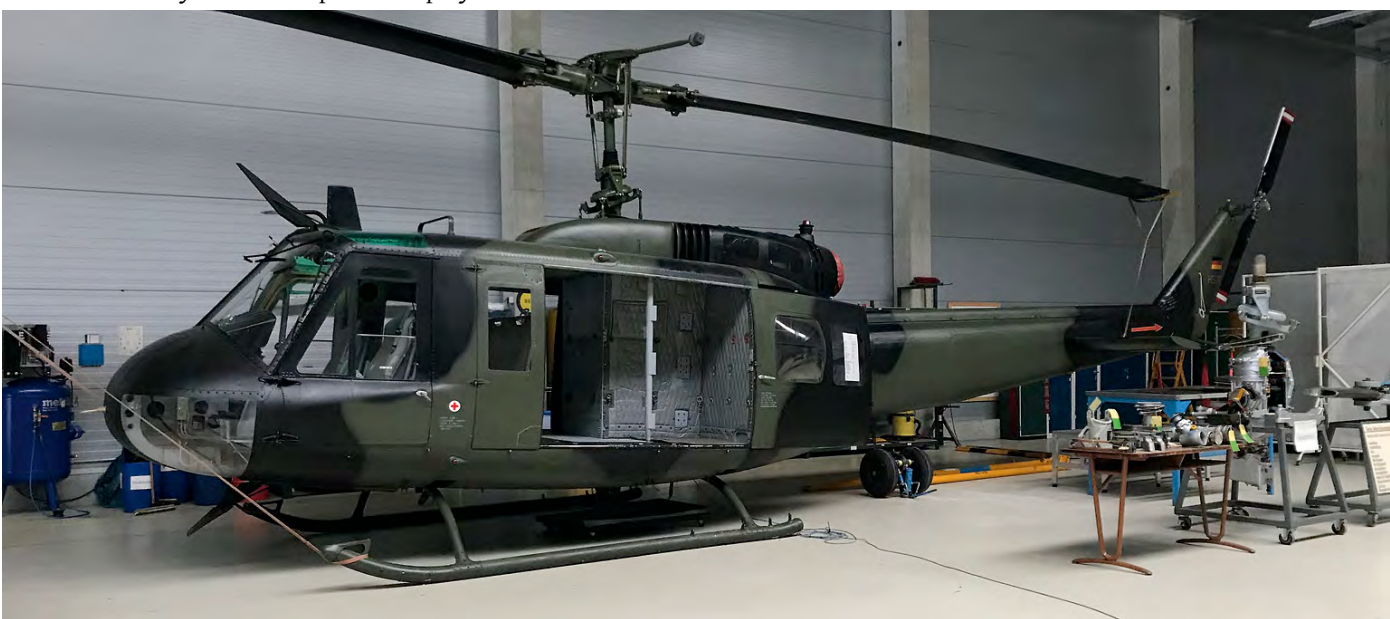
UH-1D 73+37 is one of the several instructional aiframes at the TAusbZLwSud (Technische Ausbildungszentrum der Luftwaffe Abteilung Süd) at Kaufbeuren (10 October 2018, Grant Robinson)

(MM6414)/2-52 G91R/1 preserved aug18 The former Pinerolo Gina is now pole mounted at the via Asti (N45.06570, E7.55517). The aircraft is fresly painted and the tail in now marked MM6398 with construction number