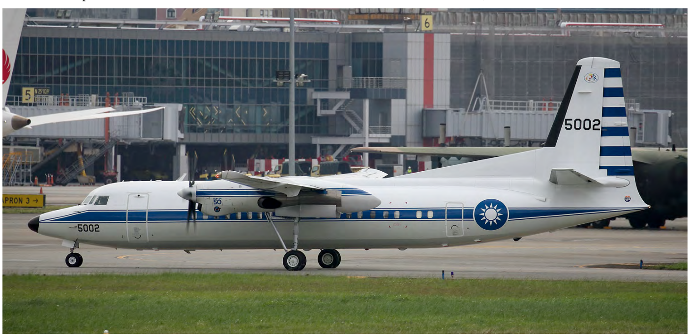
The Republic of China, or Taiwanese, Air Force is a loyal user of the F50 still. This pristine example, 5002, was seen taxying at Taipei/Songshan. (23 November 2018, Ian French)