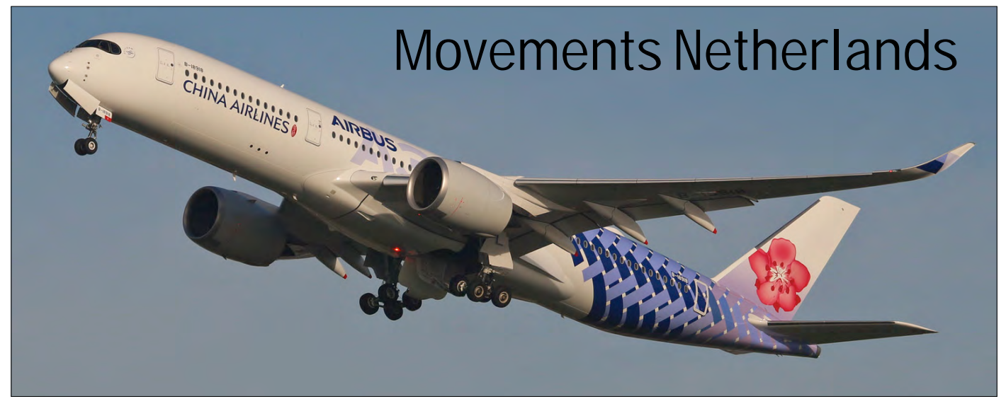
China Airlines' final A350-900 was rolled out in special 'Carbon Fibre-Airbus' colours in July 2018. The livery is a combination of China Airlines and Airbus carbon fiber colours. B-18918 arrived in Taiwan on 23 October 2018 on delivery to the airline. (Amsterdam - Schiphol, 14 November 2018)