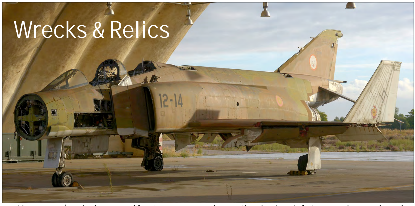
Spanish F-4C C.12-18/12-14 has been removed from its storage compound at Torrejón and made ready for its move to the Las Bardenas where it will serve the rest of its life as a target (Torrejón, 12 October 2018)