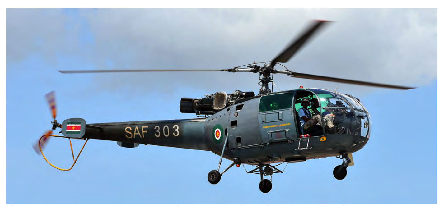
The Surinam Air Force operates just three HAL Chetaks, an Indian license-built Alouette 3. Ronald Huizer was very lucky to capture SAF303 near its homebase Zorg en Hoop on 23 November 2018.