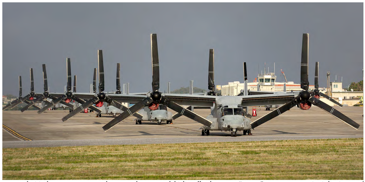
Ian French visited Futenma on 24 November 2018 and encountered this line of local VMM-265 "Dragon" MV-22B Ospreys. First in line is 198216/EP10 showing its size in parked position.

15 ye 203 UABr f/n dec18 14 ye 203 UABr f/n dec18