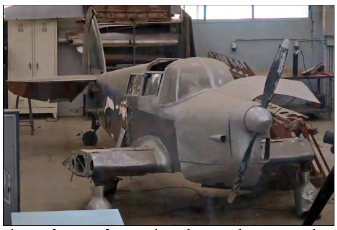
The very first aircraft operated was the Percival Proctor. Seen here is L101 in use as an instructional airframe at the Dekwaneh Campus of the University of Arts, Sciences & Technology.

Obviously, the French rule from 1920 to 1943 meant that the Lebanese Air Force was built with French help and Rayak was chosen as the site for the first Air Base. Starting off with two Percival Prentice T.Mk.1 and a Proctor V, this was quite a