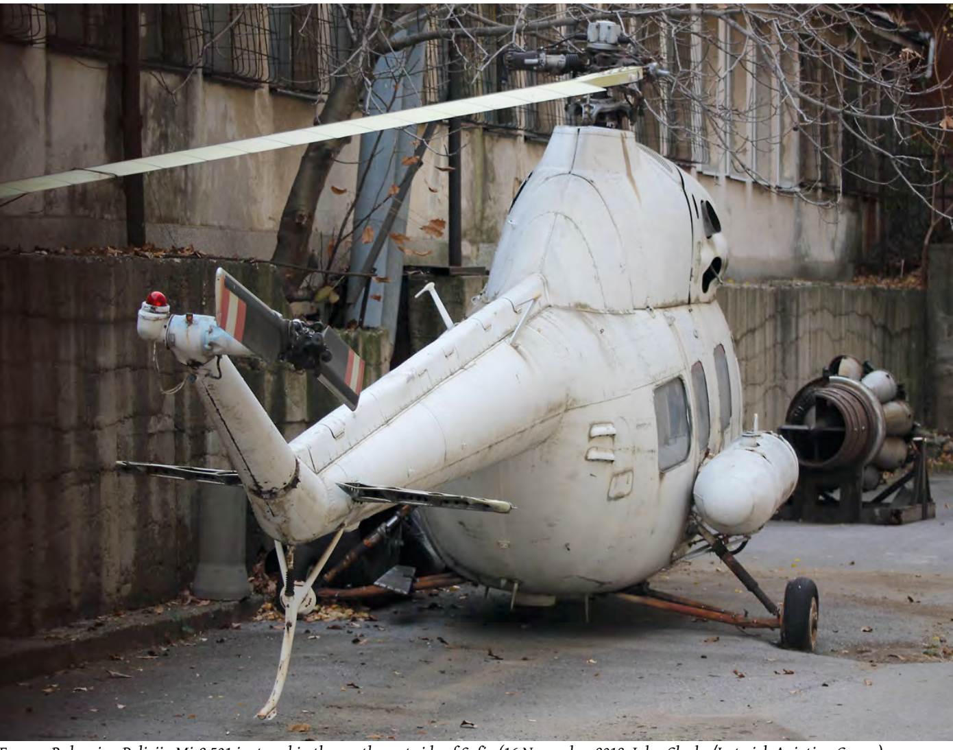
Former Bulgarian Policija Mi-2 501 is stored in the south west side of Sofia (16 November 2018)

154 (MM6398 is at Codroipo and construction number 154 at Montagnana). When still at Pinerolo the tail was marked MM6290. The mid fuselage is from MM6414