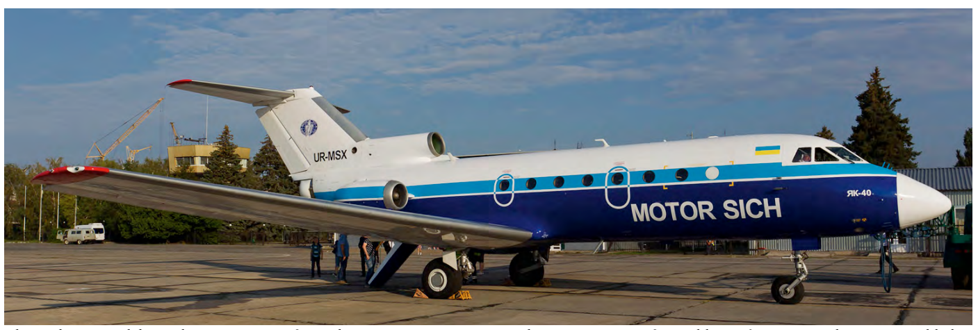
This Yak-40 was delivered in 1975 to Aeroflot Lithuania as CCCP-87541. It is however a recent fleet addition for Motor Sich as it was added to their fleet in February 2017 as UR-MSX. It was first noted at Minsk 1 Airport in September 2017. (Zaporozhye, 6 August 2018, Andre Alders)