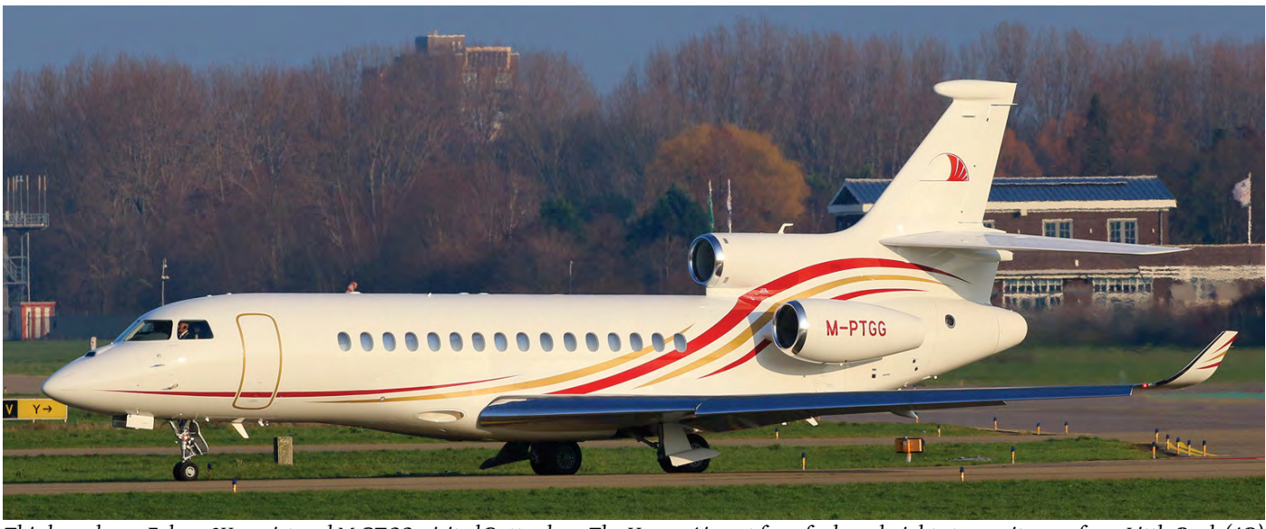
This brand new Falcon 8X, registered M-PTGG, visited Rotterdam-The Hague Airport for a fuel- and night stop on its way from Little Rock (AR)