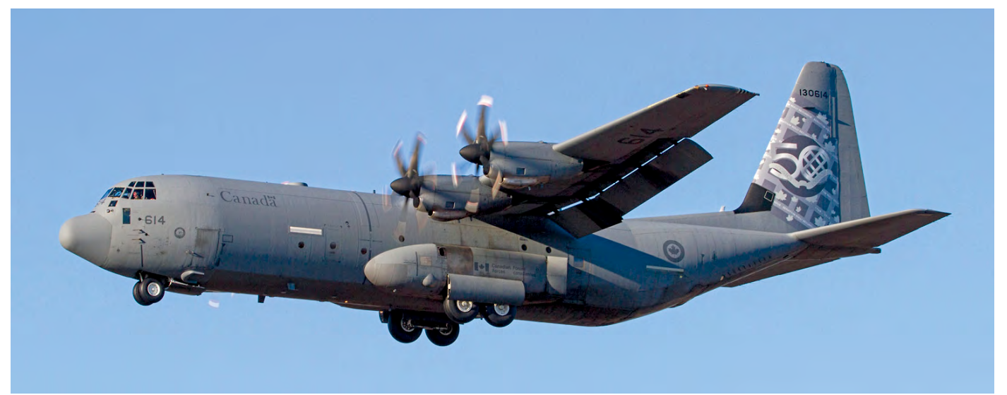
The Royal Canadian Air Force's 436 squadron has painted the tail of one of its CC-130J with commemorative markings. The livery on CC-130J 130614 salutes the 50th anniversary of the RCAF Logistics Branch. (Trenton, 20 November 2018, Andy Cline) Personal copy Distribution to a third party is not allowed 87