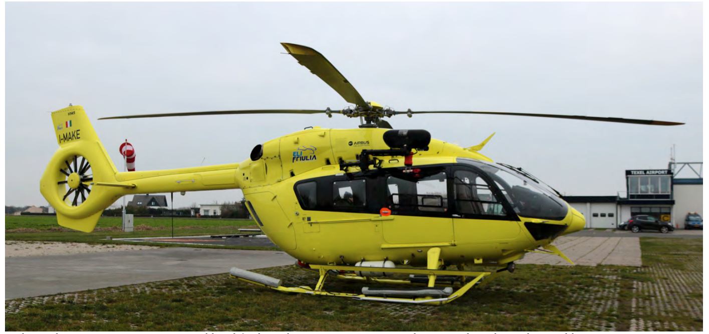
Airbus Helicopters I-MAKE was acquired by Elifriulia Helicopter Service in 2016. The H145 is leased to Wiking Helikopter Service in Germany since early 2018. (Texel, 27 November 2018, Mike de Bruijn)

PH-TFM 02, 03, 06, 08, 13, 15, 30 PH-TFK 09, 17, 23, 24, 27