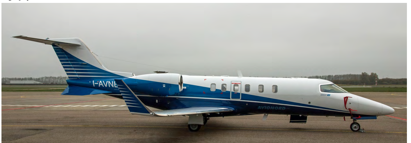
The latest addition for Avionord was initially delivered to Sirio in 2006 as I-GURU. The Learjet 40 was acquired by Avionord in October 2018 as I-AVNE. It was caught on camera after it received a repaint by SATYS. (Lelystad, 24 November 2018,)