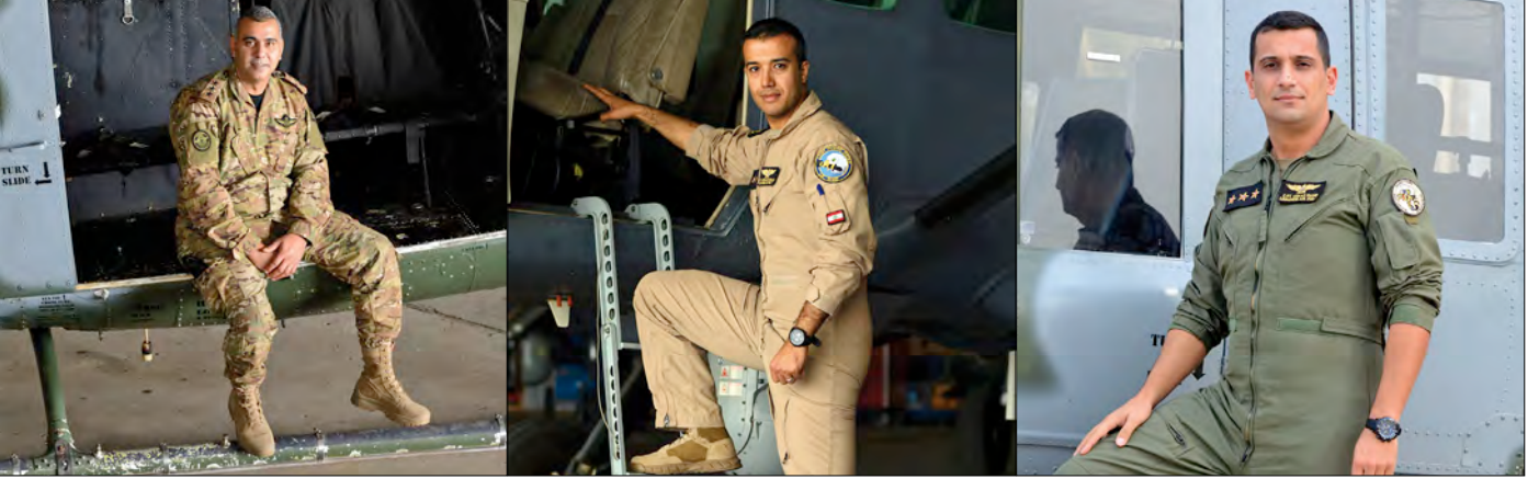
From left to right: the Commanding Officer of Tech Wing, and captains Tabaja CO 4sq, and Hamd CO 12sq.

Two main events are on the calendar of the country, and indeed the Air Force, each year. These are Army Day on 1 August and Independence Day on 22 November. Both see celebrations of unity with participation of the Air Force. More events are sometimes held, this year for example, there was a an air show at Rayak in September. One of the highlights for