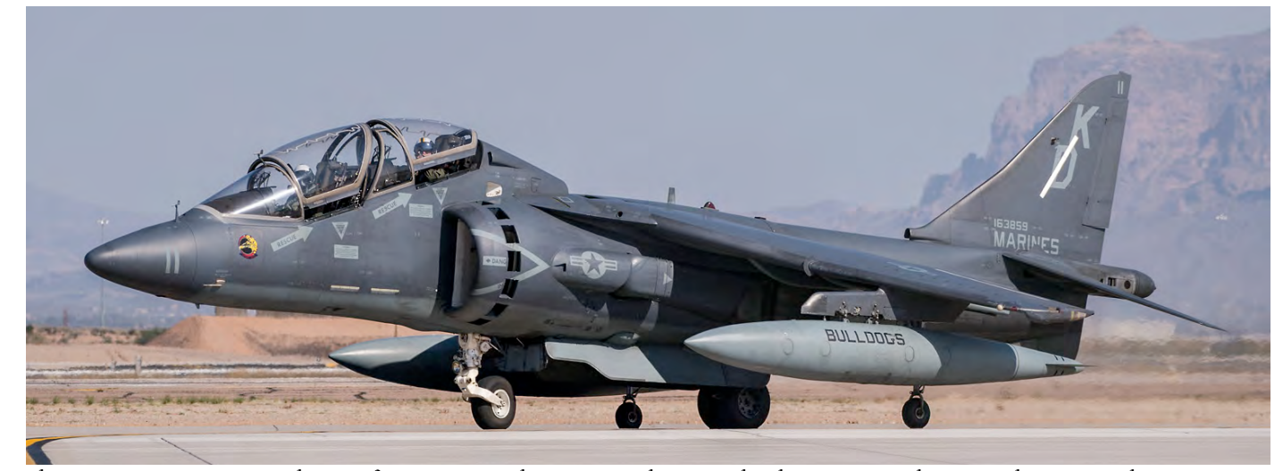
Phoenix Mesa-Gateway is worth a visit for its various military visitors during weekends. On 11 November Bert Stil encountered TAV-8B 163859 from VMAT-203 on arrival at Mesa. Based at MCAS Cherry Point this units operates a total of sixteen dual Harriers. Personal copy Distribution to a third party is not allowed