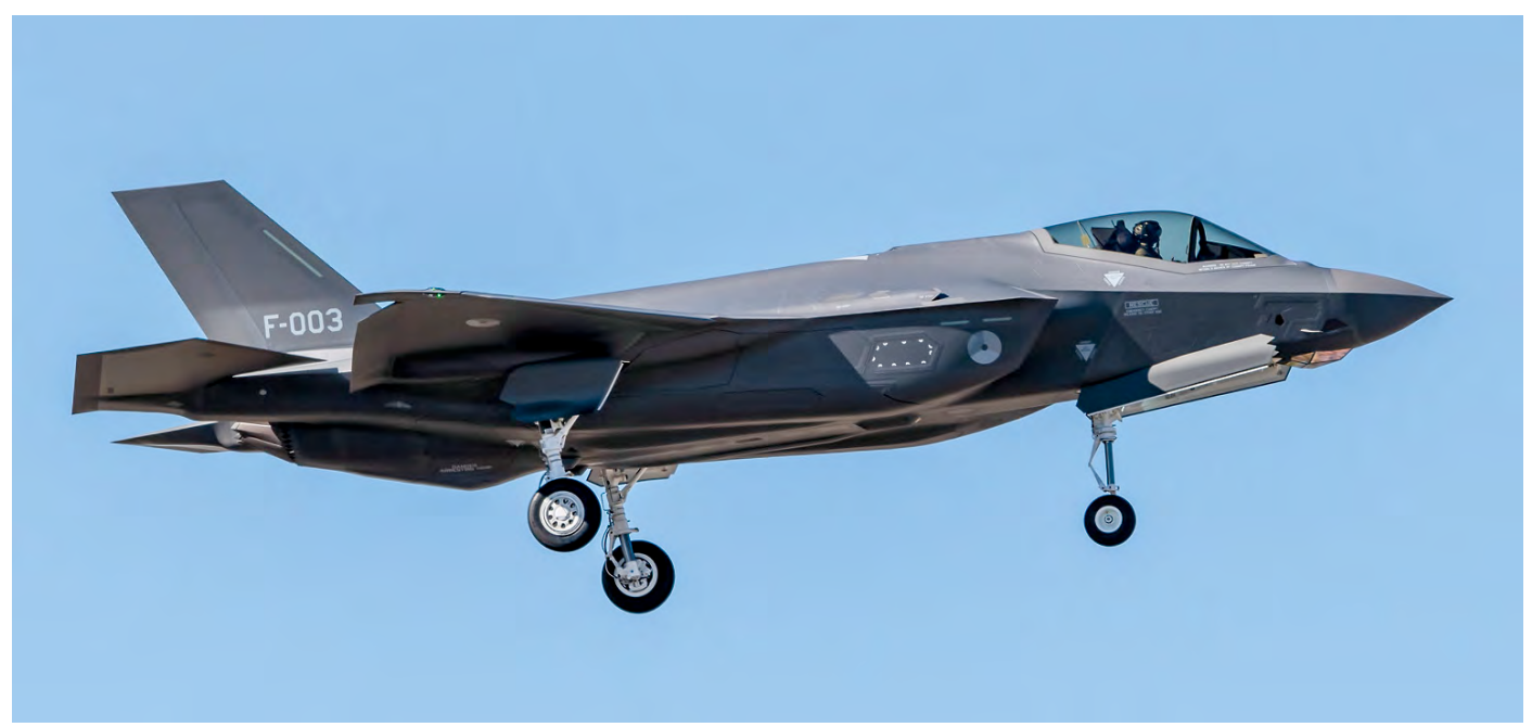
The third Netherlands Air Force F-35A made its first flight on 15 December 2018. F-003 (AN-03) is among the first six F-35A that will be build by Lockheed and also remain in the States, based at Luke AFB. Jacob Remmel was at NAS JRB Fort Worth to capture the arrival after a successfull first flight.

bitter, she said. To avoid problems in the future, new crews will be added to the existing fleet and one or two aircraft will be bought. Merkels aircraft had an aborted flight due to communication problems with the A340. Switching to the other A340 was impossible as the crew already reached their maximum flight hours and no crew was available as a back-up. To date, it is not known which type of aircraft will be added to the fleet even it will be a new or second-hand aircraft.