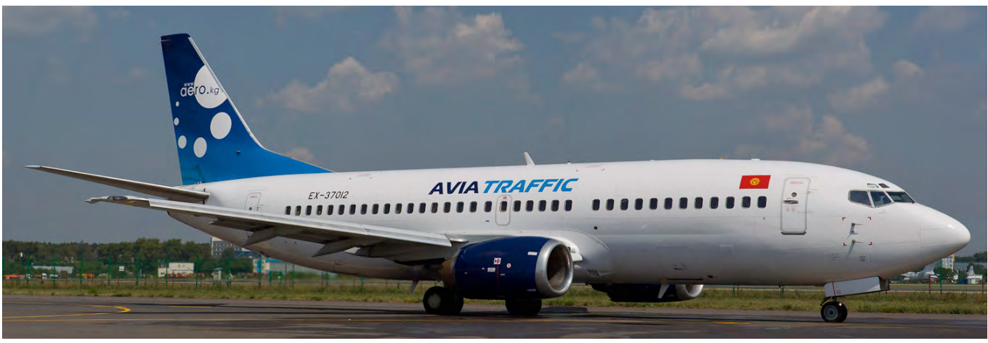
Previously in service with Shenzhen Airlines this Boeing 737 was acquired by Avia Traffic Company in September 2013 and registered EX-37012. The airline is on the List of carriers banned in the European Union. (Moscow-Zhukovsky, 4 August 2018,)

tail has been transferred to Minsk, probably for training purposes. Only a few new registrations were spotted at Moscow-Vnukovo airport due to my previous visit two months earlier when I flew Kosmos Airlines Tu-134A-3 RA-65995.