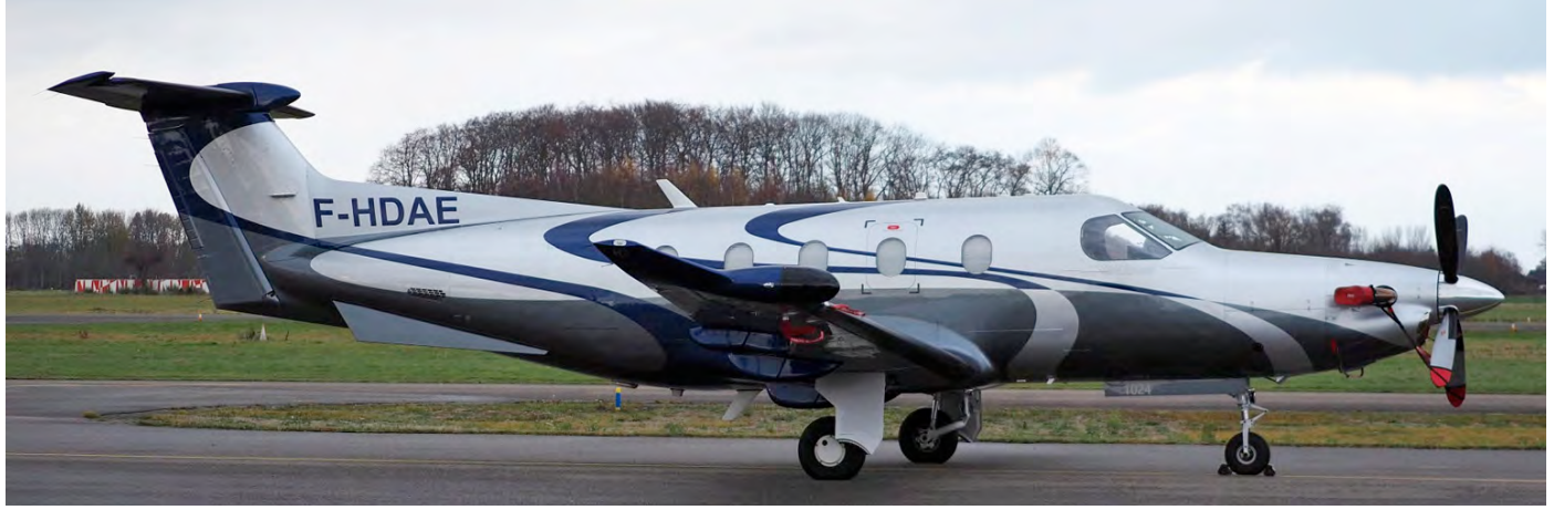
This former Fly \ 7 \ Executive \ Pilatus \ PC-12 \ was \ entered \ into \ the \ French \ register \ at \ the \ end \ of \ November \ 2018. \ F-HDAE \ is \ leased \ to \ a \ company \ called SGBO. Unfortuately there is no information regarding this company on the internet but on the same address West Central Training Logistics is located. It is not known if both companies are related. (Teuge, 30 November 2018,)