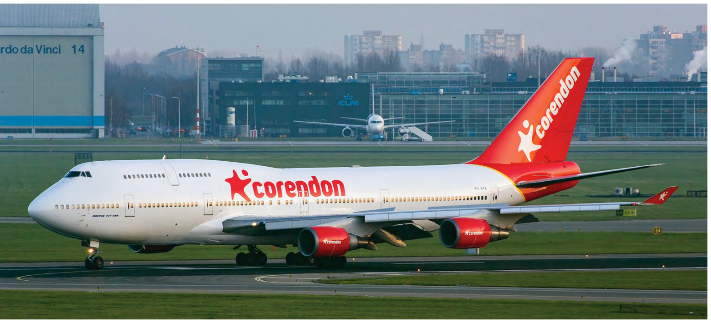
On 25 November (arriving 26 November), KLM Boeing 747-400 PH-BFB made its last flight for KLM from Los Angeles (CA) to Amsterdam-Schiphol, as KL602. One week later, on 2 December, the Queen of the Skies was ferried to Rome-Fiumicino as KL1603, were it was painted in this Corendon Airlines colour scheme. However, the aircraft will not be put in service by Corendon but will be placed on display at the Corendon Village Hotel in Badhoevedorp (near Schiphol Airport), in the beginning of 2019. The aircraft is seen here taxiing at Amsterdam on 14 December after landing from its return flight from Rome, as KL9872, which was its final and only flight in Corendon colours. (Maarten Visser Sr)