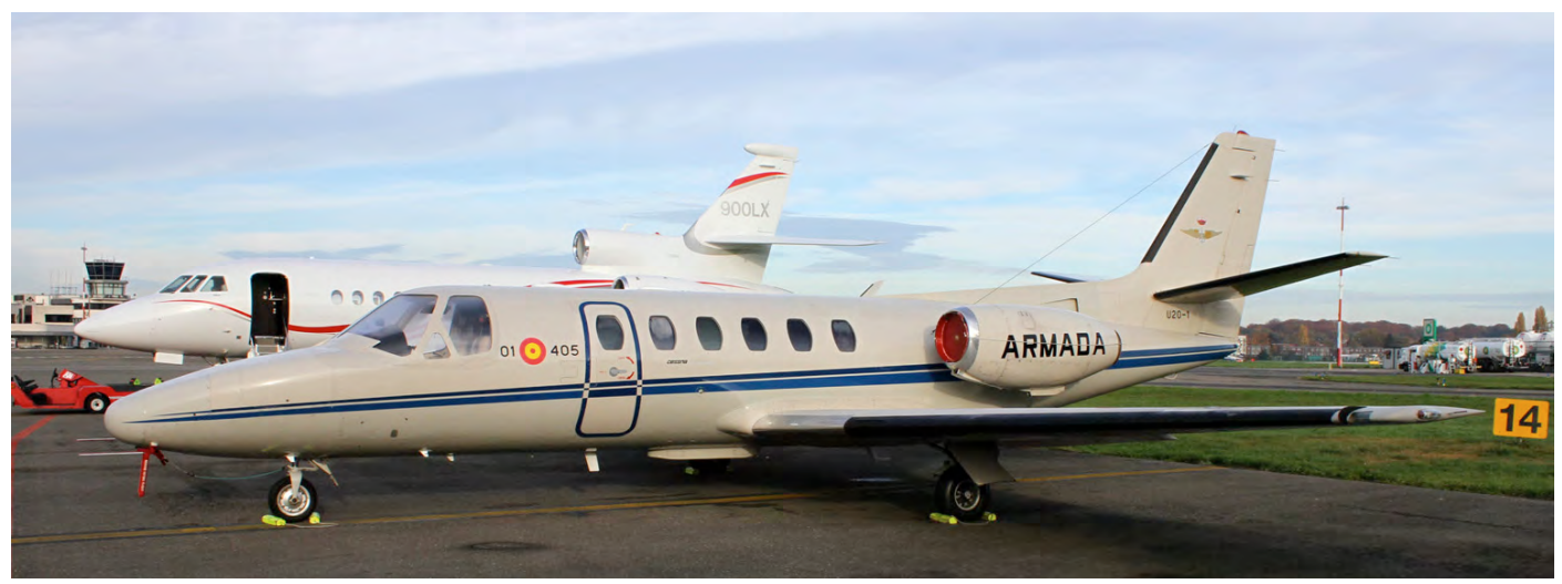
Although destined for a civilian airline in Norway this Cessna 550 was delivered to the Spanish Navy in April 1983. U.20-1 with code 01-405 is active with Eslla 004/4 Escuadrilla. (Antwerp, 9 November 2018)