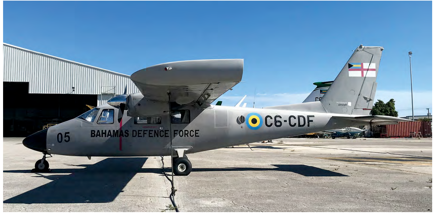
Not new, but rarely seen is the sole Vulcanair P68 Observer C6-CDF of the Bahamas Defence Force Air Wing. Daan van Laatzen was very lucky to catch this it at its home base Nassau. (23 November 2018).

The RSAF F-15SAs are to be operated, besides 55 squadron and 6 squadron (both formally F-15S units) at Khamis