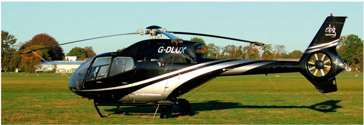
EBG (Helicopters) is a helicopter charter and training company based at Redhill Aerodrome. This EC120B entered the British register in 1999 as G-CBRI. It became G-IGPW after two months with the same operator before it was sold. EBG (Helicopters) was owner number five which operated the helicopter as G-IGPW for seven months. It took up its current registration G-DLUX in March 2016 after a repaint. (Hilversum, 28 October 2018,)