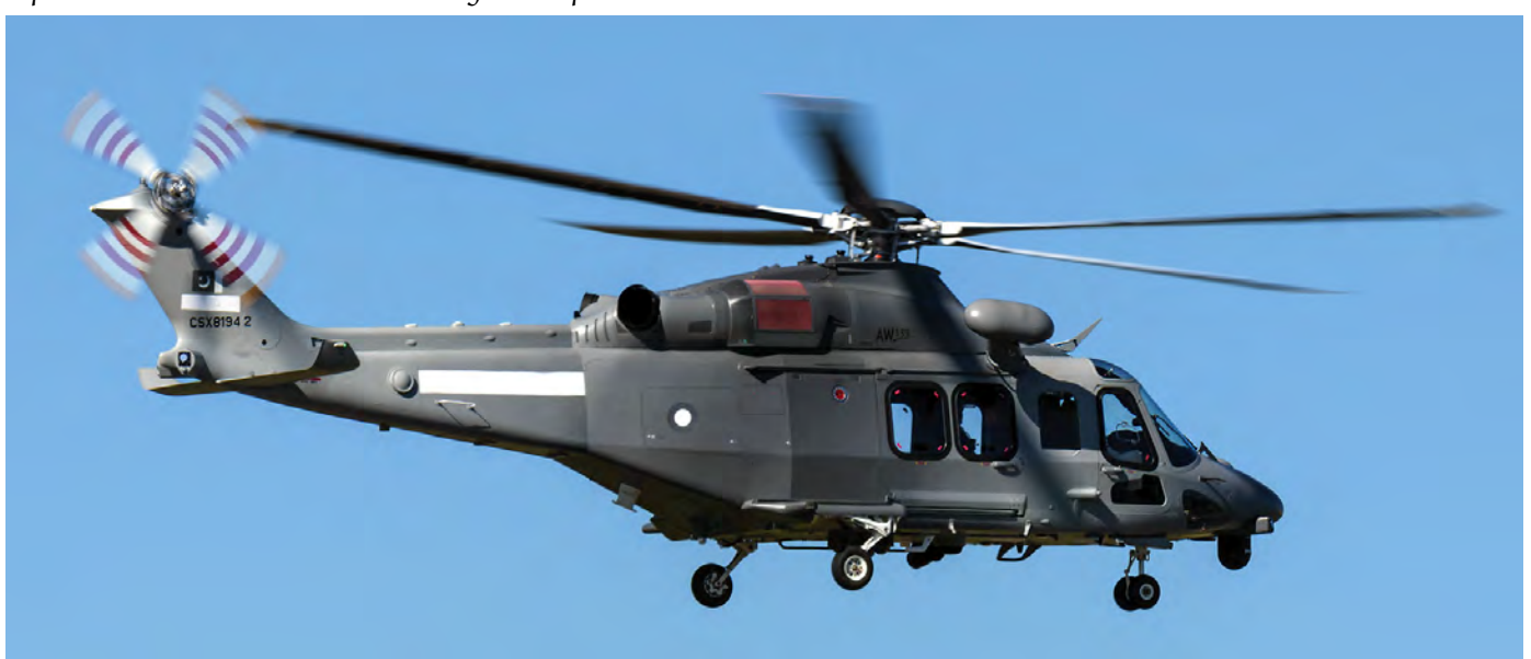
Second item on this page featuring exotic helicopters, is the 12th AW139 destined for the Pakistan Air Force. It was photographed at Venegono on 28 September 2018, still with test registration CSX81942.