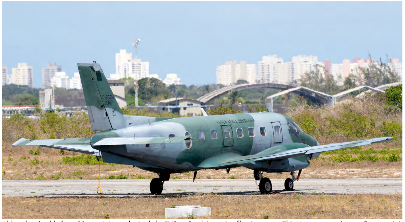
Although a sizeable fleet of Cessna 208 was obtained, the EMB110 Bandeirante is still going strong. This 2347 even constitutes a first note, it is believed to be a former SC-95B SAR aircraft, 6546, that had been stored for some time. (Natal, November 2018, Jurgen van Toor)

seem to use both. Officially, the AH-6i is the export version of the AH-6S, however. In October 2010 Saudi Arabia requested 36 Boeing Rotor Craft Systems AH-6i aircraft with related equipment and weapons from the United States through a Foreign Military Sale. The fiscal year (FY) serial of the above helicopters should be 16-01001 onwards.