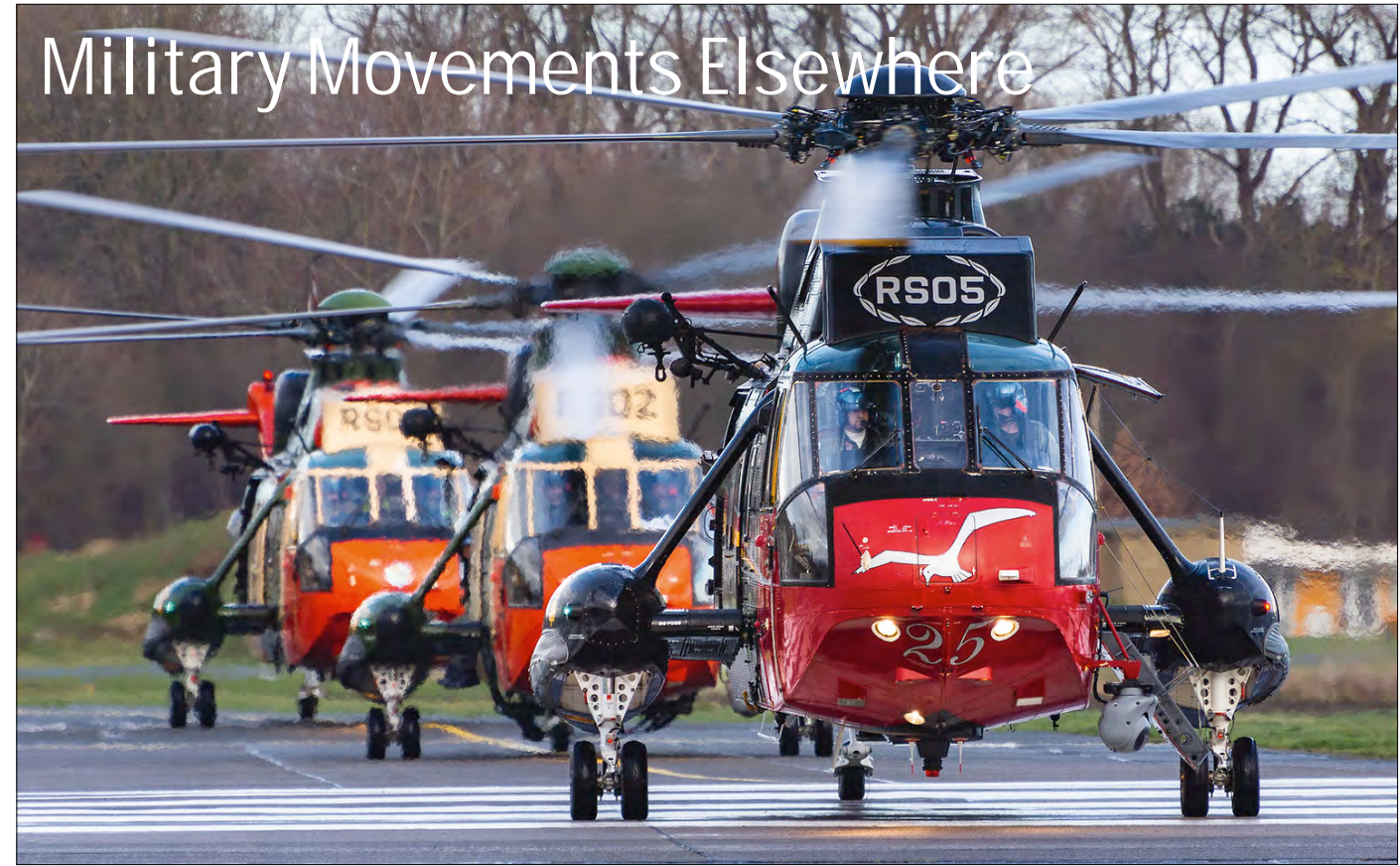
On 19 December 2018 the 40sq performed their final navigation flight with the Sea King. RS02, RS04 and RS05 flew across East and West-Flanders. Wout Goossens was at Koksijde to see the formation leave with special coloured RS05 leading the formation. All three will be stored/withdrawn afterwards and only remain stand-by for SAR duties if the NH90-NFH is not available.