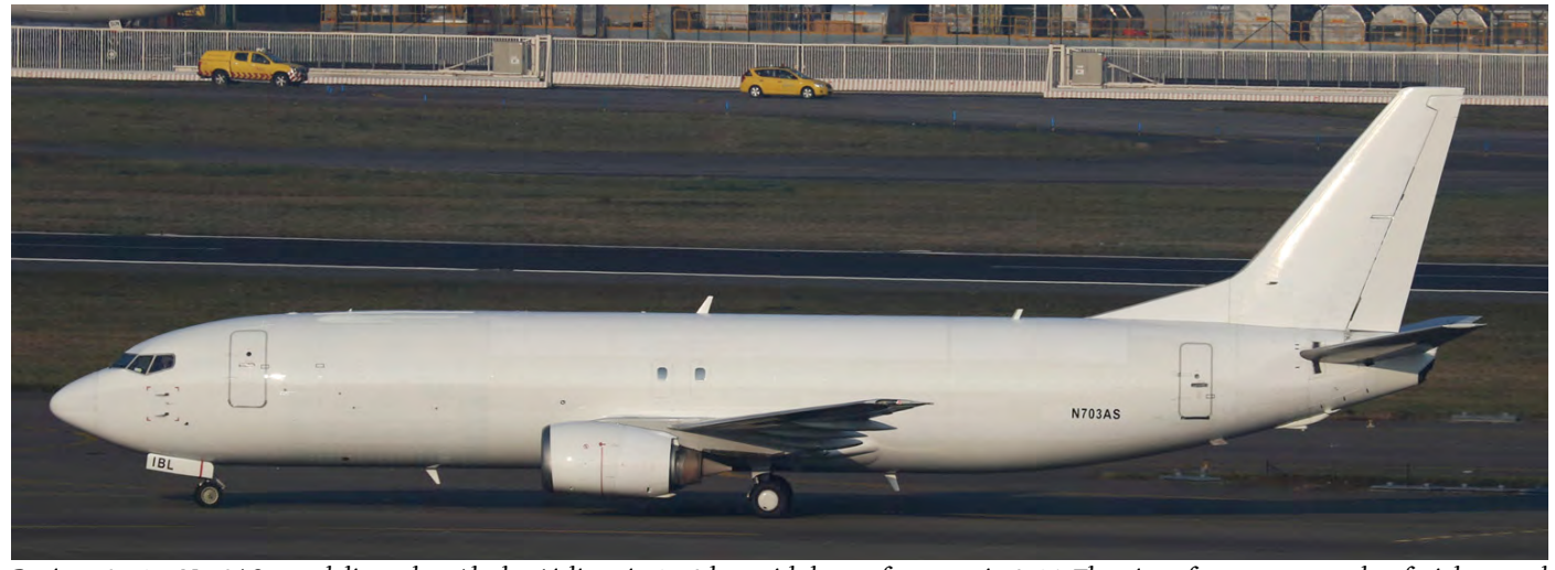
Boeing 737-400 N703AS was delivered to Alaska Airlines in 1998 but withdrawn from use in 2016. The aircraft was converted to freighter and photographed on arrival while being delivered to ASL Airlines Belgium. By the time you read this the Boeing should be active as OE-IBL. (Brussels, 22 November 2018,)