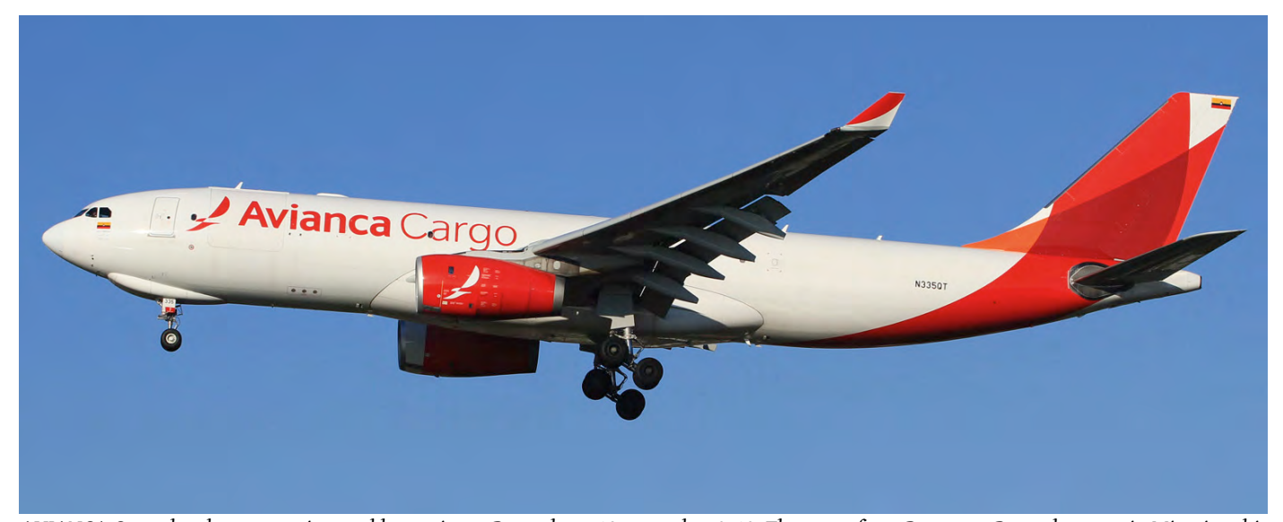
AVIANCA Cargo has begun a twice weekly service to Brussels on 18 november 2018. The route from Bogota to Brussels runs via Miami and is the first AVIANCA full cargo route to Europe. Airbus N335QT was delivered to the carrier in January 2015. (Brussels, 23 November 2018,)