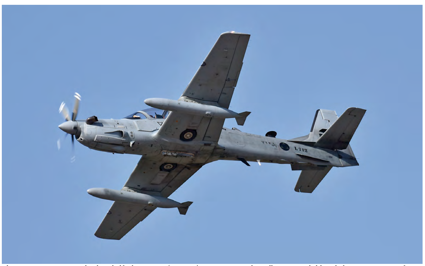
The most recent acquisition has been half a dozen A-29B (EMB314E) Super Tucanos. These all participated although they are very new airframes underpinning how no effort was spared to get the maximum number of airframes serviceable for the parade.

cabin who visually checks the location of the formations in the waiting area and during the parade."