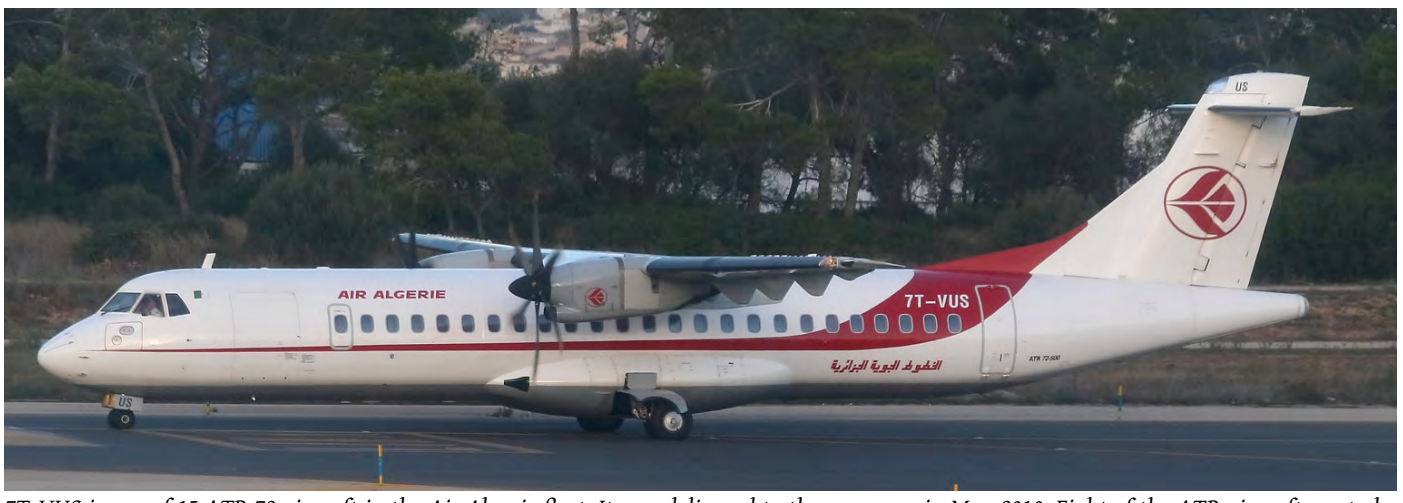
7T-VUS is one of 15 ATR 72 aircraft in the Air Algerie fleet. It was delivered to the company in May 2010. Eight of the ATR aircraft are to be withdrawn from service by 2025 according to the airline. (Palma de Mallorca, 11 October 2018, Simon Butler)