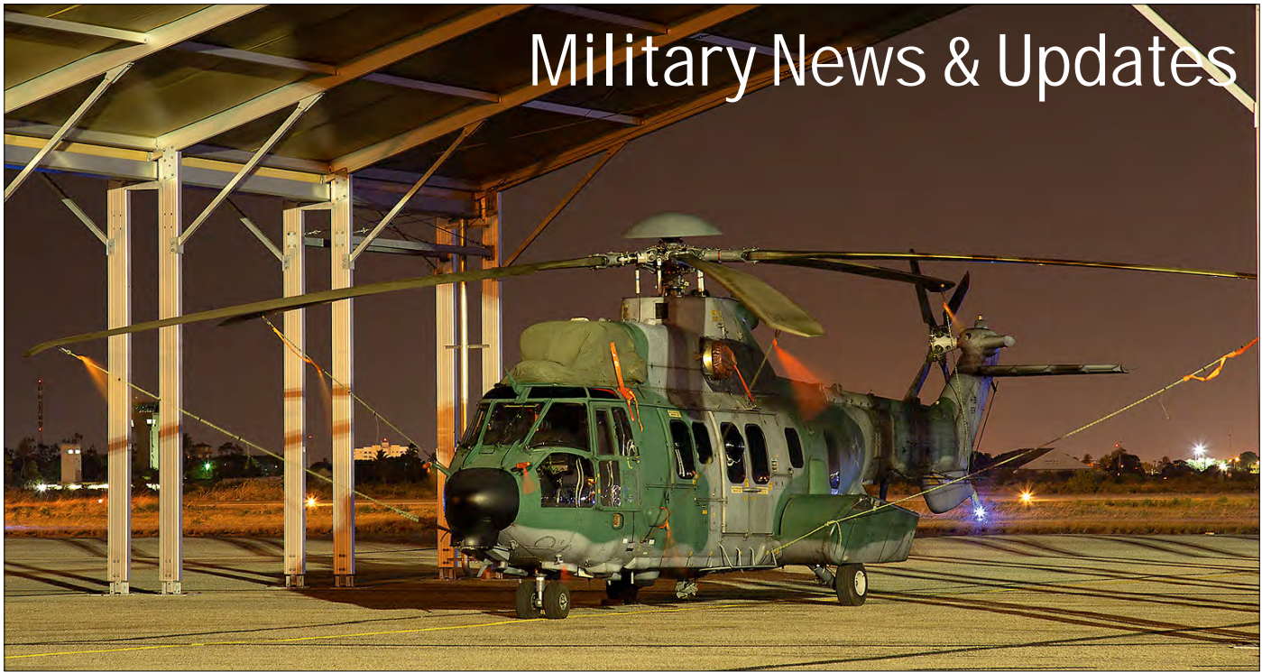
After some delays, they were still called EC725AP back then, the various branches of the Brazilian armed forces have received around 30 of the 50-strong H225M Super Cougar order. Seen here is one of the eleven Air Force examples, 8514, that was recently checked in its construction number 2877. They are used by 1°/8°GAv at Belém and 3°/8°GAv at Santa Cruz. (Natal, November 2018)

Because of our standardization we sometimes use type, unit and serial presentations that may strongly differ from those used by the manufacturer or user. It is therefore possible that the information sent by you can deviate from the information we publish.