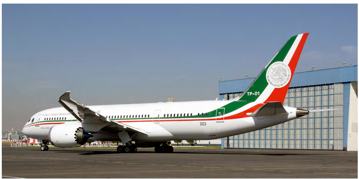
Lots has been written and said about the early retirement of the Mexican Presidential Boeing 787. On 3 December 2018, the Dreamliner left Mexico City for storage at Victorville (CA) to be sold eventually. For this last flight, its registration XC-MEC had even been replaced by a regular Mexican Air Force serial 3523. (Mexico City, 3 December 2018,).

On both 19 and 22 December a pair of new Su-34s was delivered from the Novosibirsk Aviation Plant to the 2 GvBAP at Chelyabinsk-Shagol. The four new Su-34s should be the last for the planned 2018 delivery, making a total of 84 delivered from the order for 92 from February 2012.