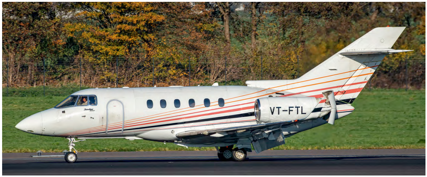
This Hawker 850XP was delivered to Futura Travels in November 2008 registered as N3188X. From March 2011 it has been registered VT-FTL and as such it was caught on camera while on its way back to the USA. The bizjet has been added onto the FAA website as N850TK in the last week of November 2018. (Rotterdam - The Haque, 15 November 2018,)