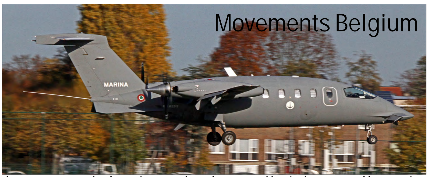
This Marina P180AM is one of two foreign military visitors this month. MM62212 was delivered to the Sezione Aerea of the Marina Militare Italiana based at Pratica di Mare (RM) in 2004 with code 9-01. (Antwerp, 8 November 2018,)