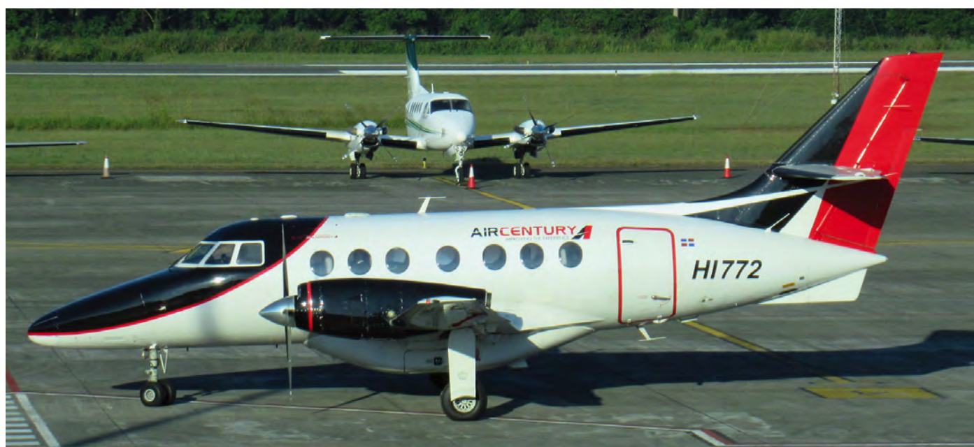
At the moment the fleet of Air Century exists of four Jetstreams, two Saab 340s and two CRJs. BAe3101 HI772 was delivered in 2002 as HI-772CT. (La Isabela, 30 November 2018, Johnny Rod)