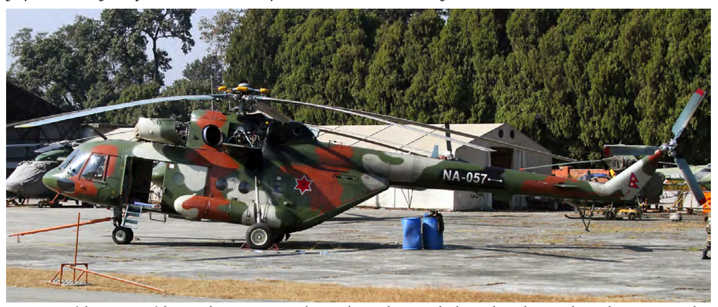
A very tasteful Mi-17V-5 of the Nepal Army Air Wing (NA-057) was photographed at its homebase Kathmandu on 29 November 2018.