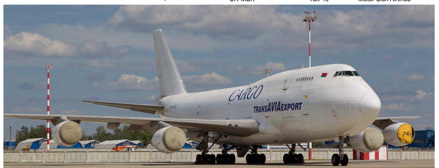
Transaviaexport Airlines took delivery of this former Georgian Star International Boeing 747 in May 2016. The aircraft was registered as EW-465TQ. The 'Cargo' titles are from the time is was operated for Saudia by Georgian Star International. (Minsk, 1 August 2018,)