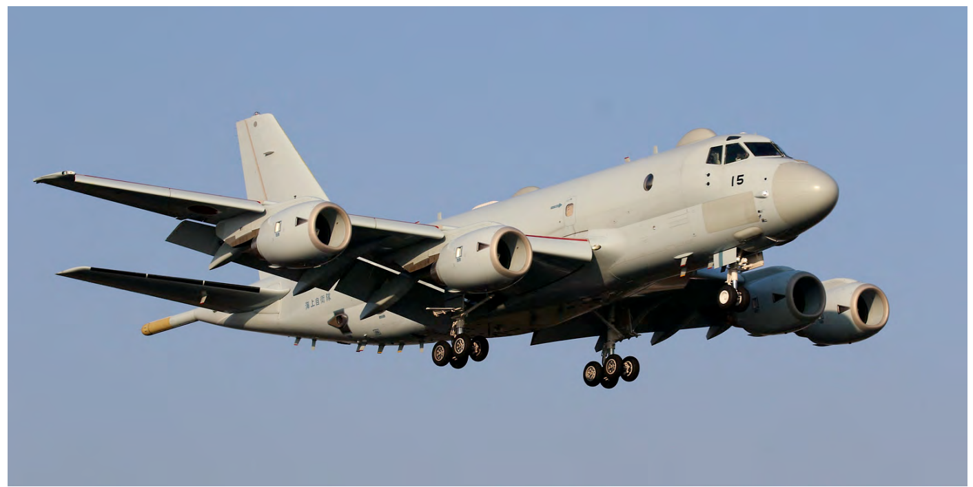
The Japanese P-3 Orion replacement, the Kawasaki P-1, is being delivered at a steady pace. P-1 5515 with 3 kokutai markings is seen here on approach to Atsuqi. The latest P-1, 5520, was seen at the factory at Gifu a few days later (27 November 2018)