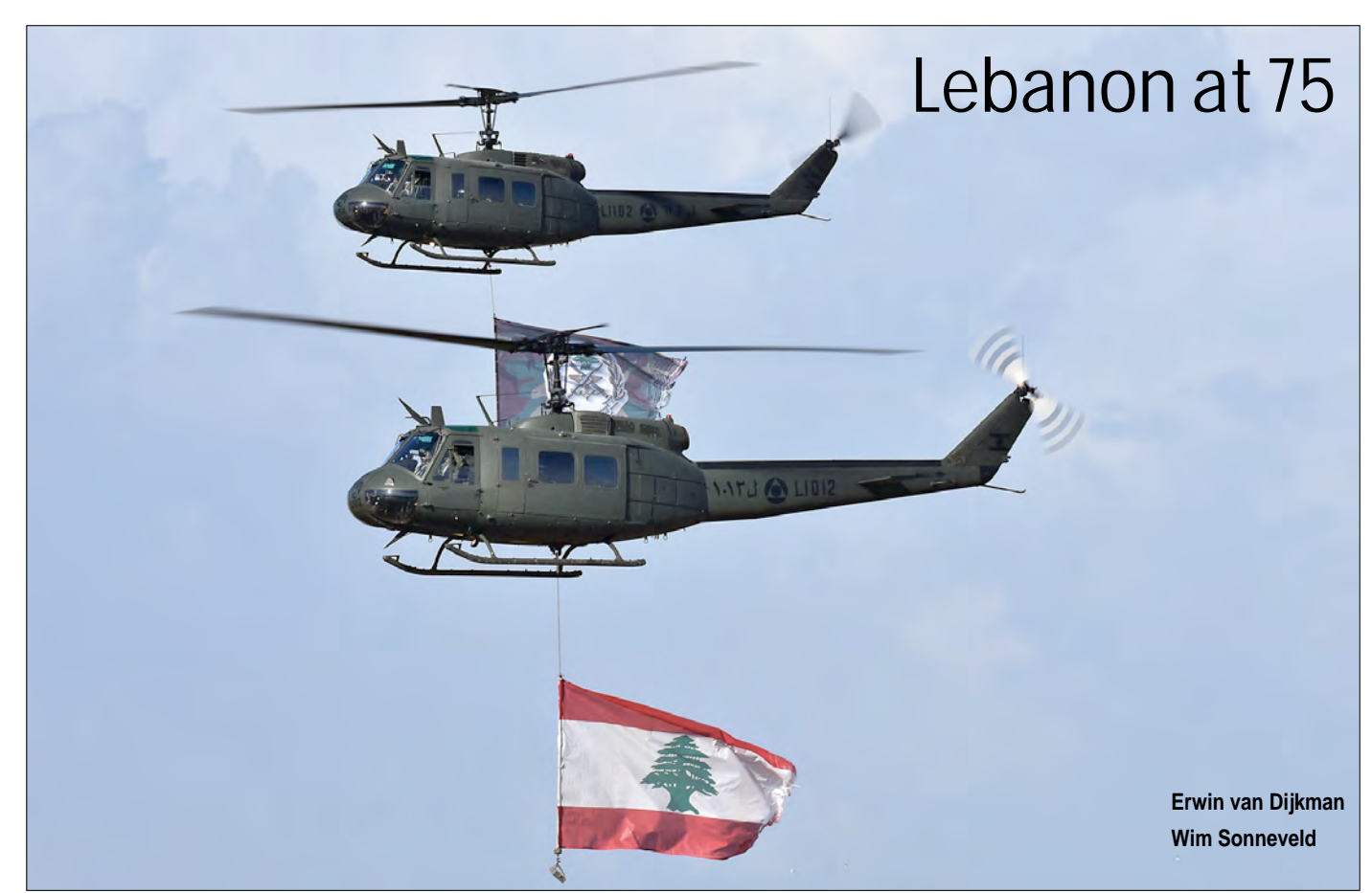
Flag bearing UH-1Hs L1012 'Black 1' and L1102 'Black 2' hover over runway 17 of Beirut Air Base on 22 November.

75 is by all means a respectable age, but for a country it is relatively young. We were granted permission to witness the preparation for the aerial parade conducted in honour of Lebanon's Independence Day at this special anniversary, 22 November 2018. In this article we will take you through the various preparatory and executory steps, shedding light on how it was coordinated from Beirut Air Base. Also, we hope to make you more acquainted with both the Lebanese Air Force and its assets as well as with the uniting role the armed forces actually play in the country.