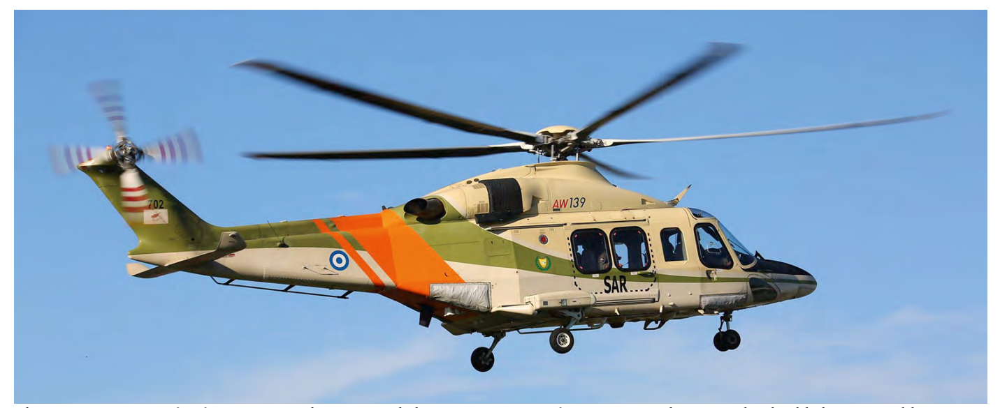
The Cyprus Ministry of Defense operates three AW139 helicopters in SAR configuration. Serial 702 was the third helicopter and last AW139 that was delivered in 2011. It is active with the 2nd Platoon, 460 MED wing (Search and Rescue squadron). (Liège, 18 November 2018, Hervé Campsteyn)

leakage in the accessory gearbox in one of its PW1100 engines during initial climb while departing back to Istanbul on the 23rd. The AeroMéxico Dreamliner on that same day was a Charles de Gaulle diversion and the LEVEL on the 23rd was an Orly diversion.