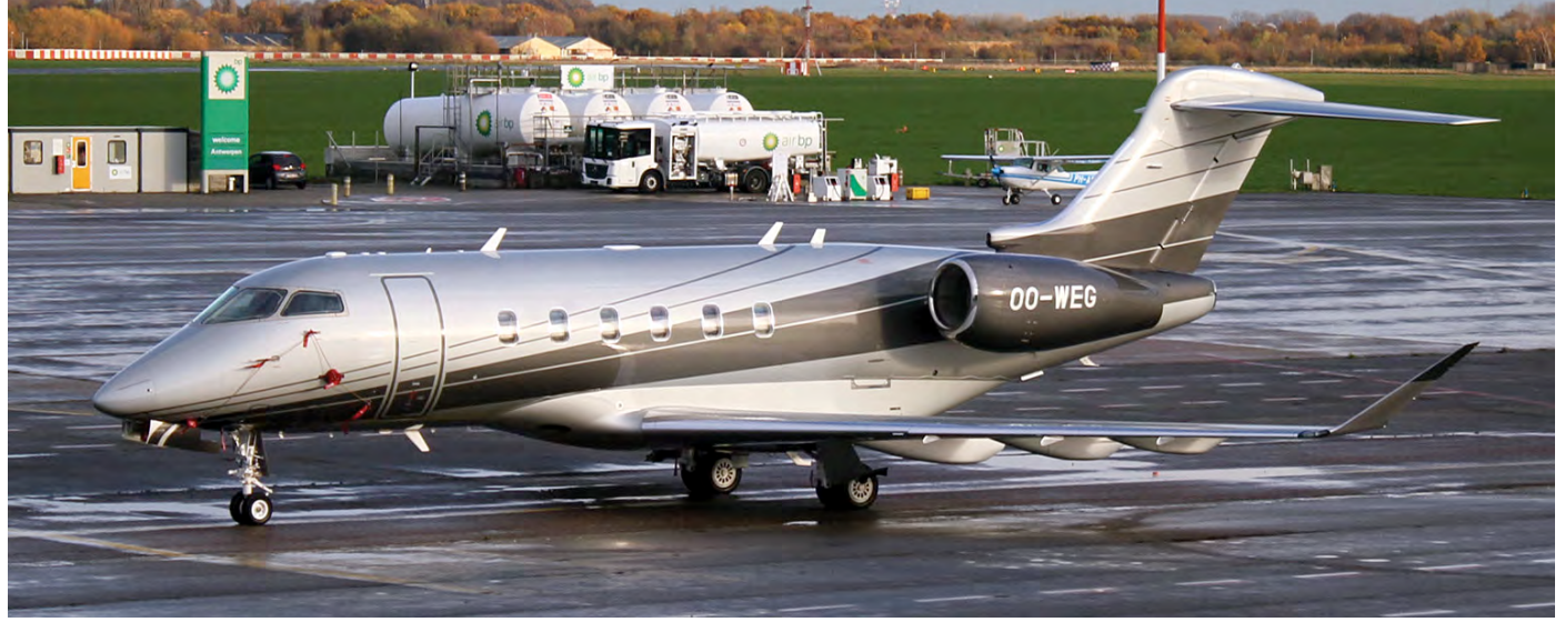
This factory fresh CL-350 with registration OO-WEG, was pictured by Walter Van Brempt shortly after its delivery to Luxaviation Belgium at Antwerp. This is a new type for the Belgium civil register. (Antwerp-Deurne, 29 November 2018)