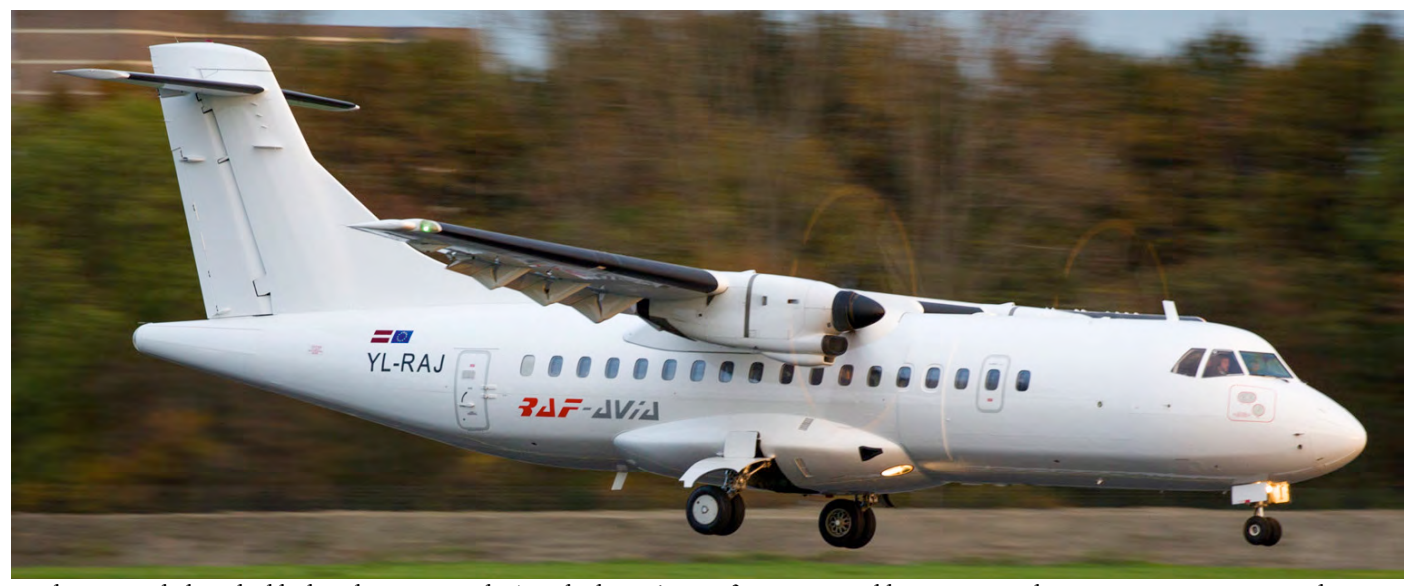
A relative new kid on the block is this ATR 42. The 'Quick Change' aircraft was acquired by RAF-Avia when its new career in Sri Lanka was a no-go. YL-RAJ entered service with RAF-AVia in October 2018. (Rotterdam - The Hague, 21 November 2018,)