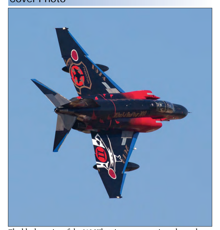
The black version of the 302 Hikotai commemorative colour scheme on F-4EJ Kai 77-8399 made its debut a few days before the air show at Hyakuri, marking the end of Phantom operations for this squadron. (1 December 2018, Bastiaan Hart)