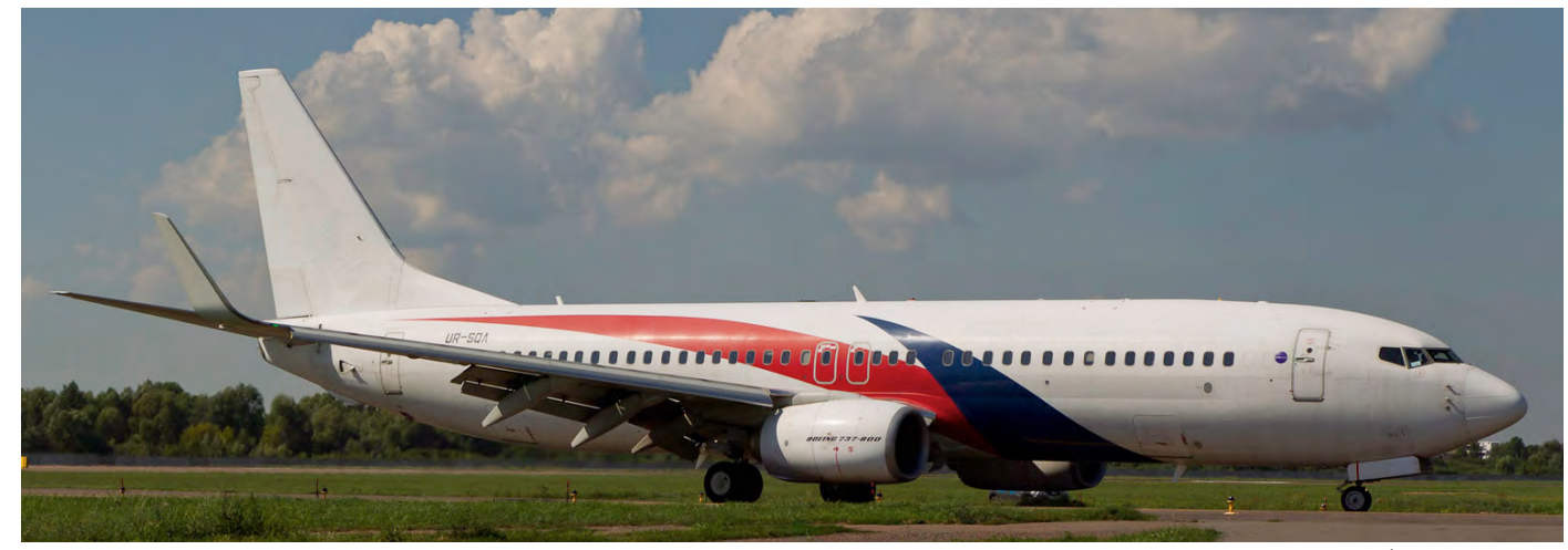
This former Malaysia Airlines Boeing 737 was added to the fleet of Ukrainian lowcost airline SkyUp in April 2018 as UR-SQA. (Kiev-Zhulyany, 3 August 2018,)