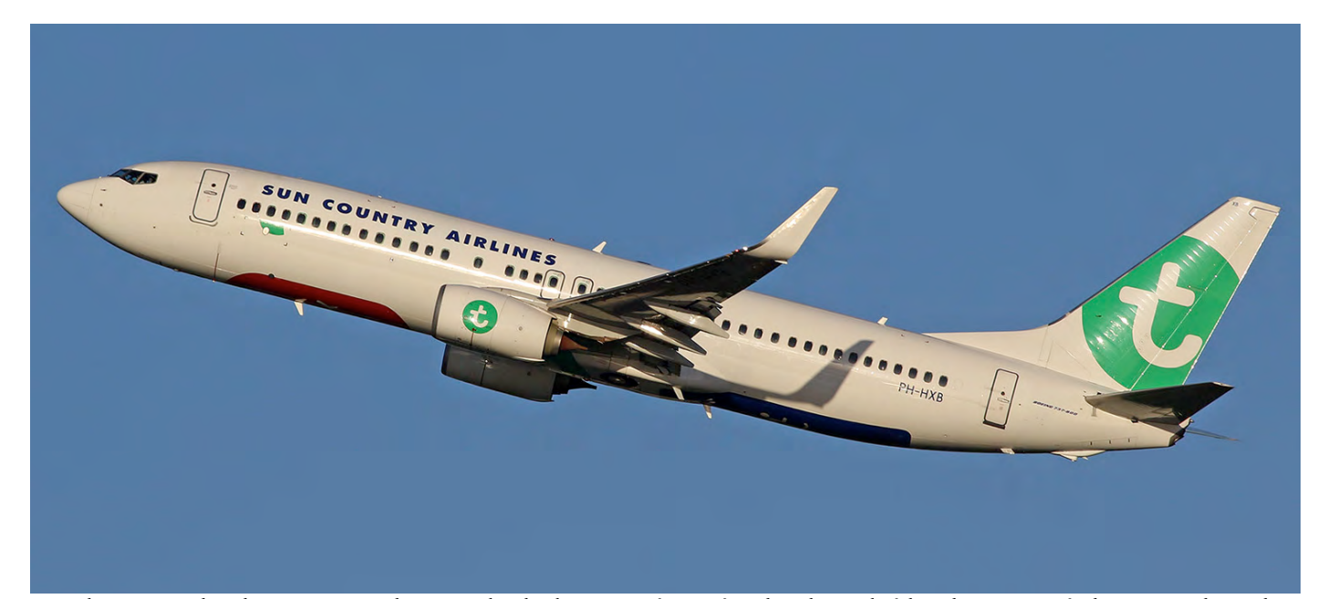
A good give-away that the winter season has started is the departure of aircraft to the other end of the atlantic ocean for lease to another airline. Transavia Boeing 737 PH-HXB will spend the winter with Sun Country Airlines. It will return to the Netherlands in the first quarter of 2019. Hopefully we will be able to show you more winter leases in the next months. (Amsterdam - Schiphol, 8 November 2018, Michel van Bokhoven)