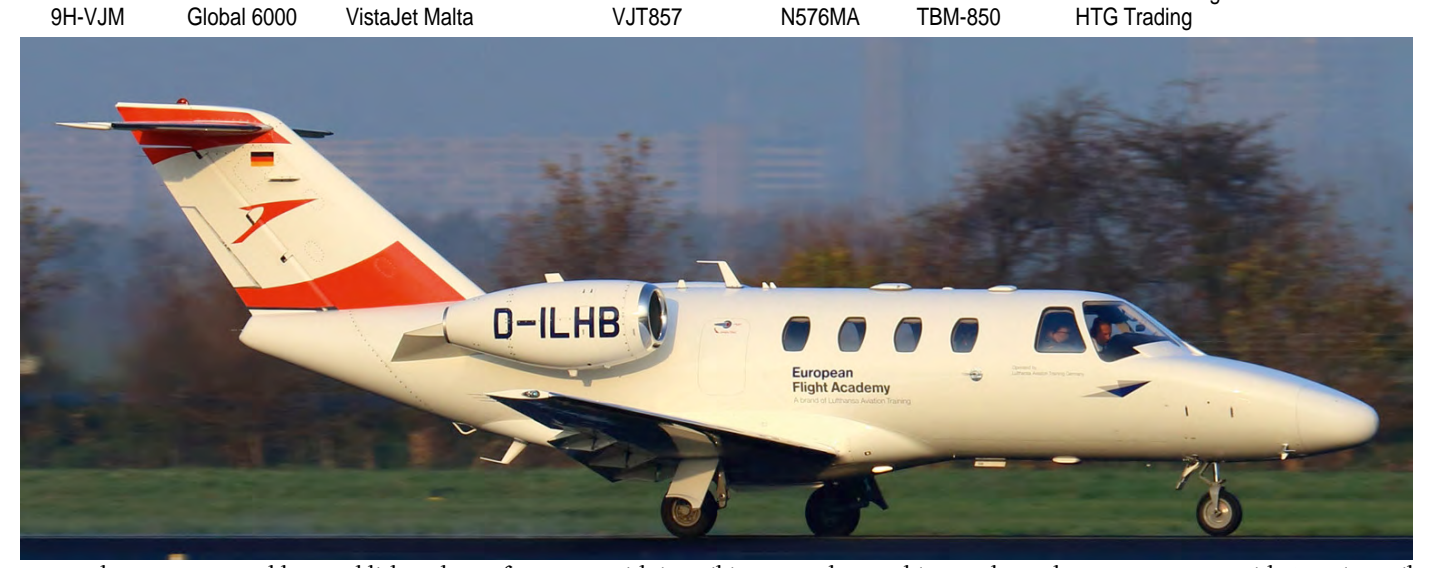
In March 2018 we were able to publish a photo of a Cessna with its tail in ANA colours. This month we show you a Cessna with Austrian tail colours. Cessna 525 D-ILHB was delivered to Lufthansa Flight Training in 2008. European Flight Academy is a Lufthansa Aviation training brand. (Rotterdam - The Hague, 21 November 2018, Cor Mout)