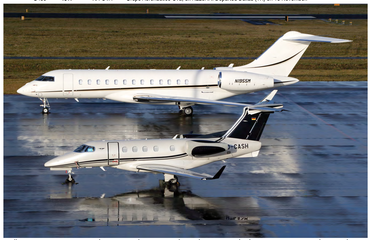
Eindhoven Airport receives more and more visiting business aircraft nowadays, as proven by this picture containing two bizjets at the same time. The Global Express with registration N1955M belongs to Bombardier Aerospace and the Phenom 300 with registration D-CASH belongs to Air Hamburg Luftverkehrs. (Eindhoven-Welschap, 4 December 2018,)