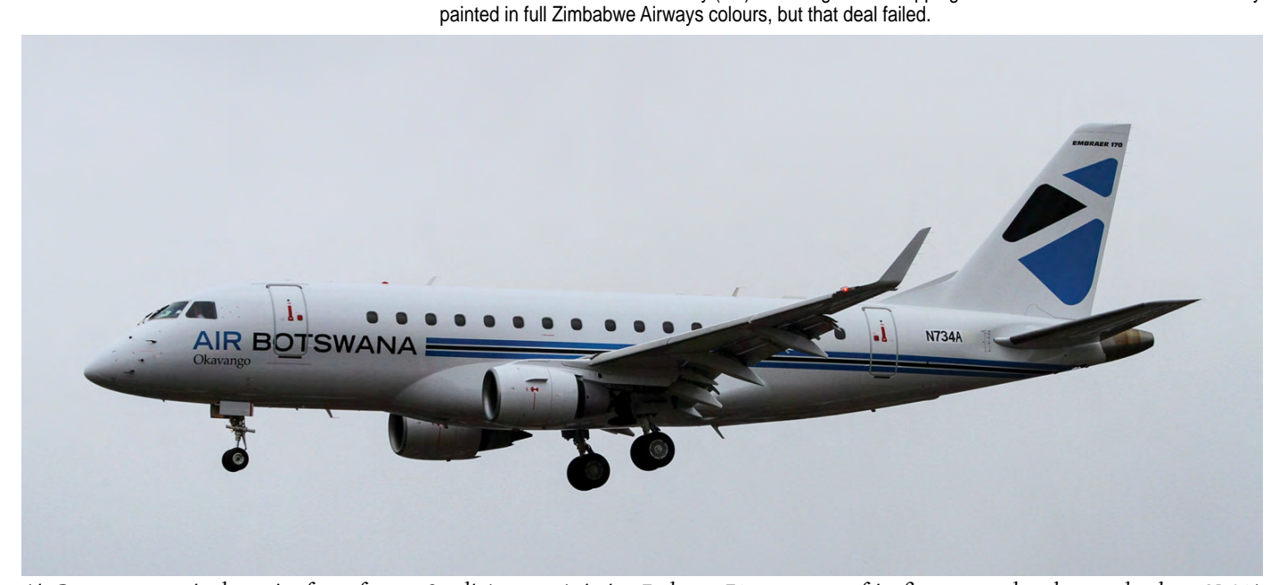
Air Botswana acquired a pair of two former Saudi Aramco Aviation Embraer E170s as part of its fleet renewal and upgrade plans. N734A (17000318) and N735A (17000319) are currently undergoing pre-delivery maintenance checks at Toronto Pearson (Ont.) ahead of their respective journeys to Southern Africa. Aside from these two Embraers, Air Botswana also acquired two brand new ATR72-600s, which were delivered in November and December. Collectively these four aircraft will replace Air Botswana's ageing fleet of ATR42-500s, ATR72-500, BAe146-100, RJ85 and a leased CRJ100. Seen here is N734A, which will be registered as A2-ABM upon delivery to Botswana, by Andrew Cline on 21 December 2018, coming in to land at Toronto Pearson International.