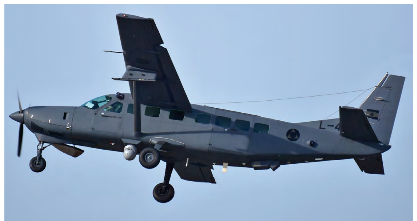
Three AC-208 (Cessna 208B) Armed Caravans were received, one in 2009, one in 2013, and the third in 2016. The latter, L403, is the only EX version with a glass cockpit. It is seen here banking after take-off on parade day. Actually, one of these Beirut-based AC-208s of 4sq was used to relay the parade's proceedings with base operations during the fly-by over the city.