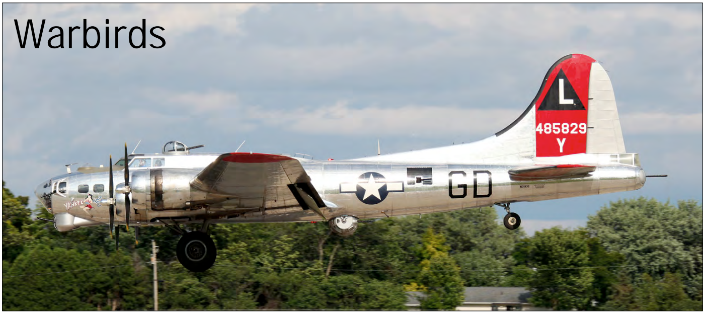
Boeing B-17G 44-85829 is one of the Flying Fortresses that was converted into a US Coast Guard PB-1G Air-Sea-Rescue machine. Since that time it found employment in civilian hands as survey aircraft, airsprayer and airtanker. In 1986 the bomber was acquired by the Yankee Air Museum at Willow Run (MI), and fully restored as 'Yankee Lady' (Oshkosh, 27 July 2018,)