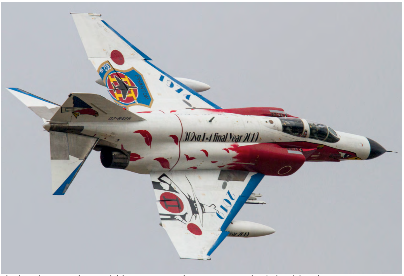
Already in July 2018, 302 Hikotai revealed this commemorative Phantom, 07-8428, to mark its final Spook flying days.