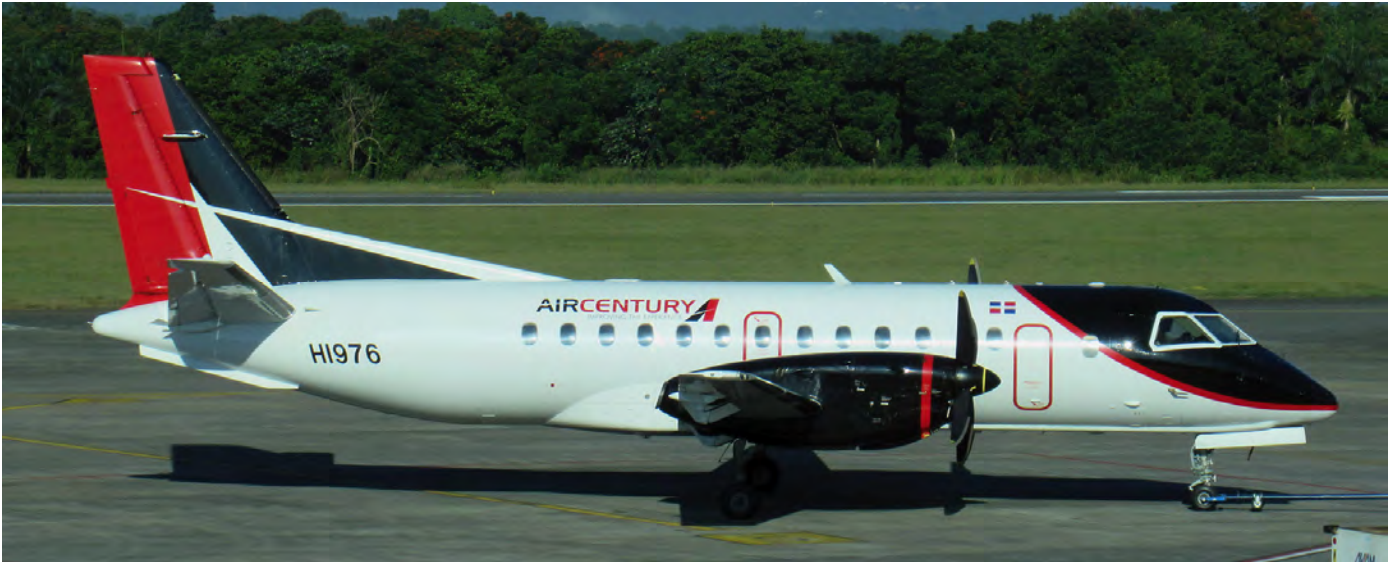
Dominican airline Air Century operates charter- and scheduled flights with three different types of aircraft. The first one is the Swedish built Saab 340. HI976 started its career in the USA in 1993 and flew there for almost twenty years. In 2015 it was added to the fleet of Air Century. (La Isabela, 30 November 2018, Johnny Rod)