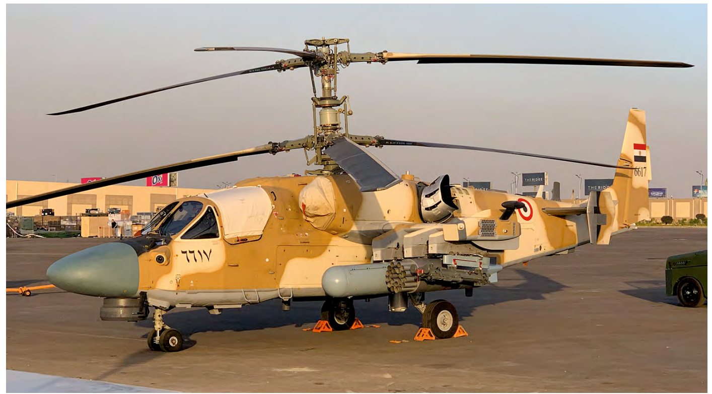
During a chance visit to the would-be venu for this year's Egypt Defence Expo (EDEX), this Ka-52 was already present. The event was held from 3 to 5 December. (6617, Cairo-EDEX, 29 November 2018).

(9T-CLG or 9S-CLG) are civil registered, the rest are part of the air force inventory. New for our database are the seven helicopters and the Boeing 737 freighter.