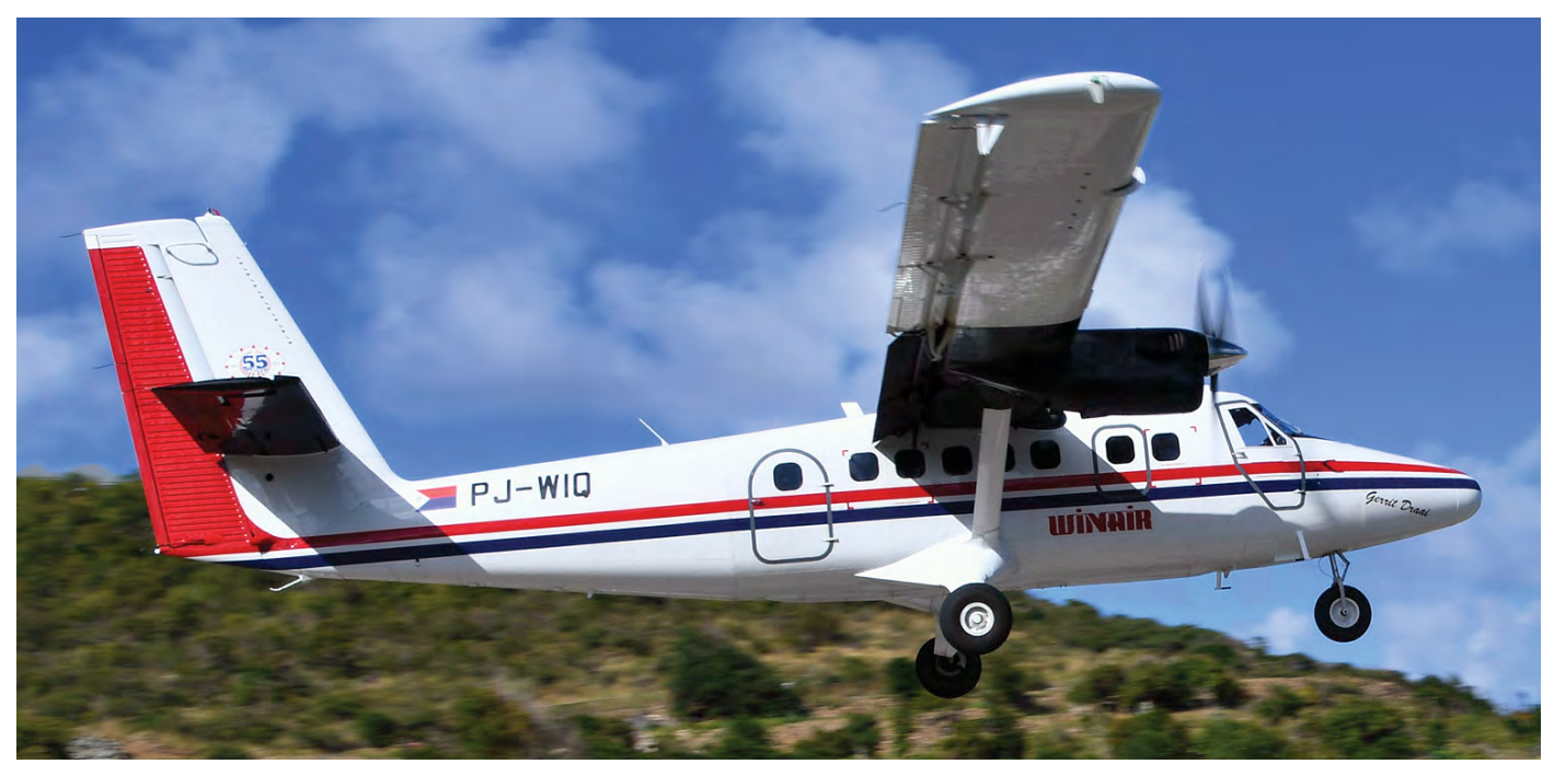
Winair has been the new owner of this 1976 built DHC-6-300 since November 2015, PJ-WIQ. The same aircraft was also owned by the same airline from 2008 till 2012, with former registration PJ-WIN. (Saint-Barthelemy, 15 December 2018,)