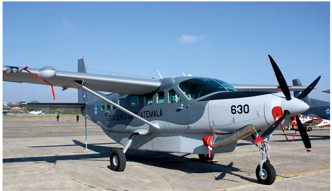
The Guatemalan Air Force has taken delivery of a third Cessna 208B Grand Caravan EX. Just to confuse spotters, the two delivered in September with serials 889 and 360 have now been augmented by serial 630 (La Aurora, 2 December 2018, Carlos Alberto Rubio Herrera).