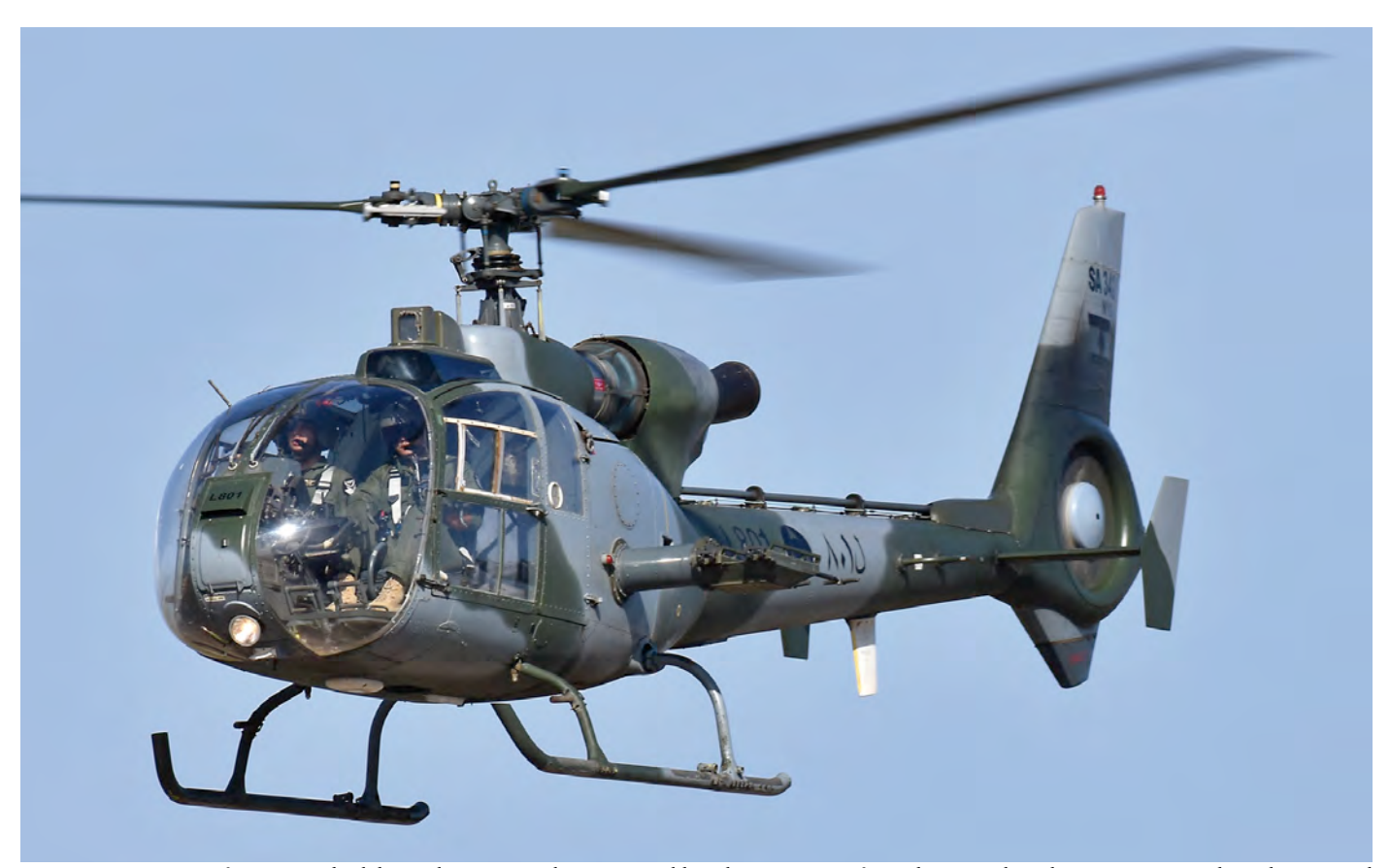
LAF operates a mix of seven newly delivered SA342L and nine second hand acquisitions from the United Arab Emirates. More have been noted so may have been delivered or reregistered. All are used by 8sq based at Rayak AB.