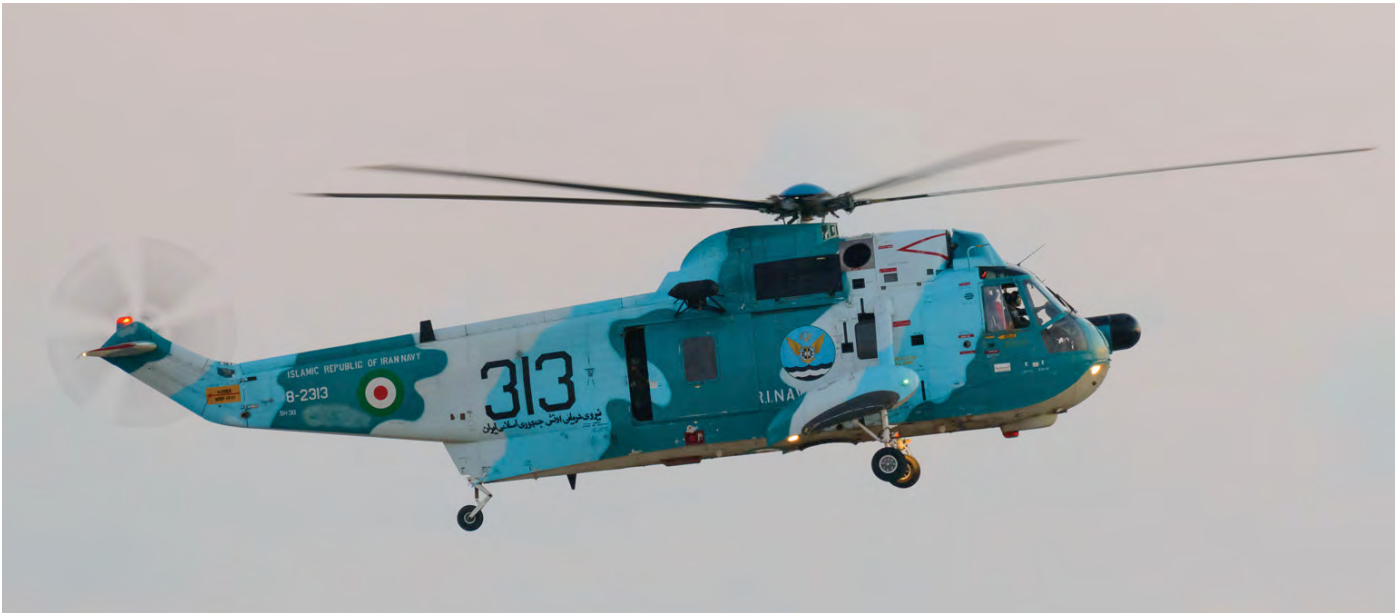
The show also knew some unexpected highlights, like this venerable Sea King of the Islamic Republic of Iran Navy Aviation. Erik Sleutelberg was among the lucky to catch SH-3D 8-2313 arriving shortly after sunset on 26 November 2018, to be put on static display the next day.