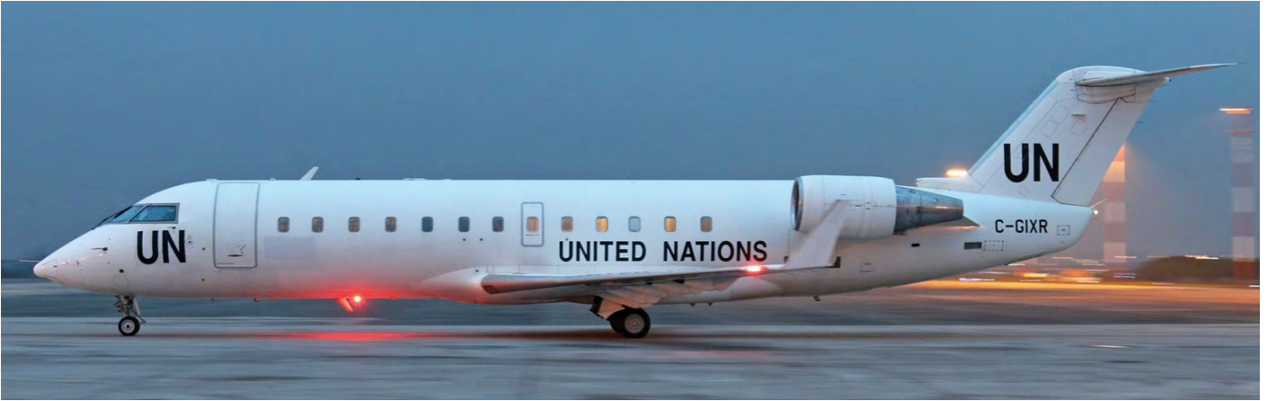
Delivered to British European Airways in 2000 this Canadairjet ventured to India in 2003. The aircraft was returned to Bombardier in December 2010. Voyageur Airways took delivery of the aircraft in April 2011 as C-GIXR and this aircraft has been on United Nation duties ever since. It was caught on camera on its way back to North Bay . (Ostend, 27 November 2018, Nik Deblauwe)

<u>Credits</u>: Replo.be, Nik Deblauwe, Andre Deblauwe.