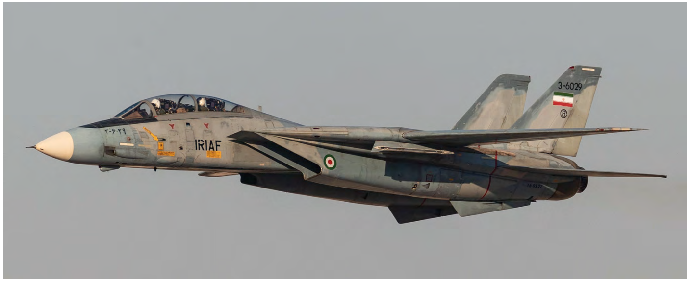
As a teaser to next month's trip report revolving around the Iran Air Show 2018 at Kish Island we present this photo page. Intensely hoped for by every enthusiast and indeed appearing on all show days were flying Tomcats. Stephan de Bruijn captured F-14A 3-6029 of the 8th TAB over the Kish runway during one of its daily sets of fly-by's from 26 to 29 November.