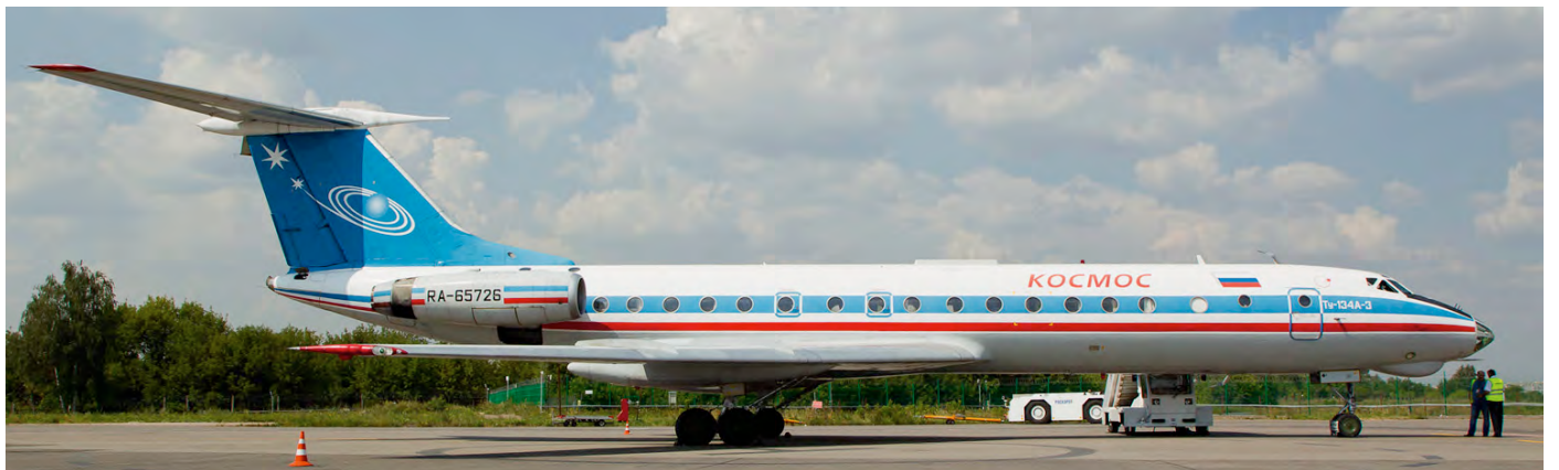
MOM NPO "Energiya" took delivery of this Tupolev Tu-134AK in 1983. At that time the aircraft was in Aeroflot colours and registered as CCCP-65726. In 1995 the aircraft was transferred to Kosmos by then already registered as RA-65726. By February 2004 the type was ammended to Tu-134A-3.(Moscow-Zhukovsky, 4 August 2018, Andre Alders)

Friday was a busy day with a morning Motor Sich Airlines flight from Zhaporozhye to Kiev-Zhulyany. I was hoping for the Yak-40 but a 1972 vintage An-24 (UR-MSI) was on the ramp. After arrival I spent some time in the excellent Kiev-State Aviation Museum. Very good pictures can be taken from the museum of taxiing aircraft at IEV. A walk alongside the perimeter fence yields many registrations, mainly of stored/derelict airplanes. The afternoon flight with Belavia B737 EW-366PA via Minsk to Moscow-Vnukovo with Utair B737 VQ-BYM was uneventful except for a couple of Russian Air Force Tu-134s, which were seen on the new part of Minsk Airport during taxiing. OAO Minsk Civil Aircraft Repair Plant No. 407 is a leading agency in the post-Soviet territory to provide repair, upgrade and maintenance services for the Yak-40, Yak-42, Yak-52 and Tu-134. The plant is now being physically relocated to Minsk Airport after the closure of Minsk-1 Airport. Even the old acquaintance UR-UES without