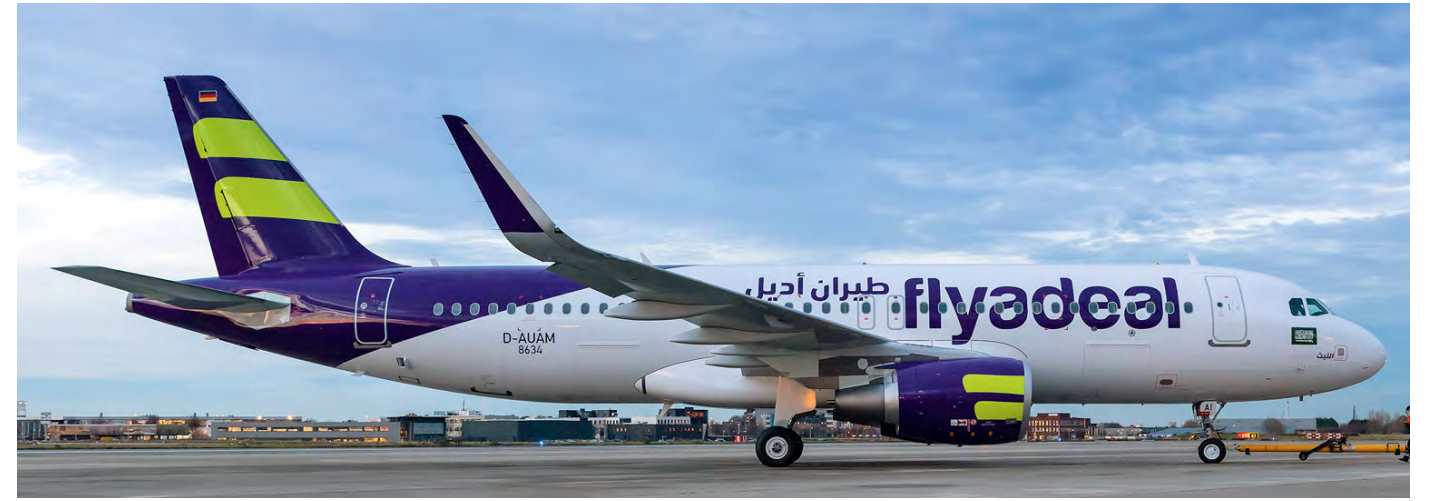
Flyadeal is the daughter company of Saudia Airlines. The airline operated its first flight on 23rd September 2017. Airbus A320 D-AUAM was delivered to the airline on 18 December 2018 as HZ-FAI. (Maastricht - Aachen, 29 November 2018,)