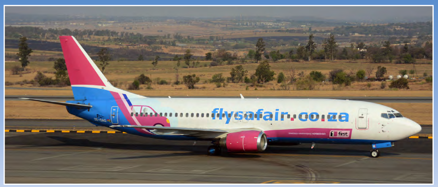
Flysafair owns a fleet of Boeing 737-400's and -800's. The 737-400 ZS-OAG on this picture was built in 1993 and delivered to the South African company in October 2017. (Lanseria, 23 September 2018, Raymond van Dijkhuizen)