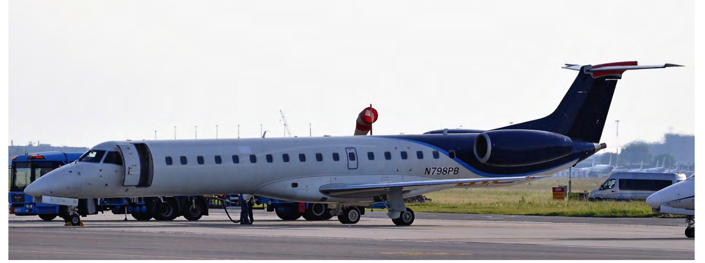
This Embraer 145 entered service with AeroLitoral in May 2004. From 2008 the aircraft carries AeroMexico Connect titles. In 2011 the colours were revised and in these basic colours and registered as N798PB the aircraft was delivered to its new operator Air Lebanon. (Amsterdam - Schiphol, 28 May 2018)