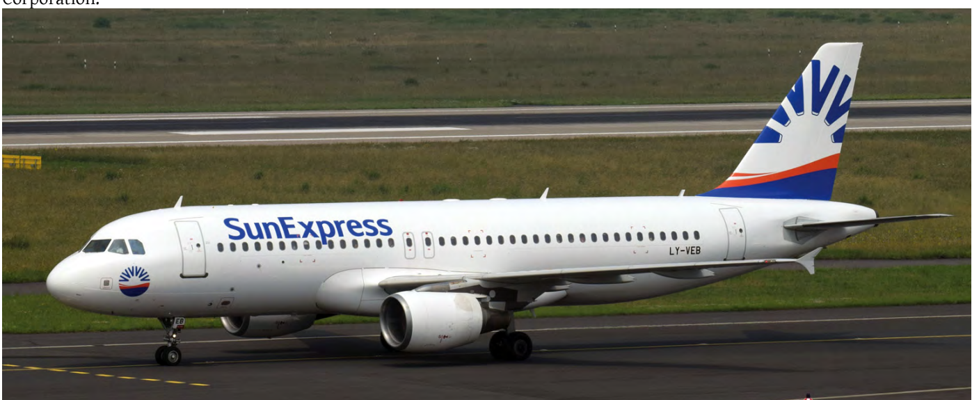
For additional capacity in the busy summer season all 737 operator SunExpress hires four Airbus A320 aircraft from ACMI specialist Avion Express., of which LY-VEB is one. The seventeen-year old Airbus is used to fly tourists to sunny destinations, because before it joined Avion Express it flew its whole life for British bucket and spade brigade airlines Air 2000, First Choice Airways and Monarch Airlines. (Düsseldorf, 10 June 2018, Frank Schuchardt)

<u>Swoop</u> has taken delivery of its first B737-800. By the end of the year, the ultra-low-cost subsidiary of WestJet expects to have ten of these B737s in its fleet. With initially domestic services, the airline intends to fly to various sunny destinations in the United States from October.