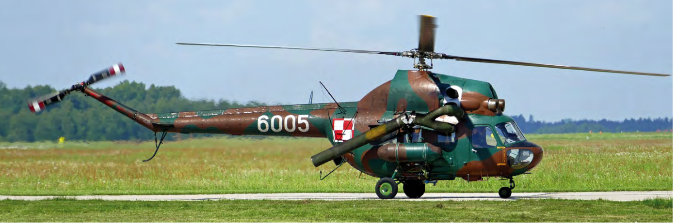
The ubiquitous Mi-2 is still in use in large numbers in Poland. One of the more interesting versions is the Mi-2Ch (Chemiczna (rozpoznawania skażeń), used to detect chemical substances over the battlefield (6005, Mi-2, 49.blot, Swidwin, 16 May 2018)