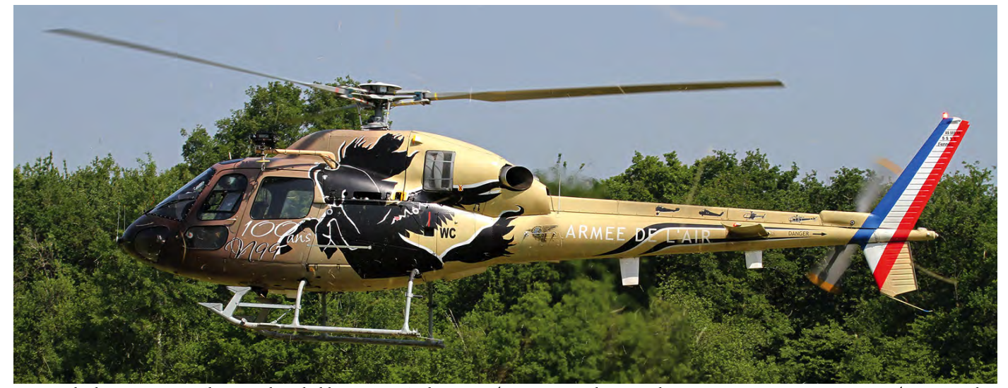
During the le Temps Des Hélices airshow held at La Ferté-Alais on 19/20 May 2018 this French Air Force AS555AN Fennec, 5511/WC, visited to drop off some VIPs. This helicopter operates with EH03.067/SPA99 at Villacoublay and sports special 100 years jubilee colours with the pegasus mascot as center piece. On the tailboom historical types operated are shown, like the H-34, SA316 and SA318. (20 May 2018,)