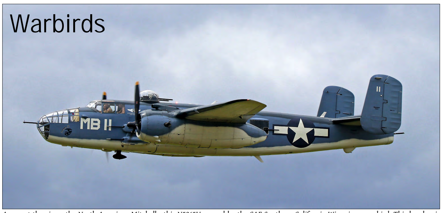
Amongst the airworthy North American Mitchells, this N5865V, owned by the CAF Southern California Wing, is a rare bird. This bomber is originally built as B-25J 44-30988, but delivered as a naval PBJ-1J with BuNo 35857. After a thorough restoration is now painted as USMC 'MB11'