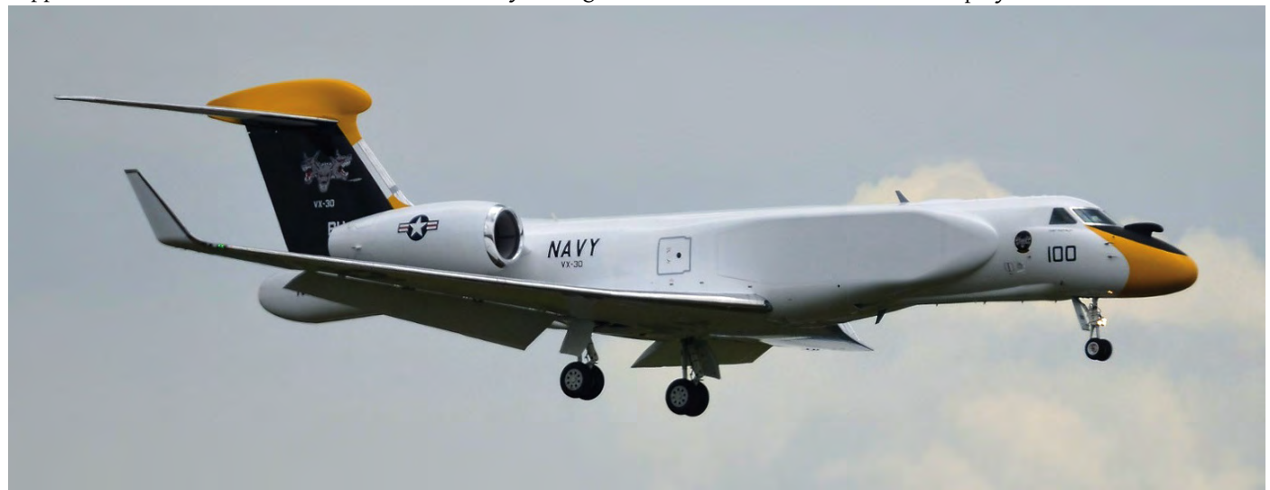
Savannah, cradle of Gulfstream bizjets, produces very remarkable breeds now and then. VX-30 will be the proud owner of this beauty, which has been upgraded to safeguard off-shore shooting ranges from its future home-base Point Mugu, replacing the NP-3D Billboard (166379/BH-100, NC-37B, VX-30, Savannah, 24 May 2018)

Related to the above Lancer news and affected by the standdown were the B-1Bs that deployed to RAF Fairford in the