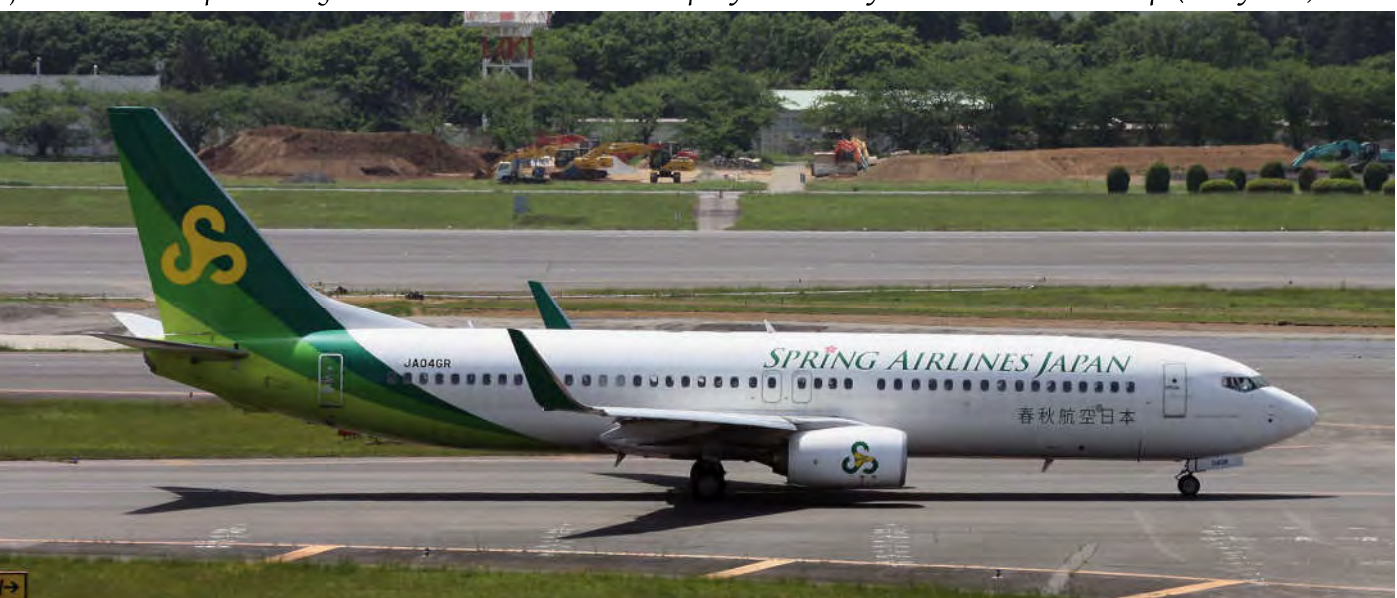
Tokyo Narita based Spring Airlines Japan has a fleet of six Boeing 737s. JA04GR was delivered in January 2017. The airline is 33% owned by the Chinese LCC Spring Airlines. (Tokyo Narita, 1 May 2018, Simon Titchmarsh)