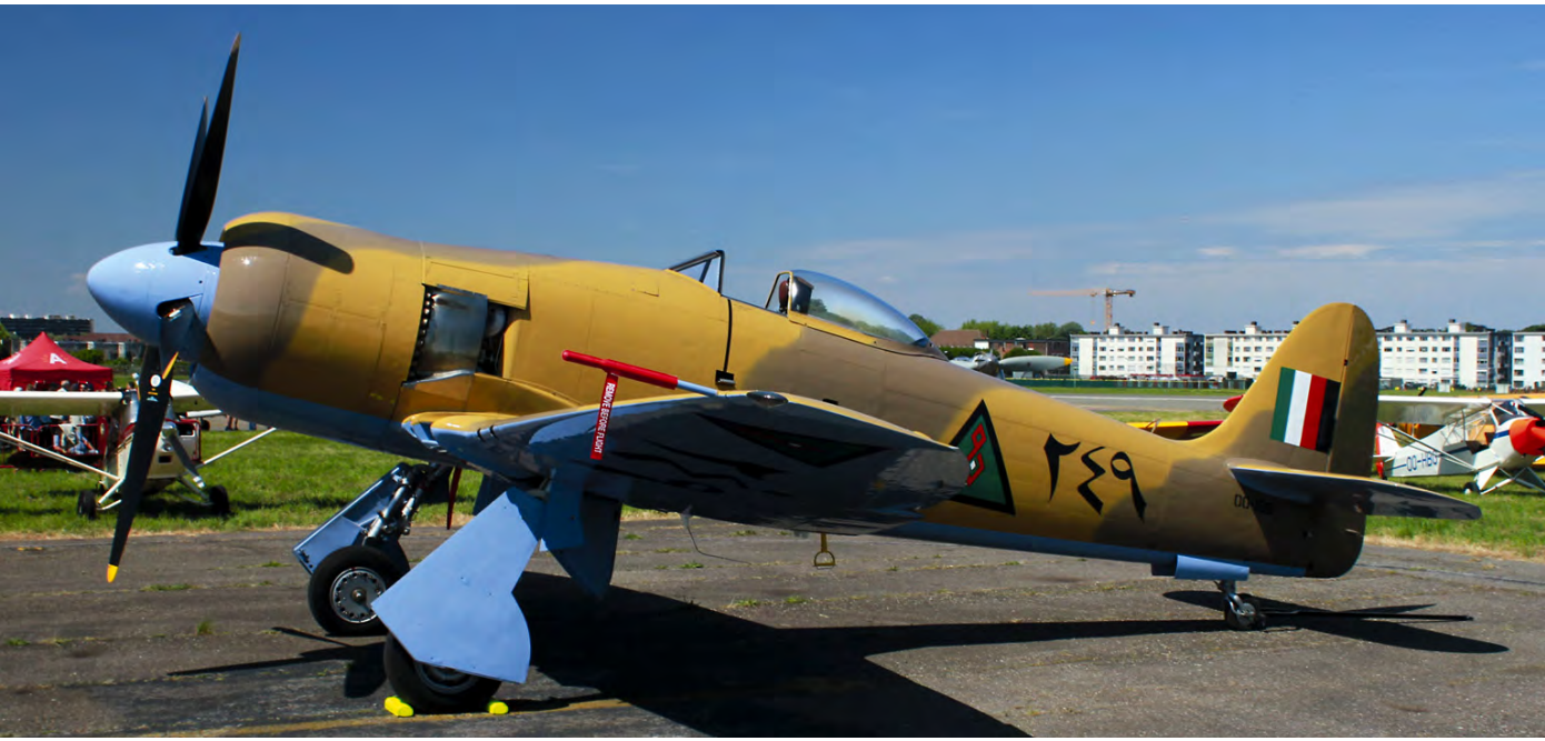
Recent changes in Belgian aviation legislation have made it easier to include a warbird in the Belgian civil register. FAST of Antwerp was one of the first companies to register one of their beauties. Iraqi Fury VH-ISS was re-registered as OO-ISS. (Antwerp, 12 May,)