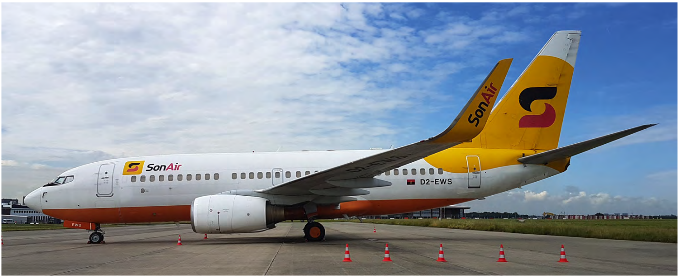
SonAir was founded in February 1998 as a venture of the Sonangol Group, an Angolan intergovernmental organization. Boeing 737 D2-EWS was delivered to the company in 2008.