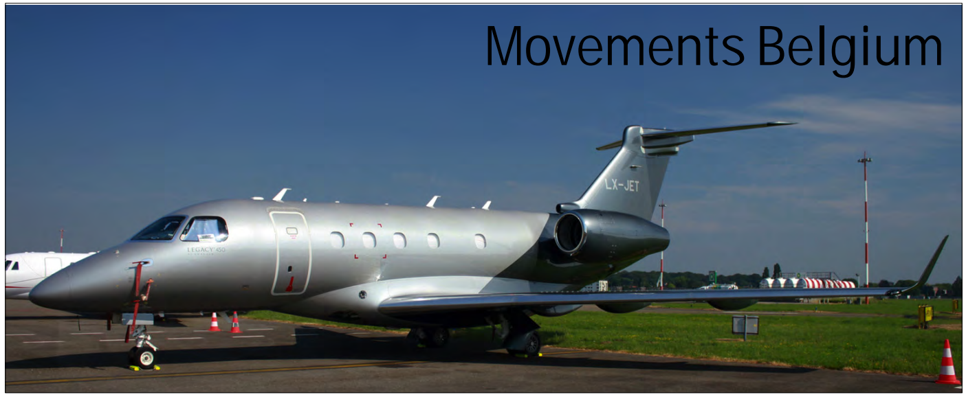
Build in 2016 LX-JET was delivered to Global Jet Luxembourg in June 2017. This Embraer EMB545 is officially owned by a company called 'LX Jet Company'. (Antwerp, 22 May 2018,)