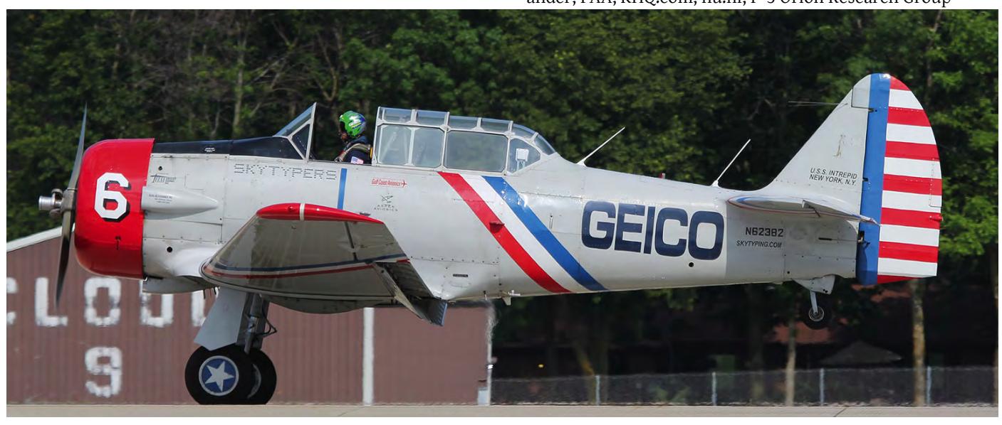
The vintage North American SNJ-2 Texan was spinning in the air just after take-off from Melville, Long island, Suffolk County (NY) before it crashed along a road in Melville. The Texan was one of the GEICO Skytypers that flew at the Bethpage Air Show at Jones Beach State Park over Memorial Day weekend.