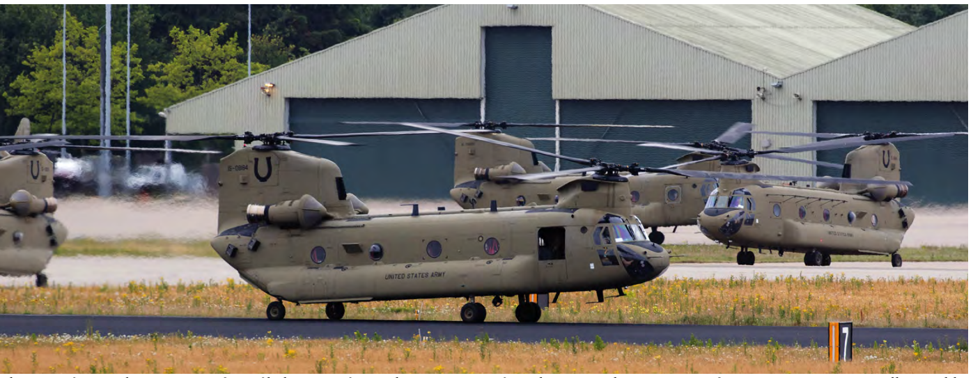
The Port of Rotterdam saw an influx of helicopters from 4th CAB arriving for Atlantic Resolve. Most were flown to Germany via Eindhoven, like this CH-47F (15-08184, CH-47F, 4th CAB, Eindhoven, 22 June 2018)

Operation Atlantic Resolve. The helicopters were off-loaded the same day and placed inside a warehouse. The next two days, the helicopters were re-assembled and departed for Germany. Most of the helicopters made a tank stop at Eindhoven, except for four UH-60L Blackhawks which flew directly to Wiesbaden AAF (Germany) during the evening of Thursday 21 June 2018.