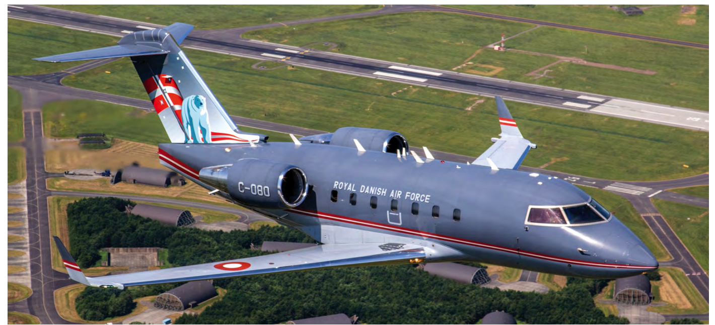
In the week leading up to the Royal Danish Air Force 2018 airshow, Soren Augustesen had the great opportunity to fly with the Air Transport Wing Aalborg on 31 May 2018. Pictured here is a CL-604 Challenger of Esk 721 with a tail painted specially for the airshow. C-080 sports a polarbear on the right side and a oystercatcher on the left side.