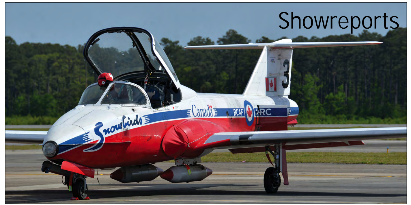
Since 1971 the Royal Canadian Air Force uses the CT-114 Tutor for their 431st Air Demonstration Team, more commonly known as the Snowbirds. Erik Jan Engelen visited the 2018 MCAS Cherry Point airshow where the Snowbirds performed with 114109/3 resting on the tarmac on 5 May 2018.