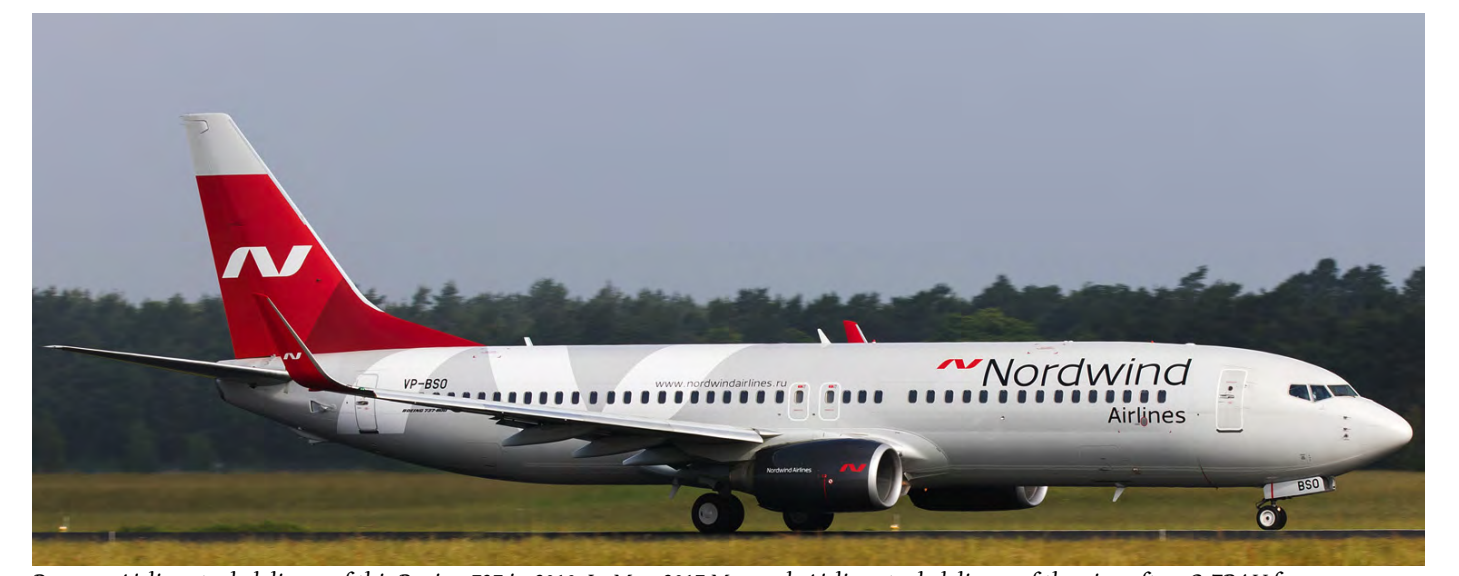
Pegasus Airlines took delivery of this Boeing 737 in 2010. In May 2017 Monarch Airlines took delivery of the aircraft as G-ZBAV for crew familiarisation flights before the airline's fleet of 737 MAX aircraft would arrive. The airline had a substantial order for 737 MAX 8 in place when it collapsed. Nordwind Airlines took delivery of the aircraft on 30 May 2018 and registered it VP-BSO. (Woensdrecht, 30 May 2018, Johan Havelaar)