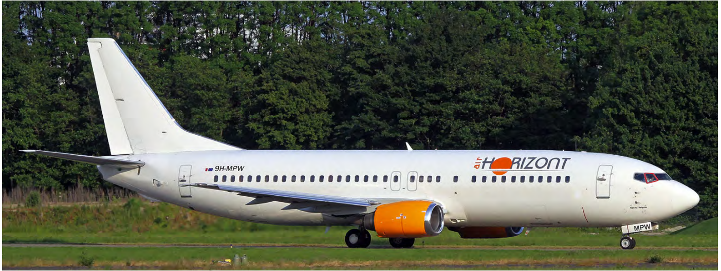
This former Olympic Airways Boeing 737 has returned to Europe after spending almost seven years in the United States. 9H-MPW was delivered to Air Horizont in April 2018. (Rotterdam - The Haque, 21 May 2018,)