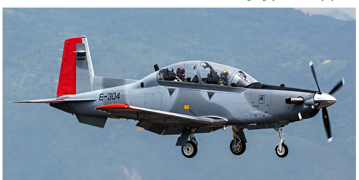
Two Argentinian Air Force T-6C+ E-304 and E-305, visited La Aurora, Guatemala City on their long delivery flight to Córdoba. These are the fifth and sixth aircraft of the twelve-strong order and two more are expected later this year (La Aurora, 22 June 2018, Oscar Guillen)

Israel has been wooing Uruguay with all sorts of proposals to