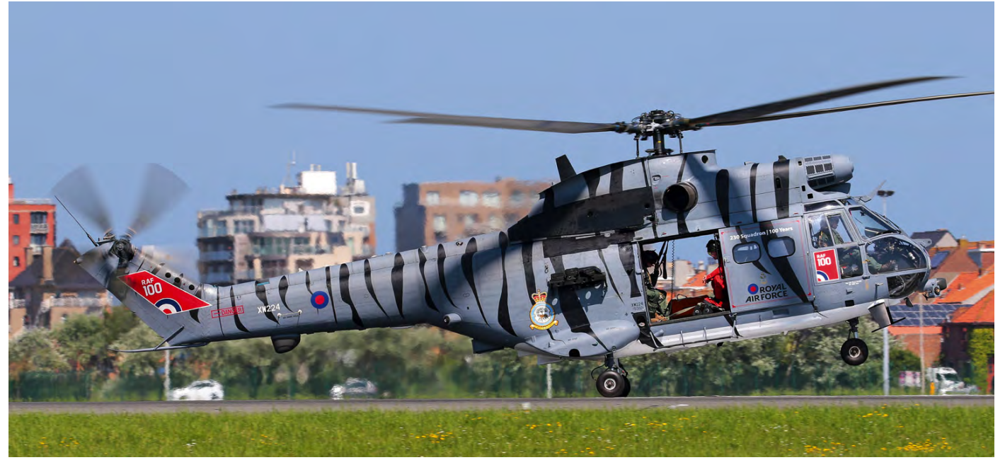
Royal Air Force Benson operated Puma XW224 was caught on camera while on its way to the Tiger Meet in Poznan, Poland. The helicopter is also adorned with RAF 100th Anniversary stickers. (Ostend, 11 May 2018,)