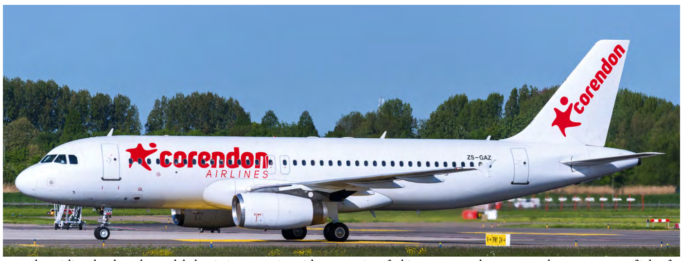
Corendon Airlines has leased two Global Aviation Operation Airbus A320 aircraft this summer. Both ZS-GAW and ZS-GAZ operate flights for Corendon Airlines and Corendon Airlines Europe in the colours as can be seen on this photo of ZS-GAZ. (Rotterdam - The Hague, 3 May 2018,)