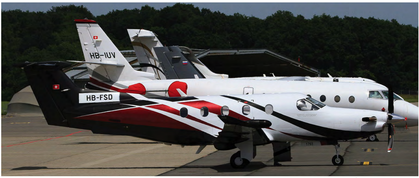
During EBACE you can usually see a few new PC-12s. HB-FSD carries c/n 1793 and will eventually be registered SP-NCL. (Geneva, 28 May 2018,)