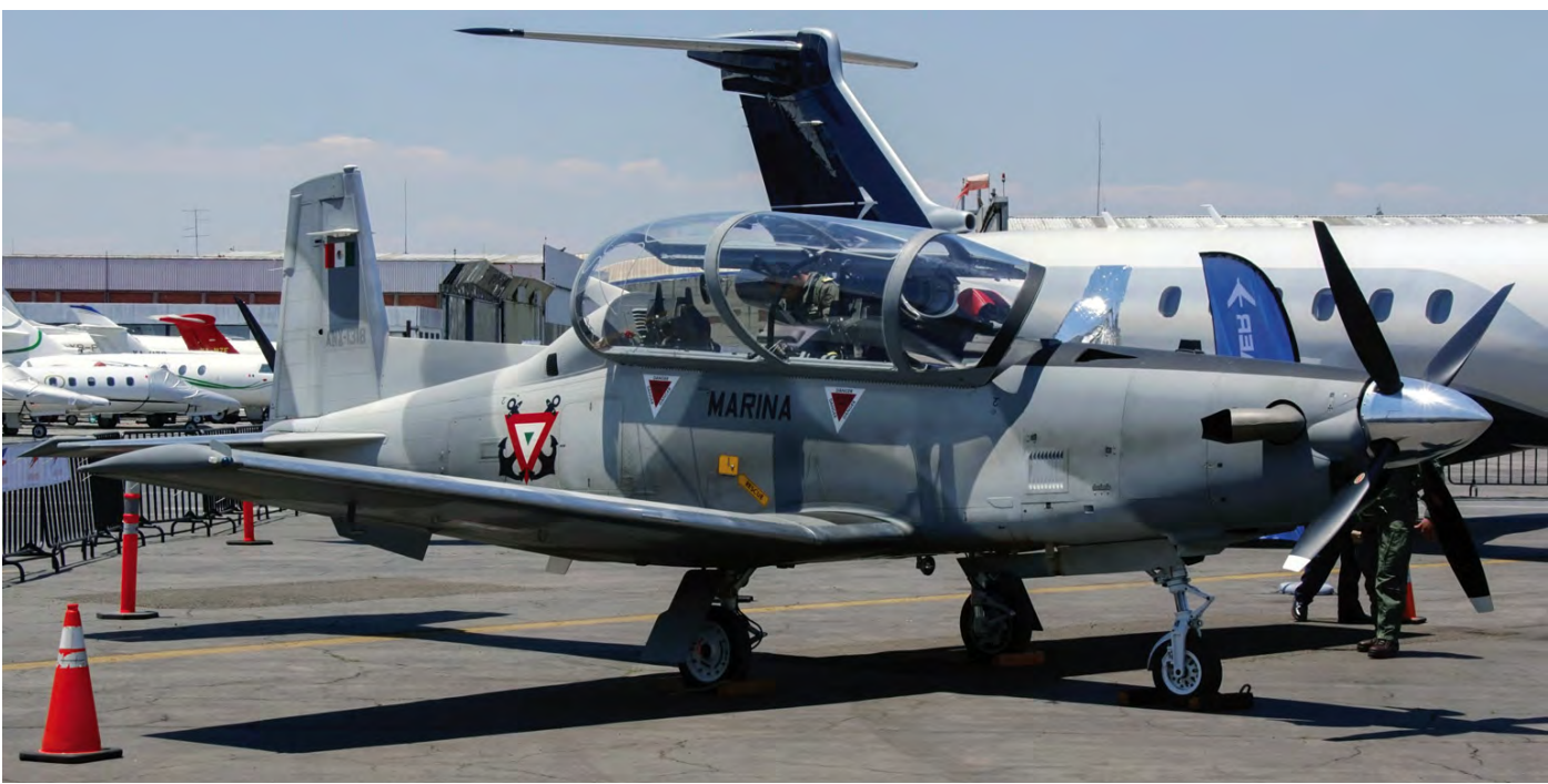
The Mexican Navy is the proud operator of a dozen T-6C+ Texan IIs, which are operated from three different bases along the long Mexican coastline to intercept drug smugglers (ANX-1318, T-6C+, Toluca, 19 April 2018)

replenish their fighter aircraft fleet. Offers range from modernized L-39NG, to A-37 parts and even helping to return the Pucara back to service with new engines. Nothing has been decided on these offers yet.