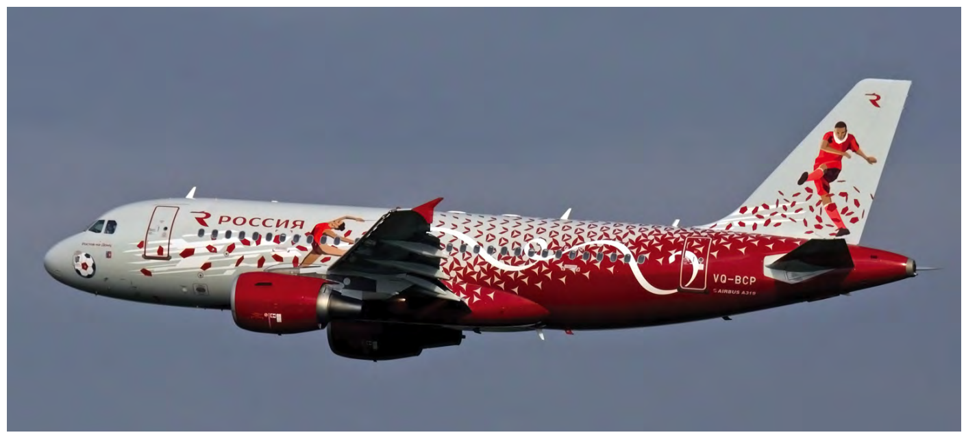
A319 VQ-BCP of Rossiya was repainted at Maastricht into this special Sports scheme. The images representing four kinds of sport: soccer, hockey, gymnastics and figure skating. It is seen here departing Maastricht. (27 May 2018, Arjen Sleeuwenhoek)