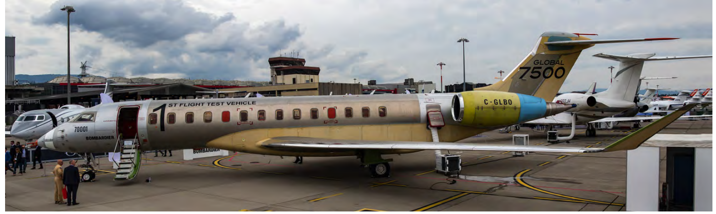
C-GLBO arrived at Geneva with Global 7000 titles on its tail but these were changed to Global 7500 shortly after its arrival thanks to performance improvements. Certification and entry-into-service is expected in the second half of 2018. (Geneva, 31 May 2018, Bastiaan Hart)