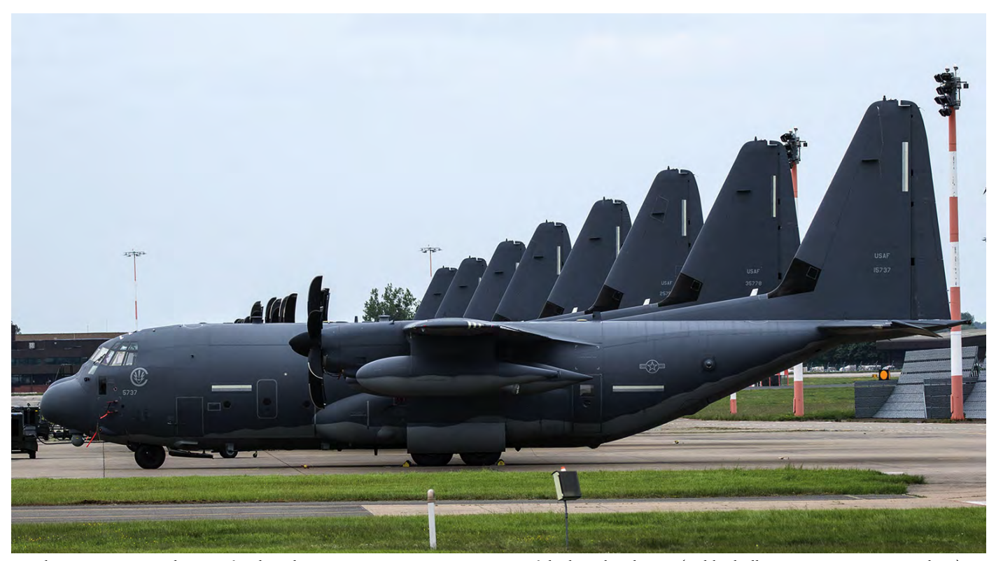
Heading an impressive lineup of no less than 8 MC-130s is MC-130J 11-5737 of the based 67th SOS. (Mildenhall, 11 May 2018, Jeroen Jonkers)

<u>Credits</u>: MAR, Scramble messageboard.