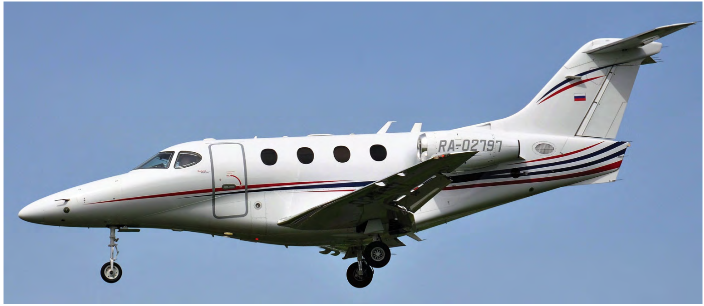
RA-02797 is one of two Premiers registered in Russia and both have previously operated in Kazakhstan. This example was delivered to Russia in November 2016. (Amsterdam-Schiphol, 1 May 2018,)