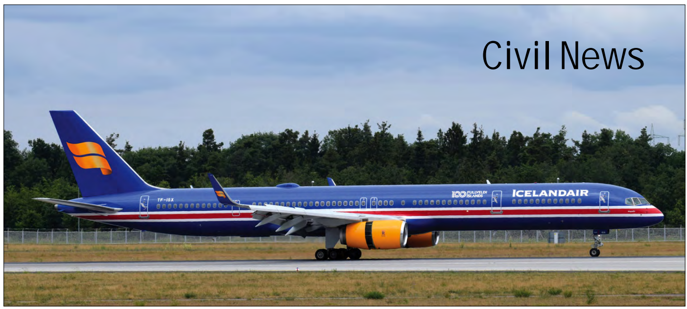
Icelandair took delivery of a former Arkia Israeli Airlines 757-300 early March 2018. The TF-ISX registered aircraft is the second 757-300 in Icelandair's fleet as they also operate TF-FIX, which was delivered brand new from Seattle in 2002. TF-ISX can be easily recognized by its special colour scheme which celebrates the centenary of Icelandic independence and sovereignty from Denmark. (Frankfurt, 13 June 2018, Frank Schuchardt)