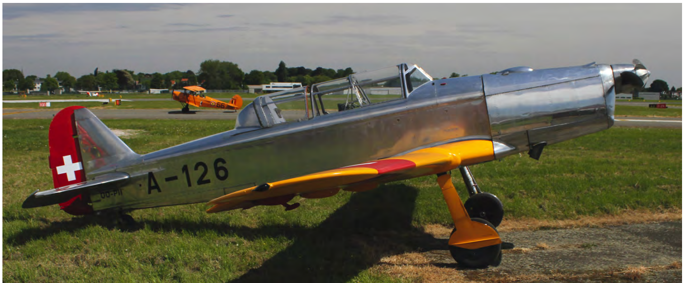
Pilatus P2-05 00-PII was delivered to the Swiss Air Force as A-126 in 1948. It was later re-registered as U-126. Sold in an auction in 1981 it became HB-RAZ and was then repainted into its original colours. This trainer was one the aircraft to receive a Belgian civil regsitration. (Antwerp, 12 May, Walter Van Brempt)