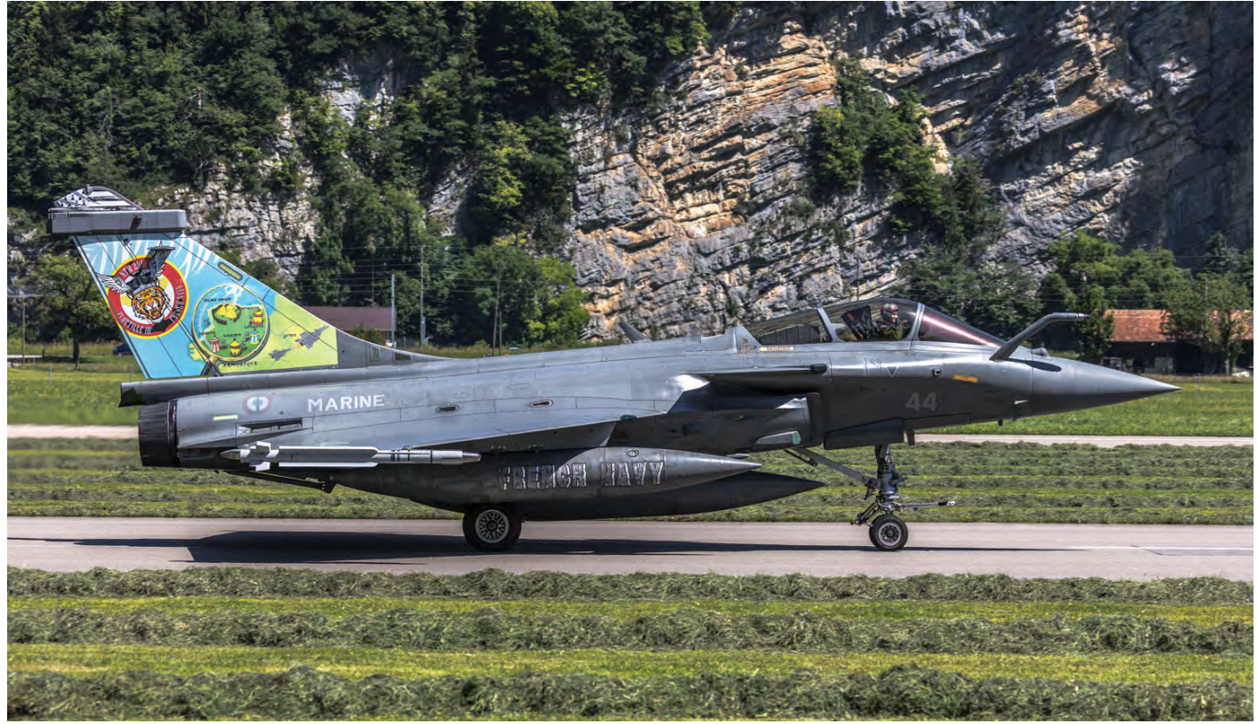
All of Gaul is occupied by the Romans. All? Not quite! Flotille 11 of the French navy went comic and depicted Asterix and Obelix village on its tail (44, Rafale M, 11F, Meiringen, 20 June 2018,)

Leonardo Leonardo Finnmeccanica at Yeovil LMTAS Lockheed Martin at Dallas-Forth Worth (TX) P2MF Puma HC2 Maintenance Facility at RAF Benson