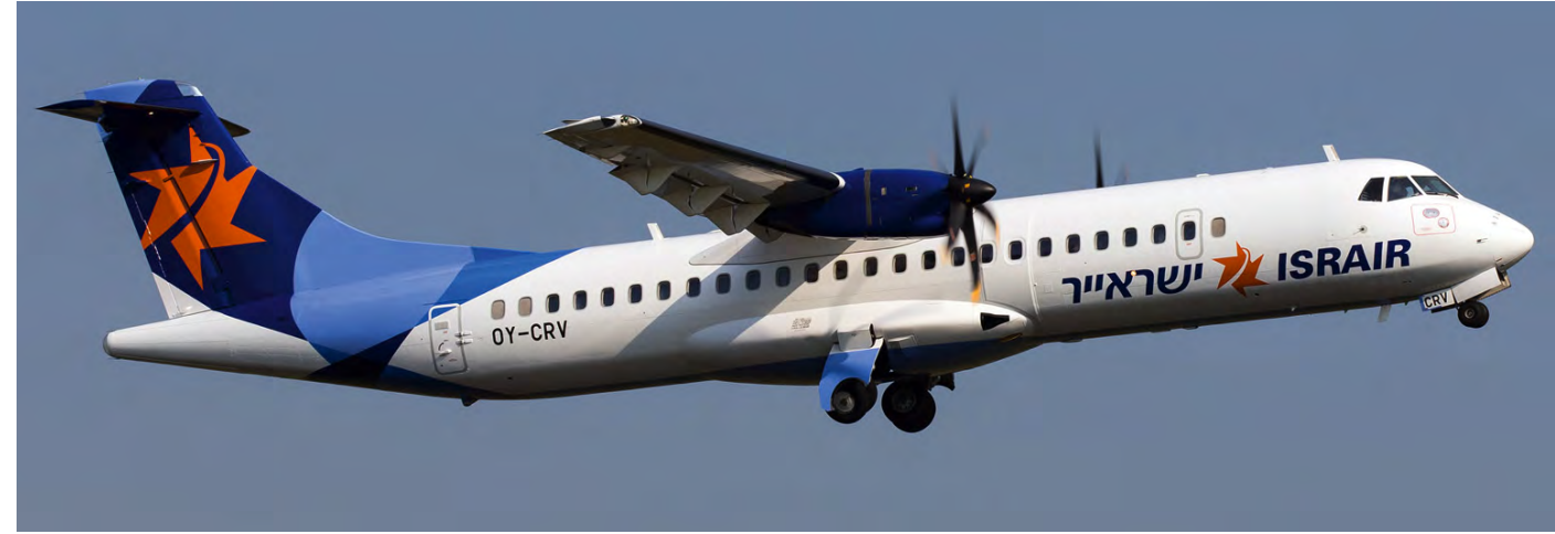
In 2008 this ATR72 was delivered to Kingfisher Airlines. In 2014 Nordic Aviation Capital became the owner and was the registration OY-CRV assigned to the aircraft for the first time. The aircraft was ferried to Woensdrecht on 2 March 2018. It departed after a repainted prior lease to Israir. (Woensdrecht, 22 May 2018,)