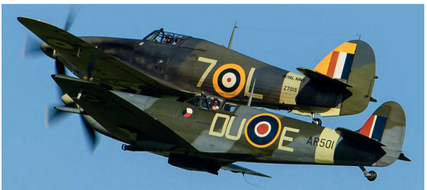
Two of the local Old Warden fighters pass in a very tight formation. Recently restored Spitfire Mk.Vc AR501 (G-AWII) is accompanied by Sea Hurricane Z7105 (G-BKTH))