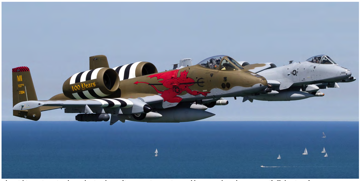
The Michigan Air National Guard painted one of its A-10Cs in stunning World War II D-day colours. To top if off, the aircraft was sent to Europe and flown over Normandy, France (81-0994 & 81-0996, A-10C, 107th FS, 3 June 2018)

United Kingdom. On Wednesday 30 May 2018, three DY coded B-1B Lancers from the 28th Bomb Squadron / 7th Bomb Wing, flew from their home base Dyess AFB (TX) to Fairford. The following DY coded Lancers were noted at RAF Fairford: 86-0098, 86-0101 and 86-0119. Because of the stand-down, the B-1B flight operations were limited to minimum. Normally the deployment of strategic bombers to the United Kingdom is part of USAF's Bomber Assurance and Deterrence operations (BAAD). Not related to the deployment but also stranded at Fairford was the 34th Bomb Squadron B-1B flagship aircraft with serial number 86-0134 and code EL at the beginning of June. The latter was believed having diverted to Fairford because of unspecified problems. Eventually, after the stand-down was lifted, all four B-1Bs had left Fairford, flying back to their bases in the Continental United States (CONUS).