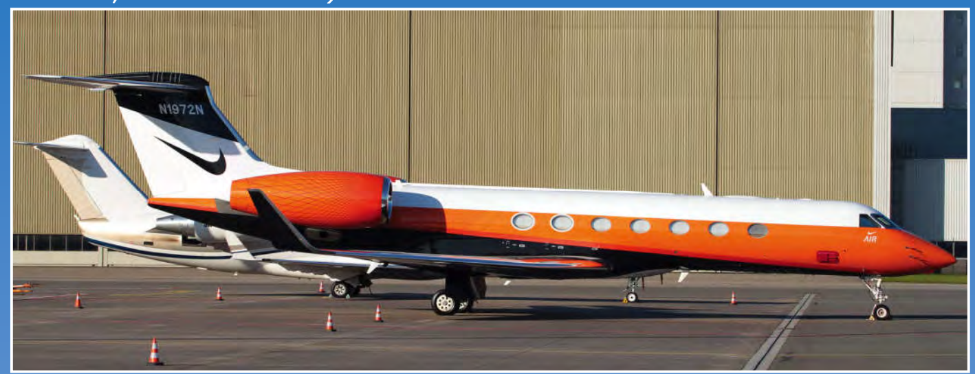
Nike has a habit of going against the flow and painting its bizjets in some very colourful liveries. This G550 has been used by Nike since 2013. (Amsterdam-Schiphol, 8 May 2018,)