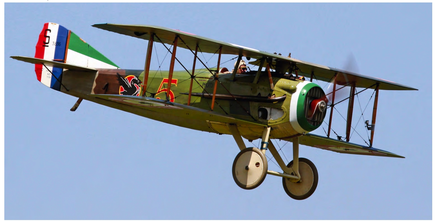
SPAD XIII C1 F-AZFP is the last airworthy example of the 8000 aircraft of this type built in World War I. It is owned by Memorial Flight at La Ferté Alais and made its first post restoration fight in 1991. In recent years it flies in the colours of '5' of SPA83 'Les Dragons'. F-AZFP was digitally framed by Jamie Ewan during the annual airshow at La Ferté on 19 May.

Credits: Aironline, CDRH Aviation News, Flypast, WIX.