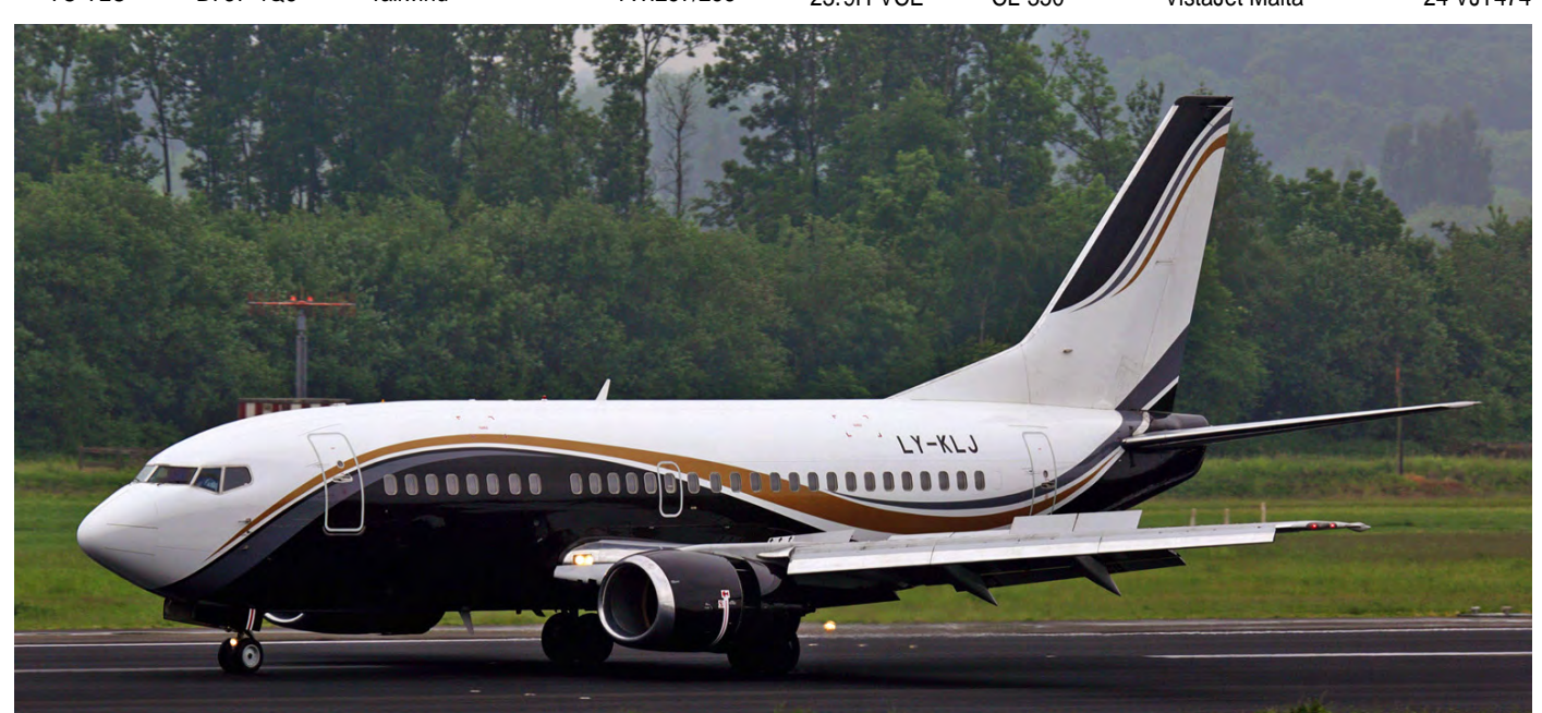
This Boeing 737 was delivered to Continental Airlines in 1998. Transaero was the second commercial operator from 2008. After modification by FL Technics LY-KLJ was added to the fleet of KlasJet as their first narrow-body business aircraft. It is the dedicated transportation of BC Kauno Zalgiris, a Lithuania based basketball club. (Maastricht - Aachen, 14 May 2018,)