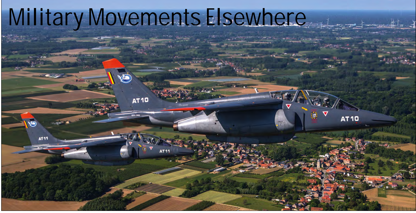
Catch them while you can, because the Belgian Alpha Jets are nearing their sundown. They will be retired in the first half of 2019 (Belgian airspace, 25 May 2017,)