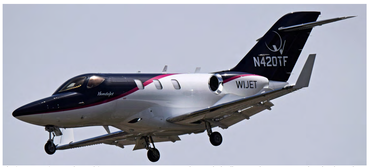
The first HA-420 for Wijet departed for Europe on 25 May 2018. It was photographed still registered as N420TF. Wijet has placed an order 16 HondaJets as part of a fleet upgrade and expansion programme. (Geneva, 27 May 2018,)