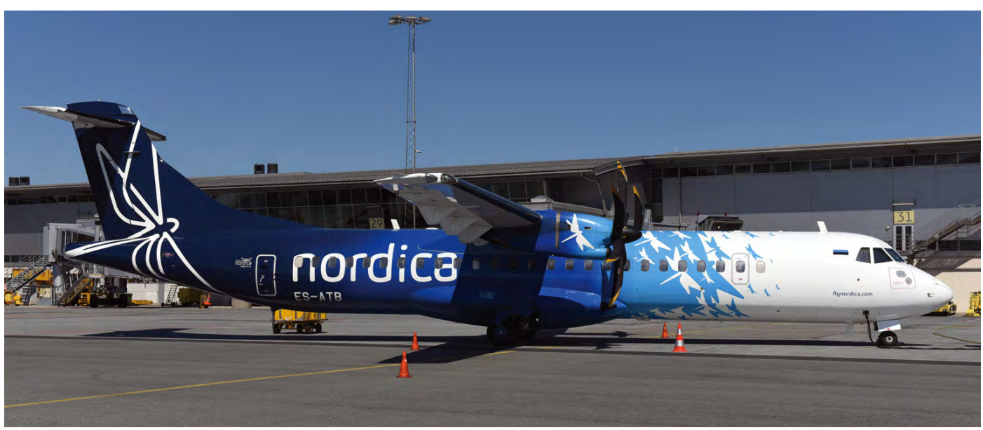
Estonia's Nordica operates six ATR72s. Two in their own colour scheme and four in the colours of SAS. ES-ATB flew in SAS colours before and was repainted into Nordica colours in February 2018. (Billund, 8 May 2018)