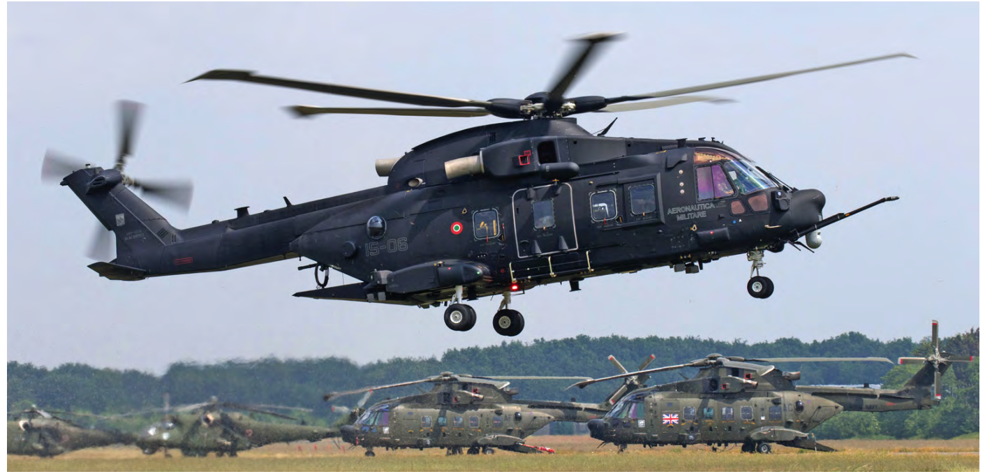
Combat Search and Rescue by Caesar! This AMI HH-101A Caesar was a very welcome participant of APROC 2018 at Gilze-Rijen(MM81869, HH-101A, 81 Centro AE, 25 May 2018,)

o'haul LOM 288M01 jun18 This Mi-17 was noted in June 2018 completely stripped down at the overhaul facility LOM Praha s.p. in Czechia. However the helicopter arrived already in November 2017 by Il-76 at Brno airport.