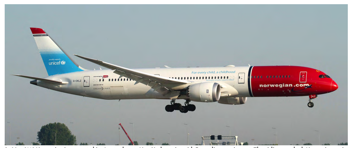
In May 2018 Norwegian inaugurated its Amsterdam to New York service with Dreamliner equipment. The airline uses both Norwegian registered and British registered aircraft on the route. G-CKLZ was delivered to Norwegian UK in September 2017.