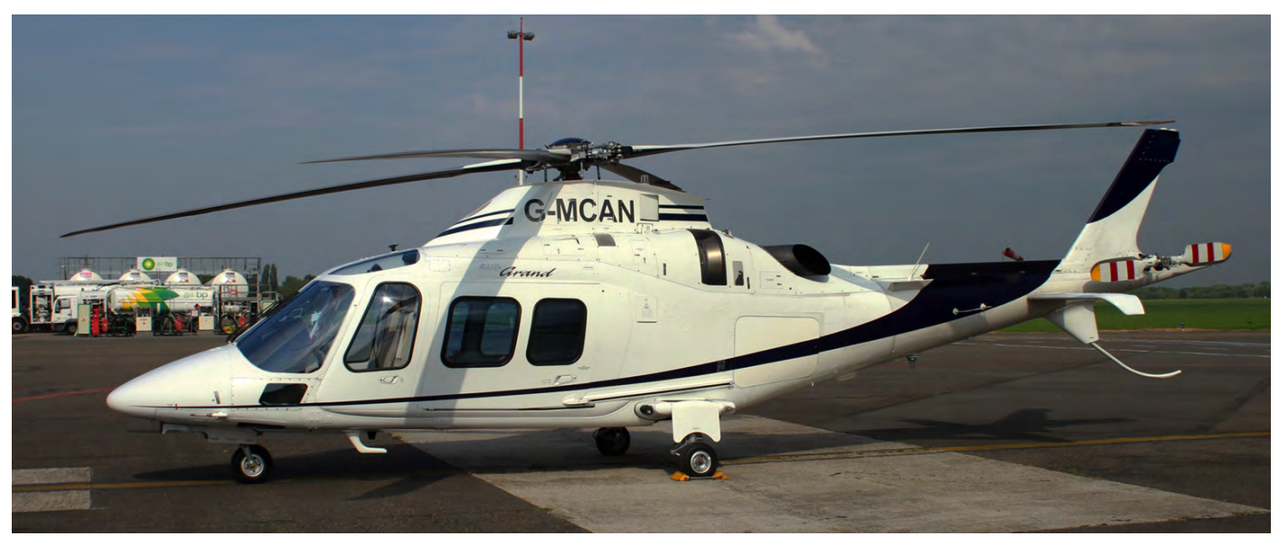
G-MCAN is an Agusta A109S Grand manufactured in 2006. It was registered to Castle Air Charters in November 2009. Ownership changed in February 2010 but Castle Air remains the operator. (Antwerp, 16 May 2018,)