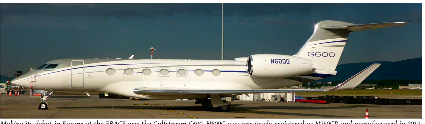
Making its debut in Europe at the EBACE was the Gulfstream G600. N600G was previously registered as N750GD and manufactured in 2017. (Geneva, 26 May 2018,)