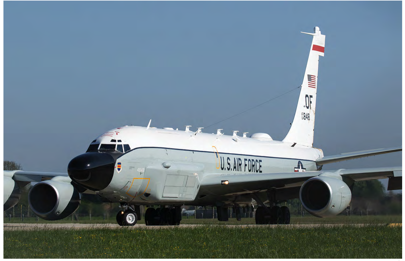
Mildenhall is still the place to be in Europe if you want to catch RC-135s. They conduct regular patrols from here towards Eastern Europe.