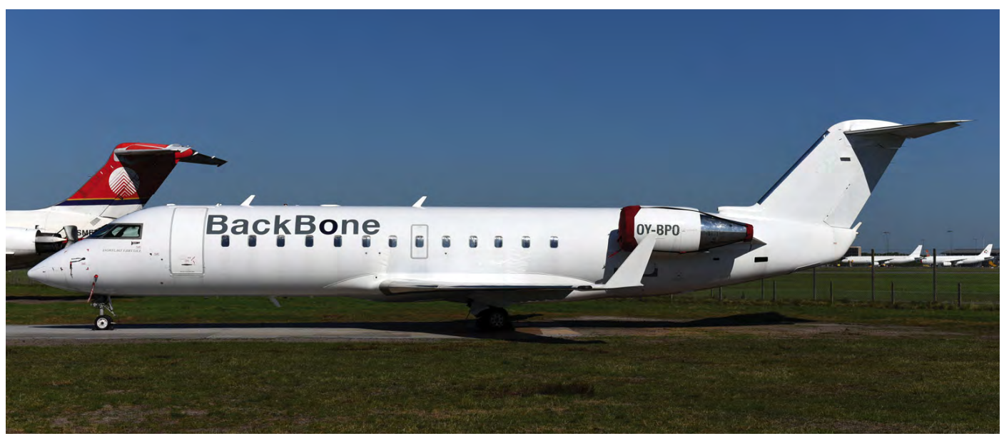
BackBone Aviation has ceased all operations back in January 2018. Pictured CRJ200 OY-BPO has been parked at Billund since then. On 25 June it was ferried to Calgary-International (Alta.). (Billund, 8 May 2018, Ton Jochems)