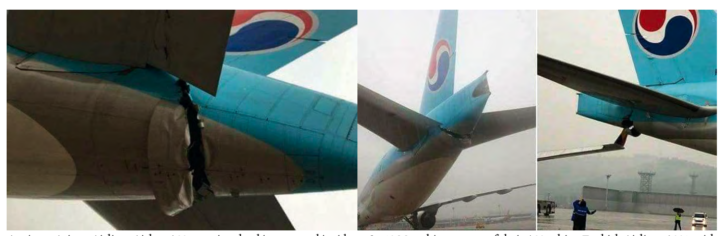
Again an Asiana Airlines Airbus A330 was involved in a ground incident. On 13 May this year one of their A330s hit a Turkish Airlines A321, with both aircraft receiving substantial damage. In a recent incident, on 26 June, the Asiana Airbus HL8286 was more fortunate with only minimal damage, but the Korean Air Triple Seven, HL7762, it hit was less fortunate. The right hand winglet of the Airbus impacted the horizontal stabilizer and underside of the rear fuselage of the Boeing 777. (27 June 2018, Twitter)

16jun18 RA-1757G Yak-52 w/o A <u>private</u> Yak-52 crashed under unknown circumstances in Altai Territory, Russia. Both occupants died in the crash.