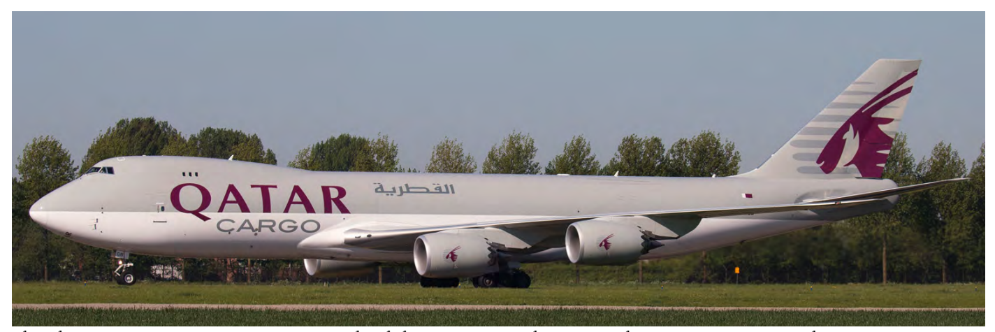
The sole Qatar Airways Cargo Boeing 747-8F was handed over to Qatar at the Everett Delivery Center on 25 September 2017. A7-BGB is not a regular at Amsterdam so catch it if you can. (Amsterdam - Schiphol, 8 May 2018)