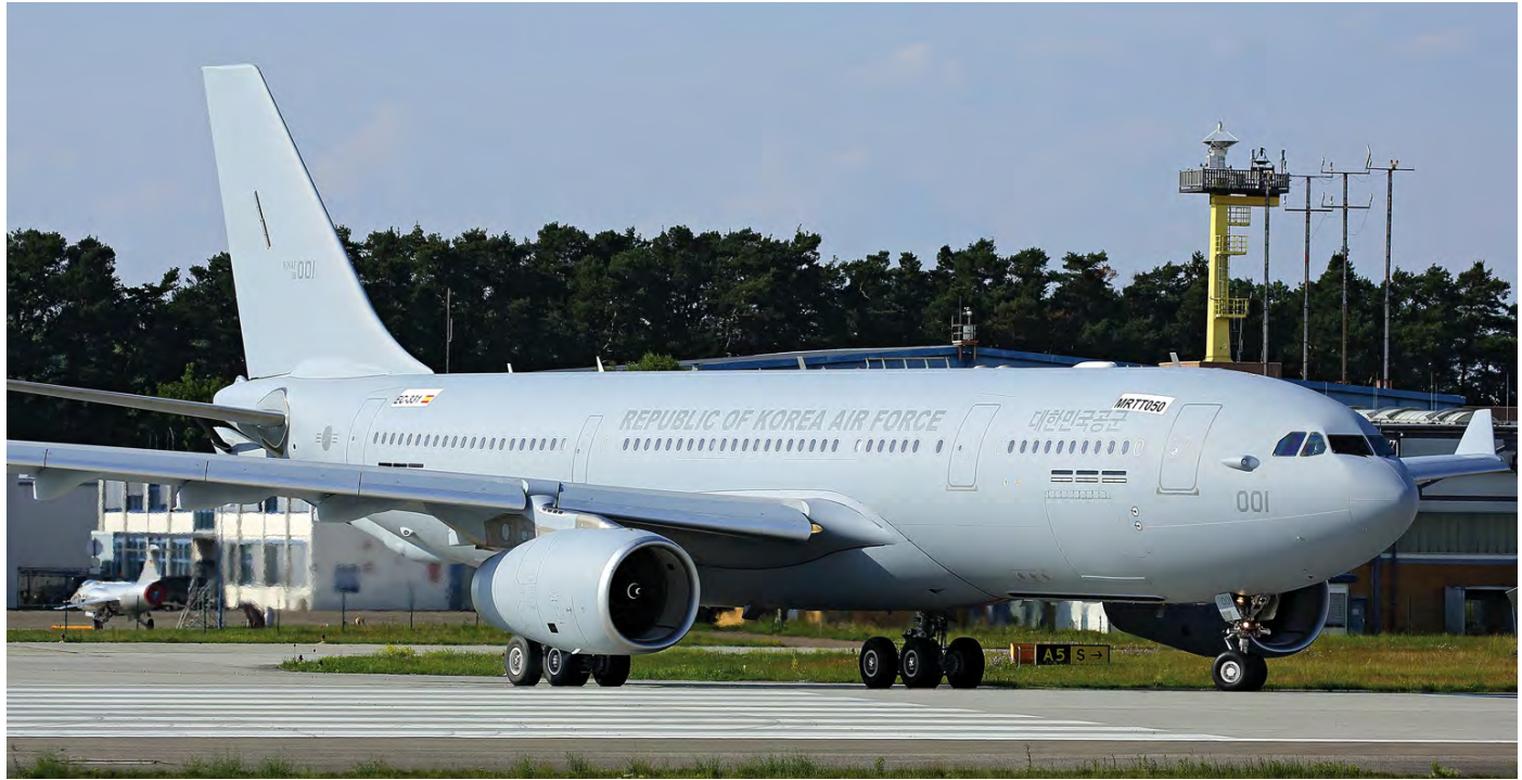
Not only France and Singapore, South Korea will also see delivery of its first A330MRTT tankers in the coming months (18-001, A330MRTT, msn 1787 Manching, 8 June 2018, Dietmar Fenners)