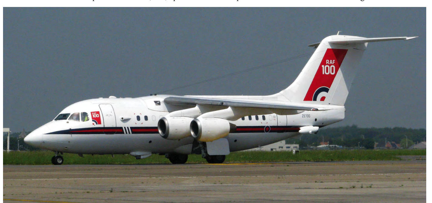
Brexit or not, British military VIP-aircraft keep visiting Brussels, like this BAe146 in RAF 100th anniversary colours (ZE700, BAe146, 32 (TR) sqn, 9 May 2018,)