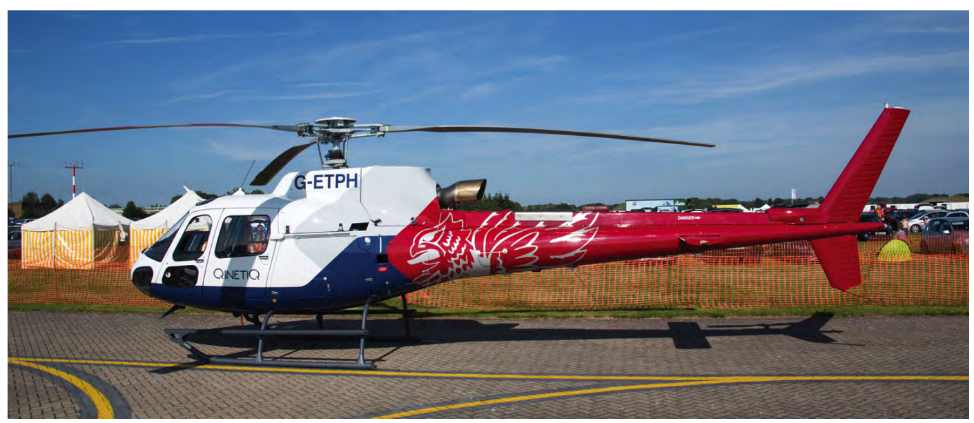
In celebration of the 100 years of RAF, Cosford held a large air show on 10 June 2018 as birthplace of the Royal Air Force. Next to a large aerial display the best part was an extensive static display. Including various historical types on static, among the newest models was ETPS/QinetiqQ H125 G-ETPH. This is one of the four new-build Squirrels ordered for the test school. (Cosford, 10 June 2018)