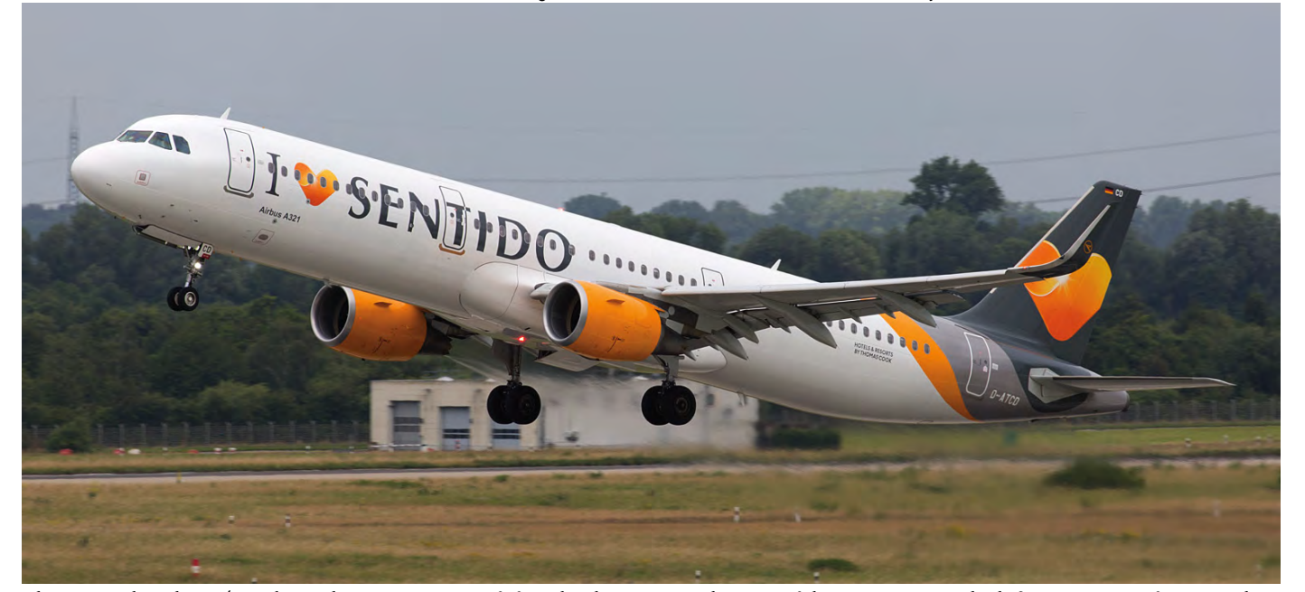
Thomas Cook Airlines / Condor took over some aircraft from bankrupt Air Berlin. One of them is D-ATCD, which flew as HB-JOX for Air Berlin's Swiss subsidiary Belair. The aircraft wears "I heart Sentido"-titles. Sentido is an hotel and resorts group. (Dusseldorf, 23 June 2018,)