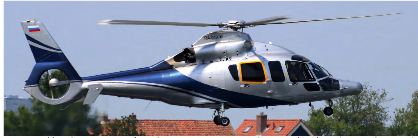
RA-04076 was delivered to Russia in 2011 and carried test registration F-WWOA. As with most privatly used aircraft in Russia the operator for this EC155B1 is unknown. In a document from 2017 the listed owner translates to Central MTU of Rosaviatsi. (Den Helder - De Kooy, 24 May 2018,)