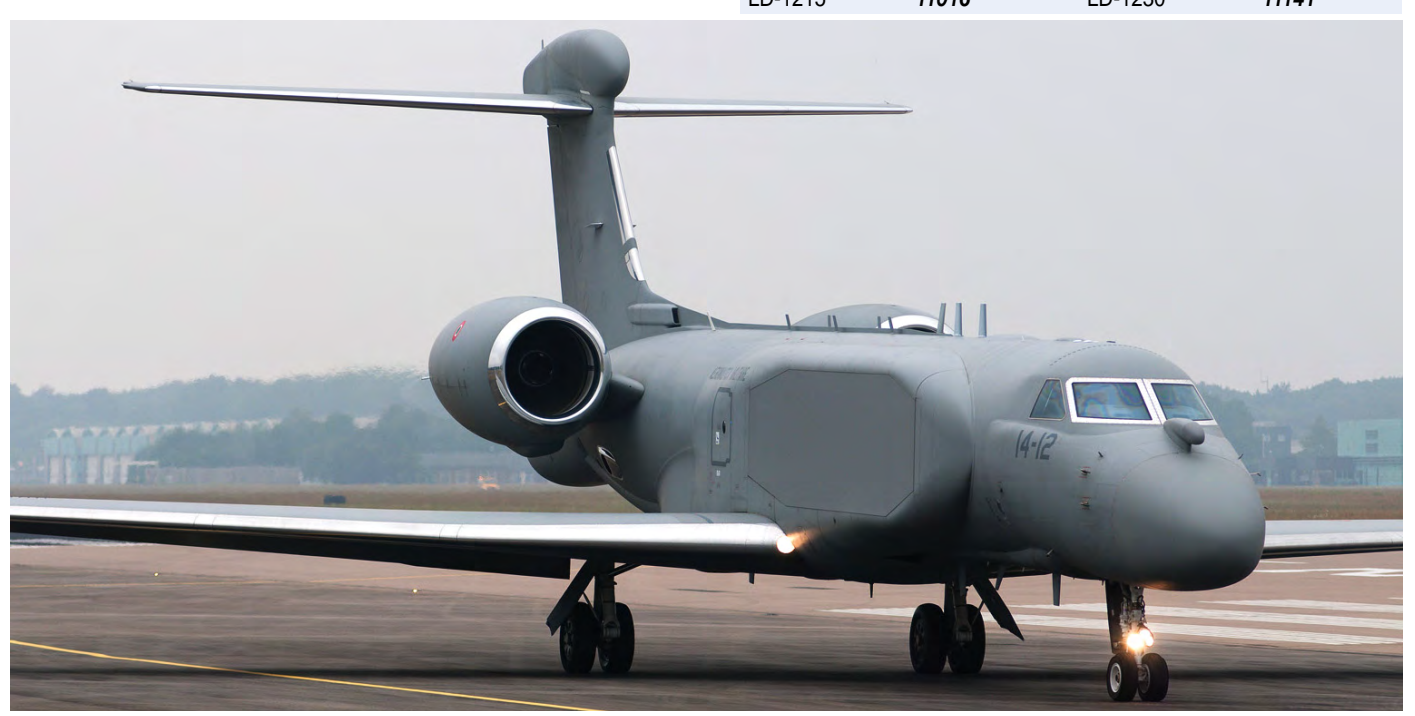
Both AMI G550C-AEWs visited Gilze-Rijen for exercise APROC 2018. This shot clearly shows the many upgrades made to the airframe for its tasking (MM62303, E-550A, 71 Gruppo, Gilze Rijen, 1 June 2018,)