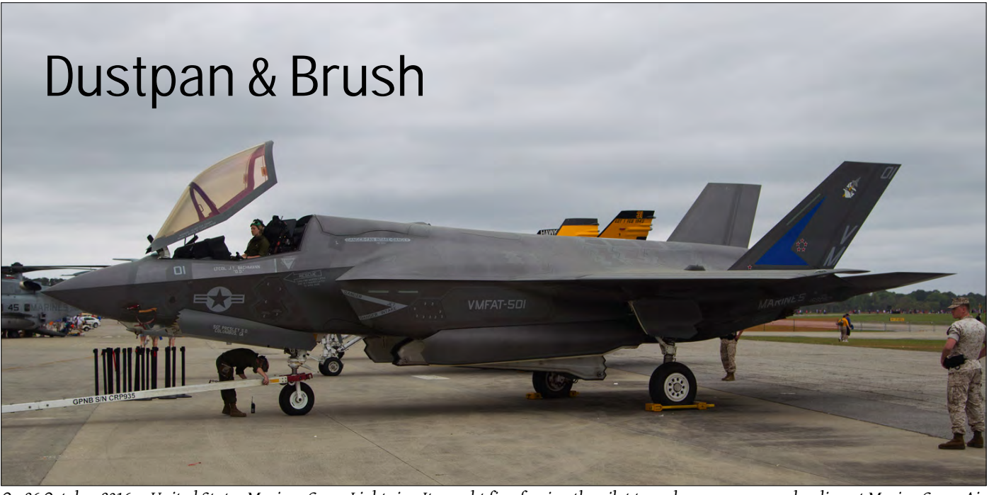
On 26 October 2016, a United States Marines Corps Lightning It caught fire, forcing the pilot to make an emergency landing at Marine Corps Air Station Beaufort (SC). The fire was due to an electrical short circuit which ignited a small hydraulic leak. Initially the USMC thought they could repair the Lightning II, but recently it was deemed that the repair costs for the airframe are too high, meaning it will go down as the first ever F-35 write off! (MCAS Beaufort (SC), 12 April 2015, Lucien Blok)