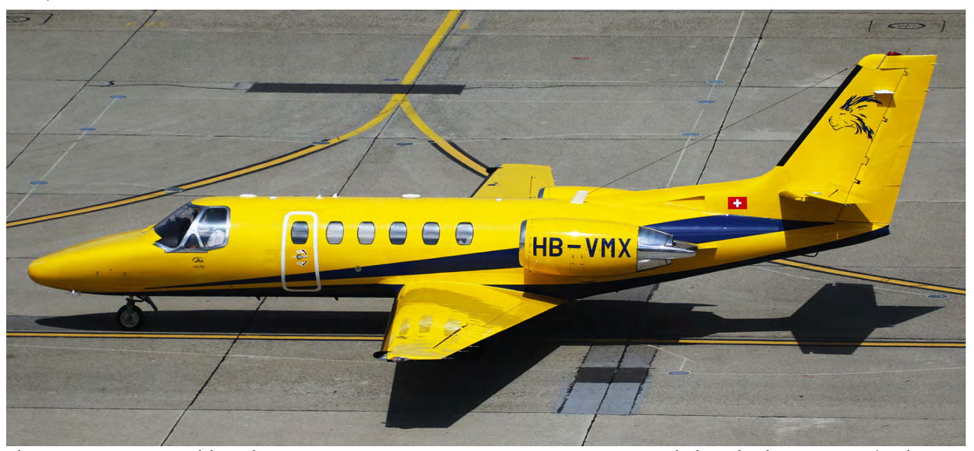
This Cessna 550 Bravo was delivered to Jet Aviation Business Jets in 2000 as HB-VMX. From 2013 the bizjet has been operating for Alpine Air Ambulance in the TCS colours with TCS Ambulance titles and logo. Recently the aircraft has been seen without the TCS Ambulance titles/logo. (Geneva, 30 May 2018,)