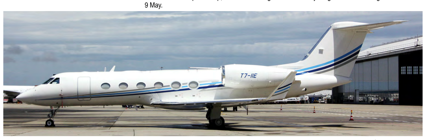
Former MJet OE-IIE was noted re-registered as T7-IIE during the recently held EBACE. It is now operated by Deught Flight. (Geneva, 11 June 2018,)