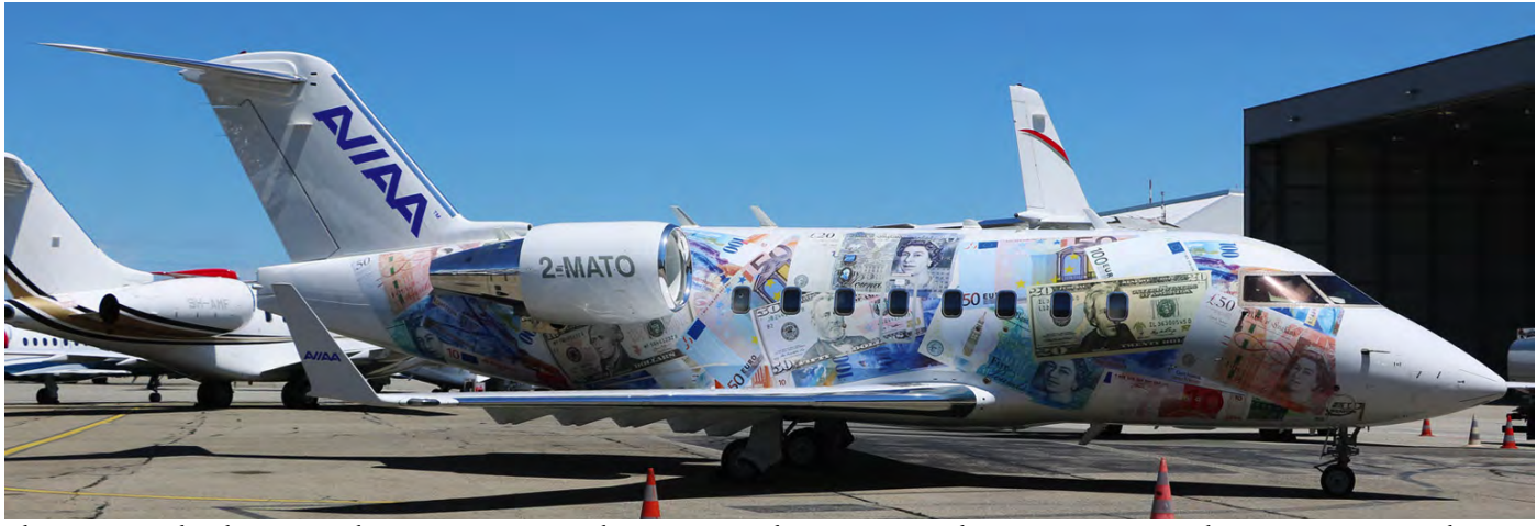
This CL-601-3A has been around since 1992. Registered as 2-MATO Volare Aviation is the operator since October 2015. International group-purchasing organisation (GPO) AVIAÂ has made its debut at this years show. That is most probably the reason for the colourfull outfit of the bizjet although it was not parked in the show area. (Geneva, 29 May 2018,)

This list is by no means a complete one. Besides Geneva, we also received logs from several airports in the region, Annecy, Annemasse, Basel, Berne, Lausanne and Zurich.