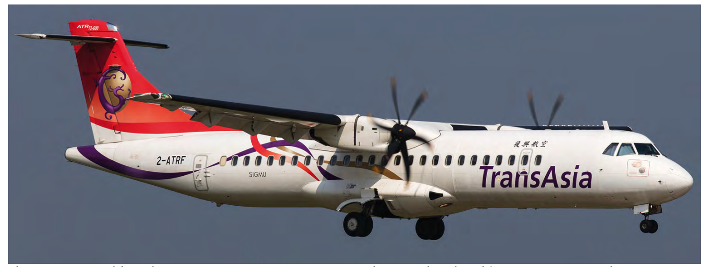
This ATR72-600 was delivered new to Transasia Airways as B-22821 on 7 July 2015, and was leased from GECAS. Late November 2016 Transasia went bankrupt and the ATR was put in storage at Taipei Sungshan. In May 2018 Nodic Aviation Capital (NAC), a leasing company specialized in regional aircraft, bought the ATR from GECAS and ferried it from Taiwan to Woensdrecht where it arrived on 29 May. NAC registered the aircraft on the isle of Guernsey as 2-ATRF. (Woensdrecht, 29 May 2018,)