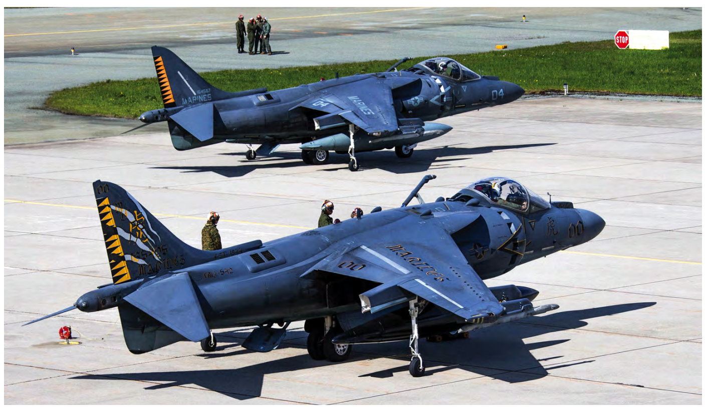
U.S. Marines with Marine Attack Squadron 542 conduct preflight checks before takeoff during Fjord Fury in Bodo, Norway, May 30, 2018. Exercise Fjord Fury is designed to conduct combined training with NATO allied forces, foster relationships with host and partner nations, and improve the squadrons combat readiness (165425/00 & 164567/04, AV-8B, VMA-542, Bodo, 11 June 2018,)

piloted aircraft. Some months ago, during March 2018, the USAF already deployed unarmed Reaper assets at Larisa Air Base (Greece).