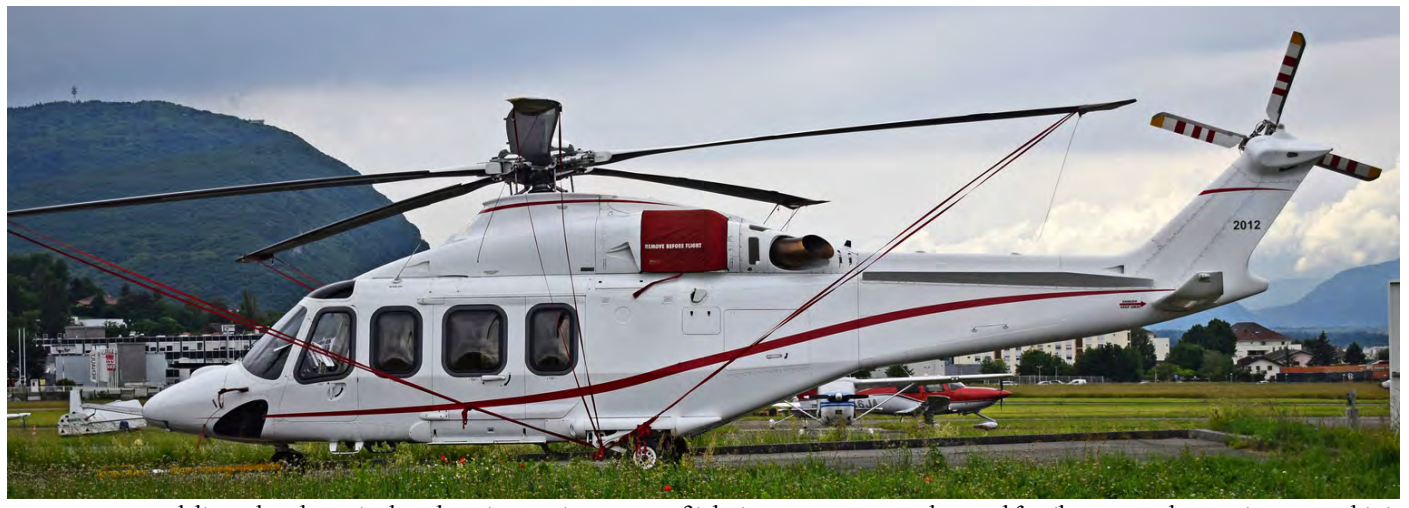
AW139 2012 was delivered to the United Arab Emirates Air Force VIP flight in August 2010. As the royal family owns real estate in Europe this is one of two based at Annemasse during this summer to transport the president and his family. (Annemasse, 30 May 2018,)