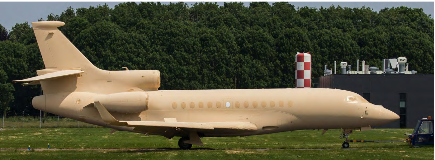
While in the process of being repainted Falcon 7X F-HMGC was briefly visible outside the STTS facility. The Dassault Aviation owned bizjet departed 8 June all white. (Lelystad, 27 May 2018,)