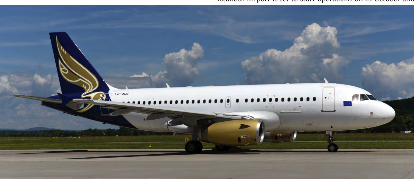
This Airbus A319 belongs to Bulgarian Eagle, the Bulgarian subsidiary of Germania. Bulgarian Eagle launched operations with a single Airbus A319 in the summer of 2017. The airline will primarily focus on providing ACMI services to other European airlines and tour operators. A second Airbus A319 was added to the fleet last spring in the form of this ex Turkish Airlines A319. The aircraft should have gone to Pakistan based Shaheen Air but the deal felt through although it was already painted in Shaheen colours. Bulgarian Eagle obviously had no time to repaint the aircraft, so it flies around in a basic Shaheen colour scheme, without titles but with Bulgarian registration LZ-AOC. (Zürich, 25 May 2018,)

President Erdogan of Turkey was the first to land at the brand new <u>Istanbul Airport</u>. He arrived on 21 June from Gaziantep onboard Airbus A318 TC-ANK, and was greeted by a water salute and many of the construction crewmembers. The new Istanbul Airport is set to start operations on 29 October and