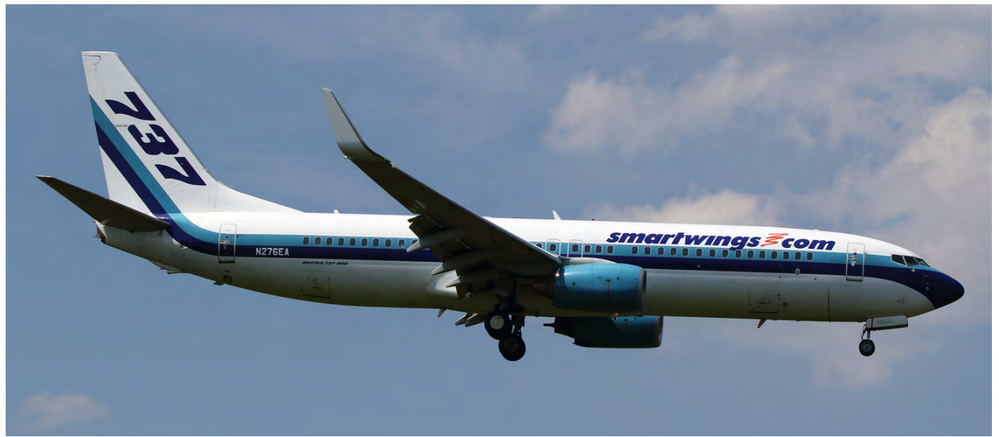
N276EA arrived at Prague on 15 May 2018 for summer lease to Smartwings. The Boeing 737 was delivered to Kenya Airways in 2006. Eastern Air Lines added the aircraft to its fleet in 2014. Swift Air bought Eastern Air Lines in 2017. (Eindhoven, 21 May 2018, Michiel van Herten)