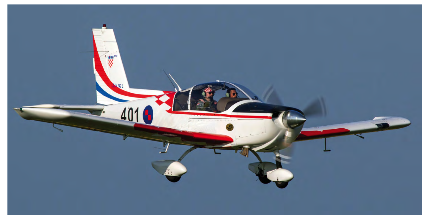
Cakovec is a general aviation airfield in northern Croatia. Robert Erenstein was present for the air show and pictured this Zlin 242 used for basic training (401, Zlin 242, 93 ZB, Cakovec, 10 June 2018, Robert Erenstein)

airworthy condition, the type was formally retired on 6 May 2018. This is a year earlier as previously announced. After the long grounding of all Air Cadets aircraft, only six Vigilant T1 aircraft were ever restored to flying condition. Besides some activity under control of the Glider Maintenance Unit (GMS) and Air Cadets Central Gliding School (ACCGS) at RAF Syerston, only 645VGS at RAF Topcliffe used the few restored aircraft. The following aircraft were restored to flying condition: