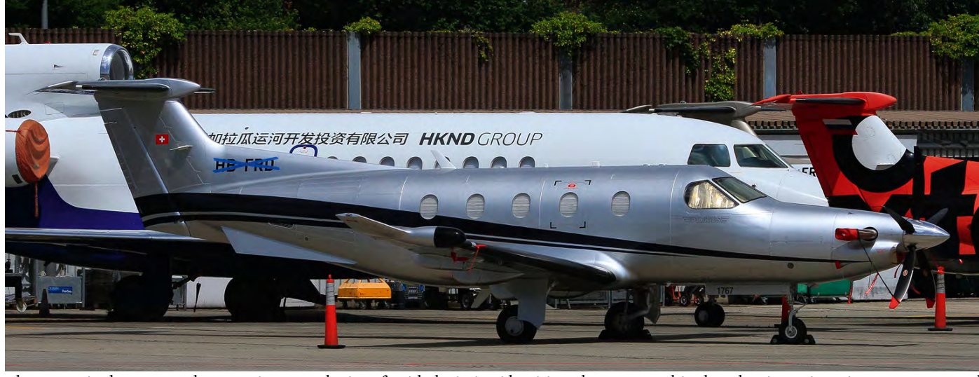
The EBACE is always a good oportunity to catch aircraft with deviating identities. The PC-12 on this photo has its registration HB-FRD crossed out. Listed on the Swiss aircraft register as HB-FRD18 MSN 1767 was officially deregistered on 22 February 2018. (Geneva, 28 May 2018, Trevor Toone)