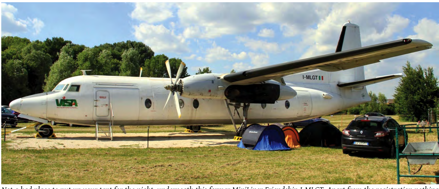
Not a bad place to put up your tent for the night, underneath this former MiniLiner Friendship I-MLGT. Apart from the registration nothing indicates its former operator but it is adorned with VISA International titles on the nose. The Fokker F27 had been stored at Bergamo since early 2010 after MiniLiner was declared bankrupt late 2009. In June 2017 the fuselage was seen on a trailer, heading for the Museo del Volo of Avio Club Montagnana at Montagnana airport, located in Padova province. It is now on display at the small Gianlino Baschirotto airport, in a museum that also features old Italian Air Force aircraft. (Aeroclub Montagnana, 24 June 2018, Daniele Mattiuzzo)