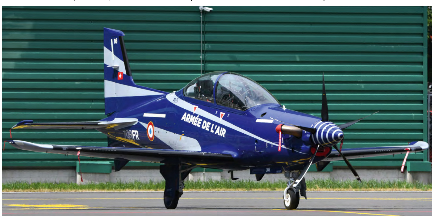
One of the PC-21s next in line for delivery to the Armee de l'Air is serial 16, pictured where it was constructed, Stans, Switzerland (17/709-FR, PC-21, Stans, 7 June 2018, Stephan Widmer)

Norway ordered five P-8A Poseidons as a replacement for its Orions, but the first aircraft are scheduled for delivery in 2021-2023. The maritime patrol aircraft from 333 skv will