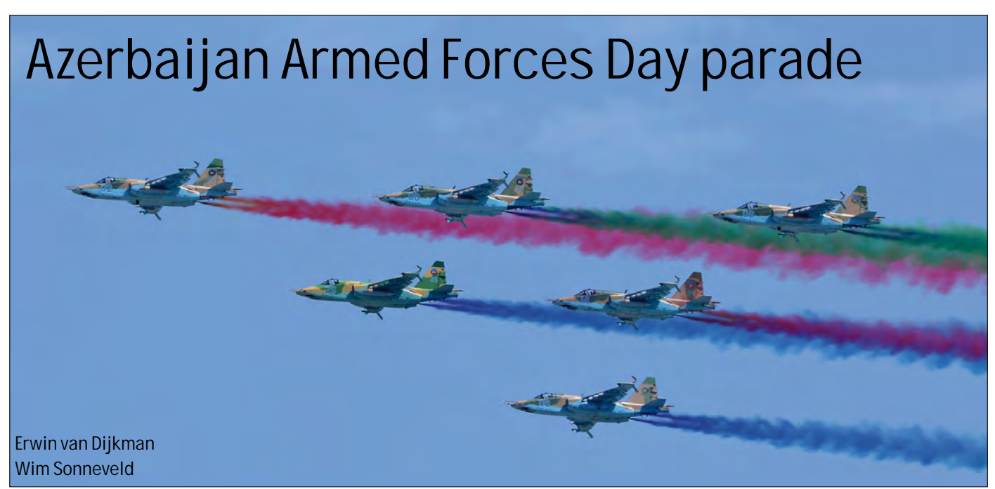
Six Su-25s from Kürdəmir with the Azeri tricolor literally formed one of the centre pieces of the parade, they did a bomb burst afterwards.