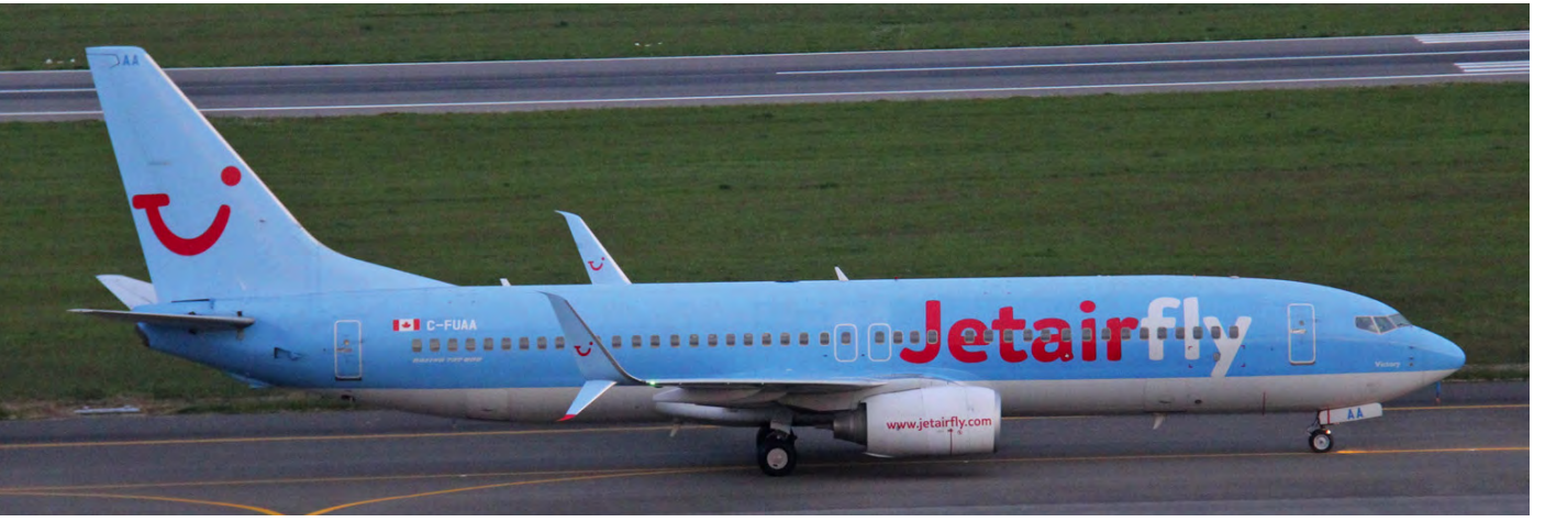
From December 2017 till May 2018 this Boeing 737 was on lease to Sunwing. The aircraft arrived back in Belgium still with its Canadian registration C-FUAA. (Brussels, 1 May 2018,)