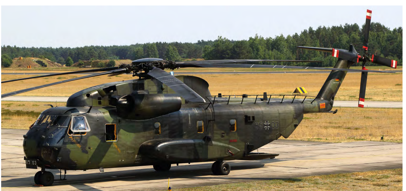
During the Tag der Bundesheer 2018 at Holzdorf, Michiel van Herten captured CH-53G 85+03, operating with locally based HSG-64.