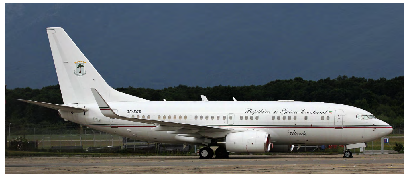
The Government of Equatorial Guinea took delivery of this Boeing 737 in 2003. At the time this photo was taken 3C-EGE had been parked at the airport since July 2017, impounded for non-payed fees pending an appeal from the plaintiff. (Geneva, 26 May 2018, Antony Pratt)