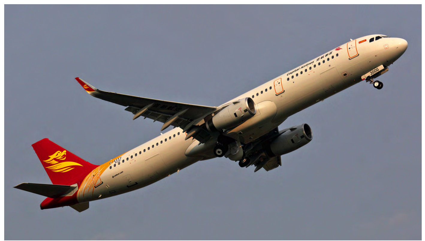
Arjen Sleeuwenhoek was able to catch this Airbus A321 on 9 May 2018 when it took of from Maastricht - Aachen airport for its flight back to Hamburg - Finkenwerder. D-AVXV has been delivered to Capital Airlines on 25 May 2018 as B-300G.